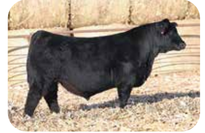
WINC MATTER OF TIME 249K Sire of Lots 8-11

The next four females are what we envision when trying to breed for the next generation of females to carry the brand. These WINC Matter Of Time 249K flush sisters from the legendary Kappes Sadie T635 Y302 are the kind that carry the torch in our minds! WINC Matter Of Time 249K looks like he is going to sire incredible daughters, they are bold bodied, easy keeping and super cowy in their look. He is a son of the dominant, W/C Miss Werning 638D donor female, and was purchased for $37,500 in the 2023 "Profit through Performance" by Diamond M Cattle Company and Werning Cattle Company, with both programs continuing to utilize him heavily in their breeding programs.