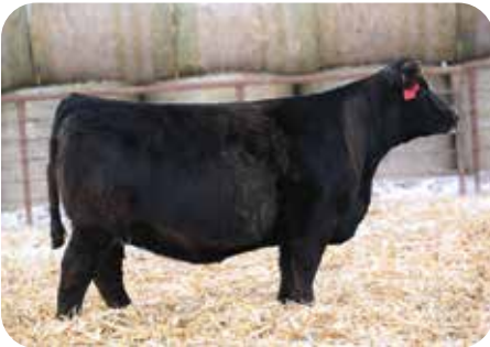
WINC 100K $17,500 Daughter of Lot 5