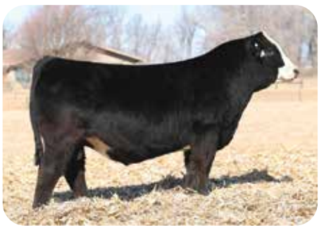
W/C DABO 703J $100,000 Full Brother to Lot 68, Sire of Lot 69 & 70 Sire of Lots 69 & 70

You will struggle to find them denser, bolder or broodier than WINC 5116N. Just by looking at her you can tell there are no questions to be asked about the horse power embedded in the genetic makeup of this W/C Dabo 703J daughter. But no surprises will be had if you do, as she ranks in the top 5% or better for YW, ADG, $GN, CW and REA.