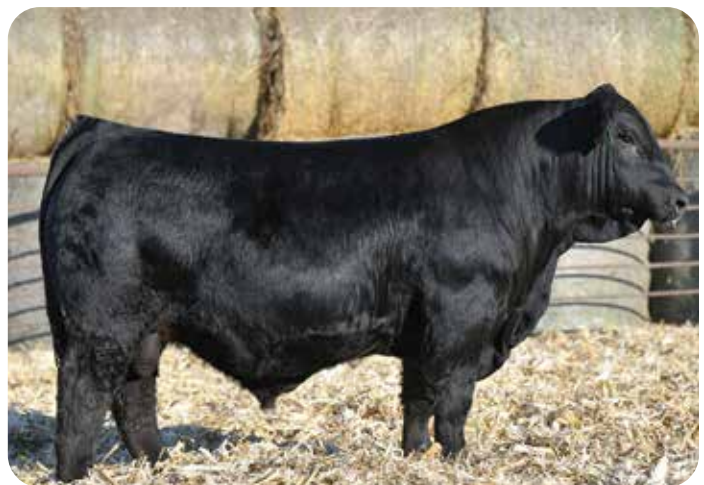
WINC BEACON 018H Sire of Lot 65