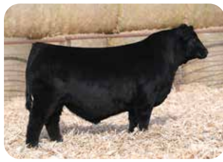
WINC MATTER OF TIME 486M Maternal Brother to Lot 69