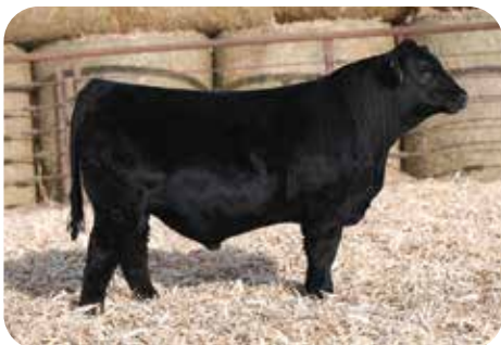
WINC FORTRESS 460M Full Brother to Lot 71