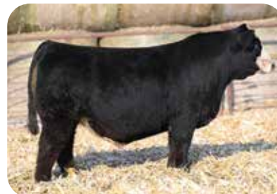
WINC SURELOCK 71L Son of Lot 5

CE BW WW YW ADG MCE Milk MWW Stay Doc CW YG Marb BF REA API TI 12.8 0.4 69.1 104.5 0.22 9.9 37.3 71.8 14.5 9.4 43.8 -0.32 -0.49 -0.03 1.19 95.6 61.2