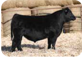
WINC RELEVANT 446M Son of Lot 57