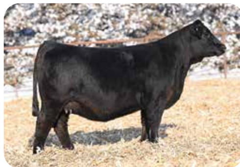
CKCC MS EAGLE 1612J Dam of Lots 17-19