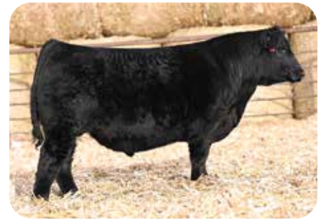
WINC RELEVANT 292K $16,000 Maternal Grandson of Lot 58