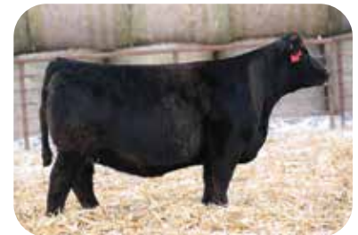
WINC 100K Dam of Lot 14

WINC 5117N is the first-born daughter of the high selling female in the 2023 "Profit through Performance", WINC 100K, that was the $17,500 choice of Austin & Paislee Moeller of Minnesota. 100K is a CKCC Relevant 0639H daughter of the legendary Kappes Sadie T635 Y302, she has an awesome set of bull calves slated for this spring, this is a division of the Y302 lineage that is set for big things!