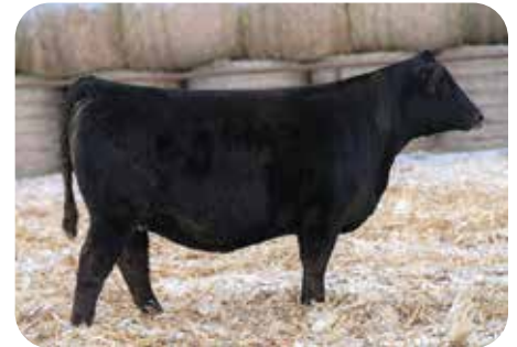
WINC 808K Daughter of Lot 5