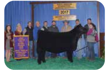
MEFC JOLENE 618D Dam of Lot 45