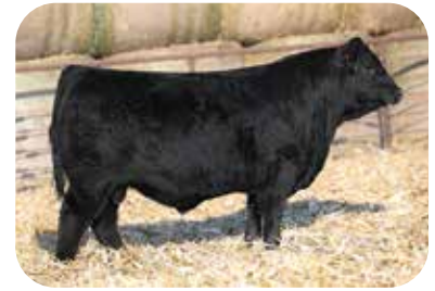
WINC REVOLUTION 300L Full Brother to Lots 25 & 26, Son of Lot 20

The combination of W/C Revolution 65G and WINC Miss 614D has been proven in the bull sale several times, with two very impressive sons selling to Jeff Huss and Brad Greenway. With the lineage that comes from 614D and therefore the potency of the Remington Lock N Load 54U and ALC Treasure C50P combination, there is no telling the potential ahead here. Generations of productive cows' line the pedigree here. 907N puts together everything we set our selection criteria around, true growth in her own right, homozygous polled and homozygous black status, and then ranking impressively for WW, YW, ADG, Milk and MWW.