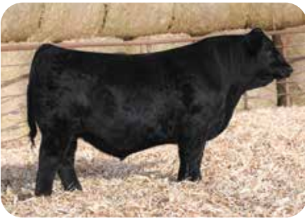
WINC RELEVANT 438M $15,000 Son of Lot 58