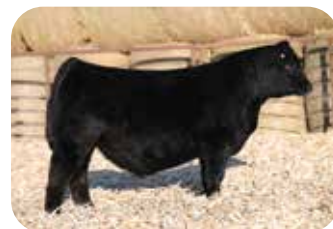
WINC/TCM MATTER OF TIME 4114M Son of Lot 15