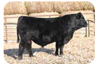
WINC REVOLUTION 275K Full Brother to Lots 25 & 26, Son of Lot 20

You best look into the data package that comes with this second daughter of the W/C Revolution 65G x WINC Miss 614D mating, because her DNA results truly elevated her status toward being one of the most elite in the offering when it comes to growth potential. She ranks among the top 1% of the breed for both WW & YW, and is supported by individuals on either side of her pedigree that add grit to the science, as both maternal and paternal linages are reputable sources of impressive pay weight.