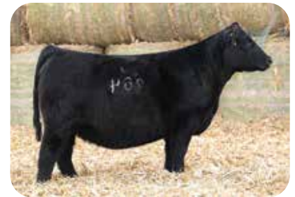
JWC BLACKBIRD LADY 264K Maternal Sister to Dam of Lot 44

This 3/4 blood Simgenetic gem stems back to the maternal power of the GAF Blackbird Lady 1159 donor that has been stirring a storm up for the JWC brand. In their 2024 production sale, two daughters of 1159, one being a full sister to the dam of WINC 419M were sought after by the most serious of stockmen. The W/C Bankroll 811D daughter sold to Beitelspacher Ranches. We love the way that this female is constructed, her movement is fluid and effortless, and her capacious center third perfectly balances with either end of her skeleton. To top it off she sports a beautiful blaze face!