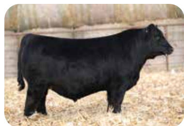
WINC STELLAR 1612L Maternal Brother to Lots 17-19

This trio of daughters from RFS Heavy Hitter H45 and CKCC Ms Eagle 1612J are the kind that need inspected by stockmen that are searching for the next purebred weapon to use for increasing the performance and growth potential of their cowherd. We purchased their dam out of the 2023 CK Cattle Production Sale, and needless to say she has done an incredible job during her short tenure, as her first calf was the $11,000 bull purchase of the Grocott's and this past spring three sons by W/C Dabo 703J were fought after by progressive stockmen. Talk about consistency, all three of these sisters rank in the top 1% of the breed for WW, YW, ADG, MWW, and 10% or better for YG, BF, REA, and TI. It comes without doubt, these flush sisters come with immense power in their genome!