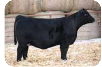
WINC MISS 243K Daughter of Lot 53

WINC 009H is a long sided, heavy muscled daughter of WS Certified E151, the breed leading calving ease and stayability specialist. We think that 009H will be the source of consistency and profitability for her new home, particularly when you take into consideration her homozygous polled, and purebred breeding. An impressive ES Statement GZ33 daughter of 009H sold in the 2024 production sale to Addison Cattle.