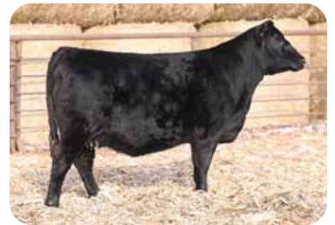
WINC 1111J Daughter of Lot 33