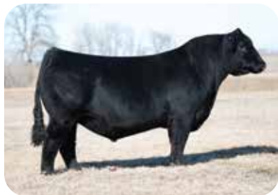
WINC ALL RIGHT 213K $147,500 Son of Lot 1