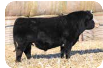
R&R TESTAMENT J155 Sire of Lot 37

We love the added look and extension of the blaze faced, WINC 5141N. The R&R Testament J155 daughter from the SHCO Glenda 373G power cow is one that reads with a very bright, and high performing future. We think the versatility of pedigree and body type offers up a very exciting future here, particularly if she develops along the pathway her mother has, like we believe she will.