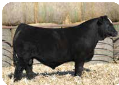
WINC FT KNOX 090H $23,500 Full Brother to Lot 1

Adj. BW 91 Adj. WW 681 Hetero Black Homo Polled