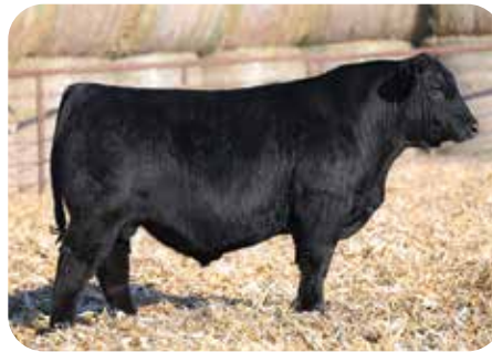
WINC CAPITAL 3147L Son of Lot 58