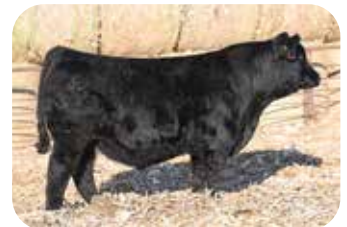
WINC RELEVANT 254K Son of Lot 54