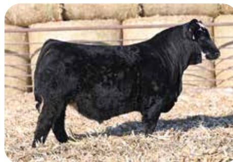
H/F MR RIGHT NOW 017K Sire of Lot 76