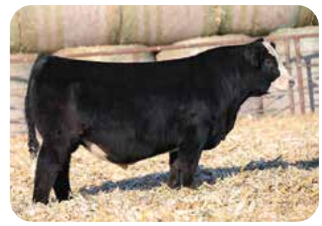
WINC DABO 3130L $15,000 Full Brother to Lot 70