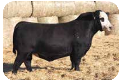
MR W/C TRIFECTA 975J Sire of Lot 39

Following her mother, WINC 5152N is the beautiful blaze faced, Mr W/C Trifecta 975J heifer calf that strikes an awesome pose with every opportunity that she gets! We love the balance and symmetry that this female has been blessed with, she is super maternal in her shape and pattern, and projects to be a sensational cow prospect. She came to the weaning pen heavy, with almost 800lbs. of adjusted weaning weight, that ratioed a 119 against her contemporary group.