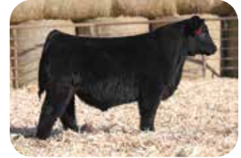
MEFC BLACKLIST 4693 ET Full Brother to Lot 45