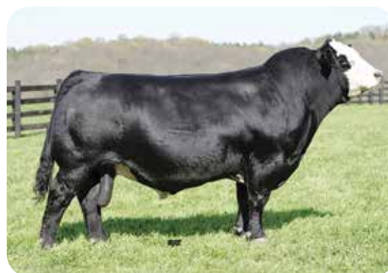
REMINGTON LOCK N LOAD54U Sire of Lot 20