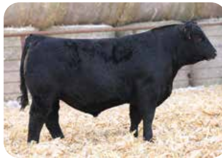
WINC RELEVANT 385L Son of Lot 33