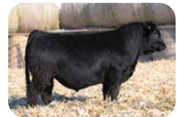
WINC DABO 380L Son of Lot 54