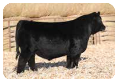
WINC DABO 464M Maternal Brother to Lots 17-19