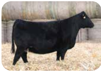
WINC MISS 624D Maternal Granddam of Lots 59-61