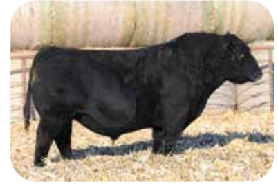
CKCC RELEVANT 0639H Sire of Lot 13

Here you will find a CKCC Relevant 0639H daughter of the Lot 12 female, WINC 177J. WINC 5106N is set out for an exciting career in the breeding pen, and it would be amiss of us not to bring attention to her incredible EPD profile, as she sports top 2% WW, ADG, CW & REA, along with top 1% YW & MWW. This high powered, double homozygous, purebred donor candidate will be one that is hard to load on someone else's trailer.