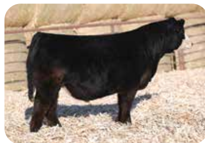
WINC/TCM DABO 4172M Son of Lot 15

WINC 5164N is perhaps the most impressive offspring of CHEZ Bobbi 0623H ET we have ever raised, this CKCC Relevant 0639H daughter is designed with both functionality and performance in mind. Her running gear is laid back and flexible, her feet are big and square, and her body cavity is extra maternal and soft, she is the kind we would take 100 of. This female combines two of the most influential cow families and genetic programs in the industry, yet her mating flexibility is broad!