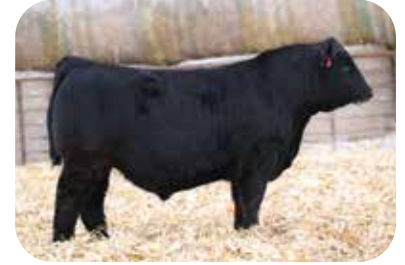
WINC GENERAL 03L Maternal Brother to Lot 62

Stemming from a young and productive, W/C Night Watch 84E daughter, this homozygous polled and homozygous black, ¾ blood female comes is a very balanced and productive package. She joins the lineup of CKCC Relevant 0639H daughters that continue to impress, and now that we have several in production, we are all in, and believe that they have potential to be some of the best mature cows we have bred on.