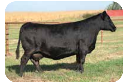
KAPPES SADIE T635 Y302 Dam of Lots 8-11

A prime example of the strong maternal function and longevity that this set of ET flushmate sisters possess. Bold and powerful in regards to her muscle pattern and shape, being round ribbed, big hiped, and square from end to end. She is due to calve early to our newest calving ease specialist, ES Stronghold LA110-14, for a quick return on investment!