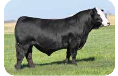
RFS HEAVY HITTER H45 Sire of Lots 6 & 7

You are going to find immense quality all the way through this book, and there is absolutely no exception with the pair of RFS Heavy Hitter H45 x Kappes Sadie T635 Y302 daughters selling here. When it comes to sorting the offering for potential to generate high performance offspring, then both of these sisters will be ones on the top of the list. This homozygous polled and black purebred female ranks top 10% for both WW & YW, along with top 2% for REA.