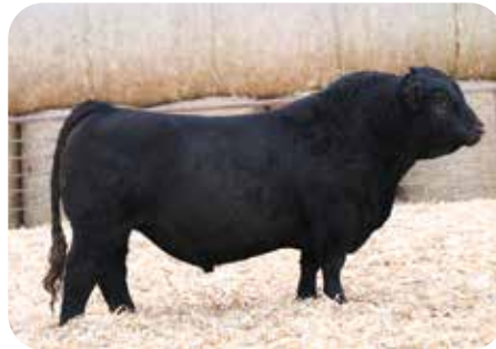
WINC FORTRESS 170J Son of Lot 5