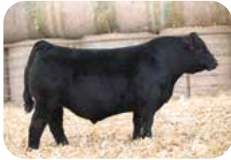
WINC RELEVANT 359L Son of Lot 55