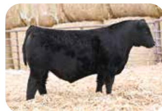
WINC/TCM STUNNER 288K Maternal Brother to Lot 16 & Son of Lot 15