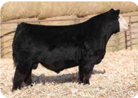
WINC SURELOCK 447M Son of Lot 33