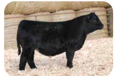
WINC FORTRESS 4141M $7,000 Maternal Brother to Lot 63

WINC 5121N is a beautiful blaze faced R&R Testament J155 daughter from a super practical and low maintenance female we purchased from Western Cattle Source. We appreciate the added efficiency and hardiness that this maternal lineage brings to the table, and think this female fits the bill for a program that operates with less inputs, but demands high outputs!