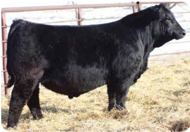
W/C REVOLUTION 65G Sire of Lot 12