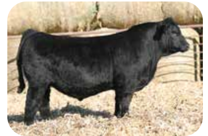
WINC FT KNOX 170J Maternal Brother to Lots 6 & 7, Son of Lot 5

The second of the flush sisters is baldy faced and comes extra heavy and burly in her design, she is powerful in her muscle shape and spring of rib, and has donor cow potential written all over her. She covers her track with ease, and looks to share that same principle of longevity that her has made her mother's tenure so long and potent for the WINC brand.