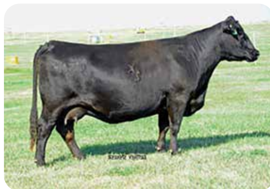
ALC TREASURE C50P Legendary Dam of Lot 20