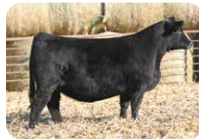
WINC 064H $24,000 Full Sister to Lot 1