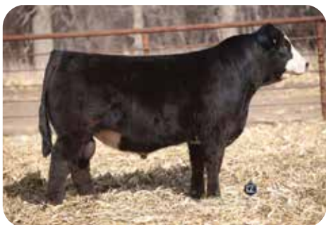
ES STRONGHOLD LA110-14 Sire of Lots 74 & 75

A stout made brood cow prospect that reads very productive in her build and body style. We deem her flawless in terms of her skeletal design, and she looks to be the easy keeping kind that offers tremendous longevity. She is no slouch when it comes to her EPD profile either, with top 10% WW, and top 4% YW & ADG figures. This trend was also reflected by her impressive 115 WWR, and 750lbs. plus weaning weight.