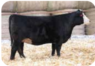
WINC 001K Maternal Sister to the Dam of Lot 59 & Full Sister to the Dams of Lots 60 & 61