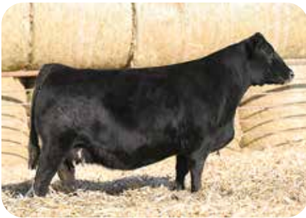
W/C MISS WERNING 638D Dam of Lot 42