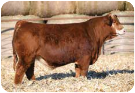
WINC GENERAL 052L Son of Lot 51

Service Sire: Bridle Bit Recharge K256 (ASA# 4058272) Heifer Calf Due: 2/8/25