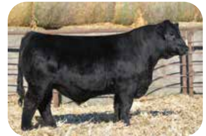
WINC BEACON 014H Son of Lot 40 & Maternal Brother to Lot 41