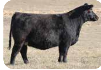
RJ MISS HEARTBREAKER 001H Dam of Lot 47

Service Sire: ECC CKCC Roosevelt 4903M (ASA# 4395859) Heifer Calf PE: Bridle Bit Recharge K256 (ASA# 4424480) 4/20/25-5/15/25. Too close to call. Due: 1/31/26