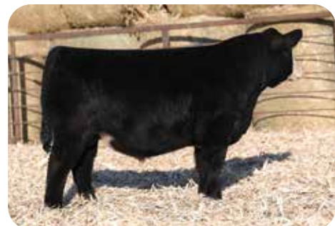
WINC TESTAMENT 4153M $9,000 Maternal Brother to Lot 61

Winc 5109N is the CKCC Relevant 0639H sired granddaughter of the 624D lineage. She is bold centered, deep flanked, and portrays a very functional body style. We love the extra stoutness and dimension that she also brings to the equation. Her calving ease maternal brother, was selected by Jeremy Moege in this past year's "Profit through Performance".