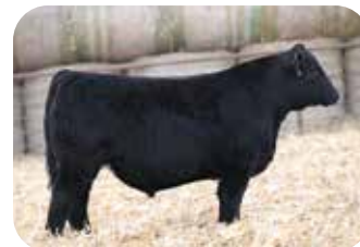
WINC EPIC 3119L Son of Lot 49