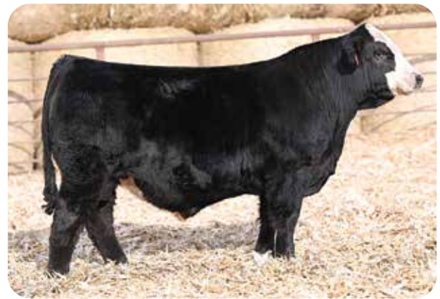
WINC SURELOCK 266K Maternal Brother to Lot 12 & Son of Lot 5