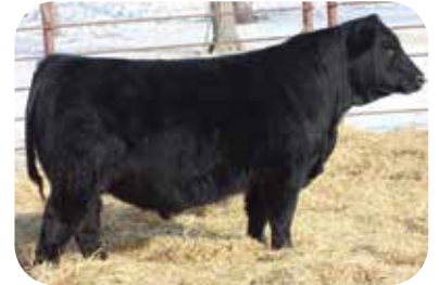
W/C REST EASY 752G Sire of Lot 38

A young and productive Simgenetic breeding piece that comes from our good friends in western Nebraska, at Western Cattle Source. They live in cow country, where cattle aren't babysat, and are forced to prove themselves with efficiency and longevity, and those are two descriptions that certainly fit the bill here. WCS Ms Rest Easy 2441K is built for the long haul, and also keeps in good flesh, while weaning a big calf. Her sire, W/C Rest Easy 752G is a past high seller from Werning's that was selected by Western Cattle Source and Select Sires.