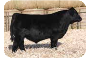
WINC FORTRESS 4171M $15,000 Son of Lot 36

When you walk through the pens on sale day, SHCO Glenda 373G is certainly a female that will jump out and grab your attention because she is a big scaled, heavy duty, power cow! Raised on the northern plains, and built for the northern plains, she gets the job done. While those who come searching for a female that reads with performance on paper may look past this female, those who value ruggedness, dimension and burliness will certainly appreciate what they find in the flesh here. Her son WINC Fortress 4171M found lots of friends this past spring, and sold to Emeri Gottlob.