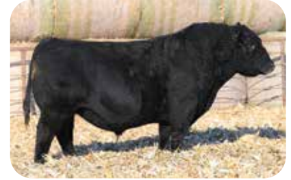
CKCC RELEVANT 0639H Sire of Lot 43

WINC 4144M is a beautiful baldy faced female that comes with an extra shot of power, all while offering superior fleshing ease and real world performance. She offers a functional skeletal design with more than enough power and substance, and in turn we love the genuine turn and shape that she offers to the center portion of their rib cage. She comes bred up to her first service, Bridle Bit Recharge K256.