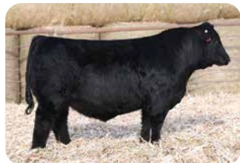
WINC RELEVANT 468M $13,000 Maternal Brother to Lot 73