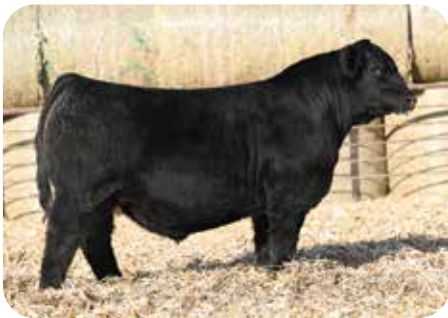
BLAG MR HUSKER 2J $15,000 Maternal Brother to Lot 64

Those looking to add a female that is backed by a high powered, heavy performance genetic package will need to pay attention when WINC 5118N goes under the hammer. This direct daughter of WINC Beacon 018H sports a number profile that screams growth and high yields. Her raw data suggests the same, as she was impressive coming to the weaning pen, with over 750lbs. of pay weight. We think you will appreciate the length of side, width of pin set and ruggedness of structure she comes built with too.