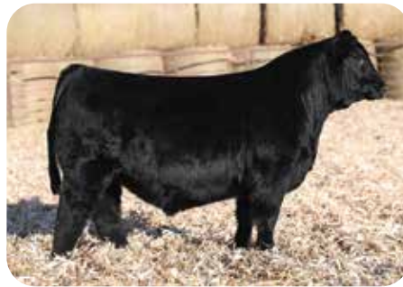
WINC JOURNEYMAN 4111M Full Brother to Lot 42