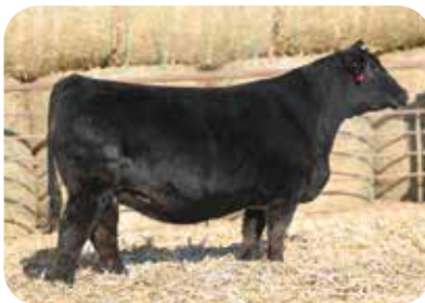
WINC 089H Full Sister to Lot 1