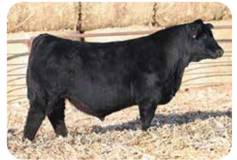
WINC MATTER OF TIME 249K Maternal Brother to Lot 42