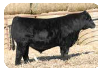
WINC STATEMENT 1105J

WINC 3139L is the CKCC Relevant 0639H daughter of the incredible, ES F17 that you find on the top half of this page. This black hided version of the impressive matron reads with the same functional body type, perfectly hinged structural design, and high generating potential as her dam, yet she reads with some advantages from an EPD perspective. We have found the CKCC Relevant 0639H daughters to be consistently deep, sound, smooth, feminine, and maternal. These fundamental traits combined with consistency in production, is why we think is he a cowherd changer!