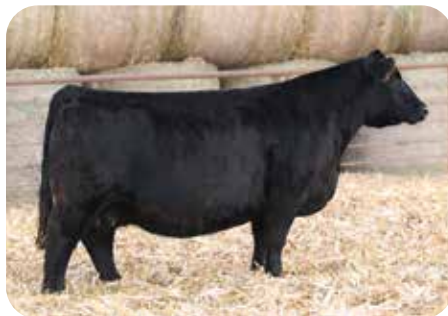
WIREGRASS BARBIE 705F Dam of Lot 64