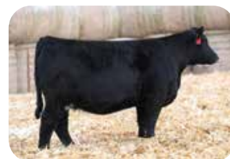
WINC MISS 2129K

F17 has a lot to offer a program that is looking for an outcross pedigreed, red hided, purebred donor female! She is a powerful beast in her body cavity, but one that remains so neat and refined about her front third. We love how bold her ribcage is, how wide her stifle and pin set sit, and how flawless she remains on her feet and legs. Several progeny of F17 have been highlights of the "Profit through Performance" over the years, with a daughter selling to Addison Cattle, and a son selling to Johnke Farms. Elegance, depth, volume, and production are all inclusive in this proven female. Regardless of the service sire in this situation, it reads as a recipe for success in our minds.