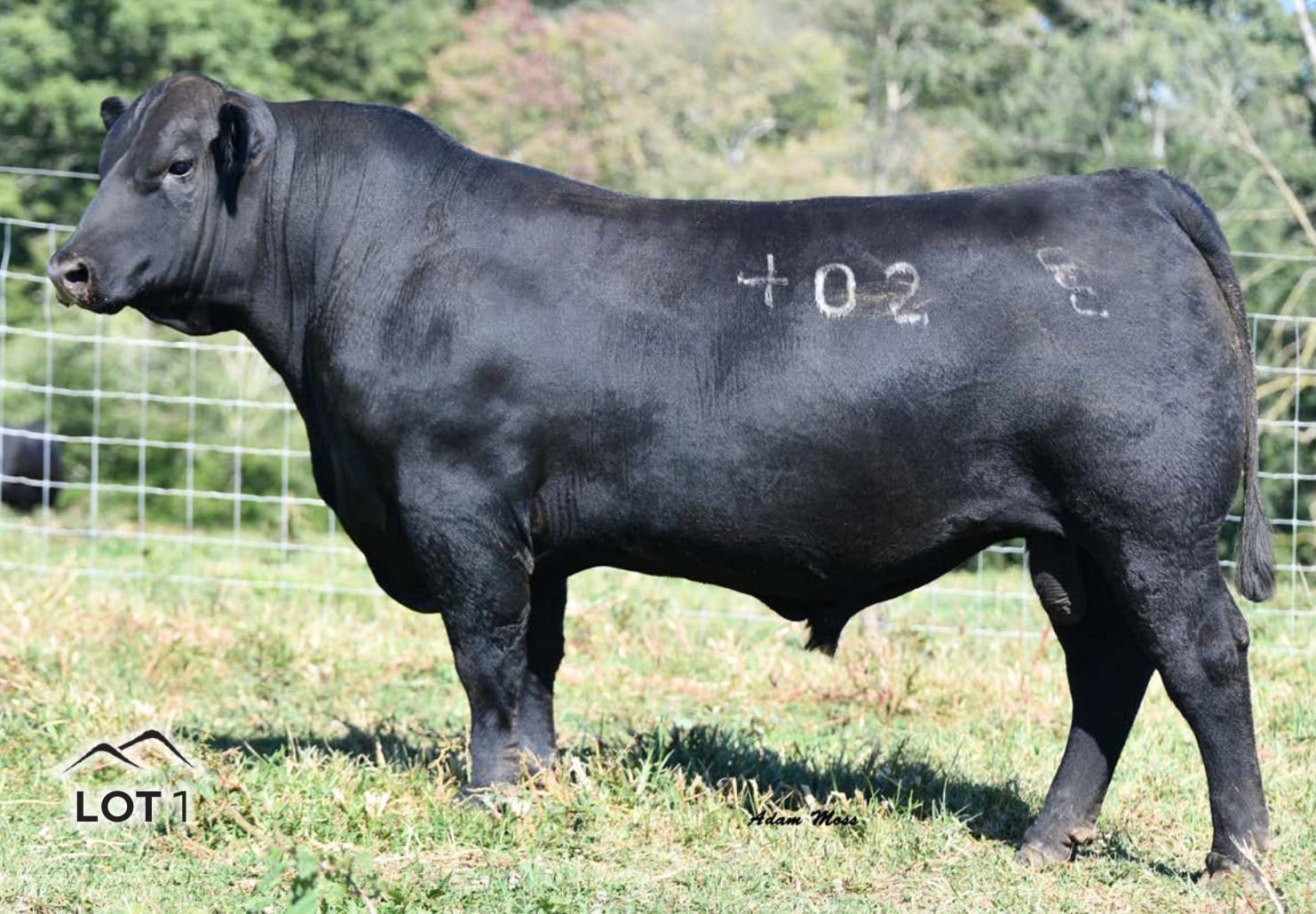
CHAPMANS STEP UP 402 - LOT 1