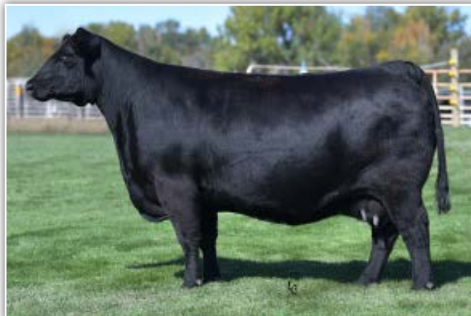
FROSTY ELBA 3745 - DAM OF LOTS 44A &amp; 44B

Ranks in the top 1% for Claw; top 15% for MILK and $M; top 20% for $W and $C.