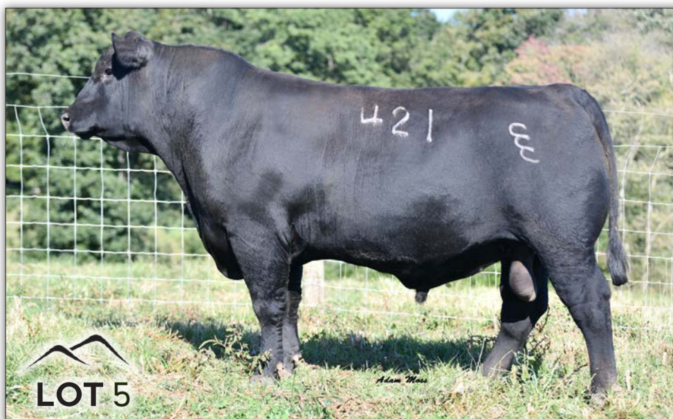
CHAPMANS CROSSFIRE 421 - LOT 5