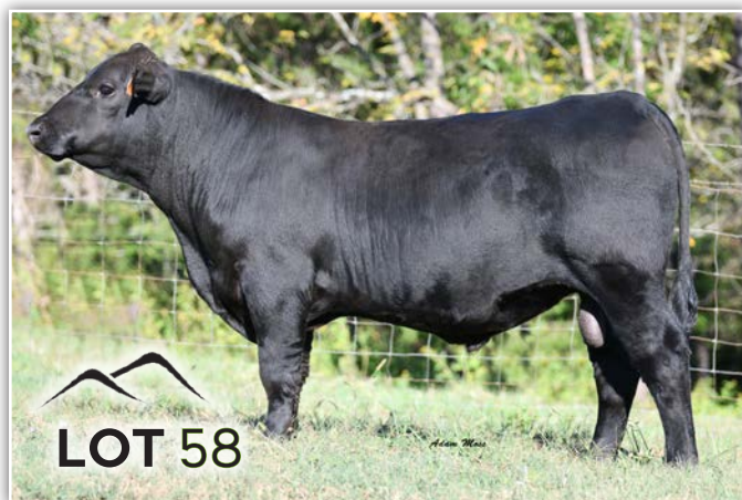
SAI GUNSMOKE M171 - LOT 58 (1/2 SIMMENTAL 1/2 ANGUS)

• This Gunsmoke son is 1/2 Simmental 1/2 Angus with Double-Digit Calving Ease and top 4% Growth Traits. Make a mental note: He is just a 12/8/24-born calf and SSS will be glad to feed him for a few extra months to develop him. He reads a great profile that covers a lot of ground for Milk, MWW, Stayability, CW, Marb, RE, API, and TI. This is a very well-balanced bull. He should provide plenty of hybrid vigor, growth, carcass value and style. He is also out of the same dam that produced the high-selling Jonesboro sons in last year's sale for SSS.