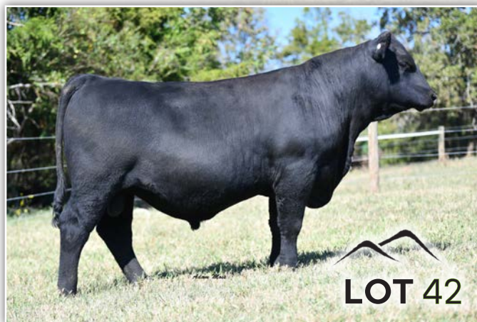
BBA CONGRESS 1214 - LOT 42

Ranks in the top 1% for WW and YW; top 3% for CW; top 4% for $W; top 10% for MW, SC, YH, Angle and $C; top 15% for $B, $G and MARB; top 20% for $F, RADG and PAP; top 25% for HP and MH.