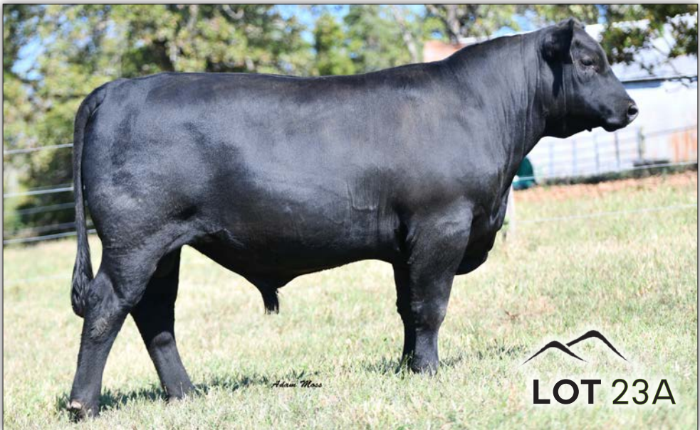
BBA BREAKTHROUGH 1223 - LOT 23A

Birth Date: 10-08-2024 Bull #*21192322 Tattoo: 1223 +*G A R Prophet K263 +*Chair Rock 5050 G A R 1131 +*H P C A Sure Fire S6 +*H P C A Ingenuity A372 #*G A R Momentum +*Daltons Lass 77 18766599 +*Daltons Lass 515