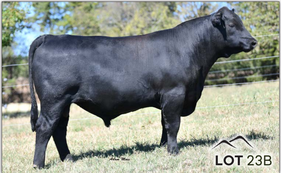
BBA BREAKTHROUGH 1240 - LOT 23B

Ranks in the top 3% for RE; top 5% for $G, CEM and $AXJ; top 10% for $B, CED, MARB, MILK and $AXH; top 15% for $W, FAT, MH and $C; top 20% for YW, RADG and PAP; top 25% for YH.