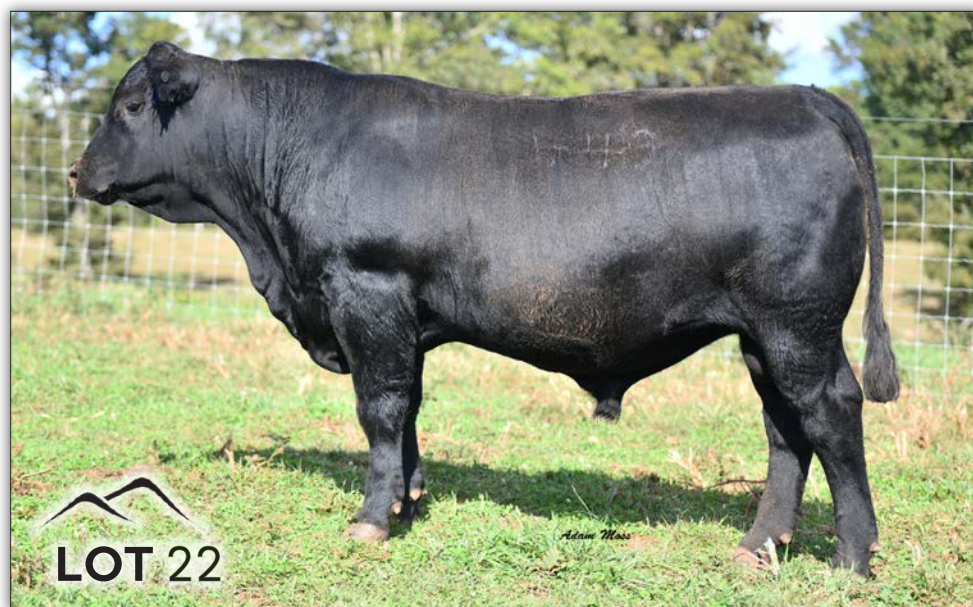
CHAPMANS BREAKTHROUGH 449 - LOT 22

Ranks in the top 1% for $B, $F, CW, RE, WW, YW, $C, $AXH and $AXJ; top 2% for $G and MH; top 5% for $W and MW; top 10% for MARB, YH and RADG; top 15% for Angle; top 25% for CEM and FAT.