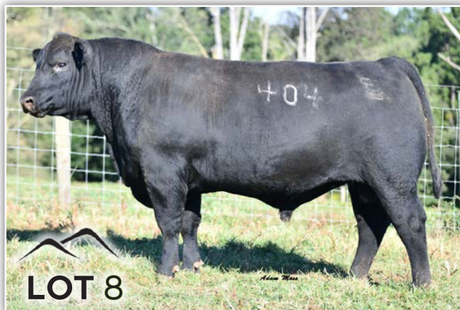
CHAPMANS MAN IN BLACK 404 - LOT 8

Ranks in the top 2% for MILK; top 5% for TEAT, $M and Angle; top 10% for UDDER; top 15% for $W and Claw; top 20% for $G, DOC, RE and $C; top 25% for $AXH and $AXJ.