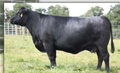
LHR SUSIE 9803 - DAM OF LOT 27, 28A, 28B, 61A, & 61B