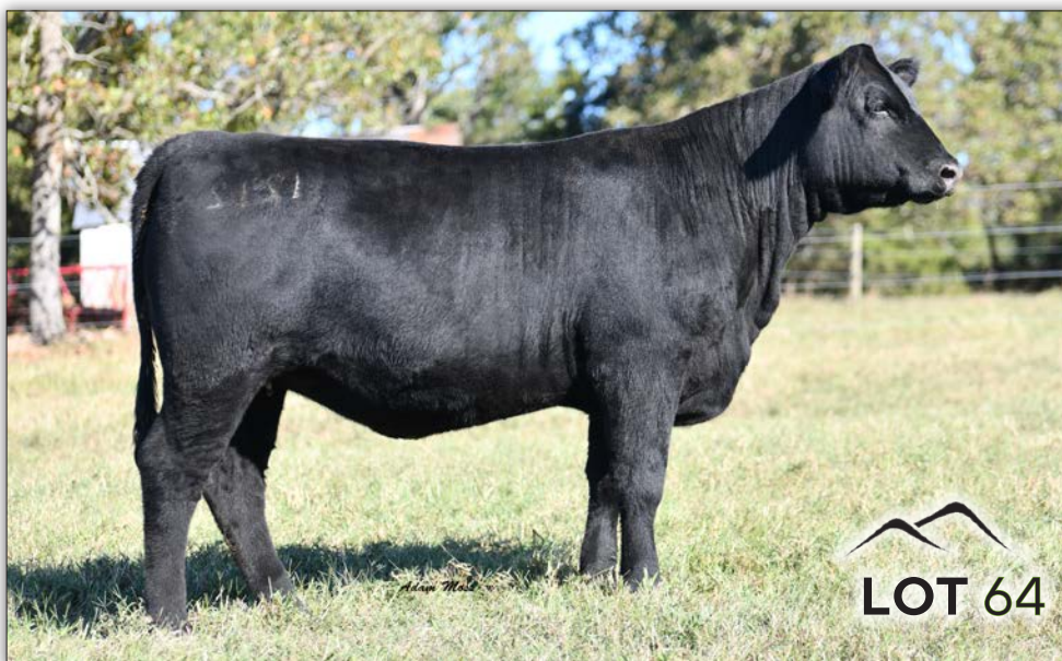
BBA RITA 1212-1009 - LOT 64