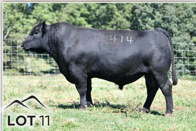
CHAPMANS BRIGADE 414 - LOT 11

Ranks in the top 3% for HP and MILK; top 4% for PAP; top 10% for DMI; top 20% for MARB and SC; top 25% for $EN and YH.