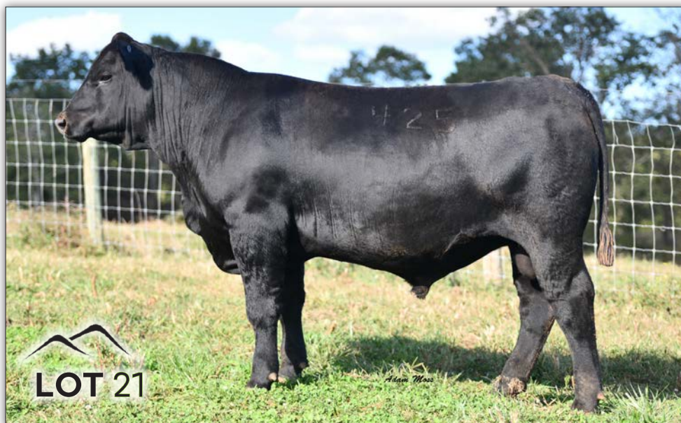
CHAPMANS BREAKTHROUGH 425 - LOT 21