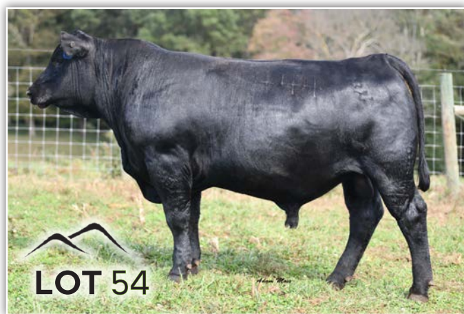
CHAPMANS YG FUND 444 - LOT 54

Ranks in the top 10% for $G, $M, $C and $AXH; top 15% for DOC and MARB; top 20% for $B, RADG, Angle and $AXJ; top 25% for FAT and UDDER.