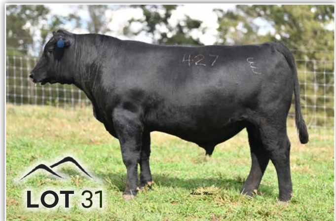
CHAPMANS IDENTIFIED 427 - LOT 31

Ranks in the top 4% for $F and $C; top 10% for $B, CEM, CW, $M and Angle; top 15% for CED, YW and $AXH; top 20% for $W, HP, MARB and RADG; top 25% for $G and $AXJ.