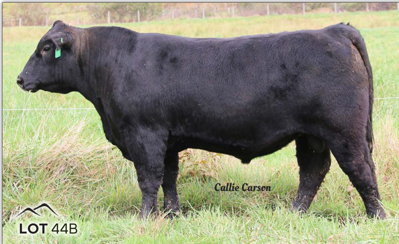
CARSON CRAFTSMAN M36 - LOT 44B