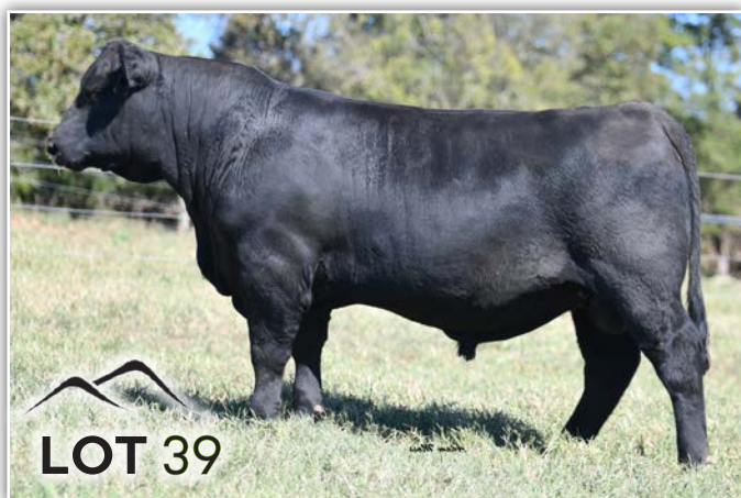
BBA REGIMENT 1215 - LOT 39