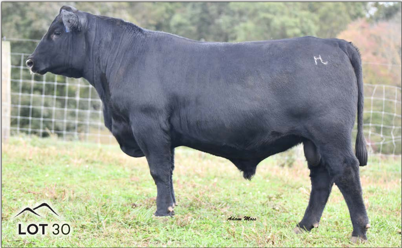
HC IDENTIFIED 831 - LOT 30