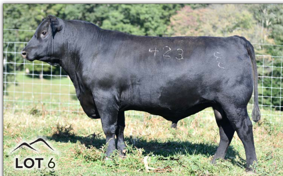
CHAPMANS VERACIOUS 423 - LOT 6

Ranks in the top 1% for MARB; top 2% for $G; top 3% for $C; top 5% for $B and $AXH; top 20% for HP, RADG, $M and $AXJ; top 25% for $F, CED and Claw.