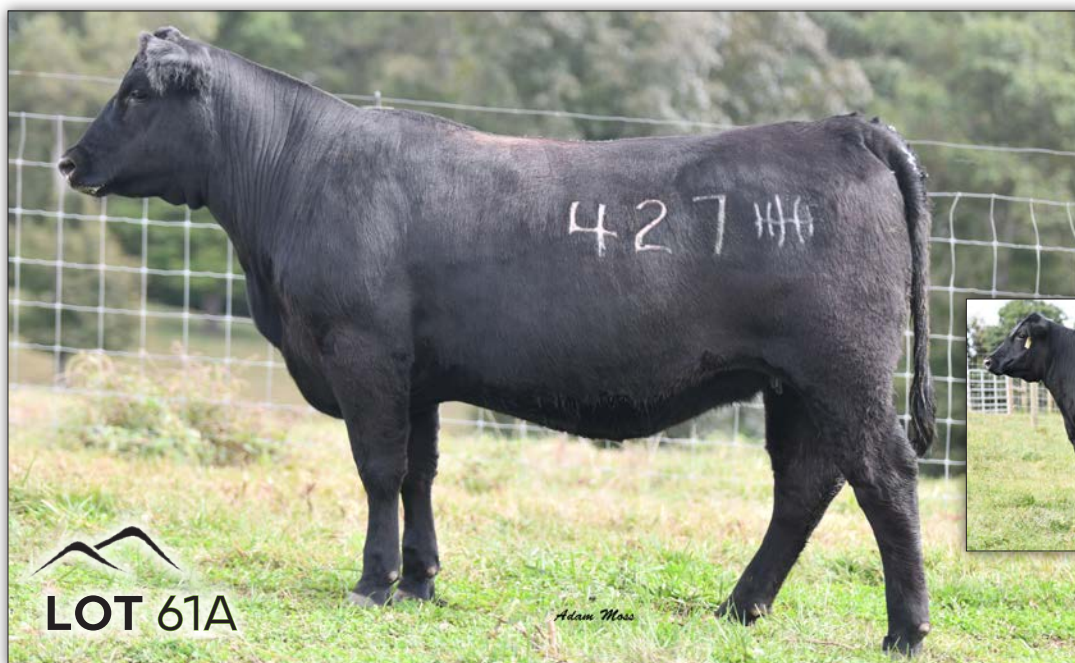
HIDDEN HILLS SUSIE 427 - LOT 61A