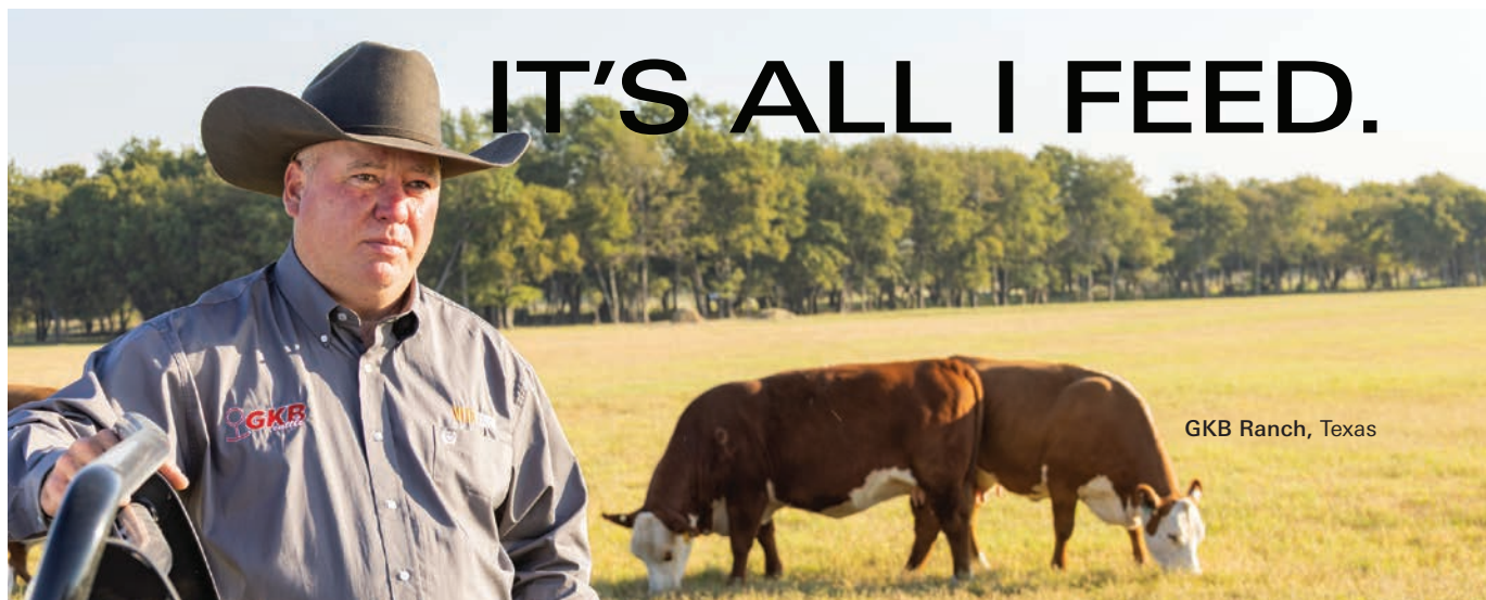
GKB Ranch, Texas