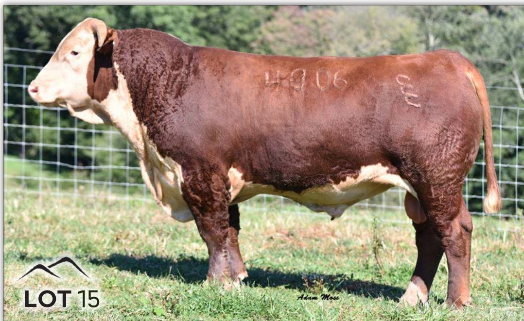
CCC L1 DOMINO 4006 - LOT 15