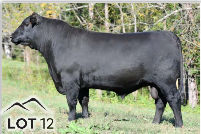
SSS RITO DUAL THREAT 166 - LOT 12