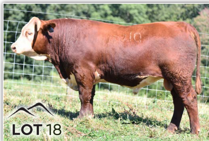
CCC L1 DOMINO 4010 - LOT 18