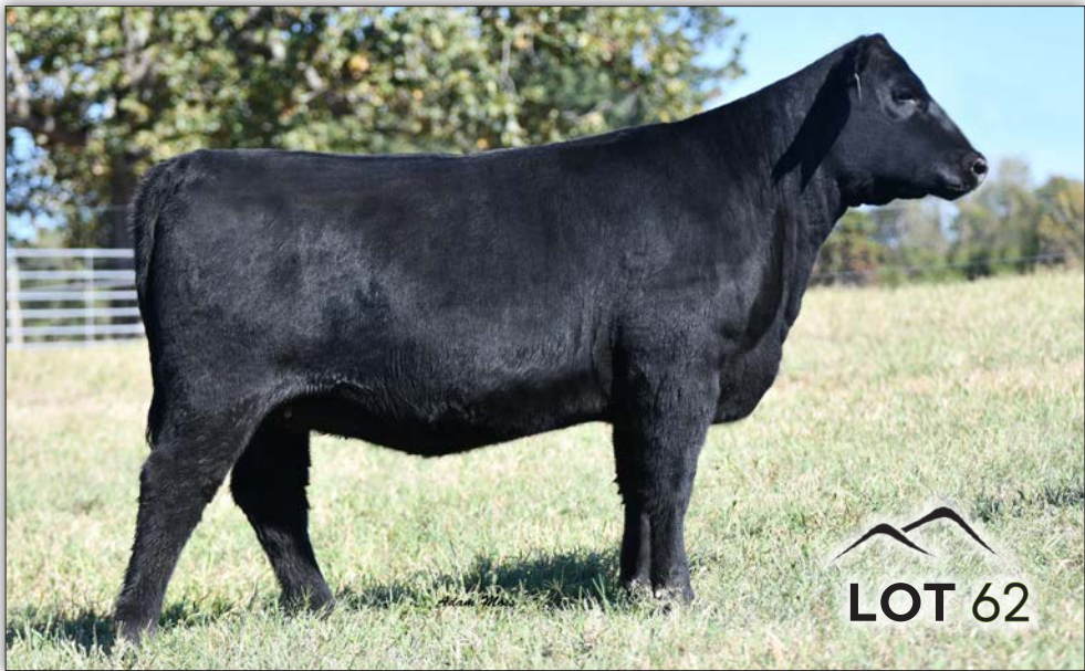
BBA RITA 1207-0989 - LOT 62