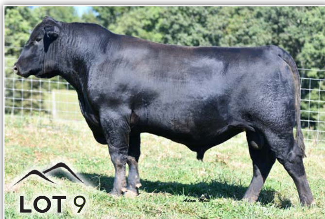
CHAPMANS BFF HOLLYWOOD 303 - LOT 9

Ranks in the top 10% for YH, RADG and Angle; top 15% for SC and YW; top 20% for $G, MILK, RE and $AXJ; top 25% for MARB and $C.