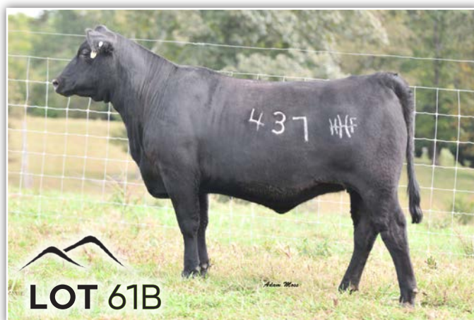
HIDDEN HILLS SUSIE 437 - LOT 61B

Ranks in the top 3% for Claw and $W; top 4% for YW and MILK; top 5% for SC and $C; top 10% for WW, RADG, DOC, CW, $F, $B, $AXH and $AXJ; top 15% for $G; top 20% for CEM, MARB and $M; top 25% for YH and Angle.