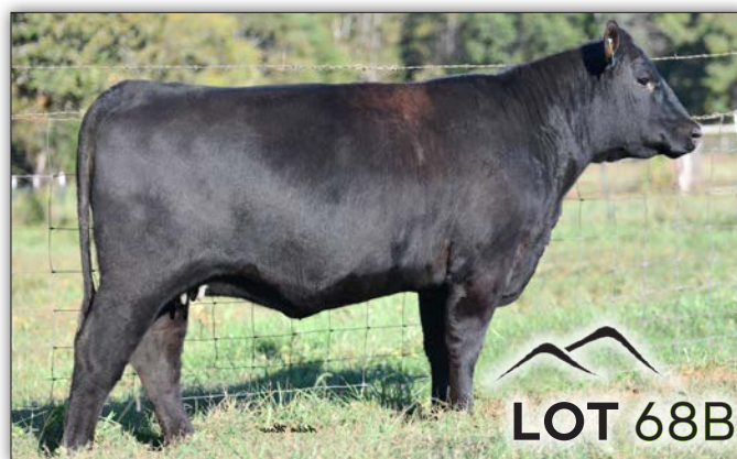
SSS ELIA CUPCAKE 1123 - LOT 68B