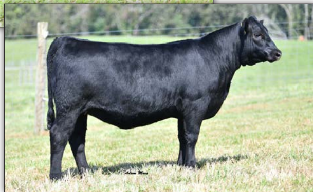
BILTMORE BLACKCAP 33N - THE $26,000 1/2 INTEREST FULL SISTER TO LOTS 60A, 60B, & 60C

• 502 is a January-born son of the great Gettysburg. CCC will feed him until spring at no charge. He is young, but we felt he deserved to be sold to someone who could use him in the spring versus hold him for another year. His sister was one of many highlights at the recent Biltmore Sale in September. She was the $26,000 1/2-interest selection of Bullard Creek Cattle in Pennsylvania. A female that expressed captivating style and presence with great muscle. 502 also has great muscle and looks powerful and masculine early. He is long and will cover ground smoothly and easily. He is a double-digit calving ease, low-birth bull with top 15% Growth Traits with excellent Maternal Value. You will appreciate his Teat, Udder and FL EPDs, with solid Management Traits and very attractive Carcass Value. Top 15% $M, 10% $W, 4% $F, 10% $G, 4% $B and 2% $C to make him a super, well-rounded herd sire prospect.