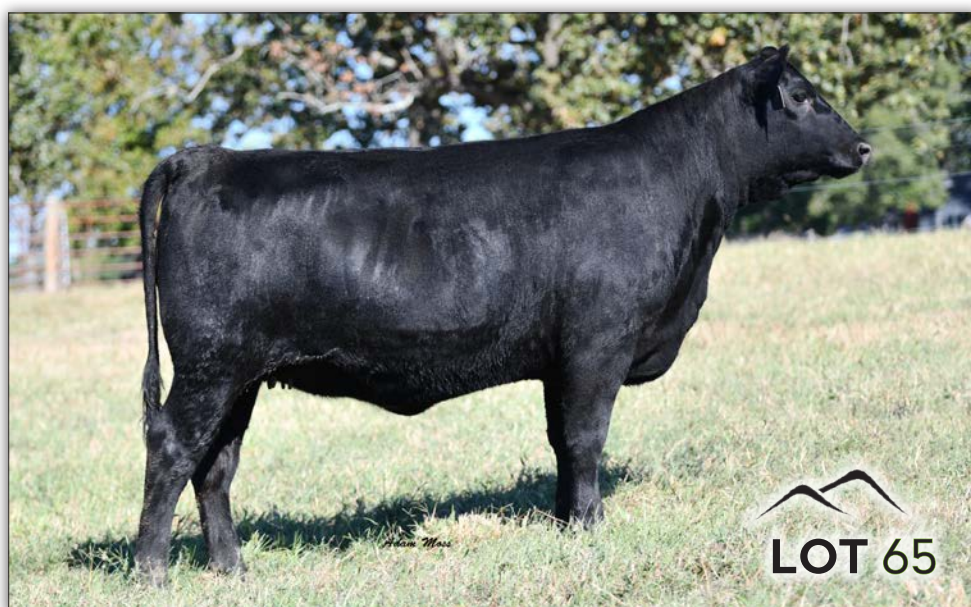
BBA LADY 1211-802 - LOT 65

Ranks in the top 1% for $W; top 2% for CEM; top 3% for YH; top 5% for $M; top 10% for CED, WW, MILK, Angle, $C and $AXJ; top 15% for CW, $F, $G and $B; top 20% for YW, DOC, MARB and $AXH; top 25% for RE.