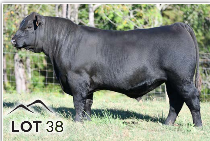
SSS BOLD RULER 3M06 - LOT 38