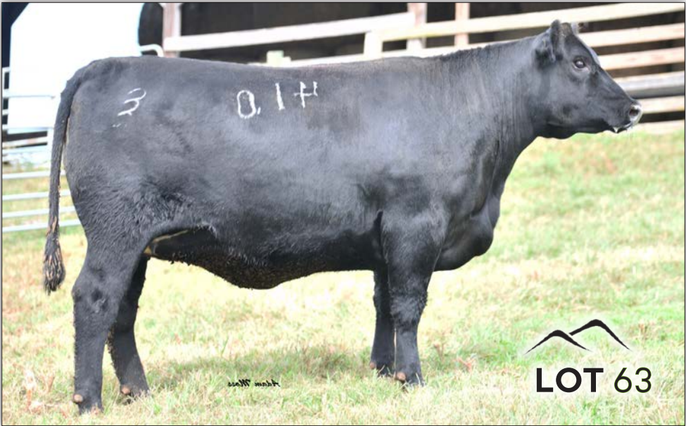
CHAPMANS JADE 410 - LOT 63

• This really stout, thick-made Top Cut daughter has a great combination of Calving Ease, Low Birth Weight and High Growth. You will also appreciate her SC and HP with a solid combination of Teat, Udder, and FL. She offers excellent Doc, top 10% HS and a superior combination of End-Product Traits. When you evaluate her Economic Values, you will find she is in the top 20% or better for $M, $W, $F, $G, $B and $C. She is due in January with a calf by ABS standout roster member TAR Dominance, whose sons and daughters have been highly sought after around the country. Ranks in the top 2% for SC, $G, $AXH and $AXJ; top 3% for FAT and $C; top 4% for $B; top 5% for RE; top 10% for CED, MARB and $W; top 15% for YW and $F; top 20% for WW, RADG, CEM, MILK, CW and $M.