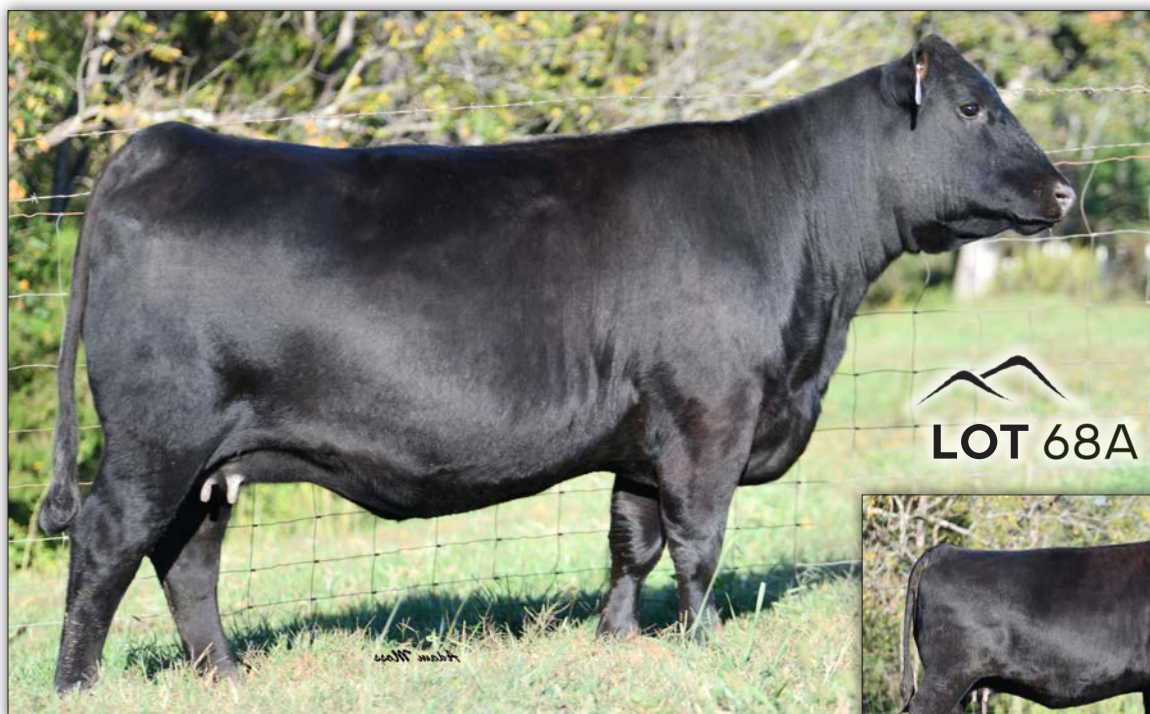
SSS FIREBALL 823 - LOT 68A