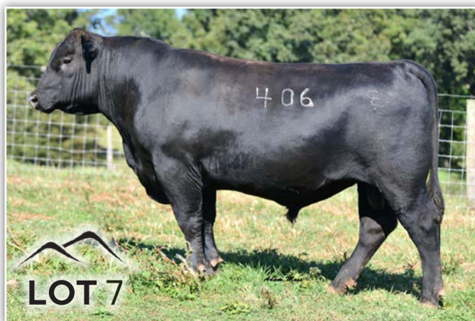
CHAPMANS WILDCAT 406 - LOT 7

Ranks in the top 1% for $B, $F, CW, WW, YH, YW and $AXJ; top 2% for $W, RE and $C; top 3% for RADG; top 4% for FAT and MH; top 5% for $G, MW and $AXH; top 15% for MARB and UDDER.