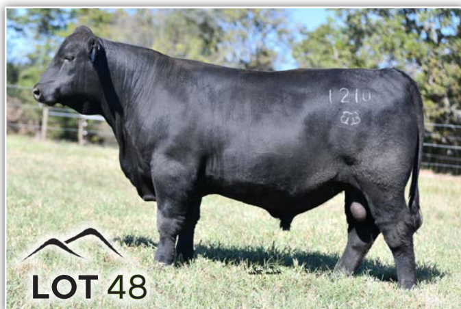
BBA DOMINANCE 1210 - LOT 48