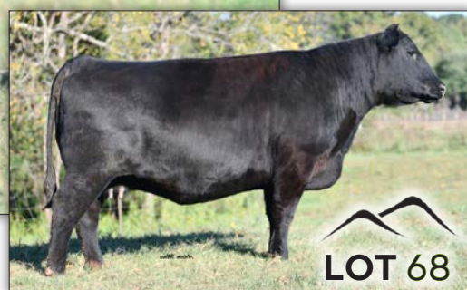
BYERGO ELIA CUPCAKE 9274 - LOT 68

Ranks in the top 1% for YH and SC; top 2% for MH; top 3% for WW and YW; top 10% for RADG, MW and $W; top 20% for FAT; top 25% for DOC.