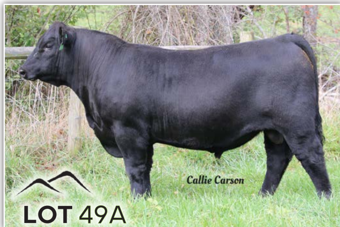
CARSON GROWTH FUND M26 - LOT 49A

Ranks in the top 4% for CED; top 10% for BW and CEM; top 15% for $W and DOC; top 20% for $G, MARB and YW; top 25% for SC, RADG, $M and Claw.