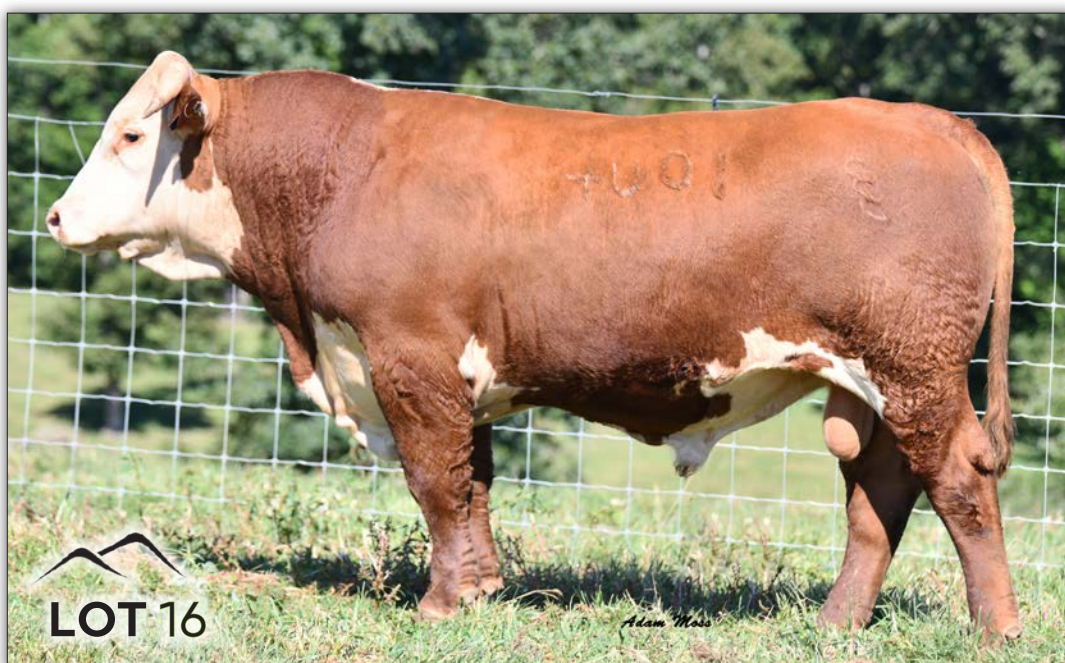
CCC L1CDOMINO 4001 - LOT 16