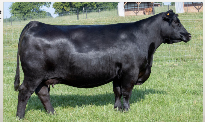
DBA Rita 1034 // Dam of WORTHY

WORTHY is also a trait leader for Marbling with a +2.10 EPD. His notable dam remains at the top of proven females in the breed for $Combined Value and is rapidly becoming one of the highest revenue generating females in the breed – not only for her inherit genetic levels, but also a high level of phenotypic power and quality in her offspring.