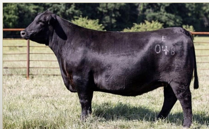
Baldrige Isabel E048 // Dam of INCOGNITO

INCOGNITO offers the total package — elite phenotype, breed-leading balance, and economic value that puts him in a league of his own.