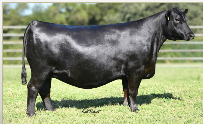
Vintage Blackcap 1084 // Dam of LANDMAN

LANDMAN is a stout-made, square-hipped individual with tremendous where he charted individual ratios of 98 for birth, 121 at weaning, and 116 for yearling. His dam is a beautiful 4 year-old that is very correct and level made with an attractive front end design.