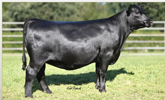
Vintage Rita 4277 // Flush sister to WESSON

In the flesh, this sire excels in phenotypic balance with distinct advantages in length, structural integrity, and internal dimension. He has an attractive pattern yet still maintains the masculine look of a herd bull.