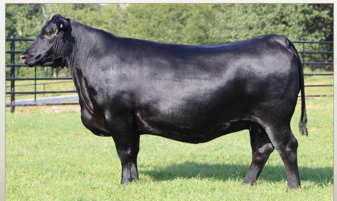
Ankony Miss Belle A064 // Dam of BAR Dominion 464M

We feel this young sire has as much potential on the seedstock side as any bull in our lineup.