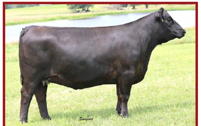
WSC OPAL G275 – GRANDDAM OF LOT 34

One of 5 females in the breed with her combination of WW, YW, SC, CW, Marb, SM, SW & SC