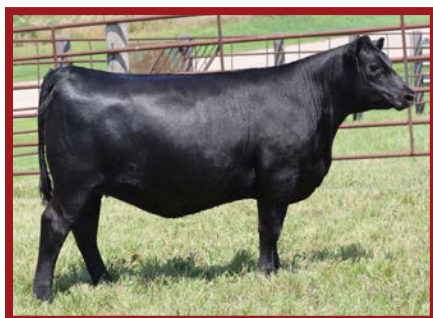
GA SUSIE 333-4603 - $125,000 PATERNAL SISTER TO LOT 9

What an opportunity here to buy the top DBA Authority female in the breed. DBA Authority was the $130,000 top-selling bull at the 2024 Cattlemen's Congress sale in Oklahoma City. His first calf crop has been beyond sensational with daughters topping sales across the country. They have the phenotype of the great Whitney cow family to go along with the mighty power of Ingram Heisman, and it's been a very balanced display of power and phenotype. The first daughter to sell publicly was the top selling female at $120,000 at this past September Gutwein sale. The second female to sell at public auction was the $95,000 high selling spring calf of this past September's Double Barrel Angus sale. 2524 has been a standout since birth. She was the natural calf from her two-year-old donor, and I promise she will not disappoint. She has the phenotype and genotype to win the National PGS show and will truly be a contender. 2524 has outstanding scrotal, top 1% HP, top of the breed teat and udder scores, tremendous fluid longevity, whopping +112 $M, along with an amazing top 1% $C.