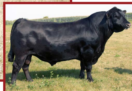
4 SONS LOGICAL – FULL BROTHER TO THE DAM OF LOT 27B AND 27C AT ABS GLOBAL