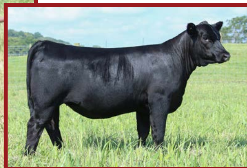
DBA HENRIETTA 3156 – DAM OF LOT 26 PREGNANCY AS A CALF