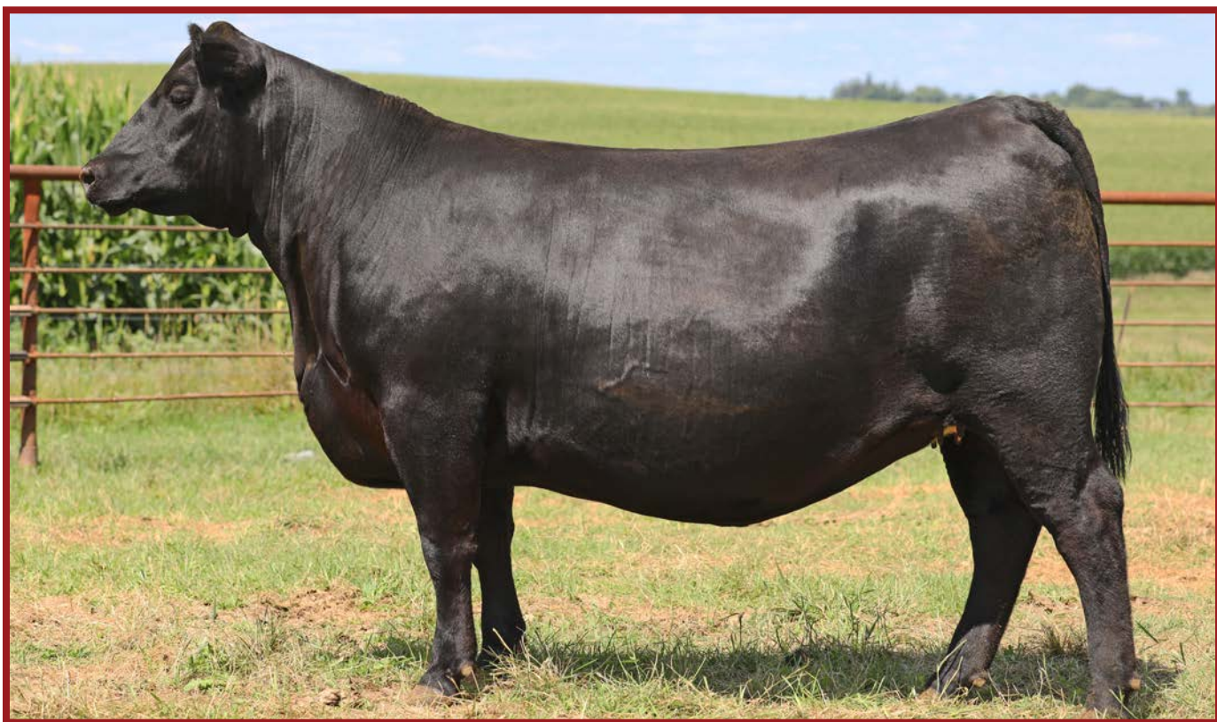
HF BARBARA 0169 – DONOR DAM OF LOT 41 PREGNANCY & $140,000 HENKE HIGH GROUND, THE TOP SELLING ANIMAL IN THE 2024 HENKE FALL SALE.