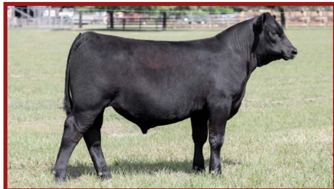
BIG MAGA - $220,000 VALUED SON OF LOT 37