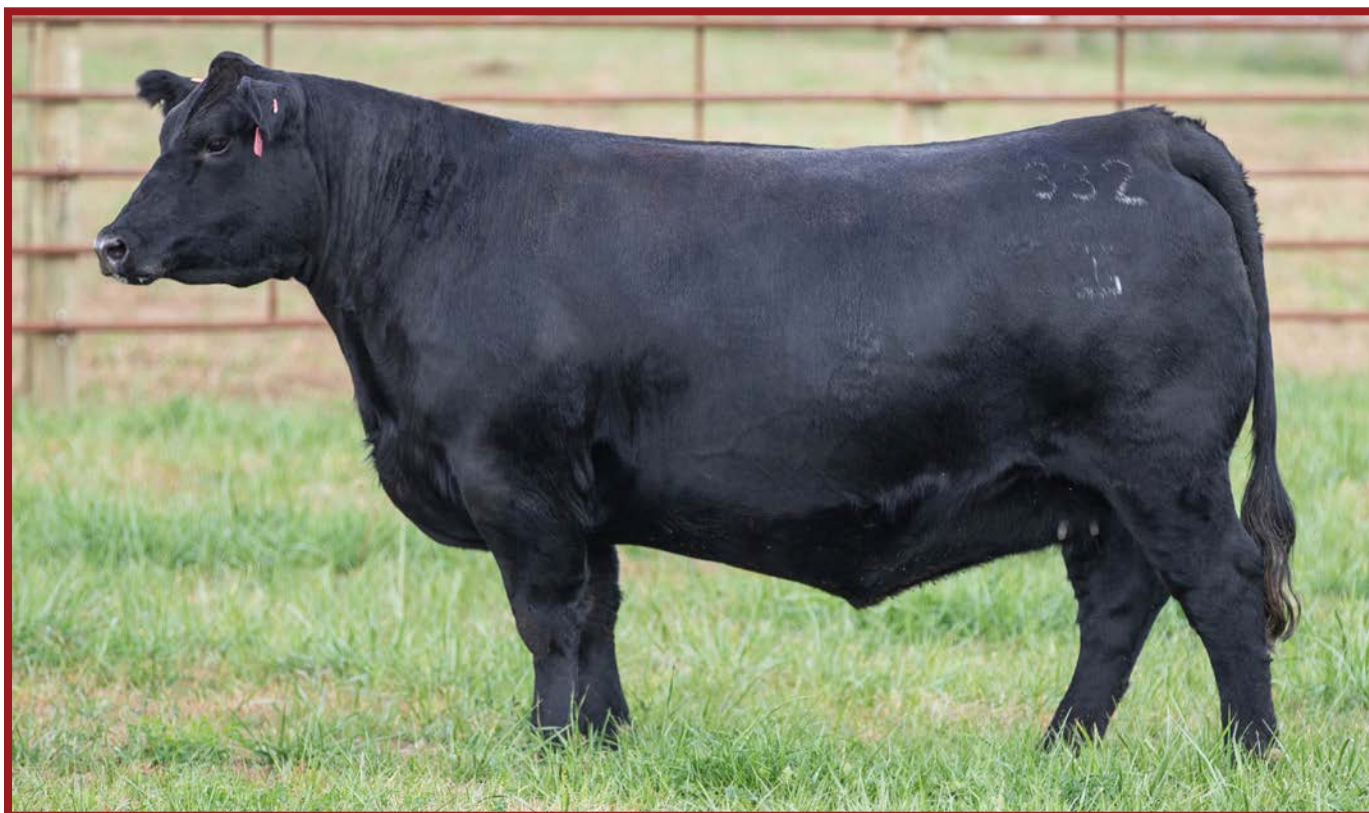
G A R SUNBEAM 332 – DAM OF LOT 4 PREGNANCY