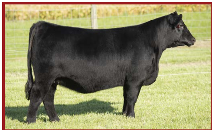
B-BAR EVERELDA 3002 - $25,000 MATERNAL SISTER TO LOT 35