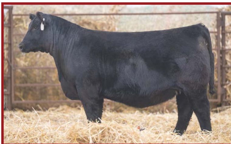
EB ERICA K4301 – $95,000 DAUGHTER OF DONOR DAM

Offering 3 IVF embryos by the $100,000 deceased Baldridge War Cry and the Edgar Brothers donor, EB Erica V8501. This exact mating produced the $95,000 selection of Grimmus Cattle in the 2025 Edgar Brothers Sale, EB Erica K4301. Talk about some serious performance, pedigree and phenotype, this genetic combination knocked it out of the park. A guarantee of 1 pregnancy if work is performed by a licensed professional.