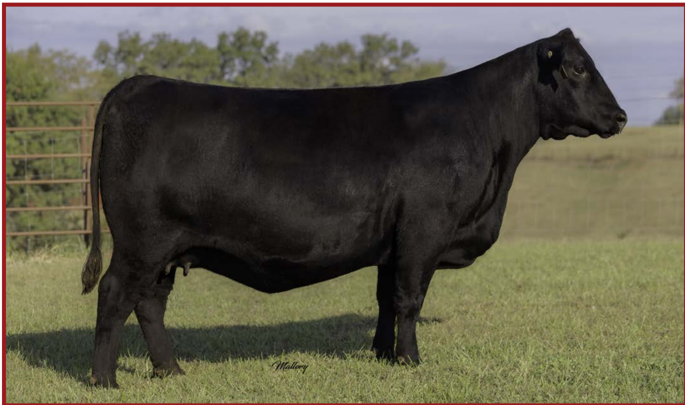
RHOADES LADY 453-3013 – FULL SISTER TO THE DAM OF LOT 1C