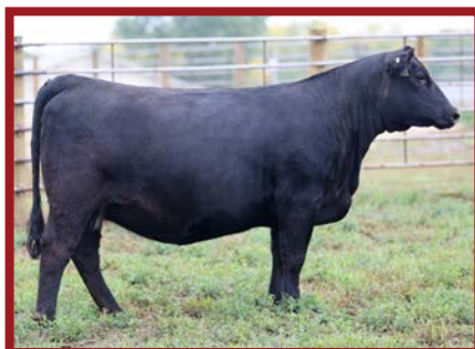
FB 327F VERACIOUS 6273 - GRANDAM OF LOT 31