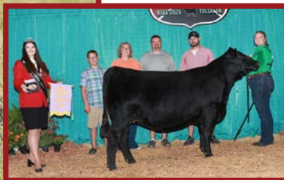
CCF LADY 3099

Selling a heifer calf pregnancy out of the incredible Division 4 PGS Reserve Champion at the 2025 National Junior Angus show. 3099 traces to an extremely unique branch of the Lady cow family. You will see no RB Lady Standard 890 along with no RB Lady Denver 453, giving you the ability to mate this young female to the sons of the multimillion-dollar producing 453. 3099 is from the second generation highlight of the Chessie Creek Lady Standard family, sired by the proven multi-trait superstar Beal Breakthrough. 3099 has a double digit CED with a negative BW, excellent docility, negative PAP, top 1% CW, top 3% Marbling and ribeye to go along with a top 1% +430 $C. Wilks Warrior, the sire of this pregnancy, is probably one of the hottest Heisman sons in the country. He, of course, hails from the top $C dam in the breed, DBA Rita 1034. His semen alone has brought close to $3500 a unit over the past six months. This one will be in high demand.