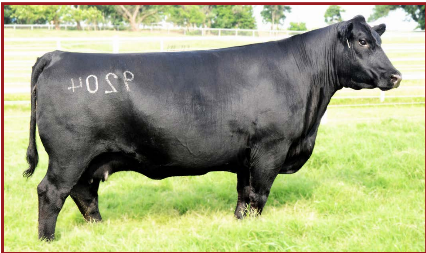
RSA FOREVER LADY 9204 – DAM OF LOTS 5A & 5B PREGNANCY