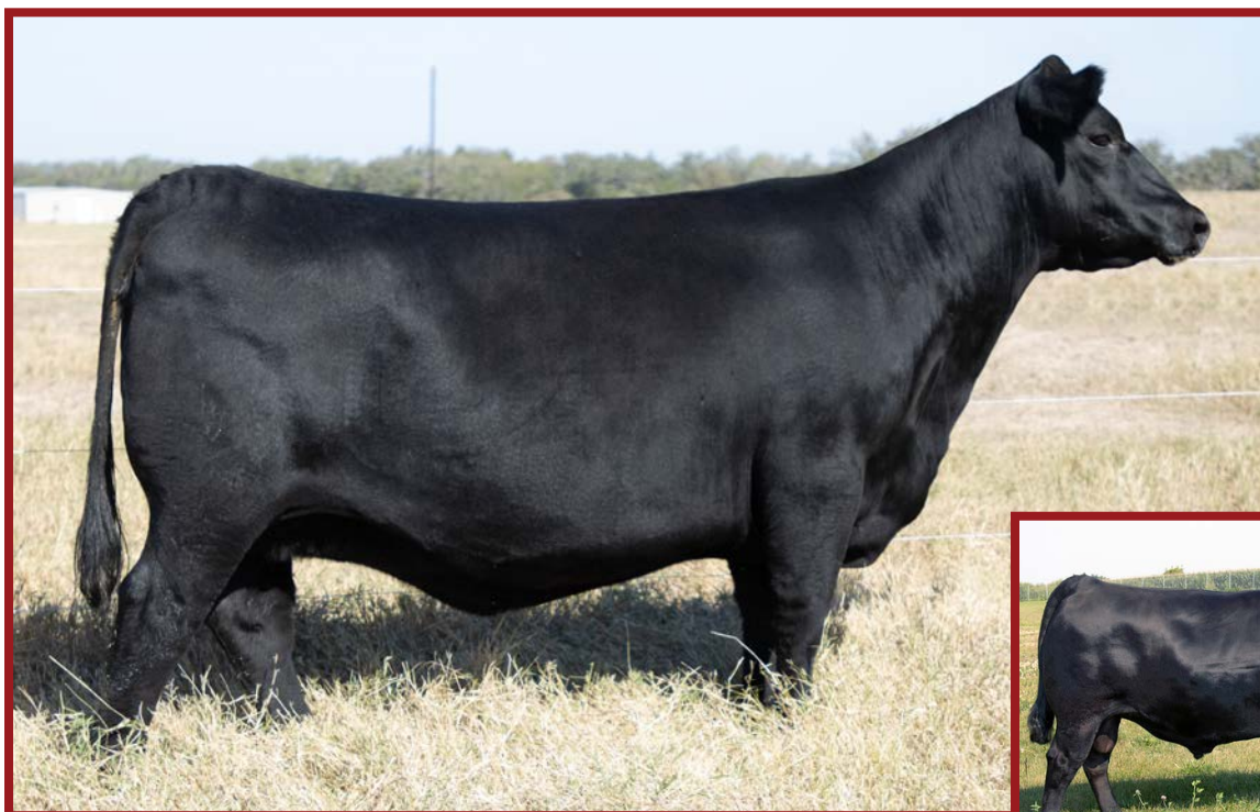
RHODES ISABEL 206 – DAM OF LOT 27B PREGNANCY