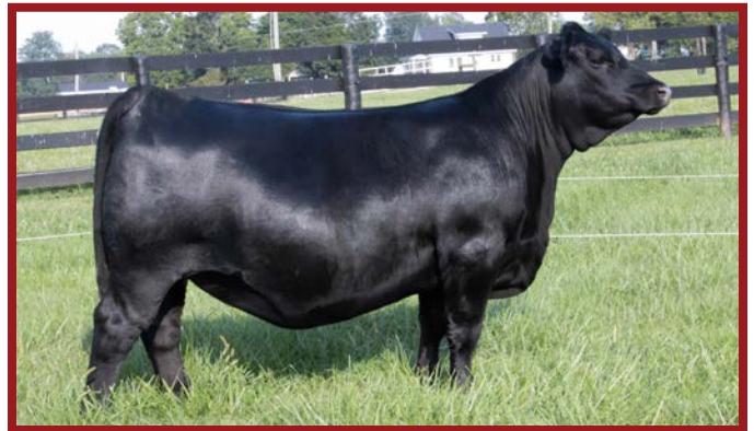
DBA RITA 4709 – $560,000 VALUED MATERNAL SISTER