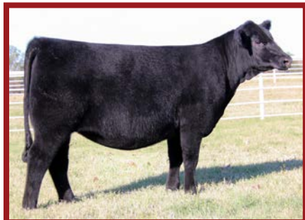
GABRIEL RITA 3523 – DAM OF LOT 11

The Number 3 $C female in the entire breed with her combination of CED, SC, PAP, and Marb, that stems from a dam that is the Gabriel Ranch donor, Rita 3523, who sold the $25,000 pregnancy in the 2025 Stars of Texas sale, selected by Stonewall Ridge, and was a highlight in the 2025 Stonewall Ridge sale. Just look at the genetic combination on this female that is a direct daughter of the very limited supply, RHI Satisfaction. Take advantage of this unique opportunity here, folks.