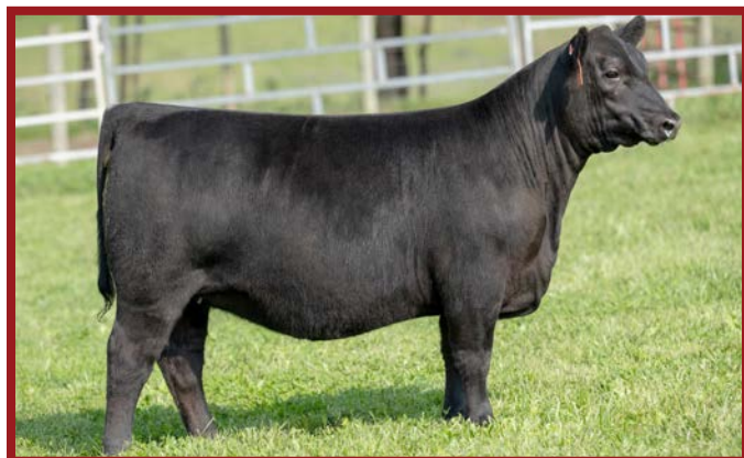
SANKEY RUTH 3007 – MATERNAL SISTER TO LOT 8