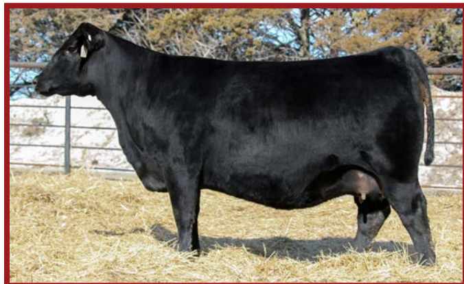
FF RITA 1S13 – $50,000 MATERNAL SISTER TO THE DAM OF LOT 42

Offering a choice in 5 unsexed pregnancies by the ABS Global sire 4 Sons Groundbreaker and from a dam that is a full sister to the granddam of the dam of Ambitious and Hustler, the $300,000 valued Rita 0237, and the $50,000 private treaty selection of Friendship Farms from Ney Cattle, FF Rita 1S13, who is a superstar, who are all anchored by the legendary deceased $150,000 valued EXAR Rita U049. The winning bidder of this lot will have a choice in 5 unsexed pregnancies after DNA at weaning. They are due to calve 11/3/2025.