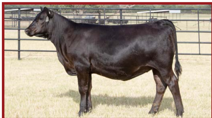
WILKS ERICA 001 – MATERNAL SISTER TO THE DONOR DAM OF LOT 48 PREGNANCY