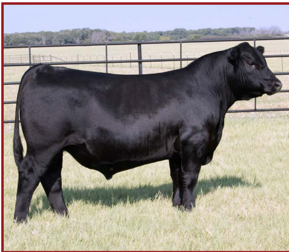
WILKS AVID 4864 – LOT 51 SEMEN