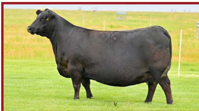
ERICA OF ELLINGTON T220 – MATERNAL SISTER TO THE DONOR DAM OF LOT 48 PREGNANCY

Offering a heifer pregnancy by the maternal sister of the $400,000 valued Erica of Ellington T220, the dam of the widely used super popular Bold Ruler, the $200,000 valued Erica 001, and the $250,000 valued Erica of Seneca H4. Not many opportunities come around with the potential to raise siblings to some of the hottest cattle in the industry. 2205 has a double digit CED with an incredible top 2% YW, excellent scrotal and HP combination, outstanding teat and udder scores, outstanding functional longevity, top 4% docility, top 1% hair shed, and all 4 carcass traits in the top 10% of the breed with a very balanced set of dollar values. The sire of this pregnancy is none other than Wilks Crick, one of the absolute hottest bulls in the industry. He is a son of the top $C cow in the breed for the past four years and very seldom is there a brother or sister that sells for less than $100,000. It truly is one of the top cow families in the industry today.