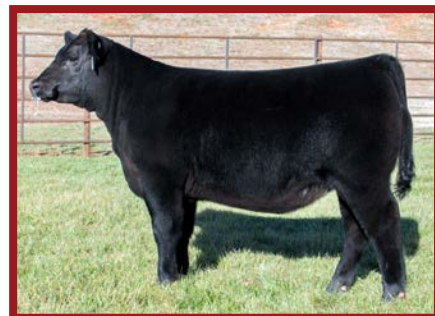
KC RITA 4105 – $30,000 MATERNAL SISTER TO THE DAM OF LOT 39B