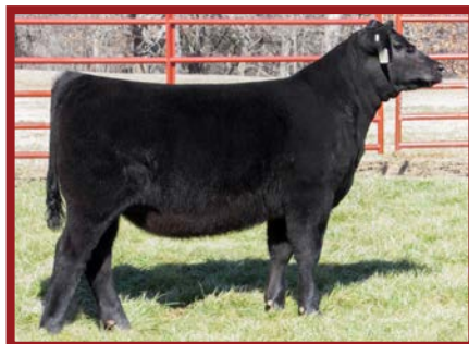
KC RITA 4103 – $29,000 MATERNAL SISTER TO THE DAM OF LOT 39B