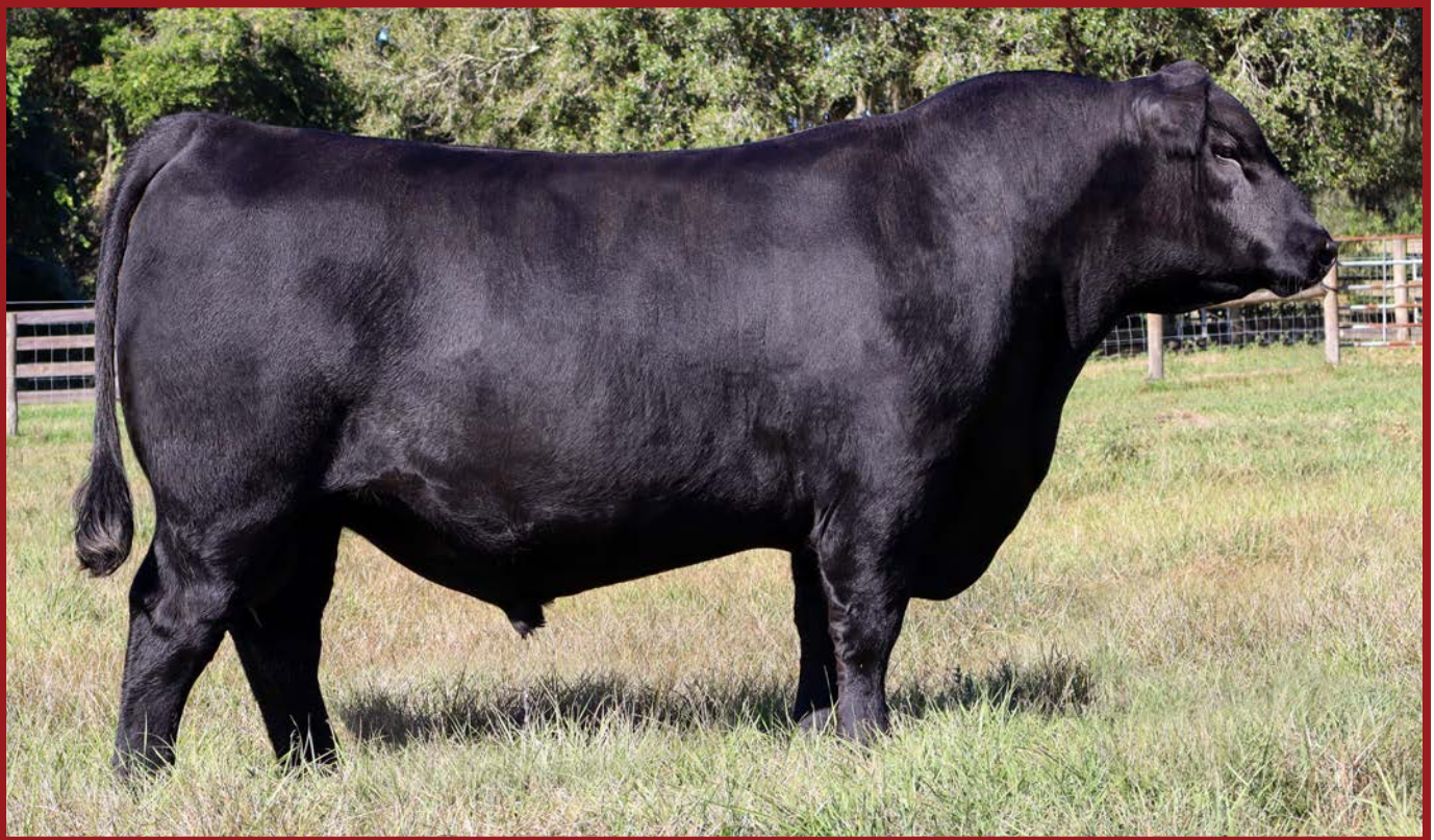
CIGAR/LUCKY V PROTECTOR – LOT 56 SEMEN