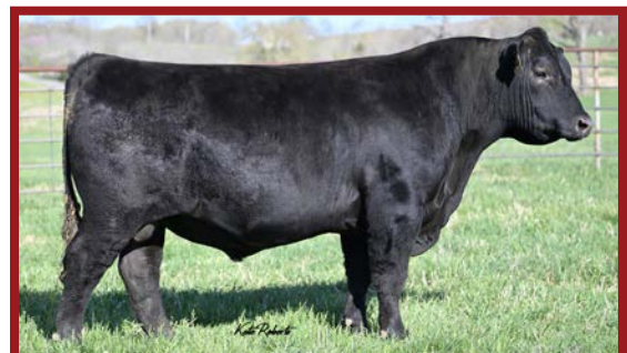
WILLIAMS HT PROMOGEN 700-280 - FLUSH BROTHER TO THE DAM OF LOT 23