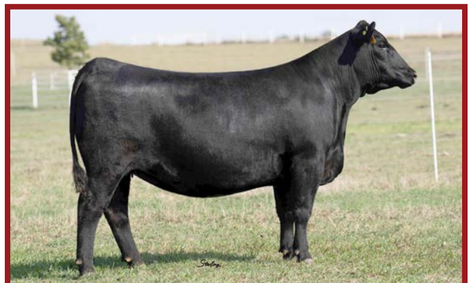
VINTAGE RITA 0404 – $360,000 DONOR DAM OF LOT 10 & DRAFT PICK