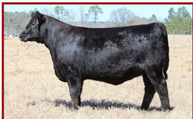
FF RITA 9B40 OF A18K 3S10 – GRANDDAM OF LOT 7