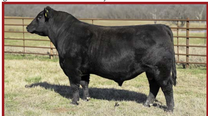
LINZ PROHIBITION – FLUSHMATE BROTHER TO LOT 1E

A flush to the bull of buyers choice in a full sister to the $150,000 valued Linz Prohibition. Talk about some serious performance and phenotype, this is going to be one of the top phenotype and genotype progeny in the offering, stemming from the family that has 11 Grand or Reserve Grand Champion PGS females at 11 national events. The donor dam is a direct daughter of the multimillion dollar producing RB Lady Denver 167-453. 1074 will command your attention as she struts through the pen. She is a fancy profiling female with a long clean front with tremendous neck extension and herd bull producing ability. 1074 is a maternal sister to the $265,000 Ingram Heisman and the $245,000 BNWZ Validity along with being a maternal sister to the $165,000 BNWZ Bougie, while being a full sister flushmate to Linz Prohibition. Brothers to 1074 have gone on to produce many sale toppers over the last year, and their legendary status only seems to go up. 1074 has an outstanding CED and birth weight combination, top 10% HP, balanced foot scores with breed leading $B and $C. A guarantee of 6 transferable embryos.