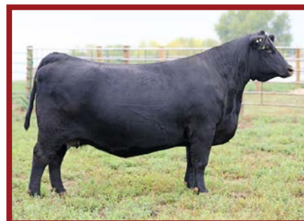
44 RUBY 327F - GREAT GRANDAM OF LOT 31