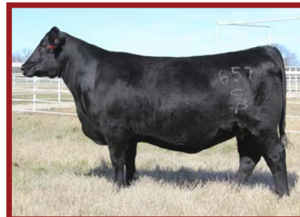
GB 6404 SURE FIRE 657 – GREAT GRANDDAM OF LOT 11