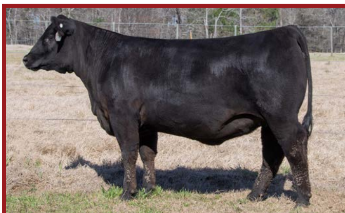
FF RITA 2S48 9B40 SALVATION – DAM OF LOT 7

The only female in the entire database with her unique combination of WW, YW, $EN, Marb and RE and the Number 2 $C Winchester female in the breed. Check out this genetic masterpiece on paper. She stems from a dam that combines Salvation with the 76 Angus donor, FF Rita 9B40 of A18K 3S10. Folks it is extremely rare to get this much performance and still maintain this elite level of $EN. This female is super unique on paper and equally unique on the hoof.