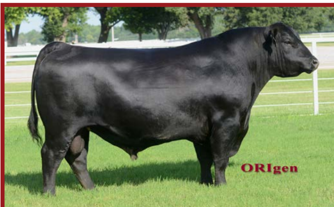
FF RITO AMBITIOUS – SIRE OF LOT 43

Check out this super impressive bred heifer that is the only female in the database sired by the record setting FF Rito Ambitious in the breed with her unique combination of WW, YW, CW, Marb, and RE. This impressive female traces back on the maternal side to the legendary multimillion-dollar producer GAR Progress 830. This female is loaded with performance on the hoof and on paper.