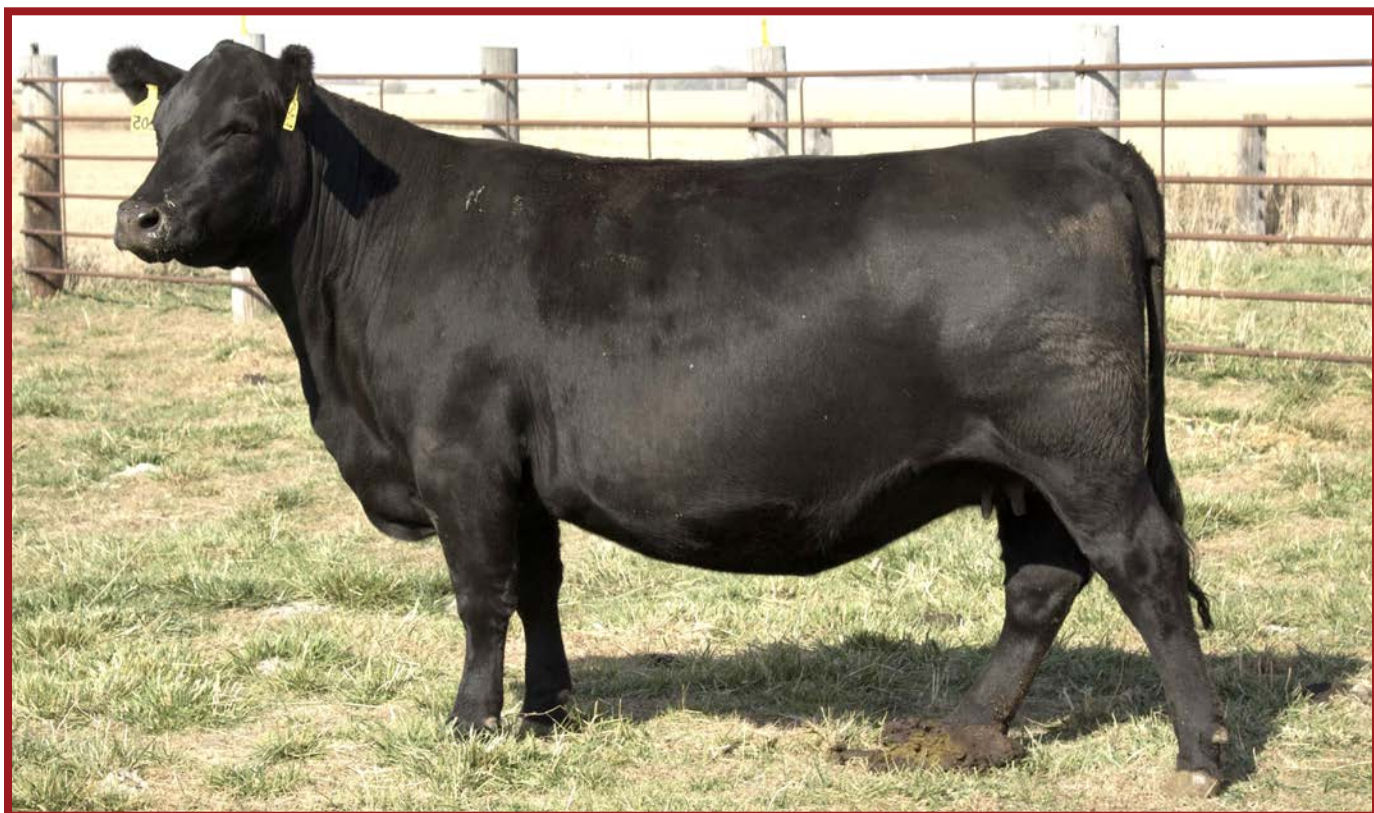
KENNY ERICA OF ELLISTON 2205 – DAM OF LOT 48 PREGNANCY