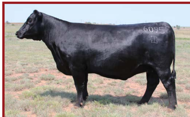
CHAIR ROCK SURE FIRE 6095 – DAM OF LOT 55 SEMEN