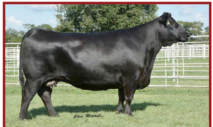
GAR PROGRESS 830