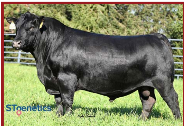
HART NETWORK – FULL BROTHER TO DAM OF LOT 33

The Number 2 $M female in the breed sired by the $150,000 GMC, Pine View and 4 Sons herd sire Breakaway with her unique combination of CED and $EN, anchored by the legendary Hart Angus and Double Barrel donor, Hart Whitney 9518, who is known for her ability to produce elite performance with elite genomics. This female is following in her matriarch's footsteps. Just analyze the data on this one, elite calving ease, elite growth, elite maternal traits, great management traits and elite carcass merit. This one has an extremely bright future.