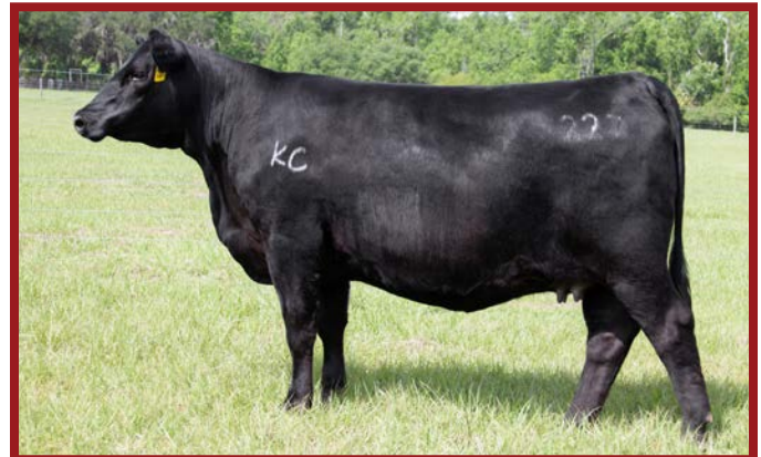
KC RITA 227 – $21,000 DAM OF LOT 19

Check out this super impressive female that is one of only three females in the entire database with her combination of CED, $EN, Marb, RE and $M, and she is the only Majority daughter in the breed with the same combination. She is a direct daughter of the $21,000 former Big Timber donor, KC Rita 227, who traces back to the legendary Wall Street donor, GAR Daybreak 82. This female is super unique on paper and on the hoof. She is loaded with the essential 3 P's — pedigree, performance and phenotype. This one needs some FSH in her future.