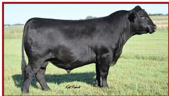
TENACITY L3005 – THE $150,000 VALUED FULL BROTHER TO THE DAM OF LOTS 44A & 44B GRAND SLAM X 516Z