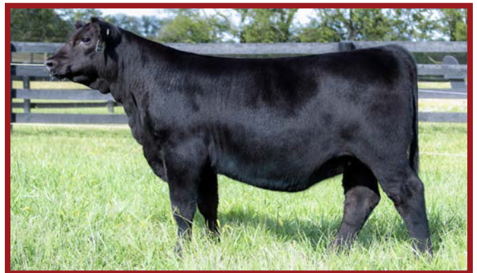
4 SONS RITA 5467 – $380,000 VALUED MATERNAL SISTER