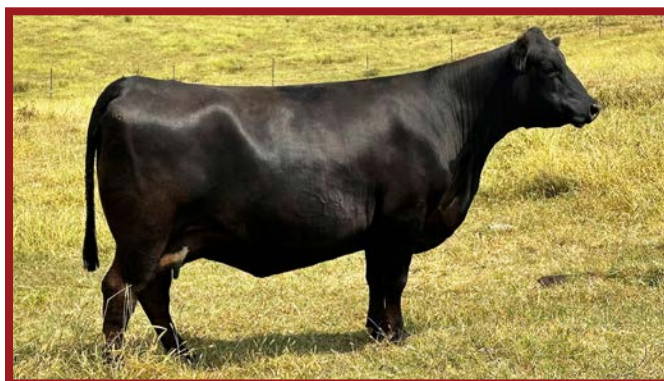
E W A 102 OF 848 HOME TOWN – DAM OF LOTS 45A & 45B EMBRYOS

Offering 4 IVF heifer embryos by the legendary super limited supply, the hottest bull in the breed, Wilks Crick and from a dam that combines the Select Sires roster member Preeminent and the legendary Lucy 1175, who is the greatest daughter of the world-famous Thomas Lucy 9307 owned by Monticello Angus and 44 Farms. Lucy 9307 has produced in excess of $1 million in progeny sales including the last two Lot 1 Bulls at 44 Farms elite bull sales, selling for $220,000 and $120,000. Talk about some serious genetic potential. A guarantee of 1 pregnancy if work is performed by a licensed professional.