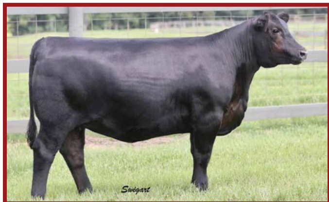
ANKNY MISS BLACKCAP 8147 – GREAT GRANDDAM OF LOT 30 PREGNANCY