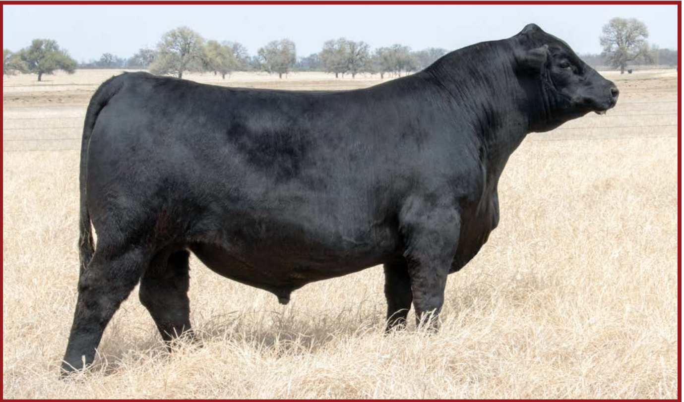
WILKS CRICK 3708 – LOT 53 SEMEN