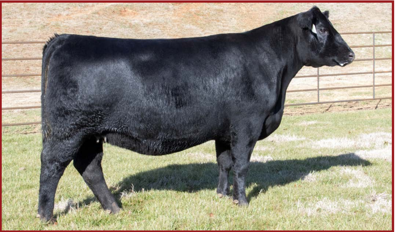
LINZ LADY MAGNITUDE 453-2427 – DAM OF LOT 1B PREGNANCY