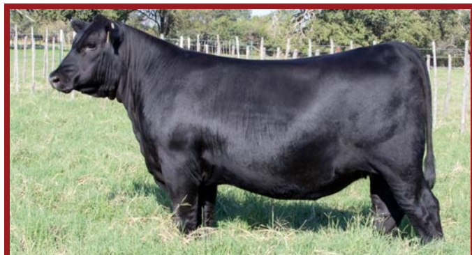
BTR FIREBALL 2303 – MATERNAL SISTER TO LOT 13