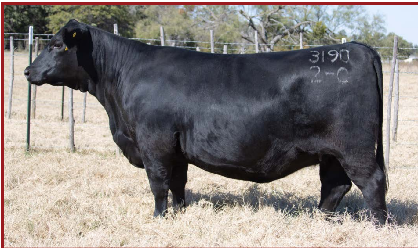
2BARC GRIDMAKER 3190 – DAM OF LOT 20A PREGNANCIES