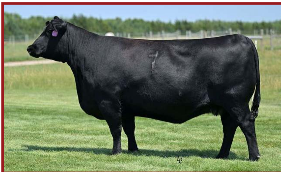
EB ERICA V8501 – DAM OF LOT 49 EMBRYOS