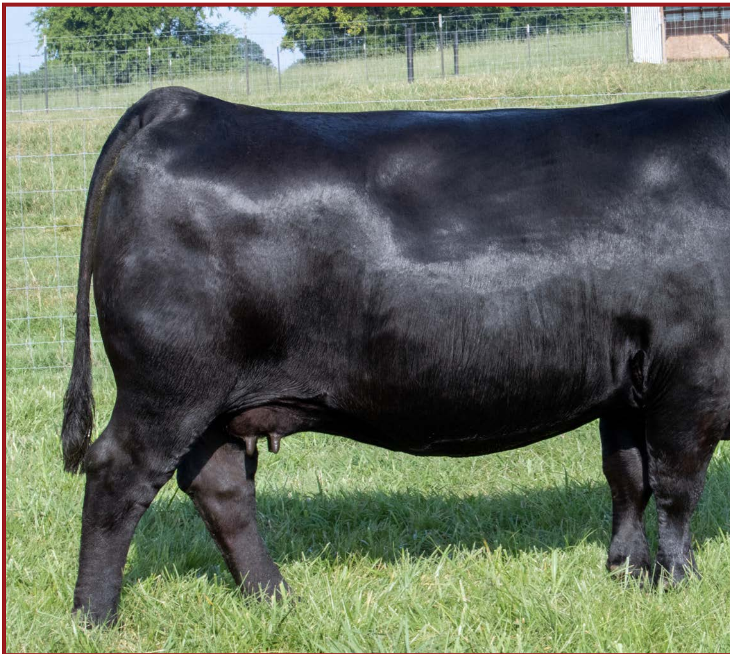
DBA RITA 1034 – DAM OF LOT 2A PREGNANCY