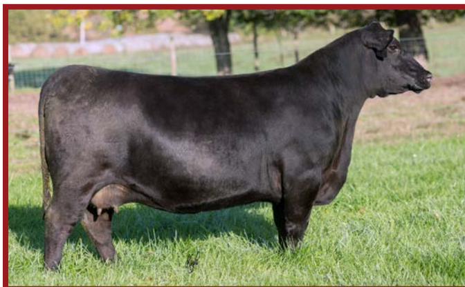
SANKEY RUTH 934 – DAM OF LOT 8