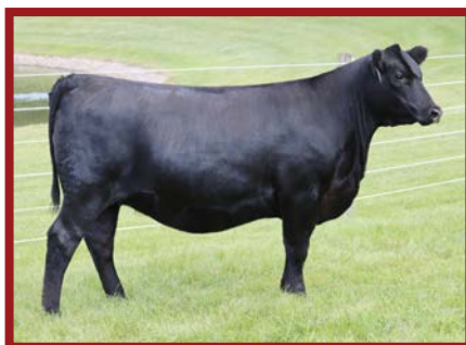
GA LUCY 1035-358 - DAM OF LOT 9