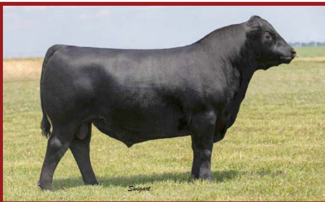
MG MAGNITUDE – GRANDSIRE OF LOT 1B PREGNANCY

A heifer calf pregnancy by True Balance and one of the most talked about females in the breed today, the $220,000 Smith Valley selection in the 2025 Katie Colin Farms sale, Linz Lady Magnitude 453-2427, who has produced the Number 1 $C True Balance bull in the breed. Talk about genetic predictions, the proof is out there already. This one has nothing but untapped potential. This heifer calf will be a full sib to the 474 $C non-parent bull in the breed. The stars have aligned here, folks. Buy this one with confidence. Sells due to calve 6/2/2026 in a reliable recip.