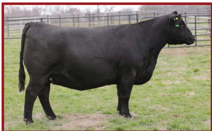
E W A 769 OF 543 SURE FIRE - DAM OF LOT 17A

This is the sire you've been waiting for! With outstanding earning potential, flawless phenotype, and a perfectly balanced EPD profile, he is built for success in any program and any geographic region in this country. His dam is a full sister to EWA Teamwork working in the Select Sires stud. She has already produced a $50,000 daughter selling to Circle F Ranch of Georgia and another $70,000 daughter selling to Rockin L Ranch, as the top selling open female at the Simply Southern sale this past October. Crouch Congress has dominated the industry for the past three seasons. He is the first sire to produce a Triple Crown winner in the PGS National Junior Angus show, with Grand Champion or Reserve Champion at all three national events in the same year. Congress has produced a $420,000 son Schiefelbein Executive in 2023 and recently has produced a $290,000 half-interest daughter at the past 4 Sons Production sale, selling to DBA Angus and Guess Angus. This young sire's dam is recently deceased, making this young sire even more valuable. M952 has a double digit CED with a negative birth weight, excellent teat and udder scores, very controlled mature height and mature weight, excellent foot scores, top 4% PAP, outstanding carcass values with a tremendous $M and $C combination.