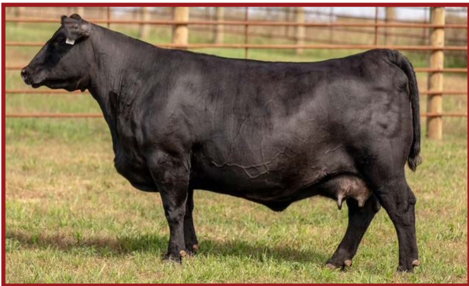
LINZ LADY MAGNITUDE 1897 – LOT 170 DONOR

A flush to the bull of buyer's choice with a guaranteed six transferable embryos with no cap. What an amazing opportunity to choose from any sire you want to the electrifying 1897, the outstanding Magnitude granddaughter of the multimillion-dollar producing and legendary 453. 1897 has absolutely stunning power and phenotype, and she was the $40,000 all-time high selling female to ever sell at Wisconsin Futurity. The dam of 1897 is widely known as the most powerful complete daughter ever produced out of the legendary 453, and she had an absolutely stunning power and phenotype combination. The Magnitude combination with 453 has been truly magical. Two daughters have sold in excess of $200,000 at public auction. This may be the best mating to the legendary 453. Magnitude semen has recently sold for over $2000 a unit at public auction. This is a sire that truly earned his right in the industry with his low birth weight and high CED and has become legendary in his daughters and sons.