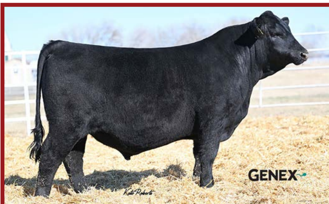
PEAK DRAFT PICK – FULL BROTHER TO LOT 10

Who is paying attention? Here's a full sister to the GENEX sire Peak Draft Pick, anchored by the $180,000 Peak Genetics donor Vintage Rita 0404, who is a direct daughter of the $160,000 valued former Vintage and High Roller donor Rita 6291. Maternal sisters to this female include the $50,000 Peak Rita K208 and the $40,000 Peak Rita L346. She is the Number 3 CW, Number 2 $B, Clarity daughter in the breed and the only Clarity daughter in the breed with her unique combination of CW, RE, $F, and $B. Other than her pedigree, what makes this female super unique is that she possesses lights out performance, an elite growth curve, elite RADG, elite hair shed, elite carcass merit and elite $Values. Not to mention, she is a powerfully constructed, massive topped, and massive hipped female. Talk about adding some serious performance to your program, K229 can do it all. She sells open ready to flush.