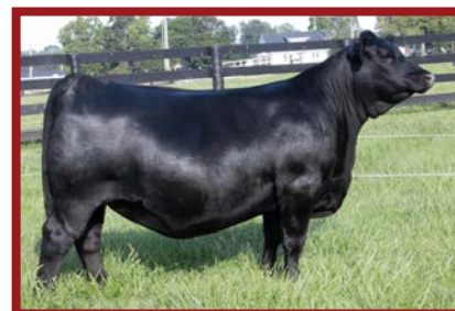
DBA RITA 4709 – SISTER TO LOT 51 SEMEN