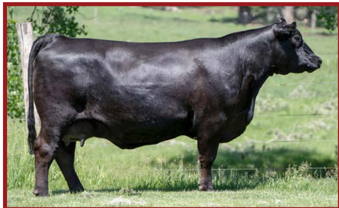
BRUMFIELD LADY MAVERICK 1125 – GRANDAM OF LOT 47 PREGNANCY

What an incredible chance to buy a heifer pregnancy by the Division 1 Western Regionals PGS champion, who also happens to be a graduate of this very sale, garnering $22,500 to Lone Oaks Cattle Company of Wisconsin. The dam of 3224 was the $48,000 highlight from the 2022 Brumfield Angus sale where she was the high selling female. 3224 has a maternal sister, Marda Premier Lady 457, who was the Lot 1 and $24,000 high seller to Bullington Cattle Company of Tennessee. If you look closely, you will see the granddam RB Lady Tombstone 5509 who is a cornerstone donor for the Brumfield herd and is also a maternal sister to the $10 million producing RB Lady Denver 453, the cow who has changed the industry. 3224 has an incredible top 1% YW, top 1% foot scores, top 1% CW and all eight dollar values in the top 15% of the breed. The sire of these embryos, Executive, was the incredible $420,000 high selling sire of the 2024 sale season.