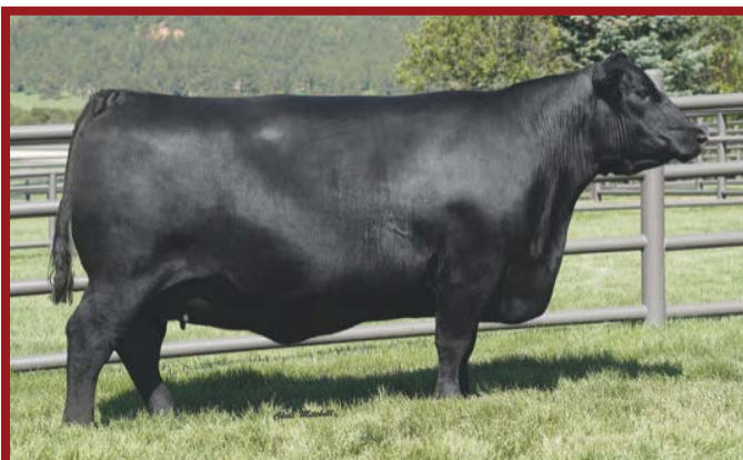
POLLARD CHLOE 9058 – DAM OF LOT 50

Teasdale Initiative is an elite multi-trait bull prospect by the $120,000 top-selling female in the 2020 Pollard Farm sale selected by Spruce Mountain Ranch, Chloe 9058, sired by the $235,000 record-breaking sire of Spruce Mountain Ranch, Riverbend Ranch, Nowatzke Cattle Company, Express Ranches, and Pollard Farms roster, Ambitious. Initiative is currently the only bull in the breed with its combination of CED, YW, Marb, $M and $C, with an explosive growth spread from double digit CED, low birth weight to top 1% YW, and elite genomics categorically across the board. He carries 15 EPDs in the top 5% and 24 EPDs in the top 25%. He is heavily muscled, massively ribbed and a monster on the hoof with excellent feet, extra long spine, and a super sound structure from front shoulder to hip all in a moderately framed package. Chloe 9058 is a direct daughter of the $200,000 headliner of the Lylester Ranch donor program, Chloe 5769, sired by the $730,000 Rooney Ranch and Vintage Angus sire Power-Play. Maternal sisters include Chloe 9071, the $140,000 half interest selection by Audley farms in the 2020 Spruce Mountain sale, and Chloe 939 the $60,000 second selling female in the 2021 Lylester Ranch sale. Chloe 4537, the full sister to Initiative, sold for $150,000 for half interest in the 2025 Spruce Mountain sale to Express Ranch.