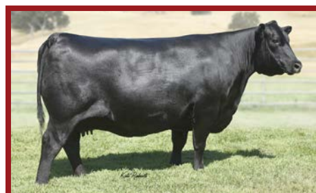
DCF CHLOE 5769 – $120,000 LYLESTER DONOR AND GRANDDAM OF LOT 50