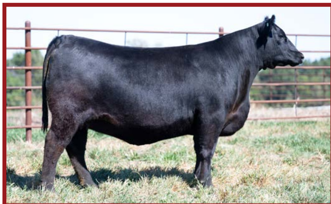
HENKE BARBARA 4052 – $150,000 DAUGHTER OF THE DAM OF LOT 41

A heifer calf pregnancy by the super limited GAR Wallace and directly from the legendary Henke Angus and Byrd Cattle donor, HF Barbara 0169, who just produced the $150,000 selection of Moon Creek in the 2025 Henke Angus sale, and the granddam of the $55,000 selection of Grimmus Cattle, the $50,000 selection of 4 Sons, and the $32,000 selection of Tall Timber in the same event. Folks, this is a female that is exploding on the scene and developing a reputation of delivering the goods on a genotype and phenotype level that is unmatched in the industry. Sells due to calve 2/3/2026 in a reliable recip.