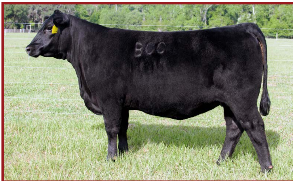
BYRD SUPERMAMA FB 6276-2554 – DAM OF LOT 25 PREGNANCY