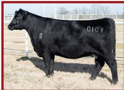
GABRIEL RITA 0108 – GRANDDAM OF LOT 11