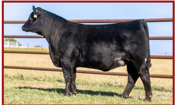
RSA BLACKCAP EMPRESS 3433 – DAM OF LOT 21 PREGNANCY

A heifer calf pregnancy by the super rare and very limited supply GAR Wallace and the $54,000 valued 3/0 selection in the 2024 sale who is one of the top $C females in the breed sired by the ORigen sire RSA True Balance and is a direct daughter of the $30,000 T/D Blackcap Empress 09. Check out the recent sort for Ambitious sons in the breed and sitting at the Number 2 $C Ambitious in the breed is a direct son of the donor in this mating. You can see the genomic power she possesses. This one is big-time good and is big time worth the investment. She sells due to calve 3/16/2026 in a reliable recip.