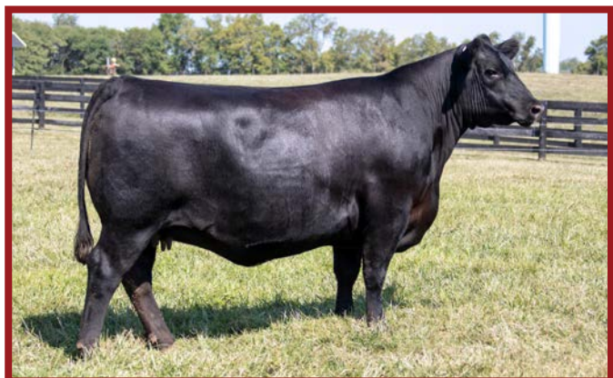
RHI RITA 9S13 OF 9524 - DAM OF LOT 52 SEMEN

Owned by Rumor Has It, Gabriel Ranch and Koberstein Farms Offering a select number of units on one of the most talked about bulls in the breed, RHI Satisfaction whoes first progeny sold in the 2025 Stonewall Ridge sale, and was selected by Spruce Mountain for a $100,000 valuation. His first progeny are hitting the ground now and absolutely awesome in their type and kind and folks they love the DNA. They have unbelievable extension , massive topped and thet eye catching appeal. Winning bidder has the option to take up to 10 units in groups of 2.