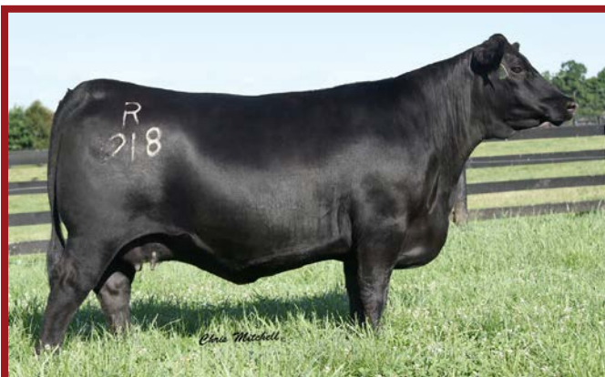
RRR ISABEL R0218 – DAM OF LOT 27A

What an exciting opportunity. Here's a flush sister to the $90,000 4 Son's Logical, the new and very popular young sire at ABS. While yet another full sister sold to Rimrock Angus for $45,000. This young female has a moderate frame with outstanding dimension and excellent foot structure. The dam has a near perfect udder and is a Confidence Plus daughter back to the herd sire producing Y69. This one has a unique pedigree combination with excellent mating flexibility, outstanding performance, and top-end indexes across the board. The Isabel females can do it all — calving ease, explosive growth, elite efficiency, great foot scores, elite carcass merit and dollar values. Take your program to the elite level with the influence of the Isabel cow family. 3500 has outstanding top 10% growth, very good HP, excellent teat and udder scores, top 1% claw and angle, and top 4% RE with incredibly balanced dollar values. She sells due to calve 7/2026 to Schiefelbein Executive.