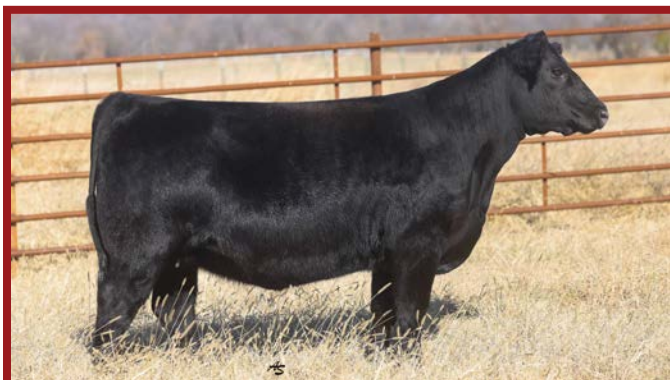
LINZ LADY MAGNITUDE 453-2436 – FLUSHMATE SISTER TO LOT 1D

Offering a flush to the bull of your choice in a full sister to the $220,000 Smith Valley selection in the 2025 Katie Colin Farm sale, Linz Lady Magnitude 453-2427, who has produced the Number 1 $C True Balance bull in the breed as of the writing of this sale book at +474 $C. Folks, there is power in the blood here. The magnitude semen is hard to get, and the Lady tribe has dominated the industry for years, anchored by the deceased Lady 453 who has generated over $7 million in progeny sales. This is an IVF flush with a guarantee of 6 transferable embryos and no cap.