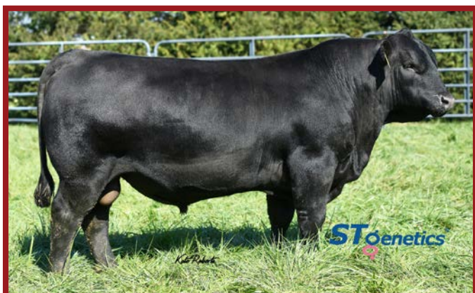
CONNELLY CLARITY – MATERNAL BROTHER TO LOT 3

Check out this massive made, powerfully constructed maternal sister to the legendary deceased STgenetics sire Clarity, who is the only dam in the breed with her unique combination of CED, $EN, Claw, Angle, Marb, RE, and $M. You can run a simple sort of YW, $EN, and $M on the entire breed, and this female is the Number 1 $C dam in the breed by over $50. Analyze the data here, folks. This female possesses a holes free EPD profile. Whether you are raising elite performance females or selling commercial bulls into the marketplace, this female does it all. Not to mention the elite phenotype that she possesses. She has been flushed 15 times to average just over 4 transferable embryos per flush. She sells open ready to flush.