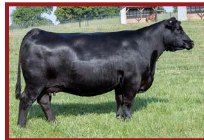
DBA RITA 1034 – DAM OF LOT 51 SEMEN