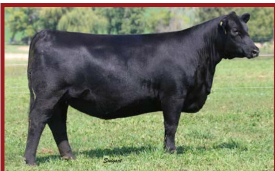
WILLIAMS HT ERICA 700-139 - $28,000 DONOR DAM OF LOT 23

Teasdale Erica T532 is a balanced-trait direct daughter of the $135,000 Butz-Hill program donor, Williams HT Erica 700-139 sired by the $235,000 record breaking sire of the Spruce Mountain Ranch, Riverbend Ranch, Nowatkze Cattle Company, Express Ranches, and Pollard Farms roster, Ambitious. T532 is currently the only Ambitious daughter in the breed with her unique combination of CED, YW, HP, Marb, $M and $C and only 1 of 10 non-parent females in the breed with her combination of WW, YW, CW, Marb, $M and $C. This young donor prospect has star power, a great look, overall structure and an elite set of EPD's making her an incredible breeding piece for the future with endless profit potential. Erica 700-139 is the direct daughter of the great Powell Erica 7312. Maternal siblings include a long list of success stories, starting with Williams E Erica 700-263, the $135,000 valued flush sister to Jonesboro & Hollywood; Williams E Erica 700-802, the $49,000 top selling female in the Coast to Coast Sale; $120,000 valued Williams Promogen; $100,000 half interest Williams Hollywood, and the $100,000 half interest Williams Jonesboro.