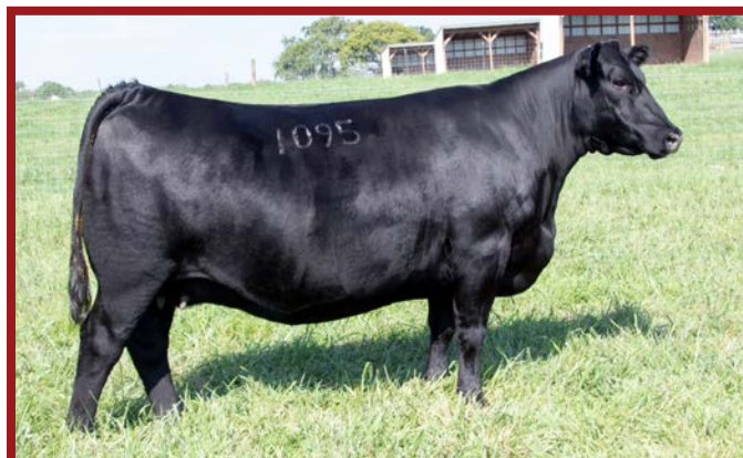
HART WHITNEY 1095 – FULL SISTER TO GRANDDAM OF LOT 33