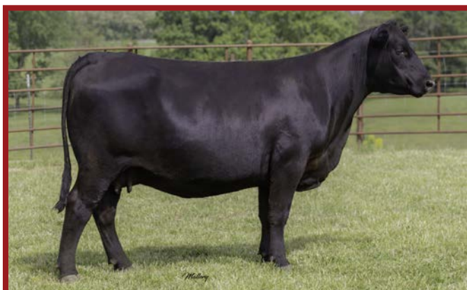
RHOADES LADY 453- 3006 – DAM OF LOT 1C PREGNANCY

A heifer calf pregnancy by the Number 1 $C bull in the breed, GAR Grand Slam, and the Number 2 $C dam in the breed, the $150,000 Rhoades Lady 453-3006, who is a full sister to the $315,000 Rhoades Swarovski and the $55,000 Rhoades Lady 453-3004, and who produced the $200,000 selection of Grimmus in the 2025 Rhoades Angus sale and is currently working in the Rhoades Angus and Galaxy Beef ET program. Talk about a colossal genetic match up. Just think of the outrageous possibilities this genetic masterpiece has to offer. Folks, we are talking a possibility of a +500 $C here. These opportunities do not come around very often, take advantage of this one. Sells due to calve 8/7/2026 in a reliable recip.