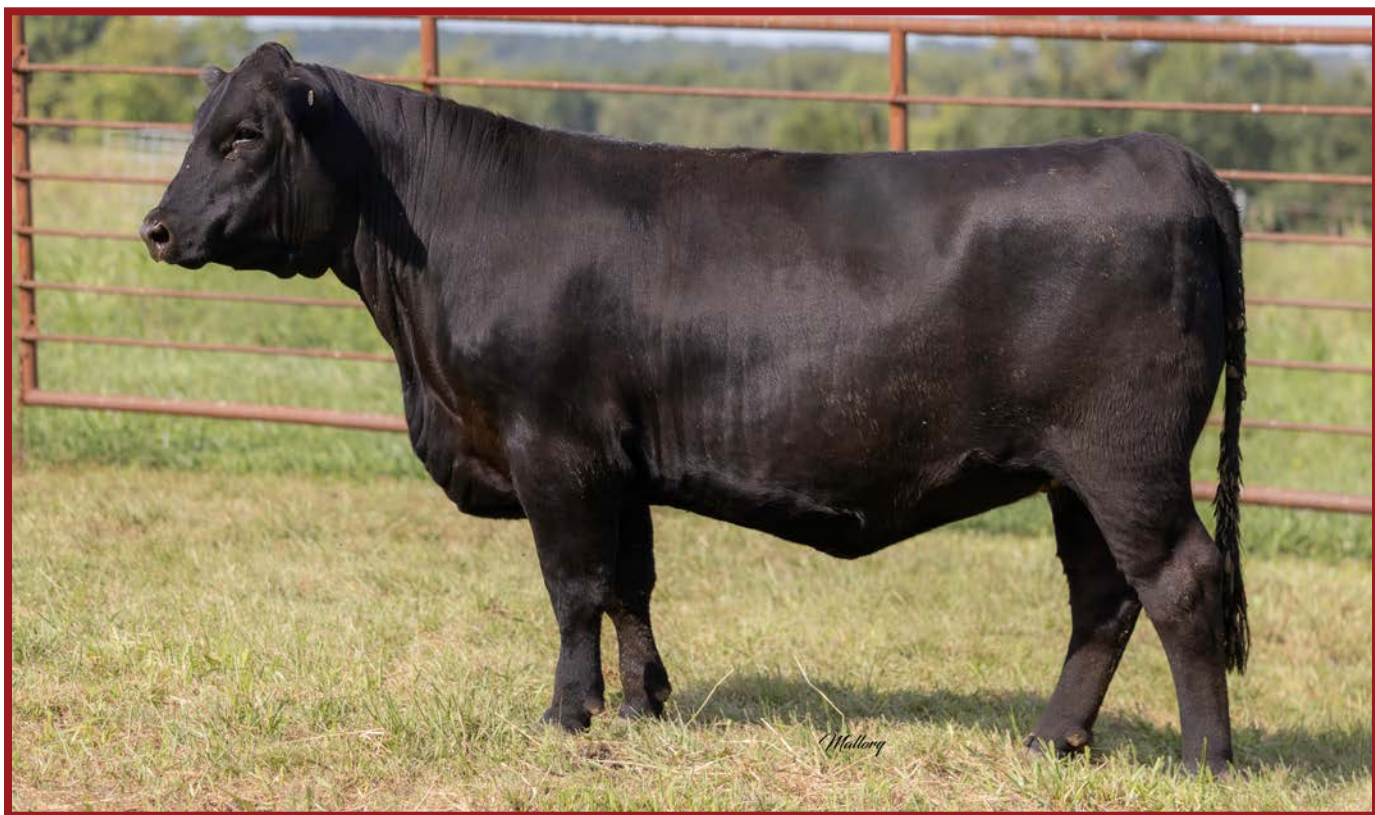
LENZ MISS BLACKCAP M432 – DAM OF LOT 30 PREGNANCY