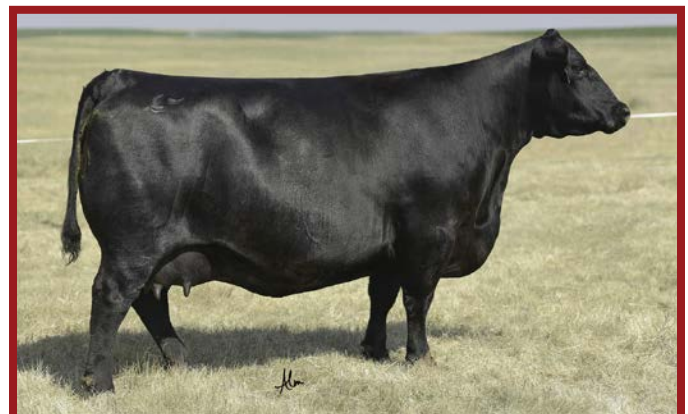
BALDRIDGE ISABEL Y69 – GREAT GRANDDAM OF LOT 27A