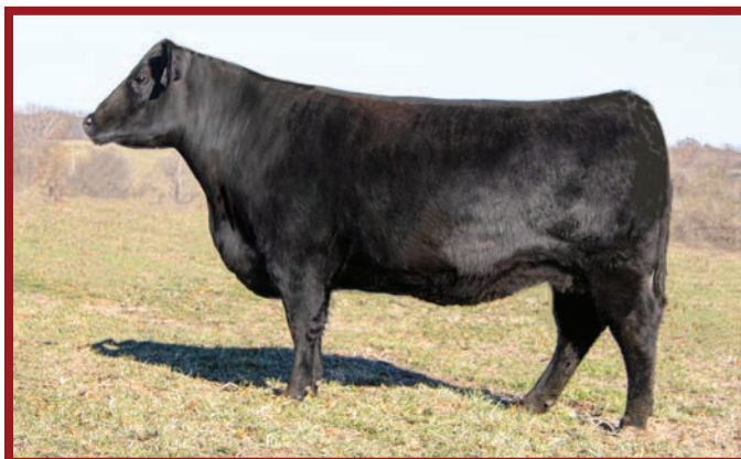
ANKNY MISS BLACKCAP A125 – GRANDDAM OF LOT 30 PREGNANCY

A heifer calf pregnancy by the record setting Lenz Farm and Brungardt Cattle Co, the $390,000 Lenz Climax, and from a super sweet made high performance Grid Maker daughter that is working in the Peterson Prime and 111 Farms donor pen, Lenz Miss Blackcap M432. Just examine the data on these two genetics masterpieces and check out the elite predictions on this heifer calf. This one has untapped, unlimited potential. Sells due to calve 1/23/2026 in a reliable recip.