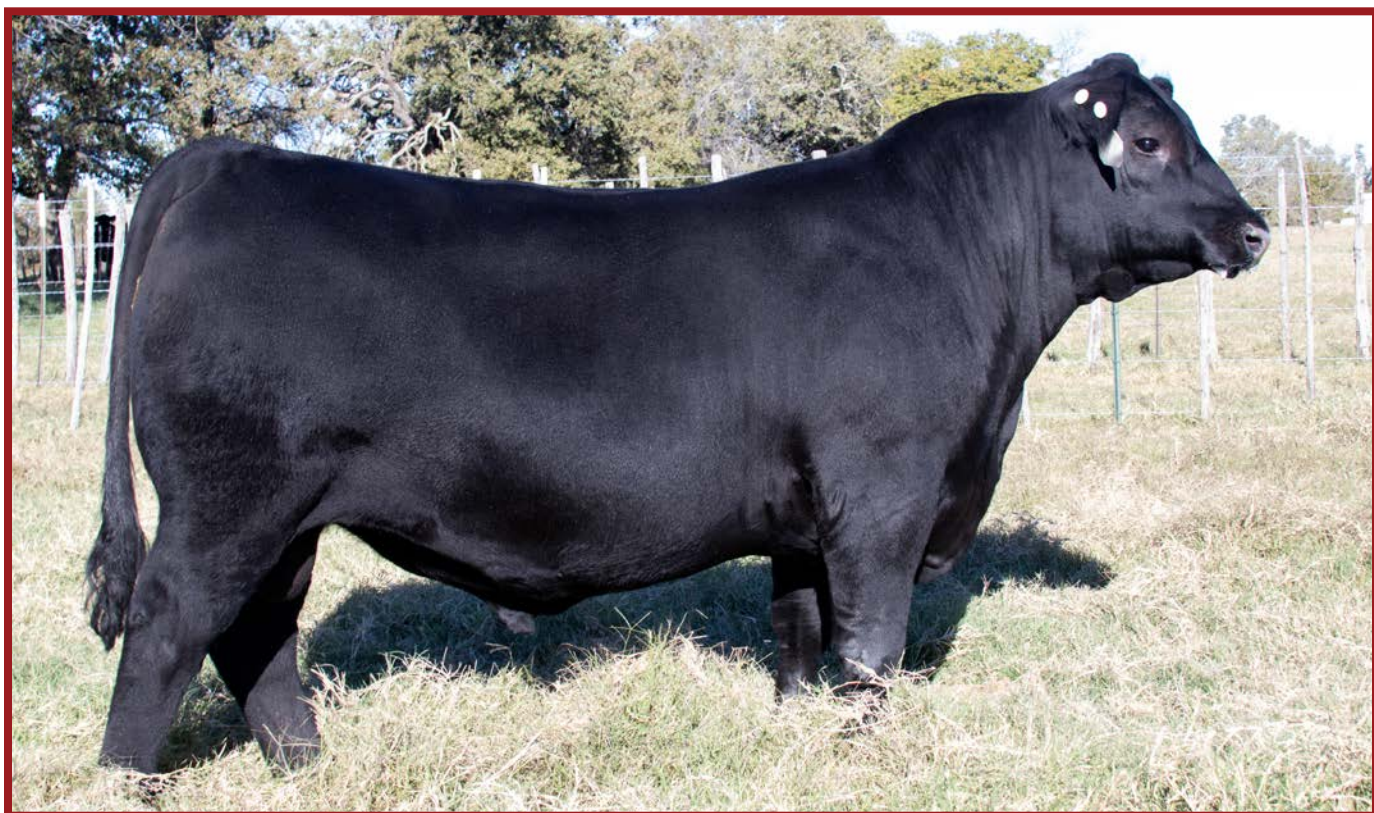
RHI SATISFACTION 9L19 - LOT 52 SEMEN