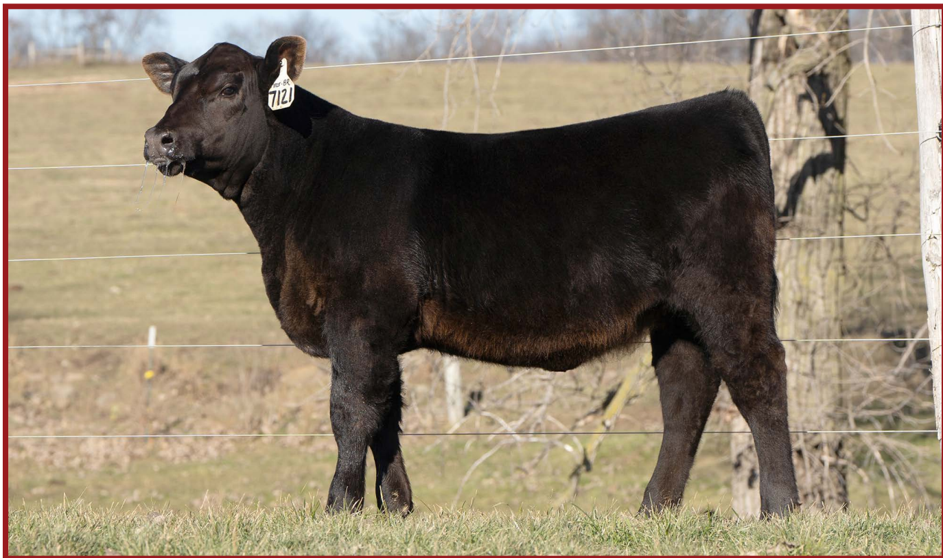
MARDA PREMIER LADY 3224 – DAM OF LOT 47 PREGNANCY