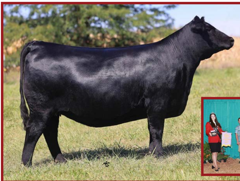
CCF LADY 3099 – DAM OF LOT 17E PREGNANCY