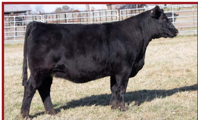
LFF REVELATION 1039 – DAM OF LOT 13