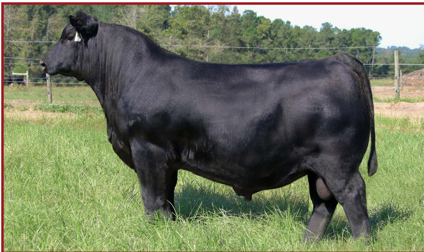
G A R GRID MAKER L1071 – LOT 55 SEMEN

+*G A R Sure Fire 6404 #*GB Fireball 672 18690054 *GB Anticipation 432