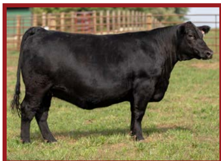
GENSTART 6273 CAPTAIN 2304 - DAM OF LOT 31