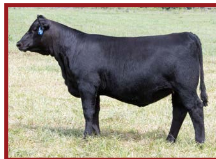
DBA RITA 5303 - $95,000 PATERNAL SISTER TO LOT 9