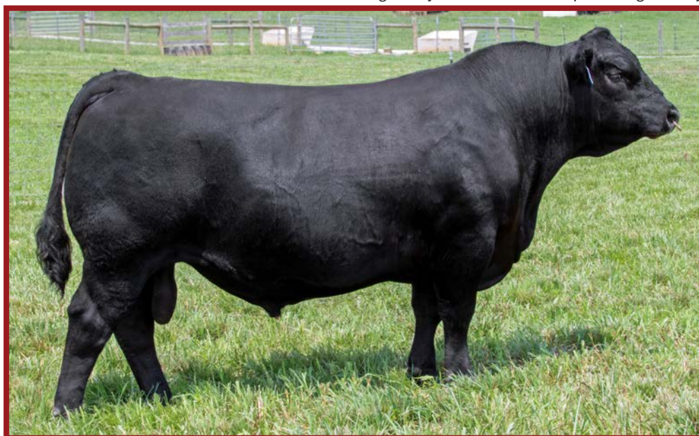
BNWZ NOBILITY – SIRE OF LOT 26 PREGNANCY

The excitement that this pregnancy brings to any herd is the kind of stuff that keeps us going year after year after year. The dam, DBA Henrietta 3156, was a past $85,000 high seller from the first Double Barrel Angus sale selling to Nowatzke Angus, Maple Lane Angus and Gutwein Angus, and she was selected for the very same reason, absolutely stunning phenotype with breed leading genotype. 3156 produced a $55,000 high seller to Spruce Mountain Angus in last September's Gutwein Angus sale, being the first progeny ever offered out of this young donor. BNWZ Nobility, the sire of this heifer pregnancy, needs no introduction to the Angus world. He was the past $110,000 high selling bull of Cattlemen's Congress in 2022, and he's had two sisters go on at public auction. One sold for $220,000 while the other garnered $195,000. Make no mistake, this is a high-income pregnancy we are looking at, by the combination of the great Henrietta Pride cow family and the legendary multimillion-dollar producing RB Lady Denver 167-453.