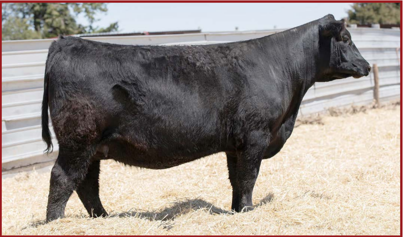
T/D BLACKCAP EMPRESS 09 – $30,000 GRANDAM OF LOT 21