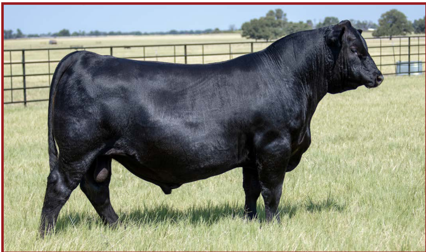
WILKS ACHIEVER 4803 - LOT 53 SEMEN