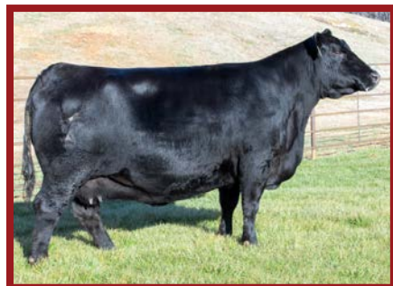
POSS RITA 5116 – GRANDAM OF LOT 39B EMBRYOS

Offering 3 IVF heifer sexed embryos by the super limited, very rare Wilks Crick and from the $20,000 valued Cantrell Creek and D&W Angus donor Rita 4089, who is a maternal sister to the legendary Katie Colin herd sire Ratified. KC Rita 4103 and KC Rita 4105 were the $30,000 and $29,000 sale highlights at the 2025 Katie Colin sale who are maternal sisters to the dam of these embryos. Folks, there is tremendous opportunity here. A guarantee of 1 pregnancy if work is performed by a licensed professional.