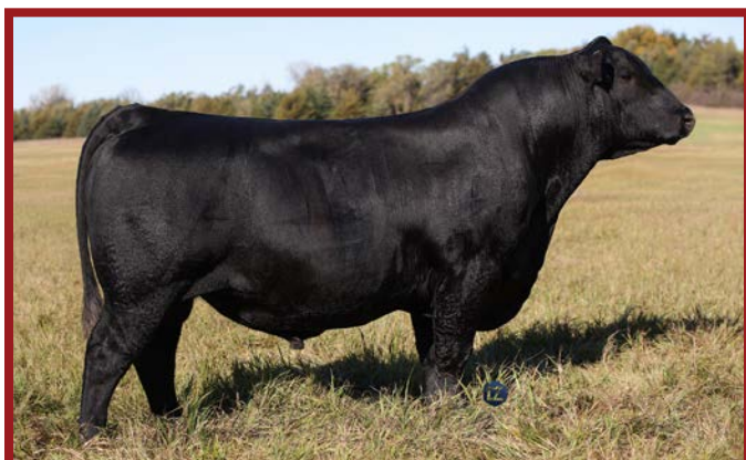
RHOADES SWAROVSKI – $315,000 FULL BROTHER TO THE DAM OF LOT 1C