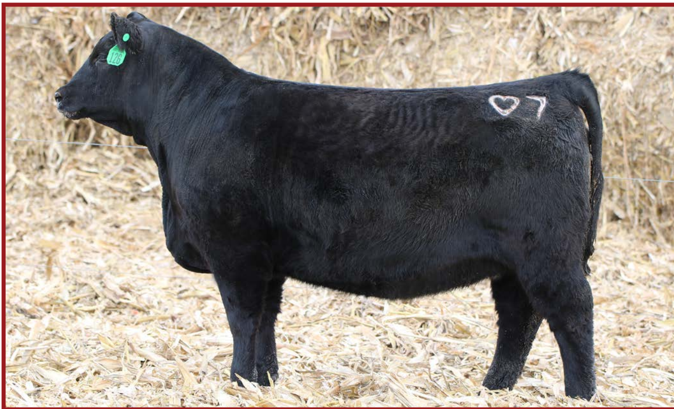
HART WHITNEY 3091 – DAM OF LOT 33