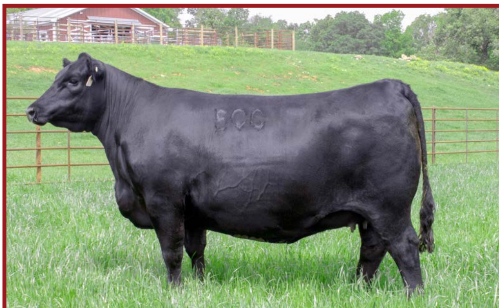
BYRD SUPERMAMA FB 6276-2548 – $300,000 VALUED SISTER TO THE DAM OF LOT 25