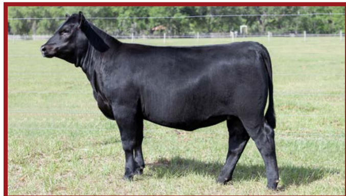
BIG HOME RUN B440 - $47,500 DAUGHTER OF LOT 37