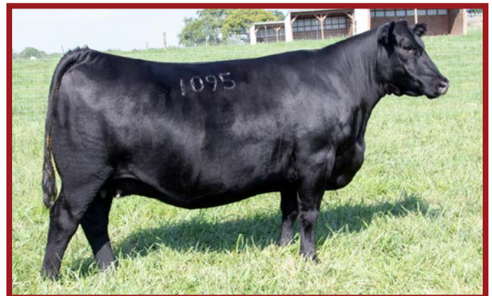
HART WHITNEY 1095 – MATERNAL SISTER TO THE DAM OF LOT 32

A double digit calving ease Majority daughter that is a direct daughter of the $25,000 Circle S selection in the 2024 Hart Angus sale, that is a direct daughter of a full sister to the million-dollar earning Hart Whitney 9518 that is owned in partnership by Hart Angus and Double Barrel Angus. You have to really appreciate the elite combination of calving ease, growth, maternal traits, great foot scores, elite carcass merit and outstanding $Values.