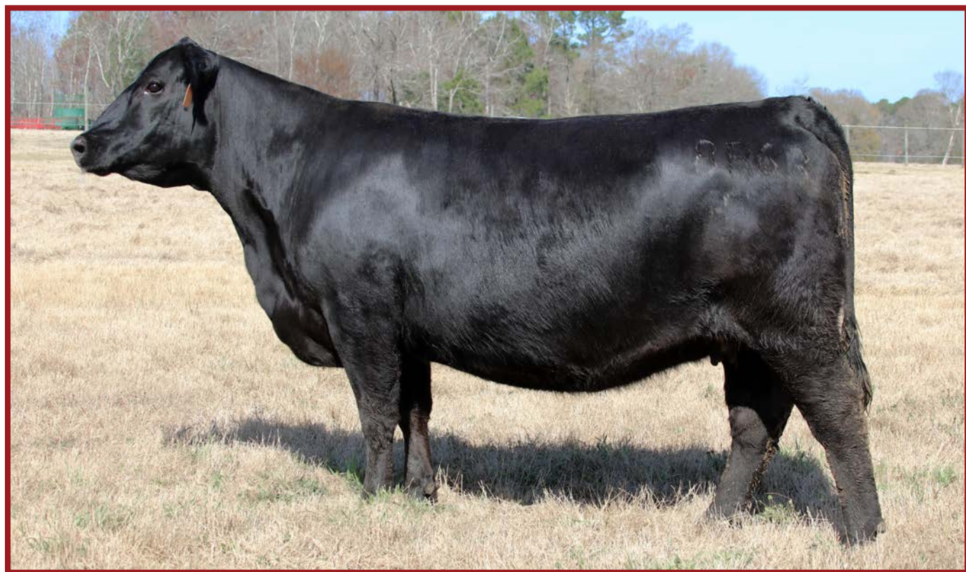
FF RITA 8R63 OF 2718 RIGHT – DAM OF LOT 42 PREGNANCY