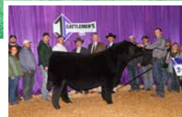
TSSC BT LIMIT UP 1099J ET 2022 Cattlemen's Congress Reserve Supreme Champion Bull