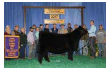
JSUL WHO DAT SULTRY 6215D ET 2017 NAILE Grand Champion Chianina Heifer