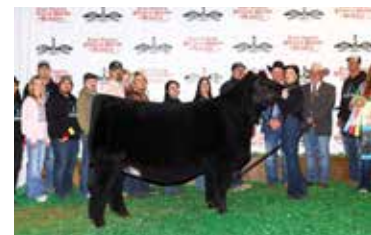
EVERHARTS BRANDY 2025 FWSS Grand Champion Purebred Simmental Heifer