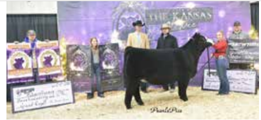
JSUL LEAPIN MARY 8108F 2019 KS Classic Grand Champion Heifer Dam of Lot 39