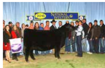
FCF PROVEN QUEEN 419 Legendary Dam of Lot 2