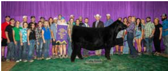
S&S COWAN DUA LIPA 758L 2024 IN State Fair Supreme Champion Junior Breeding Heifer Full Sister to Lot 30