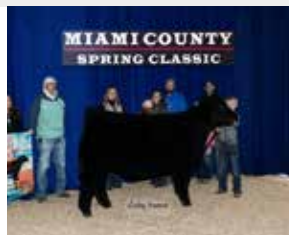
TSSC ONE OF A KIND 2044K $75,000 Daughter of Lot 11 sired by SCC SCH 24 Karat 838

BHCS HEAT SEEKER 23 JSUL SULTRY 6640 JSUL MA X AN 6651