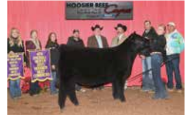
S&S TSSC BT ARIANA 1226J 2021 Hoosier Beef Congress 4th Overall Junior Breeding Heifer Maternal Sister to Lots 25-28 & 30

MR HOC BROKER JBSF PLENTY FOXY 12E JBSF MISS GOLDMINE 303A