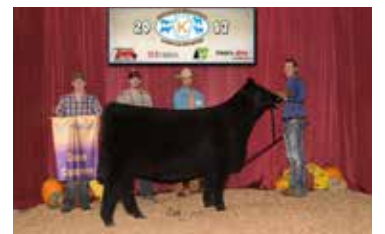
JSUL WHO DAT SULTRY 6215D ET 2017 KILE Gand Champion Chianina Heifer