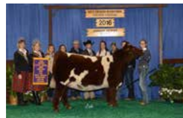
SULL DREAM ON 5158 ET $1 Million+ Producing Dam of TSS BT Limit Up 1099J ET