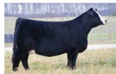
S&S EMILY'S HONEY 518C Full Sister to Dam of Lot 38