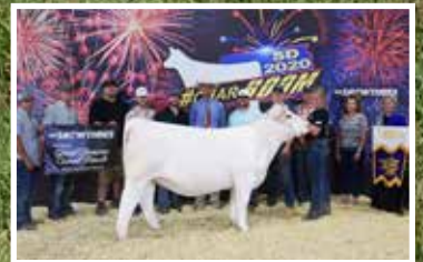
BOY MARILYN MONROE 2020 AIJCA Grand Champion Charolais Heifer Dam of Lot 8