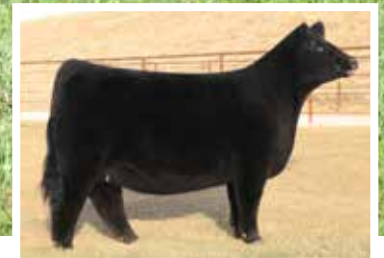
JSUL WHO DAT FETTY 6322D Legacy Full Sister to Lot 13