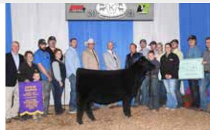
MDAY MS VALLEY APPLE ET 2021 KILE Supreme Champion Junior Breeding Heifer

TASF ARISTOTLE 752A ETGC CANDY APPLE RDIO XOXO 29X