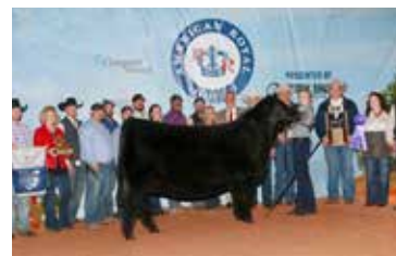
JSUL OH BOY REBA 0267G 2021 American Royal Supreme Champion Junior Breeding Heifer Dam of Lot 19

JSUL Reba 31122 is a purebred daughter of JSUL Something About Mary 8421, backed by the 2021 American Royal Supreme Champion Junior Breeding Heifer, JSUL Oh Boy Reba 0267G. Her maternal granddam is the iconic DAF Reba C85, the 2016 NWSS Grand Champion Percentage Simmental Heifer. A full sister to C85, DAF Reba C707, earned the same title in 2017. The famed “Reba” cow family has been instrumental in the Sullivan Farms Simmental program’s success. This daughter offers striking looks, longevity, and massive cow power. She is a full sister to JSUL Reba 312L, the Grand Champion Purebred Female at both the 2024 AJSA North Central Regional and the 2025 National Western Stock Show for the Griswold family.