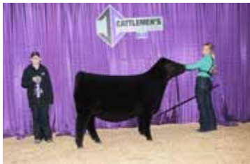
KCC GTC MS MALIBU 107M 2025 Cattlemen's Congress Division V Champion Angus Heifer Full Sister to Lot 6

EXAR BLUE CHIP 1877B UDE ELLIE 9230 SLL ELLIE 2201