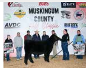
TSSC SASSY AND SALTY 5010N ET $31,000 Daughter of Lot 11 sired by Colburn Primo 5153 Full Sister to Lot 23