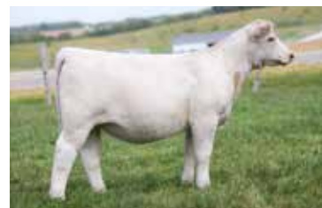
BOY AALB MONTELLA 410M