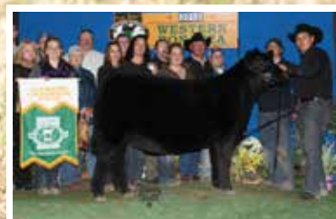
SILVEIRAS SARAS DREAM 1339 Legendary Maternal Granddam of Lot 4