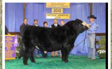
MR HOC BROKER 2012-2013 Triple Crown Winning Purebred Simmental Bull Sire of Lots 49 & 51