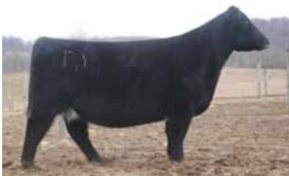
TSSC SUGAR MOMMA 867 Maternal Granddam of Lots 46 & 47

SILVEIRAS STYLE 9303 BDCC AGRF DREAM GIRL 85F TSSC SUGAR MOMMA 867