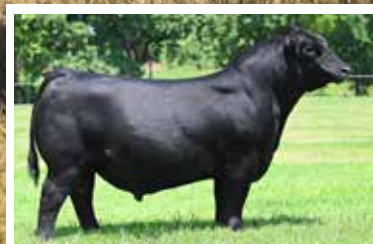
CONLEY A 1 $100,000 Sire of Lot 48