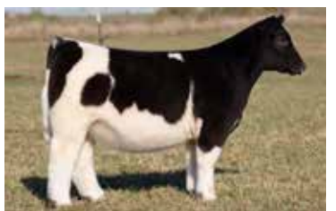
TYWC 9M ET $100,000 Maternal Sister to Lot 16