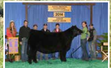
SULL RIGHT TAMALE 3365 ET "TAMMY" 2014 NAILE Reserve Grand Champion Chianina Heifer Full Sister to Lot 18