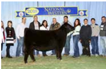
SCC PHYLLIS 052 Dam of Lot 1