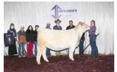
BOY MARILYN MONROE 2021 Cattlemen's Congress Reserve Grand Champion Charolais Heifer