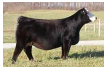
JS FLIRT AWAY 52H Dam of Lots 35-37

DUE 1/17/26 TO PVF BLACKLIST 7077 SEXED FEMALE SEMEN