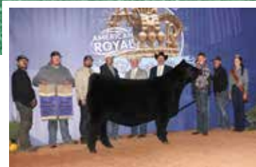
COOR DIAMOND 403M 2025 American Royal Grand Champion Chiangus Heifer