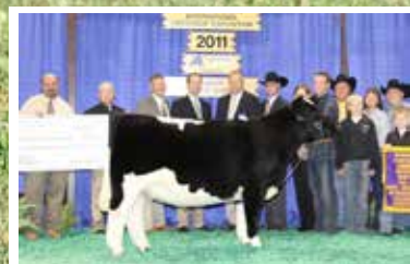
SUL JAYLNN 0904X 2011 NAILE Supreme Champion Junior Breeding Heifer Dam of Lot 17