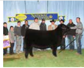
BRAMLETS BEAUTIFUL E742 2020 NWSS Grand Champion Percentage Simmental Heifer Daughter of Lot 20