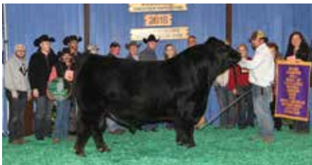
ELCX KINGS LANDING 599 D ET 2018 NAILE Grand Champion Limousin Bull Sire of Lot 44

SILVEIRAS STYLE 9303 JSZC HH TSSC LARISSA 101G ET RIVERSTONE CHARMED