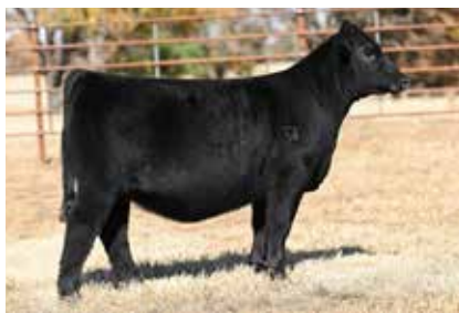
B C R BEAUTIFUL 310K $85,000 Full Sister to Lot 21

YARDLEY IMPRESSIVE T371 SHS NAVIGATOR N2B YARDLEY HIGH REGARD W242 X HPF MS BEAUTIFUL S054 MISS YARDLEY T68 SVF SHEZA CLASSIC N905