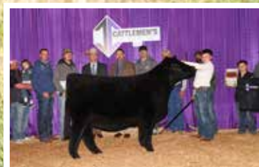
S&S PEGG FOOLS GOLD 1501J 2023 Cattleman's Congress Reserve Grand Champion Percentage Simmental Heifer Full Sister to Lot 38

DUE 2/6/26 TO PVF BLACKLIST 7077 OR 2/27/26 TO CONLEY NO LIMIT TOO CLOSE TO CALL