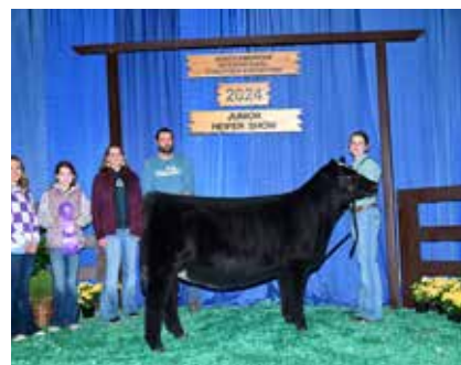
S&S TSSC SOMETHING TO SEE 2024 NAILE Division I Champion Simmental Heifer Full Sister to Lots 31 & 32