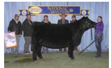
JBOY TAMMY 843 2020 NWSS Reserve Grand Champion Percentage Simmental Heifer Daughter of Full Sister to Lot 18