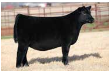
PSSC TSSC PROVEN QUEEN 4419 $40,000 Maternal Sister to Lot 3