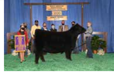
UDE ELLIE 9230 2020 NAILE Grand Champion Angus Heifer Dam of Lot 5