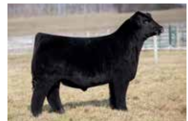
REVELATION 2K Service Sire to Lot 27

DUE 1/16/26 TO REVELATION 2K SEXED FEMALE SEMEN