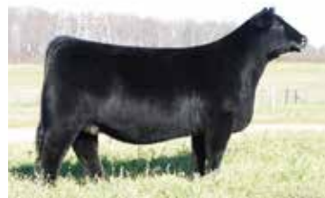
JSUL WHO'S PLAYING 6973D ET Prolific Dam of Lot 14

ASHW WHO DA MAN JSUL WHO'S PLAYING 6973D ET JSUL SULTRY 6640