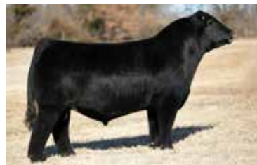
BKMT GAME ON 227G ET Sire of Lot 45