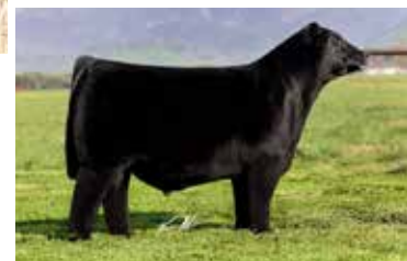
COLBURN PRIMO 5153 Popular Angus AI Sire & Maternal Brother to Dam of Lot 4