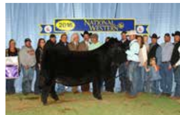
JS BLACK SATIN 9B “Boots” 2015-2016 Triple Crown Winning Purebred Simmental Heifer Full Sister to Dam of Lots 35-37