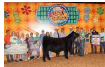
COOR DIAMOND 403M 2025 National Junior Heifer Show Grand Champion Chiangus Heifer