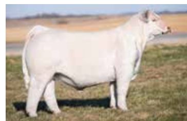
BOY AALB WHITE SNAKE 400M