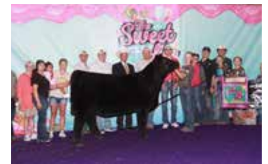
JSUL PCC WHO'S LOOKIN 2113K ET 2023 National Junior Heifer Show Reserve Grand Champion Chianina Heifer Full Sister to Lot 13