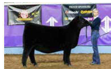
UDE SARAS DREAM 1086 $600,000 Dam of Lot 48