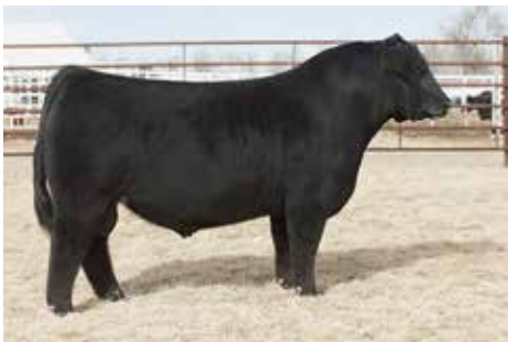
BNWZ DATA BANK 1311C ET Service Sire to Lot 37

DUE 1/17/26 TO CONLEY NO LIMIT SEXED FEMALE SEMEN