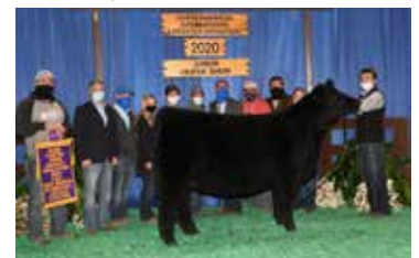
JBOY TAMMY 902G 2020 NAILE Grand Champion Percentage Simmental Heifer Daughter of Full Sister to Lot 18