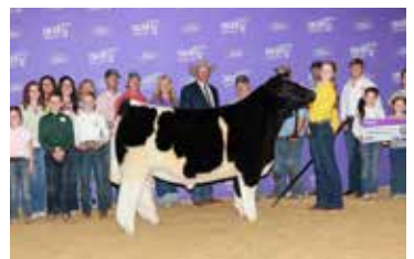
2025 Tulsa State Fair Reserve Grand Champion Market Steer Full Brother to Lot 16