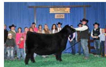
UDE SARAS DREAM 4010 2025 NAILE Supreme Champion Junior & Open Breeding Heifer $400,000 Maternal Sister to Lot 48