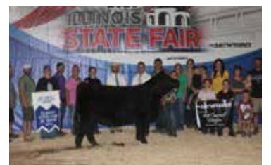
S&S BCII SUGAR AND SPICE 2023 IL State Fair 4th Overall Junior Breeding Heifer Daughter of Lot 10