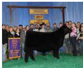
JSUL WHO DAT RAPTOR 6976D ET 2017 NAILE Supreme Champion Junior Breeding Heifer Full Sister to Lots 11 & 12