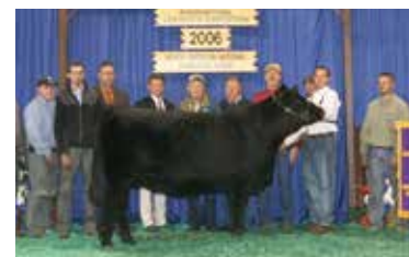
HPF HONEY R007 2006 NAILE Grand Champion Purebred Simmental Heifer Maternal Granddam of Lot 38