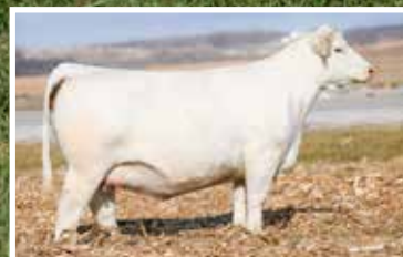
BOY MMM MONTELLA 956G