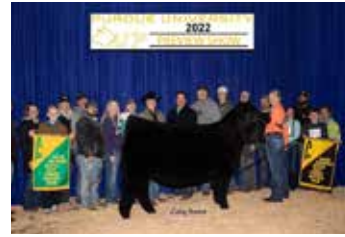
S&S TSSC BT ARIANA 1226J 2022 Purdue AGR Supreme Champion Junior Breeding Heifer Full Sister to Lot 29