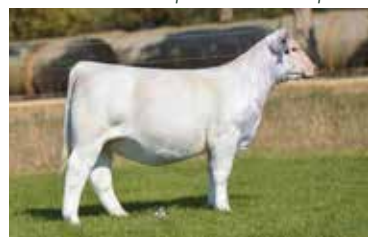
SLIK MARILYN 15M $66,500 Maternal sister to Lot 8