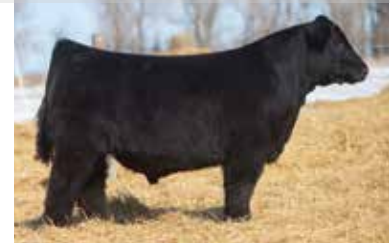
NMR MATERNAL MADE Sire of Lot 46