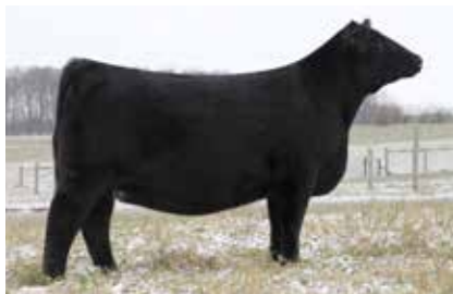
JBSF PLENTY FOXY 12E Dam of Lots 25-30