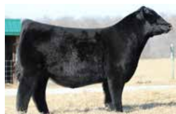
SCC SCH 24 KARAT 838 Iconic Angus AI Sire & Maternal Brother to Lot 2