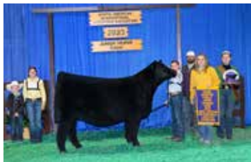
BMW ACE 2 101K ET 2023 NAILE Grand Champion Chiangus Heifer Dam of Lot 50