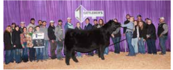
JSUL TSSC LADY IN BLACK 2181K 2024 Cattlemen's Congress Grand Champion Purebred Simmental Heifer Dam of Lot 51