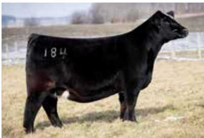
HSC JADE 019J "Pretty Woman" Dam of Lot 34

S&S Pretty Woman 4096M will be one of the first daughters of the iconic HSC Jade 019J "Pretty Woman" to enter production. She appears to be the kind that will generate some serious returns. This purebred daughter of JSUL Something About Mary 8421 offers the same wild proportions that made her dam a prized possession—featuring a refined, choke-throated front end, massive body cavity, and extra stout features. Her ear and neck set are exceptional and highlight her stylish baldie markings. We have high expectations for the PVF Blacklist 7077 pregnancy she carries—a near-perfect mating for her phenotype.