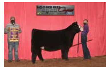
EVERHARTS FOXY 2021 Hoosier Beef Congress Reserve Grand Champion Purebred Simmental Heifer She Sells as Lot 22!