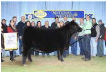
BCII SANDY 0215 2017 NWSS Reserve Grand Champion Junior Angus Heifer Dam of Lot 24

NICHOLS BLK DESTINY D12 S&S MISS SMARTY PANTS WAR OFANCY PANTS 603