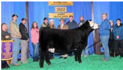
BCII ANNIE 01J 2022 NAILE Grand Champion Purebred Simmental Heifer Dam of Lot 52

JSUL SOMETHING ABOUT MARY 8421 JSUL TSSC LADY IN BLACK 2181K PEINE/GS ROSIE 677D