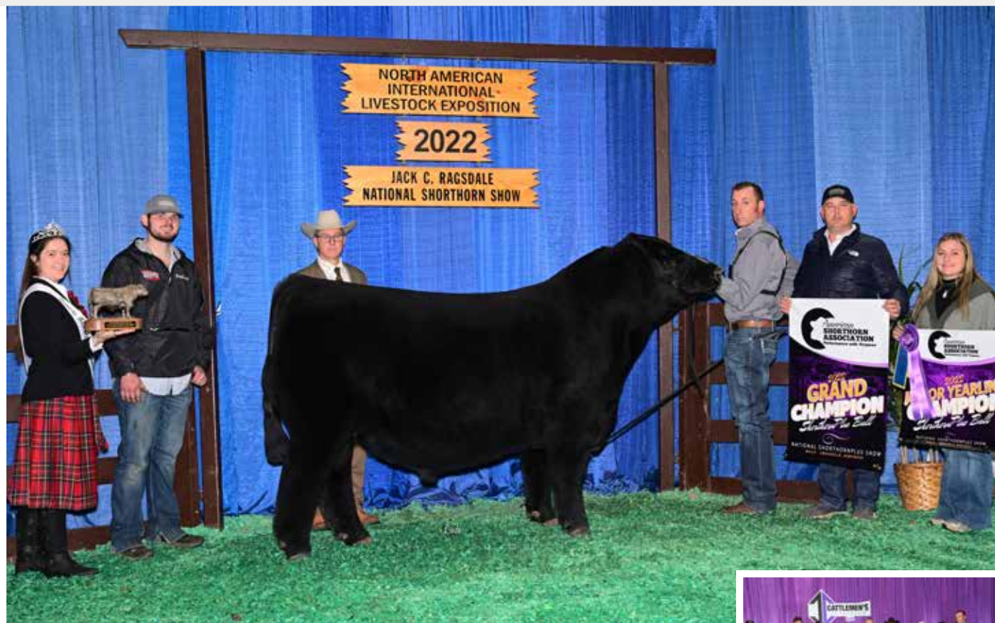
TSSC BT LIMIT UP 1099J ET 2022 NAILE Grand Champion Shorthorn Plus Bull