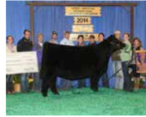
TSSC SELENA 330A "EMILY" 2014 NAILE Supreme Champion Junior Breeding Heifer Full Sister to Lot 23