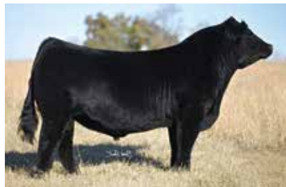
LLSF PAYS TO BELIEVE ZU194 Iconic Sire of Lots 25-27