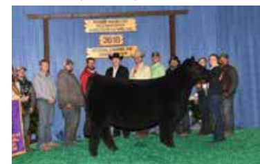
JSUL SASSY JALYNN 7507E ET 2018 NAILE Grand Champion Chianina Heifer Maternal Sister to Lot 17