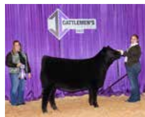
SKLS 276J 2022 Cattlemen's Congress Division Champion Limousin Heifer $45,000 Daughter of Lot 42

FWLY BIG TIME TMCK QUEEN 73T EXLR QUEEN 786P