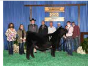
JSUL/TSSC BETH DUTTON 0113H 2022 Cattlemen's Congress Grand Champion Percentage Simmental Heifer Dam of Lot 33