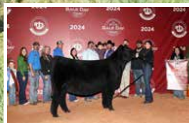
EVERHARTS BRANDY 2024 American Royal Reserve Grand Champion Purebred Simmental Heifer $60,000 Maternal Sister to Lot 22