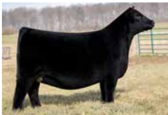
MLA PROVEN QUEEN 2135 Prolific Dam of Lot 3