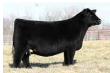
MINN KATIE 9B ET Legendary Maternal Granddam of Lot 15

SILVEIRAS STYLE 9303 BUTLER FARMS KATIE G20 ET MINN KATIE 9B ET