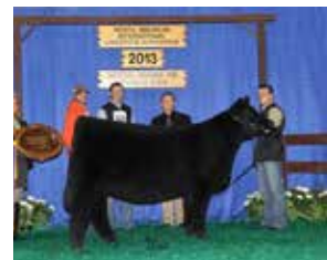
JSUL WHO DAT LADY 2037Z 2013 NAILE Grand Champion Chianina Heifer Full Sister to Lots 11 & 12