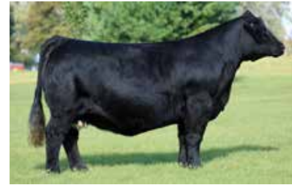
JS FLIRT A-WAY 59Y Maternal Granddam of Lots 35-37