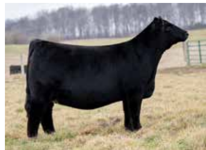
WHF DELILAH 450H Dam of Lots 31 & 32

CCS/WHF OL' SON 48F WHF DELILAH 450H WHF DELILAH 45D