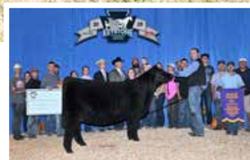
S&S TSSC MAIN MILEY CYRUS 2024 KILE Supreme Champion Breeding Heifer Maternal Sister To Lots 25-29 & Full Sister To Lot 30