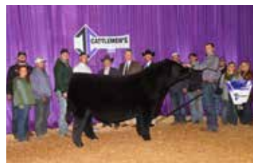
TSSC BT LIMIT UP 1099J ET 2022 Cattlemen's Congress Reserve Supreme Champion Bull Sire of Lot 28