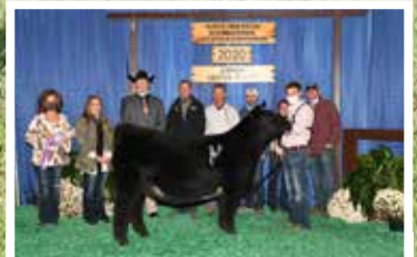
JSUL/TSSC BETH DUTTON 0113H 2020 NAILE Reserve Grand Champion AOB Heifer Dam of Lot 16 2022 Cattlemen's Congress Grand Champion Percentage Simmental Heifer