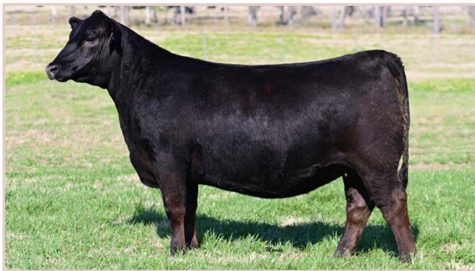
Circle G Rita 3259 - Dam of Lot 8