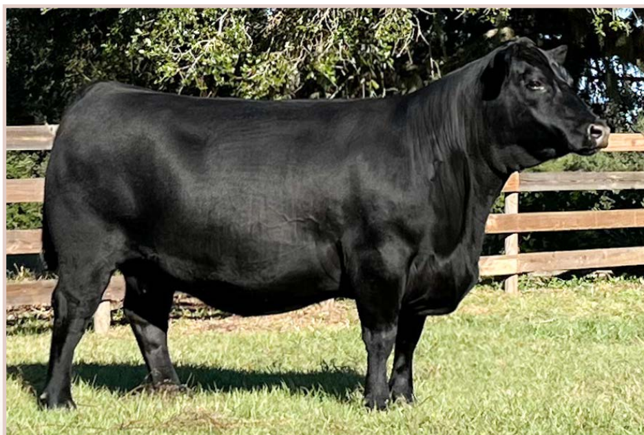
Cigar Rita 9029 of 7229 4100 - Dam of Lot 5