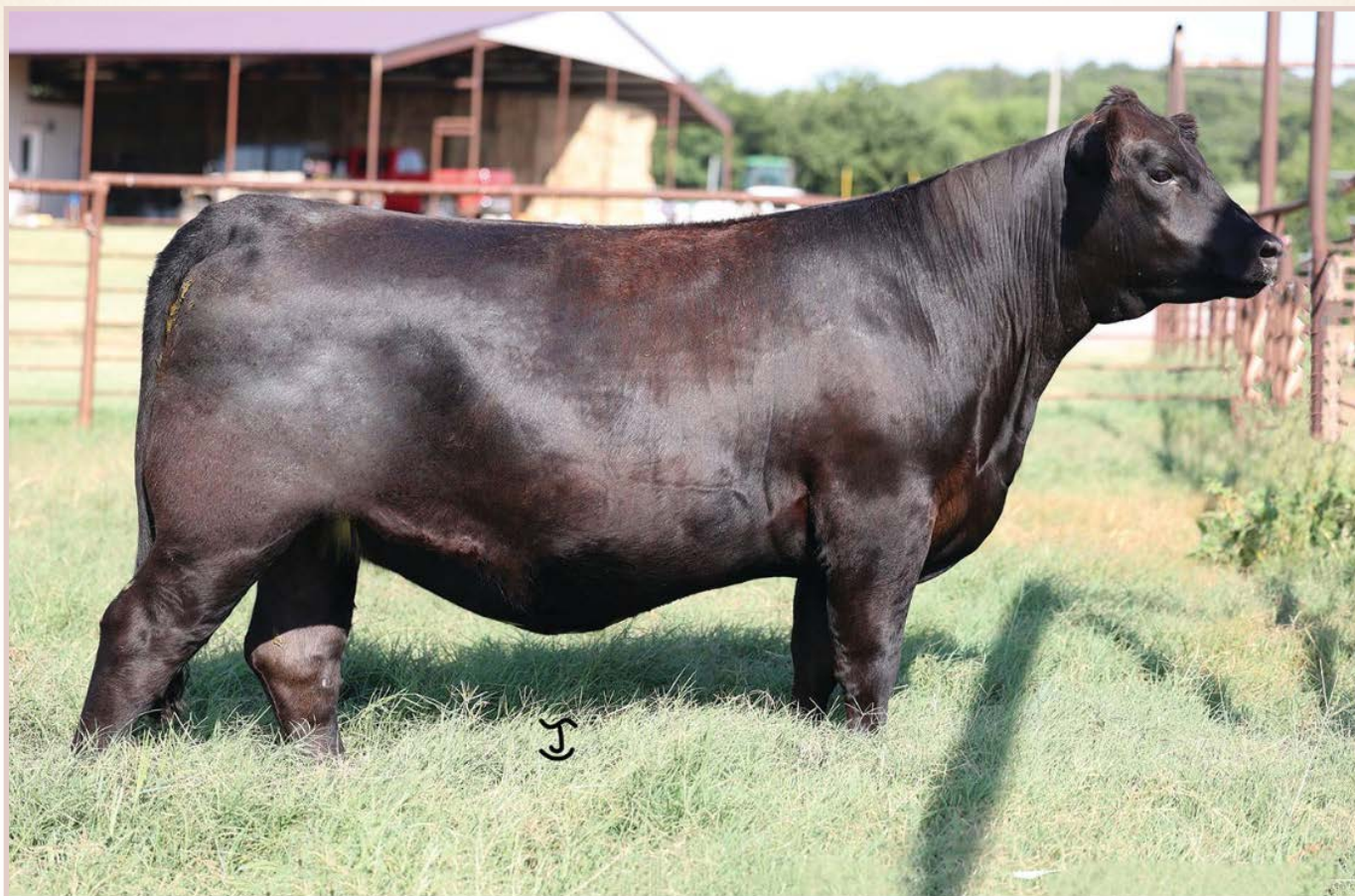
SEO 1166 Lucy 2006 4104 - Dam of Lots 11A & 11B