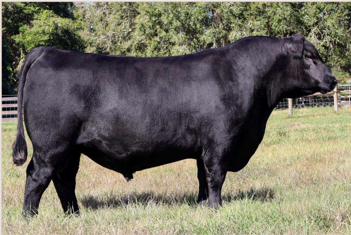
Cigar/Lucky V Protector - Lot 21 Semen