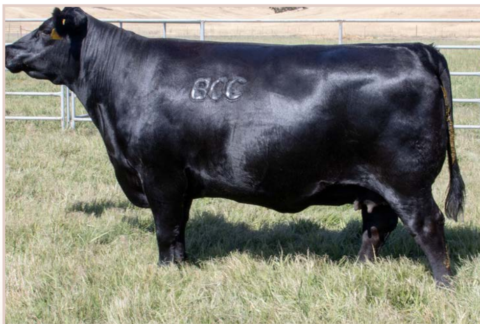
Cigar Rita of 7035 0709 - Dam of Lot 4