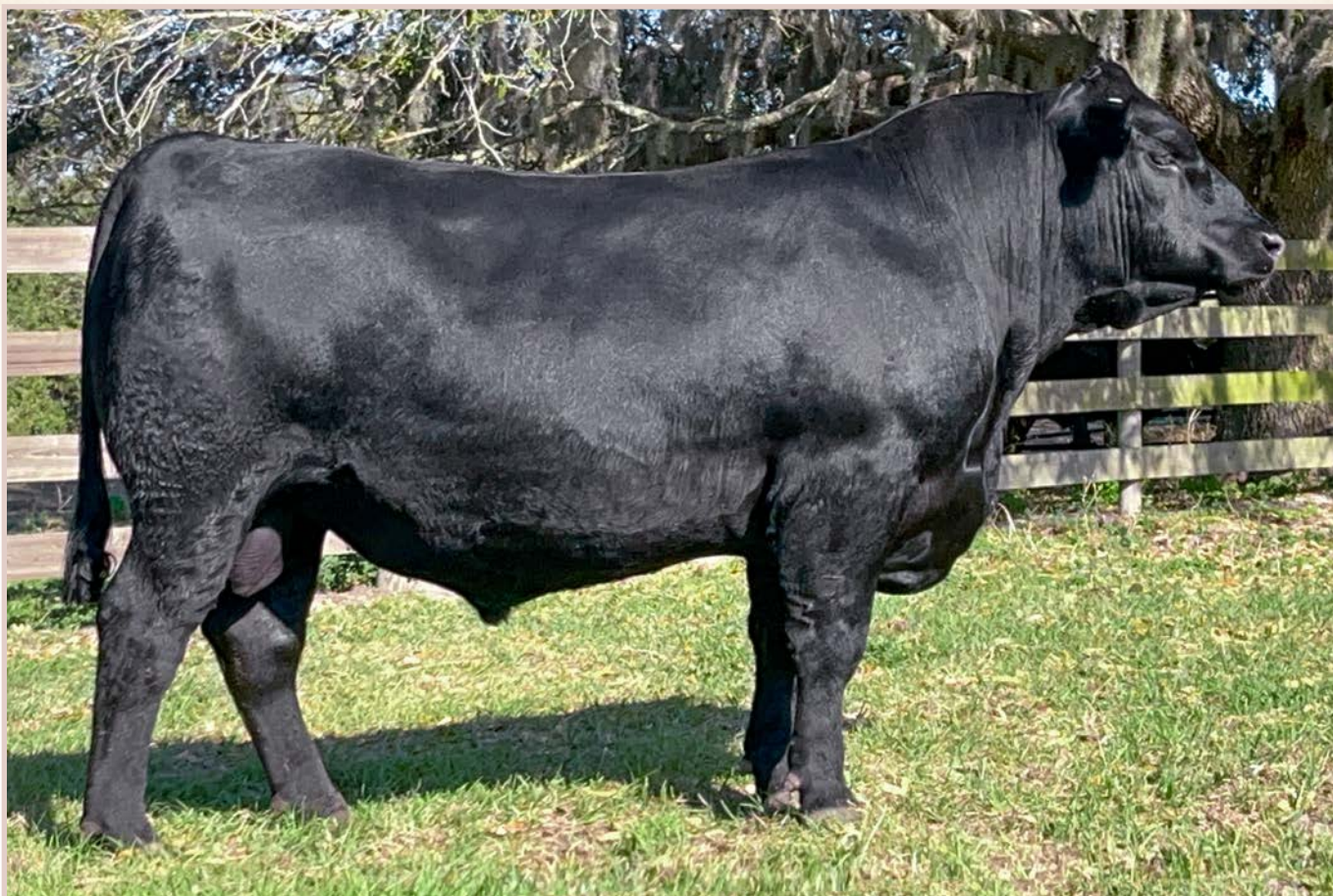
Cigar FB Waymaker - Lot 19 Semen