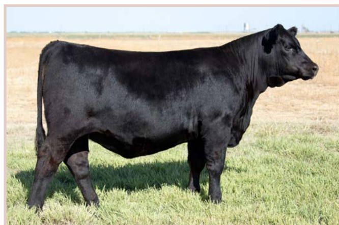
2 Bar Grid Maker 3686 - $520,000 Full Sister to Lot 19