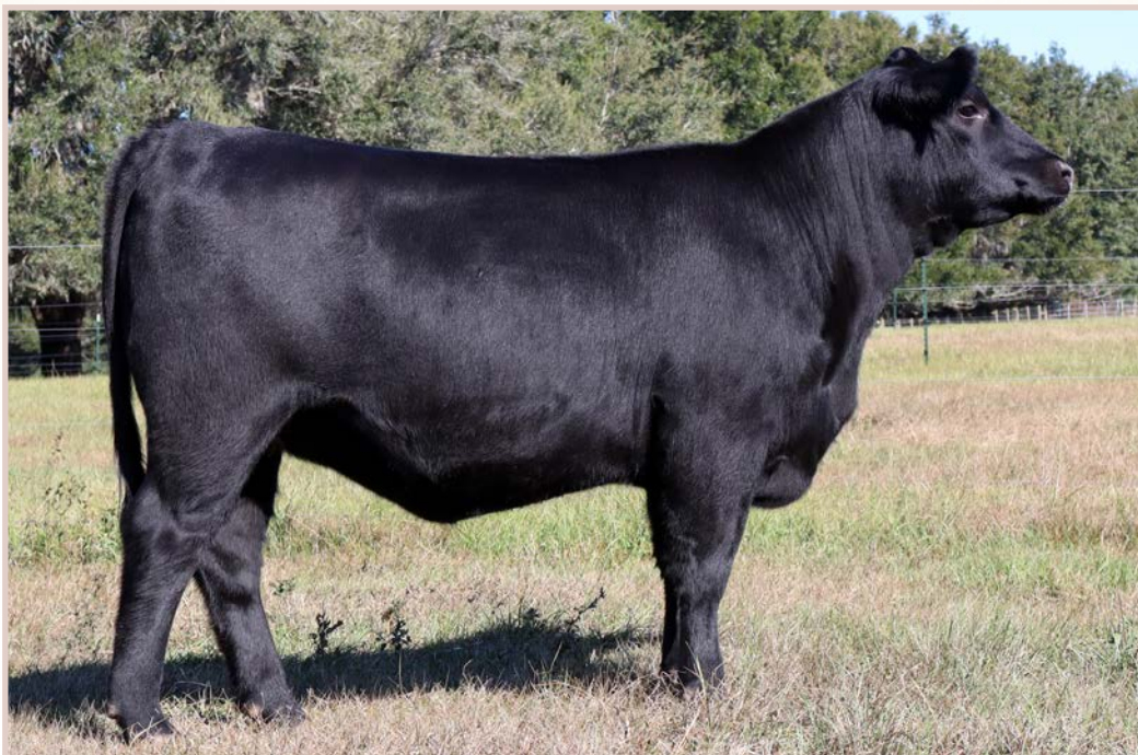
Cigar Soprano 4075 - Dam of Lot 10