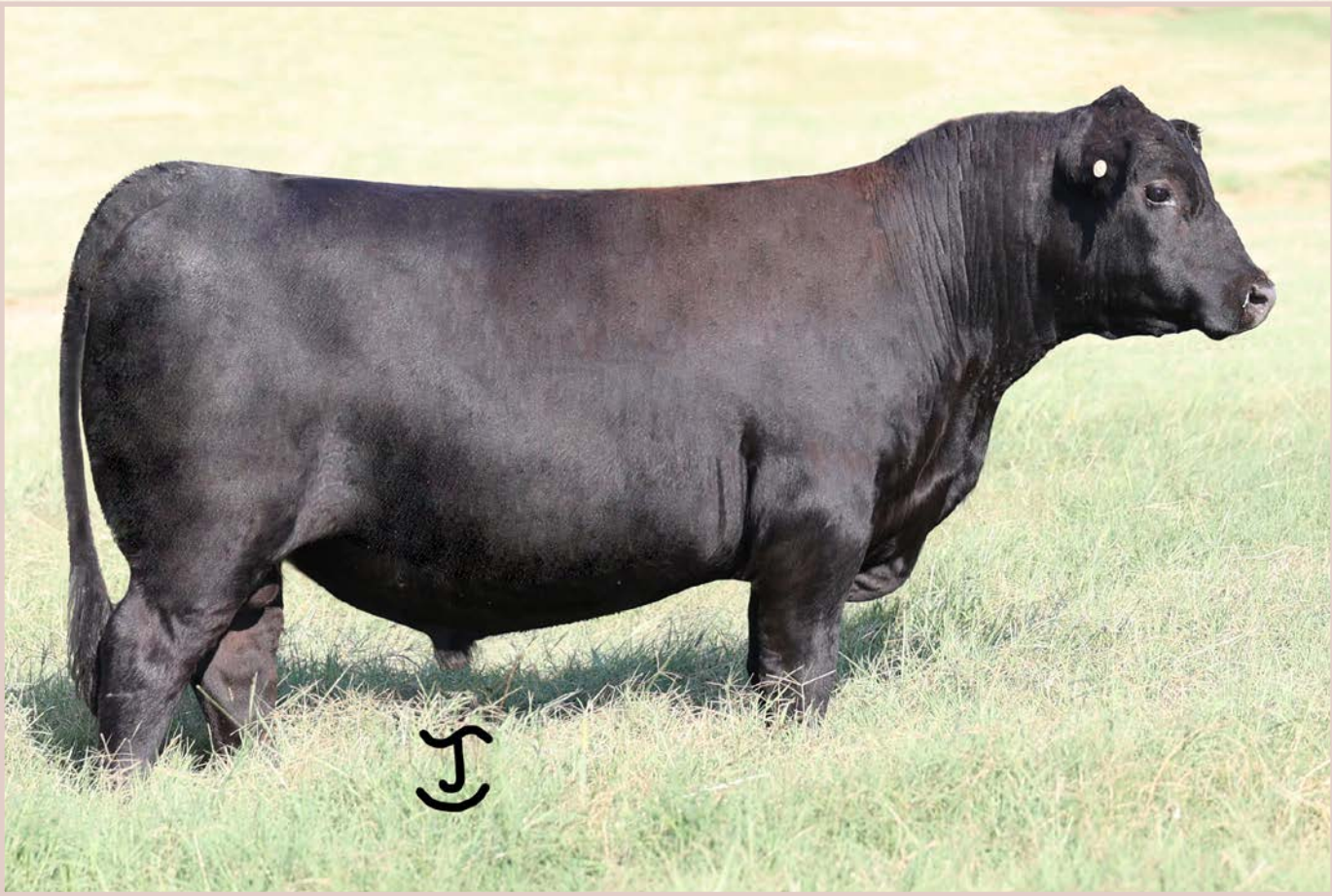
Cigar Mob Boss - Lot 22 Semen