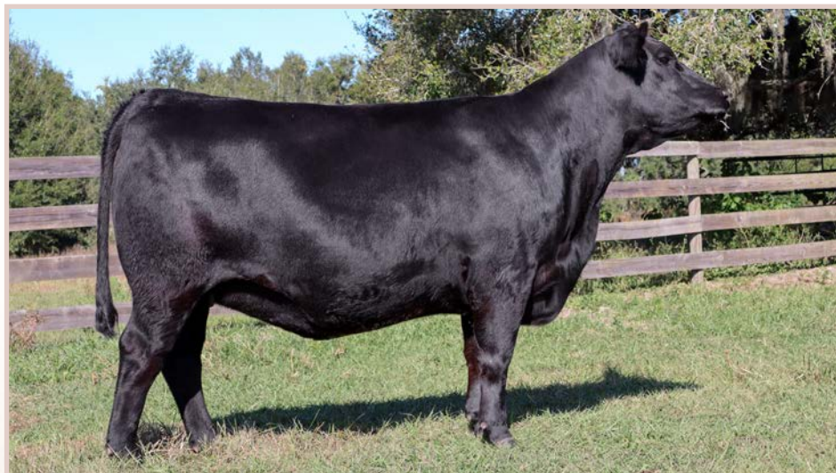
Cigar Karama 3077 of 0601 - Dam of Lot 9

A heifer calf pregnancy by the $110,000 valued Friendship Farms herd sire, De Su Do Right and from a beautifully designed Winchester daughter that is a direct daughter of the legendary $100,000 valued, deceased FB Genetics and Ozark Mountain donor SEO 764 Karama 0601, who produced the $120,000 Karama 0601 4416 selected by C5 Angus in the 2024 Source Sessions sale. The early reports on the Crick calves have been outstanding. I would expect that this has untapped, unlimited earning potential. Sells due to calve 2/3/2026 in a reliable recip.