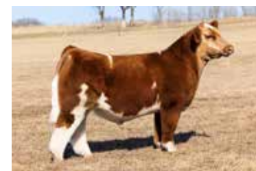
WEIS DEVIL YOU KNOW 116L