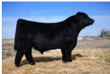
BOE GRONC ET FULL BROTHER TO DAM OF LOT 20

BREED MAINETANER | 1.62% CHIANINA • ACA 430271 | AMAA: 567832 • DOB 4/27/25 • OFFERED BY FITZ