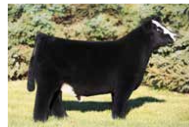
GOOD AS IT GETS SIRE OF LOTS 15-18