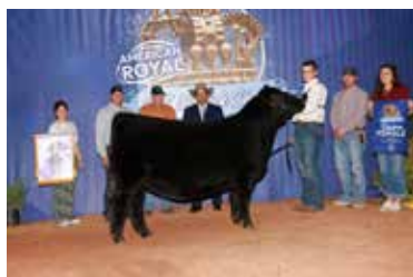
CLF PIN UP GAL 40M 2025 AMERICAN ROYAL ROV RESERVE GRAND CHAMPION HEIFER MATERNAL SISTER TO LOT 2