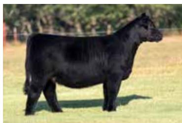
DUNK JUNEBUG 583N ET $40,000 MATERNAL SISTER TO LOT 16