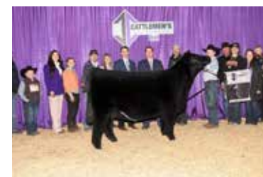
JSUL STELLAR DARLIN 3105 2025 CATTLEMEN'S CONGRESS GRAND CHAMPION CHIANINA HEIFER MATERNAL SISTER TO LOT 25