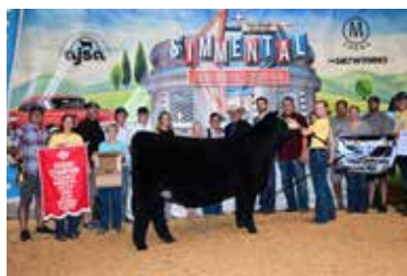
ROXI'S LOOK AT ME 2024 AJSA NATIONAL CLASSIC GRAND CHAMPION PUREBRED SIMMENTAL HEIFER MATERNAL SISTER TO LOT 26