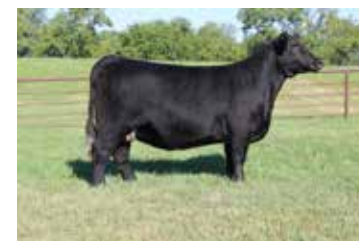
JSUL WHO DAT DARLING DAM OF LOT 25