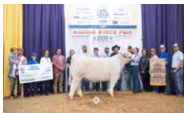
2020 KS STATE FAIR GRAND CHAMPION MARKET STEER MATERNAL BROTHER TO DAM OF LOT 18