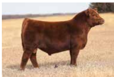
SIX MILE PARABELLUM 675G MATERNAL GRANDSIRE OF LOT 8