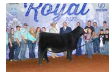
WEIS MISS LILLY 35J 2022 AMERICAN ROYAL RESERVE GRAND CHAMPION PUREBRED SIMMENTAL HEIFER DAM OF LOT 35