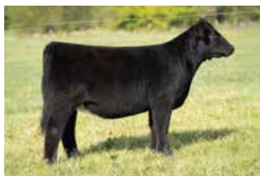
DUNK BMW JUNEBUG 304N $105,000 MATERNAL SISTER TO LOT 16