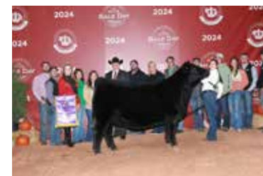
KRUSE'S ANNIE LU 9273

2024 NJAS RESERVE GRAND CHAMPION OWNED HEIFER FULL SISTER TO LOT 3 MATERNAL SISTER TO LOT 4