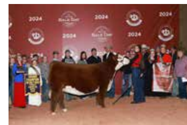
H BL TB PIXIE L369 ET 2024 AMERICAN ROYAL GRAND CHAMPION HERFORD HEIFER MATERNAL SISTER TO LOT 5