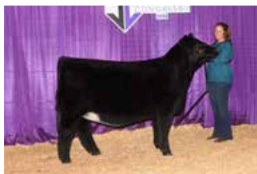
MISS MAXINE ET 2023 CATTLEMEN'S CONGRESS DIVISION CHAMPION MAINE-ANJOU HEIFER DAM OF LOT 20