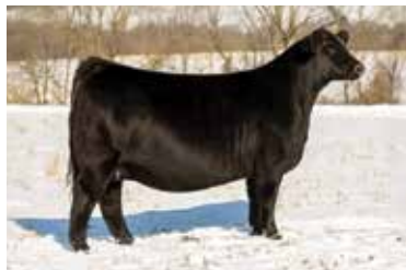
KC2 MISS VICTORIA 6H DAM OF LOT 30

BREED PB SM • ASA 4602247 • DOB 5/17/25 • OFFERED BY WEIS