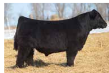
NMR MATERNAL MADE MATERNAL GRANDSIRE OF LOT 15