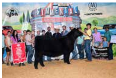
R2C BAILEY 314L 2024 AJSA NATIONAL CLASSIC RESERVE GRAND CHAMPION PUREBRED SIMMENTAL HEIFER MATERNAL SISTER TO DAM OF LOT 34