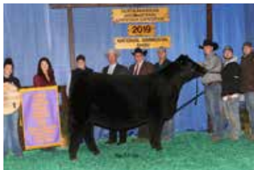
J6C WEIS MISS COCO I6F

BREED 1/2 SM 1/2 AN • ASA 4605452 • DOB 6/3/25 • OFFERED BY WEIS