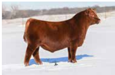
WD ROSE JOHNNY CASH 342 2024 CATTLEMEN'S CONGRESS RESERVE GRAND CHAMPION RED ANGUS BULL SIRE OF LOT 8

BREED RED ANGUS • RAAA 5169777 • DOB 6/8/25 • OFFERED BY WEIS