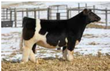
KANES 83 ET DAM OF LOT 14

BREED 9.03% CHIANINA/MAINE TAINER • ACA 429117 | AMAA 565661 • DOB 5/15/25 • OFFERED BY WEIS