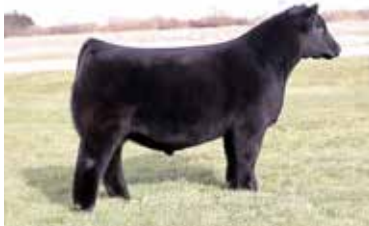
LLW CARDINAL CROSSOVER 236J SIRE OF LOT 14