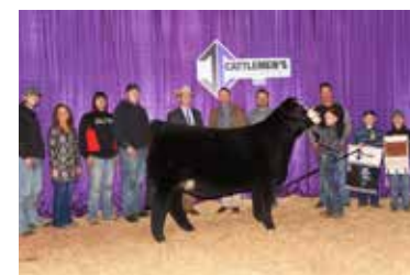
WEIS MISS LILLY 35J 2023 CATTLEMEN'S CONGRESS GRAND CHAMPION PUREBRED SIMMENTAL HEIFER DAM OF LOT 35