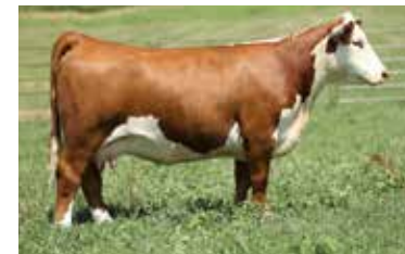
RG 551 PIXIE ET 707E ET DAM OF LOT 5