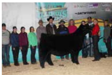
LDSC SHIRLEY I55K

GRAND CHAMPION MAINETAINER HEIFER $305,000 FULL SISTER TO DAM OF LOT 22