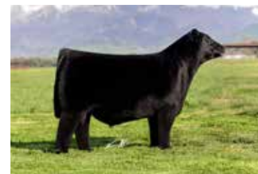
COLBURN PRIMO 5153 SIRE OF LOT 27