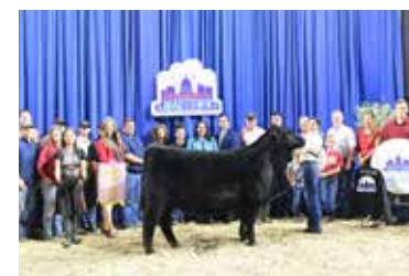
KRUSE'S ANNIE LU 9273

2024 NJAS RESERVE GRAND CHAMPION OWNED HEIFER FULL SISTER TO LOT 3 MATERNAL SISTER TO LOT 4