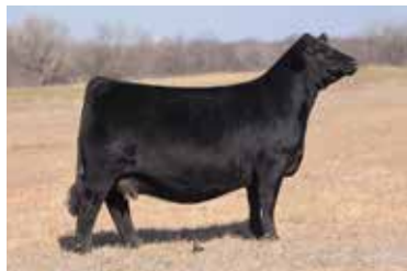
BANKROLL'S PRIDETTE 18H DAM OF LOT 34

BREED PB SM • ASA 4605092 • DOB 5/8/25 • OFFERED BY WEIS