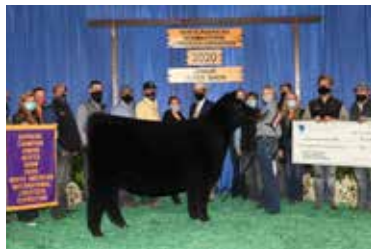
JSUL WHO DAT DARLING 902G ET 2020 NAILE SUPREME CHAMPION JUNIOR BREEDING HEIFER DAM OF LOT 24

BREED 1/2 SM | 5.39% CHIANINA · ASA 4607883 | ACA 430406 · DOB 4/30/25 · OFFERED BY FITZ