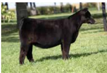
KANES SAPPHIRE ET FULL SISTER TO LOT 14