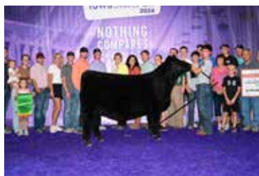
R2C BAILEY 314L 2024 IA STATE FAIR 4TH OVERALL 4-H BREEDING HEIFER MATERNAL SISTER TO DAM OF LOT 34