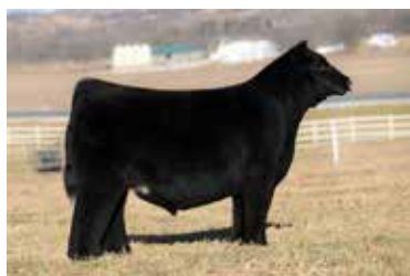
TLAC HITS DIFFERENT 1409L ET