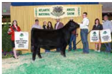
CLF PIN UP GAL 40M 2025 ATLANTIC NATIONAL SUPREME CHAMPION JUNIOR BREEDING HEIFER MATERNAL SISTER TO LOT 2