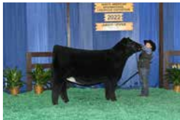
BBR JUNEBUG 125J ET DAM OF LOT 16

BREED MAINETANER | 2.38% CHIANINA · ACA 430263 | AMAA 567831 · DOB 5/14/25 · OFFERED BY FITZ