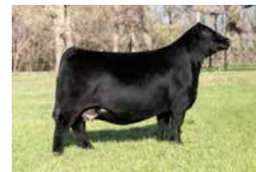
PLUM CREEK ANNIE LU 9271