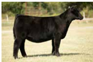
KATY'S BABY ET

BREED HIGH MAINE • AMAA 568092 • DOB 5/12/25 • OFFERED BY FITZ