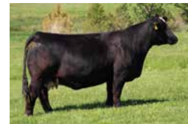
HARA'S KIM KARDASHIAN IC "LADY KILLER"