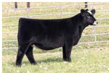
ROXI'S KUT THROAT $400,000 MATERNAL SISTER TO LOT 26