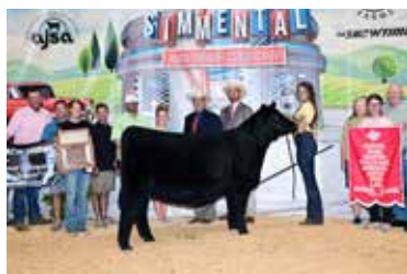
JSUL WHO DAT 3392L 2024 AJSA NATIONAL CLASSIC RESERVE GRAND CHAMPION PERCENTAGE SIMMENTAL HEIFER MATERNAL SISTER TO LOT 24