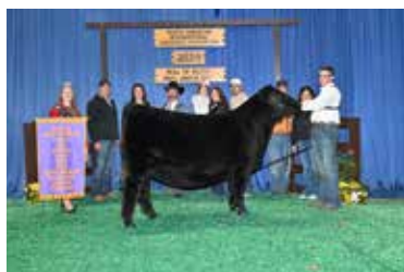
CLF PIN UP GAL 40M 2025 NAILE ROV RESERVE GRAND CHAMPION HEIFER MATERNAL SISTER TO LOT 2