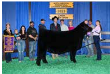
LDSC STELLA I52K

BREED MAINETAINER • AMAA 564172 • DOB 3/7/25 • OFFERED BY FITZ