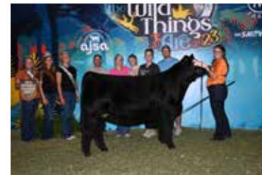
RJ LADY KILLER 238K