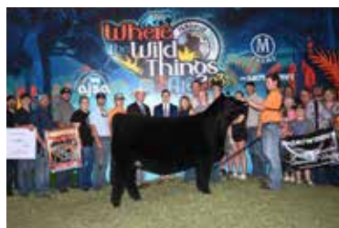
ROXI'S KARTER 2023 AJSA NATIONAL CLASSIC GRAND CHAMPION PUREBRED SIMMENTAL HEIFER MATERNAL SISTER TO LOT 26