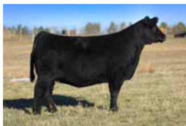
LDSC LOT I

5TH OVERALL BREEDING HEIFER $305,000 FULL SISTER TO DAM OF LOT 22