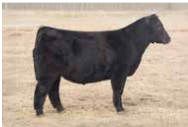
WEIS ALL ME 10F SIRE OF LOTS 12 & 13

BREED HIGH MAINE | 5.41% CHIANINA · ACA 430265 | AMAA 567828 · DOB 5/19/25 · OFFERED BY FITZ