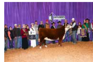
H PIXIE 0635 ET 2022 CATTLEMEN'S CONGRESS GRAND CHAMPION HORNED HERFORD HEIFER MATERNAL SISTER TO LOT 5