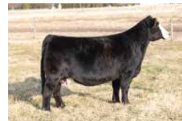
JPLF/RBS YOUR THE ONE MATERNAL GRANDDAM OF LOT 35