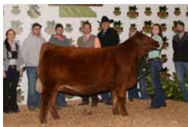
WDZ GIRL POWER 5028 MATERNAL GRANDDAM OF LOT 8