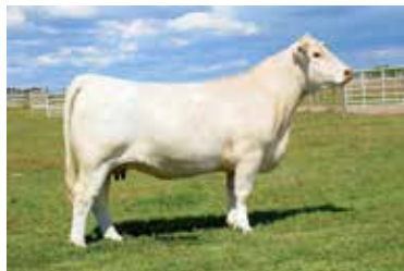
HF MUSTANG SALLY 904 PLD DAM OF LOT 18

BREED 2.86% CHIANINA · ACA 430534 · DOB 5/15/25 · OFFERED BY FITZ