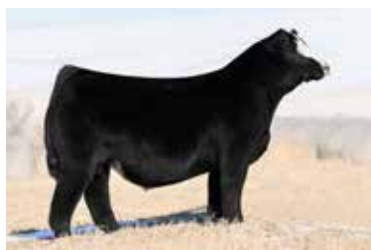
NEXT LEVEL SIRE OF LOT 30