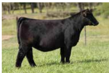
LASHMETT/WEIS VICKI M416 $105,000 MATERNAL SISTER TO LOT 30