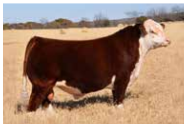
KLD RW MARKSMAN D87 ET

GRAND CHAMPION POLLED HEREFORD HEIFER DAM OF LOT 6