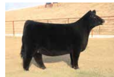
JSUL WHO DAT FETTY 6322D ET FULL SISTER TO DAM OF LOT 25