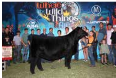
TL SADIE 37K

BREED PB SM • ASA 4599551 • DOB 5/20/25 • OFFERED BY WEIS