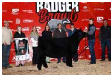
TL ELLIE 5M