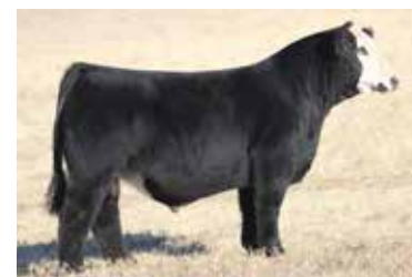
RJ TRUST FUND 212K