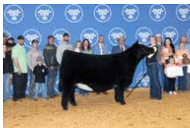
JSUL WHO'S DAT 3387L 2025 OYE SUPREME CHAMPION INFLUENCE BREEDING HEIFER MATERNAL SISTER TO LOT 24