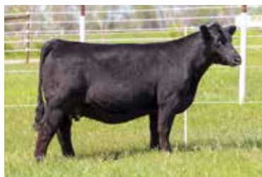
HARA'S MISS HEARTBREAKER 422B

MATERNAL SISTER TO DAM OF LOTS 31 &amp; 32