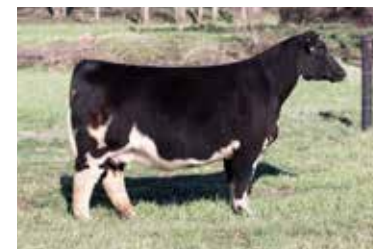
KANES 9116 ET