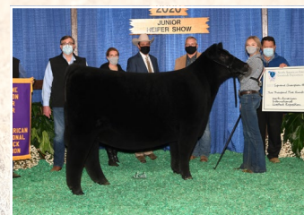
JSUL WHO DAT DARLING 9026 ET FULL SISTER TO LOT 10 AND MATERNAL SISTER TO LOT 9