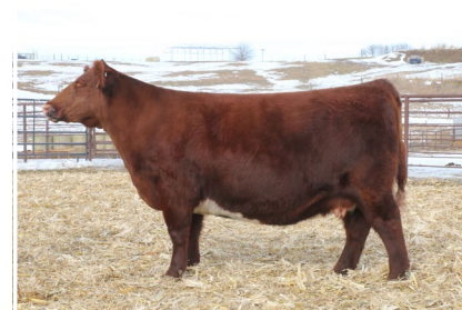
SULL ROSES ARE RED ET DAM OF LOT 6