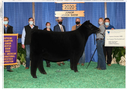
JSUL WHO DAT DARLING 902G ET DAM OF LOT 15