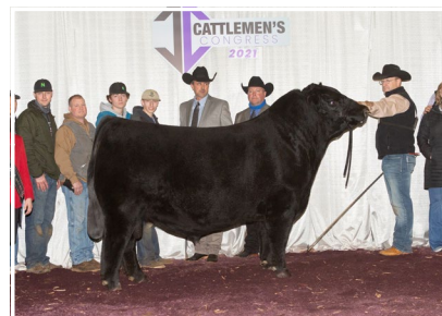
BNWZ DIGNITY 8017 SIRE OF LOT 1