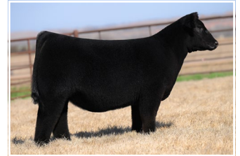
PCC WJ WHO DAT RAPTOR 342L $63,000 MATERNAL SISTER TO LOTS 11 AND 12