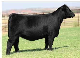
JSUL PCC DAT LOOKER 2199K $75,000 FULL SISTER TO LOT 10 AND MATERNAL SISTER TO LOT 9