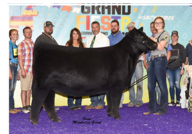
JSUL WHO DAT CAT 7184E ET MATERNAL SISTER TO LOT 9 AND FULL SISTER TO LOT 10

READY 3409L ET. Other maternal sisters to lots 9 and 10 include: