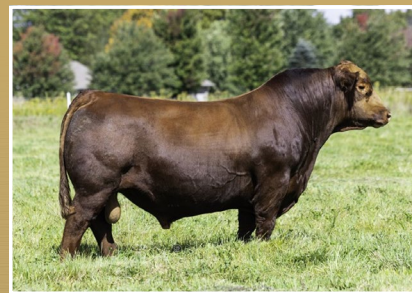
J2R RESOURCE 144J SIRE OF LOT 20 EMBRYOS