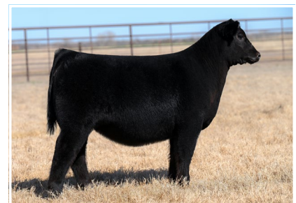
PCC DKB DAT GIRL 534L ET $29,500 MATERNAL SISTER TO LOT 13