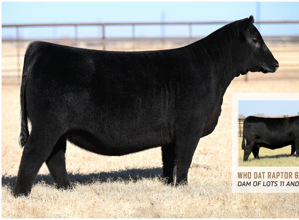
WHO DAT RAPTOR 6976D DAM OF LOTS 11 AND 12