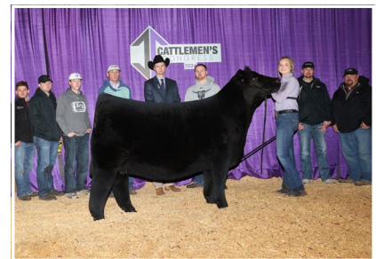
TUBB/TSSC LARISSA WHO 201K ET DAM OF LOT 17 - 2024 CATTLEMEN'S CONGRESS