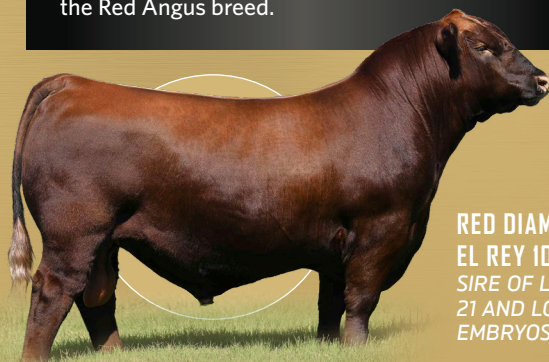
RED DIAMOND EL REY 102 SIRE OF LOT 21 AND LOT 22 EMBRYOS