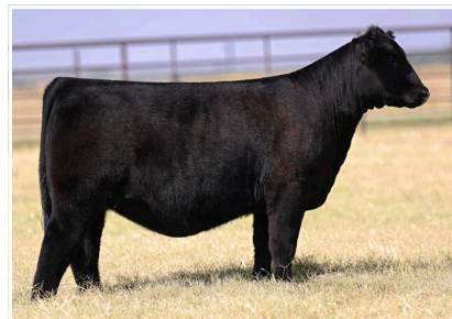
PCC SULL ELLIE 3197L $25,000 DAM OF LOT 18