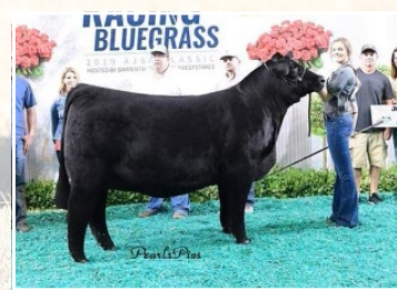
W/C HARRELL ANGEL 7110E MATERNAL GRANDAM OF LOT 7