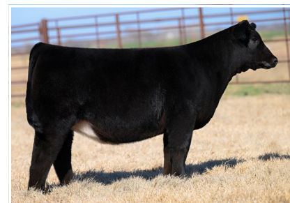
JSUL PCC JALYNN 3625L $20,000 MATERNAL SISTER TO LOT 14