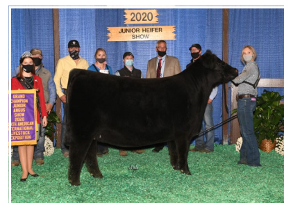
UDE ELLIE 9230 DAM OF LOT 2