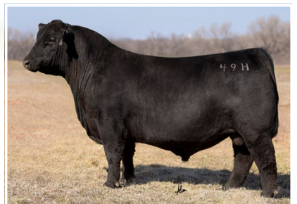
RIVERSTONE VEGAS 49H SIRE OF LOT 3