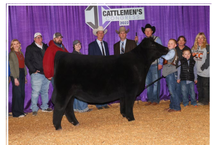
PCC SULL DAT GIRL 0393H $30,000 DAM OF LOT 13