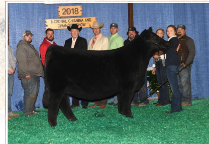
JSUL SASSY JALYNN 750E ET DAM OF LOT 14