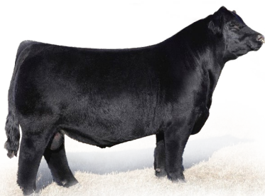
JSUL SOMETHING ABOUT MARY 8421 SIRE OF LOT 9

presence and practicality! • Lots 9 and 10 are direct daughters of possibly the most consistent donor in terms of income generation in the history of the PCC program, Who Dat Darling. Eight maternal sisters to lot 9 and full sisters to lot 10 sold in the 2023 Fall PCC Sale for a total of $355,000 to average $44,375 and included the $75,000 PCC JSUL WHO'S