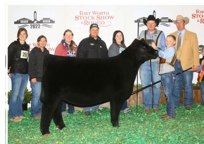
JSUL PCC FETTY'S PRIDE 1407J DAM OF LOT 19 GRAND CHAMPION CHI FEMALE 2022 FT. WORTH STOCK SHOW