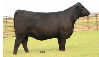
PCC EVENING TINGE 324G DAM OF LOT 4