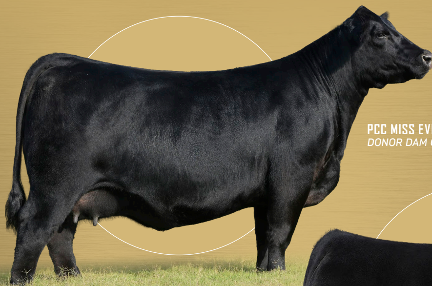
PCC MISS EVENING TINGE 430E DONOR DAM OF LOT 23 EMBRYOS