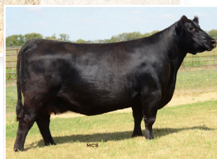
PCC EVENING TINGE 226 8001 MATERNAL GRANDAM OF LOTS 4 AND 5