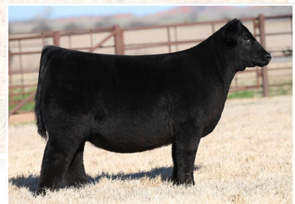
PCC DKB DAT GIRL 263M $77,000 MATERNAL SISTER TO LOT 13