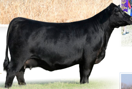
PCC MISS EVENING TINGE 430E MATERNAL GRANDAM OF LOT 3