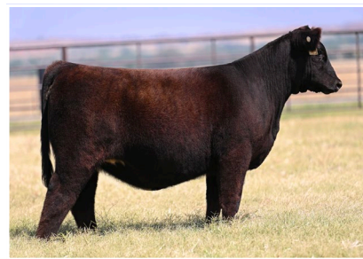
PCC WHO DAT HOTTIE 213L ET $11,500 MATERNAL SISTER TO LOTS 16 AND 16A