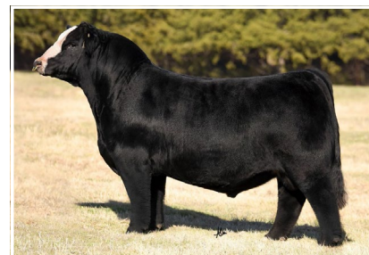
TL ON THE RUN 106K Sire of lot 8