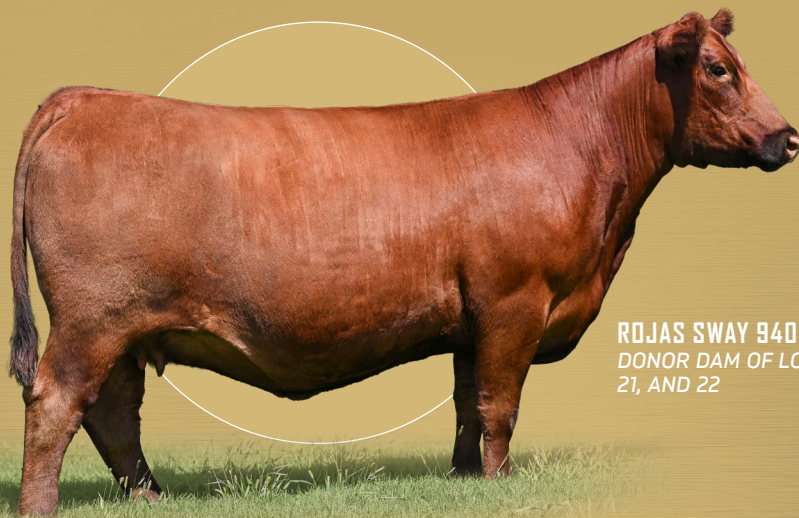
ROJAS SWAY 9401 DONOR DAM OF LOTS 20, 21, AND 22