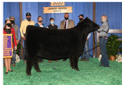
UDE ELLIE 9230 MATERNAL GRANDAM OF LOT 18