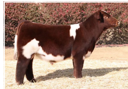
MFS DREAM WEAVER 37K $112,000 SIRE OF LOT 6