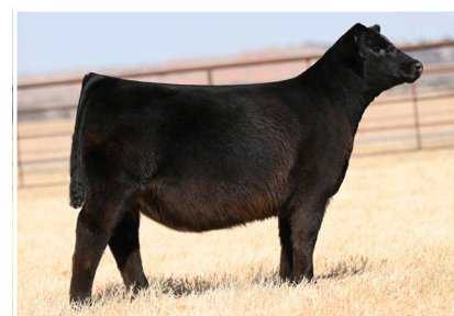
PCC JSUL ABOUT LOLA 1539J $29,000 DAM OF LOT 8