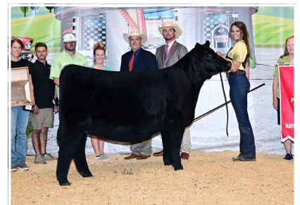
JSUL WHO DAT 3392L MATERNAL SISTER TO LOT 15