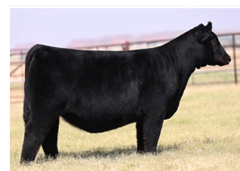
PCC JSUL WHO'S READY 3409L ET $75,000 FULL SISTER TO LOT 10 AND MATERNAL SISTER TO LOT 9

Here is an extra impressive female from a functional perspective. She is flexible off both ends of her skeleton, big bodied and high volumed, while still being bold and stout out of her hip. In addition, she is expansive in her heart yet trendy in her chest giving her a killer look from the side. Her upside earning potential is great considering her pedigree and that her kind boast the most impressive show careers, while also having the practical pieces needed from an industry aspect.