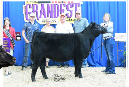
PCC EVENING TINGE 430 DAM OF LOT 3 - 2021 NJAS