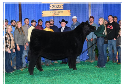
TUBB/TSSC LARISSA WHO 201K ET DAM OF LOT 17 - 2023 NAILE