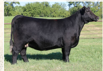
JSUL WHO DAT DARLING 4303B DAM OF LOTS 9 AND 10