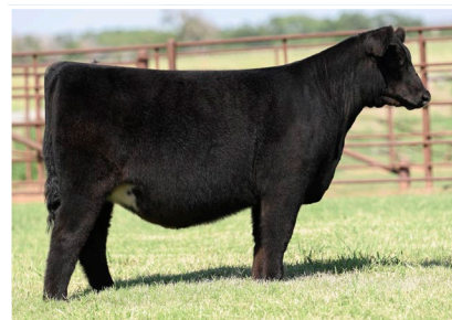
PCC WHO DAT HOTTIE 306K $45,000 MATERNAL SISTER TO LOTS 16 AND 16A