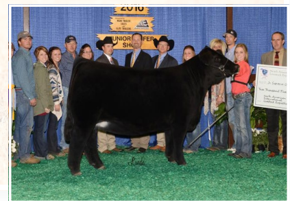
RIVERSTONE CHARMED MATERNAL GRANDAM OF LOT 17

• Lot 17 is sired by the legendary MR HOC Broker, one of the most influential breeding bulls in the history of the Simmental breed making lot 17, a ¾ sib in blood to the $120,000 JSUL 9082 Miss N6F TSSC Xclusive America. This impressive female was most notably selected as the 2024 AJSA National Classic 4th Overall Percentage Simmental Heifer for the Clark family of Oklahoma.