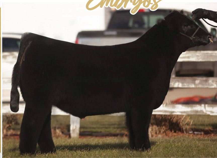
WALSH ON THE BRINK SIRE OF LOTS 16 AND 16A