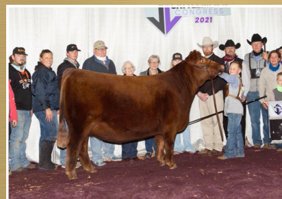
ROJAS VALENTINA 9113 (SASSY) FULL SISTER TO THE DONOR DAM OF LOTS 20, 21, AND 22