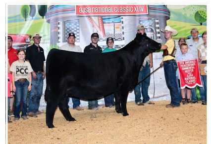
JSUL PCC DAT DARLIN 2554K MATERNAL SISTER TO LOT 15