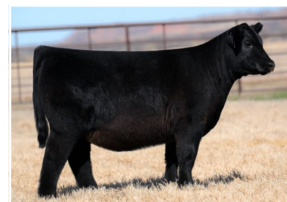
PCC SULL ELLIE 3662L $50,000 MATERNAL SISTER TO LOT 2