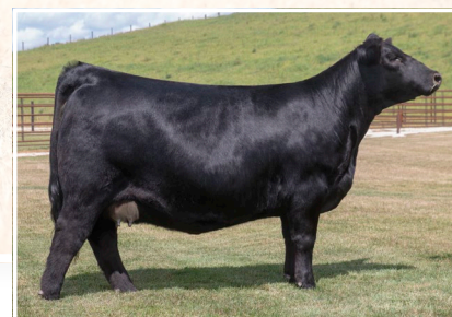
WPRF WISE LOLA MATERNAL GRANDAM OF LOT 8