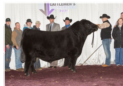
BNWZ DIGNITY 8017 SIRE OF LOT 14