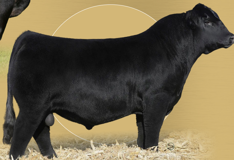
SO REMEDY 7F $530,000 SIRE OF LOT 23 EMBRYOS