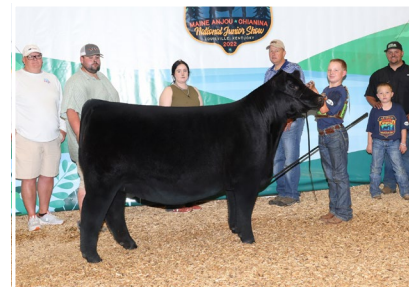
JSUL PCC FETTY'S PRIDE 1407J DAM OF LOT 19 2022 NJCS RESERVE DIVISION CHAMPION