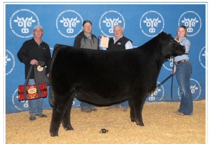
PCC EVENING TINGE 430 DAM OF LOT 3 - 2022 OYE