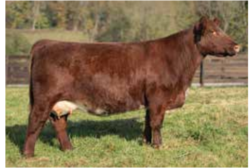
SBR Fallyn 863F