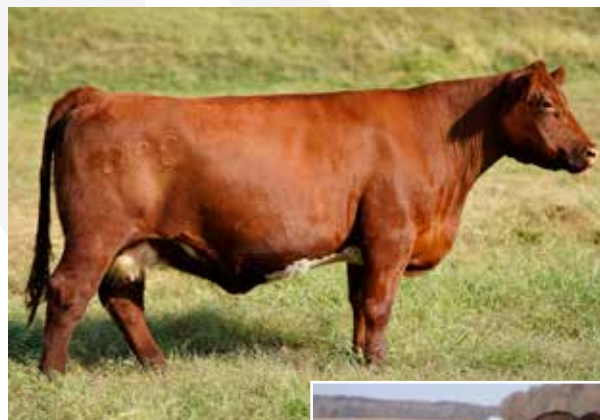
Gilman's Maystar Rosewood 39G