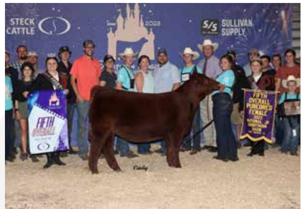
CF Mona Lisa 2117 SOL X ET