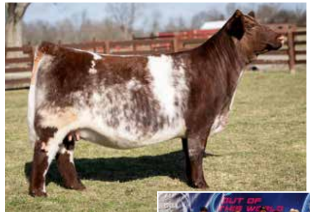
MFS Knighted Pinky The Roo 2142 ET