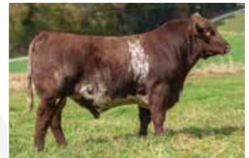
Byland Top Dog