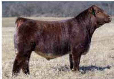
Bar N Venmo 16M