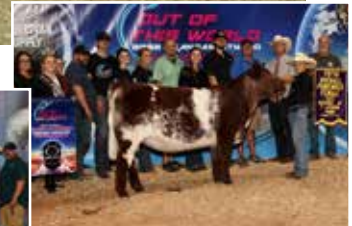
MFS Knighted Pinky The Roo 2142 ET