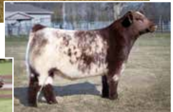
Little Cedar Look Ahead