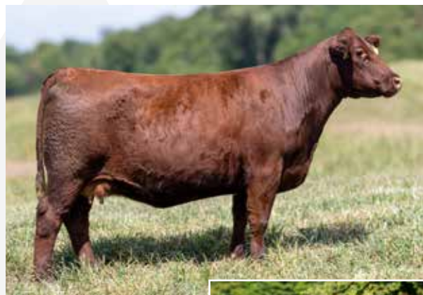
BSG Liberty Lassie 2362 of 25J ET