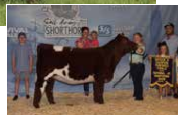
Maternal Sister to Dam