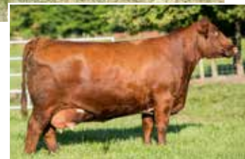
Waukaru Lassie 2024

Selling the right to one IVF cycle flush to take place Spring/Summer 2026. Guaranteed a minimum of 6 transferable embryos. Buyer responsible for all flush costs.