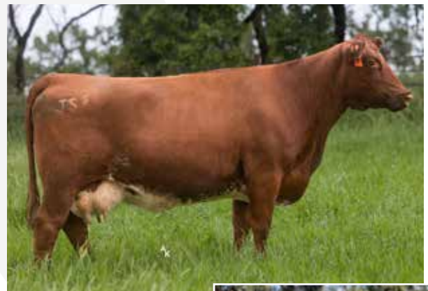
JSF Kendra 268G