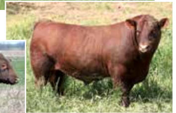
SULL Red Knight