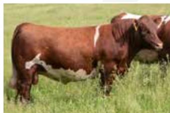
SULL Current Commodity