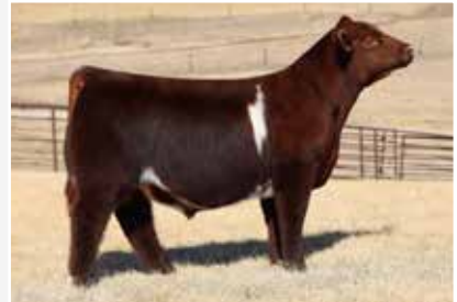
Sire - SULL Accountability