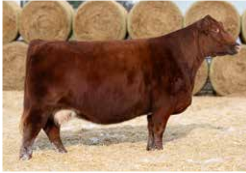
JSF Gold Rose 85C