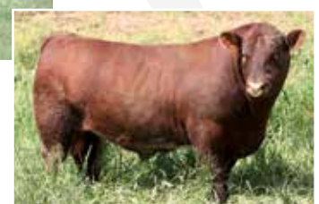
SULL Red Knight