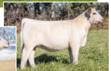
JSF Kendra 337 M

Flush to take place on or prior to 6-1-26. Buyer to pay all Flush costs. Seller guarantees 6 transferrable embryos.