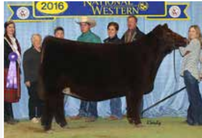
Dam - STECK Cherri C 401