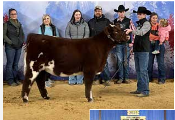
STECK WSCC Chelsie HC 247K ET