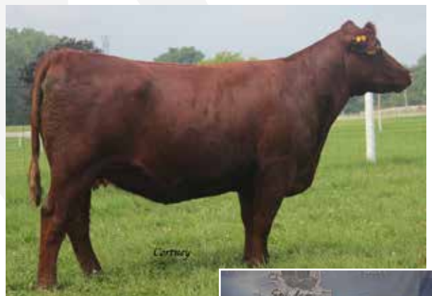
CF HHF Margie 895

CONSIGNED BY: GREENHORN CATTLE CO, DAVID: 937-470-6552 - JOSH: 937-681-1948