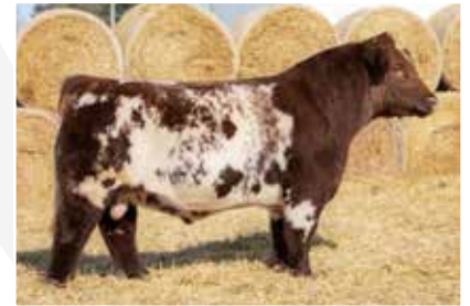
Sire - Byland Flash