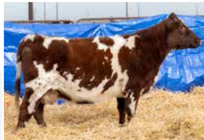
Dam - Peakview Maxa Rosa 49019