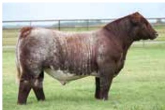
Gana My Turn

CONSIGNED BY: BYLAND, BAR N CATTLE CO, AND STEEL HILL RANCH