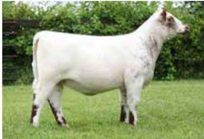
Maternal Sib to Heifer - AF VF Carrie Janes Destiny 301