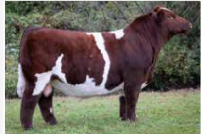
Sire - Direct Deposit