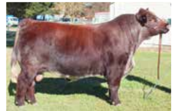
Kilkee Rising Sun F02

CONSIGNED BY: THE RISING SUN SYNDICATE (CREEKSIDE SHORTHORNS, KILKEE SHORTHORNS, COINTREAU CATTLE CO), ROCKY BISHOP: 780-385-2037