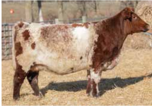
PVF Shadow 65F