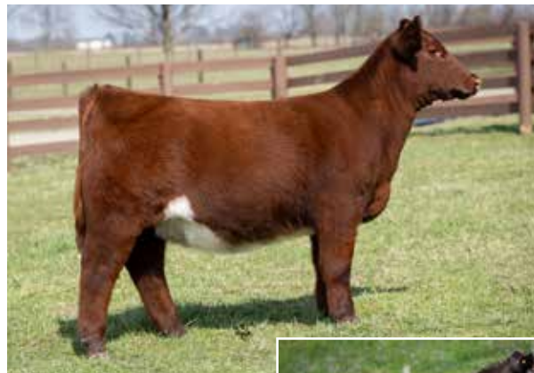
Daughter of GCC TRN Kendall Charm 65 ET

CONSIGNED BY: GREENHORN CATTLE CO, DAVID: 937-470-6552 - JOSH: 937-681-1948