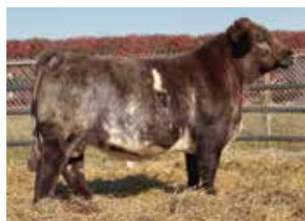
ARG Hector 1777 ET

CONSIGNED BY: PEARL VALLEY SHORTHORNS, SHAWN VACHAL: 701-840-1143