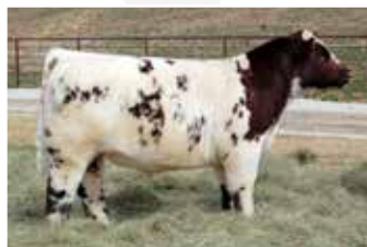
SULL Roan Blast