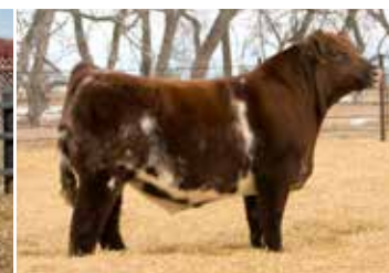
JSF Palermo 172H ET