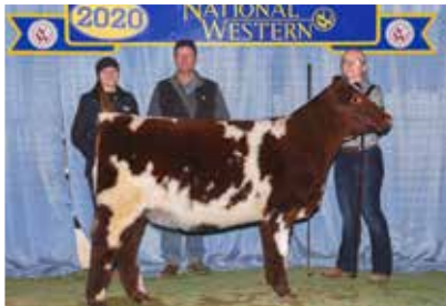
Dam as a Yearling