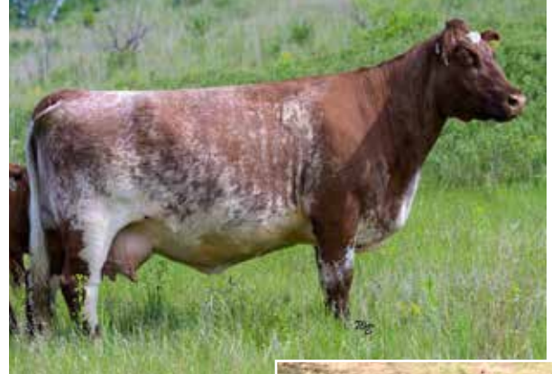
JSF Cumberland 165D