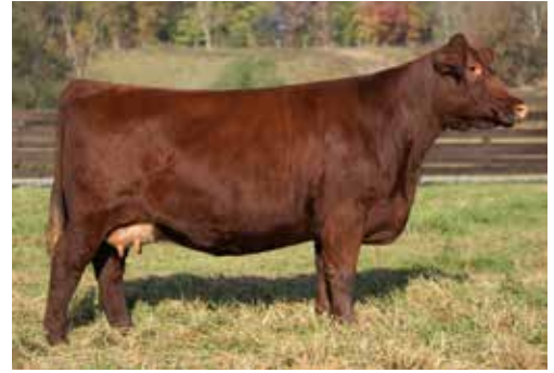
PVF Adelaide 3J