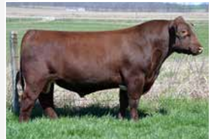
Sire - Leveldale Boardwalk 530C