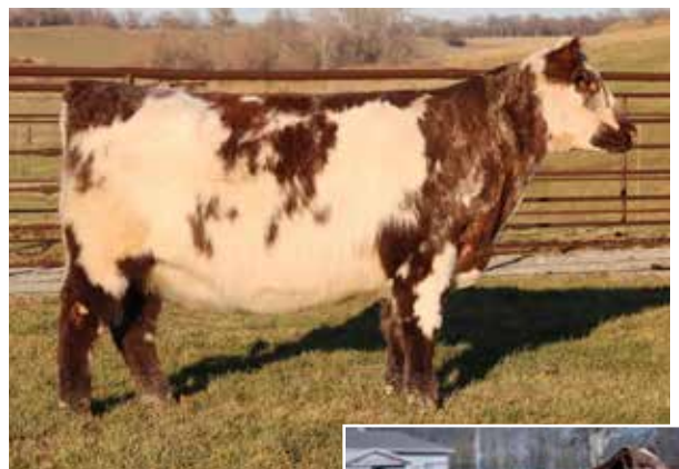
SULL Bo's Rewarding 5181C ET