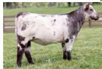
Maternal Sister to Embryos