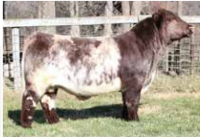
Full Sib to Dam - AF VF Fast Forward 052