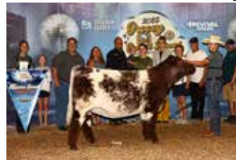
Full Sister - GCC Evolving Pinky The Roo 42