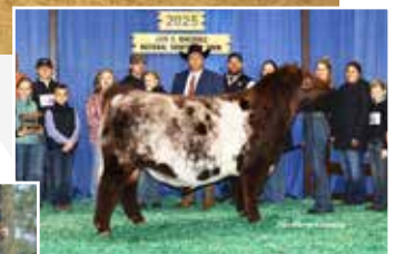
CF In Demand