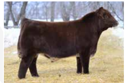
Sire - JSF Manhattan 194J ET