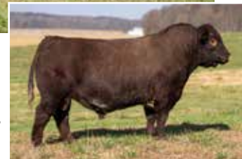
BSG Index 2072