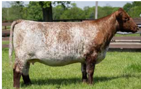
WH Max Rosa 3A ET