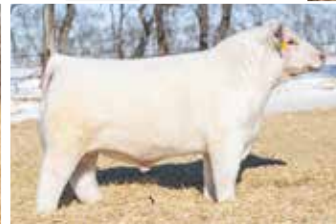
JSF White Noise