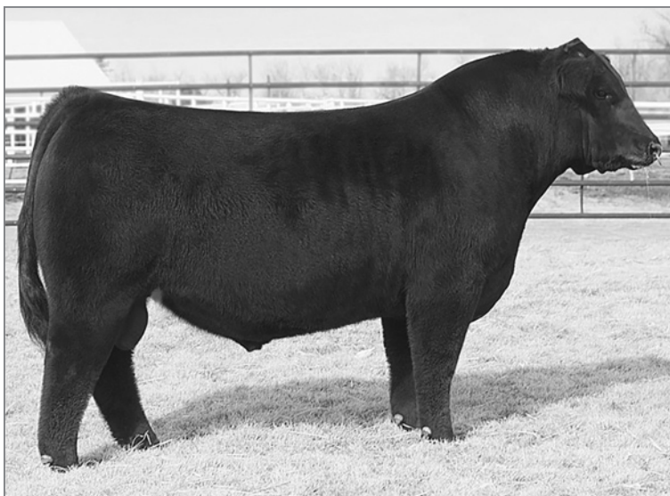
BNWZ DATA BANK 1311C ET Sire of Lot 43