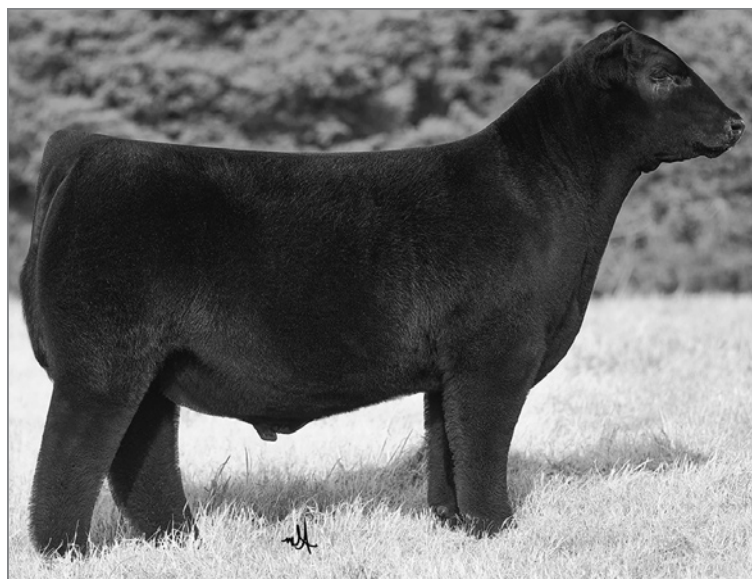
K&A PROMISE KEEPER 23K ET Sire of Lot 19