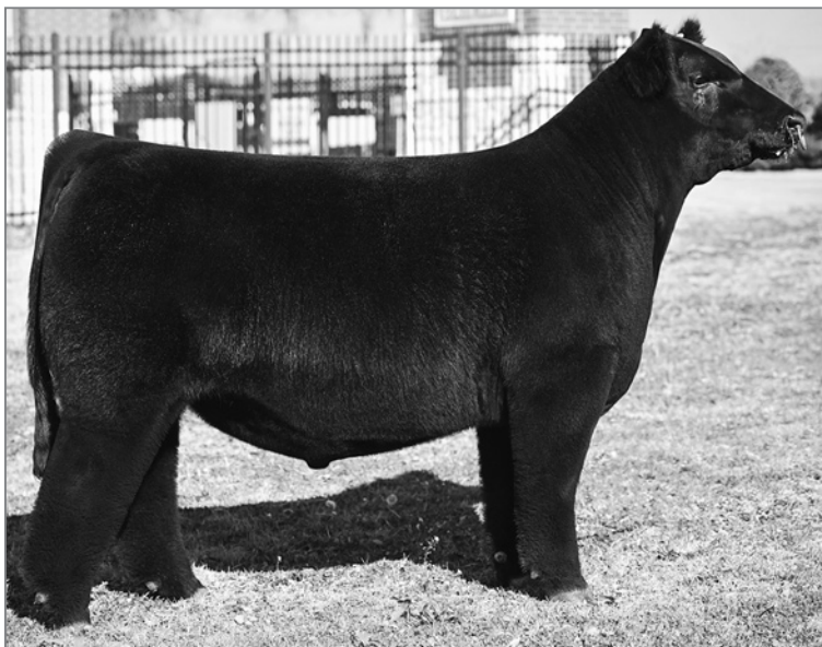
KABG TEST OF TIME 50L ET Sire of Lot 44