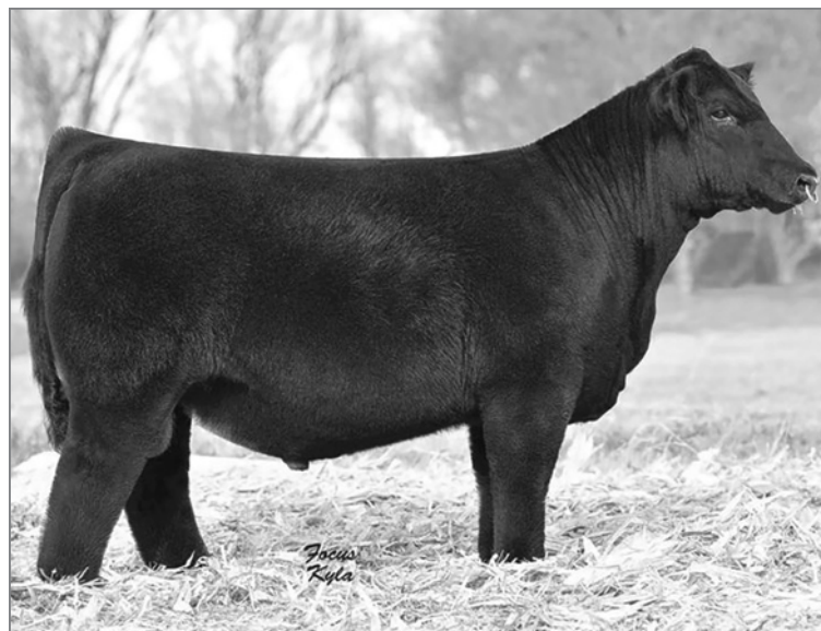
BBR MEMPHIS MAFIA 3E ET Sire of Lot 30

• Standout since day one! I'll be honest, I was hoping for a female when we put this mating in, but today I'm not complaining. This bull has never had a bad day. Extremely good on his feet and legs, great bodied, plenty of power, and awesome looking. Beth Dutton, his dam, is one of the top donors for Schaeffer Show Cattle in Indiana. She is well known for raising high sellers and winners. Big time quality. Big time individual. Big time offer.