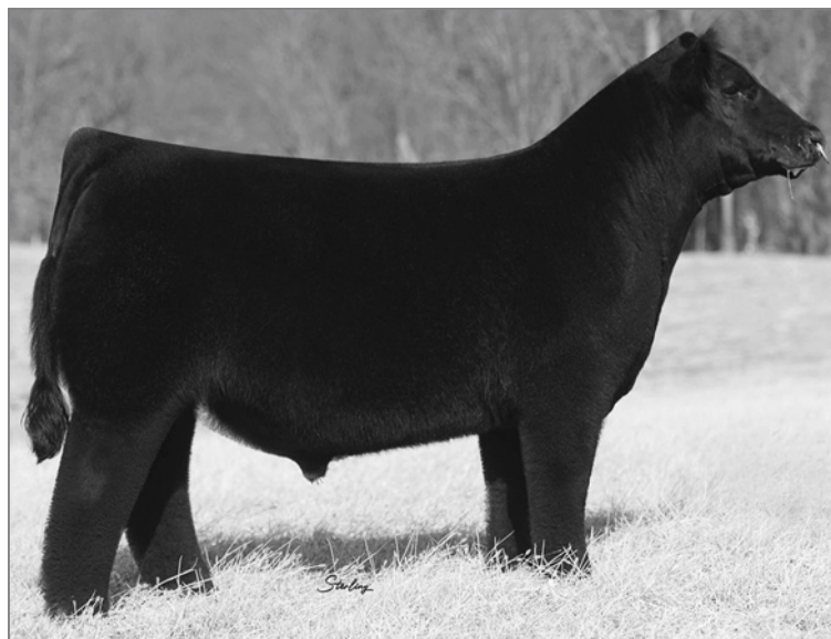
JBOY ONE FOR ALL 001J ET Sire of Lot 5