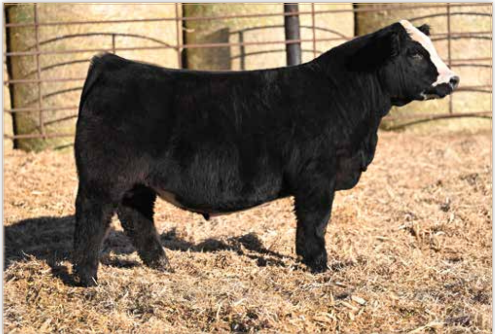
LOT 15 - LONG'S IN CHARGE N62