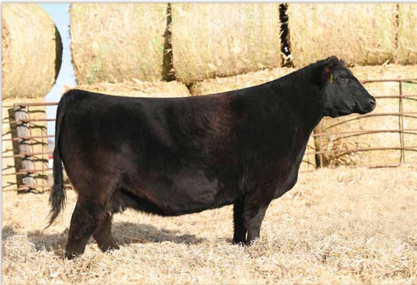
LOT 53 - LONG'S MISS PENNY