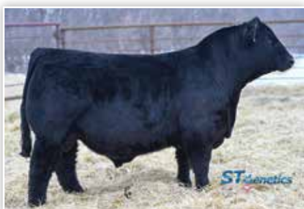
CDI TRUSTEE 387F Sire of Lot 40