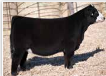
LONG'S PLAYER L148 Daughter of Lot 53

WSJ ENCORE KENCO/MF POWERLINE 204L JF FOUNDATION 8010U x LONGS COWGIRL TRIPLE C EMPRESS N3063L BAURS L925