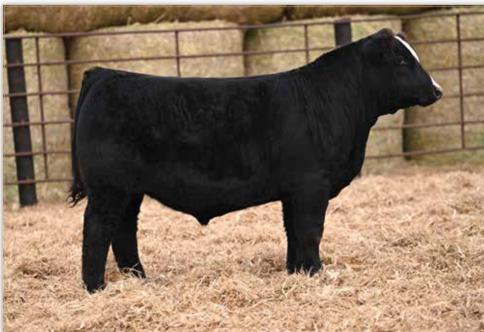
LOT 35 - LONG'S COUNTERTIME N18