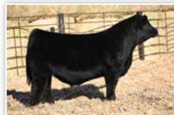
LONG'S IN CHARGE N229