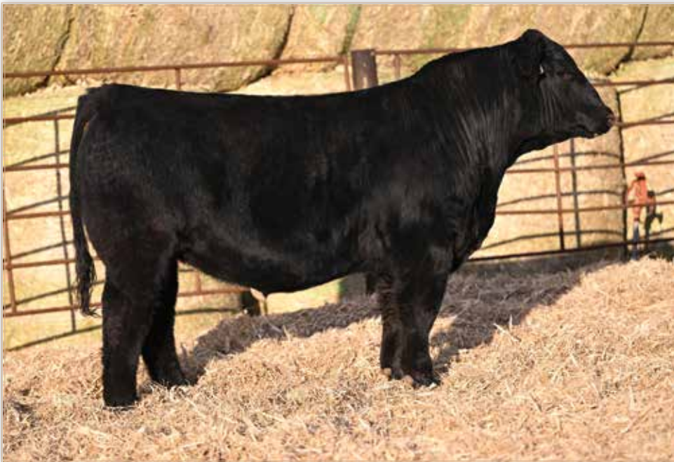
LOT 45 - LONG'S BALD EAGLE M953