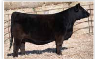
LONG'S DIAMOND K49 $70,000 Valued Dam of Lot 5 Full Sister to Lot 6