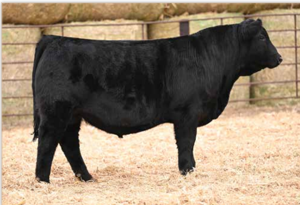
LOT 40 - LONG'S TRUSTEE N71