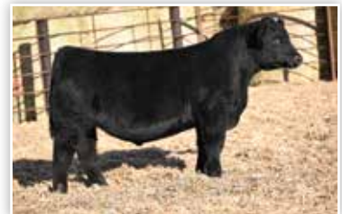
LONG'S IN CHARGE N115

Full Brother to Lots 1 & 2 He Sells as Lot 14