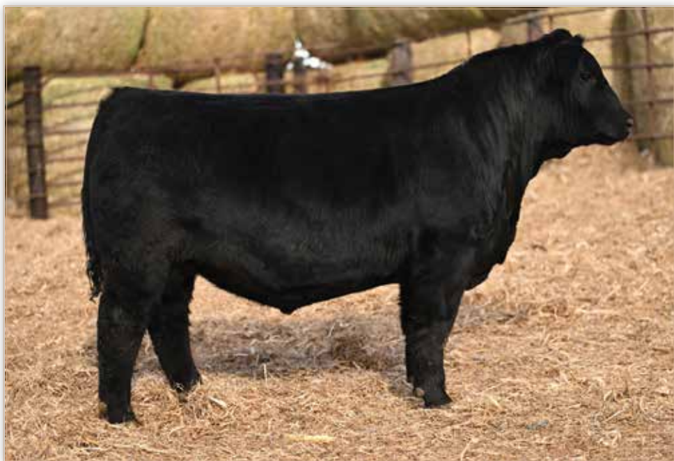
LOT 27 - LONG'S SALEM N1