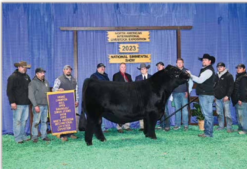
WHF/JS/CCS WOODFORD J001 2023 NAILE Grand Champion Percentage Simmental Bull Sire of Lot 8B