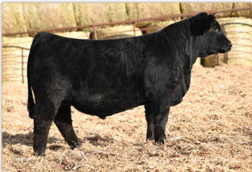
LOT 19 - LONG'S IN CHARGE N57