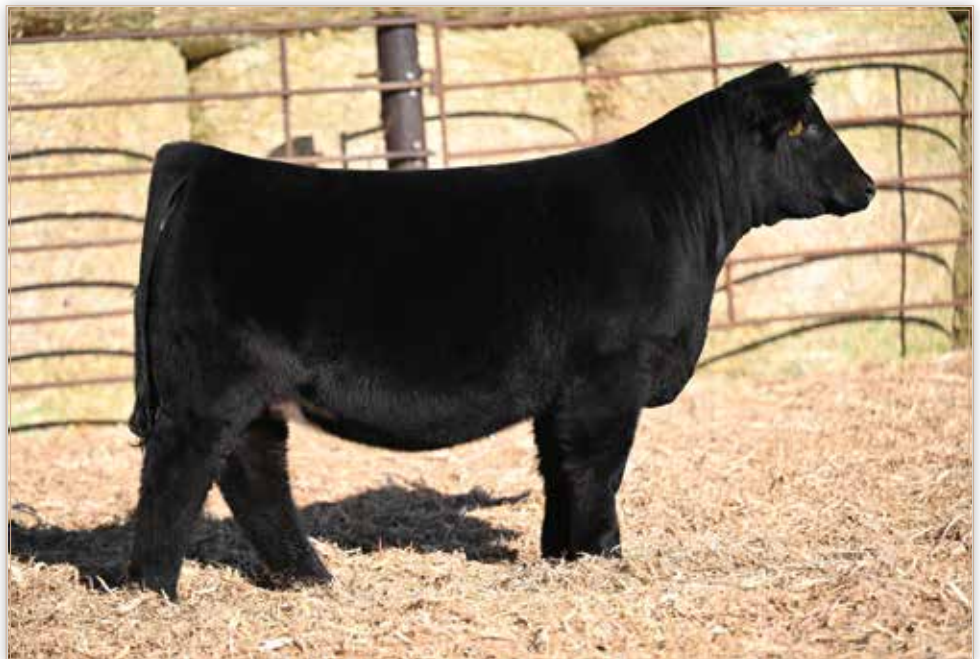
LOT 4 - LONG'S IN CHARGE N39