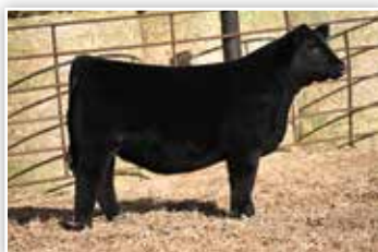
LONG'S IN CHARGE N829