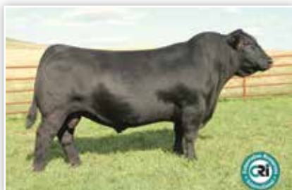
S A V RENOWN 3439 Maternal Grandsire of Lot 49