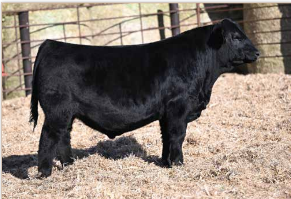
LOT 28 - LONG'S SALEM N5