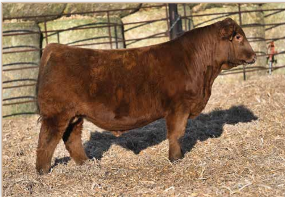
LOT 42 - LONG'S HONOR GUARD N29