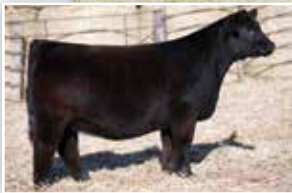
LONG'S SAM L910