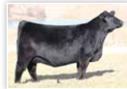
LONG'S CARMEN Dam of Lots 54-60