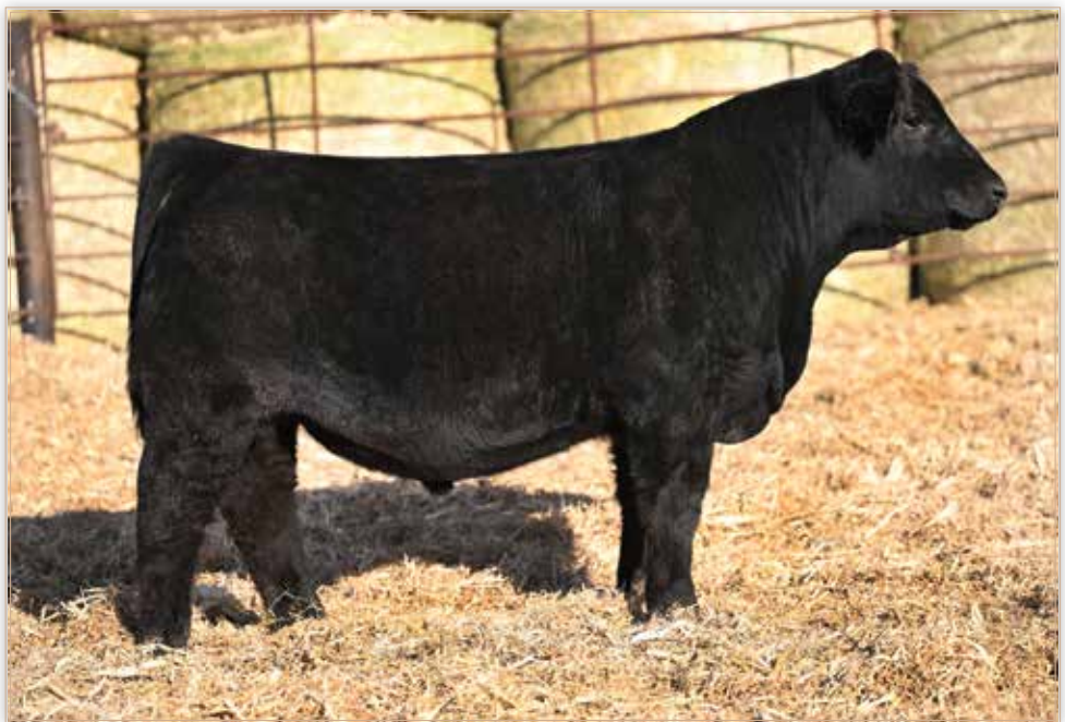
LOT 16 - LONG'S IN CHARGE N66