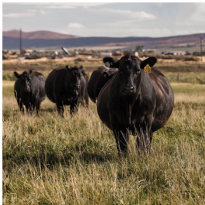
Crossbreeding is one of the most valuable tools for increasing productivity without increasing input costs.

Birth weight is as frequently discussed as mature cow size, and is another important factor in optimizing productivity. There are several EPD associated with birth, including calving ease direct, calving ease maternal, and birth weight. Calving ease direct predicts the probability of a first-calf heifer experiencing dystocia; calving ease maternal predicts the probability of first-calf daughters experiencing dystocia; and birth weight predicts the calf's weight compared to the breed average.