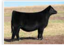
LONG'S STYLE L825 $20,000 Full Sister to Lots 54 & 55