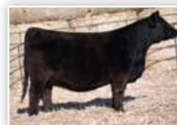
LONG'S DIAMOND K49 $70,000 Valued Maternal Sister to Lot 9