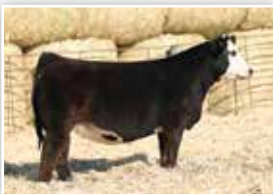
LONG'S J319 Dam of Lot 61