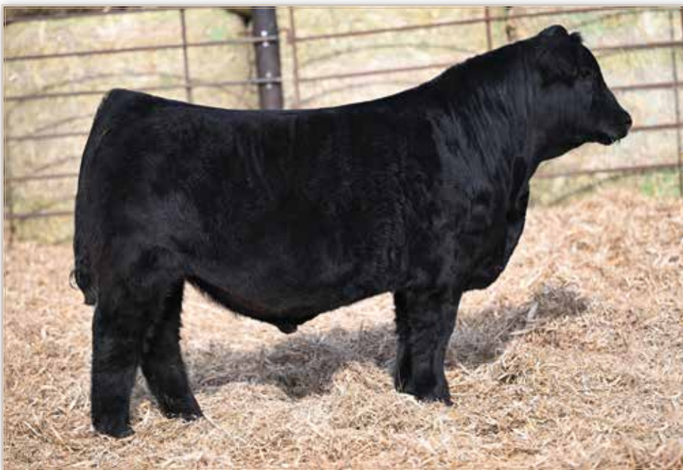
LOT 10 - LONG'S INTIMIDATOR N52