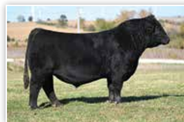
W/C INTIMIDATOR 553K Sire of Lots 9-12