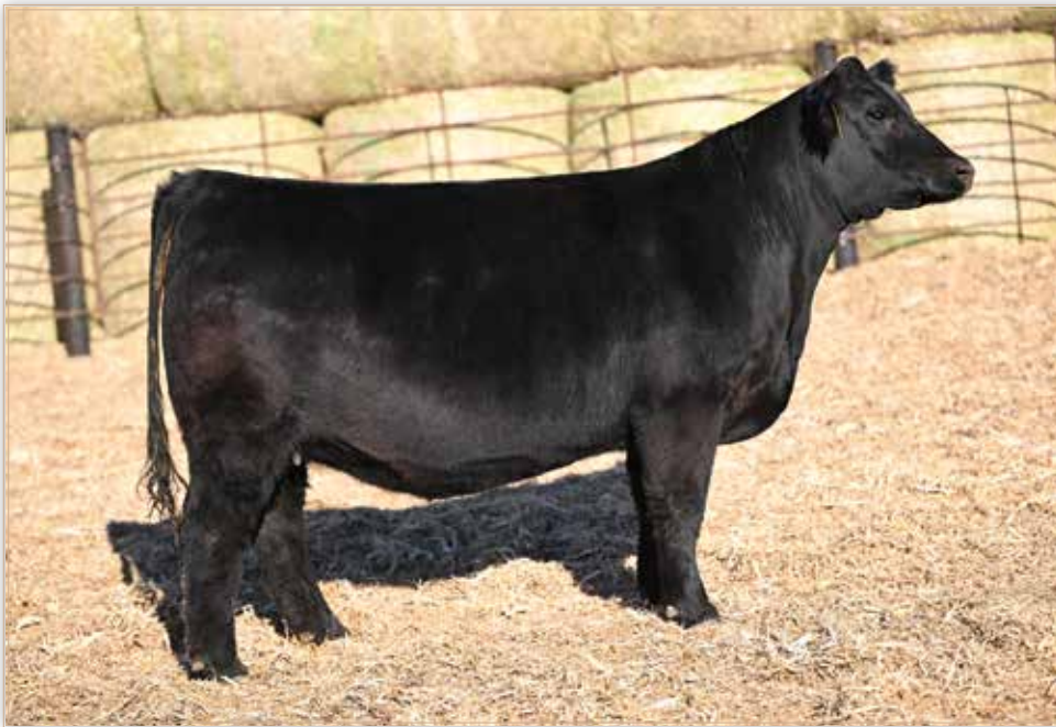
LOT 54 - LONG'S STYLE L017