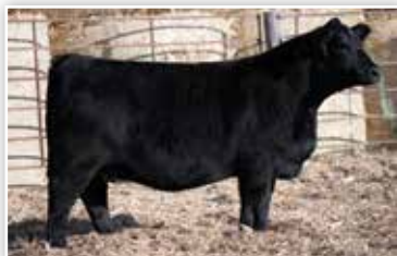
SFI MISS ROAD BOSS K1H Dam of Lot 19