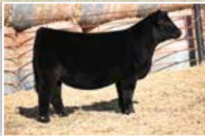
LONG'S REMEDY M418