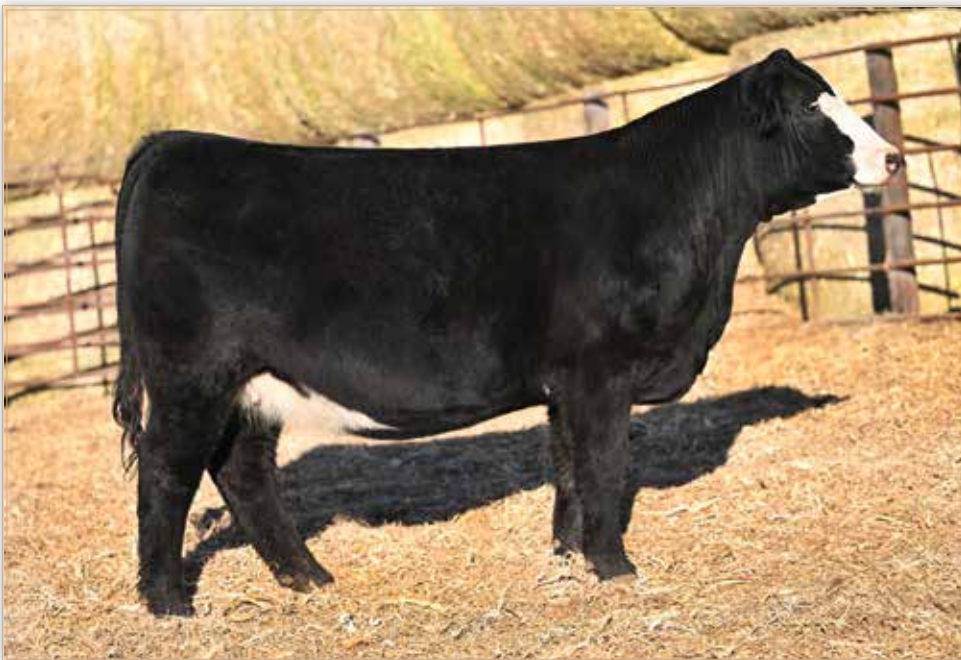
LOT 71 - LONG'S OUTLAW M78