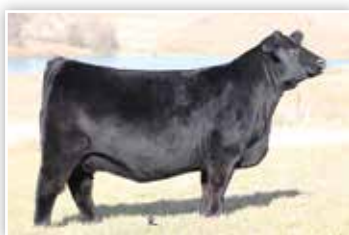
LONG'S CARMEN Maternal Granddaughter of Lot 53