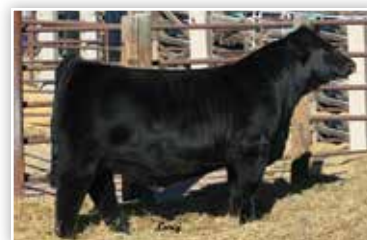
LONGS PAY THE MAN Maternal Grandsire of Lot 22