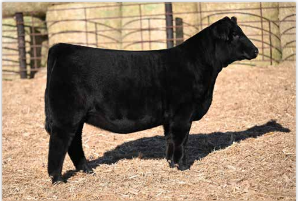
LOT 3 - LONG'S NEXT LEVEL N22