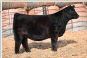
LONG'S SAM M632