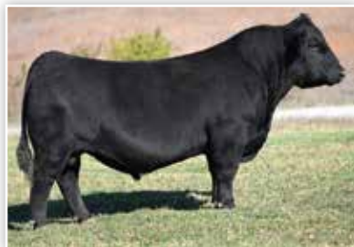
SFI LONGS IN CHARGE K28