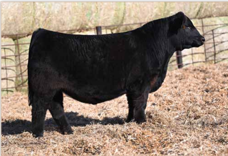
LOT 9 - LONG'S INTIMIDATOR N21