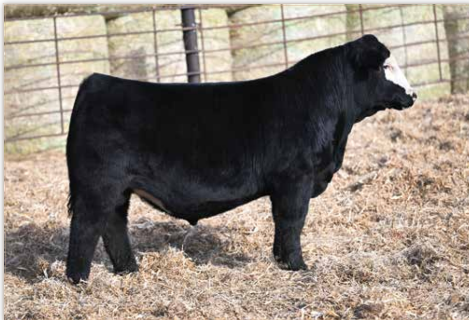
LOT 21 - LONG'S SALEM N67