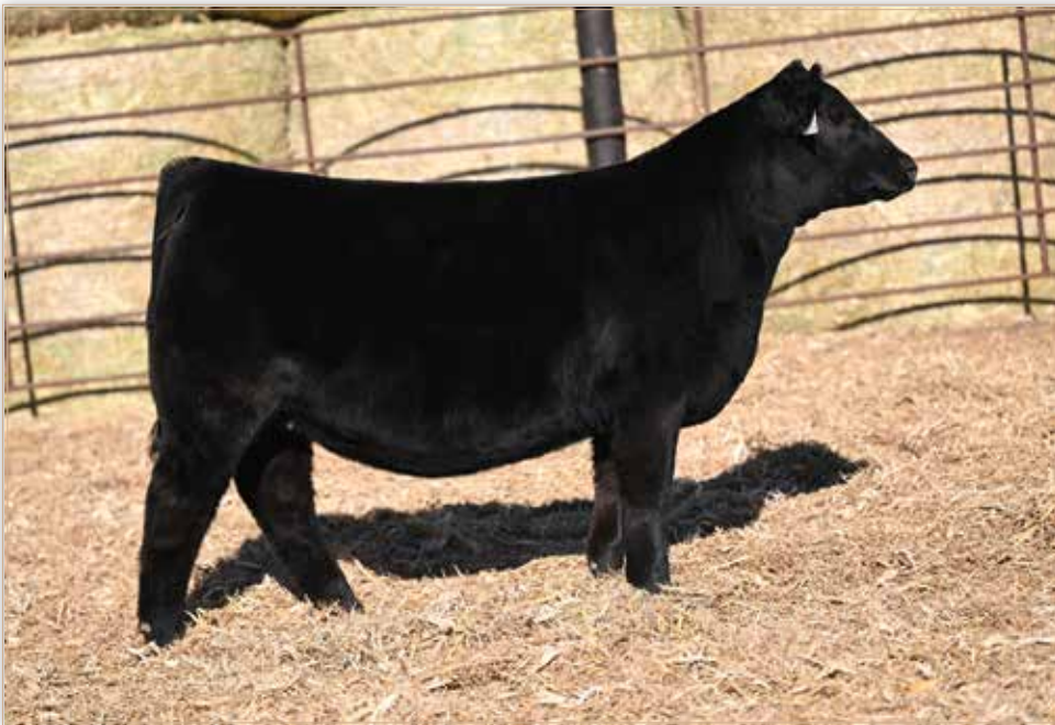
LOT 6 - LONG'S EPIC N038