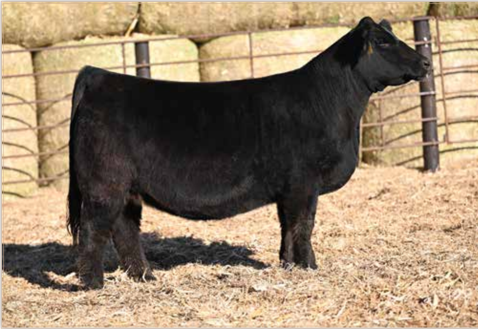
LOT 66 - LONG'S/TSC IN CHARGE M250