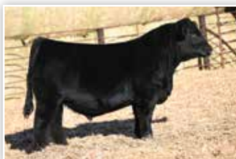
LONG'S IN CHARGE N409