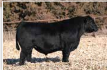
BRIDLE BIT RECHARGE K256 Sire of Lot 52A Embryos