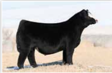
NEXT LEVEL Sire of Lot 3