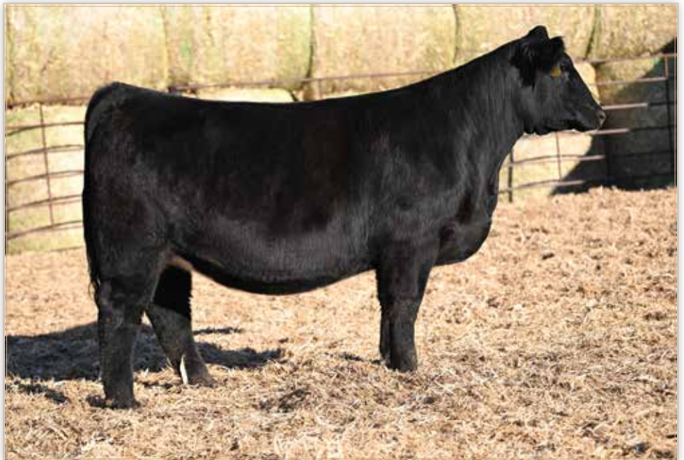
LOT 57 - LONG'S REMEDY M410