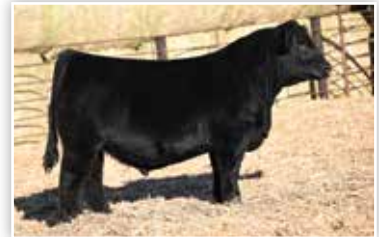
LONG'S IN CHARGE N409

Full Brother to Lots 1 & 2 He Sells as Lot 13