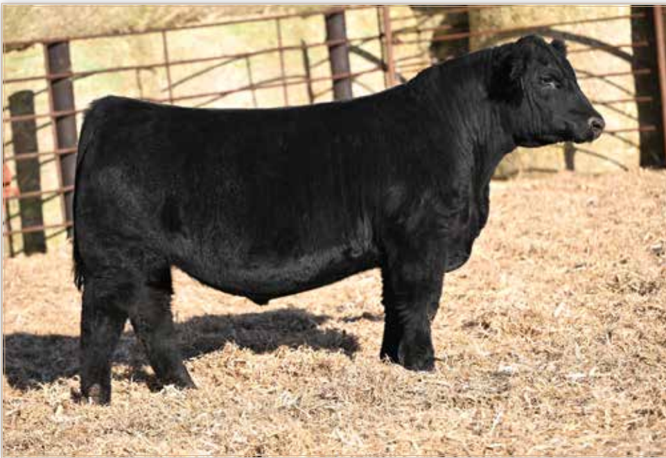
LOT 14 - LONG'S IN CHARGE N115