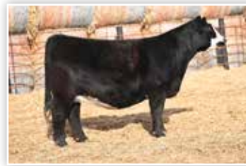
LONG'S PLAYER L784 Daughter of Lot 53