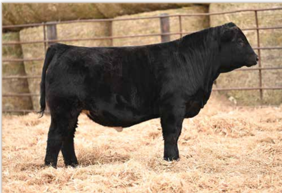
LOT 24 - LONG'S SALEM N56