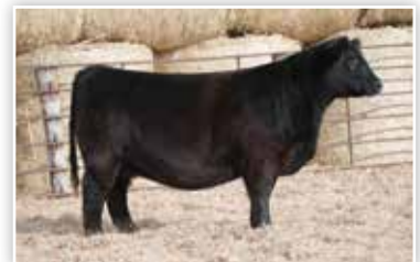
LONGS F12 Dam of Lot 6 She Sells as Lot 51

5 LONG'S/TSC PRIVATE STOCK N50 Reg: 4593374 DOB: 2/7/25 Tattoo: N50 PB SM Adj. BW: 77 • Adj. WW: 673 • Homozygous Polled • Homozygous Black