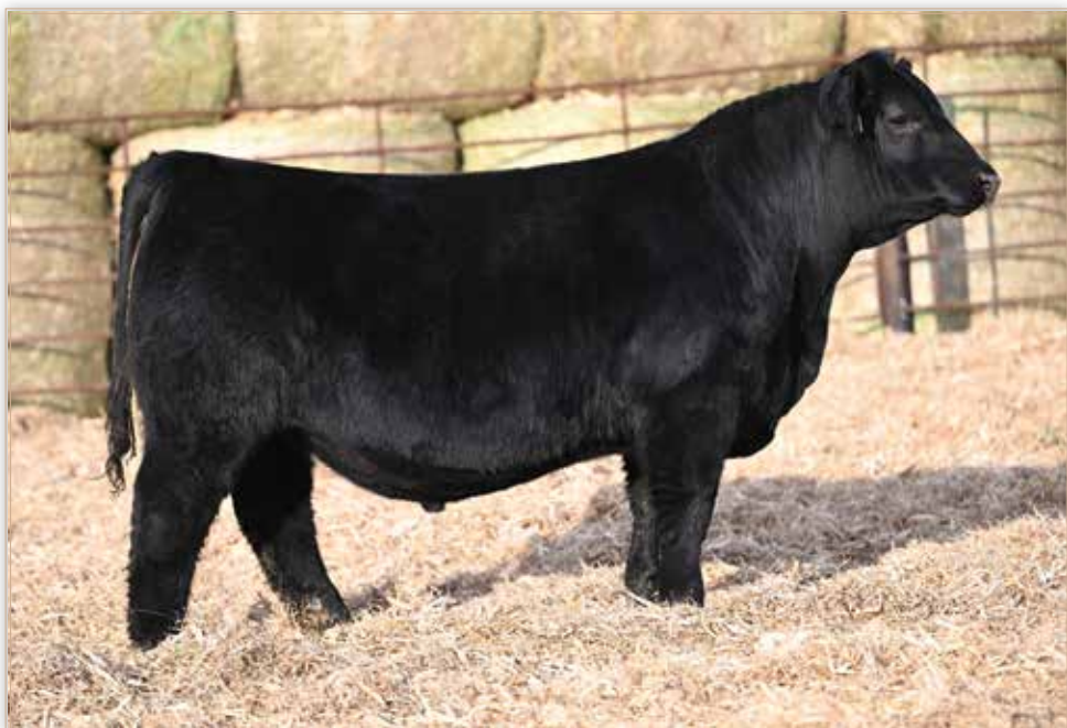
LOT 50 - LONG'S GLACIER N2