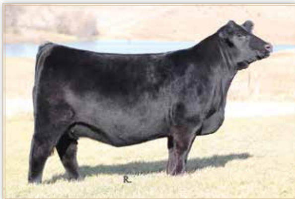
DONOR - LONG'S CARMEN