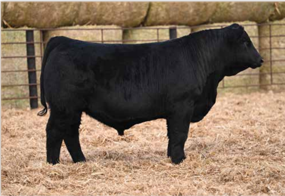
LOT 25 - LONG'S SALEM N14