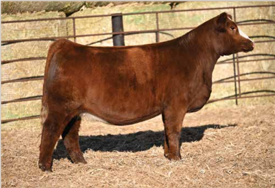
LOT 63 - LONG'S PAY TO PLAY M52