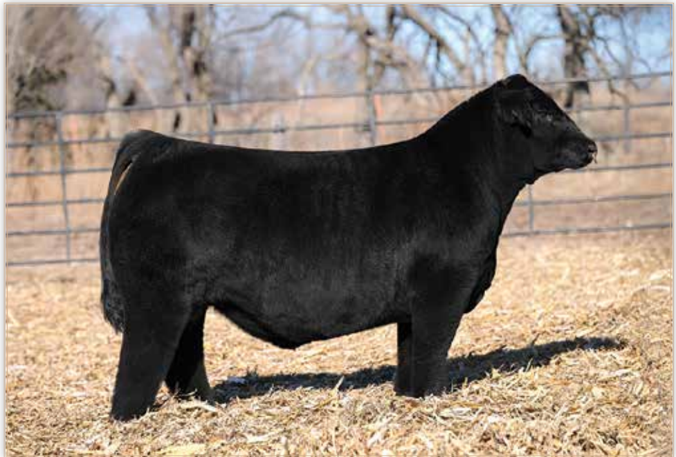
BOWJ MANIFEST 985M $280,000 Sire of Lot 8D