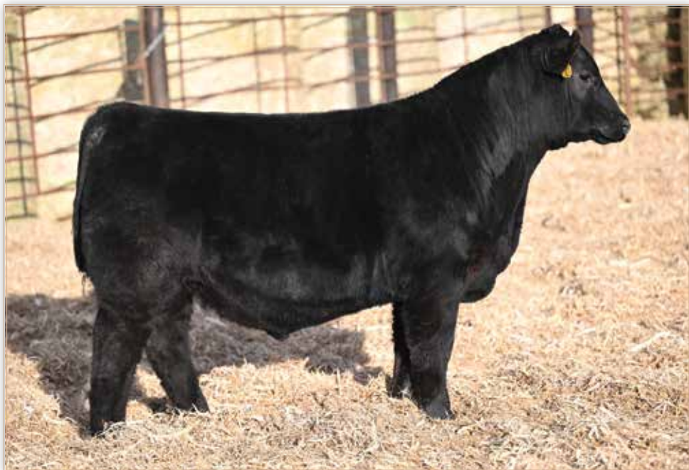
LOT 49 - LONG'S GLACIER N19