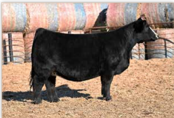
DONOR - LONG'S COUNTERTIME L794