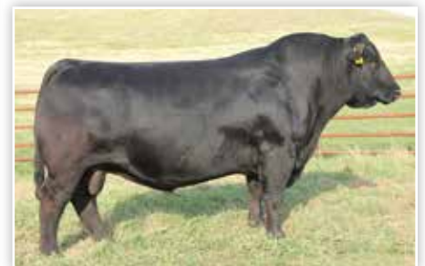
S A V PLATINUM 0010 Maternal Grandsire of Lot 38