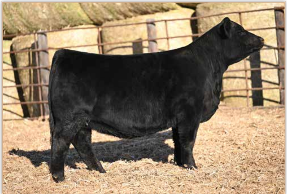
LOT 65 - LONG'S REST EASY M47