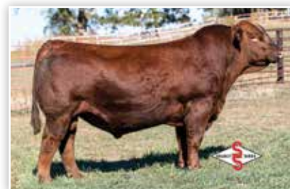
CDI/NF HONOR GUARD 267H Sire of Lots 41-43