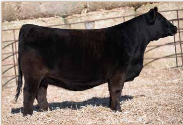
LONG'S DIAMOND K49 - Dam of Lot 73 Embryos