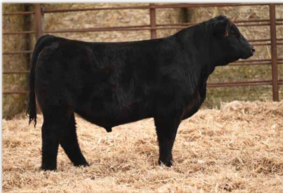
LOT 32 - LONG'S SALEM N81