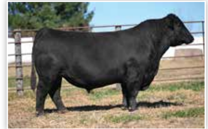
CONLEY GLACIER 295