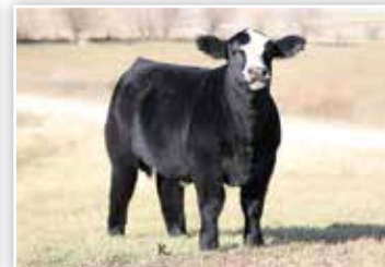
LONG'S CAME TO PLAY Son of Lot 53