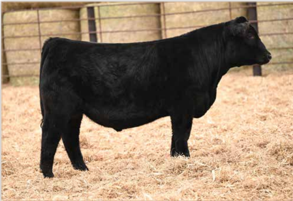
LOT 38 - LONG'S COUNTERTIME N1

"Really good calves are from the really good cows! The SS Cardinal N166 bull calf is by ES King Cardinal LD127 and out of Long's J66, the bred that we bought from you sired by Hook's Full Figures 11F." - Bill Stamp, NE