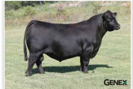
STEVENSON TURNING POINT Maternal Grandsire of Lot 70