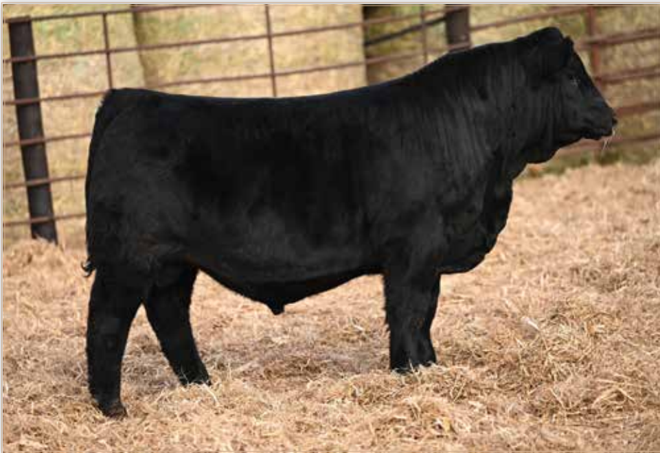
LOT 26 - LONG'S SALEM N17