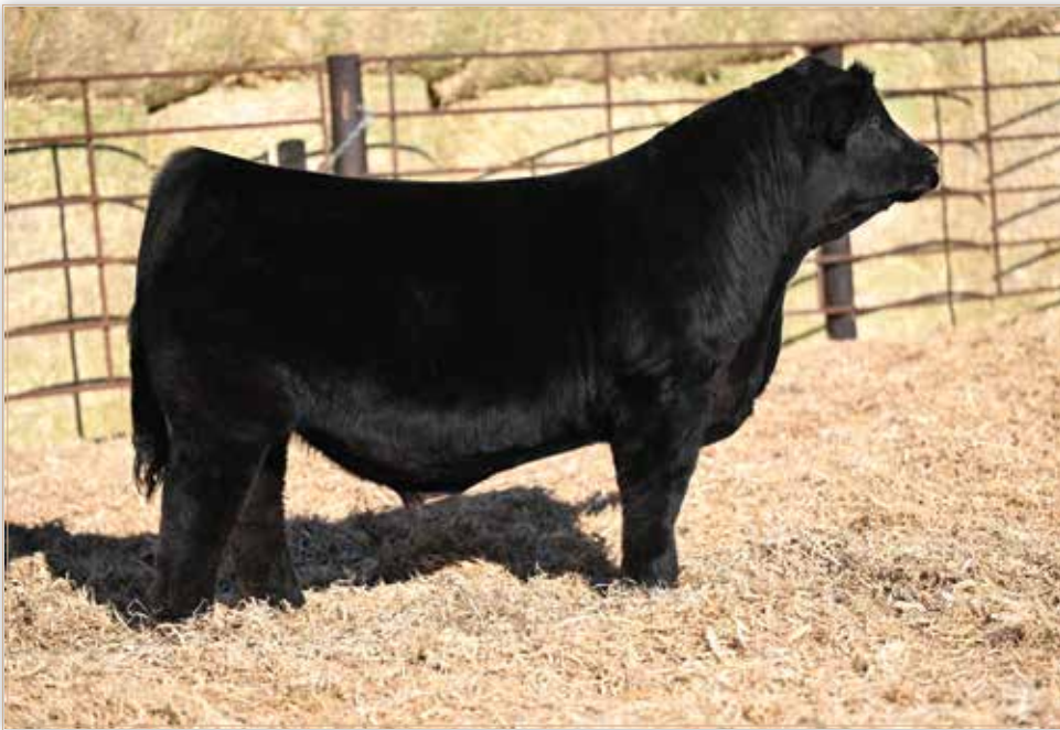
LOT 17 - LONG'S IN CHARGE N229