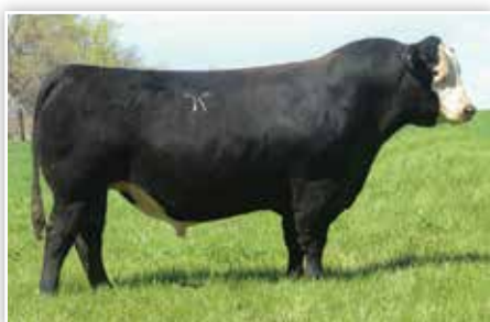
KSU BALD EAGLE 53G Maternal Grandsire of Lots 27 & 28