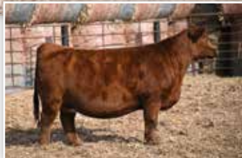
LONG'S LOVERBOY H5 $17,000 Daughter of Lot 51