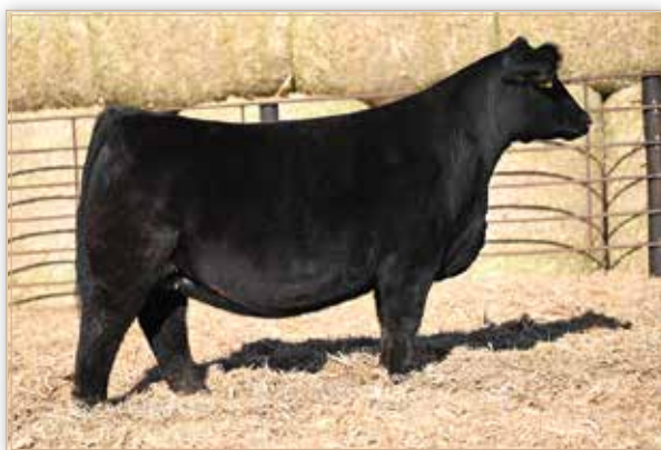
DONOR - LONG'S MOLLY M6