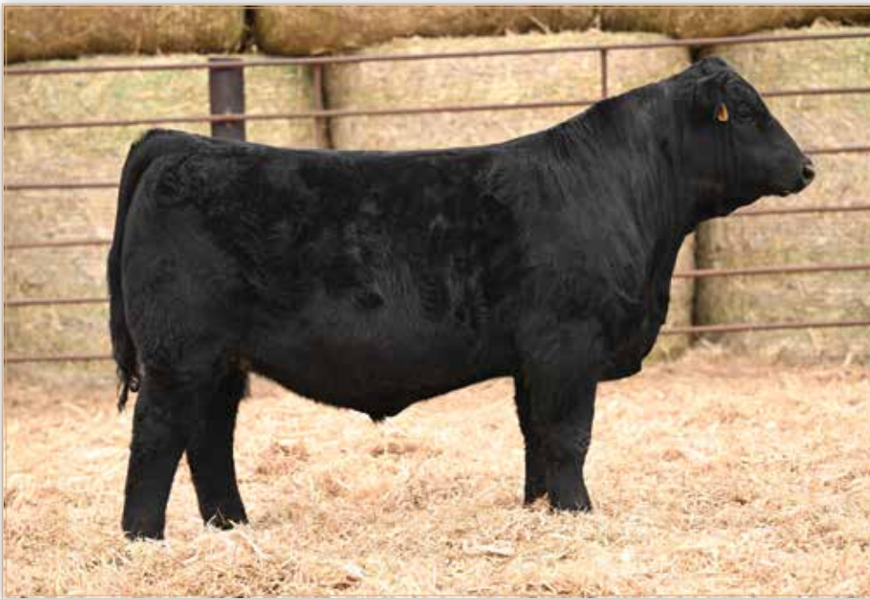
LOT 44 - LONG'S OUTLAW N73