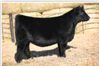
LONG'S IN CHARGE N429