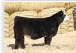
LONG'S J570 Maternal Sister to Lots 54-60