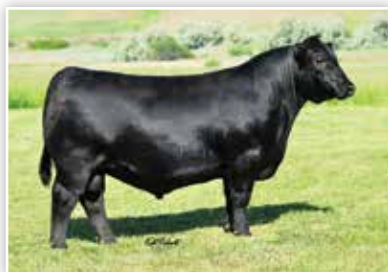
MUSGRAVE SKY HIGH 1535