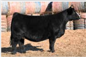
LONG'S LUCY L794