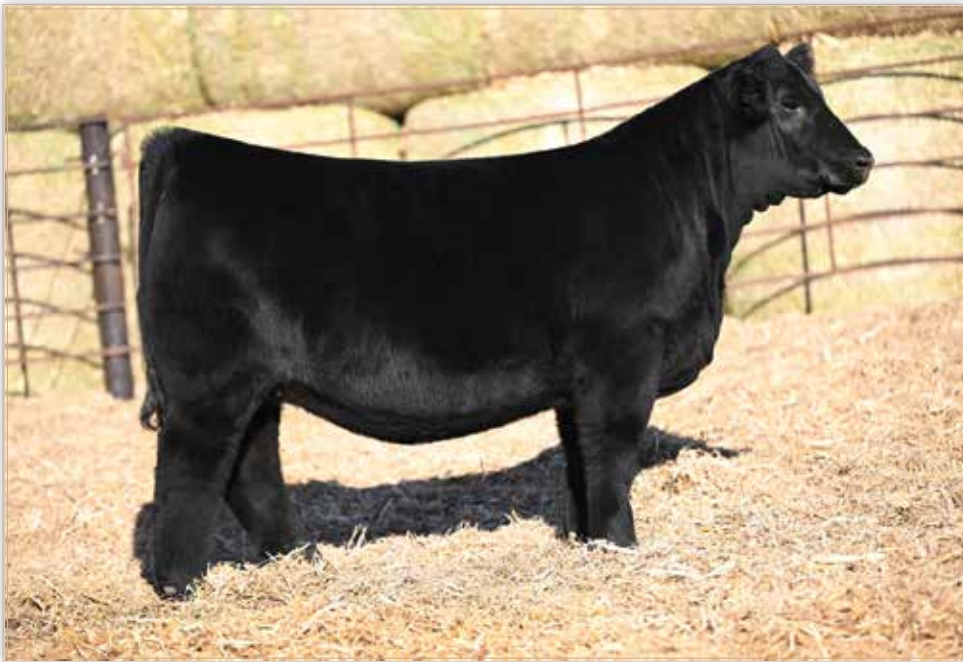
LOT 1 - LONG'S IN CHARGE N429