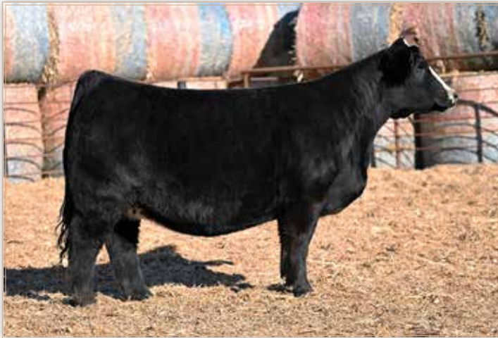
LONG'S LUCY L794 - Dam of Lot 72 Embryos