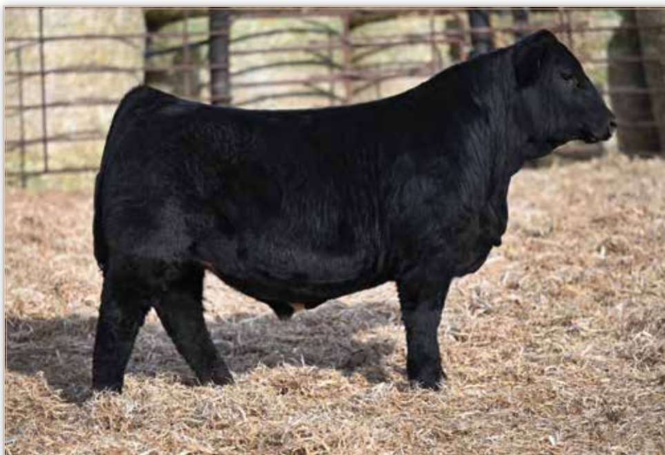
LOT 23 - LONG'S SALEM N38