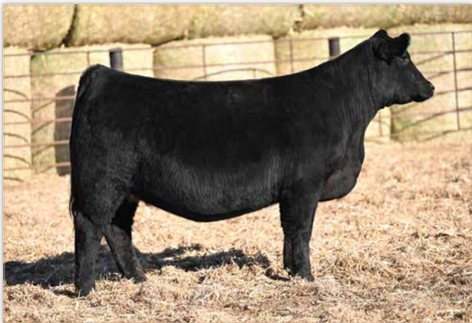
LOT 69 - LONG'S IN CHARGE M101