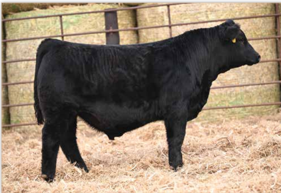
LOT 29 - LONG'S SALEM N15