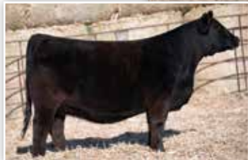
LONG'S DIAMOND K49 $70,000 Daughter of Lot 51