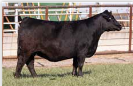
MOORE MS ELI 86J Dam of Lot 35