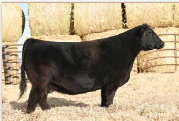
DONOR - LONG'S MISS PENNY