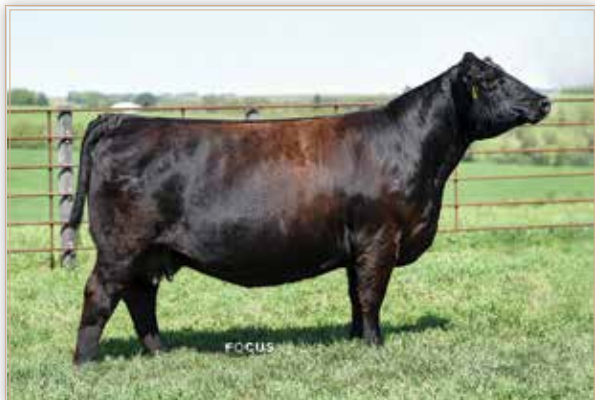
DONOR - LONG'S LILA