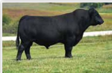
WINC OUTLAW 015H Maternal Grandsire of Lot 11