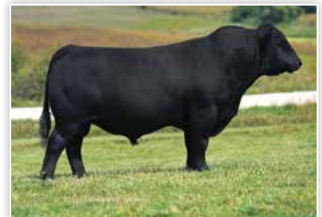
WINC OUTLAW 015H Sire of Lot 71