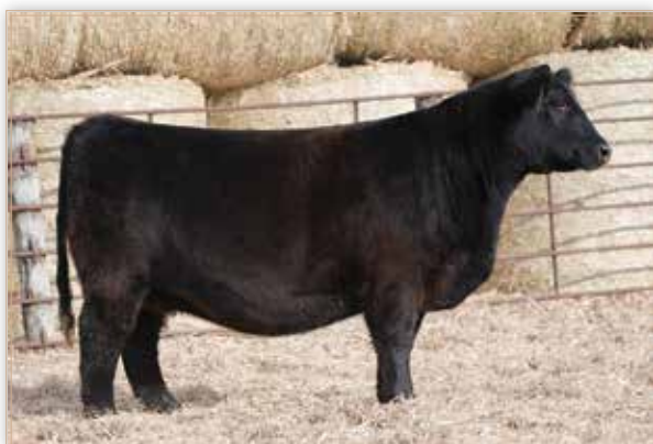
DONOR - LONG'S F12