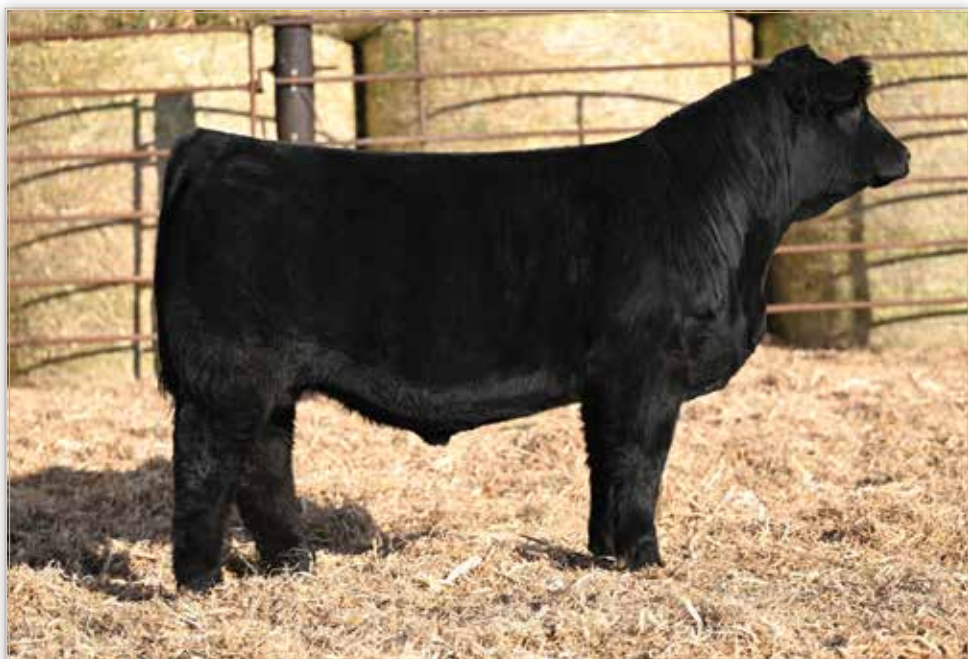
LOT 20 - LONG'S IN CHARGE N55