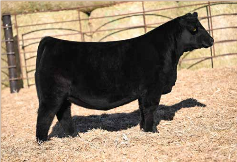
LOT 5 - LONG'S/TSC PRIVATE STOCK N50