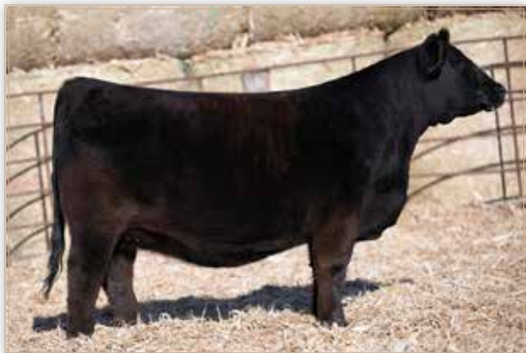
DONOR - LONG'S EPIC K49