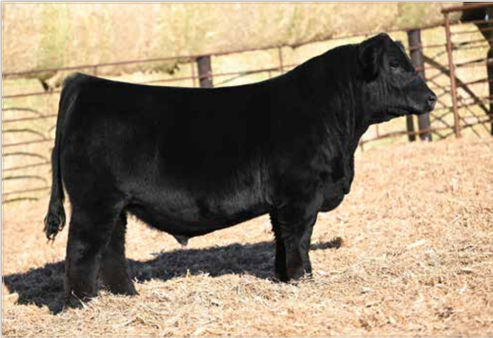
LOT 13 - LONG'S IN CHARGE N409