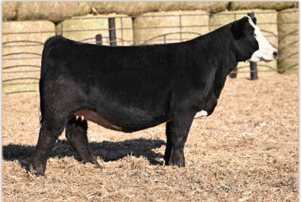
LOT 61 - LONG'S SALEM M63