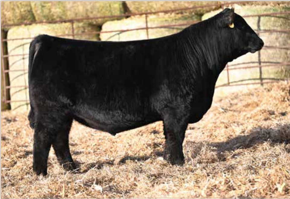
LOT 47 - LONG'S GLACIER N7