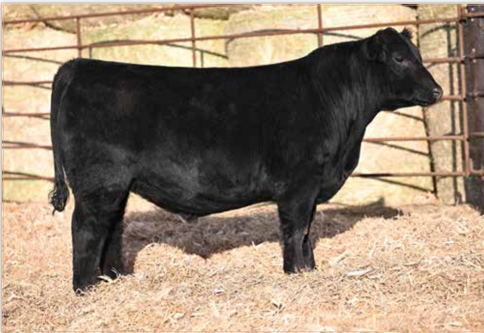
LOT 48 - LONG'S GLACIER N11