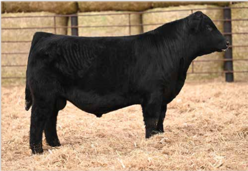
LOT 37 - LONG'S COUNTERTIME N12