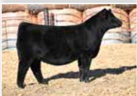
LONG'S RESOURCE M19 Maternal Sister to Lot 4