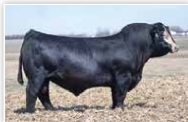
MR SR MIC DROP G1534 Maternal Grandsire of Lot 23