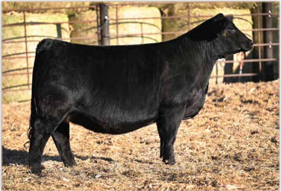
LOT 64 - LONG'S REST EASY M49

"The bred heifer we bought had a 74-pound heifer calf. She is a great mother. Couldn't be happier with both! Hope I can make it to your next sale, absolutely love their phenotype!" - Doug Nichols, OH