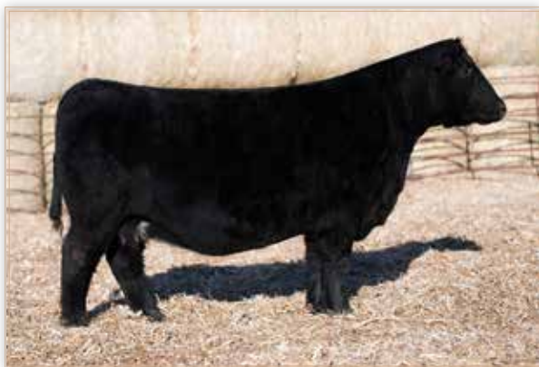
DONOR - LONG'S B28