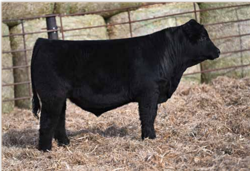
LOT 12 - LONG'S INTIMIDATOR N20