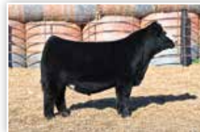
LONG'S COUNTERTIME M30