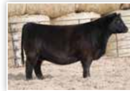
LONGS F12 Dam of Lot 17