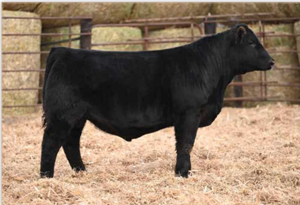
LOT 39 - LONG'S COUNTERTIME N20