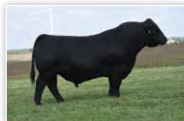
ES/LONGS SALEM HW46-1 Sire of Lots 21-32