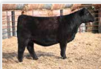
LONG'S EO L47 $17,000 Daughter of Lot 53