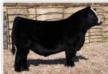
LONG'S COUNTERTIME L670