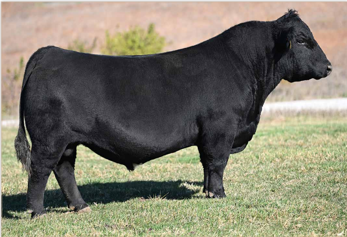
LOT 46 - SFI LONGS IN CHARGE K28