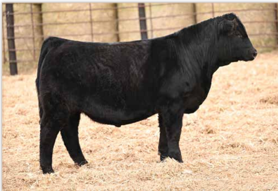
LOT 30 - LONG'S SALEM N43