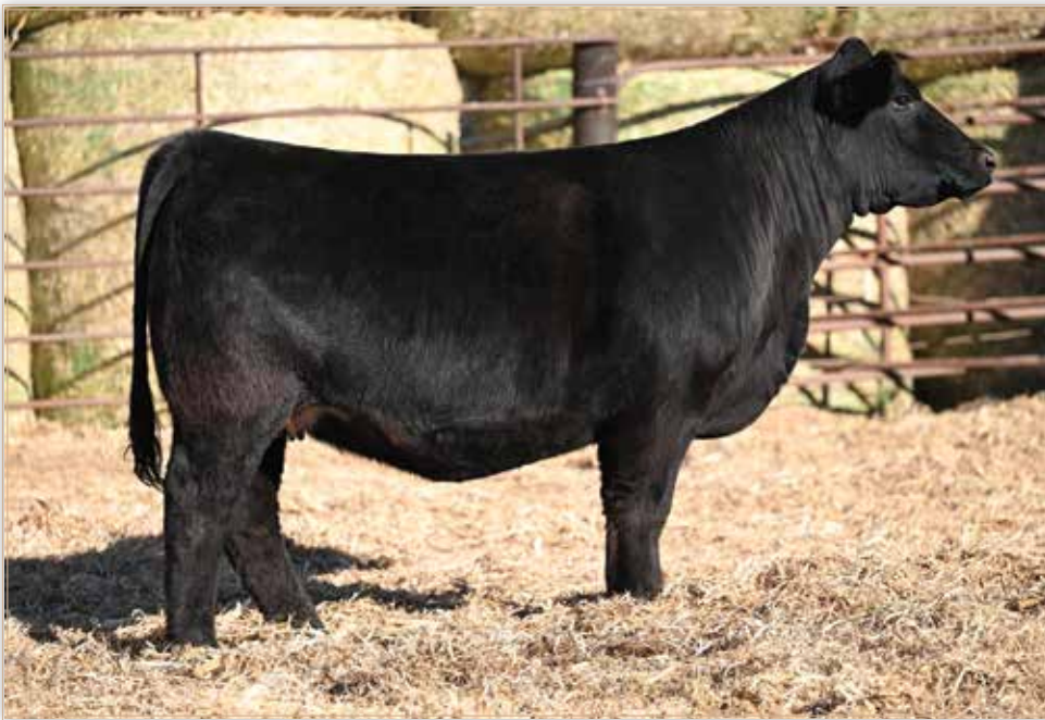
LOT 70 - LONG'S IN CHARGE M111