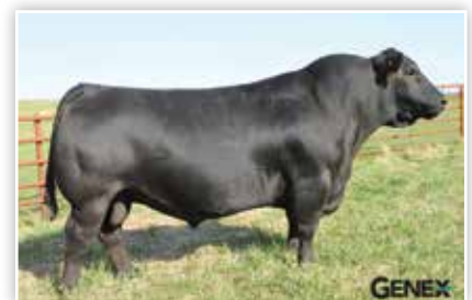
S A V RESOURCE 1441