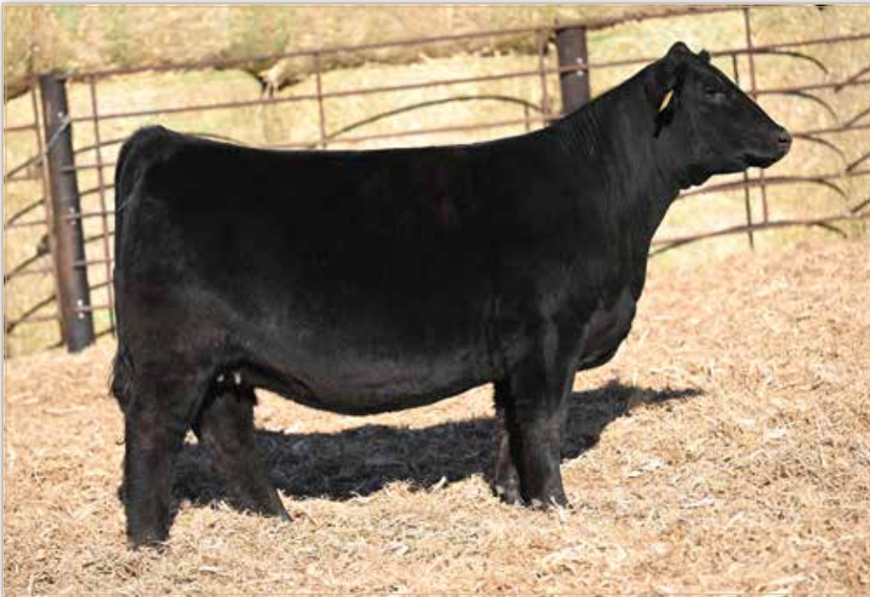
LOT 67 - LONG'S IN CHARGE M59