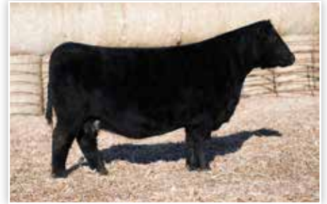
LONG'S B28 Dam of Lot 25