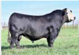
LCDR PATRIOT 8K Sire of Lot 60