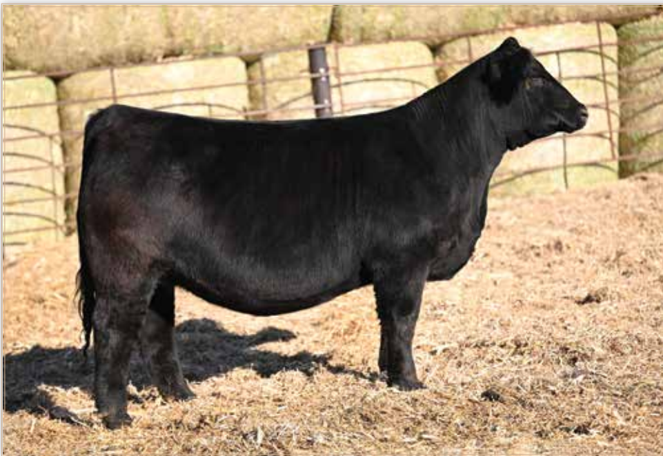
LOT 59 - LONG'S NEXT LEVEL M934