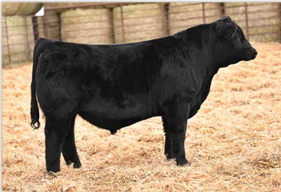
LOT 33 - LONG'S COUNTERTIME N6