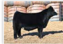
LONG'S COUNTERTIME M30 Full Brother to Lot 58