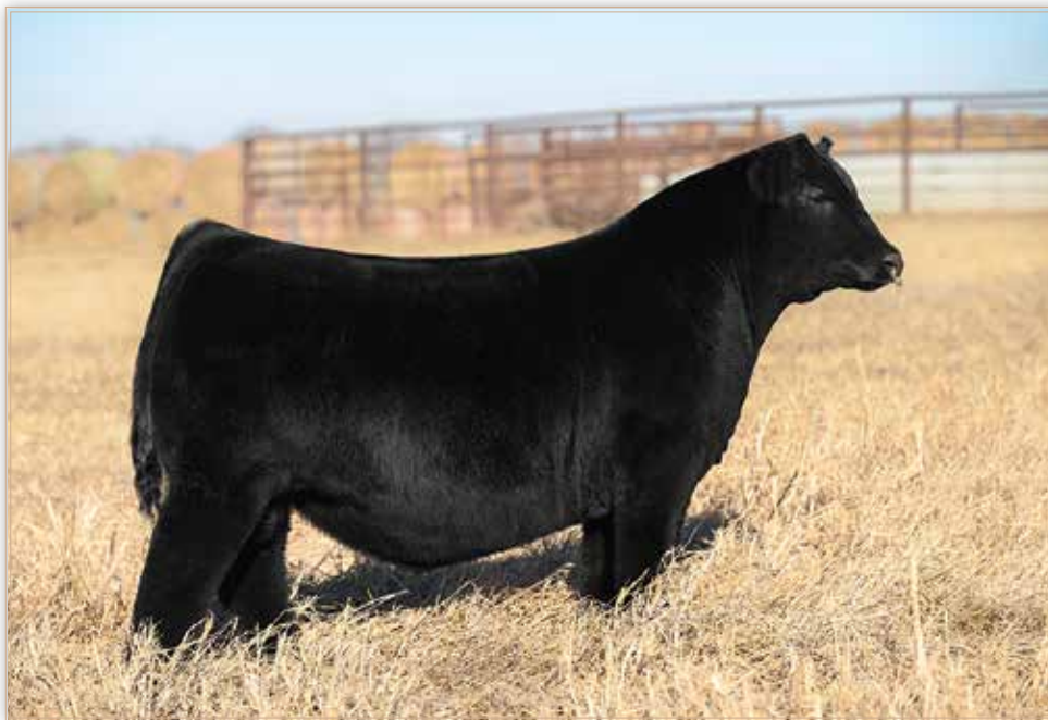
UDE NEW HEIGHTS 62/87 $280,000 Sire of Lot 8A