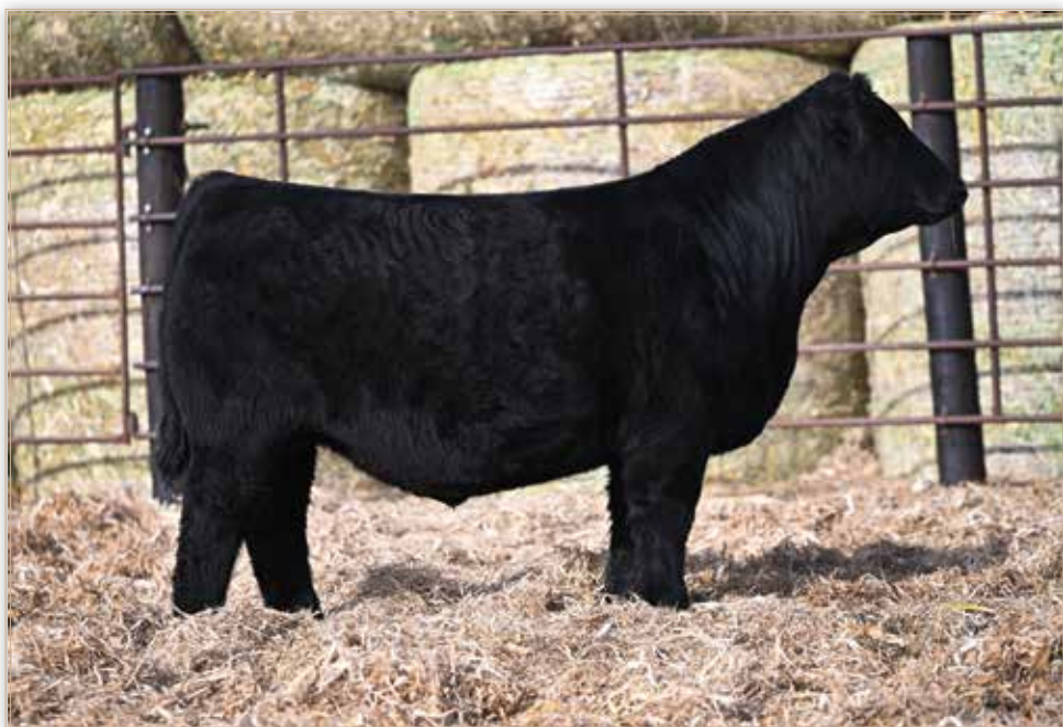
LOT 11 - LONG'S INTIMIDATOR N80