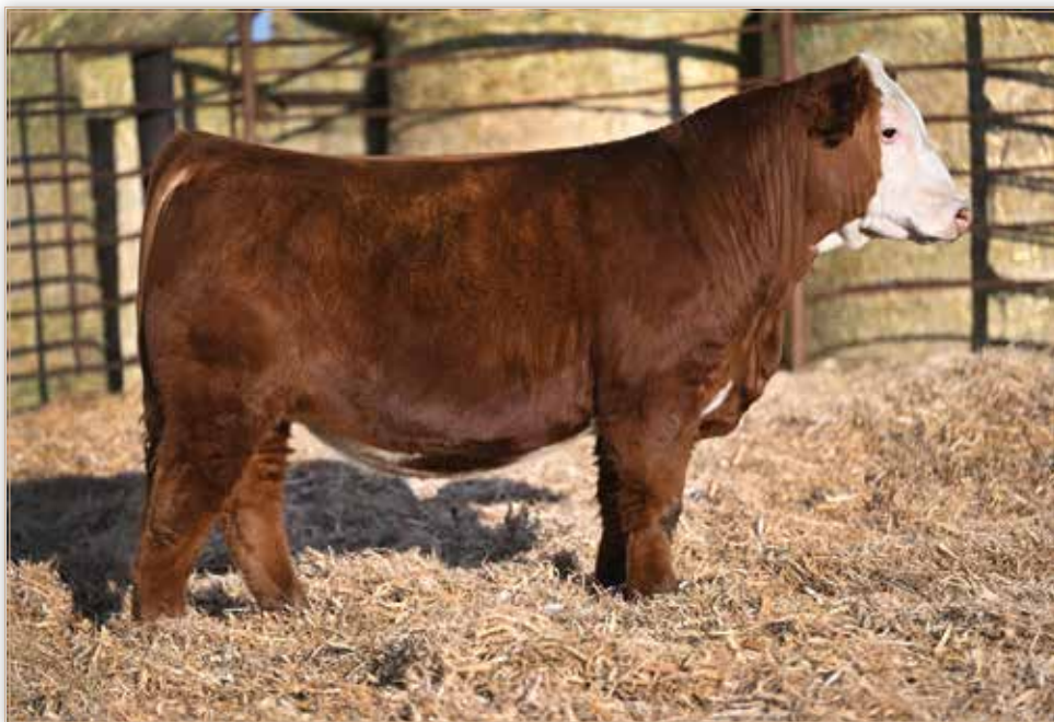
LOT 41 - LONG'S HONOR GUARD N36