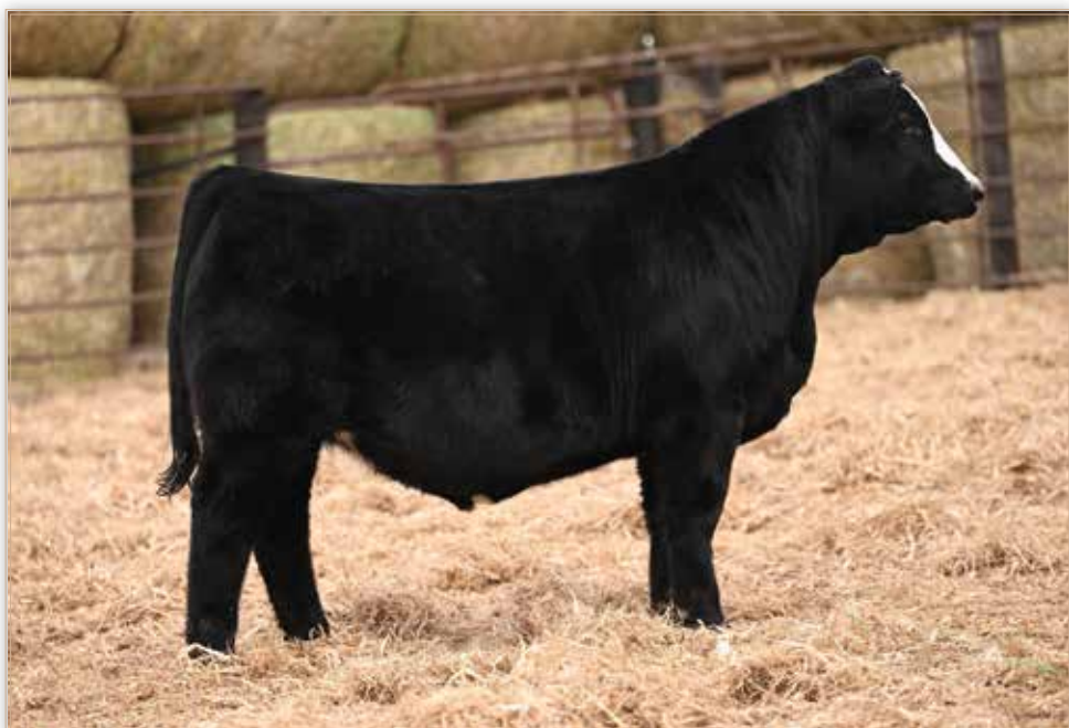
LOT 36 - LONG'S COUNTERTIME N22