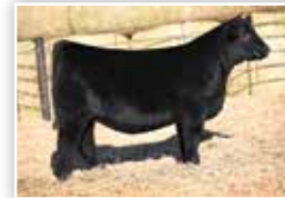
LONG'S IN CHARGE N429 Full Sister to Lots 13 & 14 She Sells as Lot 1