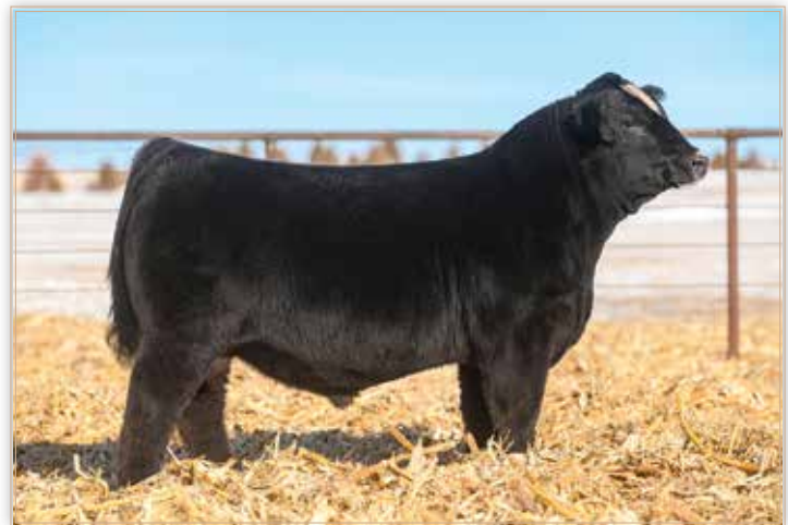
KCC1 COUNTERTIME 872H - $230,000 Sire of Lot 73 Embryos