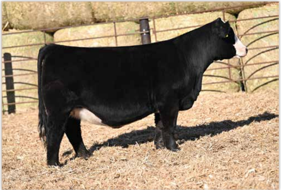
LOT 60 - LONG'S PATRIOT M201