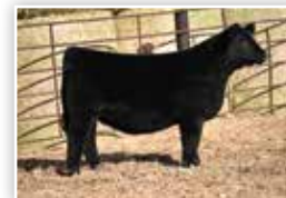
LONG'S IN CHARGE N829 Full Sister to Lots 13 & 14 She Sells as Lot 2