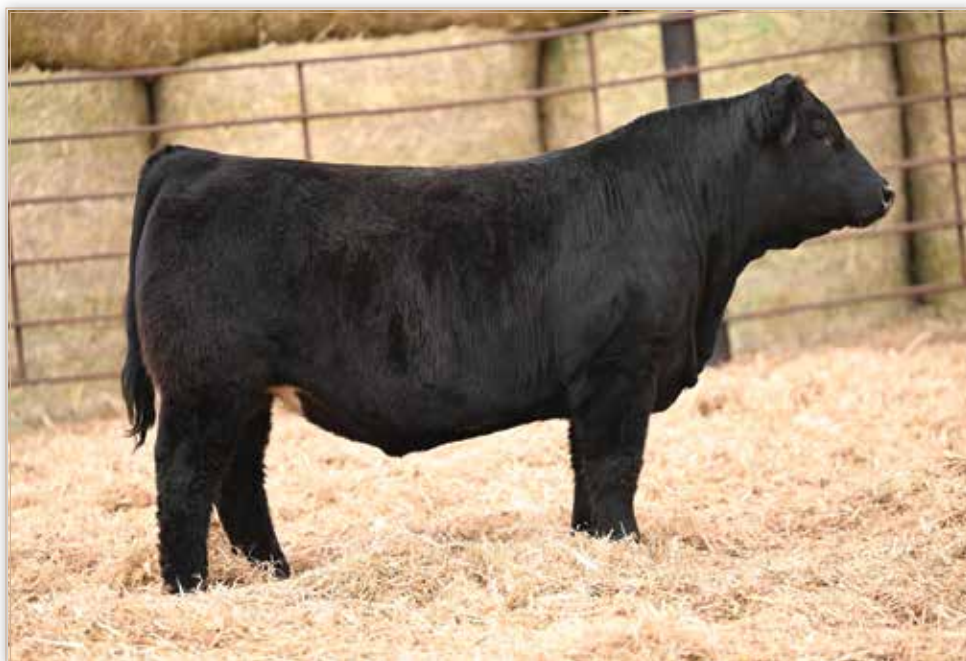
LOT 22 - LONG'S SALEM N49