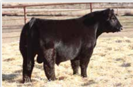
W/C ROLEX 01345E Maternal Grand sire of Lot 32