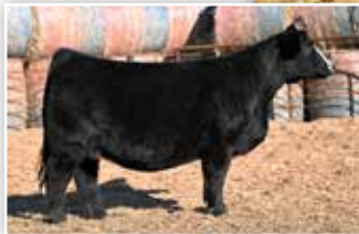
LONG'S LUCY L794 Full Sister to Lot 8C Embryos Her Embryos Sell as Lot 72