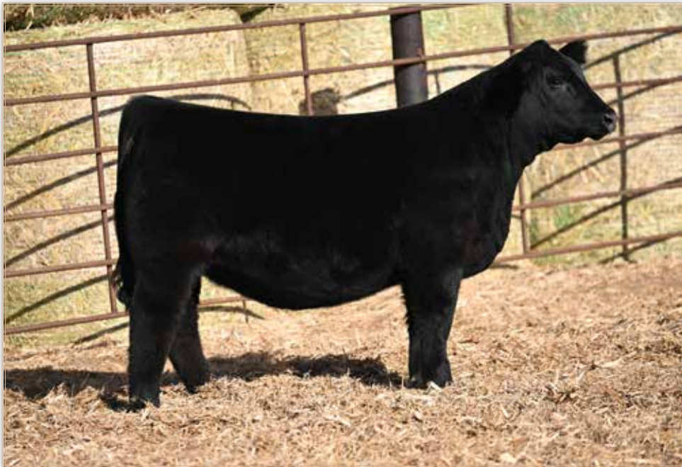
LOT 2 - LONG'S IN CHARGE N829