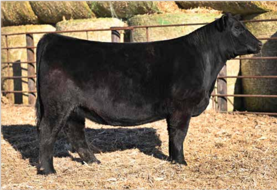
LOT 55 - LONG'S STYLE L674