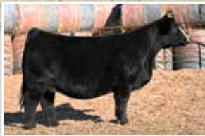
LONG'S LUCY L794