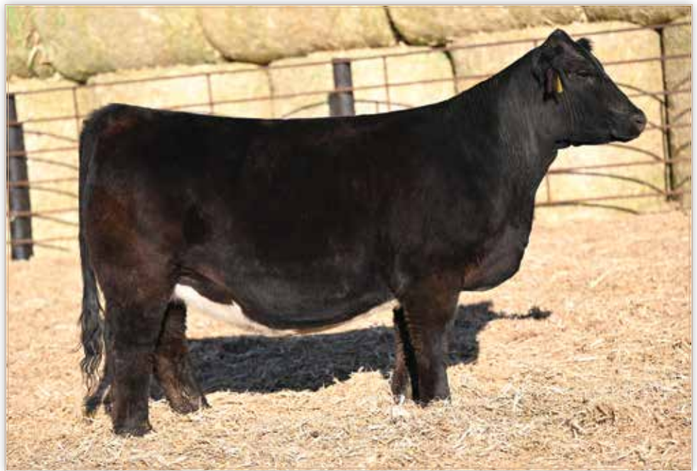
LOT 56 - LONG'S REMEDY M816