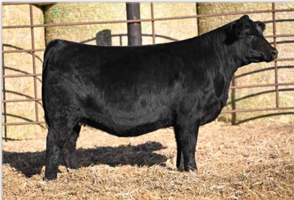
LOT 68 - LONG'S IN CHARGE M85