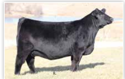
LONG'S CARMEN Dam of Lot 45