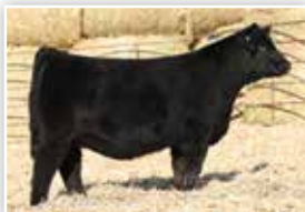
LONG'S J117 Dam of Lot 4