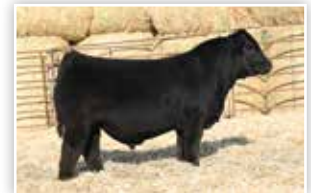
LONG'S/WBS HIRED GUN J100