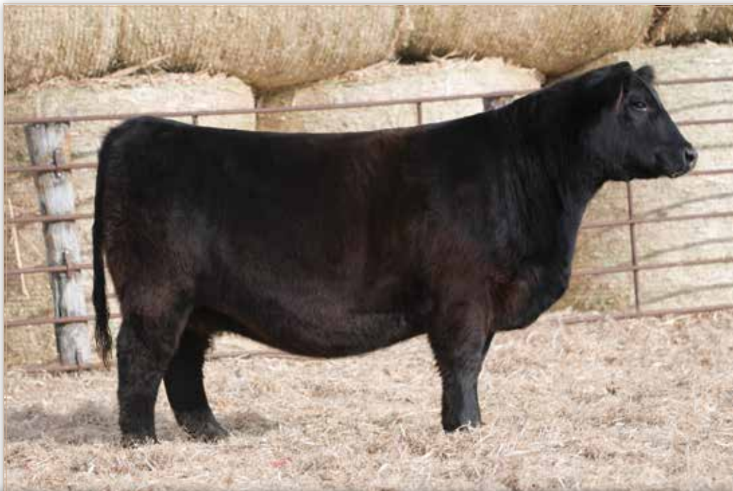
LOT 51 - LONGS F12