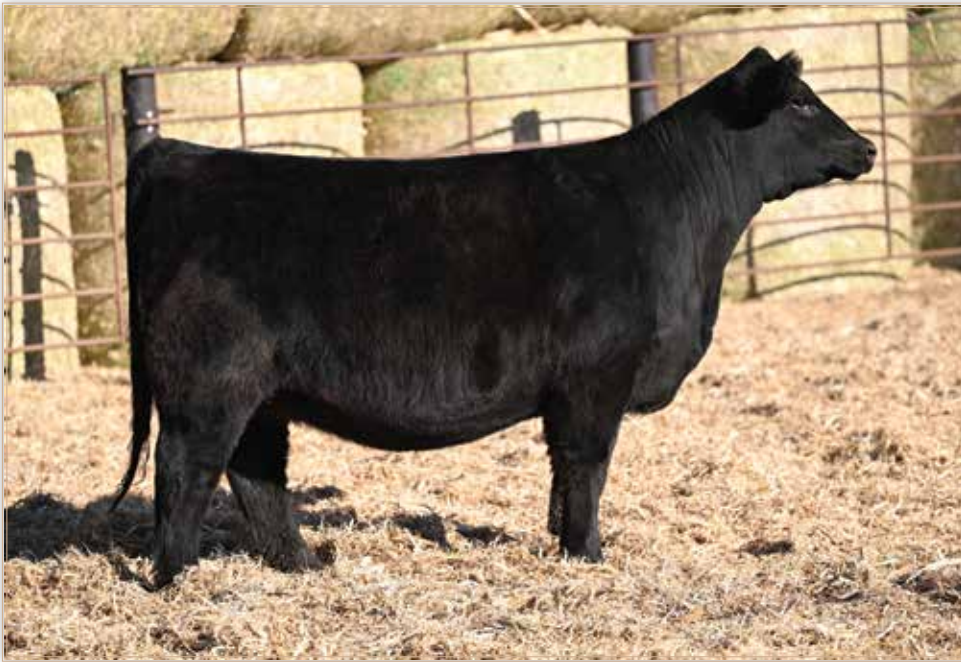
LOT 62 - LONG'S COUNTERTIME M810