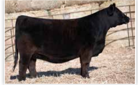
LONG'S DIAMOND K49 $70,000 Valued Dam of Lot 66