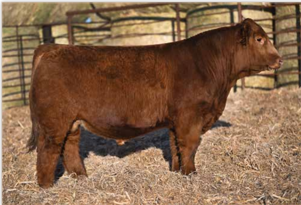
LOT 43 - LONG'S HONOR GUARD N9