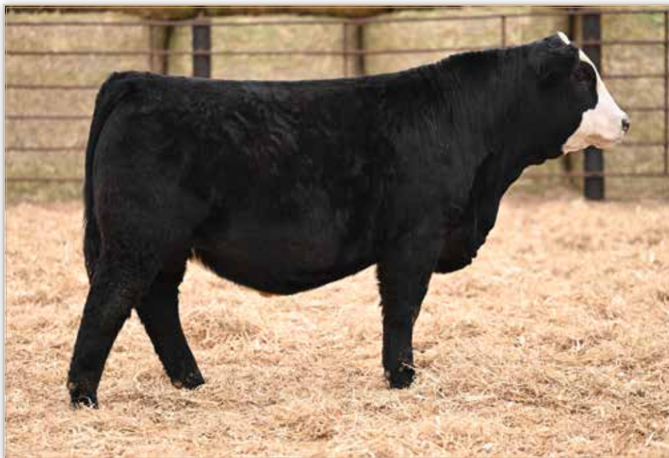
LOT 31 - LONG'S SALEM N24