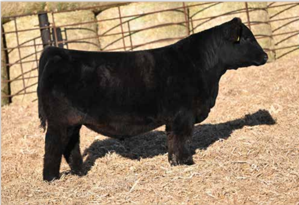
LOT 18 - LONG'S/TSC IN CHARGE N70