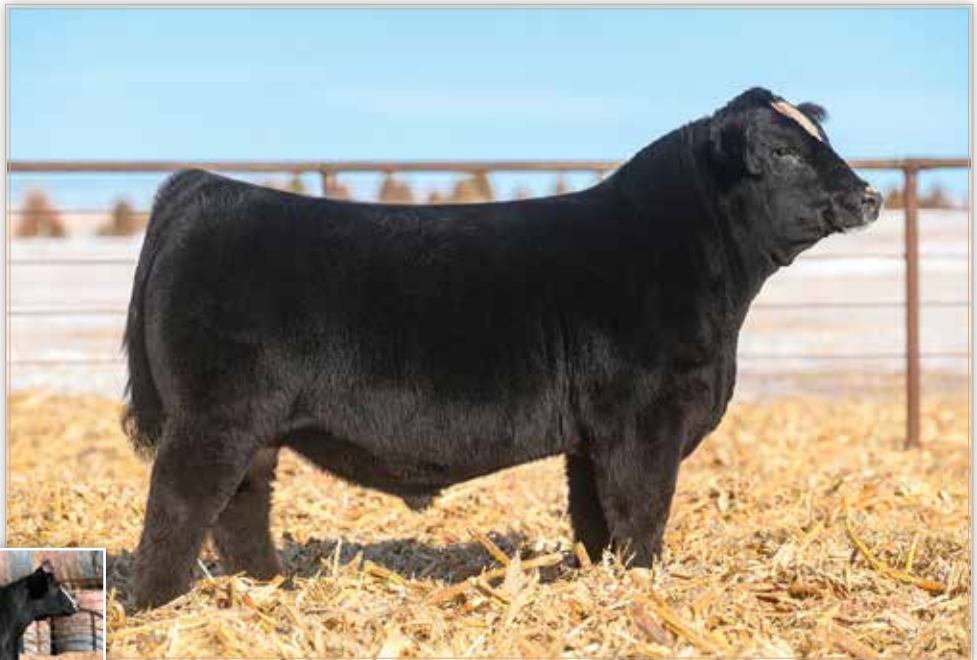
KCC1 COUNTERTIME 872H $230,000 Sire of Lot 8C