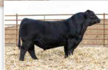
OMF EPIC E27 Sire of Lot 52B Embryos