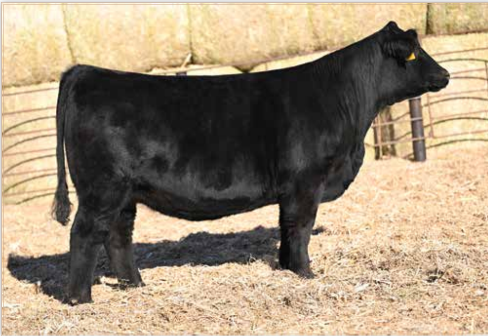
LOT 58 - LONG'S COUNTERTIME M33