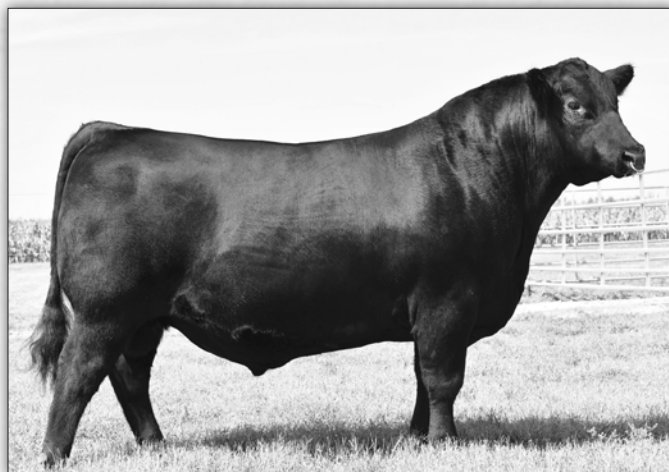
York Farms Knight Rider 2259 Featuring his progeny!

Attractive outlined daughter of Yellowstone that features the overall balance and style of the Blackbird cow family. Sells with a heifer calf at side, Lot 23A born 9/30/2025, sired by York Farms Knight Rider 2259. Bred 12/20/2025 to York Farms Knight Rider 2259.