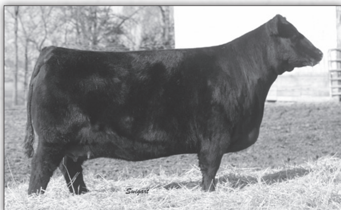
EA Emblynette 8113 - Dam of Lot 4

•Future donor prospect! The type of female you can build a program around. This massively deep centered, ultra broody female is the single highest performing female we have ever produced in terms of weaning and yearling performance. Her flush brothers averaged over $20K through the 2025 Ellingson Real World Production Sale. Numerous other maternal siblings have been features for our program selling to top operations around the country.