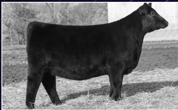
York Farms Forever Lady 2004

GREAT GENETICS START WITH GREAT FEMALES.