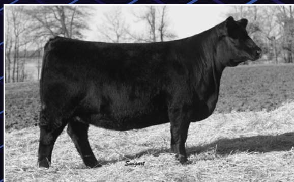
York Farms Juanada 1806