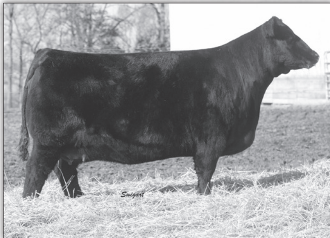
EA Emblynette 8113 - Dam of Lot 17

This young female carries on the high-performance traits of her prolific donor dam into an extremely balanced package. Maternal siblings have sold to JP Farms, Gullickson Ranches, and Wells Ranches just to name a few. Maternal sister to the female featured as Lot 4! Bred 12/4/25 to Ellingson Brazen.