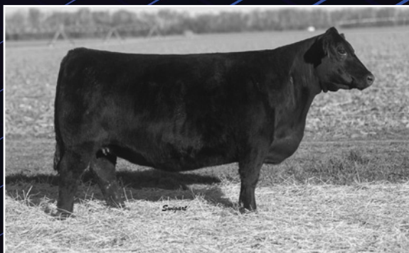
DND Everelda 35F