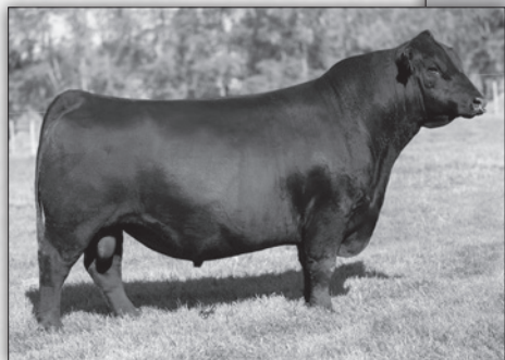
Crouch Congress - Sire of Lots 1A - 1D