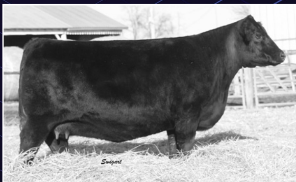
Top Line Proven Queen 5122