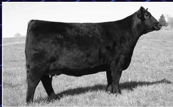
Birks Forever Lady 14