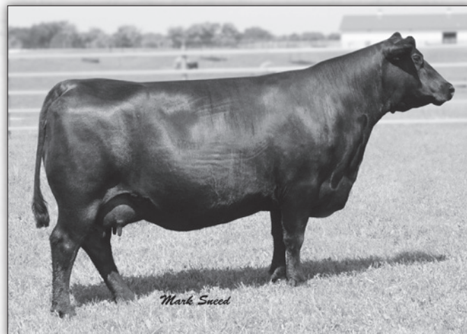
Champion Hill Georgina 4504

A highly productive Weigh Up daughter whose dam sold to Riley Brothers in Indiana as a feature female through a past production sale. The Miss Erica cow family has been a staple in our program for over 25 years due to their incredible production history and consistency. Due to calve prior to 5/10/26 to York Farms Knight Rider 2259.