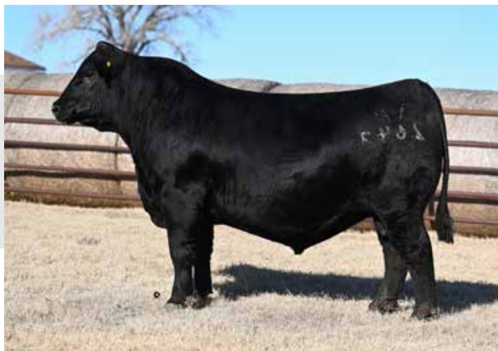
V A R Ring-of-Fire Sire of Lots 118 & 119