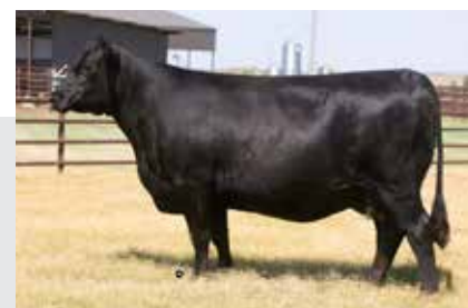
GAR Sunrise N27 Donor Dam of Lot 60