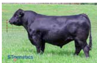
KC Kingston - Sire of Lots 35 - 38

NUMBER 1 for PAP score EPD, Number 6 for $Feedlot value index, Number 8 for Weaning Weight EPD and hot Carcass Weight EPD and Number 10 for Docility score EPD. With an Adj 205 day wt of 675 lbs as the first natural calf from a fertile dam with an avg calving interval of 381 days, this son of the record setting KC Kingston was produced by a daughter of the Deer Valley, Express, Gardiner and Spruce Mountain $425,000 G A R record setting and multi-million dollar producer of famous herd sires like G A R Early Bird, G A R Fail Sale and Deer Valley Optimum.