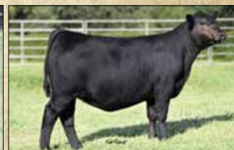
Vintage RITA 4159 the $330,000 maternal sister to True West