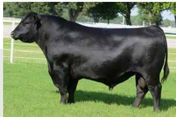
FF Rito Ambitious