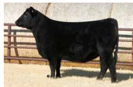
LHR Miss Lucy 7830-9567 Donor Dam of Lots 1-3

Number 5 for Functional Longevity EPD, Number 7 for PAP score EPD, Number 8 for Calving Ease Maternal score EPD and Udder suspension score EPD and Number 9 for hoof Angle score EPD Chosen for service as a Lazy H herd sire this winter with an Adj 205 day wt of 797 lbs for a ratio of 105, Number 4 for Adj 365 day wt of 1,391 lbs for a ratio of 107, URE measure of 14.1 sq inches, dam with an avg calving interval of 377 days, avg progeny weaning ratio of 3 at 105 and avg progeny yearling ratio of 3 at 104 is sired by the $200,000 Pathfinder Sire that topped a past Connealy sale and she is a flush sister to the $10,000 donor dam of the Lazy H herd sires featured as Lots 3 and 4 and their flush mates Lots 51, 170 and 173 with another daughter that sells as Lot 161 and the grandam balances an avg progeny birth ratio of 3 at 96, avg progeny weaning ratio of 3 at 105 and avg progeny yearling ratio of 3 at 104 and her $124,000 of progeny sales include a $11,000 son in 2024 and a $13,000 son in 2019.