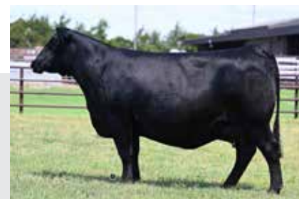
LHR Susie 1207 Donor Dam of Lot 59

Number 4 for Calving Ease Maternal score EPD and Number 9 for Rib Eye area measure EPD. Adj 205 day wt of 800 lbs for a ratio of 105, Number 6 for Adj 365 day wt of 1,379 lbs for a ratio of 106 and URE measure of 14.8 sq inches, the donor dam that records an AMAZING avg progeny %IMF ratio of 25 at 118 is also the dam of Lot 155 who recorded the highest %IMF scan in the history of Lazy H and is a flush sister to Lot 49 with maternal brothers to this bull sold for $10,000 and $8,500 in 2023 and maternal sisters that sell as Lots 155, 156, 168, 169 and 188.