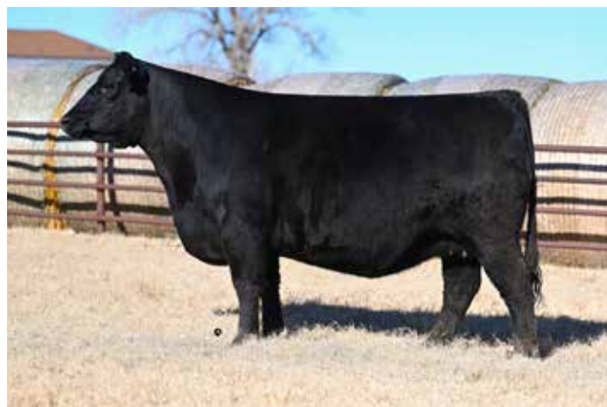
LHR Miss Lucy 7830-9568 Donor Dam of Lot 161

NUMBER 1 for Hair Shedding score EPD, Number 2 for Scrotal Circumference measure EPD, Number 3 for PAP score EPD, Number 5 for Docility score EPD, Number 6 for Yearling Weight EPD, weaning weight from maternal Milk EPD, Functional Longevity EPD and Calving Ease Maternal score EPD, Number 7 for $Weaned calf value index, Weaning Weight EPD, Udder suspension score EPD and Birth Weight EPD, Number 8 for $Grid value index and hot Carcass Weight EPD and Number 9 for Marbling score EPD, Rib Eye area measure EPD and hoof Angle score EPD. Number 2 for Adj 205 day wt of 810 lbs, Number 4 for Adj 365 day wt of 1,108 lbs, %IMF ratio of 5.48 % and URE measure of 14.3 sq inches, her maternal brothers used as Lazy H herd sires this winter sell as Lots 4 and 5 with a third brother featured as Lot 51 and their flush sisters selling as Lots 170 and 173, their donor dam records an avg progeny weaning ratio of 3 at 109, avg progeny yearling ratio of 3 at 110 and avg progeny URE ratio of 19 at 104 with a maternal brother sold for $15,000 in 2024. Birth Wt: 80 lbs