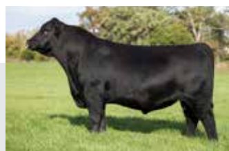
Virginia Tech Statesman - Sire of Lots 45 - 48

Number 5 for Birth Weight EPD. Adj 205 day wt of 771 lbs, Adj 365 day wt of 1,283 lbs and Number 5 for URE ratio of 110 at 16.0 sq inches, his dam excels for calving ease and fertility with an avg calving interval of 362 days, avg progeny birth ratio of 4 at 90, avg progeny weaning ratio of 4 at 102, avg progeny yearling ratio of 4 at 102 and avg progeny URE ratio of 4 at 105 and she is a daughter of the Lazy H and Brinkley donor whose dam is the $425,000 past Gardiner record setting dam of G A R Early Bird, G A R Fail Safe and Deer Valley Optimum.