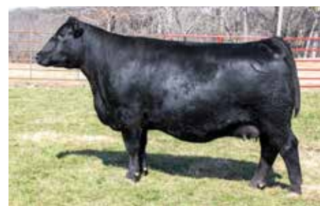
Donor Dam of Lots 6 – 8 - Sitz Elsiemere 1461