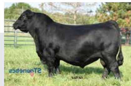
Connealy Commerce Sire of Lots 57 – 58

Number 2 for Hair Shedding score EPD, Number 5 for Teat score EPD, Number 6 for Scrotal Circumference measure EPD and Calving Ease Maternal score EPD, Number 8 for hoof Angle score EPD, Number 9 for Birth Weight EPD and Number 10 for Marbling score EPD. Adj 205 day wt of 705 lbs, Adj 365 day wt of 1,171 lbs, Number 4 for %IMF ratio of 144 and URE measure of 14.8 sq inches, this flush brother to Lot 57 was produced by a donor dam that sold to Rowh Angus in 2024 that had a weaning ratio of 117 on her only natural calf with AHIR data and an avg progeny %IMF ratio of 9 at 108 with three daughters sold for $20,000 in 2024 and four more that sell as Lots 167A, 167B, 181 and 182.