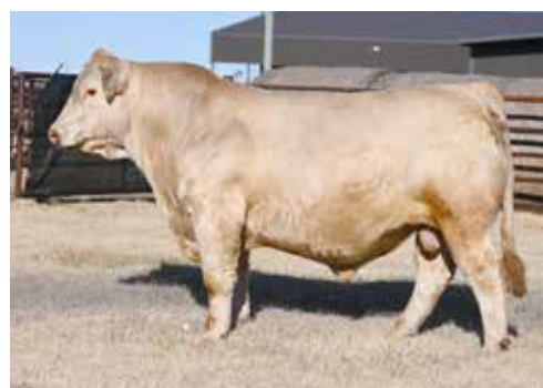
MJR Smoky Foreman 3004

NUMBER 1 SC, Number 2 Calving Ease EPD and Birth Weight EPD, Number 3 Rib Eye Area EPD, Number 4 Fat Thickness EPD and Number 5 Weaning Weight EPD.