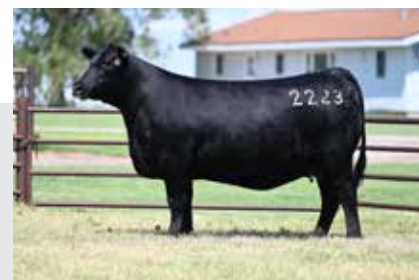
RSA Blackbird 2223 Donor Dam of Lots 57 – 58

Number 2 for PAP score EPD, Number 4 for hoof Angle score EPD, Number 8 for Weaning Weight EPD, Teat score EPD, Functional Longevity EPD, Hair Shedding score EPD and Calving Ease Maternal score EPD, Number 9 for Udder suspension score EPD and Number 10 for Scrotal Circumference measure EPD. Adj 205 day wt of 764 lbs, Adj 365 day wt of 1,218 lbs, Number 10 for %IMF ratio of 118 and URE measure of 14.1 sq inches, his donor dam that sold to Rowh Angus in 2024 had a weaning ratio of 117 on her only natural calf with AHIR data and an avg progeny %IMF ratio of 9 at 108 with three daughters sold for $20,000 in 2024 and four more that sell as Lots 167A, 167B, 181 and 182.