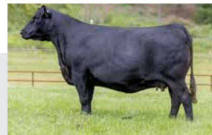
KCF Miss Reno F753 Donor Dam of Lot 67