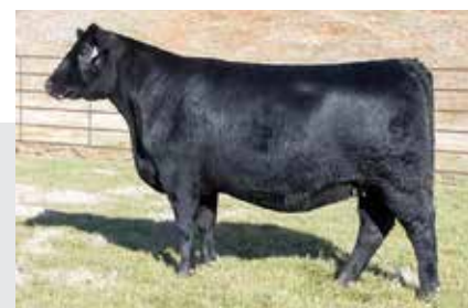
Lady Magnitude 453-2427 Donor Dam of Lot 68