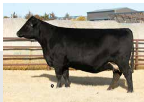
LHR Blackcap 0562-7102 Donor Dam of Lots 113 – 114

Number 3 for Functional Longevity EPD, Number 5 for Calving Ease Maternal score EPD and Number 10 for weaning weight from maternal Milk EPD. Adj 205 day wt of 804 lbs for a ratio of 113, Adj 365 day wt of 1,278 lbs for a ratio of 110, %IMF ratio of 106 and URE ratio of 102 at 14.8 sq inches as the first natural calf from a young cow with an avg progeny birth ratio of 2 at 93, this paternal brother to the $29,500 LHR Black Cat 2922 selected by Birdwell Ranch as the top seller of the 2024 Lazy H sale was produced by a new generation of a high maternal family in the Ingram Angus herd.