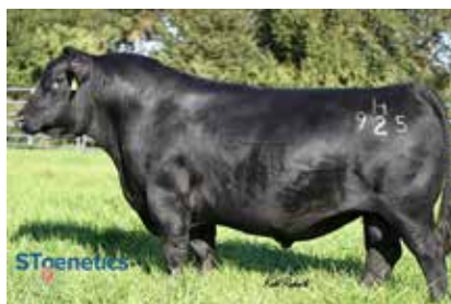
78 Baldrige Heat Seeker Sire of Lots 67 – 78

Number 5 for Claw set score EPD and Number 9 for hoof Angle score EPD and Docility score EPD. With a URE measure of 13.9 sq inches, his donor dam that is a maternal sister to the $500,000 Connealy Craftsman is a proven source of added muscle working in the Brinkley and Lazy H programs with an avg progeny URE ratio of 8 at 103 and she is also the dam of Lot 73.