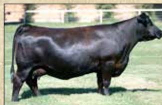
PAF RITA 7096 the multi-million dollar producing dam of True West