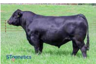
KC Kingston - Sire of Lots 20 - 21

Number 4 for Claw set score EPD, Number 7 for Weaning Weight EPD and hot Carcass Weight EPD, Number 8 for Docility score EPD and Calving Ease Maternal score EPD, Number 9 for Yearling Weight EPD and Number 10 for $Weaned calf value index. One of the oldest calves by the ST Genetics sire that sold nursing his dam for $235,000 for half interest of the pair, this flush brother to Lot 64 from a Katie Colin foundation donor dam with an avg progeny weaning ratio of 4 at 103 and avg progeny yearling ratio of 3 at 102 has seven maternal brothers sold in past Lazy H sales for an average of $8,643 that are headlined by a $16,000 sale feature in 2025 and a $11,000 herd sire in 2022 and the maternal brother to this top prospect with the NUMBER 1 $Combined value index of this sale offering is featured as Lot 67.