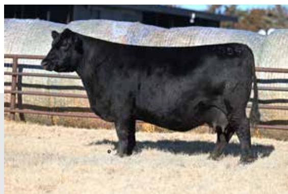
LHR Susie 3224-7589 - Donor Dam of Lots 40 - 44

Number 4 for Docility score EPD, Number 7 for $Maternal value index, Number 8 for Functional Longevity EPD and Scrotal Circumference measure EPD, Number 9 for weaning weight from maternal Milk EPD and Number 10 for Claw set score EPD and Calving Ease Maternal score EPD. Sired by the $170,000 two thirds interest maternal brother to the new Lazy H herd sire V A R True West 3009, this top prospect combines an Adj 205 day wt of 696 lbs, Adj 365 day wt of 1,277 lbs, %IMF ratio of 109 and URE ratio of 104 at 16.1 sq inches and is s flush brother to Lots 158A and 158B and a maternal brother to the flush mates that sell as Lots 106 , 175A, 175B and 175C and their donor dam had three sons in the 2024 sale sold for an average of $9,167 and she combines an avg progeny weaning ratio of 3 at 103 and an EXCEPTIONAL avg progeny %IMF ratio of 24 at 110 and she is a maternal sister to Lots 29 through 32 and 41 through 44 with her eight brothers sold for an average of $11,375 in the past three Lazy H sales anchored by the $20,000 Lot 1 in 2023 and a another $20,000 maternal brother that sold in 2024.