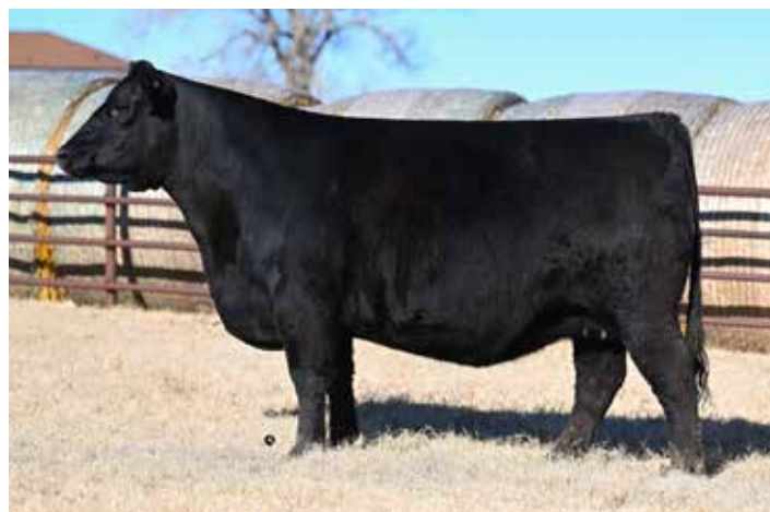
LHR Miss Lucy 7830-9568 Donor Dam of Lots 4 – 5

NUMBER 1 for Claw set score EPD, Number 3 for $Weaned calf value index and Weaning Weight EPD, Number 4 for Yearling Weight EPD and Number 10 for hot Carcass Weight EPD. Chosen for service as a Lazy H herd sire this winter with the Number 2 for Adj 205 day wt of 940 lbs, Number 8 for Adj 365 day wt of 1,362 lbs and Number 4 for URE ratio of 111 at 16.8 sq inches, this flush brother to Lot 4 who was also used as Lazy H herd sire this winter, other flush mates sell as Lots 51, 170 and 173 with a maternal sister featured as Lot 161, their $10,000 donor dam that is a flush sister to the dam of Lots 1, 2 and 3, records an avg progeny weaning ratio of 3 at 109, avg progeny yearling ratio of 3 at 110 and avg progeny URE ratio of 19 at 104 with a maternal brother sold for $15,000 in 2024.