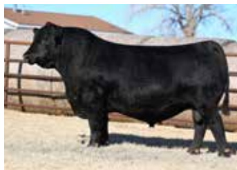
LHR-KC Ignite Sire of Lots 116 - 117

Number 8 for hot Carcass Weight EPD and Number 9 for hoof Angle score EPD and Calving Ease Maternal score EPD. Adj 205 day wt of 842 lbs, Adj 365 day wt of 1,314 lbs for a ratio of 105, %IMF ratio of 102 and Number 10 for URE ratio of 105 at 15.7 sq inches with a birth ratio of 96 as his dam's first calf, his sire selected by Genex as a 19,000 past Lazy H top seller is a maternal brother to the record-setting featured ST Genetics sire KC Kingston whose first calf crop of sons are featured in this sale and a maternal brother to the exciting herd sire prospect that sells as Lot 23.