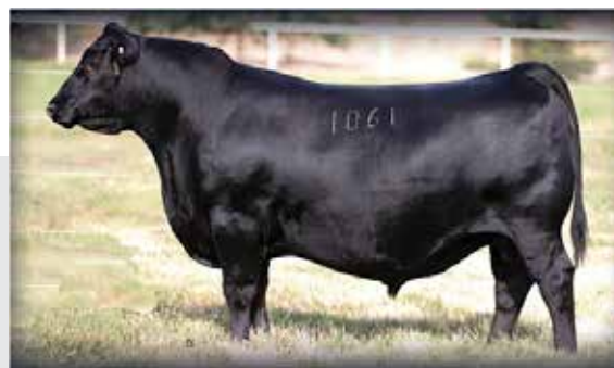
EZAR Gettysburg - Sire of Lots 40 - 44