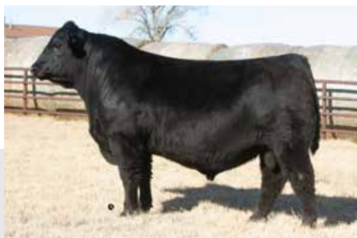
LHR Upscale 1862 Sire of Lots 95 – 97

NUMBER 1 for Scrotal Circumference measure EPD, Number 3 for percent Heifer Pregnancy EPD, Number 5 for Calving Ease Maternal score EPD, Number 6 for Docility score EPD, Number 7 for Claw set score EPD, Number 8 for Hair Shedding score EPD and Number 9 for Functional Longevity EPD. Adj 205 day wt of 825 lbs for a ratio of 106, Adj 365 day wt of 1,279 lbs, Number 9 for %IMF ratio of 121 and URE measure of 14.1 sq inches, his dam with the exceptional combination of an avg progeny birth ratio of 4 at 91 and avg progeny %IMF ratio of 7 at 117 produced a $15,000 maternal brother in the 2022 Lazy H sale and the sire of this bull sold for $11,000 in 2025 after use as a Lazy H herd sire.