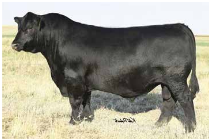
Basin Jameson - Sire of Lots 6 - 9

Number 5 for $Weaned calf value index and hoof Angle score EPD, Number 6 for $Maternal value index and PAP score EPD, Number 8 for Functional Longevity EPD and Number 10 for Weaning Weight EPD, Claw set score EPD, Hair Shedding score EPD and Calving Ease Maternal score EPD. Adj 205 day wt of 702 lbs and Adj 365 day wt of 1,153 lbs, this flush brother to the Lazy H herd sire featured as Lot 6 and to the power bull selling as Lot 7 is a maternal brother to Lot 76, the first natural calf from a cornerstone Katie Colin donor that is the result of mating a $165,000 past Sitz top selling sire best known as the sire of the $500,000 Connealy Craftsman to a $16,000 foundation female at Ruggles Angus in Nebraska.