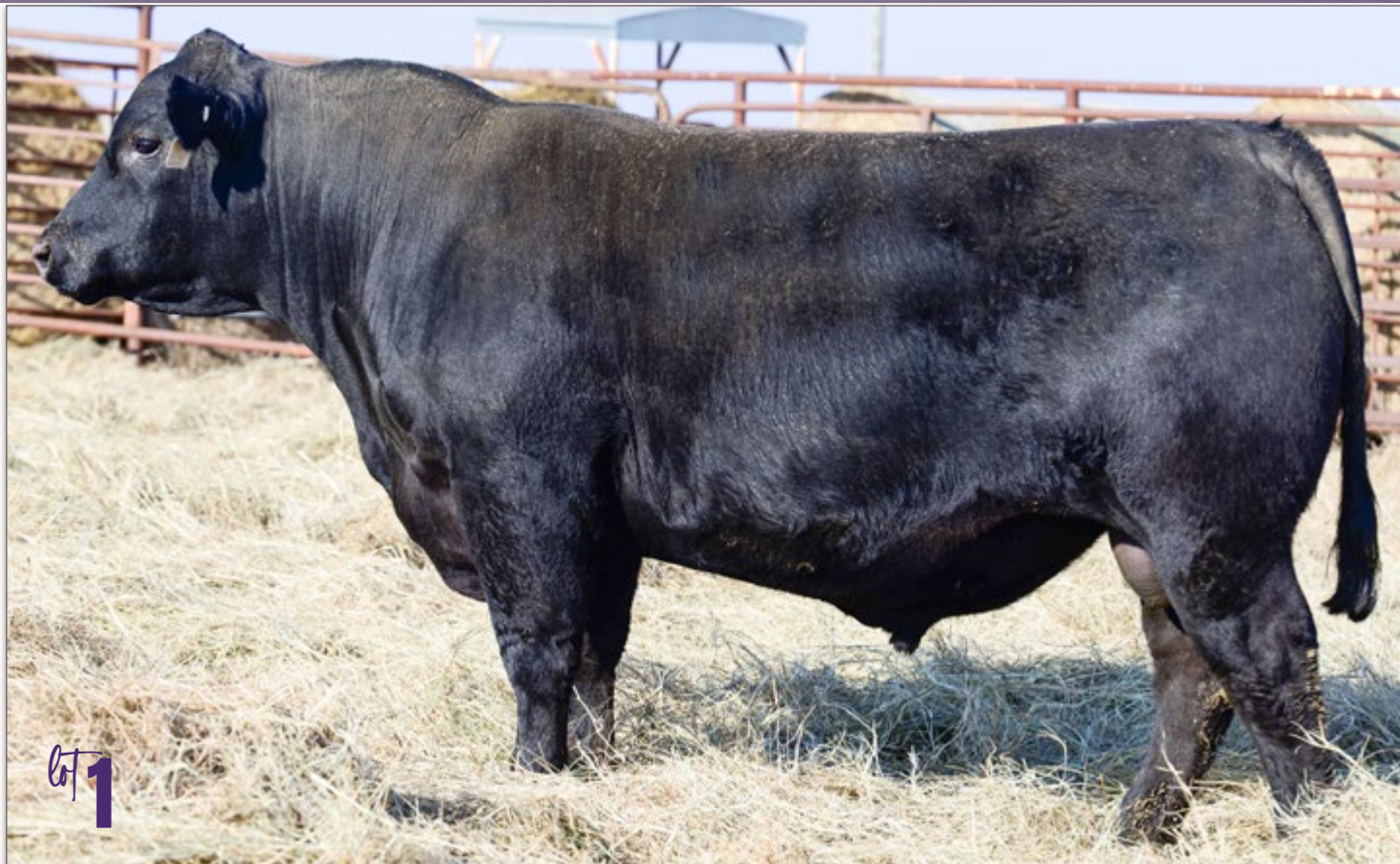
RAFTER 5M BUSINESS 451