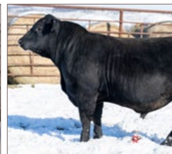
RAFTER 5M SUPERIOR