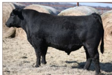
RAFTER 5M EAGLE 257