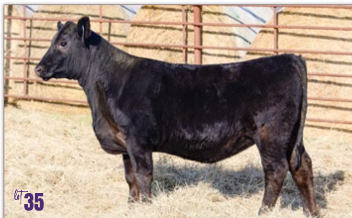
RAFTER 5M RITA 502

A nice Pathfinder heifer that has the potential to turn into something special. Her mom has done a great job so far, continuing to move to the beginning of the calving season.