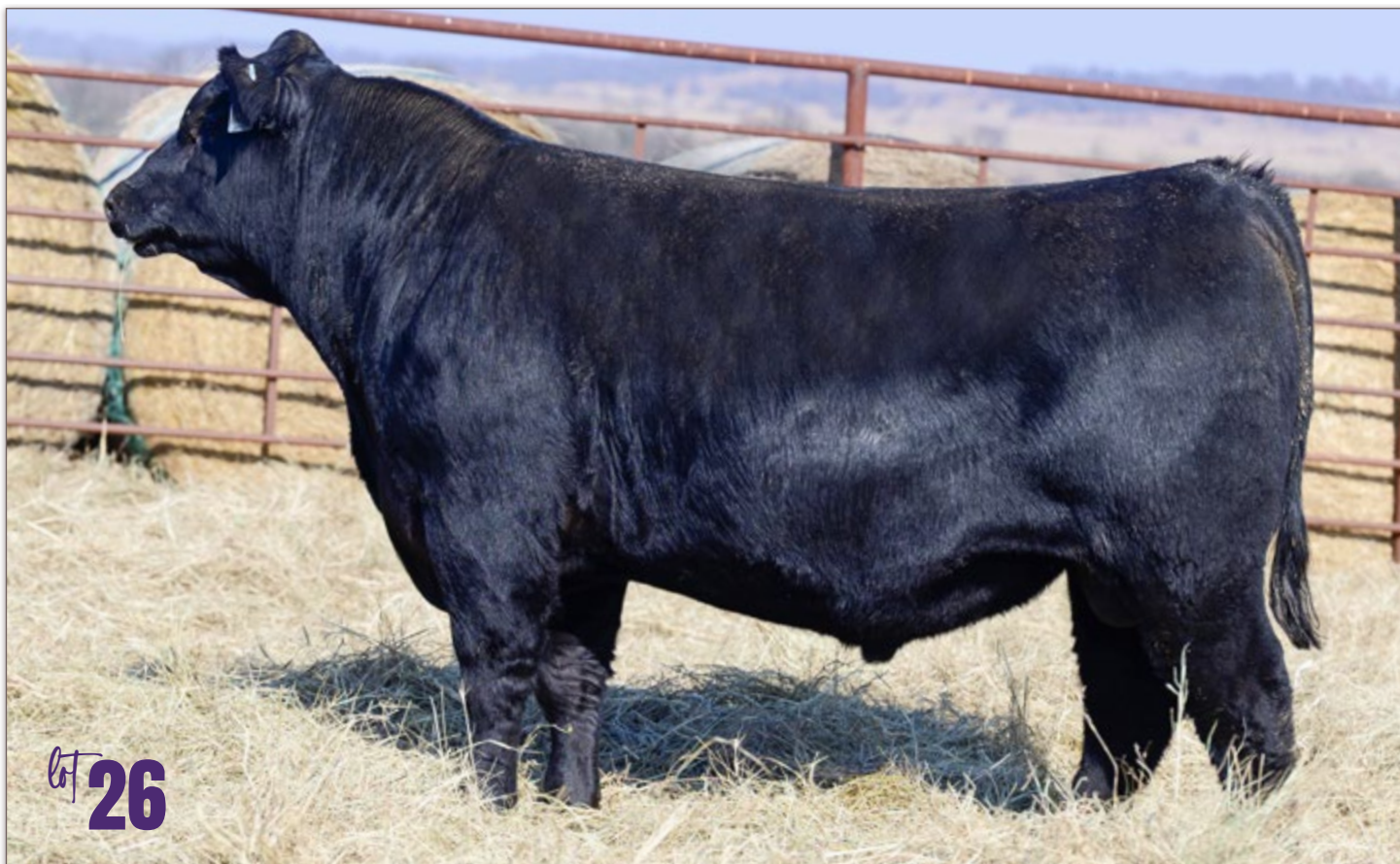
RAFTER 5M SOUTHERN GRACE 467