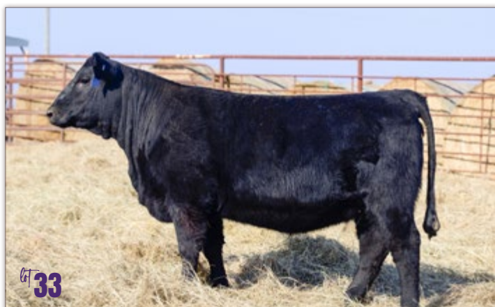
RAFTER 5M ELANE 556

These Holy Water heifers are so good that I decided to pick out the very best ones to show the world just how good these Holy Water progeny are. They're long, stout, beautiful Angus females that are really hard to part with. I love how beautifully uddered and easy fleshing the first ones to calve have been.