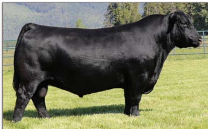
SQUARE B ATLANTIS 8060 | SIRE OF LOT 36