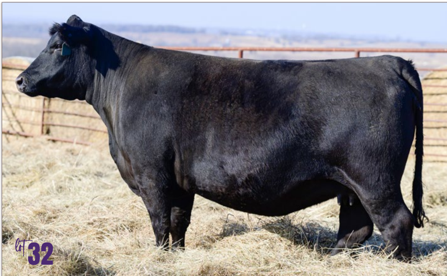
RAFTER 5M DIXIE ERICA 144