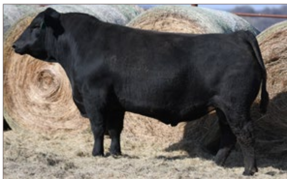
RAFTER 5M ROADBLOCK | MATERNAL BROTHER OF LOT 9

It's hard to get much more royally bed than this one. 0231's daughters are the best cows we have. The Glenda cow family will soon become synonymous with our entire program. When you think of Rafter 5M you'll be reminded of 0231 and her many sons and daughters.