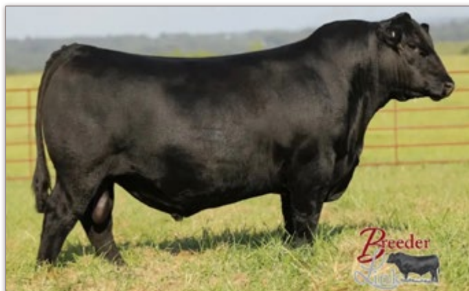
ZWT BLUE BLOOD 1508 | SIRE OF LOT 37