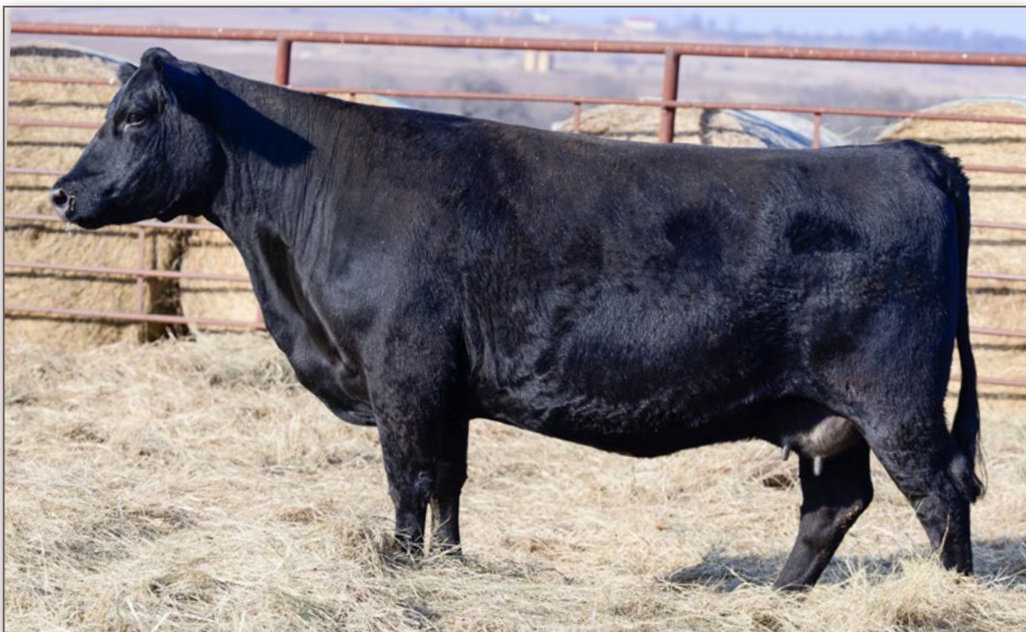
SRR ELBA 6222 | DAM OF LOT 27