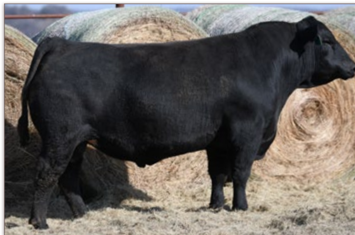
RAFTER 5M ROADBLOCK 214