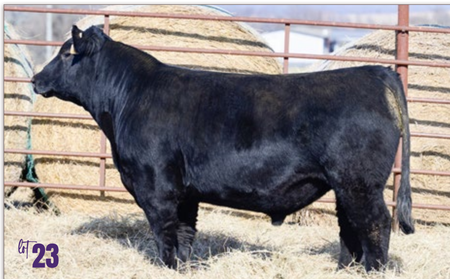
RAFTER 5M ECLIPSE 472