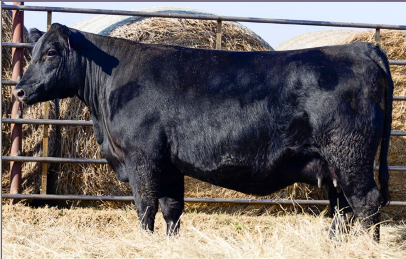
RAFTER 5M GLENDA 410 | MATERNAL SISTER TO LOT 9 OF LOT 9