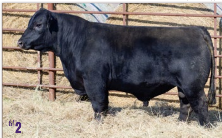
RAFTER 5M BRONC 452

Another year, another son by 1134. I really like how this bull puts it all together. Wide topped, deep and stout. I'm reluctant to call a cow 'can't miss', but she's as close as it gets. This bull is exactly why you stack a pedigree with proven performance and longevity. As is the case with all 1134 sons, keep the daughters. This bull could really help a lot of people.