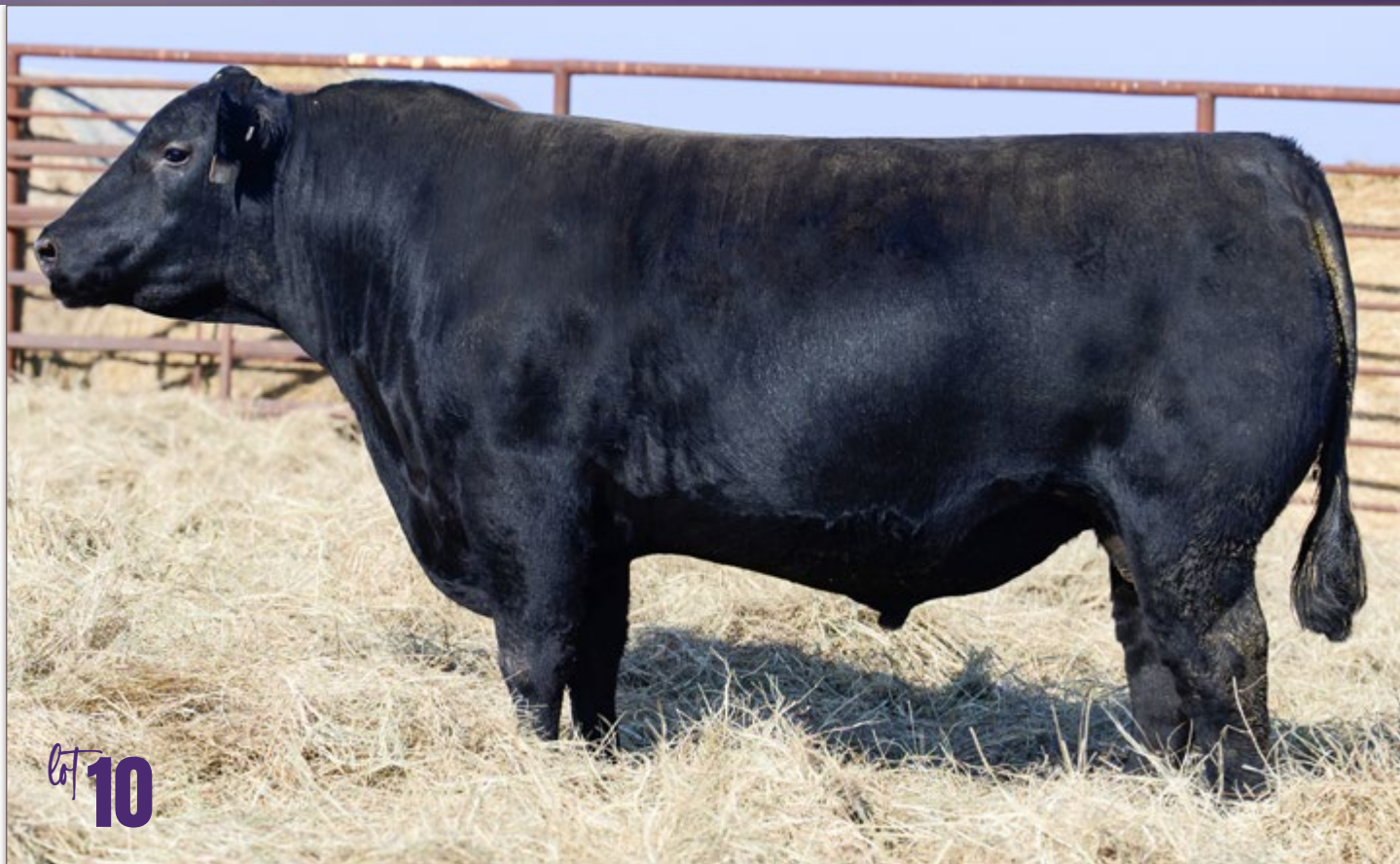
RAFTER 5M DOMINANCE 453