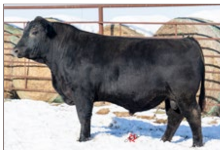
RAFTER 5M STOCKADE 353

Calving ease brother to lot 1. This bull has extra hip and base width for a bull that will work on heifers.