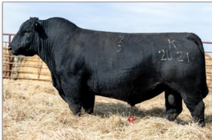
KOUPALS B&B HOLY WATER 2021