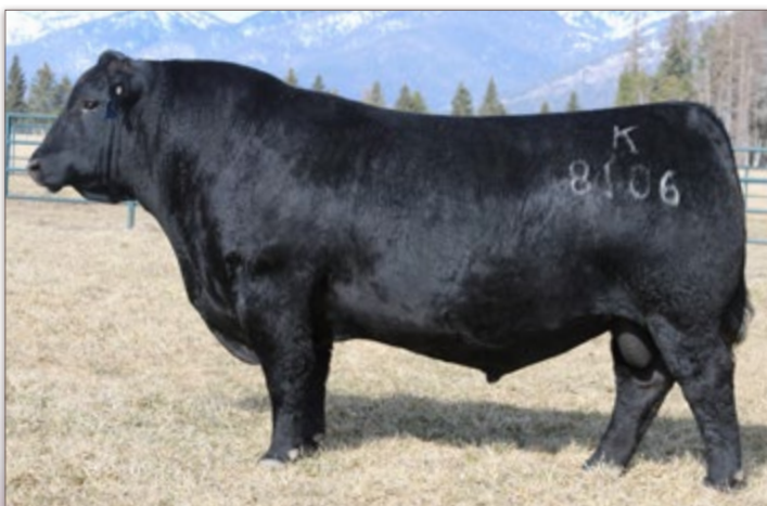
KOUPALS B&B PATHFINDER 8106 | PATERNAL GRANDSIRE OF LOT 27