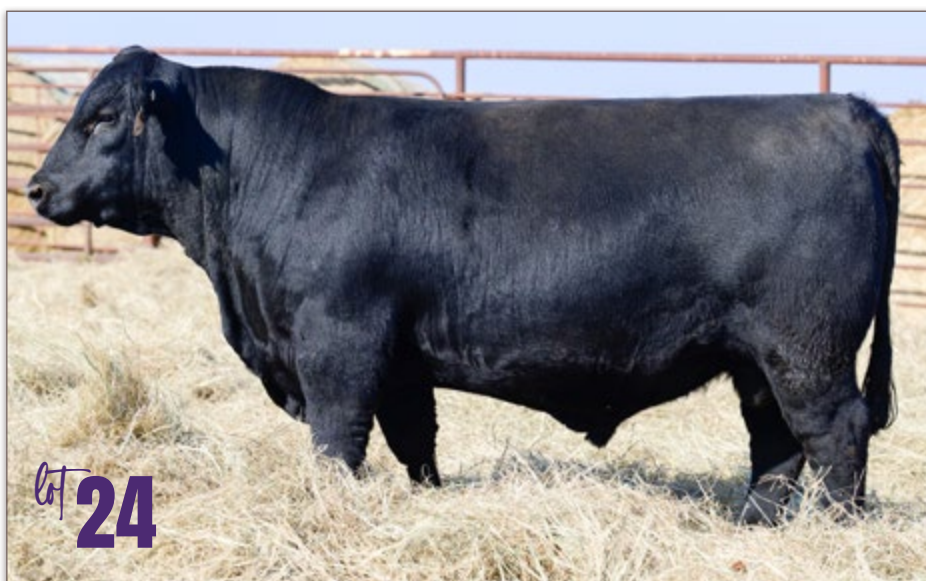
RAFTER 5M COLT 468

Holy cow! What an awesome bull. Another sale highlight by Holy Water. Calving ease and real world performance. He's an extra rib longer with a huge middle. His mother out of the Glenda cow family has raised a sale bull every year. She's easy fleshing and really stamps her progeny with that huge Payweight middle. Definitely a highlight and another one of the bulls that I really think could move your program in a positive direction.