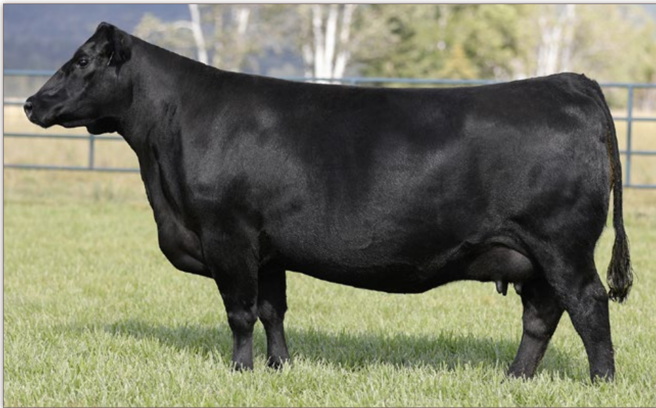
MONTANA ERICA 9074 | DAM OF LOT 36

Fall Heifers Exposed to Koupals B&B Holy Water 2021 from December 2, 2025 to Jan. 11 and then exposed to Lot 1 from Jan. 12 through sale day. These fall cows are the no nonsense type that stay around until their teens.