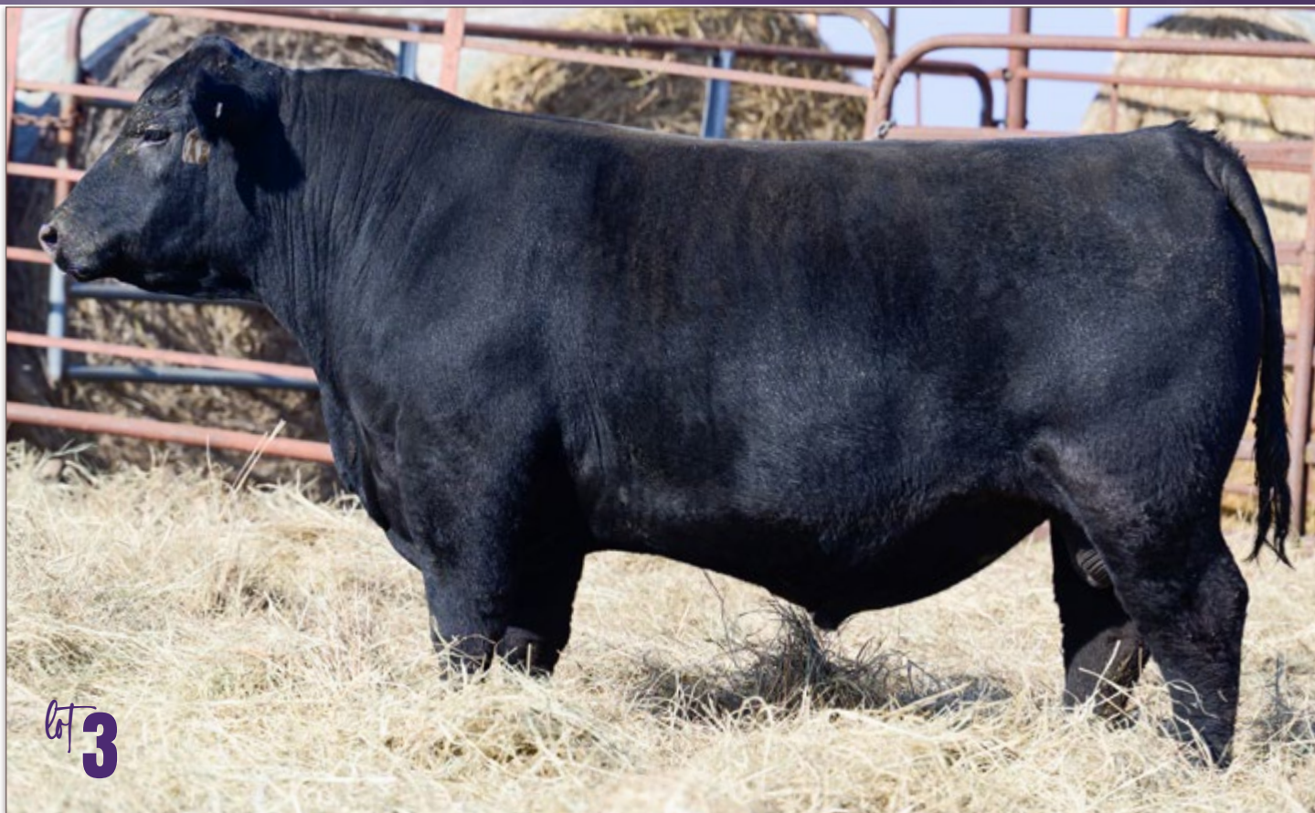
RAFTER 5M FORTIFY 454