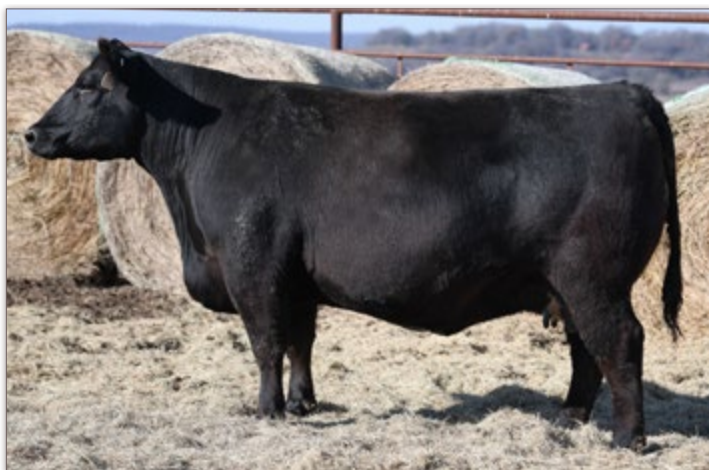
SRA RITA 9182 | DAM OF LOT 21