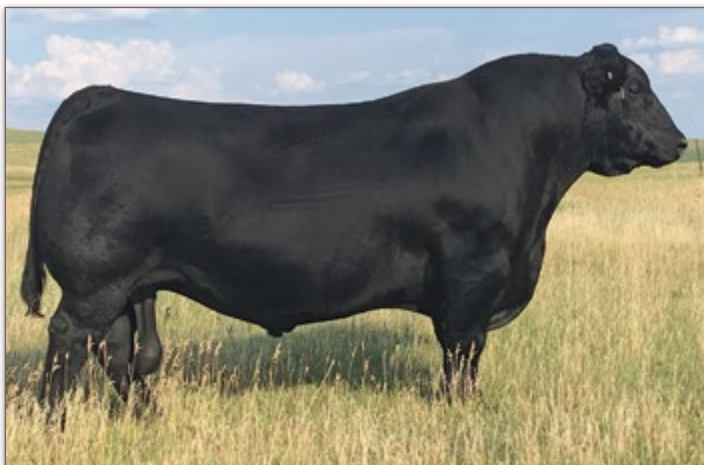
S A V RENOWN 3439