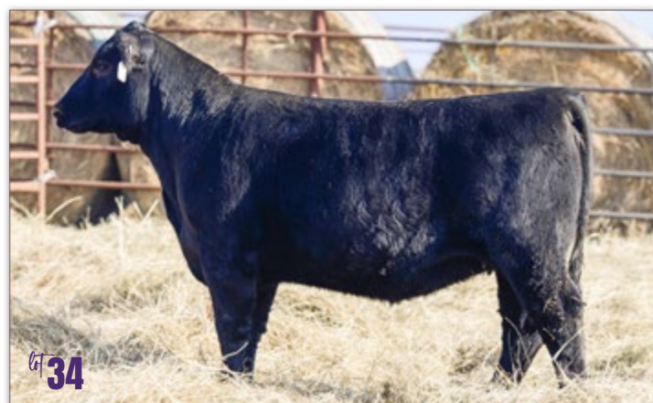
RAFTER 5M TROJAN ERICA 510