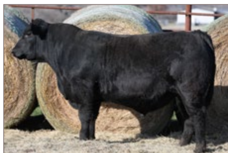
RAFTER 5M RAVEN 250