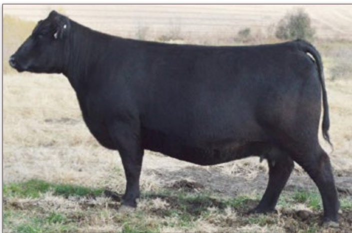
S/A MC LADY 4182-1134 | DAM OF LOTS 1-3

Full brother to Rafter 5M Stockade 353 who was a sale highlight in our 2025 sale. This bull is a standout and definitely a sale highlight. I really like how this bull ties into his front shoulder and gets out and moves with a purpose. Like his older brother, he's big ribbed, big middled and easy fleshing. 454 is sure to grab your attention and keep it.