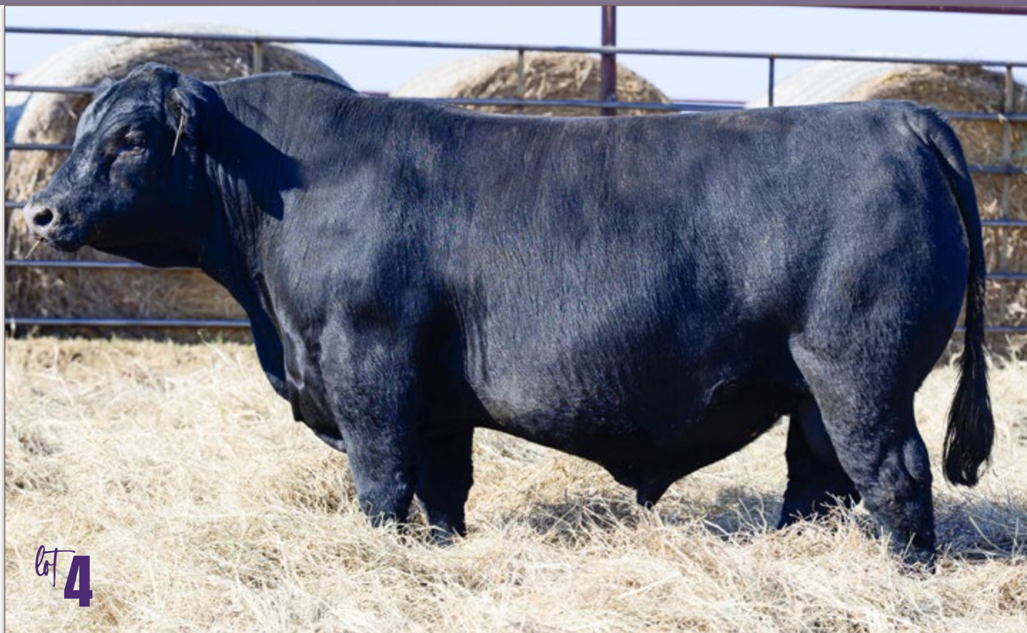
RAFTER 5M STONEWALL 433