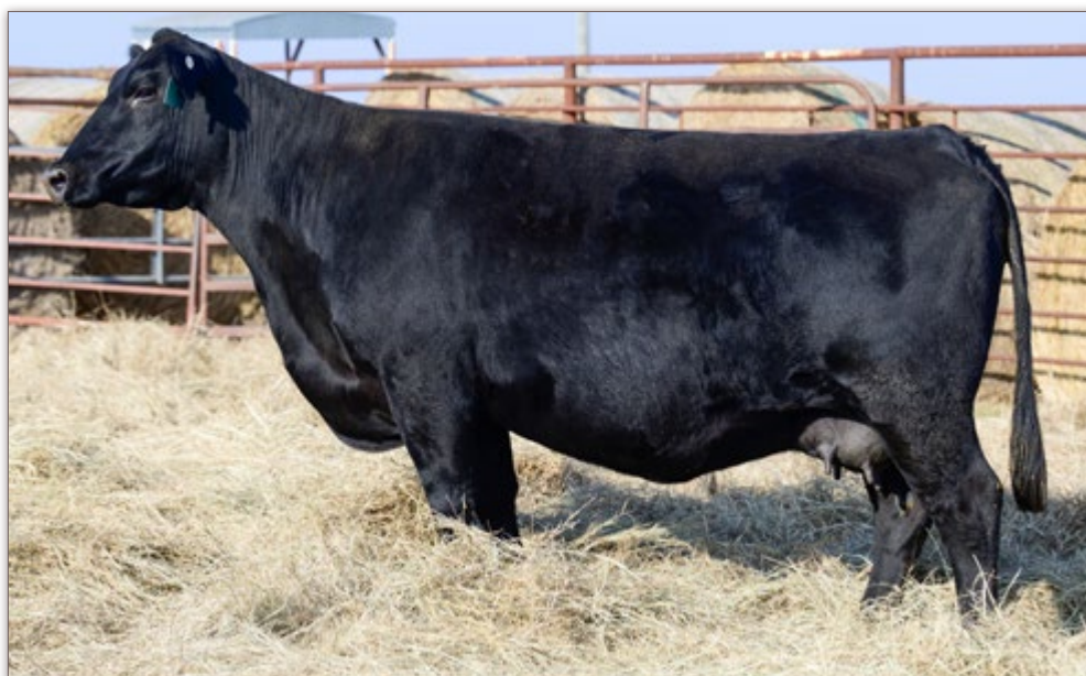
RAFTER 5M BLACKCAP 022 | MATERNAL SISTER TO LOT 38