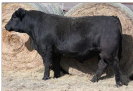
RAFTER 5M RENOWN 255