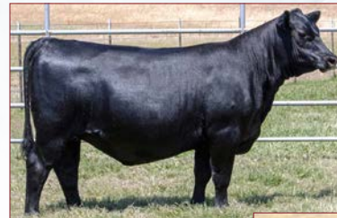
BYRD DixieErica TB 0065-4569 - $145,000 Valued Maternal Sister to Lots 11A-11E Embryos