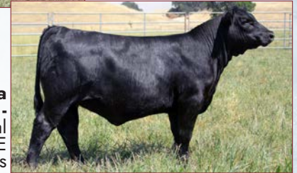
BYRD DixieErica TB 0065-4023 - $165,000 Maternal Sister to Lots 11A-11E Embryos