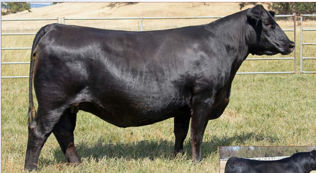
RMRK Rita 0237 - Dam of Lots 7A-7C Embryos