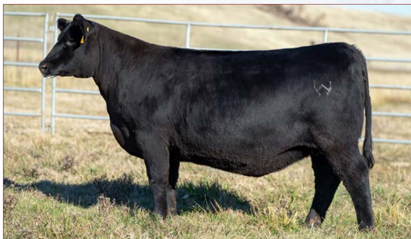
Wilks Princess 3266 - Dam of Lots 4A-4E Embryos

If you're a fan of data, it doesn't take long to realize 3266 is one of the most unique females in the Angus breed. She is a low birth, high CED female that is simply a "way out there" outlier as she ranks in the top 2% of the breed for $M, $G and $C, while ranking in the best 5% of the breed for $EN at +10. When you run a very basic sort with her levels of Marb, RE, $M, $C and $EN, she's the only animal in the breed. 3266 was a $60,000 ½ interest feature of our recent September sale, going to Betts Angus and Loose Arrow Ranch, while a daughter sold to Bear Hill Cattle Company for $32,500. Three embryos out of 3266 by Ambitious were highlights of our February 2025 embryo sale, commanding $12,000 each to the Hay Ranch. In the 2026 National Western Foundation Female Sale, 3266 produced the $18,000 high-selling pregnancy - a sister to the Lot 4A embryos. These 3266 matings could well be set up for a genomic explosion!