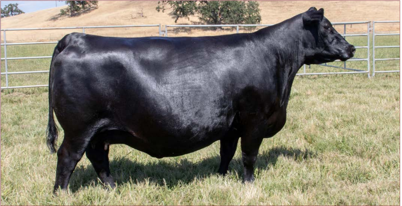
BA7 Oaks Erica J04 - Dam of Lots 3A-3C Embryos

You'll have to look long and hard to find a more visually stunning female than J04 – and her pedigree couldn't be more “right for the times” being out of the recently deceased T220. J04 is a full sister to Bold Ruler at Alta and a maternal sister to Grindstone, War Cry and Sharpie. A Wallace X J04 pregnancy was a $25,000 highlight of our recent September sale going to Kern Cattle, and her embryos topped both the embryo division of our September sale and our 2025 April Opportunity online sale. A full sister to J04 recently produced the $120,000 top selling bull at Galaxy Beef. Even though J04 wasn't on display at the September sale, plenty of folks went and found her and came back raving about how good she was. We are as excited about J04's potential as we've been about any female in a long time, and she will likely highlight our fall 2026 sale. If your goal is to make big numbered cattle that have an exquisite look, these matings demand your full attention.