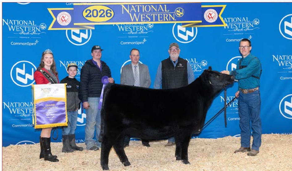
KC Blackcap Lady 5033 - The 2026 National Western Stock Show Champion P & G Female and maternal sister to Lot X & XX embryos

Guarantee 1 pregnancy if implanted by a certified technician.