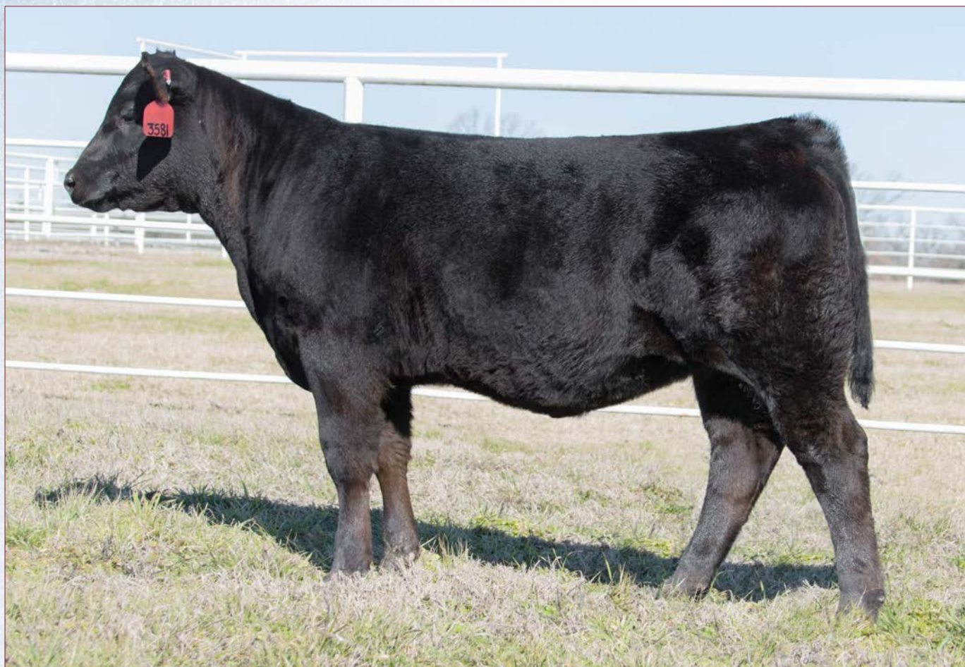
Gabriel Blackcap 3581 - Dam of Lots 5A-5C Embryos

This will be the first public offering of embryos from the $84,000 highlight of the 2024 Gabriel sale that we own with Kern Cattle Company. If you're intrigued by cattle that are unique and hard to make - both genotypically & phenotypically - pay special attention here, as 3581's data profile is unmatched, and her look is stunning! In the next year, we will look to maximize the breed changing potential we believe 3581 possesses. Get in early on these "money making" genetics and ride along with us!