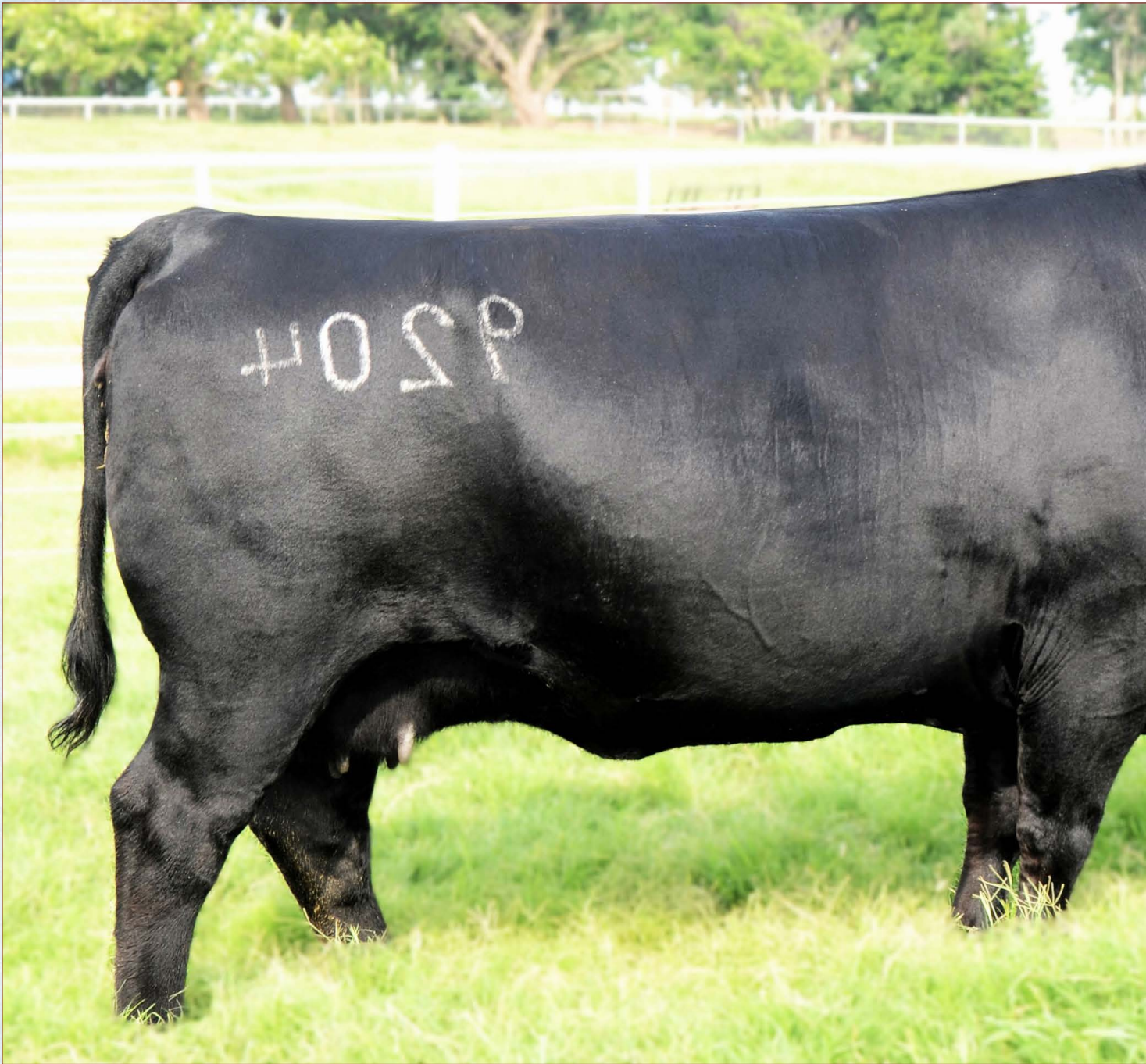
RSA Forever Lady 9204 - Dam of Lots 2A-2C Embryos