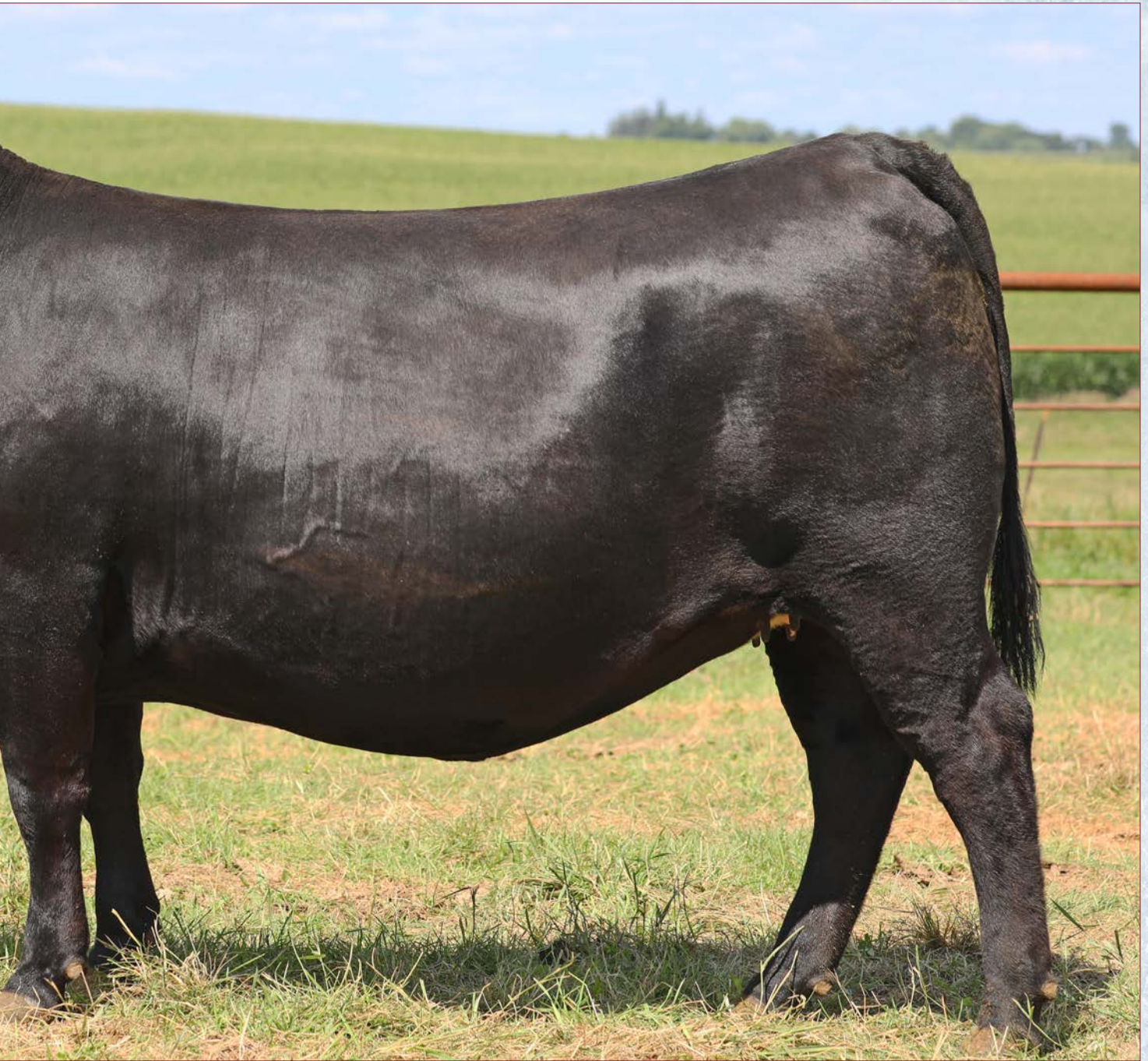
HF Barbara 0169 - Dam of Lot 1A & 1B Embryos