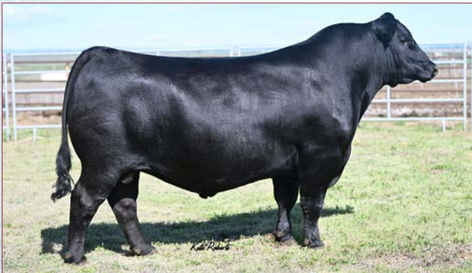
RSA True Balance - Full Brother to Lot 2A Embryos