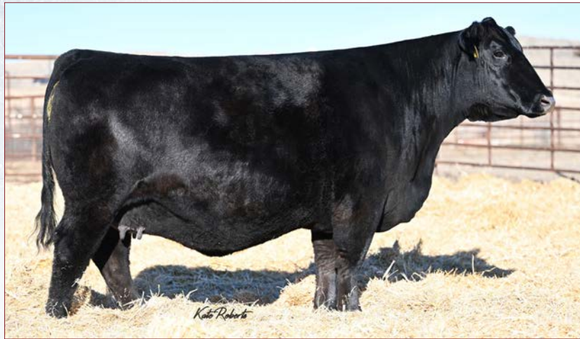
Basin Lucy 8108 - Dam of Lots 10A-10E Embryos

8108 was our $80,000 ½ interest selection from the 2023 Fall Basin Female Sale. In the 2024 Basin Bull Sale, she produced the $110,000 high selling bull to Grimmus Cattle, a $55,000 son to Krebs Ranch and a $20,000 son to Belle Point. Not only does 8108 transmit tremendous depth of body and powerful phenotype to her progeny, she is a DNA upgrader that produced sons with the highest and second highest $C indexes ever recorded in the Basin herd. This cow is the real deal!