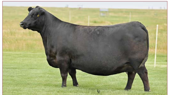
Erica of Ellston T220 - Granddam of Lots 3A-3C Embryos

Guarantee 1 pregnancy if implanted by a certified technician.