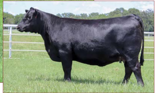
4 Sons Erianna 5K31 - Full Sister to Dam of Lots 12A-12BB Embryos

5K24 is a neat made Surpass daughter that descends from the $300,000 valued HR Erianna 8193. A flush sister to 5K24 that is the #1 $C Surpass daughter in the breed sold in the 2024 Wilks Sale to Galaxy Beef & Smith Valley for $90,000 and she produced two of the three high selling open heifers in the 2025 Gabriel Ranch Female Sale at $160,000 to Express, Nowatzke and Spruce Mountain and $52,500 to 4 Sons – those heifers are full sisters in blood to the Lots 12A & 12AA embryos here. The potential in these matings is unlimited.