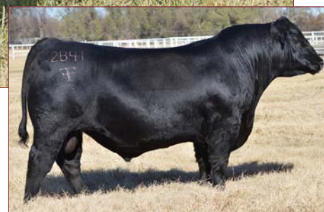
FF Rito Ambitious - Maternal Brother to Lots 7A-7C Embryos