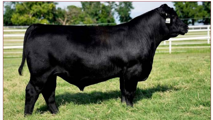
EXAR Anticipation 4836B - Full Brother to Lot 2B Embryos