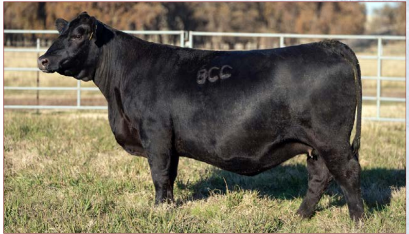
BYRD Rita Prov 0237-2B43 - Dam of Lots 8A-8F Embryos

These embryos are out of the $250,000 valued selection of Circle F in the 2024 National Finals Sale. 2B43 is the most numerically advantageous of the full sisters to two of the hottest sires in the breed today, the $1 million valued FF Rito Hustler and the record setting FF Rito Ambitious owned by Express, Pollard, Spruce Mountain and Riverbend. Want embryos that'll "pop" to the top of the charts for $C? The highest $C heifer calf in the 2025 fall borns at BCC is a full sister to the Lot 8C embryos (21343662), and six out of 12 of 2B43's progeny currently exceed +400 $C. Circle F sold a $40,000 pregnancy to Express in their October sale – don't miss your chance to tie in to a special cow with built in marketability and ride the path to profitability!