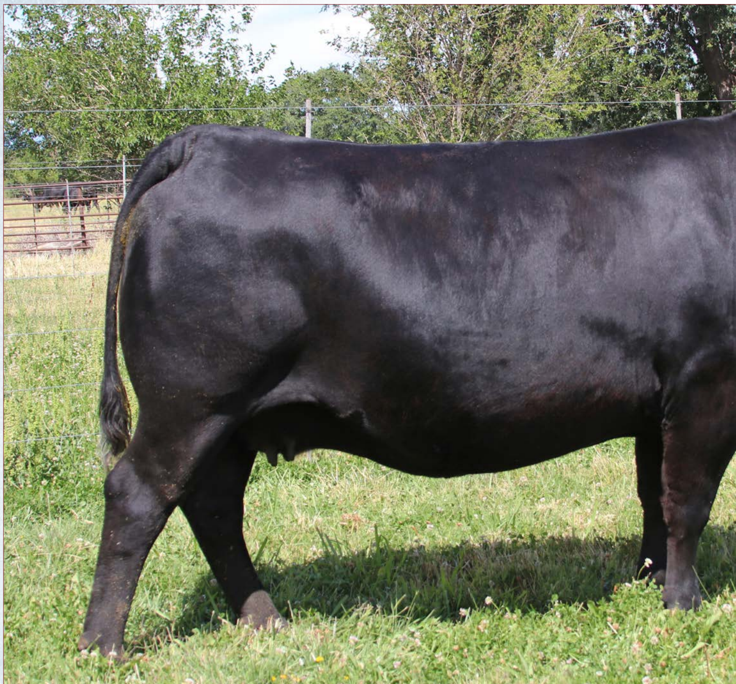
MCC SuperMama 6276 - Dam of Lots 9A-9E Embryos