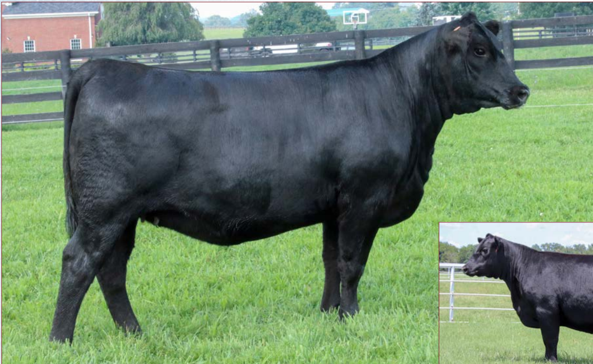
4 Sons Erianna 5K24 - Dam of Lots 12A-12BB Embryos