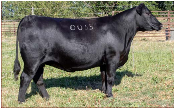
BCC DixieErica 816 8044-0065 - Dam of Lots 11A-11E Embryos