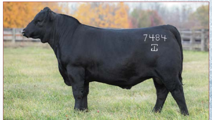
G A R Diligent - Sire of Lot 1B Embryos