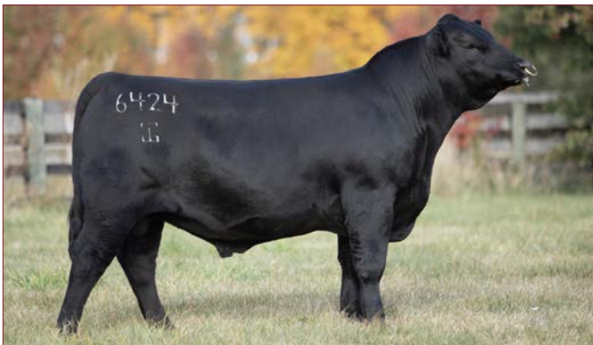
G A R Grand Slam - Sire of Lot 1A Embryos