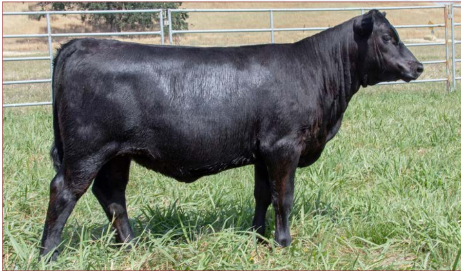
BYRD Blackcap Lady 0172-3009 - Dam of the 2026 National Western Stock Show Champion P & G Female and Lot X & XX embryos