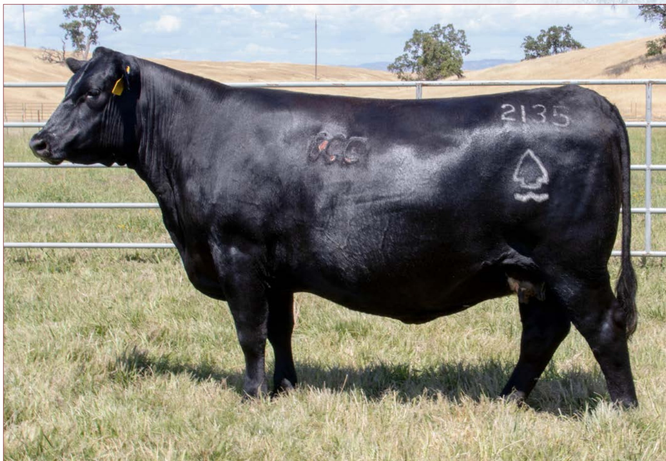
PAR Barbara 2135 - Dam of Lots 6A & 6B Embryos

2135 is a "hidden gem" with her first embryo offering available in this sale. We purchased her and her heifer calf as the $42,500 high selling pair of the 2024 Percy sale. A year later, in our fall sale, that heifer calf sold as the #1 $C Heat Seeker daughter in the breed for $70,000 to Three Trees Land & Cattle and is now working as a donor in the Peak Genetics program as well. You don't often find cattle that look like 2135 with a data package like hers!! 2135 likely has a high profile spot in the fall 2026 sale here – take advantage of the chance to get out in front of the pack!