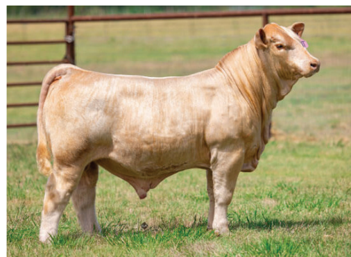
SIRE OF EMBRYOS - PAT