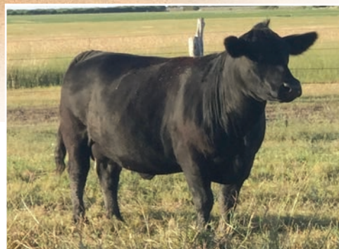
DAM OF EMBRYOS - 202 DONOR