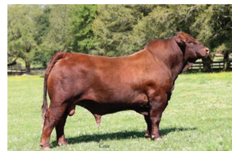
SIRE OF EMBRYOS - TCC PLAYING WITH FIRE