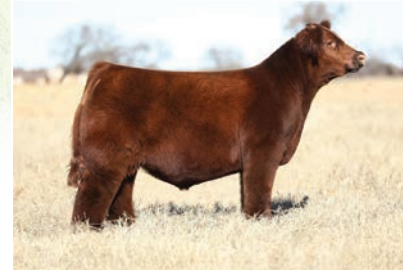
SIRE OF 20B EMBRYOS - WATER TO WINE