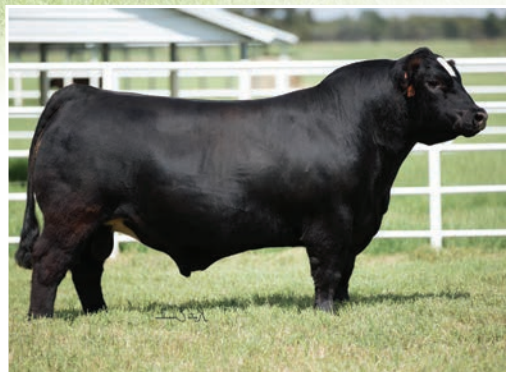
SIRE OF ADELA - GAVIN

Adela is one of those females that has a dominant show career and then goes on to our perform the banners she hung with her production of big dollar generating progeny who also go on to hang their fair share of banners. The first thing you think when you see this female in person is her functionality and how she blends so much mass with a refined front end. Her sire HL Gavin is a bull we lost too soon, his ability to produce cattle like Adela is only now being realized. The legend of Keep Swinging will only grow with this mating the Adela.