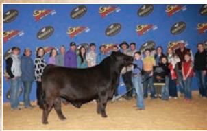
MATERNAL SIB TO AMERICAN DREAM

A direct son of our great cow we call Linda, as well as a direct son of our personal favorite Brangus bull, Wall Street!! We truly believe this bull has a place and are excited to get him to production, we have already flushed and AI'd a bunch of cows to him and have got calves on the way!! To tell you the amount of confidence we have in him I could ramble on and on as I am very capable of doing!! I will tell you we went as far as transferring these into purchase pregnancy cows that we were having to give north of $5000 ahead for 60 day pregnancies- and if that doesn't show you how much confidence we have in this bull then I would say you just don't understand how much courage that takes!! Buy the semen, use the semen, count your money!! It's THAT EASY.