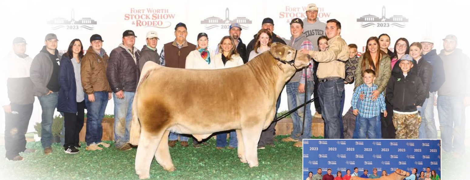
CHAMPION AMERICAN STEER 2023 FWSSR • FULL SIB TO 34A EMBRYOS