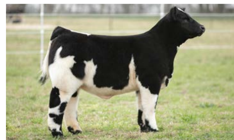
FULL SIB TO CHAIN BREAKER - SOLD 1/2 INTEREST $43,000