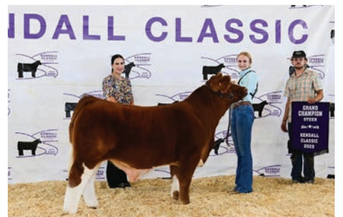
FULL SIB TO EMBRYOS - GRAND CHAMPION 2025 KENDALL CLASSIC