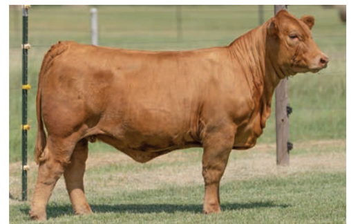
FULL SIB TO LOT 11A - SOLD FOR $10K