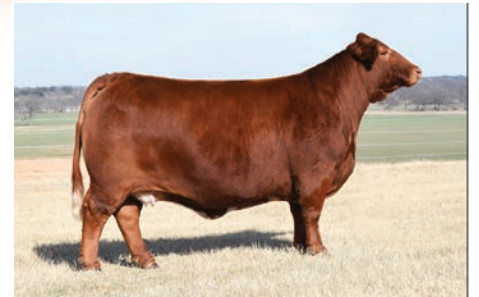
WR FOXIE - GRAND DAM