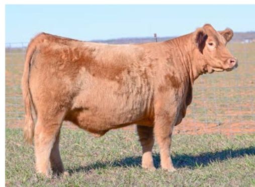
QB 123, LOT 8 IN 2025 SOLD FOR $37,000 SIRED BY IGWT