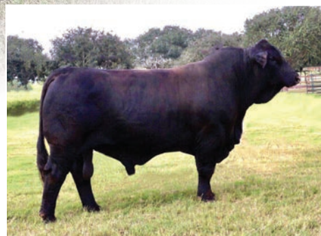
LMC MT TRANSFORMER 5E/32

Houdini is POLLED, stout, rugged, sound, and as good looking as you can make a 5/8 Brahman influenced bull. The more I type and think about it, I really don't know why we are selling 50% possession and 50% semen interest on a bull of this magnitude. Feel free to call or text with any questions. Raise your hand, click the button, phone a friend, it really doesn't matter just get involved with this unique piece of history!