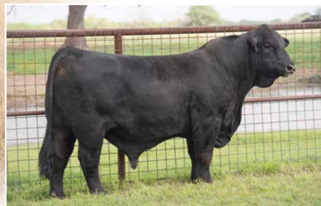
SIRE - DDD WALLSTREET 150C