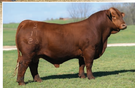
SIRE OF EMBRYOS - BET ON ME

Selling 1 Package of 3 Female Sexed Embryos - Guarantee 1, Stored at Trans Ova, Bryan, TX