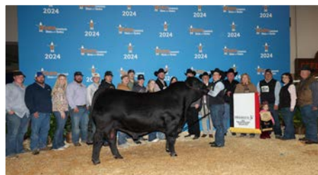
SON OF BELLE OF THE BALL - ORIGINS KNOCK OUT 302K2