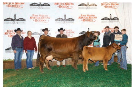
FULL SIB - RESERVE GRAND CHAMPION SIMBRAH FEMALE 2026 FWSS OPEN SIMBRAH SHOW