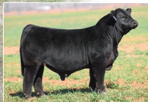
SIRE - QB NELSON