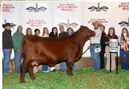
2022 NATIONAL CHAMPION, DAUGHTER OF SYRUS

Two-time Reserve National Champion, sire to 7 National and Reserve National Champions, Syrus has been named SGBI Sire of The Year 3 times. Syrus adds bone, volume, and power to his offspring. His daughters and granddaughters are making tremendous, sought after females that work in both Purebred and Club Calf programs. Semen is stored at Integrated Breeders Service in Wheelock, TX. This will be the first offering on Syrus semen since spring of 2024. Purebred or Club Calf, Syrus is proven and profitable.