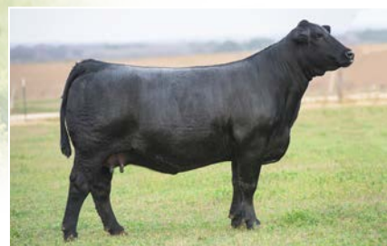
DAM - RAFTER L AMY JO 157H3

Lot 52: Selling - 2 Packages of 2 straws of Unsexed / Conventional - 2 Packages of 2 straws of Sexed Male - 2 Packages of 2 straws of Sexed Female Semen Stored at Trans Ova Genetics, Bryan, TX