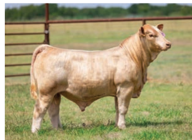
SIRE OF 19C - PAT

- All Lots Guarantee 1, Stored at Hoofstock, Ranger, TX