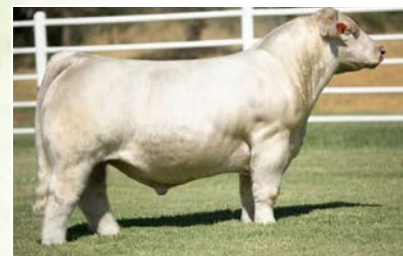
SIRE OF 20A EMBRYOS - KING OF KINGS