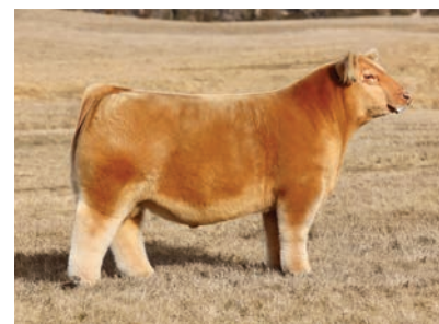
SIRE OF 25C EMBRYOS - GREATER GOOD