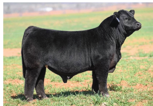
SIRE OF 23B EMBRYOS - QB NELSON