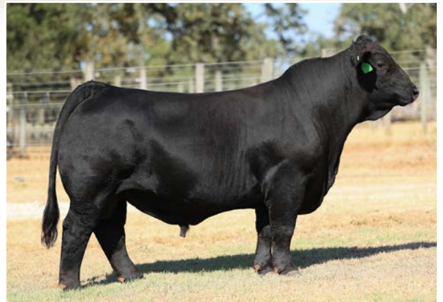
D-/CCC FULL CIRCLE 150L

As we make our way into 2026, it's no secret the 313 cow family is easily one of the hottest in the breed today. The dam of these embryos is a direct daughter of the $41,000 313F and a granddaughter to the $120,000 313A. While this Crosscut daughter was purchased to compete in the showing her ultimate purpose was to produce offspring that blend phenotype and genomics that can compete on the national stage. 313J5 is flawless in her structure and her build is what we think about when we talk about longevity in the Brangus breed. We saw the Full Circle bull at the bull stud and went straight to the online offering to gather up 10 straws. These heifers should be cool, powerful and most importantly highly marketable!!