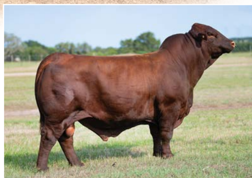
SIRE OF EMBRYOS - VALEDICTORIAN

This is a mating built on dominance, predictability, and proven results—one that continues to write its own legacy.