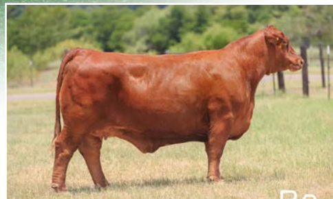
DAM OF EMBRYOS - 255