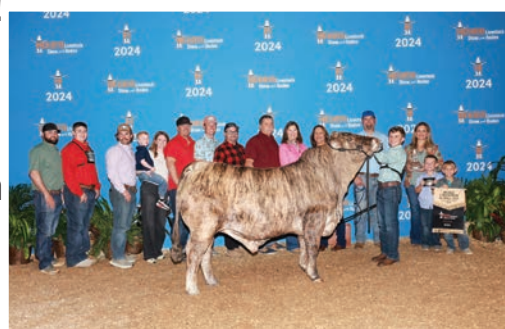
FULL SIB, HLSR BREED CHAMP 24' RAISED BY RORY D, SOLD BY WALDRIP & DOSS TOREZ