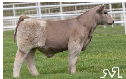
THE WOLF X RVR 701