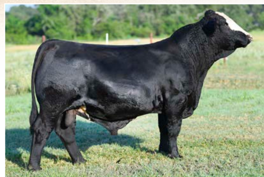
SIRE OF EMBRYOS - HAGAN HUSH MONEY