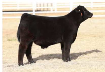
FALL 2025 BORN Sired BY KEEP SWINGING X 888