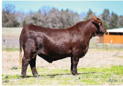
SIRE OF EMBRYOS - 777 CANDYMAN 17K4

- Guarantee 1, Stored at 605 Donors, Piedmont, OK