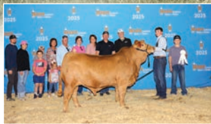
3RD PLACE BRAHMAN 2025 HLSR VOODOO SON