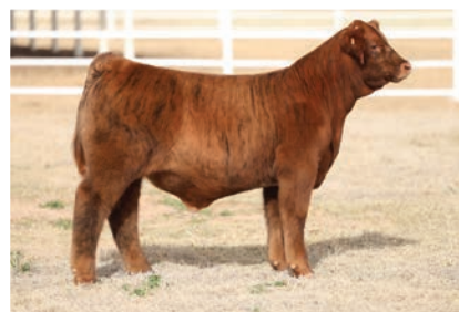
FALL 2025 BORN Sired BY KEEP SWINGING X 888