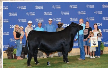
MATERNAL SIB - CHAMPION LWT AMERICAN SFT 24'

★ Selling 1 package of 4 IVF Embryos - Guarantee 1, Stored at Trans Ova Genetics, Bryan, TX