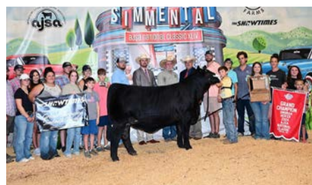
GRAND CHAMPION 2024 JUNIOR NATIONALS

What is there to say about Athena that her resume doesn't already tell. Record setting $35,500 purchase out of the Club 1835 fall event, undefeated in the calf division, junior National Champion, Ft. Worth Champion, and capped off her illustrious show career by being named the supreme champion American female right here in San Antonio one year ago. When you see her in person you understand why she had so much success. Giant soft feet, loose structure, great body and balance, with a quality look that oozes off of her. She's elite in every way. We are trying daily to make Simbrahs with this kind of foot quality and softness of structure and body and trust us, it's not easy. She will be the cornerstone to our Simbrah program moving forward. Jump in early and immediately elevate into the upper echelon within the Simbrah breed or take her to a club calf bull that will make ELITE ELITE Americans. We feel strongly she can be a clean blooded option that taken to the right bull can make the next American badass in cow town or anywhere else.