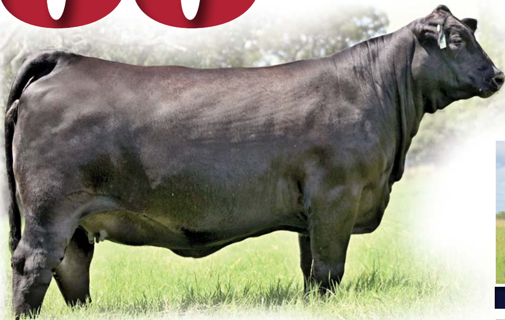
TCR BELLE OF THE BALL 302A - FULL SIB TO EMBRYOS