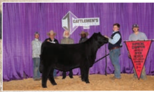
DAM TO FULL COUNT