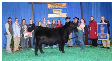
DAUGHTER OF BELLE OF THE BALL ORIGINS MISS HERA 302M3