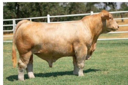
FULL SIB TO 3B • GOD BLESS AMERICA

Predictability is the name of the game and these are about as much of a known commodity as you'll find in this business regardless of breed. This full sib mating to God Bless America and the 2023 Champion ABC Steer in Austin has been a staple here at American Nation.