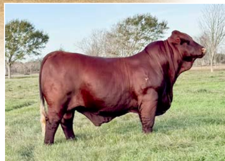
SIRE OF 62A EMBRYOS - PHAROAH