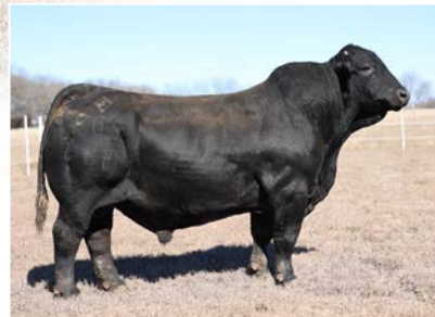
SIRE OF DONOR - DDD STOCK OPTION 804B43