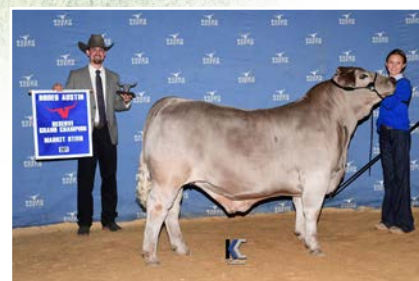
FULL SIB TO 3A • RES GRAND STEER 2021 AUSTIN

You know at American Nation we love to offer those full sibs to past champions. This mating to Sugar bear is a full sib to your 2021 Reserve Grand Steer at Rodeo Austin and another reserve American at the State Fair of Texas in 2024. Silver Americans like this mating produces are the real deal when it comes time to put checks in the bank!