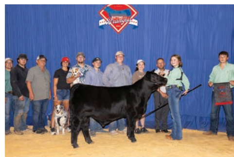
FULL SIB TO EMBRYOS GRAND CHAMPION PERCENTAGE 2024 LJBBA STATE SHOW