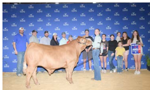
MATERNAL SIB TO EMBRYOS RES CHAMPION ABC 2024 AUSTIN