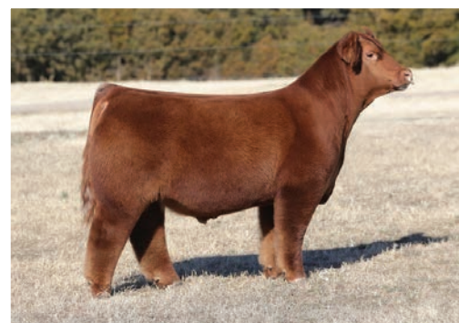
SIRE - JUST CHILLIN