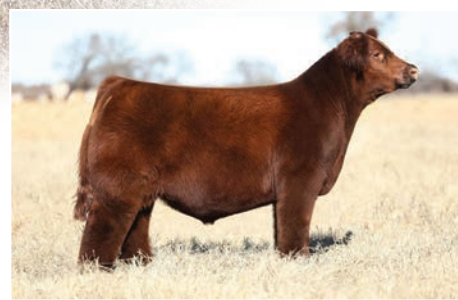
SIRE - HL WATER TO WINE