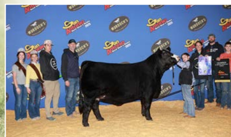
SUPREME AMERICAN HEIFER 2025 SAN ANTONIO