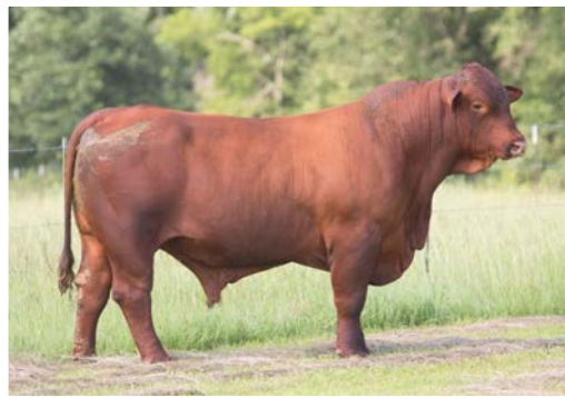
SIRE OF EMBRYOS - MR FLEX