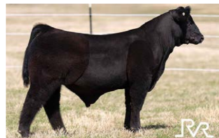
THE WOLF X RVR 999 - "IBB"