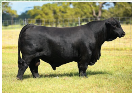
SIRE OF EMBRYOS - DIAMOND K'S KINGDOM 157M

Lot 53: Selling 1 Package of 5 IVF embryos - Produced by Trans Ova using Female Plus technology - Guarantee 1, Stored at 6B Show Cattle, Florence, TX