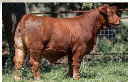
DAM - LA ROUGE (CAJUN) (DREAMSICLE X HL 707) (FULL SIB TO GOLDEN BOY)

Selling 1 Package of 3 Sexed Male Embryos - Full Sibs to Heifer - Guarantee 1, Stored At Trans Ova Genetics, Bryan, TX