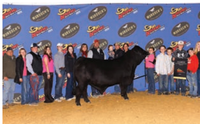
CHAMPION BRANGUS STEER 2023 SAN ANTONIO FULL SIB TO WALLSTREET EMBRYOS