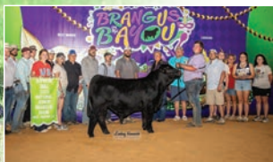
SUPREME BULL 2025 BRANGUS JUNIOR NATIONALS