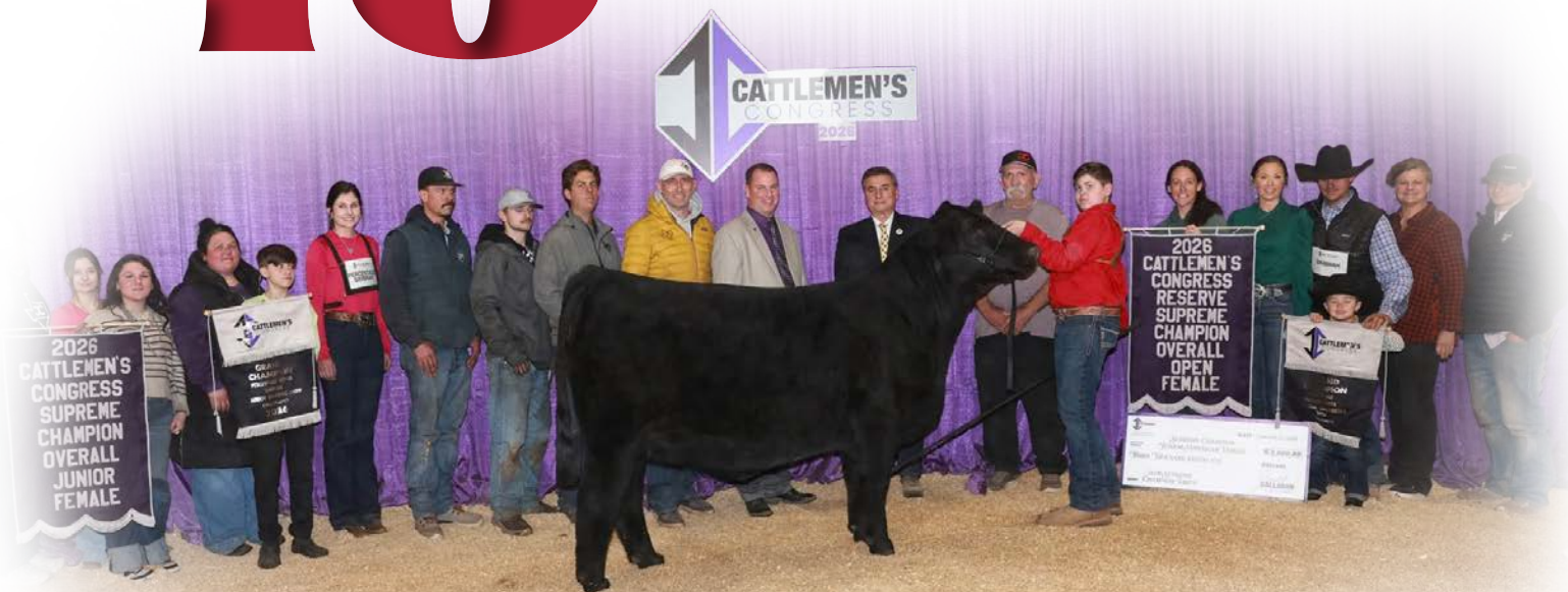
SUPREME AMERICAN JUNIOR HEIFER 2026 CATTLEMEN'S CONGRESS • FULL SIB TO EMBRYOS

HAGAN MARVELOUS 034M REG # 4420830 BREED % SIMBRAH/ARB