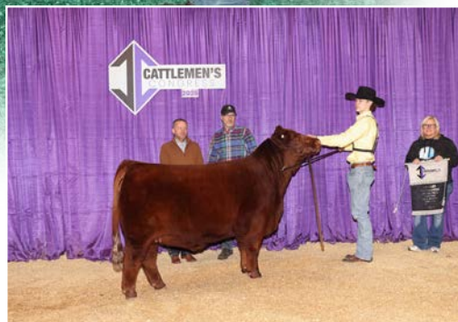
GRAND CHAMPION STAR 5 FEMALE 2026 CATTLEMEN'S CONGRESS

★ Lot 61: 50% embryo interest, no possession - No Possession