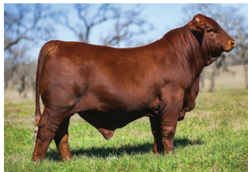
2022 NATIONAL CHAMPION, SON OF SYRUS