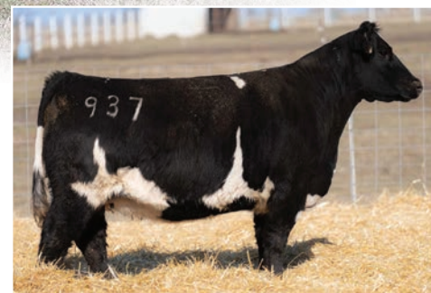
DAM - QB 937