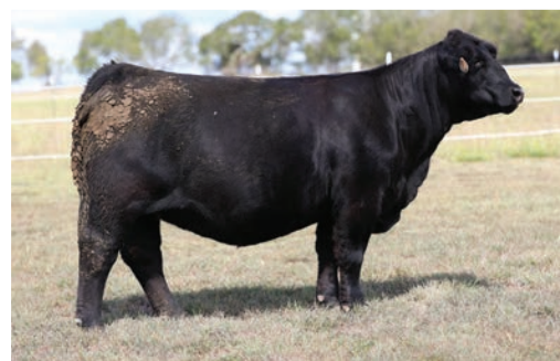
DAM OF EMBRYOS - DONOR 30 (MINDE'S SISTER)