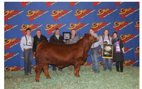
DAM OF WR CHOCOLATE • WR MELANIA