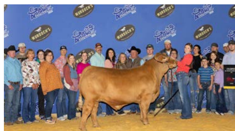
MATERNAL SIB TO EMBRYOS CHAMPION ABC 2024 SAN ANTONIO