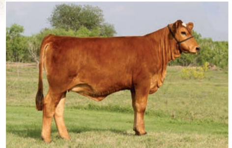
DAM OF EMBRYOS - 3CC CTCF GWEN