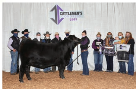
FULL SIB TO EMBRYOS - TCR MARILYN 302G2