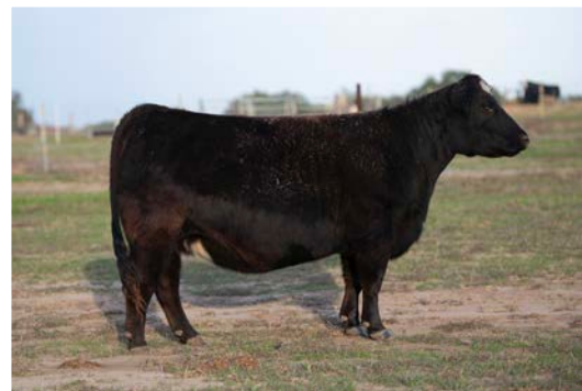
DAM OF EMBRYOS - RRF TIARA 034G