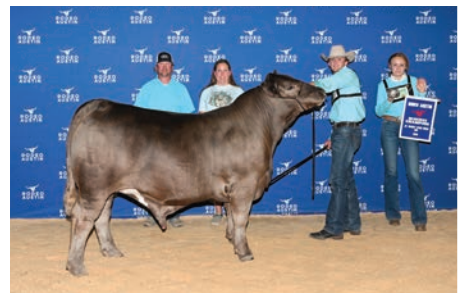
RESERVE ABC 2023 RODEO AUSTIN