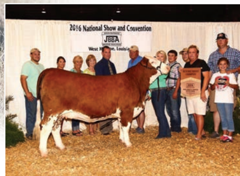
DAM - DOLLY'S DELIAH

Lot 46: Selling 100% Possession - Retaining the Right to 2 Successful IVF Aspirations