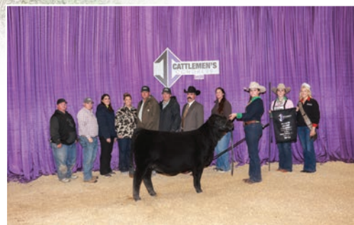
RESERVE PERCENTAGE BRANGUS HEIFER 2026 CATTLEMEN'S CONGRESS JUNIOR SHOW

- Allen Cattle retains the right to (2) IVF FLUSHES with a minimum of 6 embryos at our expense and the new owners convenience.