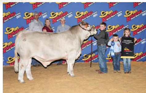
$31,000 HIGH SELLER - 2021 CHAMPION SIMBRAH