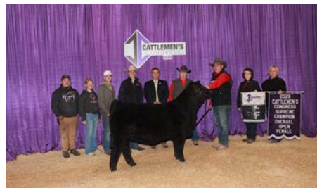
PATERNAL SIB - GKB MISS STARSTRUCK 924N6