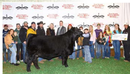
GRAND CHAMPION SIMBRAH 2025 FORT WORTH