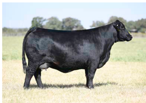
DAM OF 804J4 - GT MISS CROSSOVER 804C3