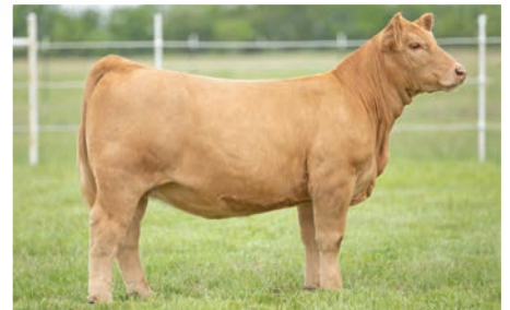
AMAZING GRACE DAUGHTER SOLD 1/2 INTEREST FOR $10,000

★ Selling 1 Package of 4 Embryos (2 IGWT, 2 Blessed Assurance) - Guarantee 1, Stored at Bullnanza, Sweetwater, Tx