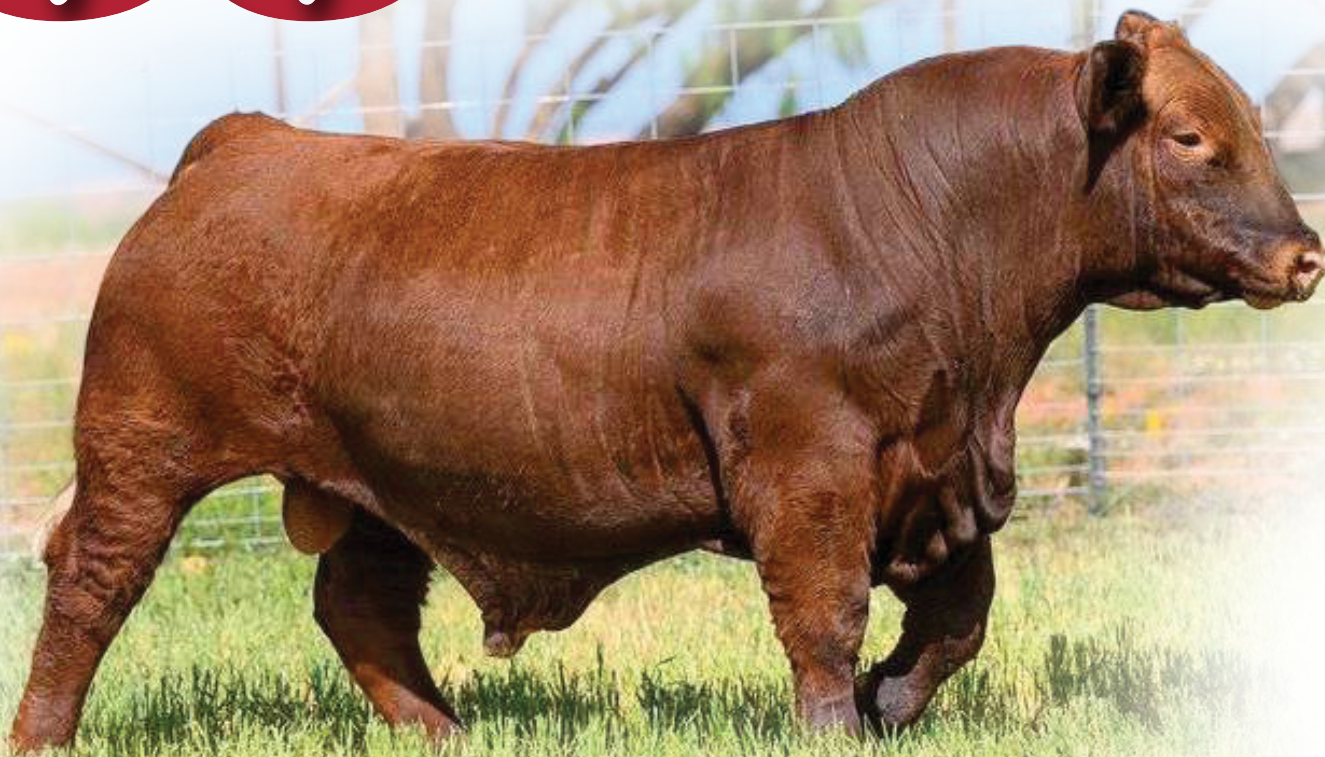
SIRE OF EMBRYOS - RED 5319

We took one of the phenomenal full sisters to the lot 34A mating and blind flushed to Rory Duels Red 5319 bull! These were put in last year and all we can say is this was an absolute home run!! Study the pedigree in this mating and it's no surprise the calves came out looking like they did. All but one calf was red hided, all are powerful with style to burn, running gear for the long haul, and HAIRY HAIRY HAIRY!!!! They were so good we flushed a couple other sisters to 167 the same way this year!!!