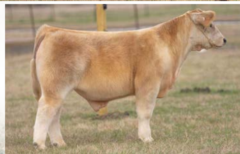
$85,000 HIGH SELLER - MATERNAL SIB TO DAM

Bidi Bidi, you might've guessed, is named after the famous SELENA. If you ever tried to draw an American donor as exotic, STOUT, and cool colored as you could make one, more than likely you'd sketch out Reed Vestal Ranches Donor 9065, "Bidi Bidi". She is the natural calf out of the famous Embryo Donor 6065 and their bull, American Ranger. She is a maternal sib to the very popular and dominate Champion Simbrah at San Antonio shown by the Jenschke family, and sibs to many, many other champions, and high sellers. Including the highest selling American steer ever at $85,000! Given how young she is, Bidi Bidi has only had two calves up to this point. Our best calf this year is quite possibly out of Bidi Bidi. Extremely high quality. To say we are ALL IN on this donor is an understatement. Jam packed with pedigree and just crazy phenotypical potential, GET IN while you still can. She is just getting started folks! This impressive specimen is at your disposal. Take advantage.