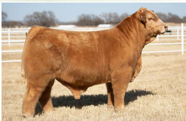
SIRE OF CALF - GOLDEN BOY

HL 8217 is one of favorites in Anson, Texas regardless of breed and it's easy to see why!! If you want to be on the forefront of American steer production and get the first shot at one of the unique mating at Horn Livestock then take a look at what we did here. We took one of the best cows on the place and mated her to Golden Boy so we could exclusively offer a pregnant recip due this coming August. This mating has the making of something truly special and is likely what the next generation of American steer production looks like around here. There is not question, the Golden Boy progeny have consistently proven they work on cows just like 8217. We believe in this mating, she represents some of our best coming this fall!