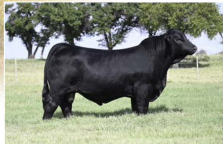
SIRE - GKB PERFECT STORM 804H20

Lot 50: Selling 100% semen and 100% possession