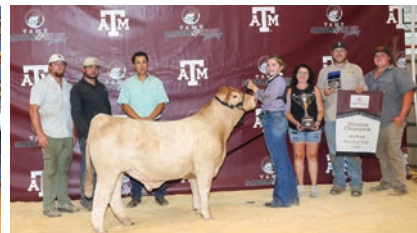
CHAMPION AMERICAN STEER 2025 SADDLE & SIRLOIN FULL SIB TO READY OR NOT EMBRYOS