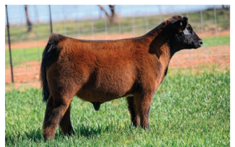
$19,000 SON Sired BY HGTA