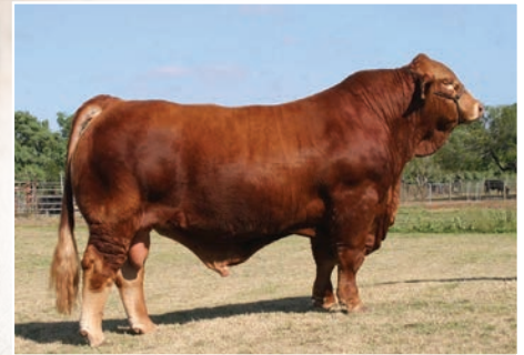
SIRE OF EMBRYOS & SEMEN LMC GOLD MEDAL 5Z/75 SEMEN