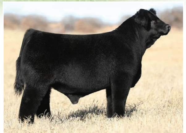
SIRE OF EMBRYOS - KEEP SWINGING

★ Lot 21: Selling 1 Package of 3 Unsexed Conventional Embryos - Guarantee 1, Stored at 66 Genetics, Yukon, OK