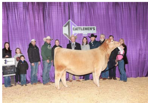
DAM OF EMBRYOS - CHAMPION CHAROLAIS COMPOSITE FEMALE 2024 CATTLEMEN'S CONGRESS