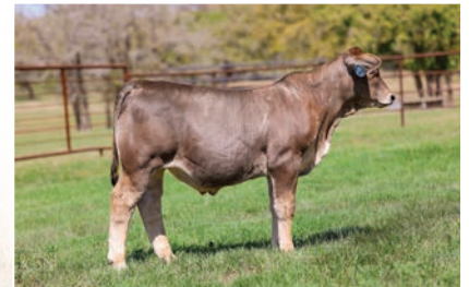
FULL SIB TO LOT 14B EMBRYOS