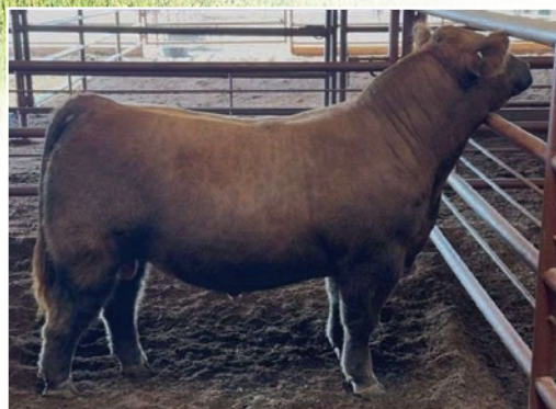
SIRE OF EMBRYOS - BLESSED ASSURANCE