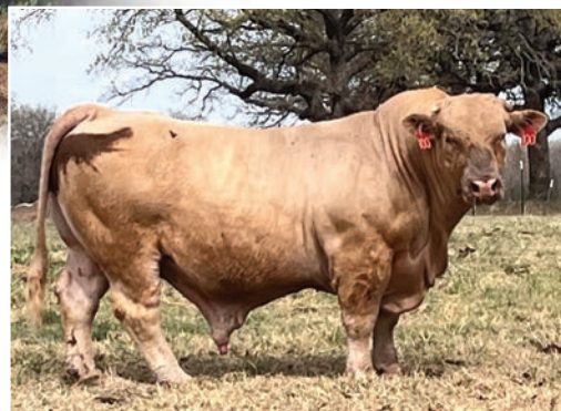
SIRE OF EMBRYOS - CM