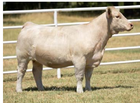
DAM - 8145