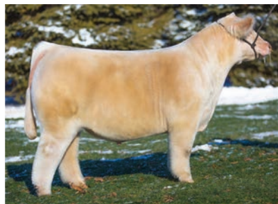
SIRE OF 26B EMBRYOS - IN GOD WE TRUST