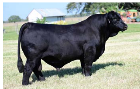
MATERNAL SIB - TCR HEAVY DUTY 56G