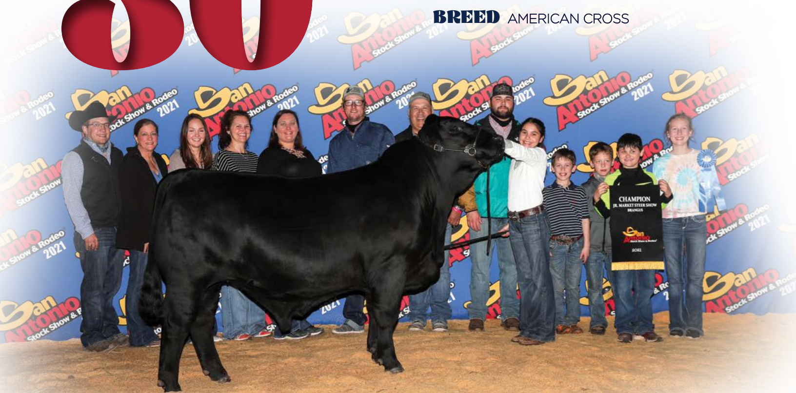
3/4 SIB TO EMBRYOS - CHAMPION BRANGUS 2021 SAN ANTONIO