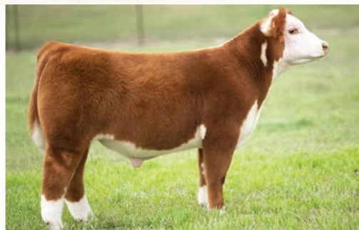
SIRE TO LIVE LOT - RANCH WATER

Lot 10: Selling 100% Possession - Retaining 3 Flushes, 10 Embryo Minimum at Buyers Convenience