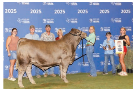
FULL SIB TO 34A - RES. HVY DIVISION AMERICAN 2025 SFT