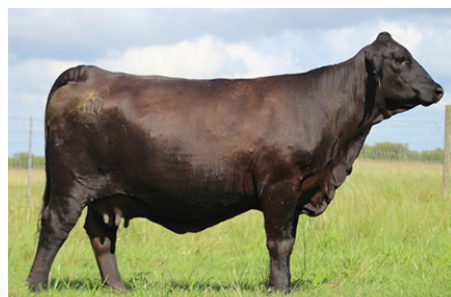
SCC. BELLA'S HERCULES 302X3

- Guarantee 1, Stored at Trans Ova Genetics, Bryan, TX