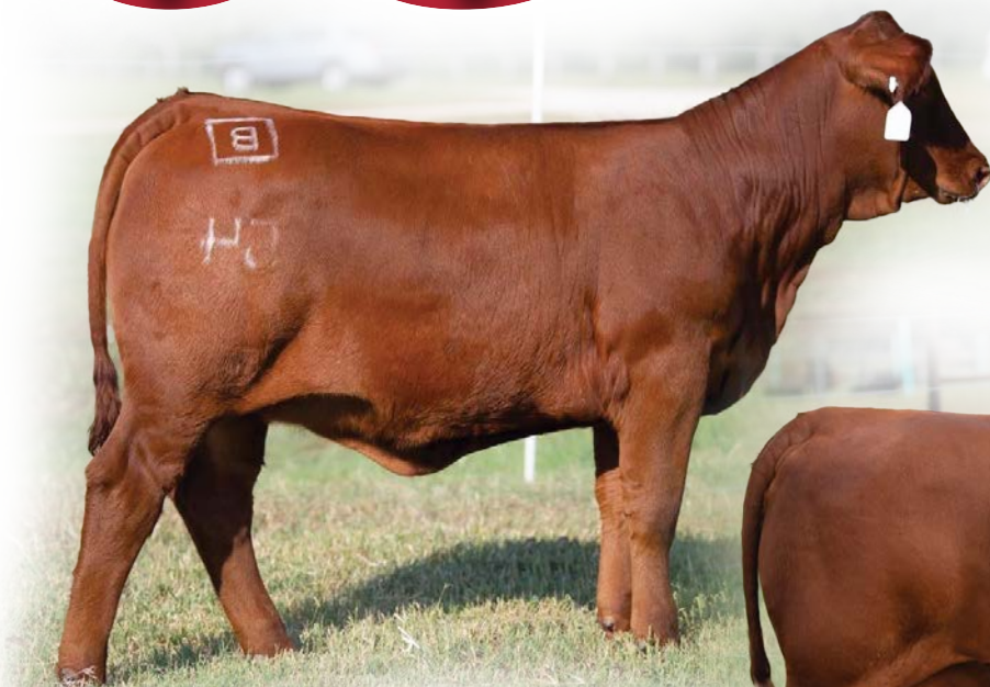
FULL SIB TO EMBRYOS - BSR LADY POISON, SOLD FOR $42,000

This mating has truly changed our operation in more ways than we could have imagined. The consistency, quality, and versatility it has produced set a new standard for B Square Ranch.