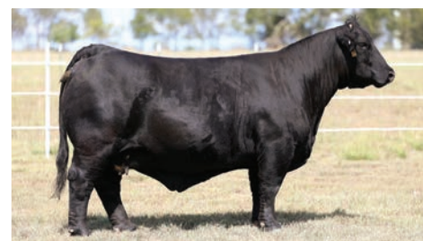
DAM - MINDE