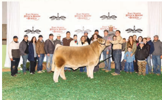
MATERNAL SIB TO DAM OF EMBRYOS CHAMPION AMERICAN STEER 2023 FWSSR

- Guarantee 1, Stored at Trans Ova Genetics, Bryan, TX