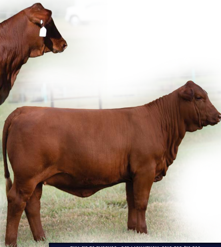
FULL SIB TO EMBRYOS - BSR LADY VENOM, SOLD FOR $19,500

Lot 63: Selling 1 Package of 5 Conventional Embryos - Guarantee 1, Stored at Trans Ova Genetics, Bryan, TX