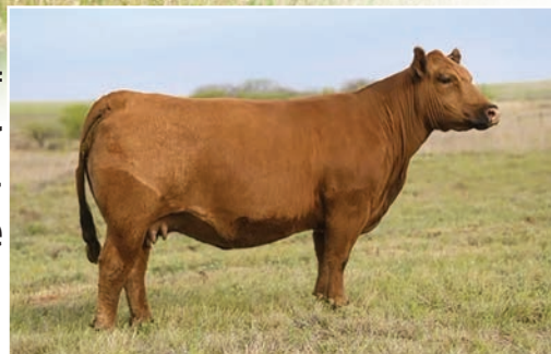
DAM - 5319

- Guarantee 2 Pregnancies As A Result Of This With No Cap