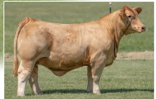
FULL SIB TO LOT 11A - SOLD HALF INTEREST FOR $39,000