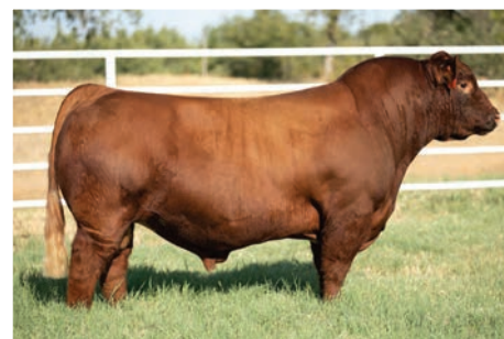
SIRE OF 34B EMBRYOS - STANDOUT