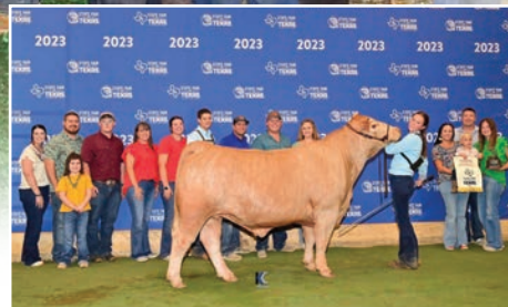
FULL SIB TO 34A - 23' CHAMP HEAVYWEIGHT SFT

Highly anticipated mating here!! Haven't had any hit the ground yet, but we feel confident there will be lots of RED and lots of HAIR!!! Anything with F13 in the mix is worth latching onto!! Maternal sibs to lot 34A.