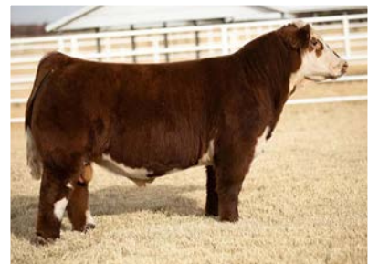
SIRE OF 20C EMBRYOS - GOTCHA