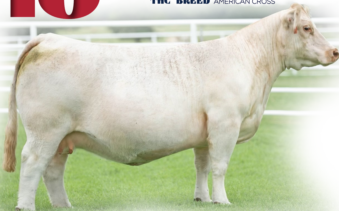
DAM - HL 8217

SIRE OF CALF GOLDEN BOY DAM OF CALF HL 8217 (THE GENERAL X SOLID GOLD/620) THE BREED AMERICAN CROSS