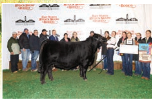
FULL SIB TO KINGDOM GRAND BRANGUS HEIFER FWSS 2026

This is the biggest footed animal we have raised at the ranch. Kingdom is extremely level in his lines, impeccable in his skeleton, and his moderation and breed character suggest that he is useful in both purebred Brangus operations as well as raising high quality American show steers. Kingdom is a son of KK Miss Relentless 157E, the former 2X IBBA Grand Champion Female in Houston, half-brother to the 2024 Grand Champion Brangus Female at the National Junior Brangus Show and a full-brother to the 2026 Grand Champion Brangus Female at the Fort Worth Jr. Heifer Show. With the power from the bottom side of his pedigree, we feel confident about his consistency and soundness. Don't miss out.