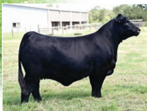
MATERNAL SIB TCR ZENDAYA 9K

The one word to best describe Donkey Kong is proud. He is sexy and he knows it. He is cocky and walks around like a cobra about to strike. DK's coat is beautiful and bold with soft, supple hair and plenty of it. We only have a calf picture of him because the second he tested – he went on cows. He is an August 2024 calf and froze high quality semen on his first jump. This bull has plenty of character without being sloppy and overly leathery. Donkey Kong's best attribute is definitely his soundness and impeccable leg set. He has an awesome set of bendy, cushy back wheels that reach out and grab the ground in the most ideal way. He is round and robust in his upper rib and packs plenty of punch in his hind quarter. This bull's presence, soundness, and character could be a real game changer on shorter backed, dense made American or exotic type cows.