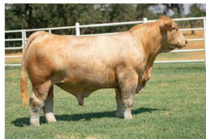
MATERNAL SIB TO 888