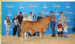
FULL SIB TO OPEN THE GATE RES BREED CHAMP 2025 HLSR

This bull is growing and growing in popularity!! His calves are truly as good of a set top to bottom as I could've ever dreamed of having!! His pedigree speaks for itself, he's out of a legendary cow and a bull that has no bigger fan than me, he does not miss, they come out good and spend every day of their life getting better. Lovin 750 is as good as they get, and he increases in his consistency when used on eared cattle!! If the Open the Gate cattle feed half as good as the L750s there will be more than one in the winner circle in 2027!! I love this bull's mom. I love this bull's dad!! I am this bull's number one fan. I would use this opportunity to get a little juice on a bull that was "up-and-coming" but based off how his calves look now I would say he is HERE!!