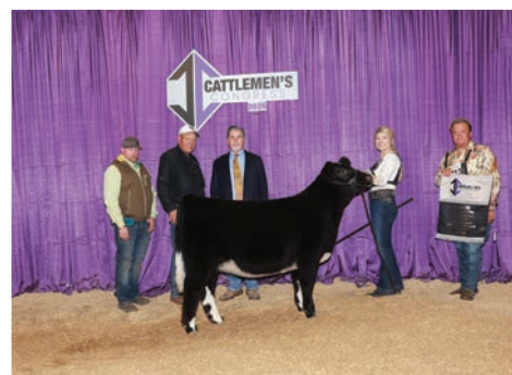
ELLIS DIME GRAND CHAMPION E6/ADVANCER 2026 CATTLEMEN'S CONGRESS