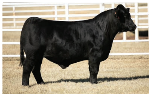
AI'D TO - HL GOOD LOVIN'