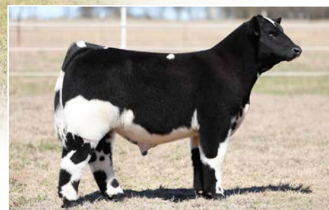
CHAIN BREAKER - 7 MONTHS

Lot 2: Selling Full Possession & 50% Semen Interest