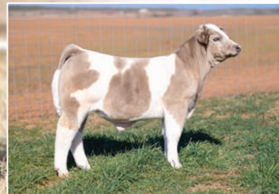
FULL SIB TO 19A - 2916 X KEEP SWINGING

★ Selling 1 Package of 3 Sexed Male IVF Embryos