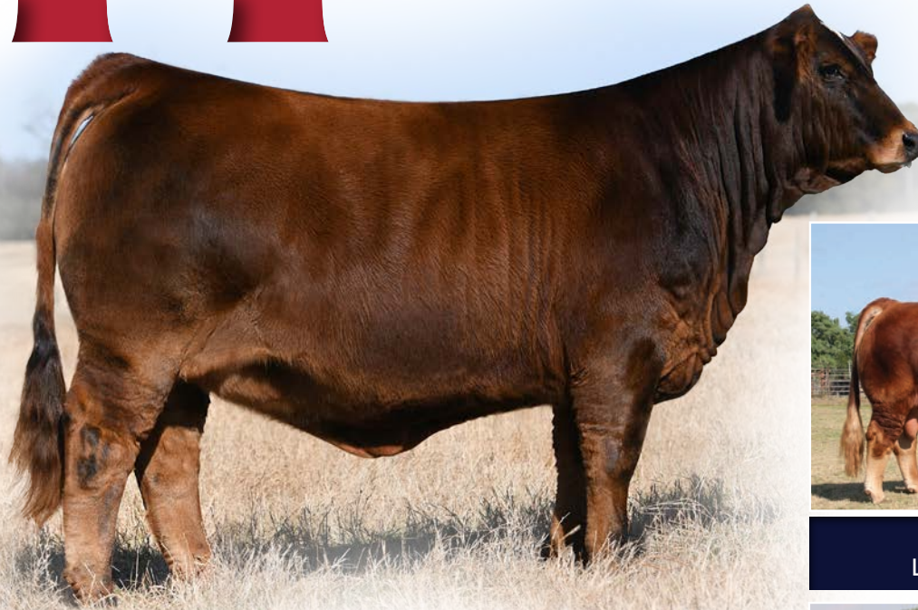
3CC LMC GIN BLOSSOM L69 • FULL SIB TO EMBRYOS