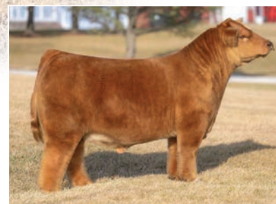
SIRE OF 25A EMBRYOS - GOLDEN TICKET