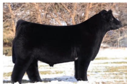
SIRE OF LOT 3C • HOW GREAT THOU ART

This mating will bring some color variation, we have seen some red tigers from this mating and HGTA will put the bone and mass in these calves that make them highly marketable at weaning.