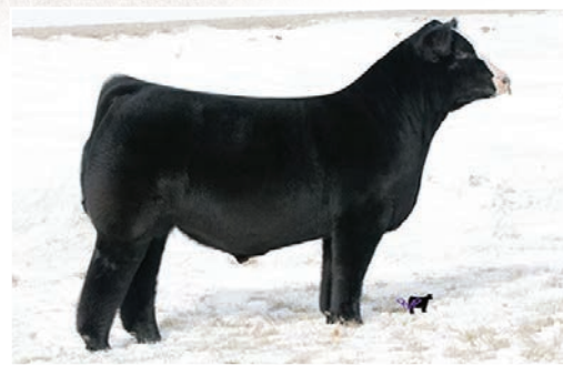
SIRE OF EMBRYOS - AIN'T BLUFFIN

Selling 1 Package of 4 Conventional IVF Full Sib Embryos - Guarantee 1, Stored At Trans Ova Genetics, Bryan, TX