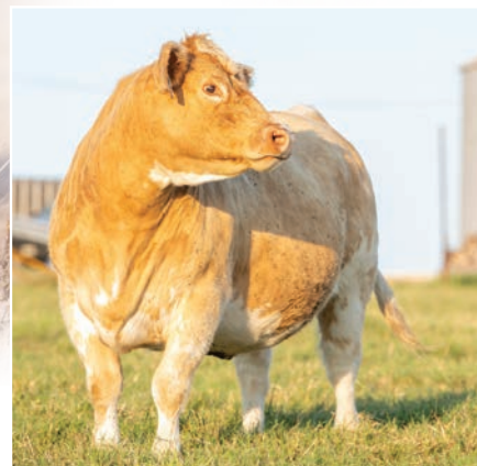
DAM - 012 DONOR