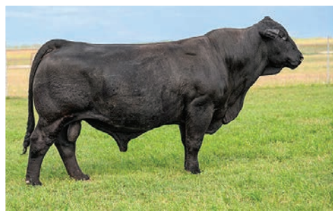
SIRE OF LIVE LOT & 8B - READY OR NOT