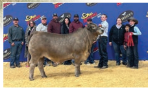
2ND PLACE BRAHMAN 2025 SA VOODOO SON