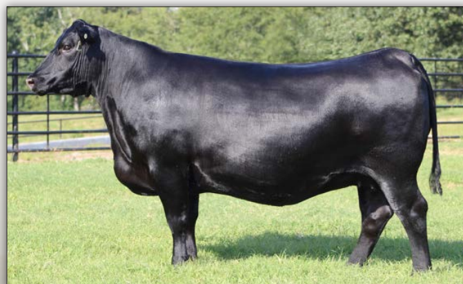
Ankony Miss Belle A064 // Dam of BAR Dominion 464M

We feel this young sire has as much potential on the seedstock side as any bull in our lineup.