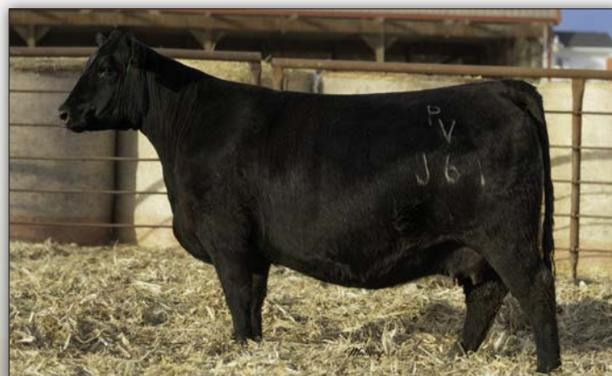
Pine View Rita J61 // Dam of Pine View Affirmed

This unique opportunity for sexed female semen will put you on the fast-track to high-value daughters with unlimited production potential for a wide variety of markets.