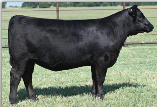
Hopsong Rita 5018 // The $110,000 flushmate sister to Habit

This is the initial release of HABIT, the high-selling standout from Oklahoma Cattlemen's Congress at the National Angus Bull Sale. This son of Bold Ruler was one of the most talked about bulls in the city for his distinct advantages in muscle expression, quality skeletal design, and a performance look. HABIT is moderate for birth with top 10% growth and a top 3% breed rank for Residual Average Daily Gain. He has a balanced suite of carcass EPDs, and when combined with his output potential, he ranks in the top 5% for $Beef Index as well. A flush sister to this bull was the $110,000 high-selling heifer calf in the 2025 Hopsong Angus Production sale.