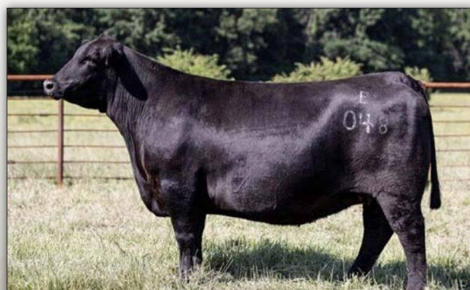
Baldridge Isabel E048 // Dam of Baldridge Incognito J852

INCOGNITO offers the total package — elite phenotype, breed-leading balance, and economic value that puts him in a league of his own.