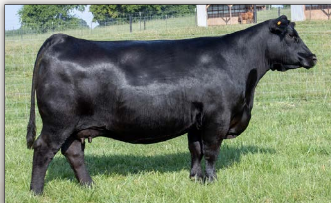
DBA Rita 1034 // Dam of Wilks Warrior 3715

This bull delivers next-level maternal function with industry-leading carcass traits — a rare opportunity for breeders seeking to advance both phenotype and profitability.