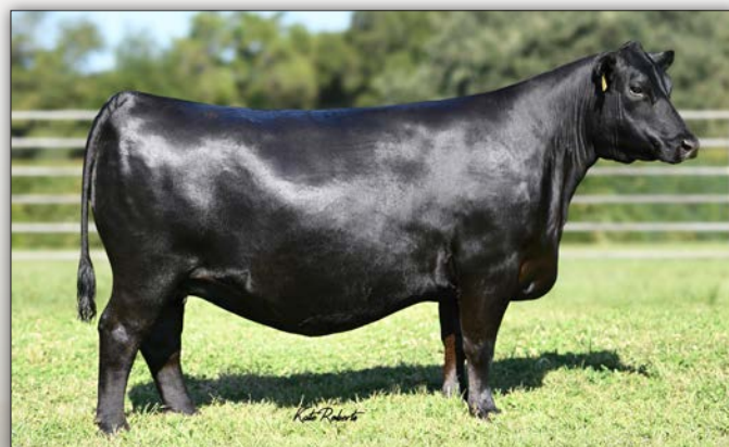
Vintage Blackcap 1084 // Dam of VAR Landman 4194