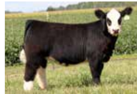
Full W/maternal sib of embryos selling, Babycakes $47,000 half interest Josh Kastle's top seller