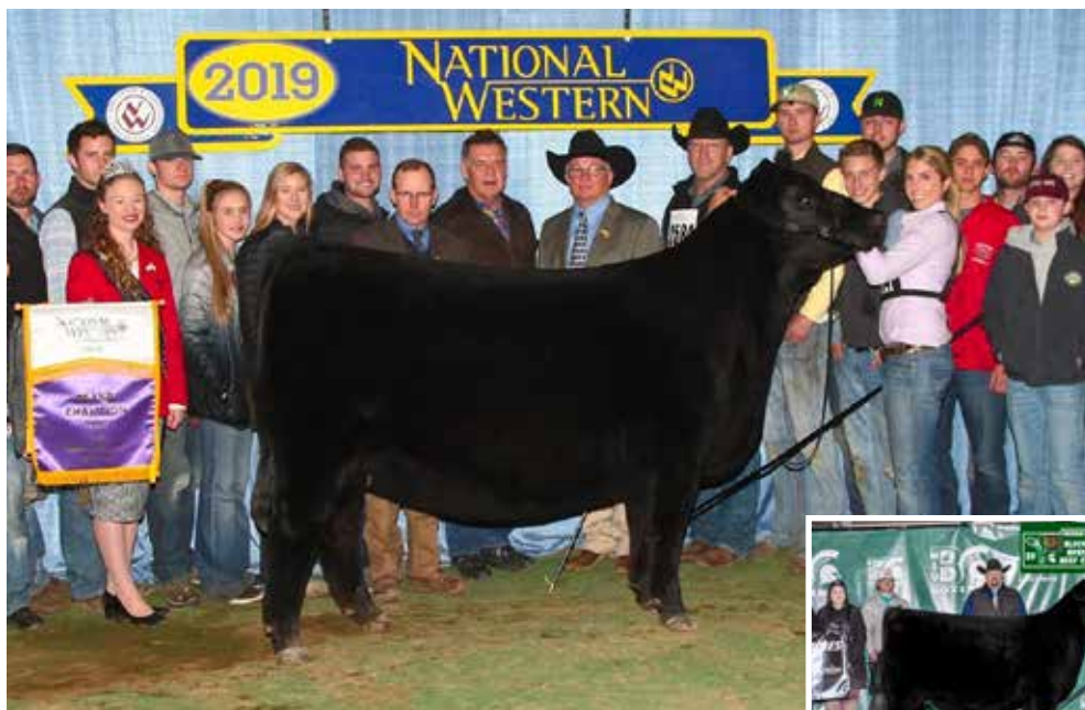
Dam of embryos selling, T/R NFF Princess E307 2019 Nation Western Stock Show Grand Champion Angus female 2019 Fort Worth Stock Show Grand Champion Angus female 2018 /2019 Roll Of Victory Show Heifer of the Year

DAMERON FIRST CLASS X EXAR PRINCESS 8063 • ANGUS (AAA 18941290)