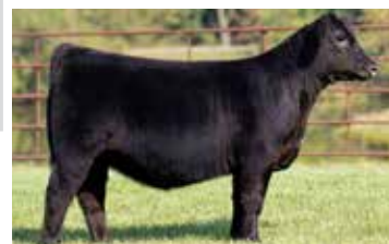
Maternal sib to embryos selling, $70,000 half interest TJSC Copping with Destiny 9K X 1B