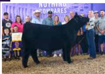
Full / maternal sib to embryos selling, 2025 Iowa State Fair Grand Champion Maine Anjou Female

•LOT 32A: 1 PACKAGE OF 3 EMBRYOS SIRED BY WEIS All Me 10F SEXED FEMALE