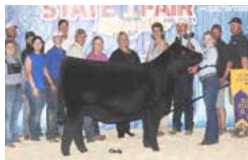
Maternal sib to embryos selling, Colburn Sara's Dream 5082 2022 Illinois State Fair Supreme Champion Heifer