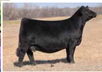
Maternal sib to embryos selling, Bankroll X 1D daughter Reserve Grand Female American Royal Donor for Rosebud & Robinson