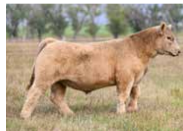
Full sib to embryos selling, Sold for $30,000