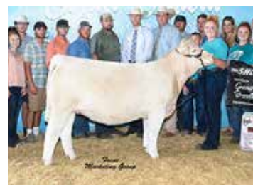
Maternal sib to embryos selling, CAG Bubbles 9950G