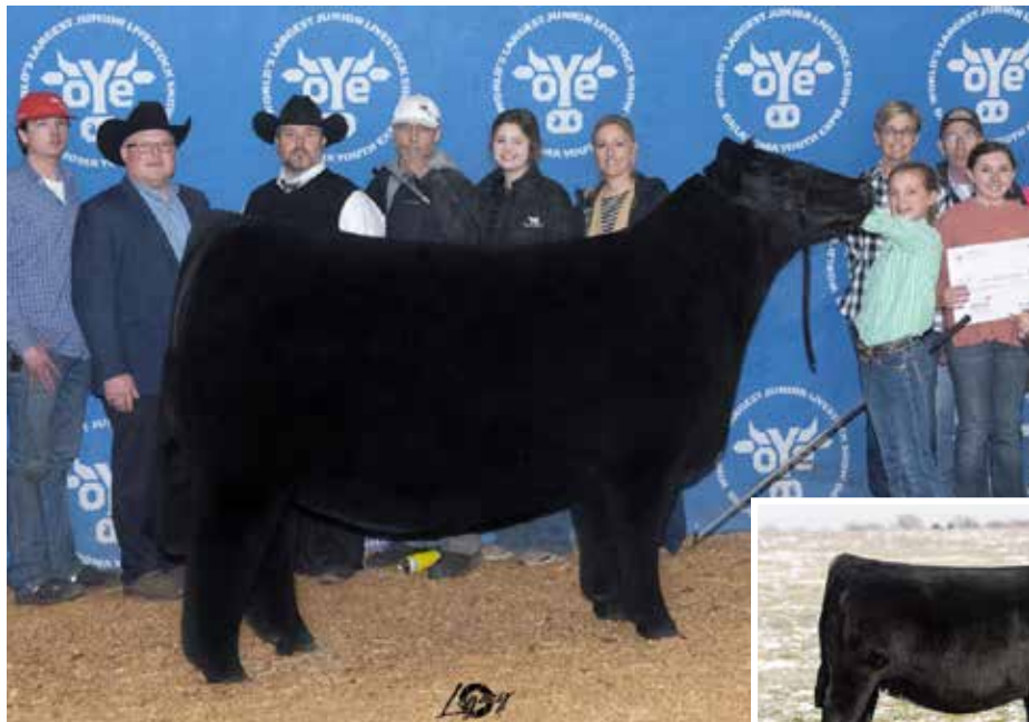
Full / maternal sib to embryos selling, GOF Miss Dolly 215H 2022 Cattleman's Congress Grand Champion Maintainer 2022 Oklahoma Youth Expo Supreme Champion Female

SILVEIRAS STYLE 9303 X BPF MISS ME 910Y • CHI (378843)