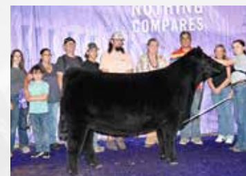
Full/maternal sib to embryos selling

•LOT 10A: 1 PACKAGE OF 3 EMBRYOS SIRED BY Silveiras Style 9303 SEXED FEMALE