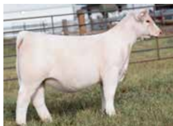
RJ Judy 5209 N

2025 Hoosier Beef Congress Champion Charolais Heifer - $56,500 heifer sired by RF Elevate K108