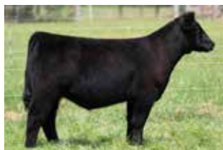
Maternal sib to embryos selling, $26,000 Maternal Made X Miss Worthy 1H