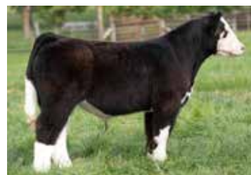
Full / Maternal sibs to embryos selling, $12,500 Here I Am X GOET Miss Cherry Girl

•LOT 38A: 1 PACKAGE OF 3 EMBRYOS SIRED BY CHOICE Revelations 2K or TLAC Hits Different 1409L ET SEXED FEMALE