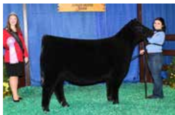
Full / maternal sib to embryos selling, Campbellco Queen 2503N 2025 NAILE Reserve Senior Calf Champion