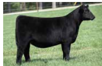
Full / maternal sib to embryos selling, Campbellco Queen 2503N $88,000 half interest

•LOT 52A: 1 PACKAGE OF 3 EMBRYOS SIRED BY SCC SCH 24 Karat 838 SEXED FEMALE