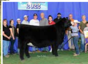
Full/maternal sib to embryos selling, 201F Broker Hairietta daughter