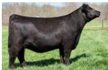
Donor to embryos selling, BNWZ Queen 7477