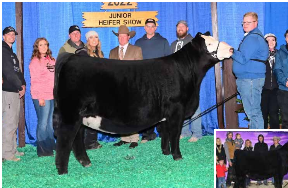
Dam of embryos selling, BC II Annie 01 J - Meg the Stallion 2022 NAILE Grand Champion Junior Simmental Female

JSUL SOMETHING ABOUT MARY 8421 X CLAC ANNA MARIE 437E • SIMMENTAL (3931998)