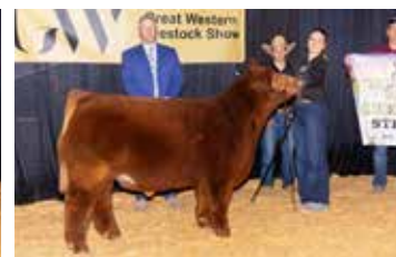
Full / maternal sib to embryos selling, How Great Thou Art X Simon/Newton 53 2026 Great Western 5th Overall