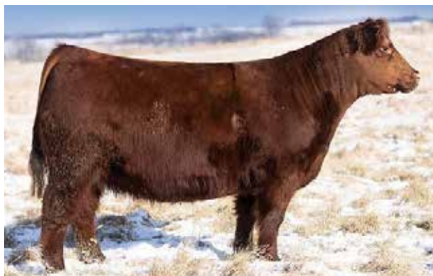
Dam to embryos selling, Lil Red