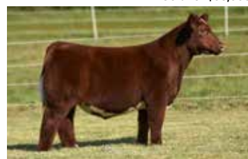
Full sib to embryos selling, Sold for $36,000