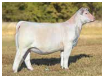
RJ GCC Miley Cyrus N07

2025 Hoosier Beef Congress Champion Charolais Heifer - $56,500 heifer sired by RF Elevate K108