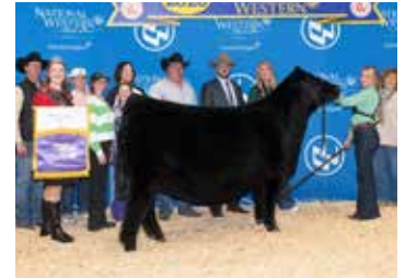
Flushmate to dam of embryos selling, 2026 NWSS Supreme Champion Heifer