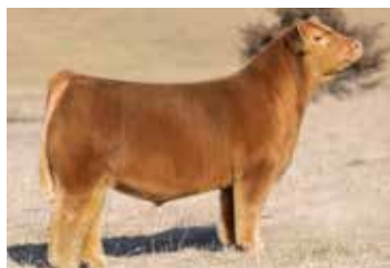
Full / maternal sib to genetics selling, Paid With Gold - AI Promotional Sire