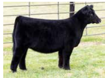
Full / maternal sib to embryos selling, $33,500 WEIS All Me 10F X JACW Ms Brandy