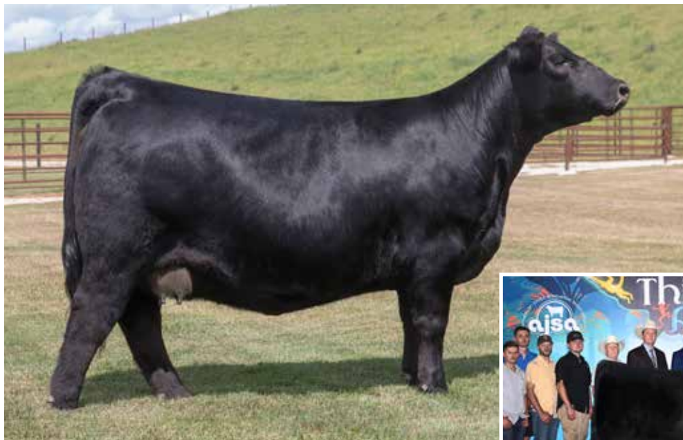
Dam of embryos selling WPRF Wise Lola 620D