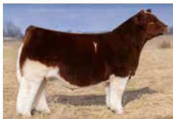
Full / maternal sib to genetics selling, Red White & Delight - AI Promotional Sire