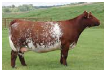
SULL Lady Crystal

•LOT 50A: 1 PACKAGE OF 4 IVF EMBRYOS SIRED BY MFS Dreamweaver 37K SEXED FEMALE