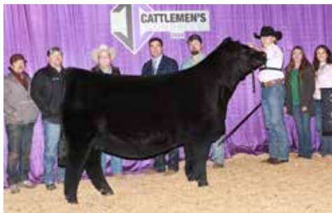
Maternal sib to embryos selling, Campbellco Queen 16K 2024 Cattlemen's Congress Reserve Grand Champion % Simmental 2024 National Western Stock Show Reserve Grand Champion % Simmental

DAMERON FIRST CLASS X J&J QUEEN 414 • ANGUS (18947664)