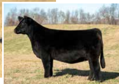
Grandmother of embryos selling, BPF Princess 999C

We are proud to welcome SBSC RF Haley 036H to The Collection Event. Haley comes from a pedigree that has been highly influential in the industry for years. Her dam, BPF Princess 999C "Miley," was shown extensively across Oklahoma, earning 14 Supreme and Reserve Supreme Champion titles and capturing the Oklahoma Club Calf Association High Point Heifer Award.