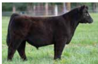
Maternal sib to embryos selling, Here I Am X Miss Worthy 1H