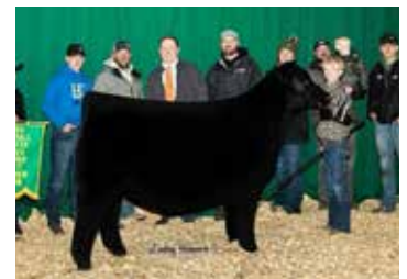
Full / maternal sib to embryos selling, GDMN Miss Cinderella 1712 ET 2024 Purdue AGR Champion Chi Female 3rd Overall Supreme Female