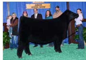
Granddaughter of Donor, BMW Dolly 206 ET 2025 NAILE Grand Champion Chianina Open Show