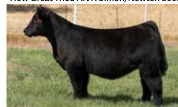
Full / maternal sib to embryos selling, Sold for $8,000 How Great Thou Art X Simon/Newton 8608