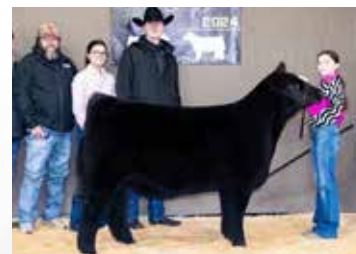
Full/maternal sib to embryos selling