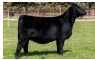
Full / maternal sib to embryos selling,$24,500 - 4492 - 24 Karat X 8079

•LOT 12A: 1 PACKAGE OF 3 EMBRYOS SIRED BY UDE New Heights 62/87 SEXED FEMALE