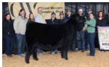
Maternal sib to embryos selling, 2026 Great Western Res Supreme Female GAF Walk The Line X Colburn Annie Lu 8079