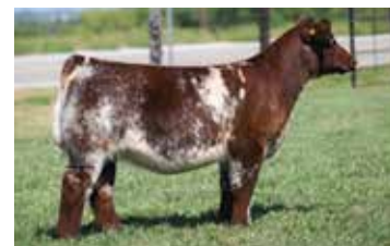
Full / maternal sib to embryos selling, Sold for $26,500