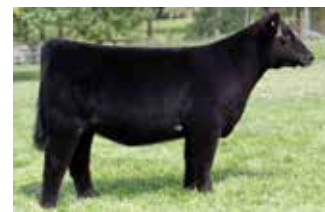
Maternal sib to embryos selling, $24,500 Drivin 80 X Miss Worthy 1H