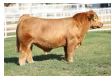
Full sib to Lot B embryos selling, Touch Of Heaven