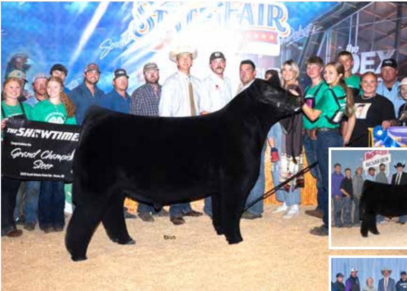
Full/maternal sib to embryos selling, How Great Thou Art X Miss Maddie 2025 South Dakota State Fair Grand Champion Market Steer, 2025 Aksarben Grand Champion Market Steer 2025 NWSS Grand Champion Prospect Steer

MOTHER OF THE AKSARBEN GRAND CHAMPION STEER