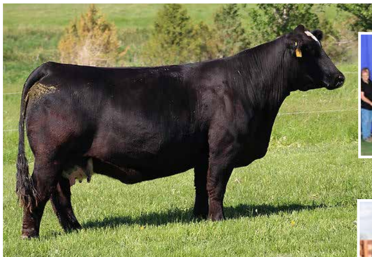
Full/maternal sib to embryos selling, Broker Hairietta "Lady Killer"

WHO MADE WHO 411F X ANGUS • FOUNDATION (2711735)