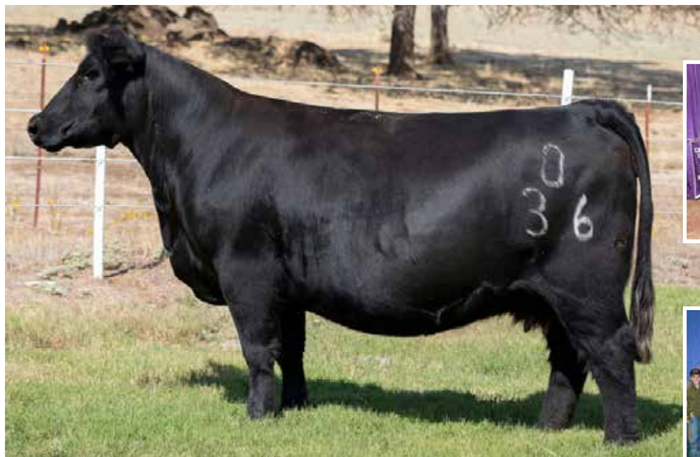
Dam of embryos selling, Simon/Newton 036