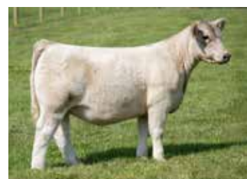
Maternal sib to embryos selling, In God We Trust X Campbellco Jaylyn 1928