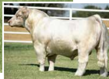
Sire of embryos selling, King of Kings