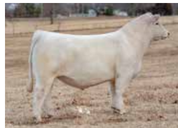
Maternal sib to embryos selling, WIA Backwater Jack 060PW

•LOT 30A: 1 PACKAGE OF 3 EMBRYOS SIRED BY WC Premonition 1138 P ET