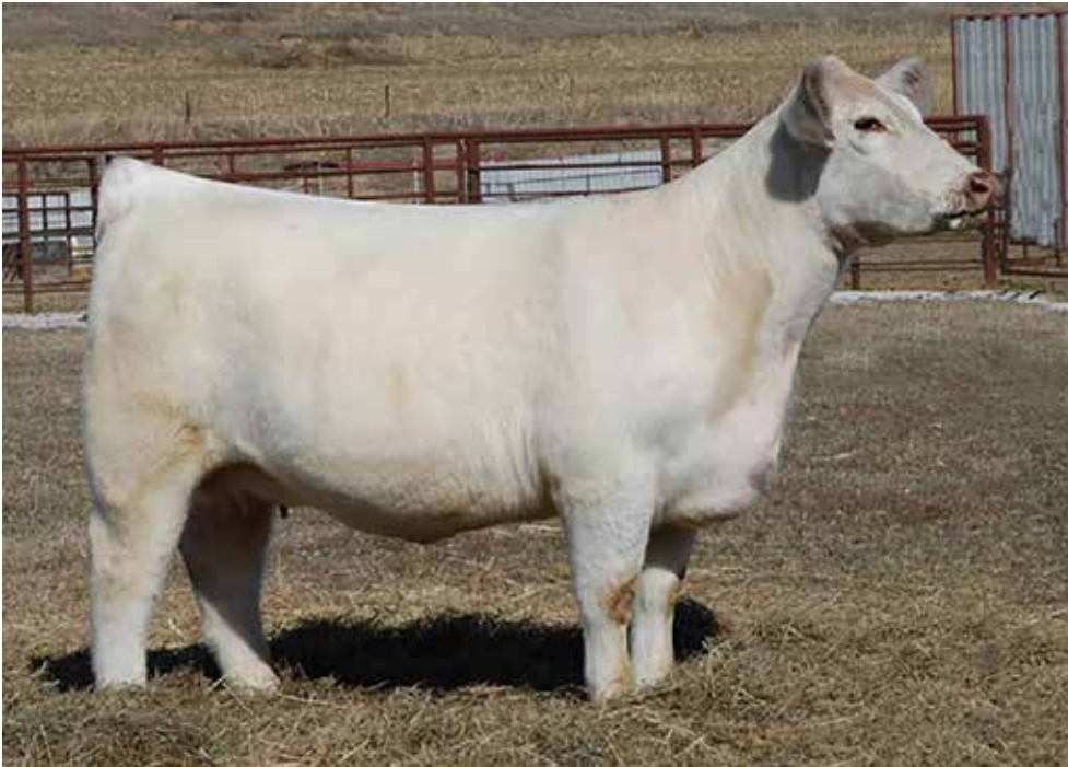
Dam of embryos selling, SULL Crystal Lady 434P

WHR SONNY 8114 X AF MARGIES DREAM LADY 05ET • SHORTHORN (*X4217011CL)