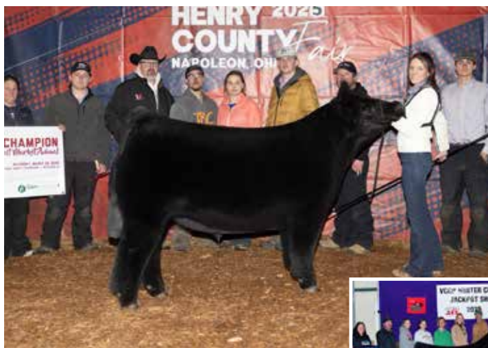
Full / maternal sib to embryos selling, 2025 Henry County Jackpot Grand Champion Steer 2025 Athens Fair Grand Champion Steer 2025 VCCP 4th Overall

DAM OF 2025 ILLINOIS STATE FAIR GRAND CHAMPION STEER