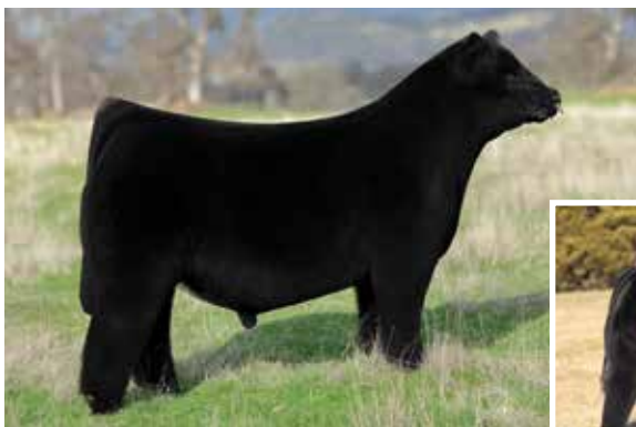
Maternal sib to embryos selling, Man of Steel