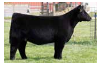
Maternal sib to embryos selling, $86,000 Drivin 80 X Miss Worthy 1H