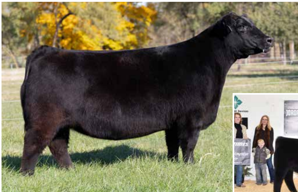
Dam of embryos selling, UDE Fergie 89F

COLBURNS PRIMO 5153 X JSUL RED THUNDER 9051W • CHI (394732)