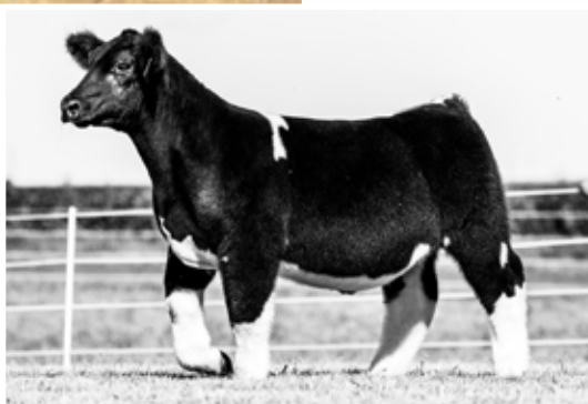
Son of Donor, New World Order X 423 Sold for $63,000