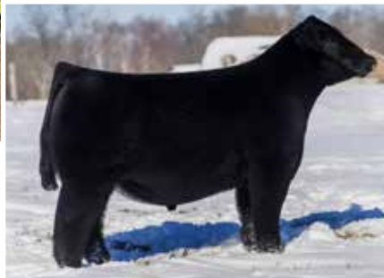
Maternal sib of embryos selling, GOET Outsource 2026 promotional AI sire