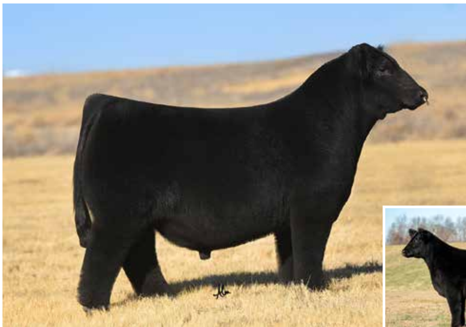
Maternal sib to embryos selling, Players Only

BOE GARTH X BPF PRINCESS 999C • 3/4 MAINE ANJOU (AMAA 555929)