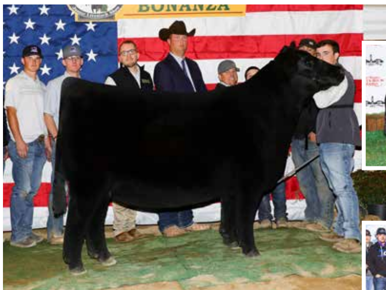
Dam of embryos selling, Colburn Sandy 0588

COLBURN PRIMO 5153 X SILVEIRAS S SIS SANDY 2352 • ANGUS (19800995)