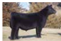
Made To Order 2