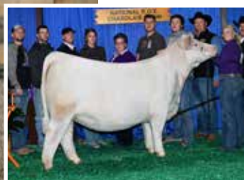
Dam of embryos selling, LJR Ms Kari 318K ET

2025 Badger Brawl 5th Overall Heifer Champion Division 1 NWSS $60,500 heifer sired by RF Elevate K108