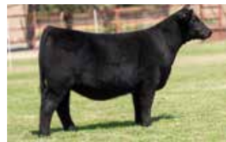
Maternal sib to embryos selling, - 5700 Dignity X Colburn Annie Lu 8079