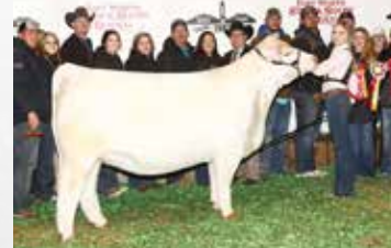
Full/Maternal sibs to embryos selling, Outsider X 22E

• LOT 5A: 1 PACKAGE OF 3 EMBRYOS SIRED BY M&M Outsider 4003 PLD SEXED FEMALE