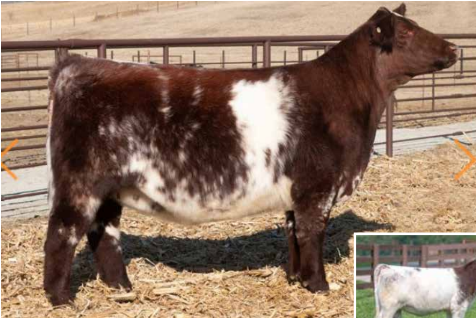
Dam of embryos selling, SULL Crystals Lucy 8202

SULL RED KNIGHT 2030 X SULL CRYSTAL'S LUCY ET • SHORTHORN (*4277781)