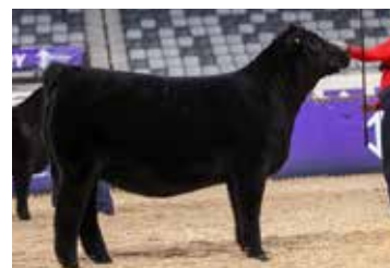
Maternal sib to embryos selling, Spring Calf Champion 2026 Cattlemen's Congress

Opportunities like this are rare. Only at The Collection can you secure embryos from this elite donor line and invest in genetics that continue to dominate both the show ring and the marketplace.