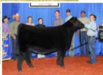
Maternal sib to embryos selling, 2023 West Virginia State Fair Reserve Grand Champion Heifer

•LOT 61A: 1 PACKAGE OF 3 EMBRYOS SIRED BY TLAC Hits Different 1409L ET SEXED FEMALE