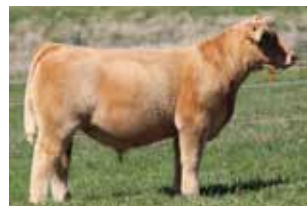
Full / maternal sib to genetics selling, $36,000 IGWT X Lil Red