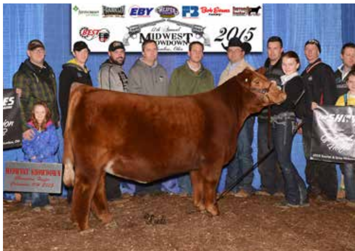
Granddaughter of Donor, BMW Dolly 502 ET

MR HOC BROKER X BPF MILEY 80T • MAINETAINER (AMAA 4471111)