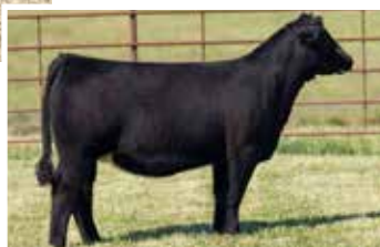
Maternal sib to embryos selling, W/C Bankroll 811D X Vanna