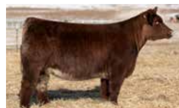
Maternal sib to embryos selling, $50,000 bred from the First Class Female Sale