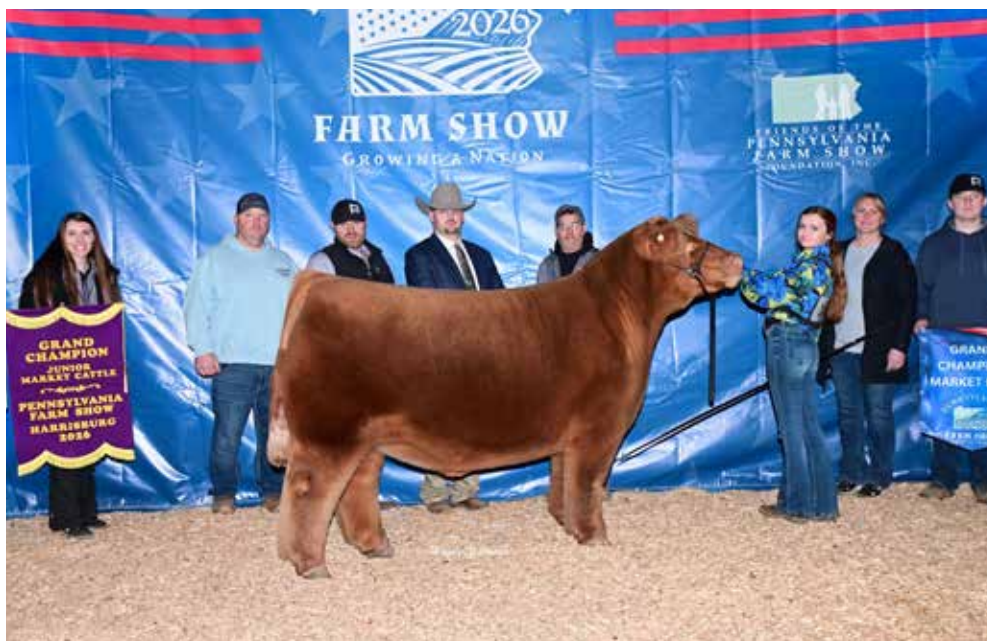
Full sib to embryos selling, 2026 Pennsylvania Farm Show Grand Champion Junior Market Steer

DAM OF 2026 PENNSYLVANIA FARM SHOW GRAND CHAMPION STEER