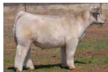
Maternal sib to embryos selling, In God We Trust X 5G