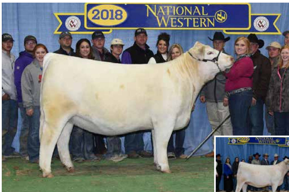
Dam of embryos selling, BRCHE TR Dory 6501

NATIONAL CHAMPION FEMALE and DAM OF NATIONAL CHAMPIONS