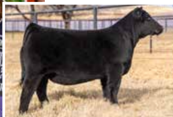
Full sib to Lot B embryos selling, Sold for $19,500