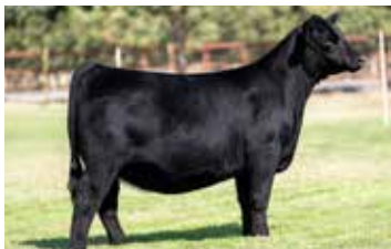
Full / maternal sib to embryos selling, Colburn Sara's Dream 5437 PVF King Pin 0588 X Sara's Dream 1339

DAM OF COLBURN PRIMO 5153 and MULTIPLE STATE FAIR CHAMPION FEMALES