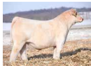
Grandson of donor, CAG Boy Narco 5646N ET