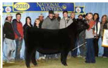
Full/maternal sib to embryos selling, 2019 National Western Reserve Grand Champion Prospect Heifer