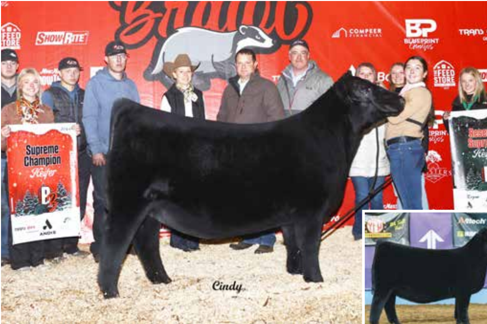
Dam of embryos selling, UDE Saras Dream 4001

2025 NJAS CHAMPION • 2025 NAILE SUPREME CHAMPION HEIFER & 2026 NWSS SUPREME CHAMPION HEIFER