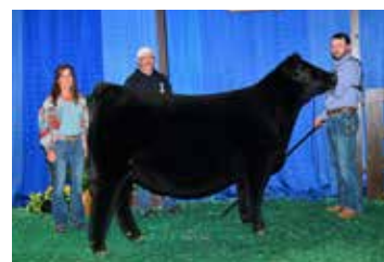
Maternal sib to embryos selling, Silveiras Style 9303 X UDE Phyllis 0223

OFFERED BY: REIBOLDT SHOW CATTLE, TROY 756.220.5552