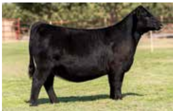
Full / maternal sib to embryos selling, Colburn Sara's Dream 5588 PVF King Pin 0588 X Sara's Dream 1339