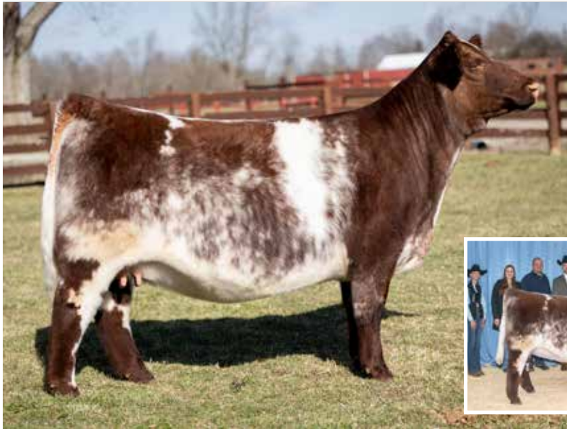
Dam of embryos selling, MFS Knighted Pinky The Roo 2142 ET

SULL RED KNIGHT 2030 ET X KOLT RGLC PICKY THE ROO 940 ET • SHORTHORN (*X4326236)