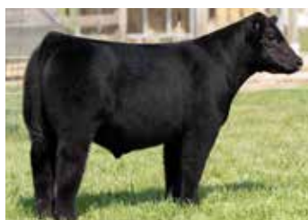
Full / Maternal sibs to embryos selling, $8,000 Here I Am X GOET Miss Cherry Girl