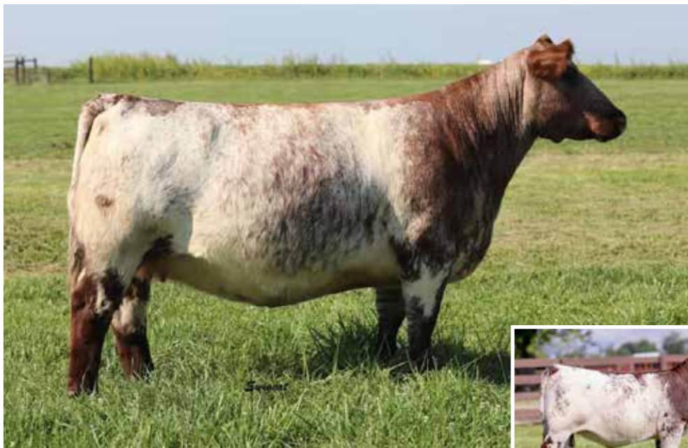
Dam of embryos selling, 2G Demi 47-F Sol

CF SOLUTION X ET X WHR JAZ DEMI DELIGHT 2 R 58