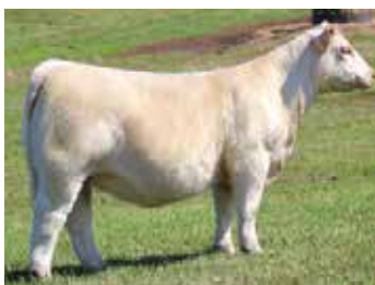
RJ SA Ms Cool N1 ET

$53,000 heifer sired by BRCHE Cool Dot 0503 PLD ET