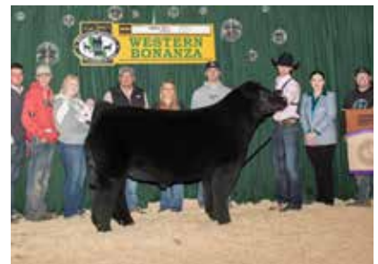
Full / maternal sib to embryos selling, 2024 Western Bonanza Supreme Steer