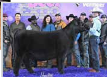
Maternal sib to embryos selling, R2C Bailey 314 2024 Grand Champion Iowa Beef Expo