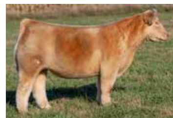
Full/Maternal sib to embryos selling