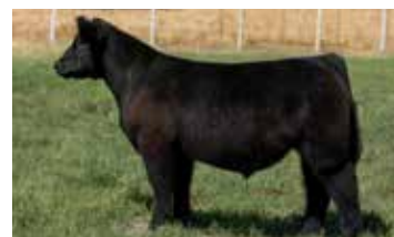
Full / maternal sib to embryos selling, Sold for $20,000 How Great Thou Art X Simon/Newton 8608