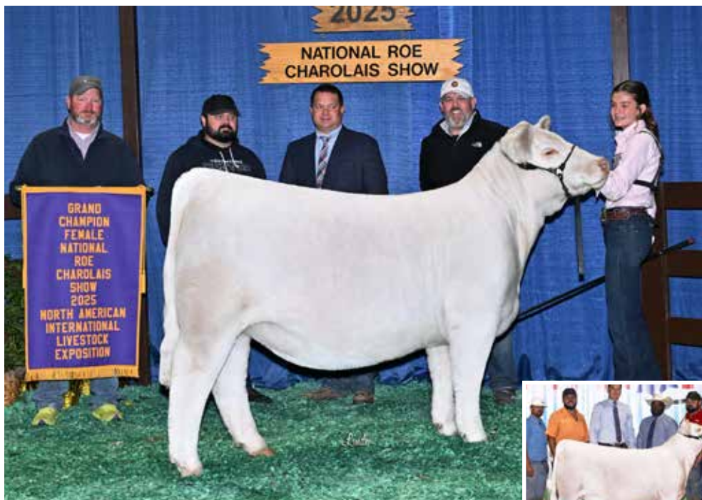
Full sib to embryos selling, BF WBG Paisley 440 (Pickles)

CCC WC RESOURCE 417 P X CC WGB BERKELEY 029 P ET • (EF1339033)