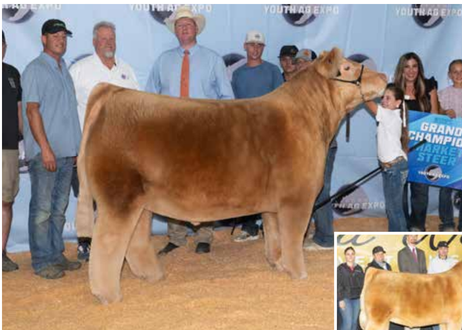
Full/Maternal sib to embryos selling, Multiple top 5 finishes Grand Champion Steer 2025 California Youth Ag Expo

PROFIT SON X 6/19 SMILING BOB X 2/75 IRISH WHISKEY X KELLI