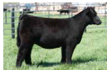
Full / maternal sib to embryos selling, $51,500 WEIS All Me 10F X JACW Ms Brandy