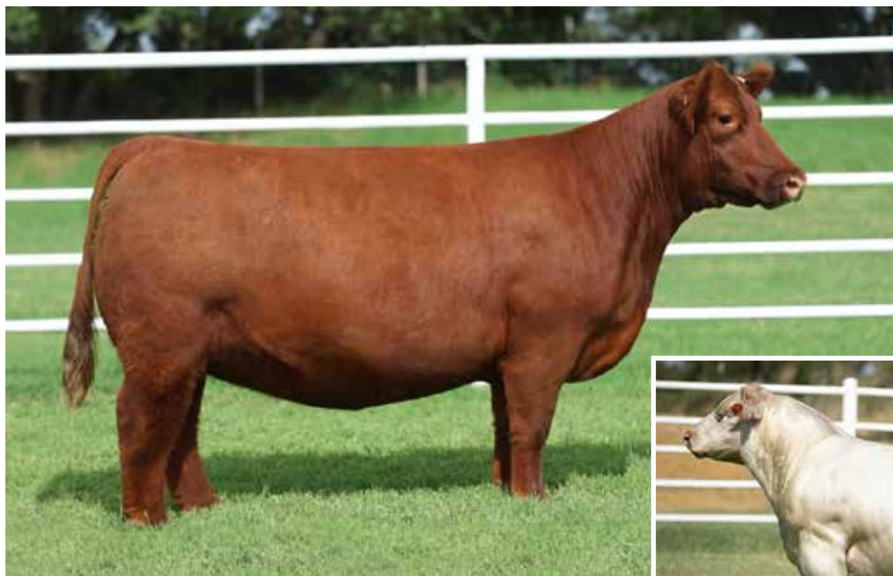
Dam of embryos selling, Horn 0222