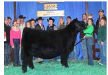
Flushmate to dam of embryos selling, 2026 NAILE Supreme Champion Heifer