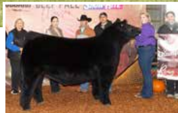
Full / maternal sib to embryos selling, How Great Thou Art X Simon/Newton 8608 2025 MN Beef Fall Classic Grand Champion both rings