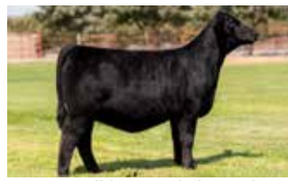
Full / maternal sib to embryos selling,$28,500 - 4212 - King Pin X 8079