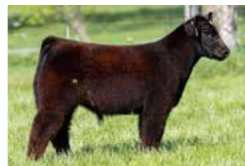
Maternal sib to embryos selling, Here I Am X GOET Annie