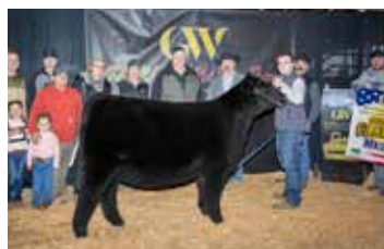
Maternal sib to embryos selling, Colburn Sara's Dream 2223 2024 Great Western Supreme Champion Female