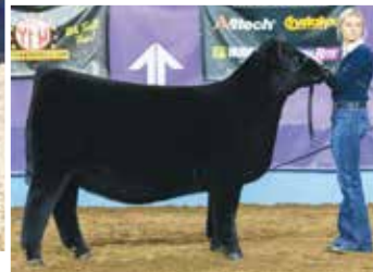
Grandam of embryos selling, $600,000 RECORD SELLING ANGUS SHOW HEIFER UDE Sara's Dream 1086