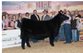
Full / maternal sib to embryos selling, Colburn Sara's Dream 3190 2025 Northern International Livestock Expo Supreme Champion