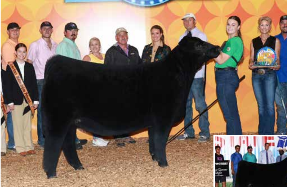
Full / maternal sib to embryos selling, GDMN Miss GiGi ET 2025 Maine Anjou Junior Nationals Grand Champion Maine Anjou Female

GOET I80 X STREITMATTER MANCHILD DONOR • MAINETAINER (AMAA 429266)