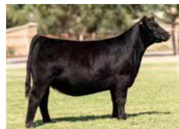
Maternal sib to embryos selling, Dignity X Colburn Sandy 0588

•LOT 53A: 1 PACKAGE OF 3 EMBRYOS Sired BY UDE New Heights 62/87 SEXED FEMALE