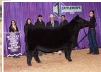
Maternal sib to embryos selling, 2024 Cattlemen's Congress Grand Champion Mainetainer Female