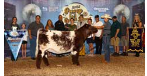
Maternal sib to embryos selling, GCC Evolving Pinky The Roo 42 ET 2025 Reserve Grand Champion Bred & Owned National Junior Heifer Show