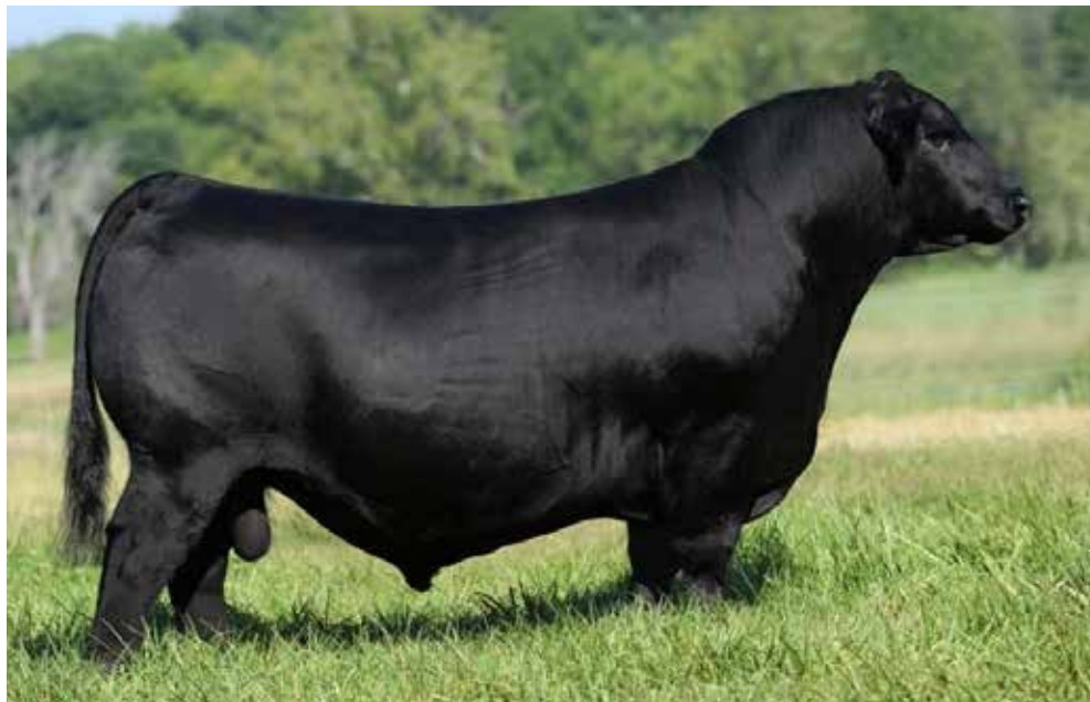
Rosewood Bellagio 090

KR CASINO 6243 X ROSEWOOD GEORGINA 290Z • ANGUS (AAA 20046900)