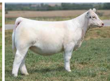
RJ Judy 5215N

$69,000 valued heifer sired by BRCHE Cool Dot 0503 PLD ET