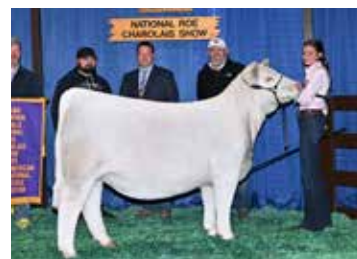
Dam of embryos selling, WBG CC CLT Berkly 240 P ET 2024 Illinois State Fair Grand Champion Charolais Heifer