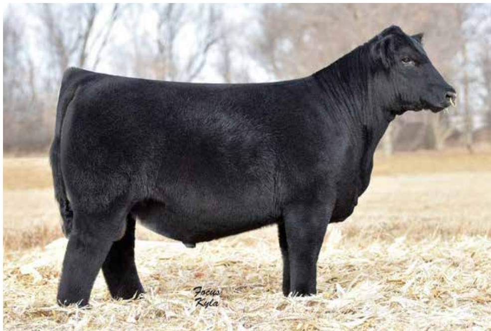
BBR Memphis Mafia 3E ET

GOET 180 X GEF MISS DOMINATRIX 236A • 3/4 MAINE ANJOU (AMAA 484081)