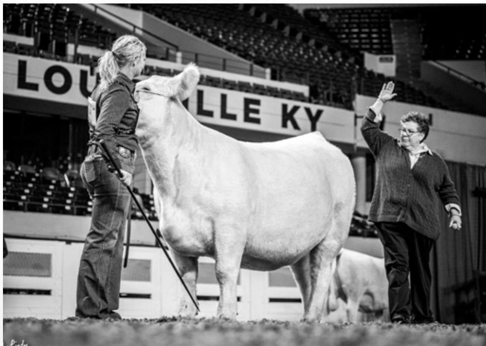
Full/Maternal sibs to embryos selling, LJR Miss Kari 318K ET being selected as Reserve National Champion female

LJR SIR REDNECK MAN 903 X LJR MISS WHITE SATIN 401 • CHAROLAIS (F1257124)