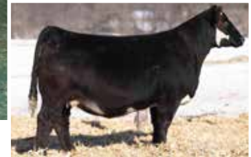
Dam to embryos selling, May 646

•LOT 36A: 1 PACKAGE OF 3 EMBRYOS Sired BY How Great Thou Art SEXED MALE