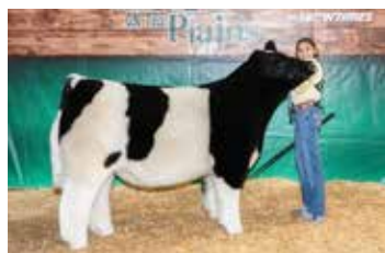
Full / maternal sib to embryos selling, How Great Thou Art X Simon/Newton 53 2026 Showdown on the Plains