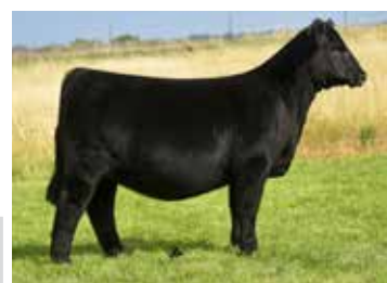
Maternal Granddaughter of donor, $78,000 Granddaughter at Rosebud Cattle