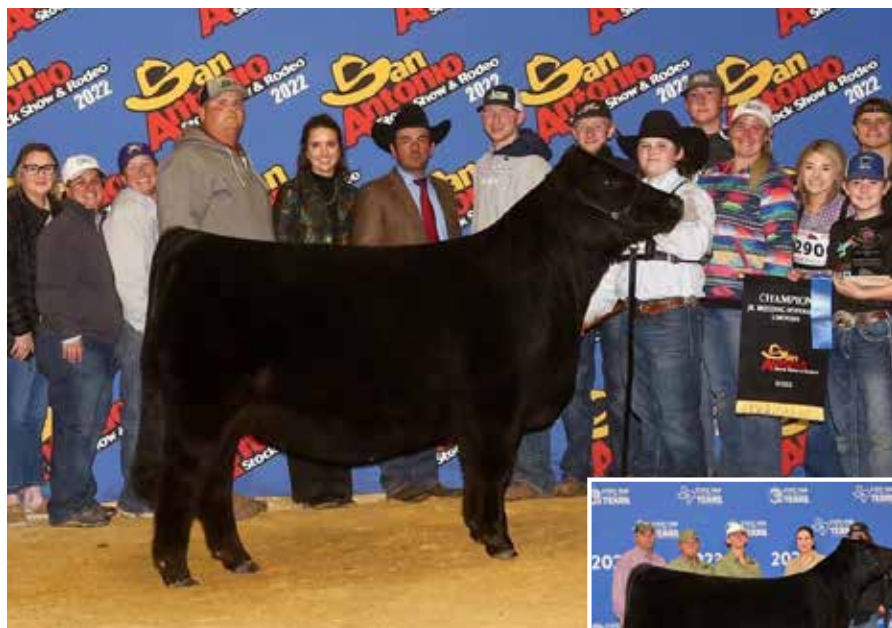
Dam of embryos selling, LJRJ CSVN Ms Brown Sugar ET

DAM OF 2026 ARIZONA NATIONAL SUPREME CHAMPION