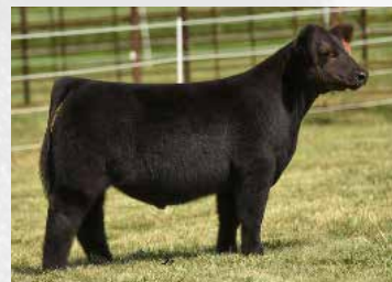
Full sib to embryos selling, Sold for $10,000