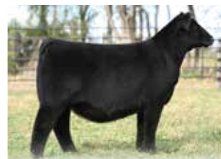
Granddaughter of Donor, RJC RBM Rosemary N372 ET — $82,500 heifer sired by TLAC Hits Different 1409L ET