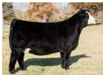
Full/maternal sib to embryos selling, Broker Hairietta daughter

•LOT 48A: 1 PACKAGE OF 3 EMBRYOS SIRED BY MR HOC Broker SEXED FEMALE