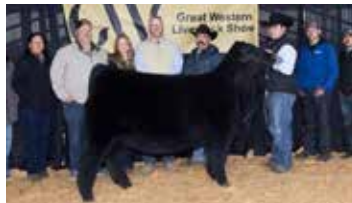
Maternal sib to embryos selling, 2025 Great Western Supreme Champion Female Executive Decision X Colburn Annie Lu 8079