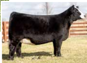
Full/maternal sib to embryos selling, Broker Hairietta daughter