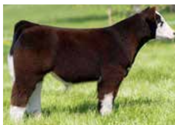
Full / Maternal sibs to embryos selling, $10,000 Here I Am X GOET Miss Cherry Girl