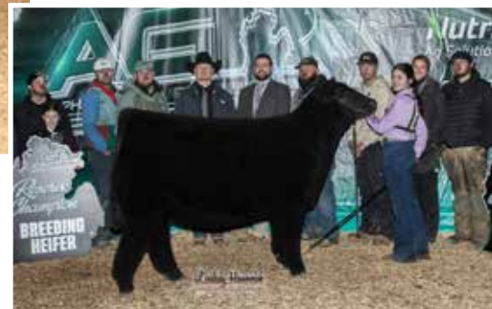
Maternal sib to embryos selling, Reserve Grand Female 2025 MSU AGR

•LOT 17A: 1 PACKAGE OF 3 EMBRYOS SIRED BY TLAC Hits Different 1409L ET SEXED FEMALE