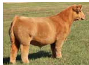
Full / maternal sib to genetics selling, $110,000 IGWT X Lil Red