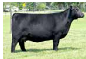
Grand Dam of embryos selling, Seldom Rest BRMF Bardot 890 2015 Grand Champion Angus Female NAILE