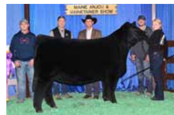
Maternal sib to embryos selling, 2022 NAILE Reserve Champion Maine-Anjou Female Open Show

•LOT 31A: 1 PACKAGE OF 3 EMBRYOS SIRED BY WEIS All Me 10F