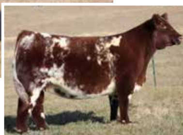
Dam of embryos selling, RJC Strawberry Shortcake H213 ET