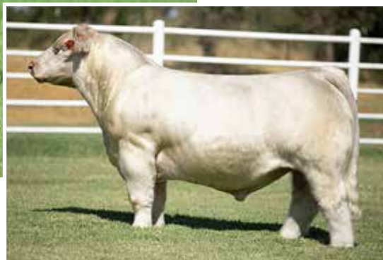
Sire of embryos selling, King of Kings