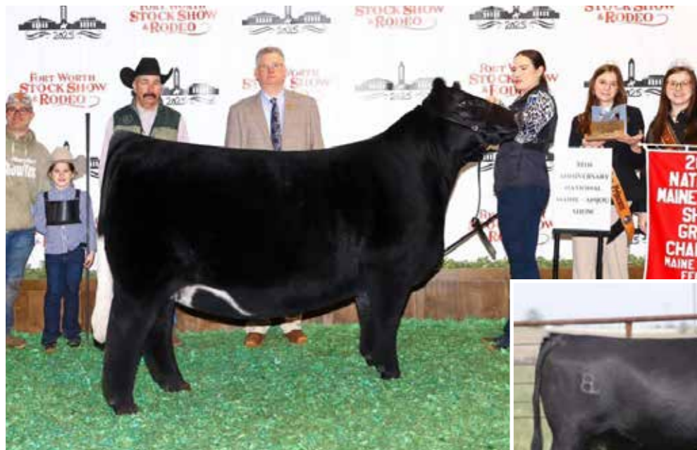
Dam of embryos selling, BK MBSB Lucky Break 310 L ET

JBOY ONE FOR ALL 001J ET X BK FORECAST 8201F ET • MAINE ANJOU (AMAA 543434)