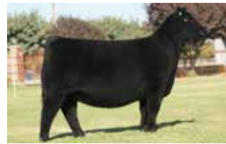
Full / maternal sib to embryos selling,$88,000 - 4710 - 24 Karat X 8079