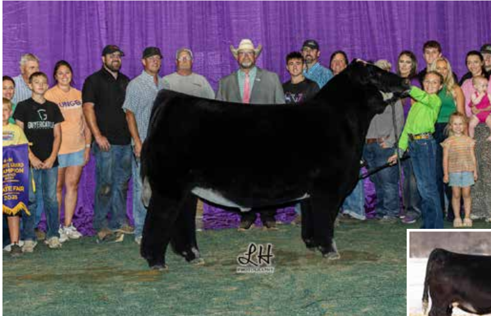
Full / maternal sib to embryos selling, 2025 Indiana State Fair Reserve Grand Champion Market Steer

DAM OF 2025 INDIANA STATE FAIR RESERVE GRAND CHAMPION STEER