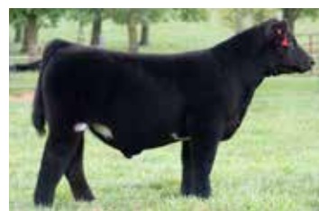
Maternal sib to embryos selling, Here I Am X GOET Annie