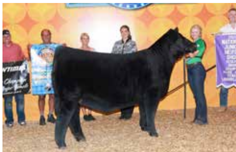
Full / maternal sib to embryos selling, Campbellco Queen 2401N 2025 Maine Anjou Junior Nationals Reserve Grand Champion Maine Angus