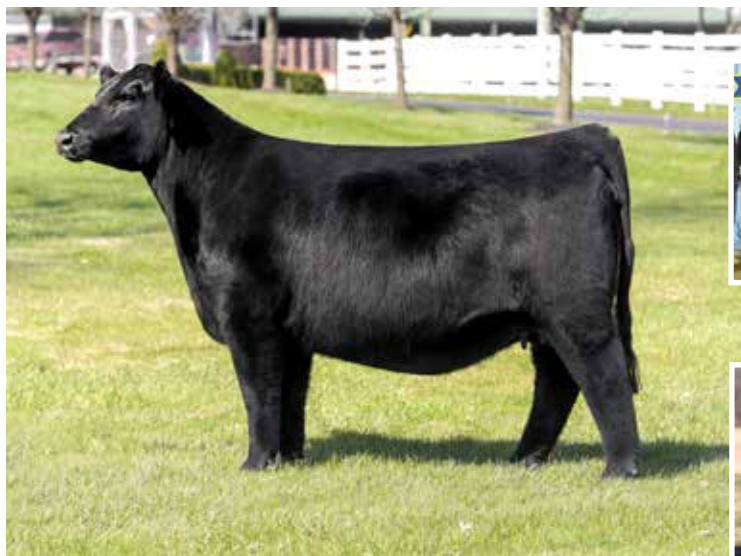
Dam of embryos selling, Sommers DF Rosemary 99-174 "Celebrity"

SCC FIRST-N-GOAL GAF 114 X SOMMERS DF ROSEMARY 99-99 • ANGUS (AAA 17980598)