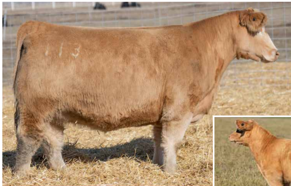
Dam of embryos selling, TSS 0113