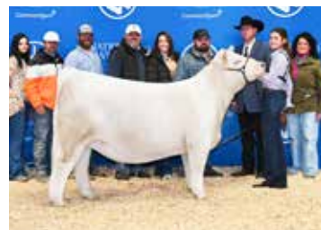
Full sib to embryos selling, BF WBG Paisley 440 (Pickles)