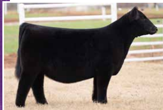
Dam of embryos selling, SSUL Sultry Dear 5978C

Maternal sib to embryos selling, ESS Priscilla 2240K $252,000 Top Selling female for New Era Cattle 2023 Grand Champion Prospect Female Cattleman's Congress 2023 Grand Champion Chianina Female Cattleman's Congress 2023 Grand Champion Chianina Female American Royal