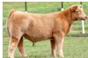
Full / maternal sib to genetics selling, $34,000 IGWT X Lil Red