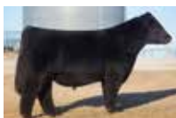
GOET Drivin 80

Your opportunity to get in on the ground floor begins on the 19th. Semen will be available to the open market in limited quantities at a later date; however, the only guaranteed access will be through The Collection offering. Semen will be released in the order it is sold. Bred by Goettemoeller & Tourlucias