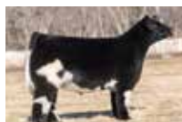
I Am Here