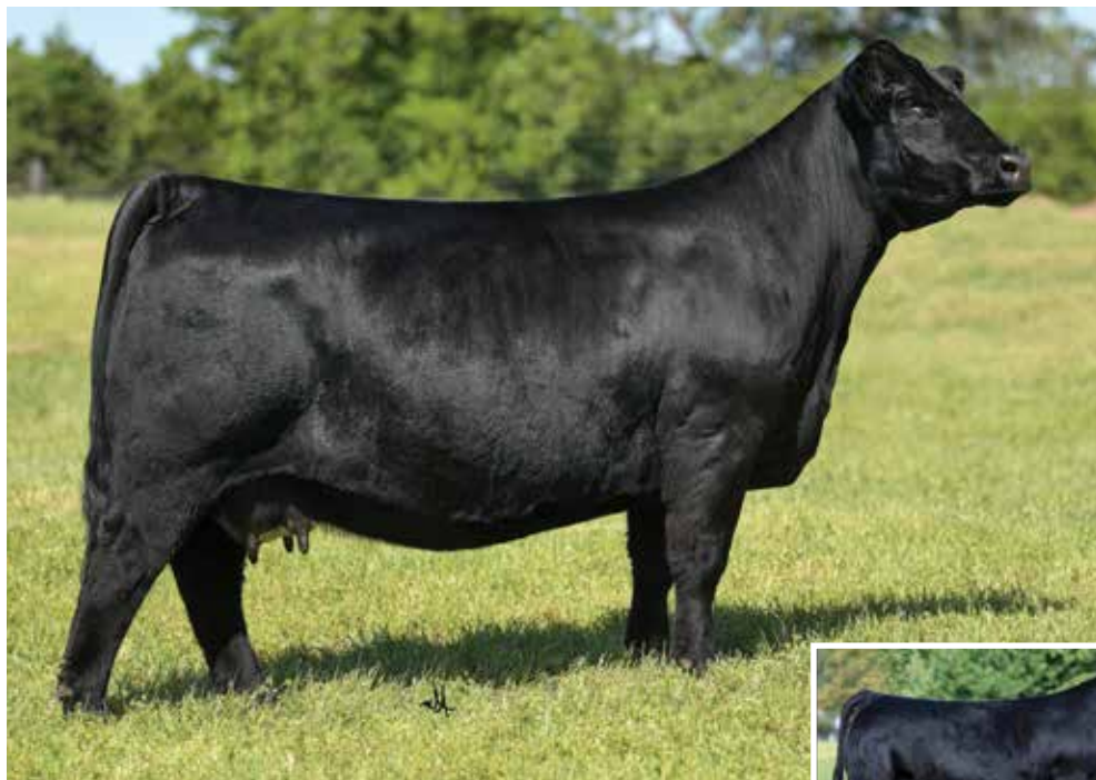
Maternal sib to embryos selling, JS Black Satin 9 "Boots" Triple Crown Winner

HARKERS/JS DOMINATION X JS FLATOUT FLIRTY 46T