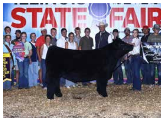
Full / maternal sib to embryos selling, 2025 Illinois State Fair Grand Champion Steer