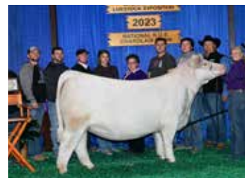
Full/Maternal sibs to embryos selling, Reserve National Champion Female