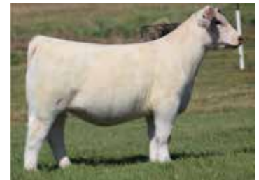
Full sib to embryos selling $56,500 FSF Perfection x 434P