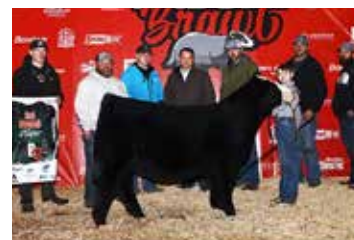
Granddaughter of Donor, 2025 Badger Brawl 3rd Overall Heifer 2025 Beef Fall Classic Supreme Champion Heifer (A & B)