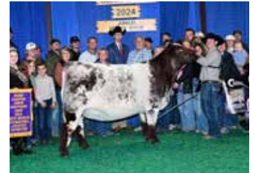
Full sister to donor of embryos selling, Grand Champion Shorthorn Females 2024 North American Livestock Expo