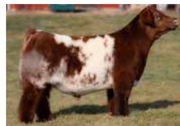
Sire to Lot C embryos selling, Back to Good