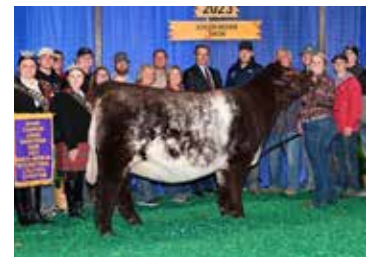
Full sister to donor of embryos selling, Grand Champion Shorthorn Females 2023 North American Livestock Expo