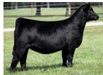
Full / Maternal sib to embryos selling, KR Casino 6243 x T/R NFF Princess E307