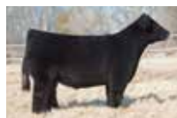
Set Me Free