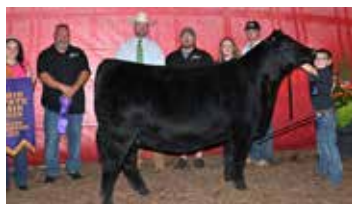
Full / maternal sib to embryos selling, 2025 Ohio State Fair Grand Champion Angus Heifer PVF King Pin 0588 X Colburn Annie Lu 8079