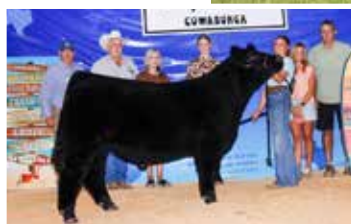
Full / maternal sib to embryos selling, How Great Thou Art X Simon/Newton 8608 2025 TJMAA Grand Champion Steer