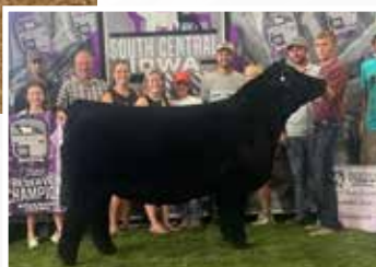
Donor to embryos selling, Fires Marissa 39K ET