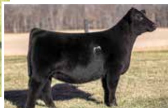
Maternal sib to embryos selling, $15,500 Daughter by Plum Creek Paradox