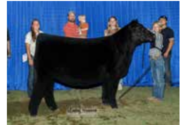
Full / maternal sib to embryos selling, GDMN Miss Cinderella 1712 ET 2024 Indiana State Fair Grand Champion Chi Female