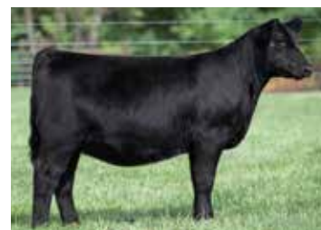
Maternal sib to embryos selling, Ride the Lightning X Campbellco Jaylyn 1928