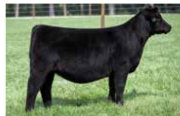
Full / maternal sib to embryos selling, Campbellco Queen 2504N $47,500 half interest

•LOT 52C: 1 PACKAGE OF 3 EMBRYOS SIRED BY CHOICE Revelation 2k or TL Ledger