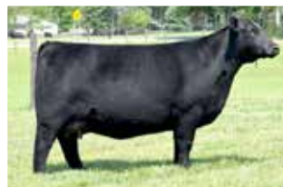
Maternal Grandmother to GOET Outsource Bardot 890