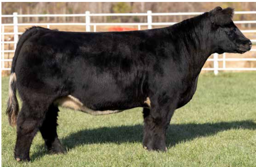
Dam of embryos selling, Richland Farm 5G