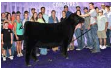
Full / maternal sib to embryos selling, 2025 Iowa State Fair Champion Angus 4th Overall Supreme Female SCC SCH 24 Karat 838 X Colburn Annie Lu 8079