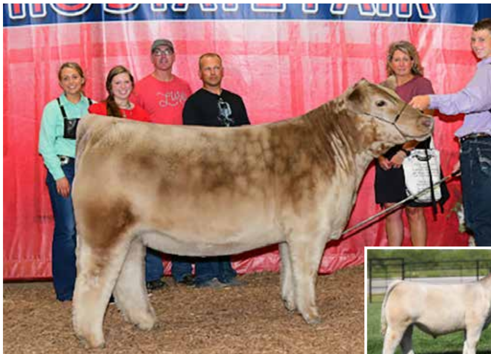
Dam of embryos selling, Miss Ohio