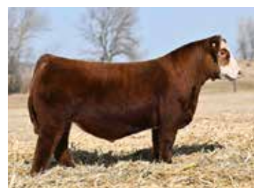
Sire of Lot A embryos selling, Bet on Red