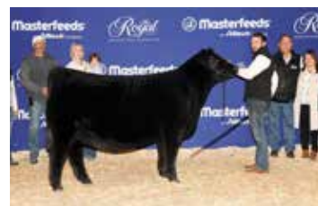
Maternal sib to embryos selling, 2025 The Royal International Winter Fair Champion Junior Yearling

The reach, consistency, and adaptability of cattle descending from the legendary FCF Phyllis 532 are truly remarkable. This offering provides rare access to a proven branch of that influential cow family—rooted in powerful, time-tested genetics that have delivered success across multiple generations. Few maternal lines in the industry carry this level of distinction and reliability. Step forward with confidence and invest in a genetic foundation built to last—this is the kind of decision that pays dividends for years to come.