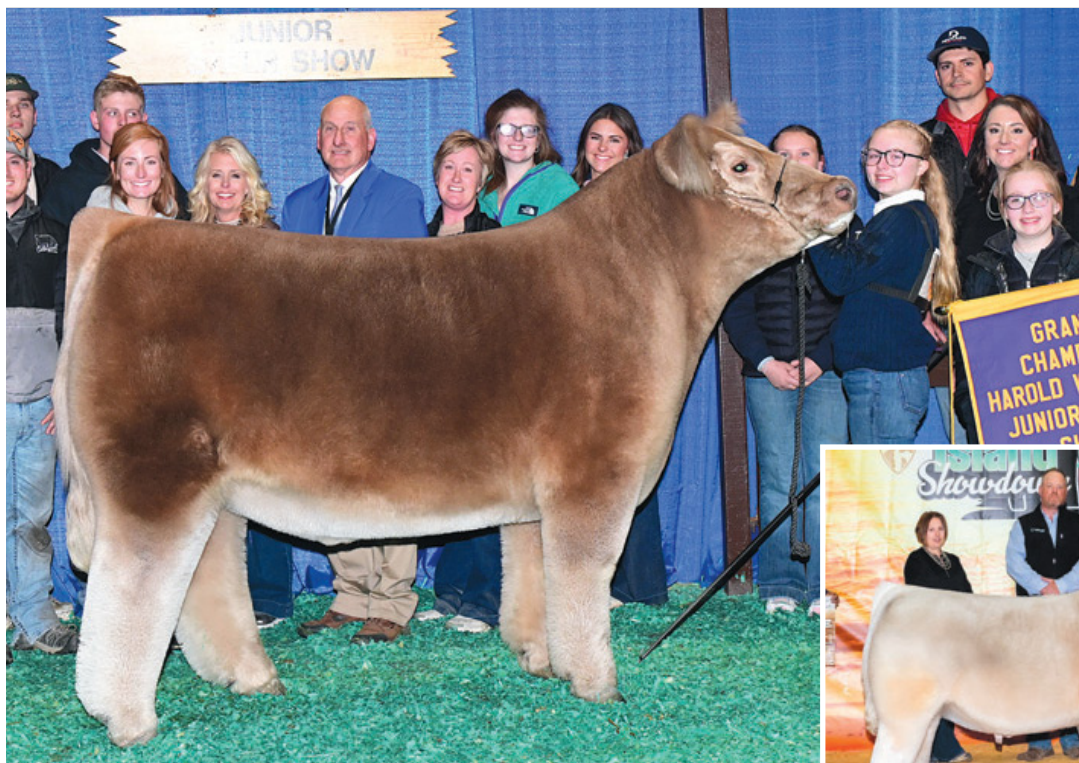
Full/maternal sib to embryos selling, 2025 NAILE Grand Champion Market Steer

DAM OF THE 2025 NAILE GRAND CHAMPION STEER