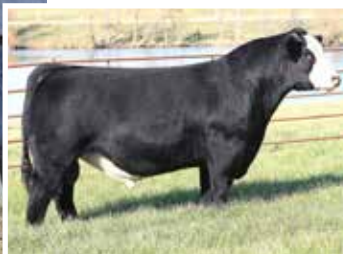
Maternal sib to embryos selling, Change is Coming