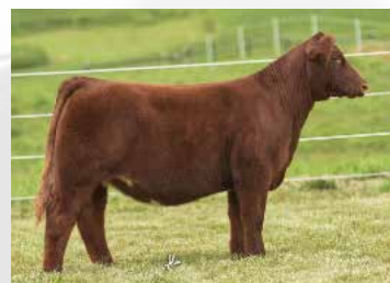
Full sib to embryos selling, Sold for $13,500