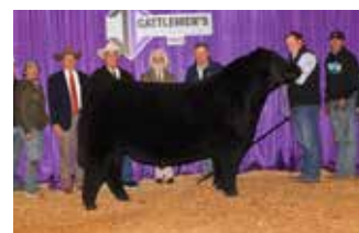
Maternal sib to GOET Cupcake, Seldom Rest Regulate 0105