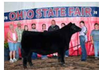
Grandson of Donor, Grand Champion Angus Steer Ohio State Fair