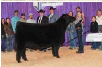
Full / maternal sib to embryos selling, BMW Dolly 206 2026 Cattlemen's Congress Grand Champion Mainetainer Junior & Open Female 2026 Cattlemen's Congress Reserve Supreme Female 2025 Cattlemen's Congress Reserve Grand Champion Chianina Female 2025 NAILE Reserve Grand Champion Chianina Junior Show Female 2025 NAILE Reserve Grand Champion Mainetainer Female