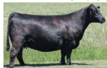
Full/maternal sib to embryos selling, RJ Cattle Donor AC Miss Style 802F "F1199"