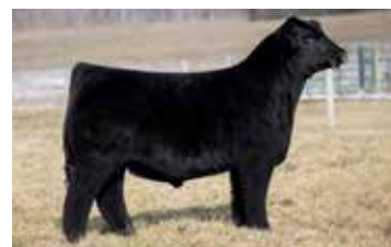
Sire of Lot B embryos selling, Revelation 2K

•LOT 45A: 1 PACKAGE OF 3 EMBRYOS SIRED BY Revelation 2K SEXED FEMALE **AVAILABLE 4/1