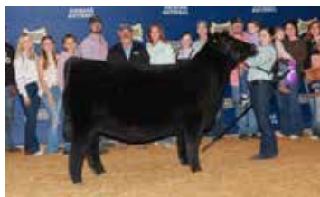
Maternal sib to embryos selling, 2026 AZ Champion Angus Arizona Nationals GAF Walk The Line X Colburn Annie Lu 8079