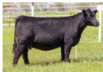
Granddaughter, Heartbreaker 422