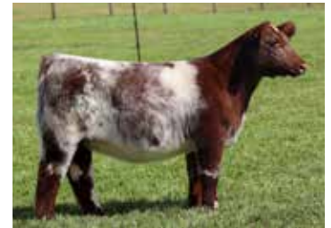
Full sib to embryos selling $69,000 FSF Perfection x 434P