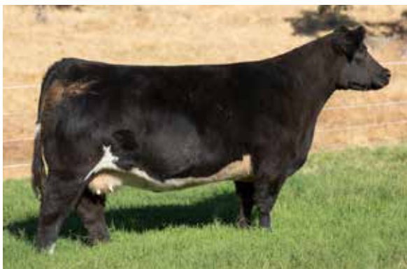
Dam to embryos selling, Simon/Newton 53