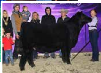
Maternal sib to embryos selling, Campbellco Annie 2505N 2025 Cattle Battle 4th Overall Supreme Heifer