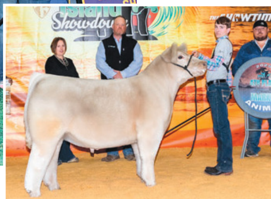
Full/maternal sib to embryos selling, 2025 Fall Island Showdown 4th Overall Market Animal

•LOT 27A: 1 PACKAGE OF 3 EMBRYOS SIRED BY In God We Trust SEXED MALE