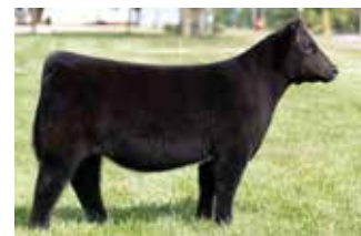
Maternal sib to embryos selling, $28,500 Maternal Made X Miss Worthy 1H