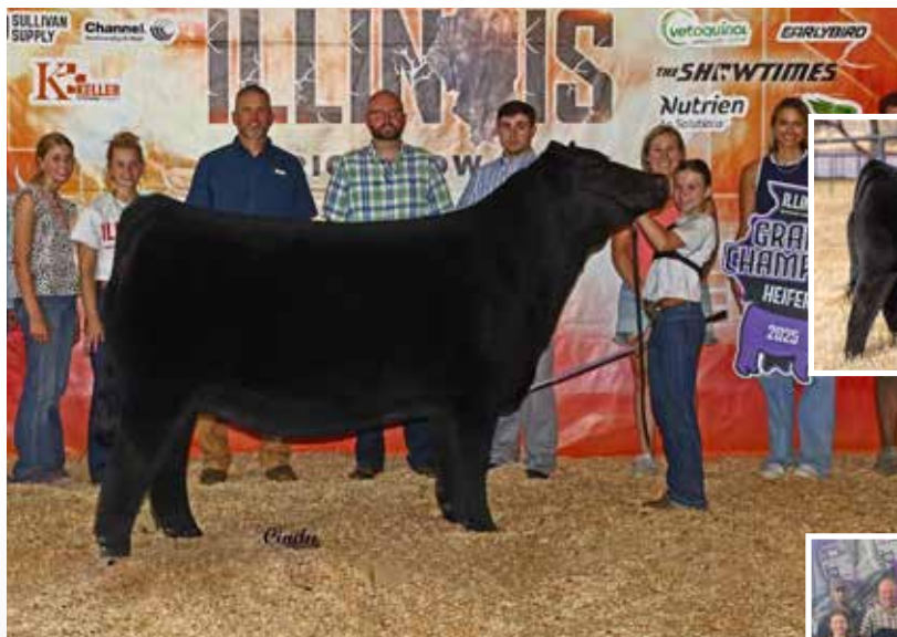
Full/maternal sib to embryos selling, $61,500 Supreme Champion Female Illinois District Series Finale

CROWN ROYAL X RATLIFF FLIRT 892F • LIMOUSIN (HALF NFX2525796)