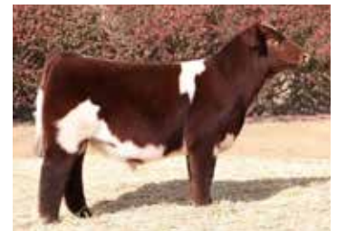
Sire of embryos selling, MFS Dream Weaver 37K