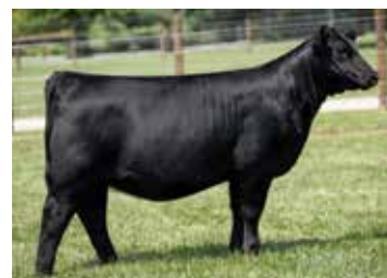
Maternal sib to embryos selling, Dignity x HAF Envious Blackbird 1897