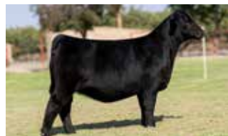
Maternal sib to embryos selling, - 5902 Executive Decision X Colburn Annie Lu 8079