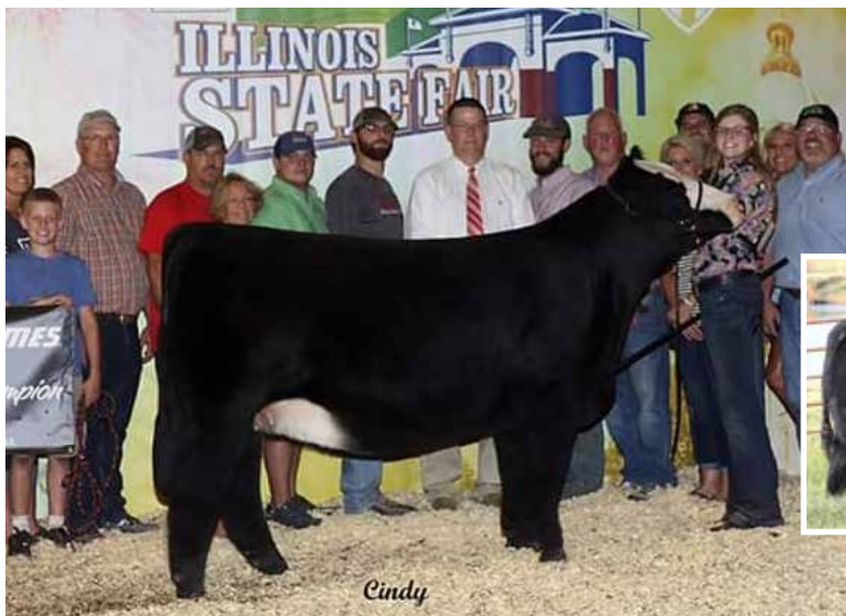
Maternal sib to embryos selling, Illinois State Fair Supreme Champion Female

MR HOC BROKER X SVJ WILD FIRES DREAM • SIMMENTAL (ASA 3143701)