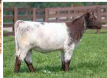
$11,000 Maternal sib to embryos selling