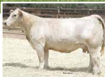
Grandmother of Horn 650, Horn 620