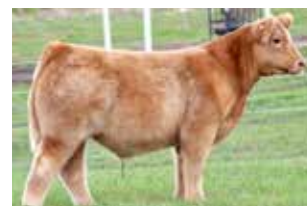
Full / maternal sib to genetics selling, $39,500 IGWT X Lil Red

Finally, Lot C comes available only after considerable persuasion—a sexed male pregnancy by How Great Thou Art, due in mid-May. Whether this calf develops into a promotional bull, sold as a holdover, or the kind that draws every high-end trader to your place this fall, the potential is undeniable. Regardless of where this lot lands on sale day, it has all the ingredients to return the investment—and then some.