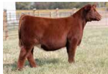
Full sib to embryos selling, Sold for $58,000