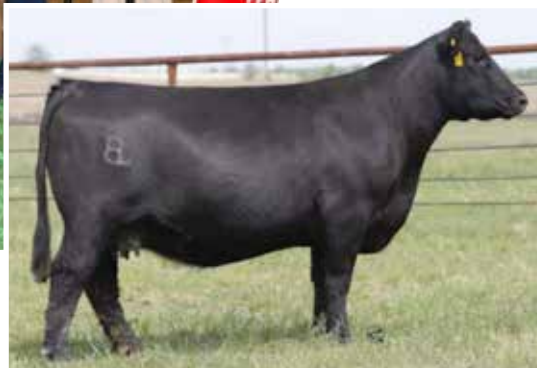
Grandmother to embryos selling, BK Forecast 8201F ET