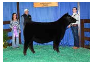
Full / Maternal sib to embryos selling, 2025 NAILE ROV Senior Heifer Calf Champion