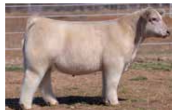
Maternal sib to embryos selling, In God We Trust X 5G