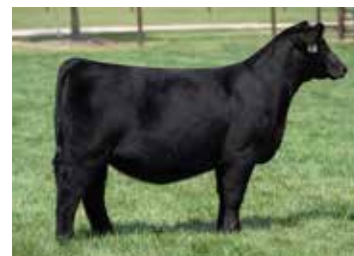
Maternal sib to embryos selling, Campbellco Annie 2505N $91,000 half interest