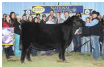
Maternal sib to embryos selling, Colburn Sara's Dream 5116 2016-2017 4x National Champion Angus Female

•LOT 14A: 1 PACKAGE OF 3 EMBRYOS SIRED BY UDE New Heights 62/87 SEXED FEMALE