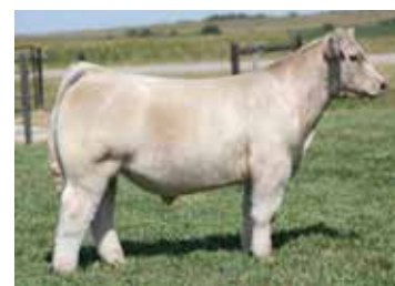
Full sib to embryos selling, Sold for $25,000