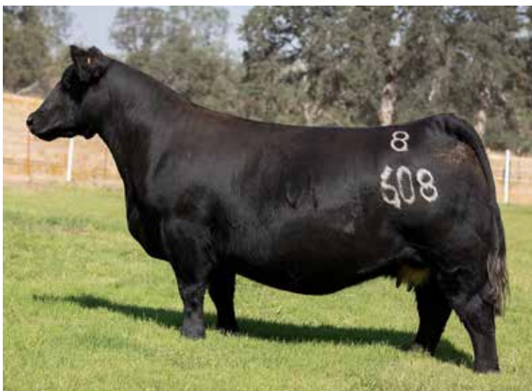
Dam of embryos selling, Simon/Newton 8608