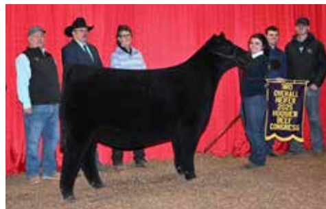
Full / maternal sib to embryos selling, Campbellco Queen 2503N 2025 Hoosier Beef Congress Champion Angus & 3rd Overall Female