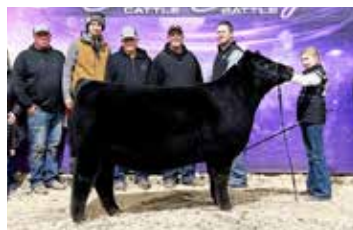
Full / maternal sib to embryos selling, Campbellco Queen 2504N 2026 Clark Co Cattle Battle Champion Maine Angus & 3rd Overall Supreme Female