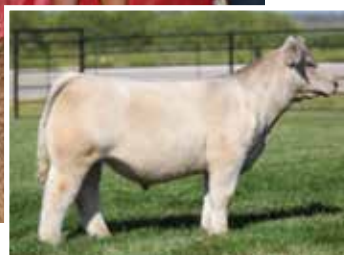
Full sib to embryos selling, Sold for $80,500

• LOT 23A: 1 PACKAGE OF 3 EMBRYOS Sired BY How Great Thou Art SEXED MALE