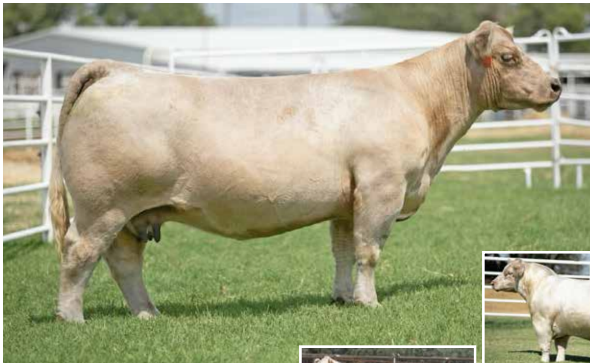
Dam of embryos selling, Horn 650

MAKES THEM EASY TO SELL and HARD TO BEAT