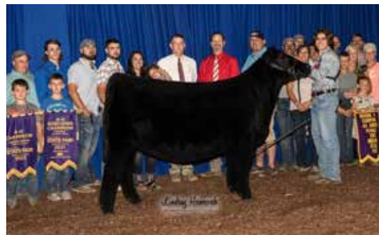
Dam of embryos selling, UDE Phyllis 0223 2023 Indiana State Fair Reserve Supreme Champion Female

•LOT 51A: 1 PACKAGE OF 3 EMBRYOS SIRED BY PVF Blacklist 7077 SEXED FEMALE