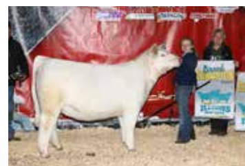
Full/Maternal sibs to embryos selling, LJR MS Josephine 840J ET Champion Charolais 2022 IBE