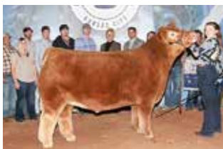
Full / maternal sib to genetics selling, 2023 American Royal Reserve Grand Champion Steer