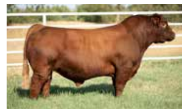
Sire to Lot A embryos selling, HL Standout