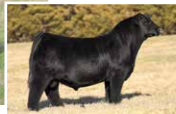
Maternal sib to embryos selling, Simon Says