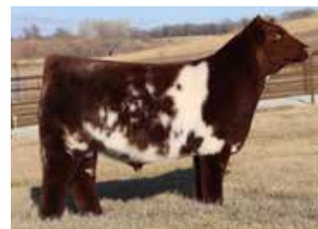
Sire of embryos selling, SULL RGLC The Goat 4202M