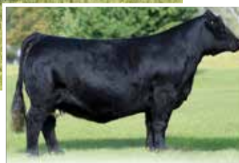
Dam of embryos selling, JS Flirt-A-Way 59Y