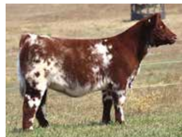
Full / maternal sib to embryos selling, Sold for $29,500