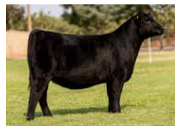
Full sib to embryos selling, 24 Karrat X Colburn Sandy 0588