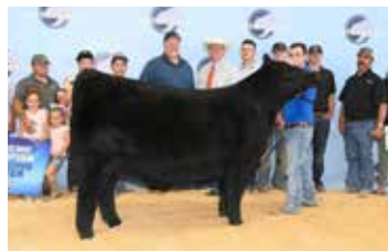
Maternal sib to embryos selling, Colburn Sara's Dream 2223 2023 California Youth Expo Supreme Champion Female