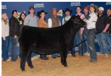
Full / maternal sib to embryos selling, 2026 Arizona National Supreme Champion Female