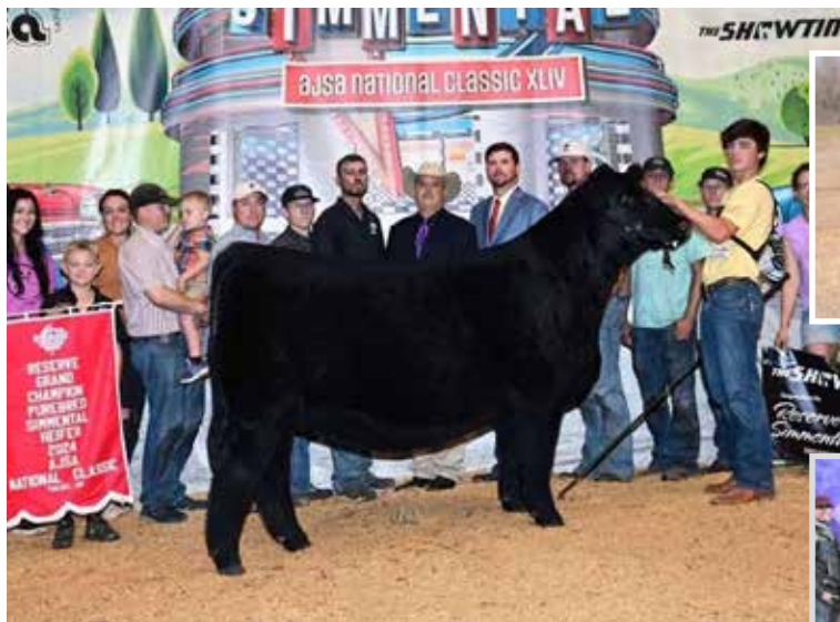
Maternal sib to embryos selling, R2C Bailey 314 2024 Reserve Grand Champion Purebred Heifer AJSA Junior Nationals

MR TR HAMMER 308A ET X BAILEYS 415B • SIMMENTAL (ASA 3231735)