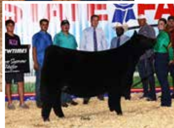
Full / maternal sib to embryos selling, GDMN Miss GiGi ET 2025 Illinois State Fair Reserve Supreme Champion Female