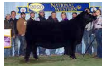
Maternal sib to GOET Cupcake, Bardot 8021