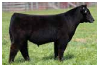
Maternal sib to embryos selling, Here I Am X Miss Worthy 1H