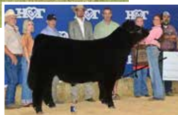
Full / maternal sib to embryos selling, How Great Thou Art X Simon/Newton 8608 2025 Heart of Texas Grand Champion Day 1 • 3rd Overall Day 2