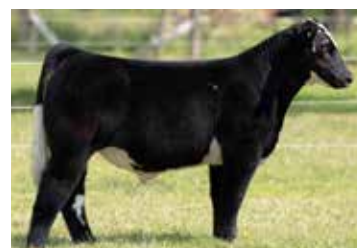
Full / Maternal sibs to embryos selling, $10,000 Here I Am X GOET Miss Cherry Girl