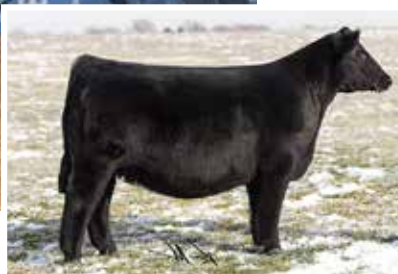
Dam of embryos selling, BPF Miss Me 528C