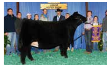
Full/maternal sib to embryos selling, 12D Broker Hairietta daughter