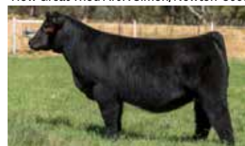
Full / maternal sib to embryos selling, Sold for $13,000 How Great Thou Art X Simon/Newton 8608