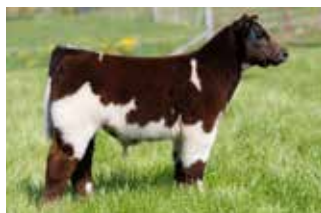
Full / Maternal sib to embryos selling, Spread The Word X Miss Worthy 1H