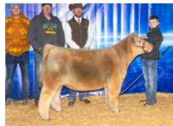
Full/Maternal sib to embryos selling, 5th Overall 202 Jordan Mack Memorial

•LOT 26A: 1 PACKAGE OF 3 EMBRYOS Sired BY In God We Trust SEXED MALE