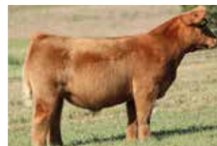
Full / maternal sib to genetics selling, $66,000 IGWT X Lil Red