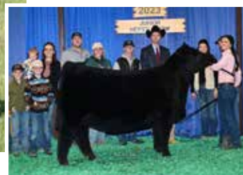
Maternal sib to embryos selling, 2023 NAILE Reserve Grand Champion Female