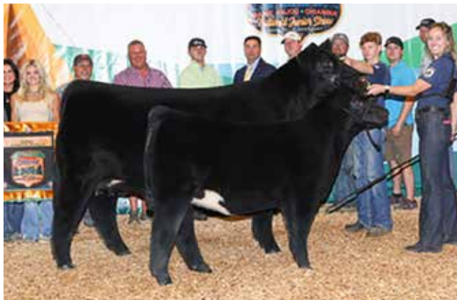
Dam of embryos selling, Miss Worthy 1H

SILVEIRAS STYLE 9303 X JSUL RED THUNDER 9051W • 7.47% CHIANINA (404073)