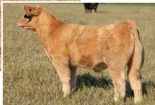
Full/maternal sib to embryos selling, $40,000 Selling steer by How Great Thou Art

•LOT 28A: 1 PACKAGE OF 3 EMBRYOS SIRED BY How Great Thou Art SEXED MALE