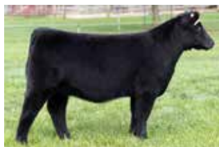
Maternal sib to embryos selling, $28,500 Drivin 80 X Miss Worthy 1H