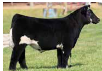
Full / Maternal sibs to embryos selling, $25,000 Here I Am X GOET Miss Cherry Girl