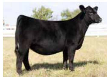
Maternal sib to embryos selling, $16,000 Daughter by Dignity