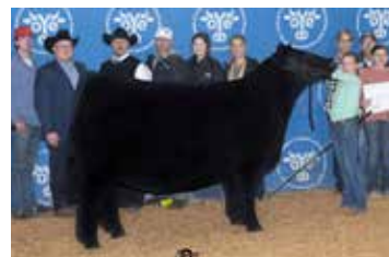
Dam to embryos selling, GOF Miss Dolly 215H 2022 Cattlemen's Congress Grand Champion Mainetainer Female 2022 Oklahoma Youth Expo Supreme Female