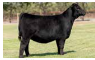
Maternal sib to embryos selling, - 5073 Dignity X Colburn Annie Lu 8079

Lot B offers embryos by SCC SCH 24 Karat 838, the proven mating responsible for a powerful trio of sisters selling for $88,000, $75,000, and $39,000, including the standout Kinnick Paulsen heifer.