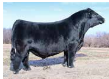
Sire to embryos selling, TJSC Coping With Destiny 9K

•LOT 44A: 1 PACKAGE OF 3 EMBRYOS SIRED BY Next Level SEXED FEMALE