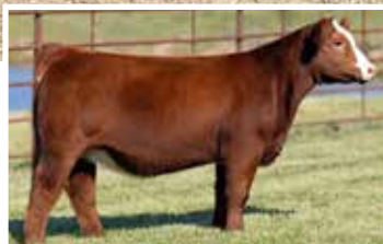
Full sib to embryos selling, $80,000 High selling SAM X Vanna