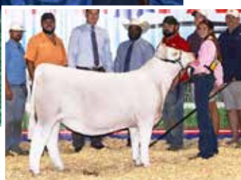
Full sib to Embryos selling, BF WBG Paisley 440 (Pickles)