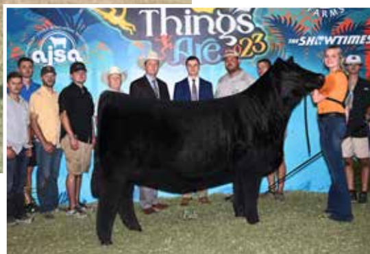
Full/maternal sib to embryos selling, JSUL Sam Is Wise 2023 Junior Nationals Reserve Grand Champion Purebred Female

•LOT 47A: 1 PACKAGE OF 3 EMBRYOS SIRED BY JSUL Something About Mary 8421 SEXED FEMALE