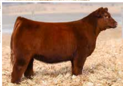
Maternal sib to embryos selling, $40,500 1/2 interest 2025 Boyert-Core Sale