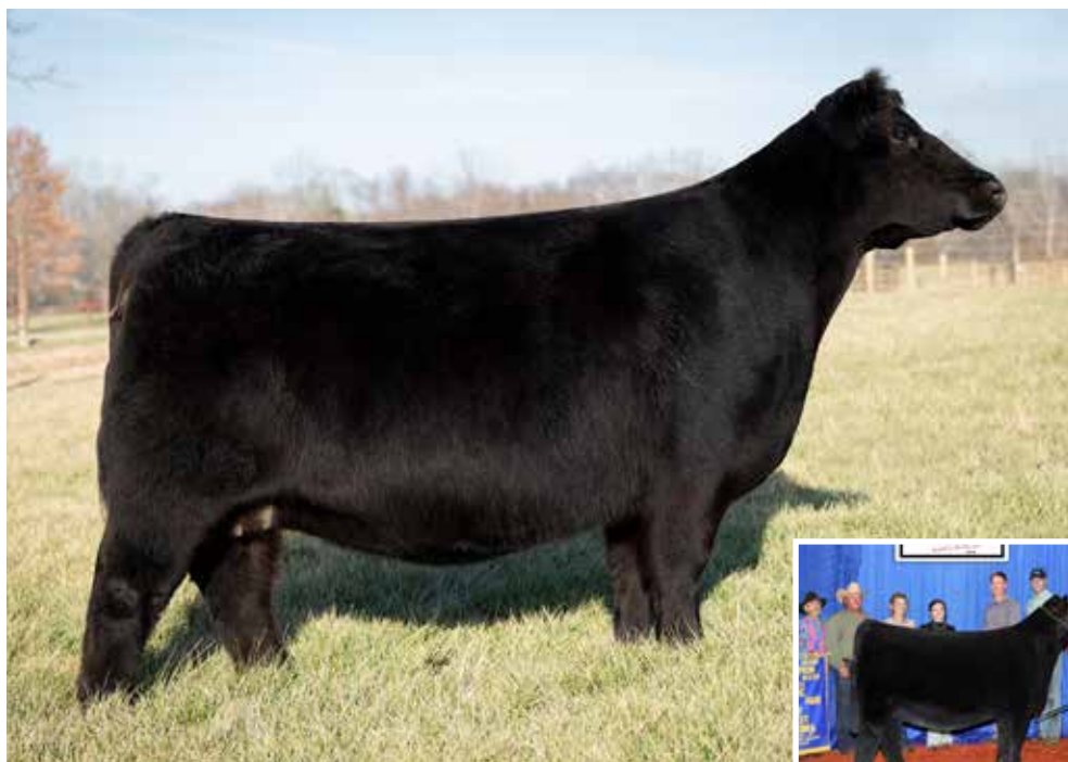
Dam to embryos selling, Campbellco Jaylyn 1928 G

GETCHA SOME X SULL JAYLNN ROSE 8249 • CHI (#399073)