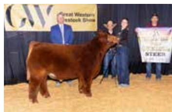
Full / maternal sib to embryos selling, How Great Thou Art X Simon/Newton 53 2026 Sierra Winter Classic Reserve Grand Champion Steer