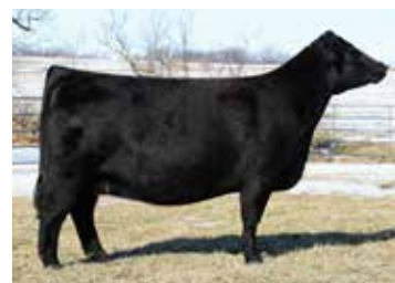
Dam of embryos selling, Baileys Pridette 1D

OFFERED BY: HOLTkamp CATTLE COMPANY, CHAD 319.850.1563