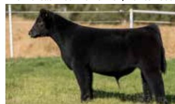
Full / maternal sib to embryos selling, Sold for $20,000 How Great Thou Art X Simon/Newton 8608