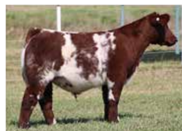
Full / maternal sib to embryos selling, Sold for $21,000

•LOT 40A: 1 PACKAGE OF 4 EMBRYOS SIRED BY Red & White Delight