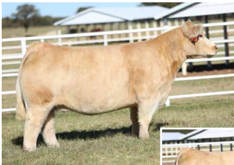
Dam of embryos selling, Horn 702