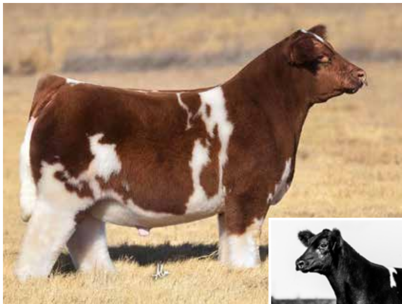
Son of Donor, Perfect Storm