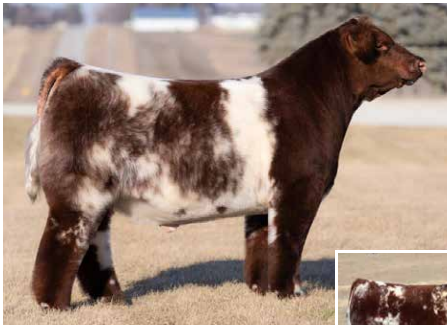
Full / maternal sib of embryos selling, Lethal Promotional sire for Vanhove-RJ Cattle & Schrag-Nikkel

MAN AMONG BOYS X SULL LADY CRYSTAL 434 P • SHORTHORN PLUS (*XAR4363778)