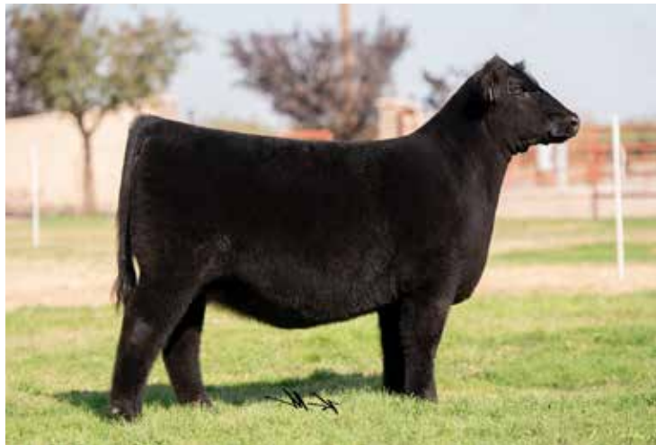
Dam of embryos selling, $140,000 Colburn Annie Lu 8079

COLBURN PRIMO 5153 X PLUM CREEK ANNIE LU 4472 • ANGUS (19233484)