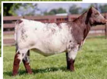
Maternal sib to embryos selling, Demi's Commodity