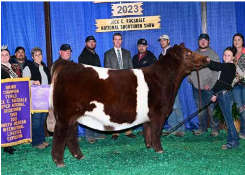
Full sib to embryos selling, VENN SS Revival 703 2023 NAILE Grand Champion Shorthorn Female