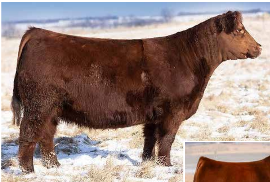
Sib to embryos selling, Little Red Dam of high sellers and National Champions