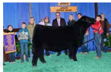
Full / maternal sib to embryos selling, BMW Dolly 502 ET 2025 NAILE Champion Chi Female