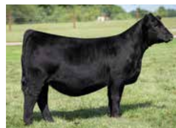
Maternal sib to embryos selling, Campbellco Annie 2402M $81,000 half interest