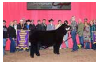
Maternal sib to GOET Outsource Grand Champion Steer Hoosier Beef Congress Grand Champion Steer Purdue AGR Grand Champion Steer MO AGR Grand Champion Steer Ohio AGS