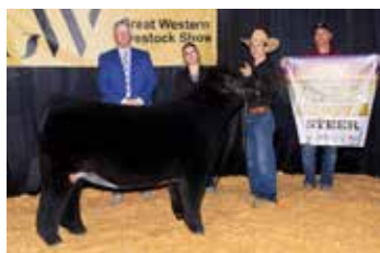
Full / maternal sib to embryos selling, How Great Thou Art X Simon/Newton 53 2026 Great Western Reserve Grand Champion