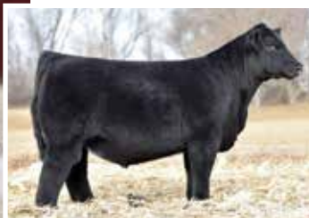
Maternal sib to embryos selling, BBR Memphis Mafia 3E