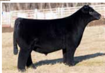
Maternal sib to embryos selling, BBR MLC Mafia Max 2023