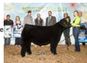
Full / maternal sib to embryos selling, 2025 Michigan Winter Classic Reserve Grand Champion