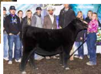
Maternal sib to embryos selling, 4th Overall Boo Bash