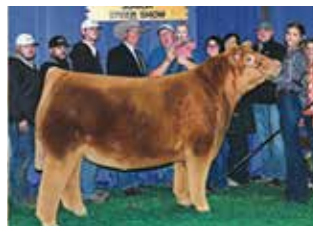
Full / maternal sib to genetics selling, 2023 NAILE Reserve Grand Champion Steer