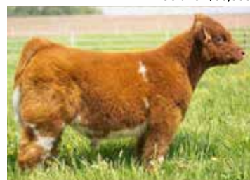
Full sib to embryos selling, Sold for $30,000