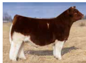
Sire of embryos selling, Red & White Delight

•LOT 7A: 1 PACKAGE OF 3 EMBRYOS SIRED BY Red & White Delight