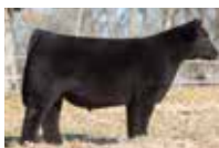
Made To Order