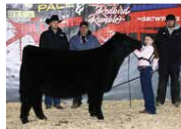
Full/maternal sib to embryos selling