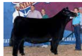
Full / maternal sib of embryos selling, 2024 Nebraska State Fair Grand Champion Market Heifer & 3rd Overall Market Heifer