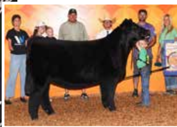
Full / maternal sib to embryos selling, 2025 Chianina Junior Nationals 3rd Overall Chi Composite Female