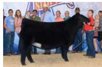
Maternal sib to embryos selling, 2023 Nebraska State Fair Supreme Champion Female