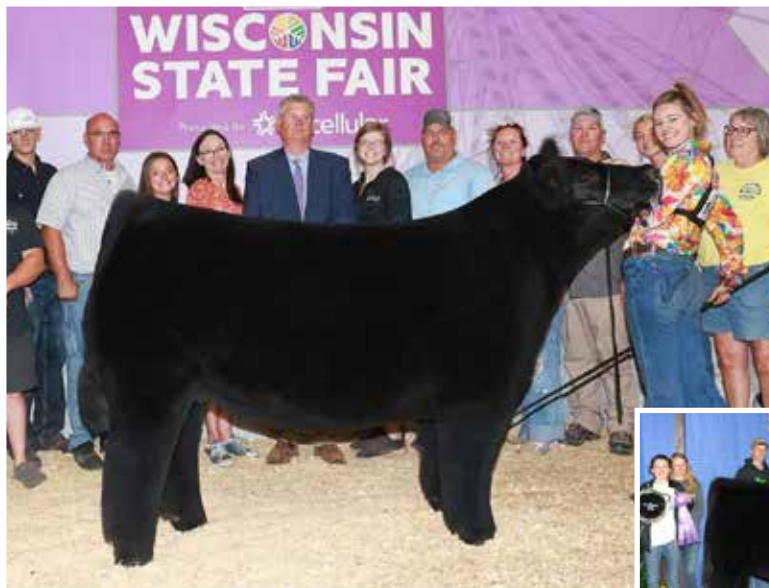
Maternal sib to embryos selling, Here I Am X GOET Annie 2023 Wisconsin State Fair Grand Champion Steer

GOET DRIVIN' 80 X HOLLYWOOD / IRISH WHISKEY (ANITA LOAN FULL SISTER)