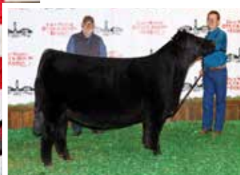
Maternal sib to embryos selling, Roll of Victory Intermediate Show Heifer of the year