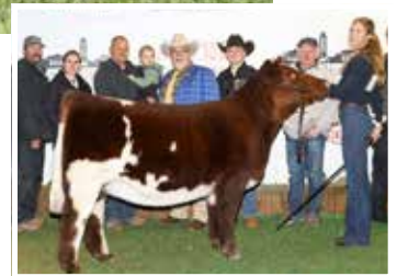
Full sib to embryos selling, GCC Revival Finest 710 ET $43,000 Top Seller - Greenhorn's Where Females Make the Difference Production Sale