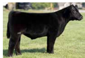
Maternal sib to embryos selling, Here I Am X GOET Annie