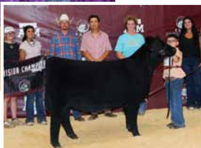
Maternal sib to embryos selling, 2025 Texas A&M Saddle & Sirloin S Supreme Champion British Female