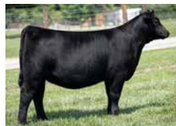
Maternal sib to embryos selling, Conley A1 x HAF Envious Blackbird 1897