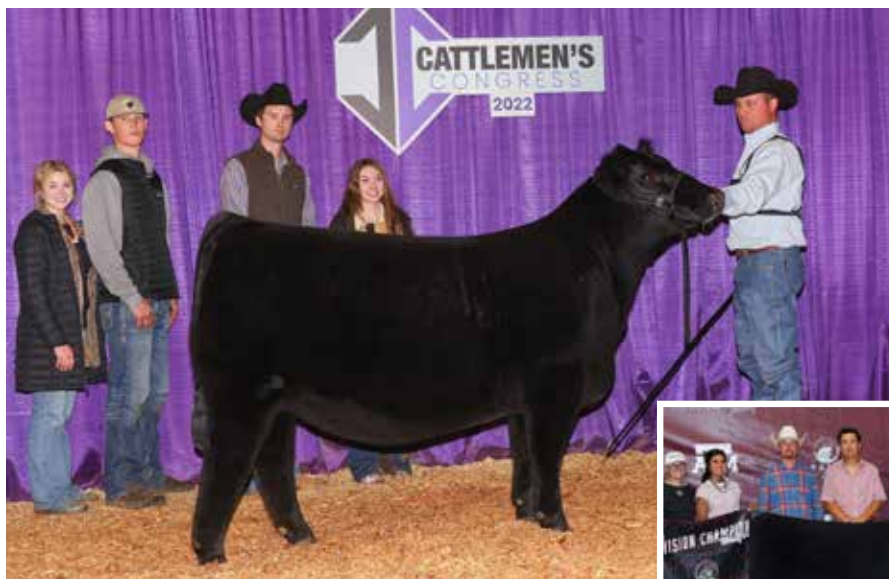
Maternal sib to embryos selling, 2022 Cattlemens Congress Division Champion

COLBURN PRIMO 5153 X EXAR ENVIOUS BLACKBIRD 5983 • ANGUS (AAA 19398164)