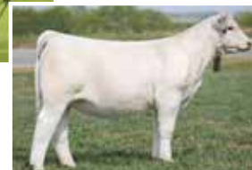
RJ Judy 521 ON

2025 Badger Brawl 5th Overall Heifer Champion Division 1 NWSS $60,500 heifer sired by RF Elevate K108