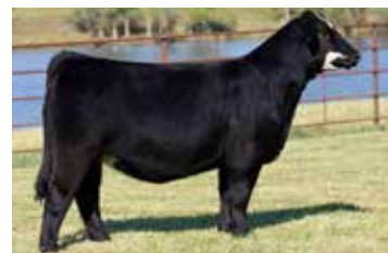
Maternal sib to embryos selling, $180,000 Bankroll Daughter