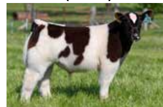
Full / Maternal sib to embryos selling, Spread The Word X Miss Worthy 1H