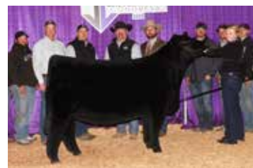
Maternal sib to embryos selling, 2023 Cattlemen's Congress Reserve Grand Champion Mainetainer Female Open Show