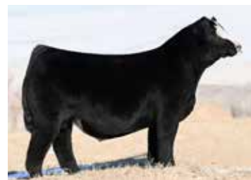
Sire to embryos selling, Next Level