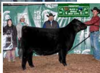
Full / maternal sib to embryos selling, 2025 MSU Block & Bridle Grand Champion Heifer