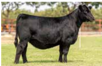
Full / maternal sib to embryos selling, Colburn Sara's Dream 5897 First Class X Sara's Dream 1339