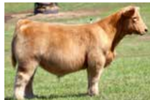
Full / maternal sib to genetics selling, $44,500 IGWT X Lil Red