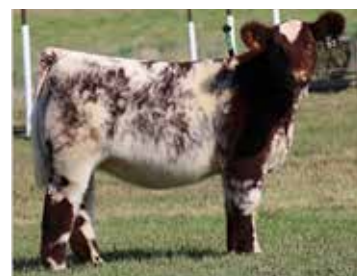
Full / maternal sib to embryos selling, Sold for $15,000

This lot features a mating to Red & White Delight, offered non-sexed—and for good reason. Few would turn down the opportunity for a powerful, high-impact steer prospect from this combination. When you consider the look, balance, and proven success behind this mating, it's easy to see the upside. Oh boy... welcome to a brave new world.