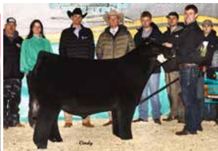
Full / maternal sib to embryos selling, 2025 Illinois Beef Expo Reserve Grand Champion