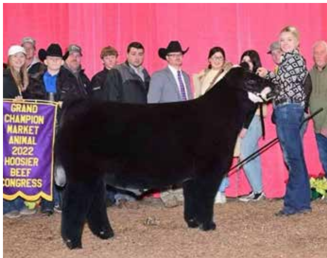
Full / maternal sib of embryos selling. Multiple time Grand Champion Steer including: Grand Champion Steer Hoosier Beef Congress Grand Champion Steer Purdue AGR Grand Champion Steer MO AGR Grand Champion Steer Ohio AGS