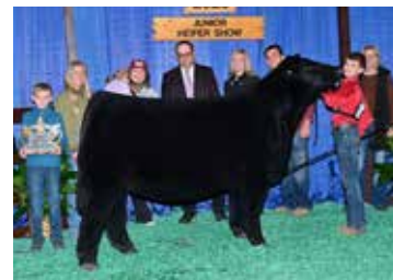
Granddaughter of Donor, BMW Dolly 502 ET 2025 NAILE Grand Champion Chianina Junior Show