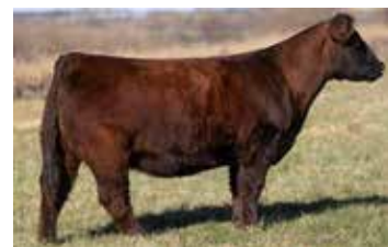
Dam of embryos selling, Webster 191