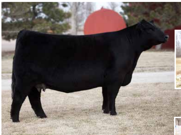
Dam of embryos selling, GEF Miss Dominatrix 236A

MINN HARD WHISKEY 591Y X BA FOREVER LADY 520 • MAINETAINER (AMAA 440729)