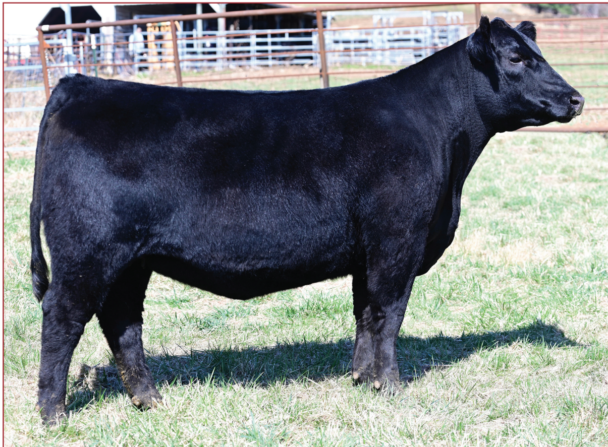
Dancing Pedlar Rita 4039 / Lot 17