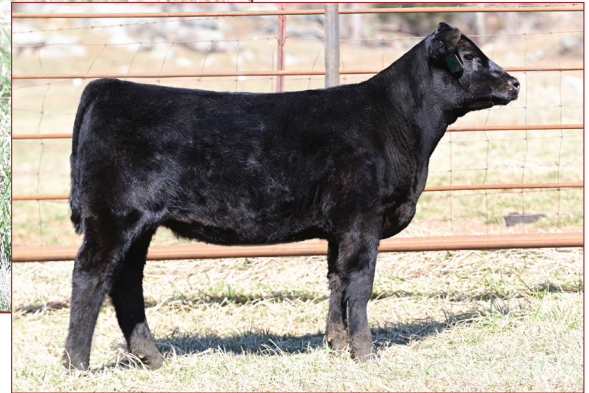
Dancing Pedlar Rita 4051 / The $8,100 lead-off female of the 2025 Dancing Pedlar LiveOnline Sale selected by Two Rivers Cattle Company. A maternal sister sells as Lot 10.