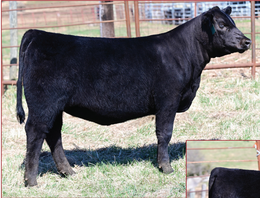
C&M Rita 5009 / Lot 11