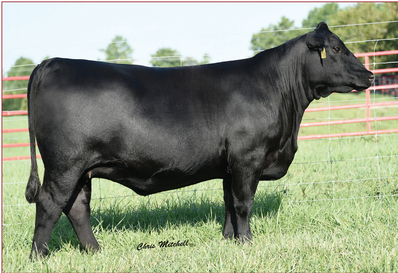
EWA 0136 of 6104 Peyton / Lot 8