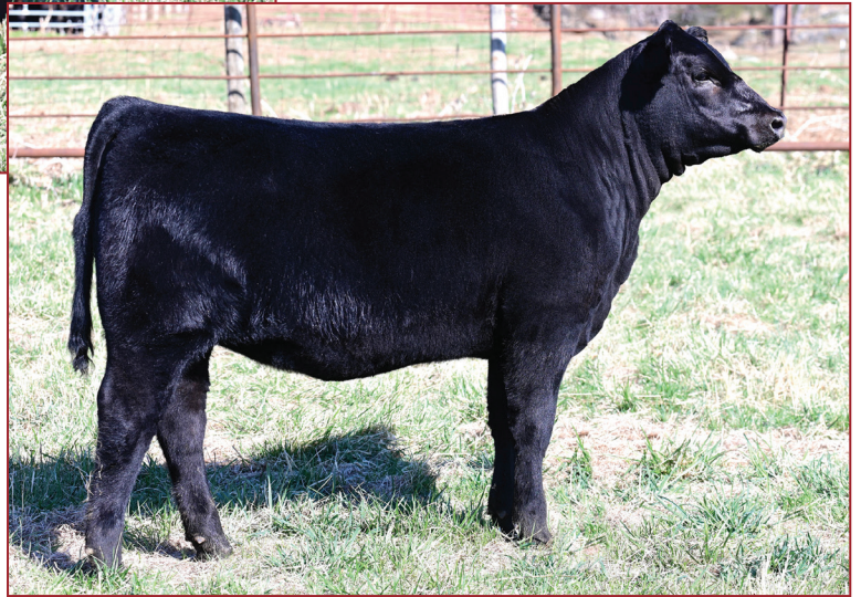
Dancing Pedlar Lucy 5057 / Lot 5