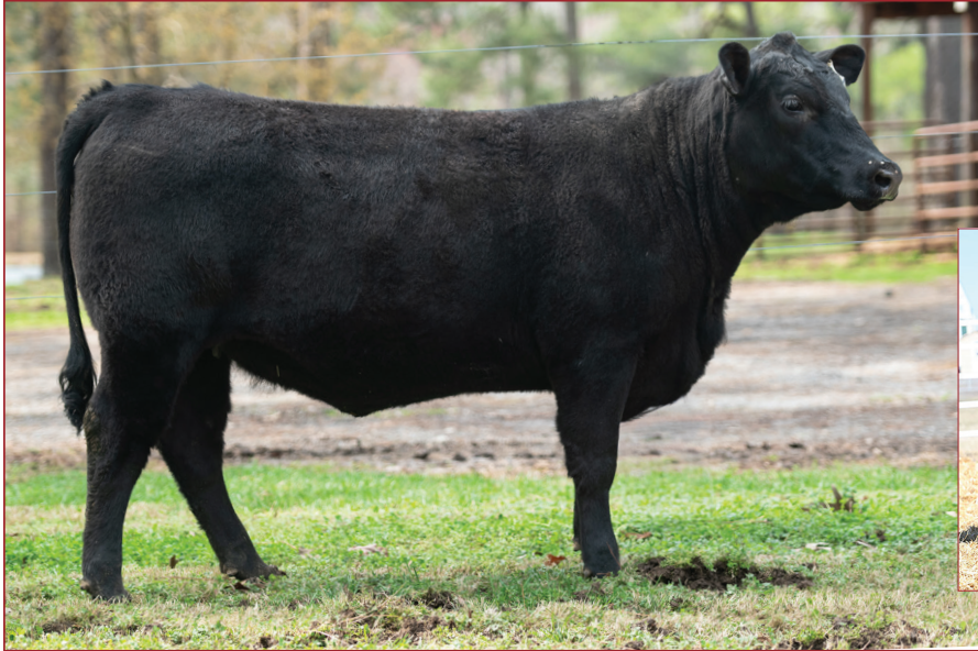
FOF & S/F Winchester 0136N / Lot 7A