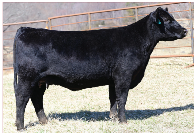
Dancing Pedlar Rita 1028 / A daughter of this proven former Dancing Pedlar donor sells as Lot 17.

Rita 4039 is a powerful growth, RE, $M and $C bred heifer produced by the foundation Rita in the Dancing Pedlar donor program Rita 1028 and sired by the proven phenotype leader of the ST Genetics roster, RiseAbove.