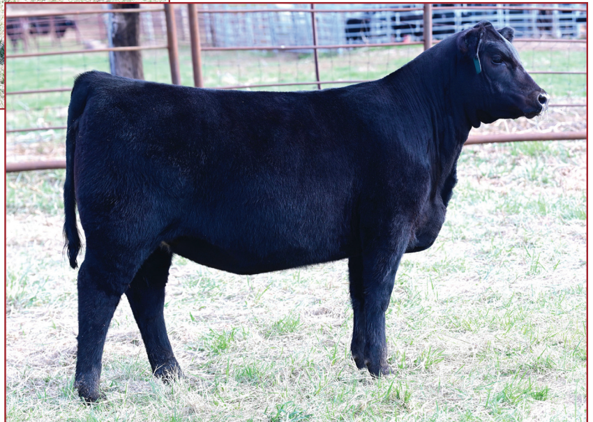
Dancing Pedlar Rita 5032 / Lot 20A