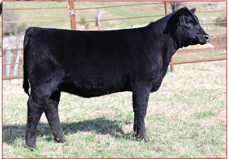
Dancing Pedlar Rita 5064 / Lot 12