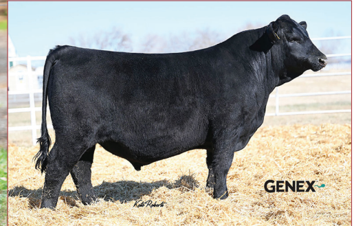
PEAK Draft Pick / The multi-trait leading sire of Lot 7B.