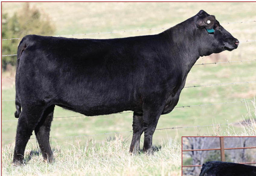
Dancing Pedlar Rita 4504 / Lot 15