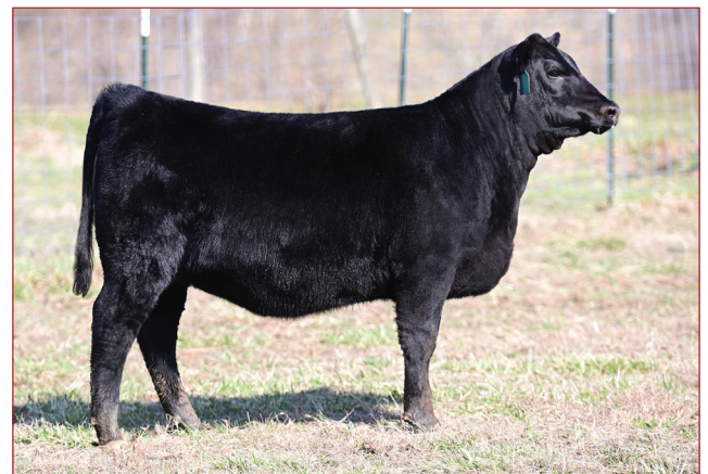
Dancing Pedlar Jaunty 3003 / The $10,000 full sister to the dam of Lot 1A featured in the 2024 Dancing Pedlar LiveOnline Sale.

• Jaunty 5059 is currently the ONLY non-parent female in the breed with her combination of CED, BW, WW, YW, SC, HP, PAP, CW, Marb., RE, $M, $W, $B and $C.