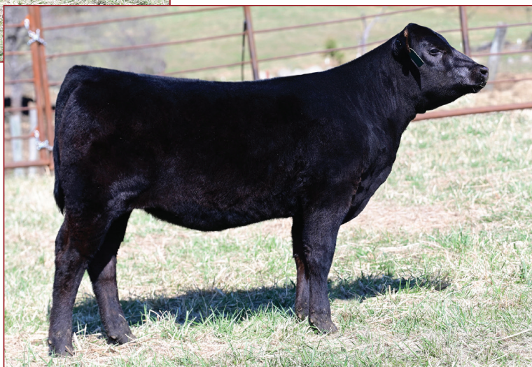
Dancing Pedlar Blackcap 5088 / Lot 19A