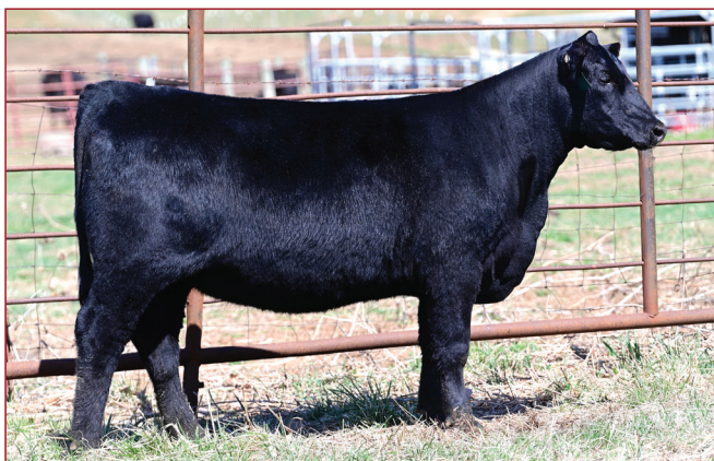
Dancing Pedlar Jaunty 4035/ Lot 3