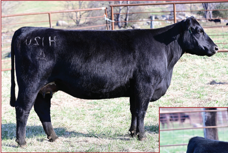
Audley Rita H120 / Lot 20