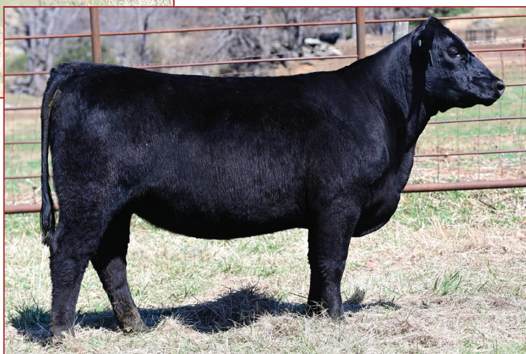
Dancing Pedlar Blackcap 4503 / Lot 16