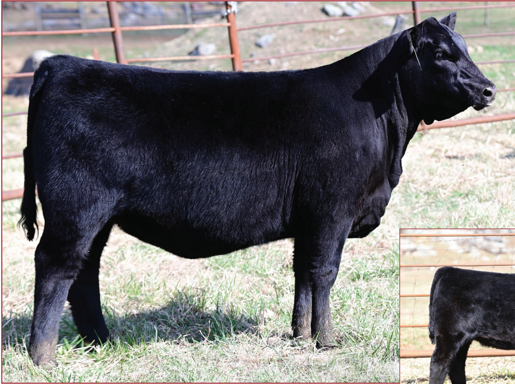
Dancing Pedlar Erica 5046 / Lot 9