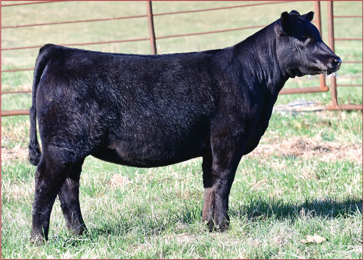
Dancing Pedlar Jaunty 5059 / Lot 1A