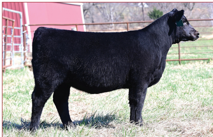
Dancing Pedlar Jaunty 5036 / Lot 2