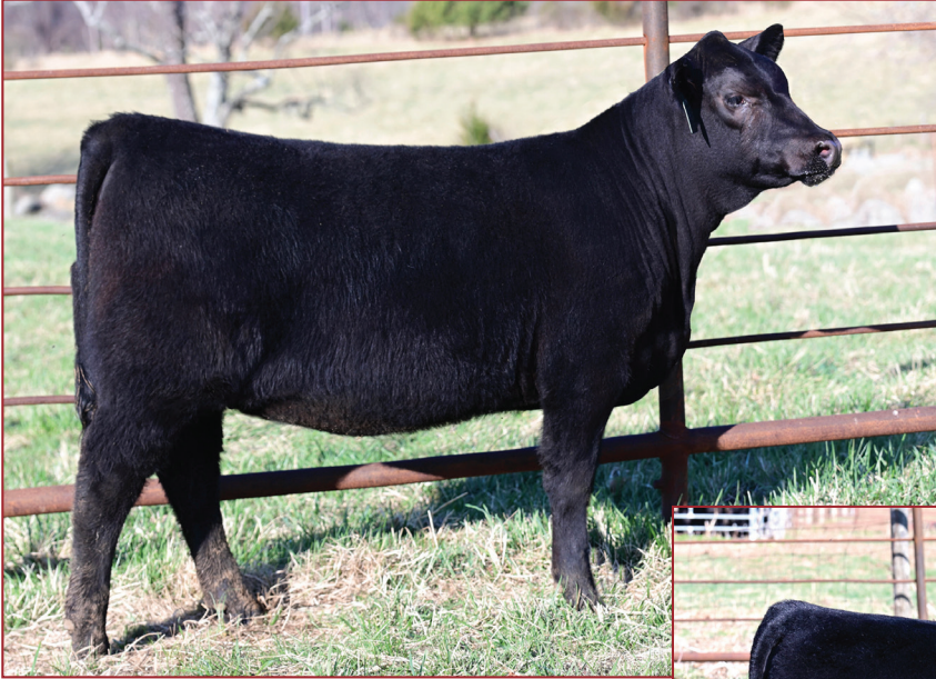
Dancing Pedlar Elba 5001 / Lot 4