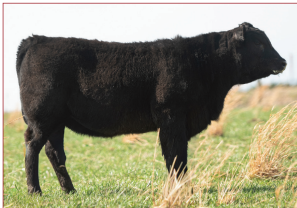
FOF Lucy 01N / Lot 14