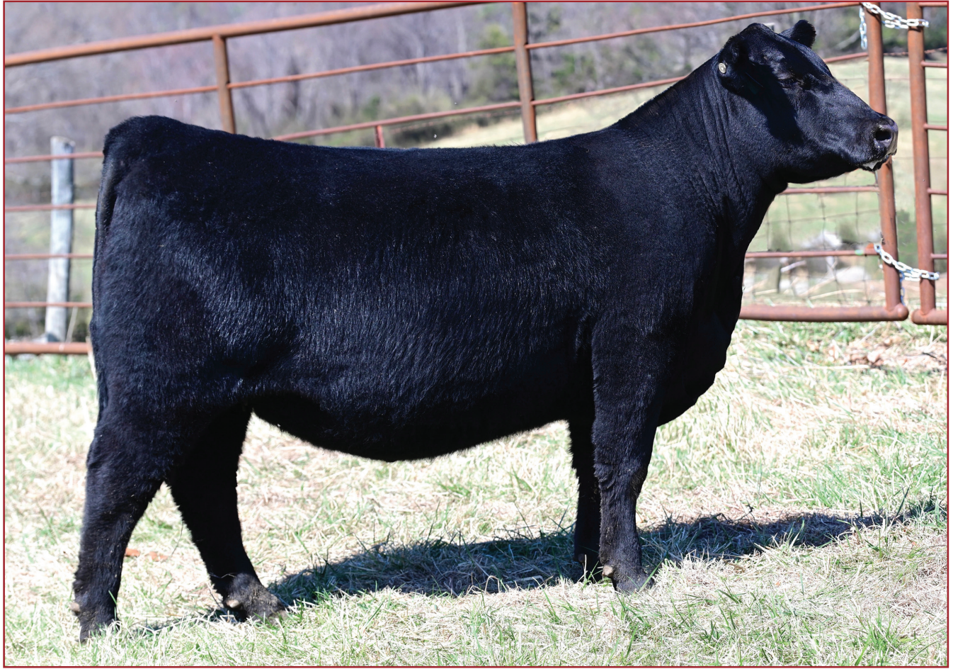
Dancing Pedlar Enamel 4019 / Lot 18

Enamel 4019 is a growth, REA, $M, $B combination daughter of the foundation Enamel in the Dancing Pedlar program, Enamel 2V21 sired by the proven growth and phenotype sire at ST Genetics, RiseAbove.