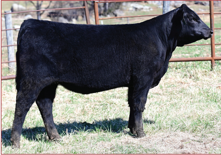
Dancing Pedlar Blackcap 5010 / Lot 13