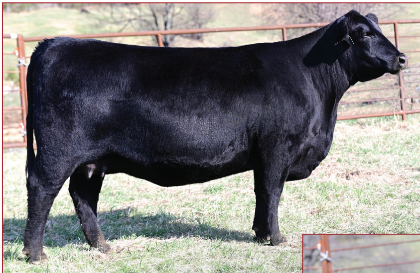
Dancing Pedlar Blackcap 1018 / Lot 19