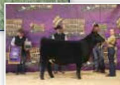
DAMERON FRONTIER GAL 424 The $210,000 maternal sister to Lot 1-5.