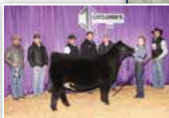
DAMERON FRONTIER GAL 424 The $210,000 maternal sister to Lot 1-5.