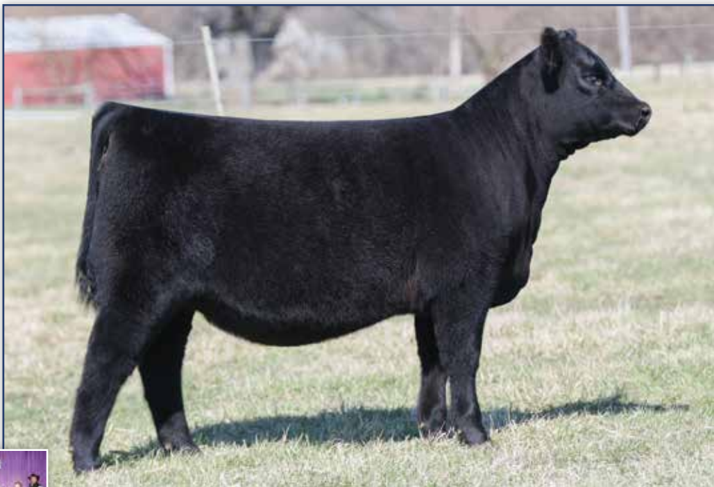
DAMERON FRONTIER GAL 5106 – She sells as Lot 3.