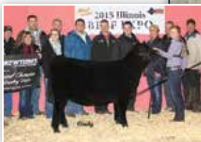
DAMERON LUCY 4137 Illinois Beef Expo Supreme Champion and dam of Lot 15.

A flawless September show heifer prospect by Conley DS Clear Cut 0510, ROV Show Bull of the Year, back to Dameron Lucy 4137, one of the top income-producing females in the Dameron Angus program and the $85,000 past feature of a fall sale who went on to be named the Supreme Champion at the Illinois Beef Expo, Early Heifer Calf Champion of the Atlantic National, Res. Early Summer Heifer Calf Champion of the Atlantic National Junior Show, and her third-generation dam, Dameron Lucy 868, is a past ROV Transplant Dam of the Year.