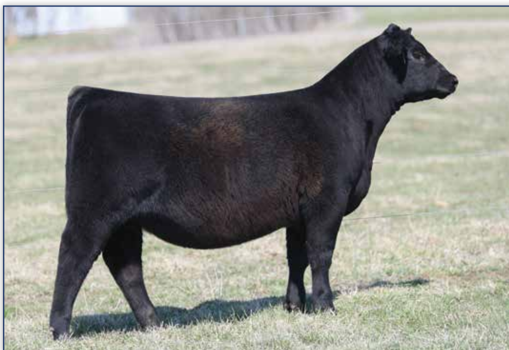
DAMERON LUCY 5120 – She sells as Lot 14.