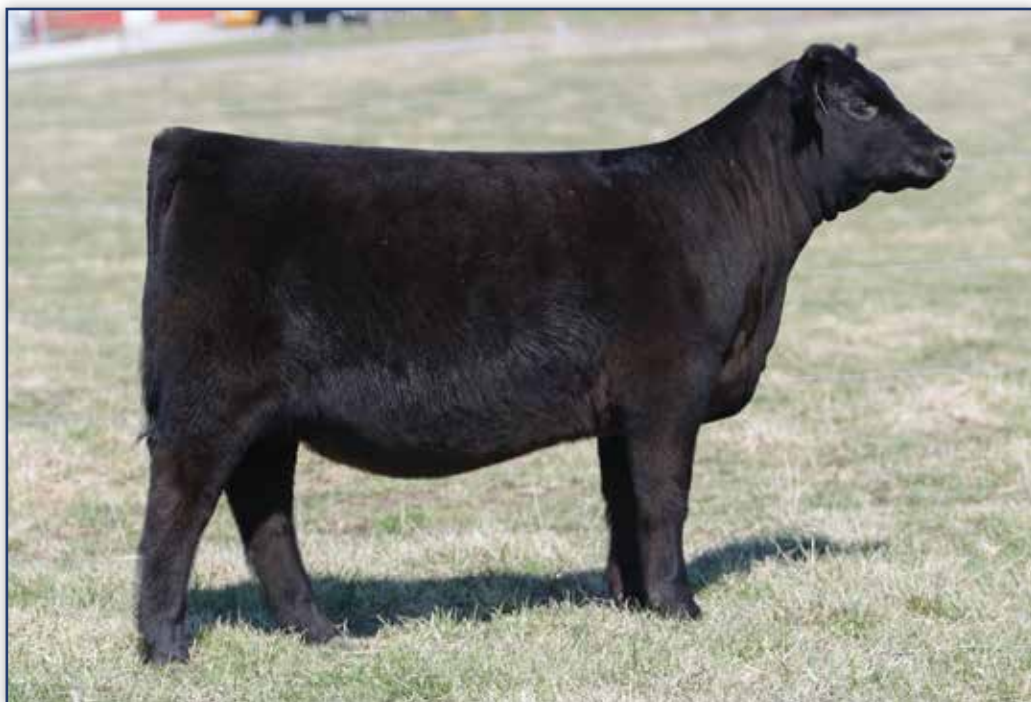
DAMERON SANDY 5121 – She sells as Lot 8.