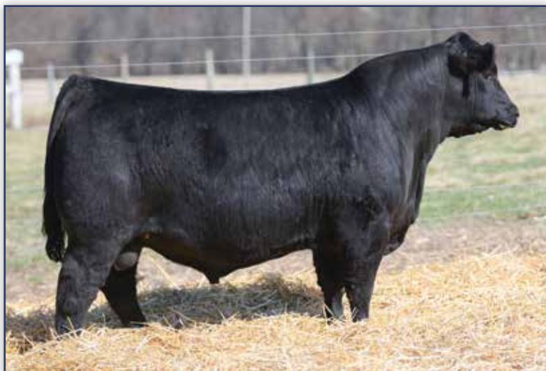
DAMERON REAL WORLD 540 – He sells as Lot 28.