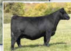
DAMERON FRONTIER GAL 645 Dam of Lots 1-5.