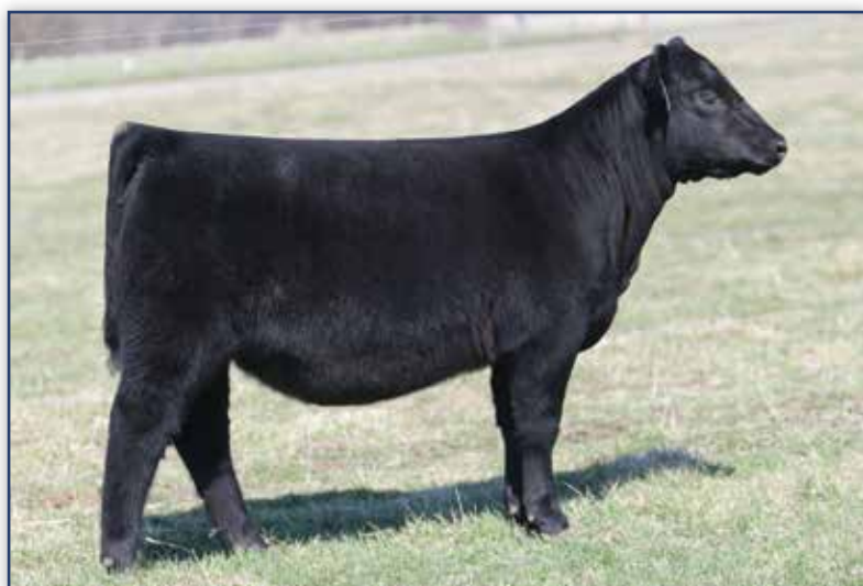
DAMERON LUCY 5117 – She sells as Lot 16.

One that demands a look is this daughter of SCC SCH 24 Karat 838 back to Dameron C-5 Lucy 2242, who is the Overall Bred & Owned Champion of the 2023 All-American Futurity Junior Show and in 2024 went on to be named the Grand Champion Bred & Owned Cow-Calf Pair at the National Junior Angus Show, Res. Heifer Calf Champion Div. I of the Cattlemen's Congress Junior Show, Res. Div. I Heifer Calf Champion of the Cattlemen's Congress ROV Angus Show. Dameron Lucy 9193, a full sister to the dam, was selected as the 2021 Grand Champion Female of the National Junior Angus Show, Res. Grand Champion at the Atlantic National, and was one of the winningest heifers in the 2021 summer show season.