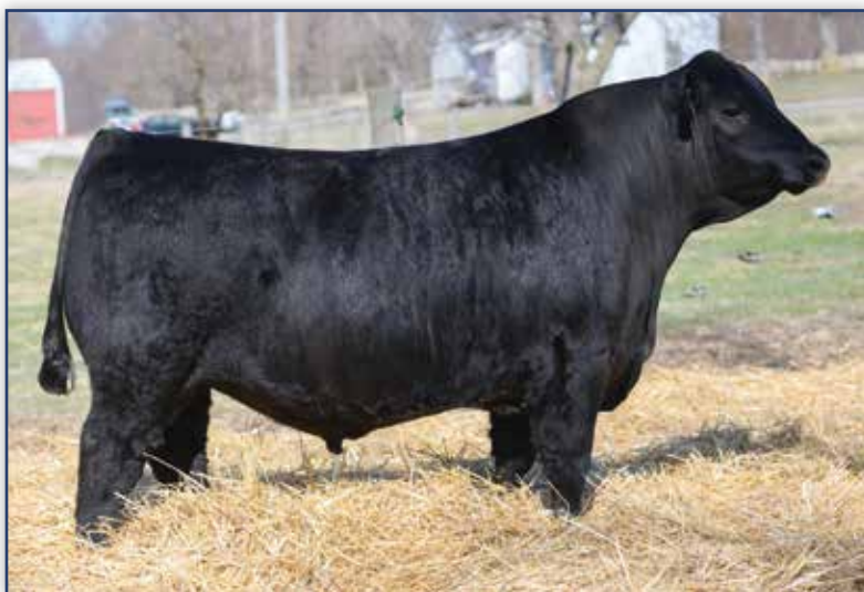
DAMERON THEDFORD 511 – He sells as Lot 27.