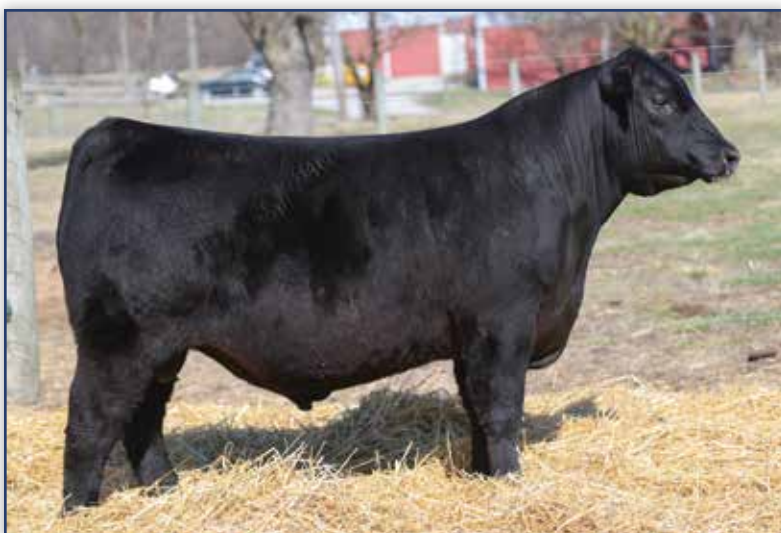
MR FR DAMERON SKY HIGH 5018 – He sells as Lot 32.