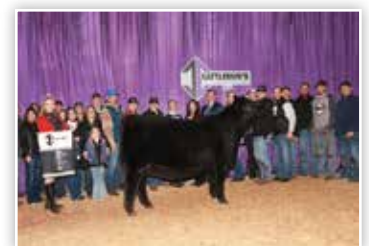
SELDOM REST 2030 Supreme Champion Female, 2024 Cattlemen's Congress & dam of Lot 6.