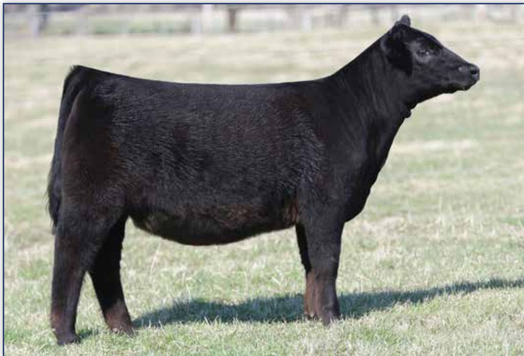
DAMERON SANDY 5126 – She sells as Lot 7.