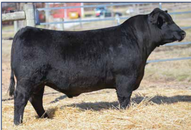
DAMERON BULLET PROOF 4798 – He sells as Lot 33.