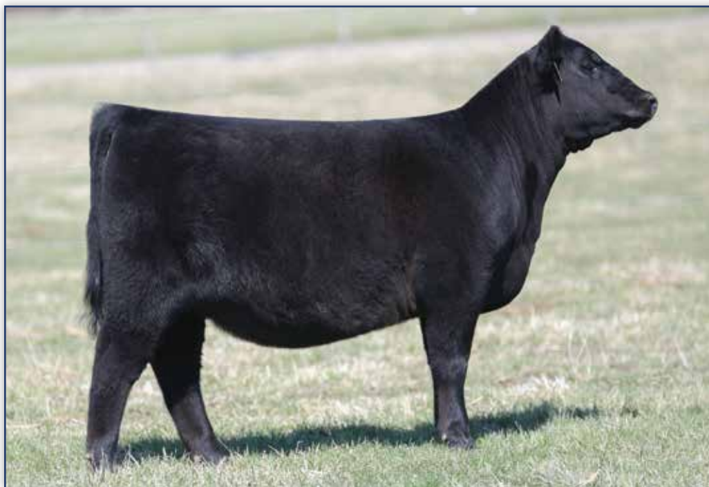
DAMERON LUCY 5125 – She sells as Lot 13.