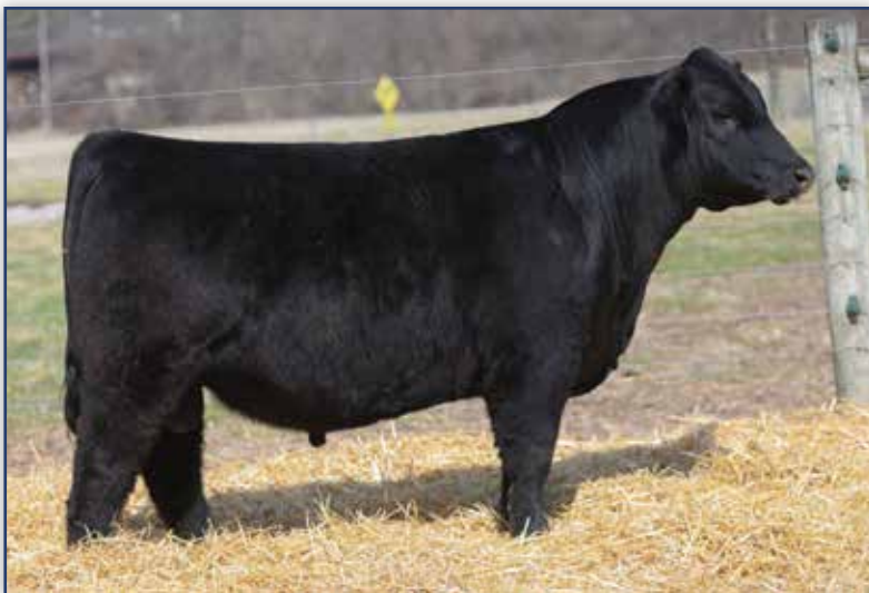
DAMERON POINT GUARD 4147 – He sells as Lot 34.