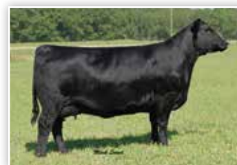
DAMERON LUCY 868 – Third dam of Lots 13 & 14.