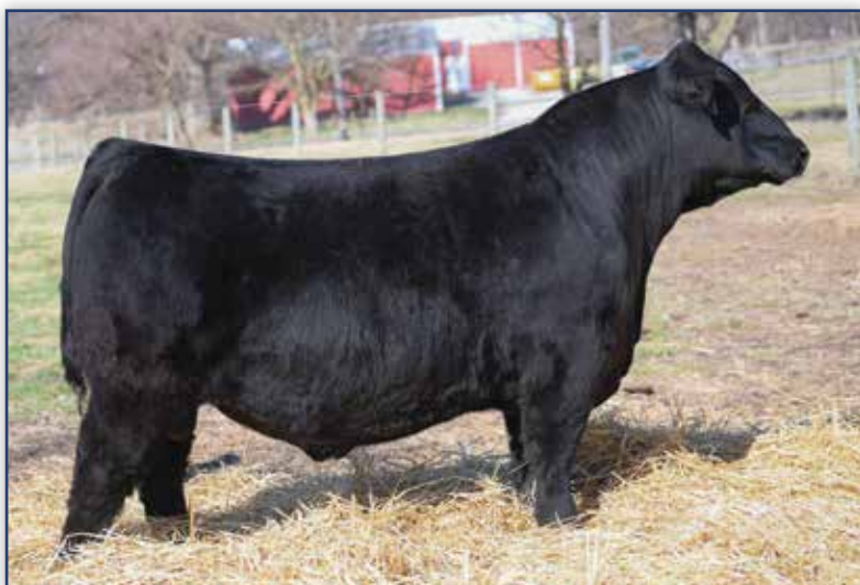
DAMERON PROMINENT 4707 – He sells as Lot 29.