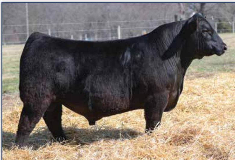
DAMERON TRUE BALANCE 5019B – He sells as Lot 25.