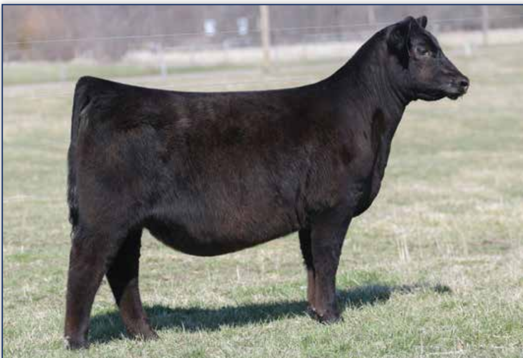
DAMERON SANDY 5119 – She sells as Lot 6.