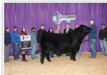
SCC WICKED WAGER 346 Grand Champion Bull of the 2025 Cattlemen's Congress & maternal brother to Lot 9.