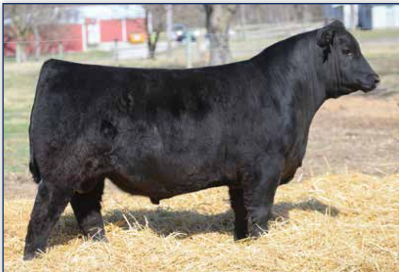
DAMERON EXEC DECISION 517 – He sells as Lot 31.