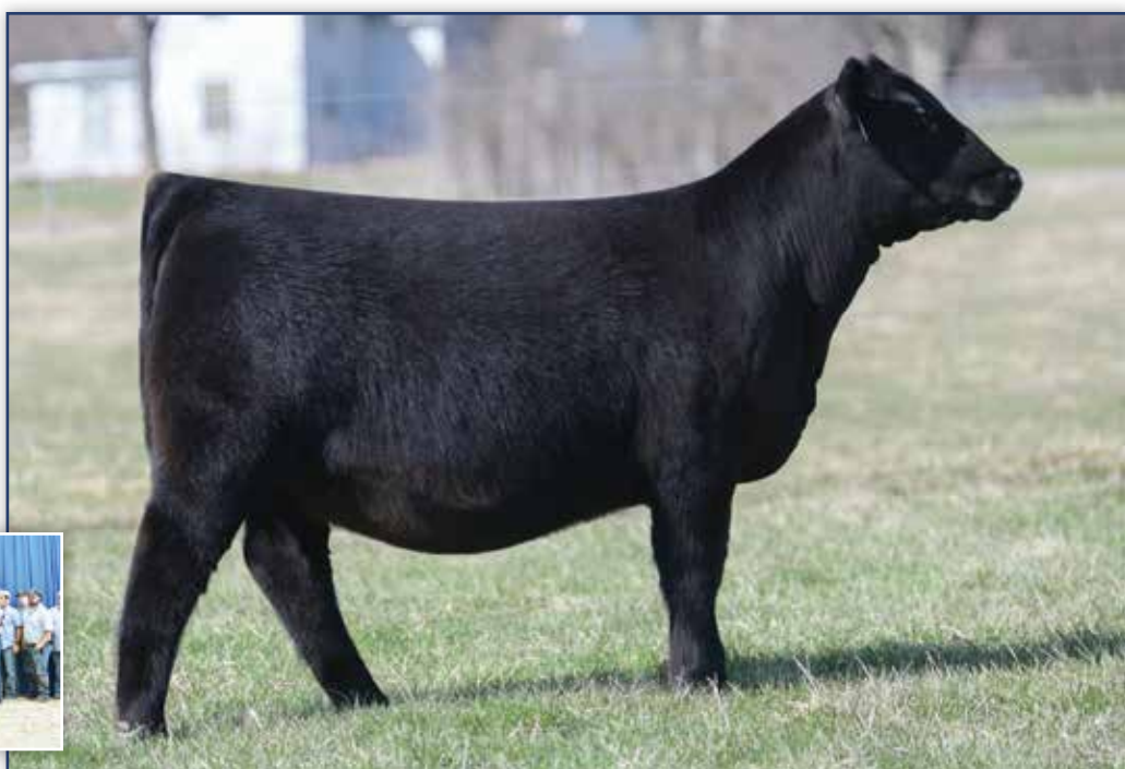
DAMERON LUCY 5109 – She sells as Lot 12.