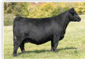
DAMERON LUCY 9193 Full sister to the dam of Lot 13 & 14.