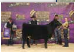
DAMERON FRONTIER GAL 424 The $210,000 maternal sister to Lot 1-5.