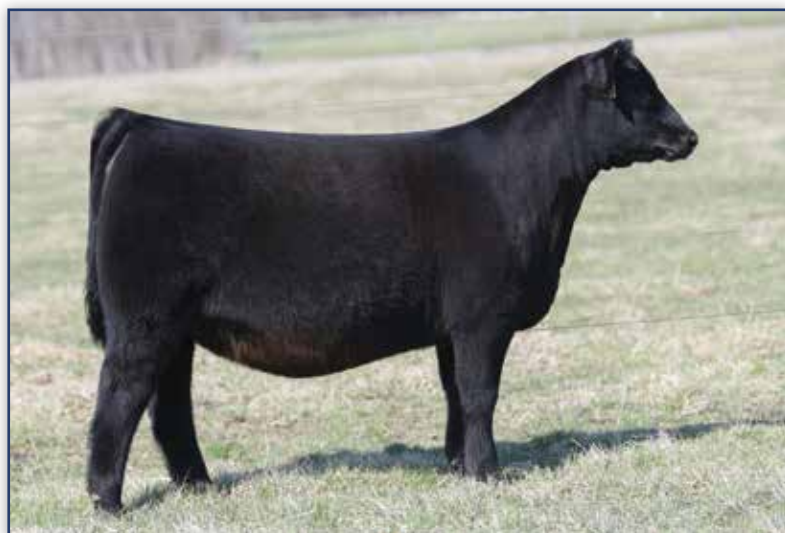
DAMERON STAR 5112 – She sells as Lot 17.

Refined from every angle is this featured late September show heifer prospect by PVF DLX King Pin 0058 back to the featured Star family. Dam is a powerhouse female who is big footed and big boned with tremendous body shape and added three-dimensional thickness throughout and a daughter of SCC First-N-Goal GAF 114 produced in the Rutledge program in Illinois. This fall show heifer prospect offers unlimited opportunity to have a tremendous 2026 summer show season.