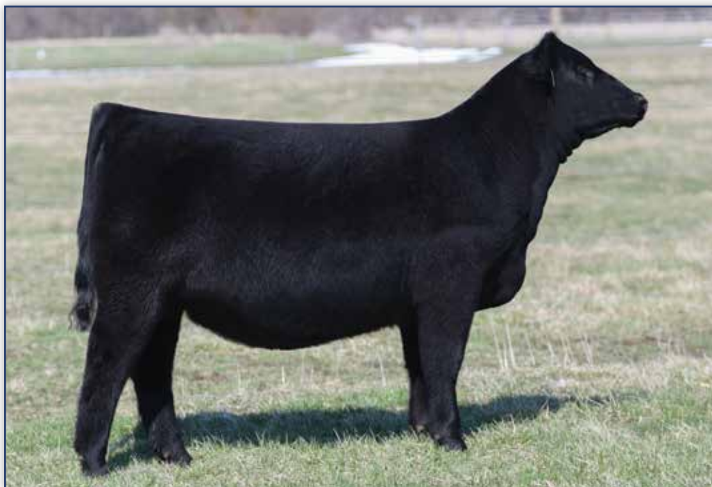
DAMERON LUCY 598 – She sells as Lot 10.