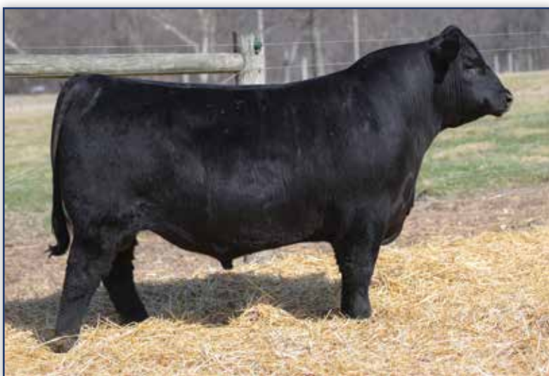
DAMERON THEDFORD 512 – He sells as Lot 26.