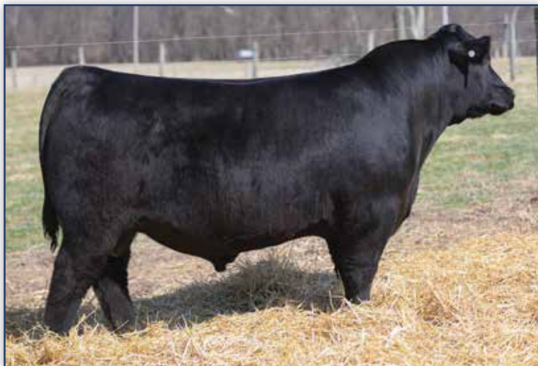
DAMERON SIDEKICK 2493 – He sells as Lot 30.