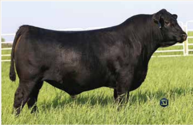
BNWZ Bougie 1588 / Reference Sire B

B BNWZ Bougie 1588 [AMF-CAF-D2F-DDF-M1F-NHF-OHF-OSF-RDF] Birth Date: 09-16-2021 Bull *20200640: 1588 #**Baldrige Alternative E125 Poss Easy Impact 0119 *SG Salvation *MGR JP Rita 7037 Baldrige Blackbird A030 19559741 #*Basin Payweight 1682 *MGR Rita 2145 #*EXAR Denver 2002B #*EXAR Upshot 0562B +RB Lady Denver 167-453 +Exar Royal Lass 1067 18143482 *R B Lady Party 167-305 #*Werner War Party 2417 *B A Lady 6807 305