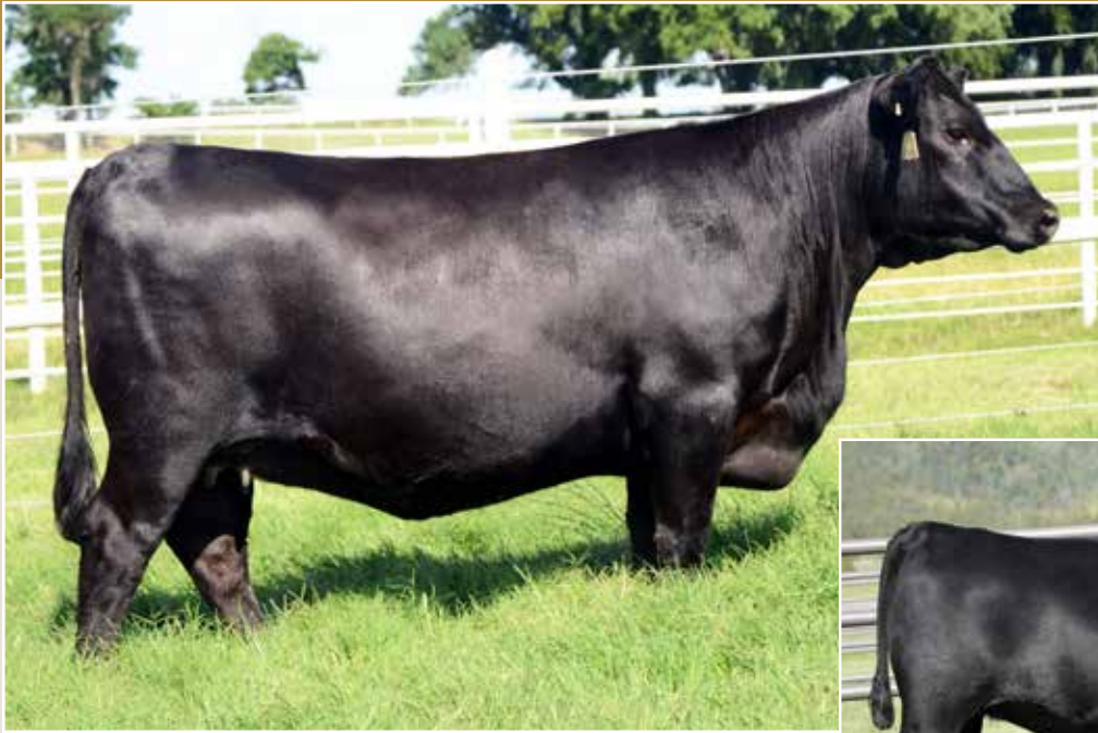
EXAR Rita 2888 / The $155,000 top-selling fall pair of the 2024 Big Event at Express Ranches and donor dam of Lots 10A and 10B.