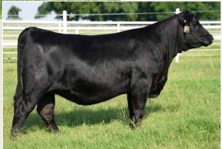
EXAR Susie 4860 / The $160,000 full sister to Lot 12 selected by Grimmus Cattle Company in the record-breaking 2025 Express Ranches Big Event.

Featuring an outstanding set of embryos from the $230,000 all-time high-selling female for Gobbell G3 Farms, Susie 2141 sired by the record-selling multi-trait sire in the Spruce Mountain roster, Ambitious.