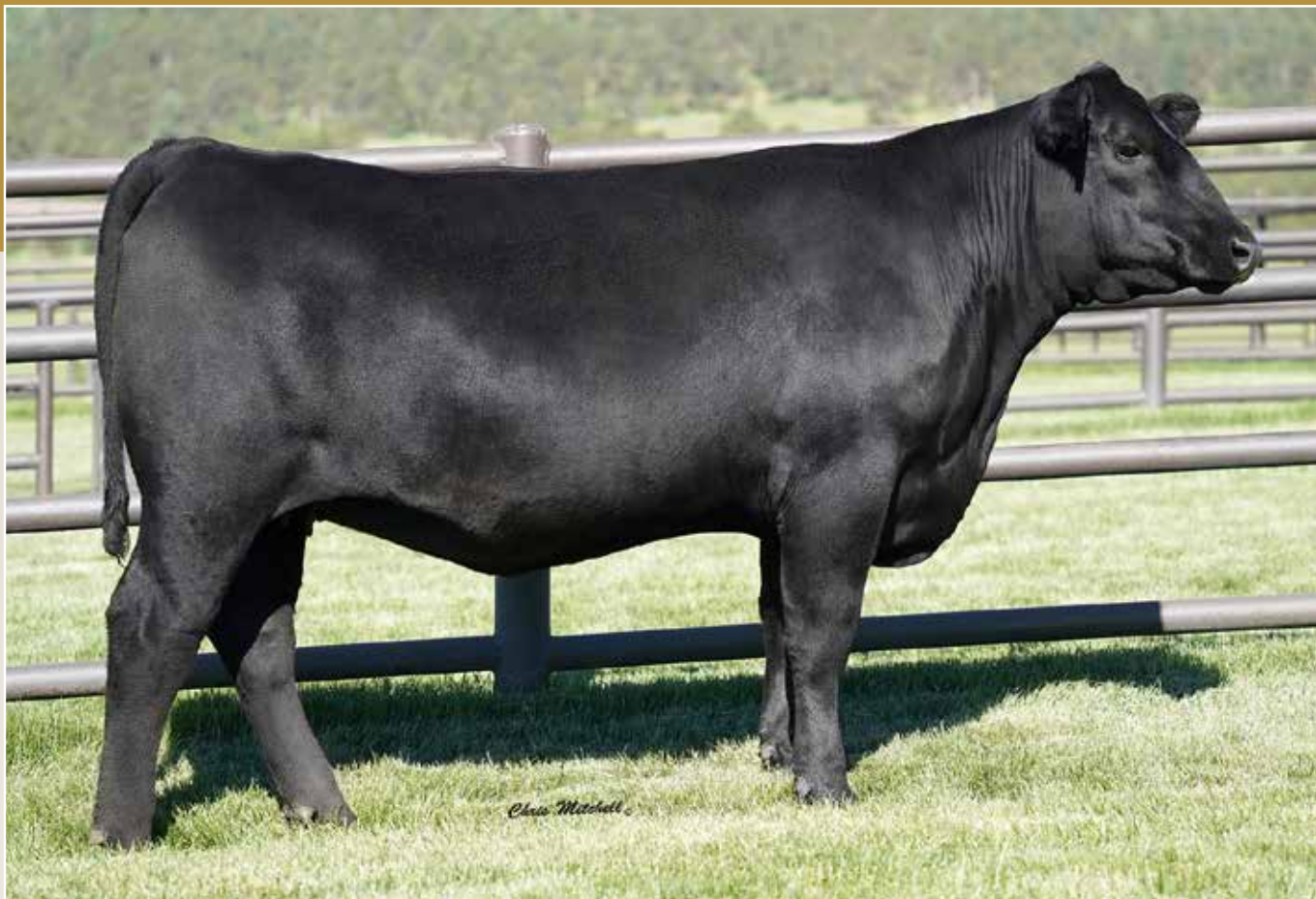
Linz Lady Magnitude 453-2461 / The $60,000 valued featured donor in the Spruce Mountain Ranch and Brennan Livestock joint embryo program and donor dam of Lot 4.

Featuring a set of embryos from the $60,000 valued foundation Lady in the Spruce Mountain Ranch and Brennan Livestock joint embryo programs, Lady Magnitude 453-2461 sired by the exciting $C leader, Grand Slam.