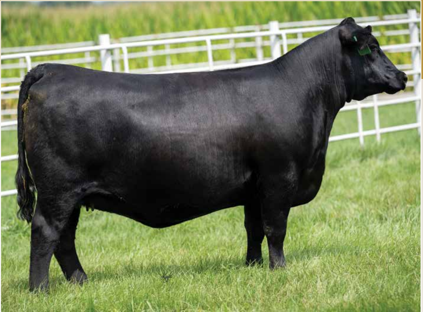
EZAR Henrietta Pride 2092 / The $160,000 cornerstone Henrietta Pride in the joint embryo programs of Spruce Mountain Ranch and Express Ranches and donor dam of Lot 17.

Featuring a set of embryos from the $160,000 headliner of the 2023 Nowatzke Cattle Company Sale, Henrietta Pride 2092 sired by the record-selling multi-trait feature of the Spruce Mountain Ranch herd sire roster, Ambitious.