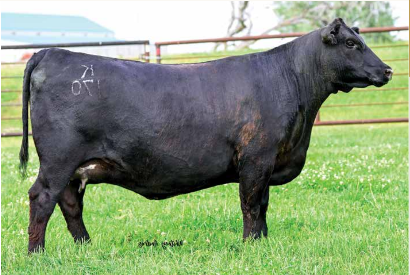
Riverbend Belle K170 / The $65,000 foundation Belle in the Spruce Mountain Ranch program and donor dam of Lot 9.

Featuring a set of embryos from the $65,000 top-selling fall pair of the 2024 Riverbend Ranch Sale, Belle K170 sired by the breed's Number 1 $C sire, Crick.