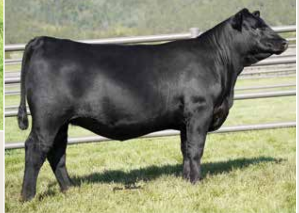
Spruce Mtn Rita 4542 / The $380,000 valued maternal sister to Lots 10A and 10B selling half interest to Pollard Farms in the 2025 Spruce Mountain Ranch Sale.

Featuring two sets of embryos from the $155,000 top-selling first calf heifer of the 2024 Express Ranches Big Event, Rita 2888 sired by the exciting $C leader, Crick and the popular ST Genetics sire, Longbow.