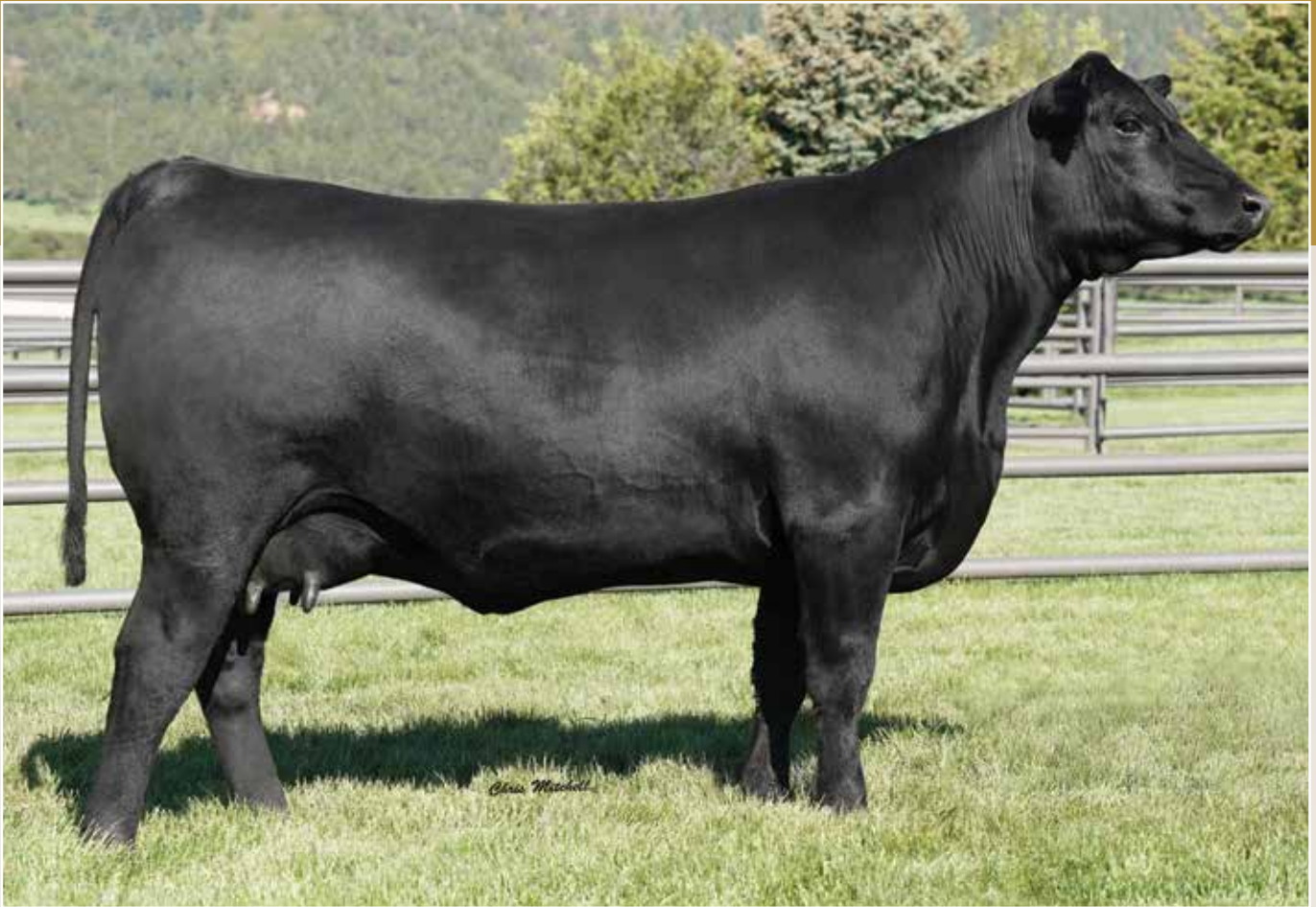
Spruce Mtn Linda 3066 / The $95,000 maternal sister to the dam of Lot 14 selected by Gobbell G3 Farms in the 2025 Spruce Mountain Ranch Sale.

A special highlight from the herd sire producing Linda family, a set of embryos from the foundation Spruce Mountain and Belle Point Ranch Linda, Linda 3515 sired by the multi-trait leader of the Gabriel Ranch, Koberstein and Rumor Has It programs, Satisfaction.