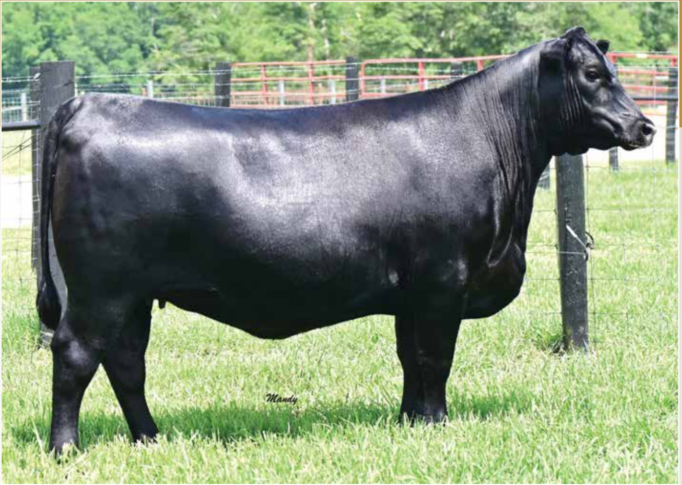
EPF Rita L1118 / The $150,000 co-top-selling bred heifer of the record-setting 2025 Edisto Pines Farm Sale selected by Spruce Mountain and donor dam of Lot 19.

Featuring a set of embryos from the $150,000 co-top-selling bred heifer selected by Spruce Mountain in the record-breaking 2025 Edisto Pines Sale, Rita L1118 sired by the outcross feature, Gable 311.