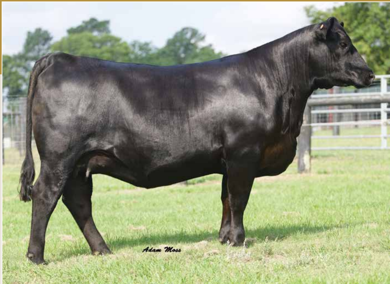
EPF Rita J158 / The $170,000 top-selling and lead-off selection of Spruce Mountain Ranch in the 2023 Edisto Pines Sale and donor dam of Lot 18.

Selling a set of embryos from the $170,000 top-selling and lead-off female of the 2023 Edisto Pines Farm Sale, Rita J158 sired by the popular Brumfield Angus headliner, Congress.