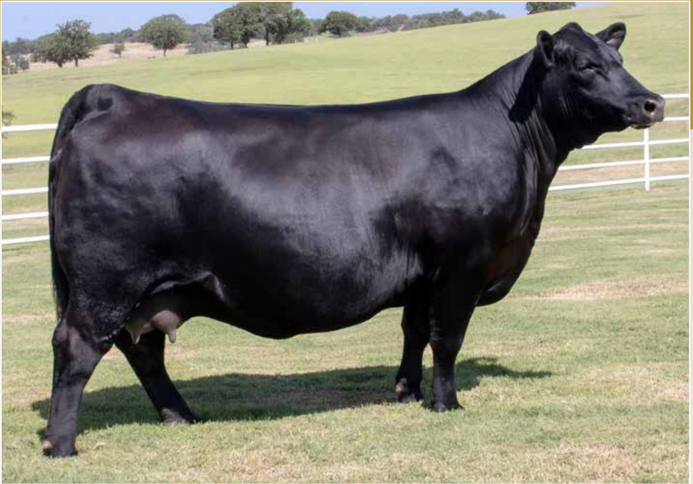
PEAK Rita L346 / The $40,000 maternal sister to the multi-trait leader Draft Pick and donor dam of Lot 20.