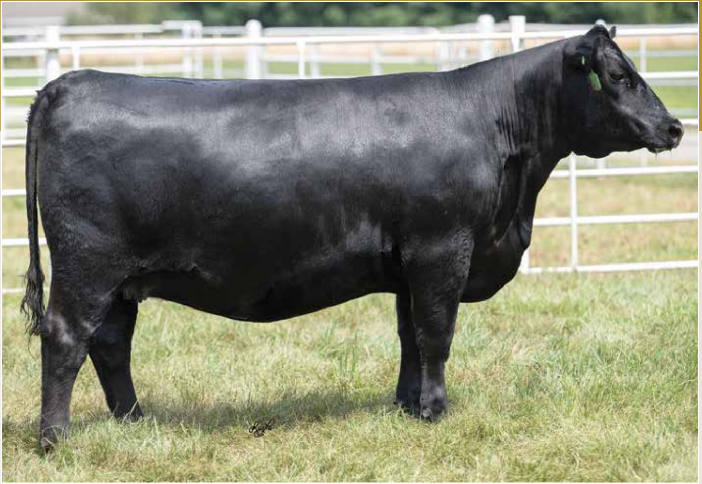
BNWZ Lady 453-2771 / The $400,000 valued and top-selling half interest selection of Spruce Mountain Ranch in the 2024 Nowatzke Cattle Company Sale and donor dam of Lot 13.

A special and exciting highlight from the famous Lady family a set of embryos from the $400,000 valued headliner of the Spruce Mountain Ranch and Nowatzke Cattle Company joint embryo programs, Lady 453-2771 sired by the record-selling multi-trait leader of the FB Genetics, Prime of Iowa Angus and Edgewood Angus programs, Captain.