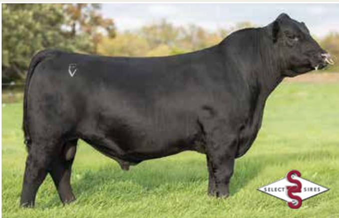
Riverbend Black Label J1810 / Reference Sire C

C Riverbend Black Label J1810 [AMF-CAF-D2F-DDF-M1F-NHF-OHF-OSF-RDF] Birth Date: 07-16-2021 Bull *20372845: #**Baldrige Alternative E125 Poss Easy Impact 0119 *SG Salvation *MGR JP Rita 7037 Baldrige Blackbird A030 19559741 #*Basin Payweight 1682 *MGR Rita 2145 #*G A R Sure Fire #*Connealy In Sure 8524 +E W A 6121 of 3128 Sure Fire +Chair Rock 5050 G A R 8086 18675065 +E W A 3128 of 9067 Weigh Up #*Plattmere Weigh Up K360 *Rita 9067 of Rita 5M13 Obj