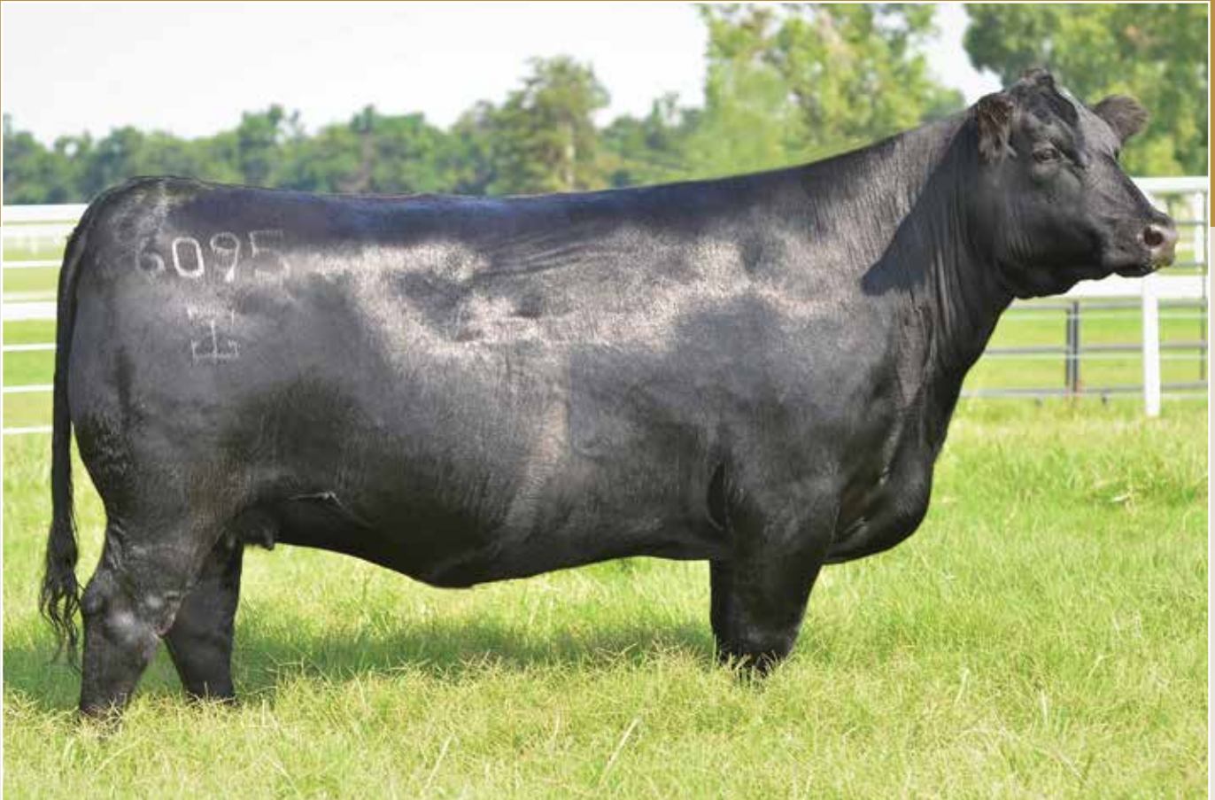
Chair Rock Sure Fire 6095 / The $125,000 herd sire producing legendary dam of Lot 1.

A special and exciting heifer pregnancy to lead-off the spring Spruce Mountain Ranch LiveOnline Frozen Genetics sale, a heifer pregnancy from the legendary herd sire producing Sure Fire 6095 sired by the proven and popular multi-trait Genex roster leader, Draft Pick.