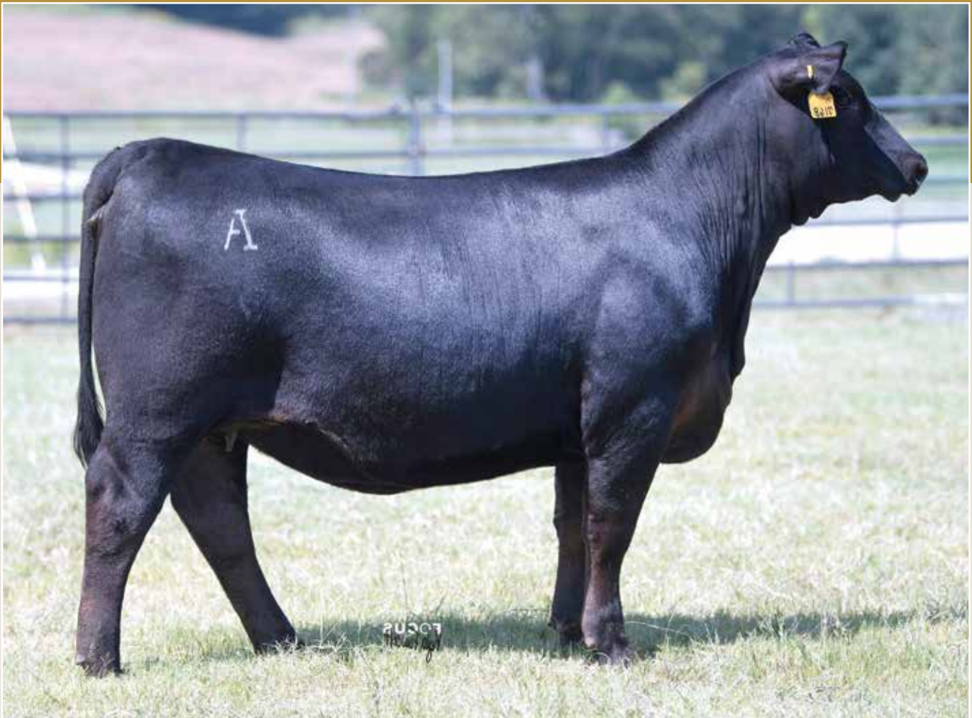
Ingram Lady 1613 / The $125,000 donor dam of Lot 5 and cornerstone Lady in the Spruce Mountain Ranch and Gobbell G3 Farms joint donor programs.

Featuring a set of embryos from the $125,000 headlining Lady in the Spruce Mountain Ranch and Gobbell G3 Farms joint embryo programs, Lady 1613 sired by the multi-trait highlight of the Aberan Angus and Monticello Angus programs, Global.