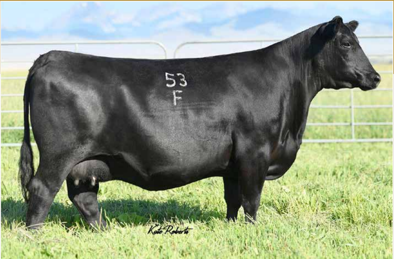
Sitz Barbarmere Nell 53F / The $160,000 herd sire producing headliner of the Spruce Mountain Ranch and Express Ranches joint donor programs and dam of Lot 11.

A special and cutting-edge set of embryos produced by the $160,000 herd sire producing highlight of the Spruce Mountain Ranch program, Barbaramere Nell 53F sired by the exciting outcross sire in the ABS roster, Brazen.