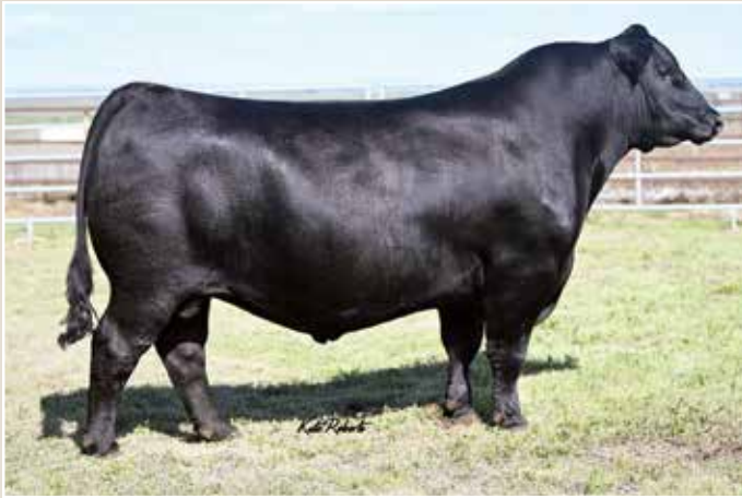
RSA True Balance 1311 / Reference Sire A

A RSA True Balance 1311 [AMF-CAF-D2F-DDF-M1F-NHF-OHF-OSF-RDF] Birth Date: 08-24-2021 Bull *20180432 1311 #**G A R Ashland *G A R Early Bird #*G A R Home Town *Chair Rock Ambush 1018 19266718 **Chair Rock Sure Fire 6095 #*G A R Sure Fire *Chair Rock Progress 3005 #*EXAR Monumental 6056B #3F Epic 4631 *RSA Forever Lady 9204 *FWY 7008 of C085 4029 19786127 *RSA Forever Lady 7232 *Janssen Wyatt Earp 5110 +Rsa Forever Lady 4585 240