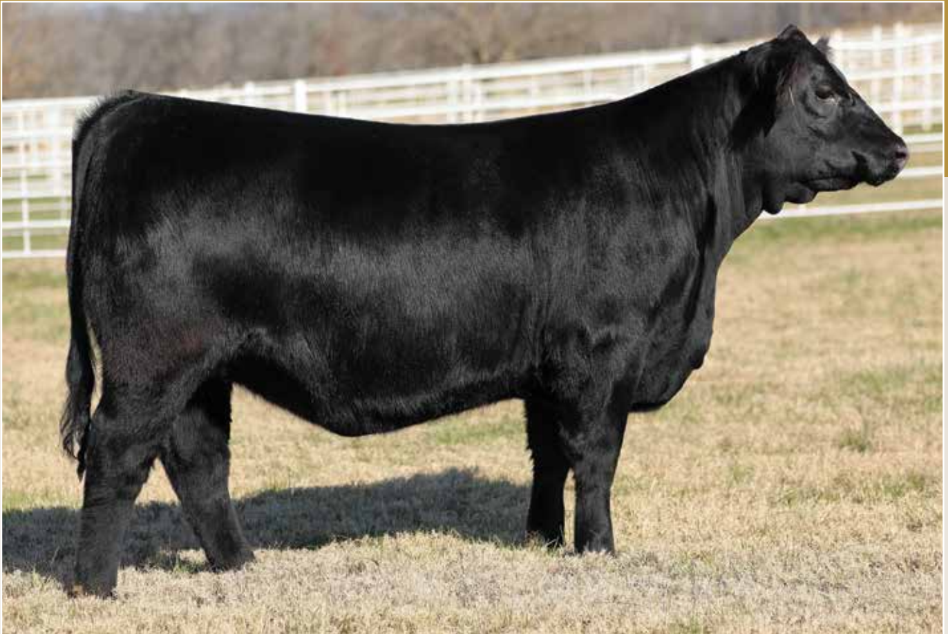
Deer Valley Linda 4753 / The $95,000 full sister to the dam of Lots 6A and 6B selected by JB Farms and Circle F Farms in the record-setting 2026 Bases Loaded Sale.