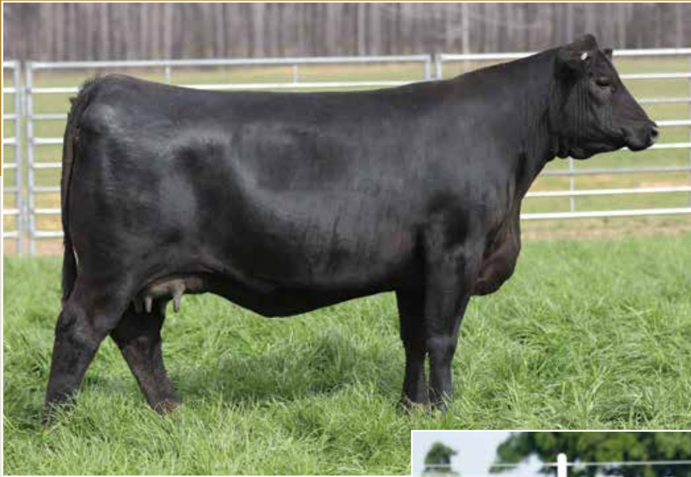
44 Susie 2141 / The $230,000 feature of the Spruce Mountain Ranch and Express Ranches joint embryo programs and donor dam of Lot 15.