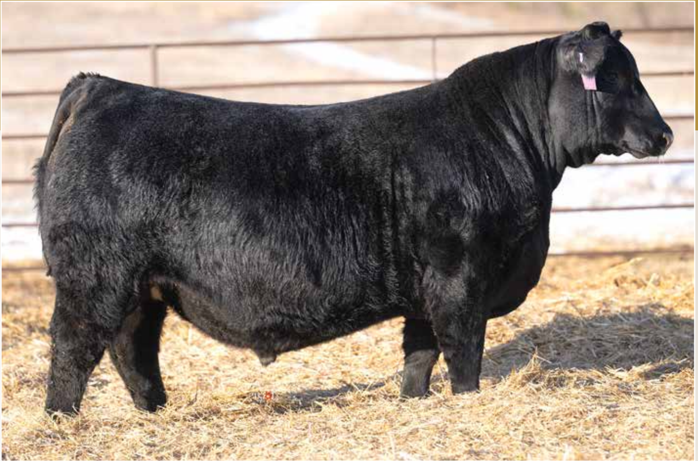
Ellingson Brazen / This exciting member of the ABS roster and sire of the Lot 11 embryos in this offering stems from the same family as the donor dam of Lot 15, Bells Girl 4656.

Featuring a set of embryos from the $22,000 valued half interest selection of Spruce Mountain in the 2025 Ingram Angus Sale, Bells Girl 4656 sired by the proven genomic leader of the Spruce Mountain and ORigen rosters, True Balance.