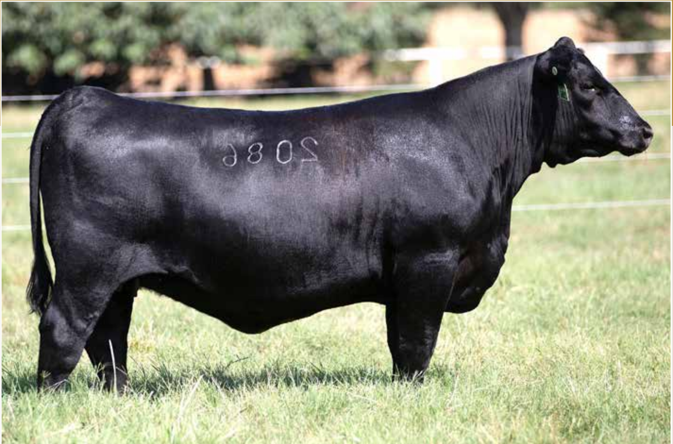
EZAR Fanny 2086 / The $80,000 cornerstone Spruce Mountain Fanny and donor dam of Lots 16A and 16B.