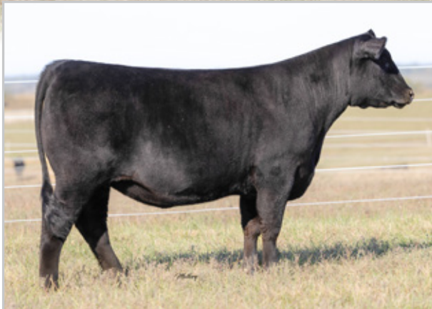
VALLEY VIEW TIANNA 1423 DAM OF LOT 5