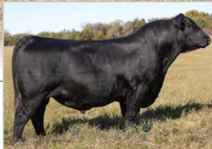
RHOADES SWAROVSKI REFERENCE SIRE