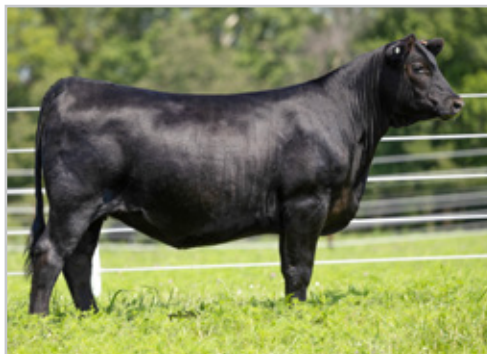
VALLEY VIEW KARAMA 7123 $90,000 MATERNAL SISTER TO DAM OF LOT 2 AT CIRCLE F, GA