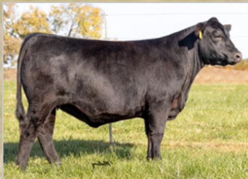
6 MILE HOME TOWN J06 $110,000 GRANDAM OF LOT 1 AT JOCKO VALLEY, MT