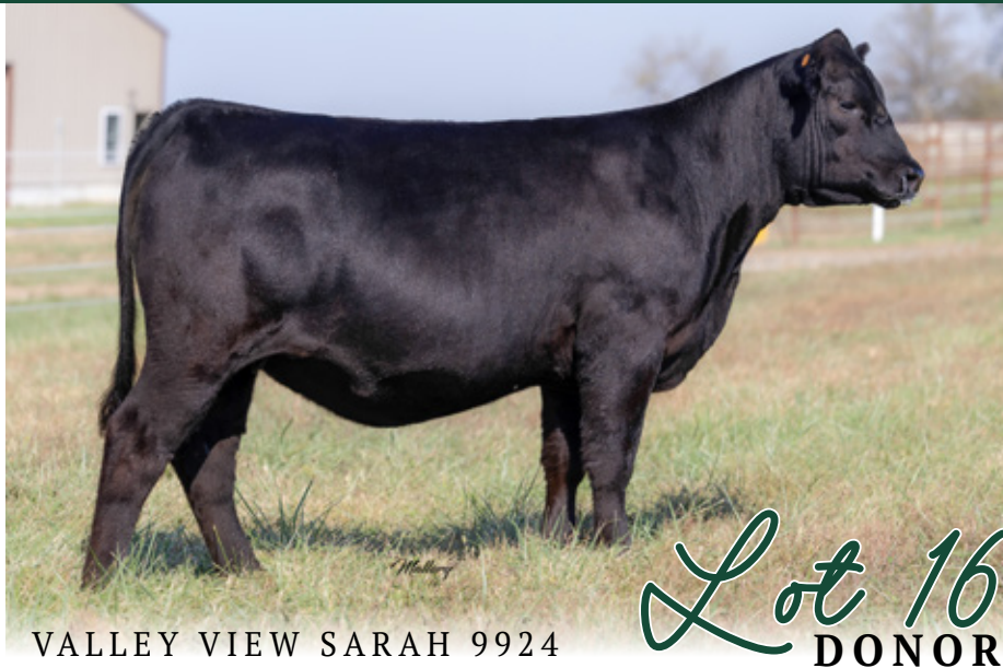
VALLEY VIEW SARAH 9924