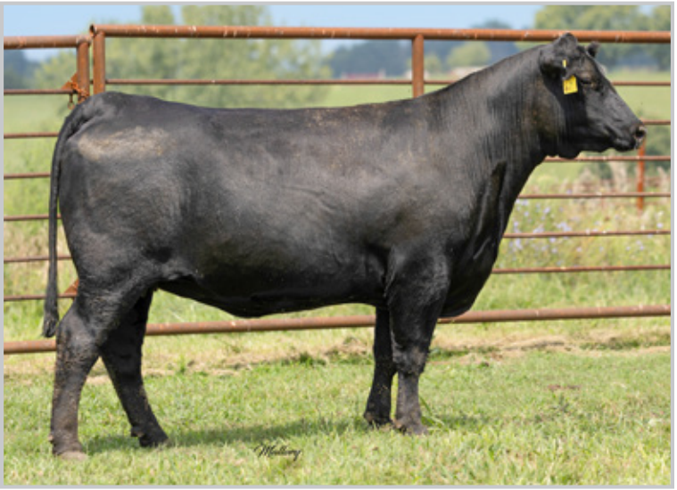
PPA TRANSCENDANT P392 DAM OF LOT 10