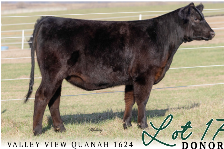
VALLEY VIEW QUANAH 1624