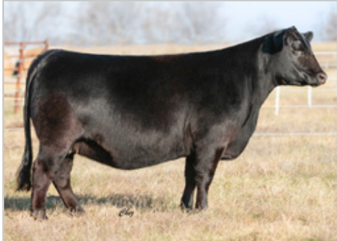
BAR 7 CLARITY A748 1604 DAM OF LOT 6