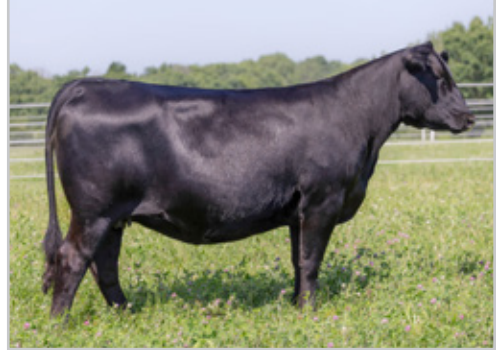
VALLEY VIEW VICTORINE 91123 MATERNAL SISTER TO LOT 6 AND DONOR AT VALLEY VIEW