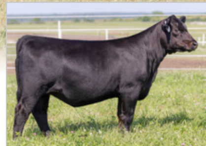
VALLEY VIEW TIANNA 12174 $100,000 FULL SISTER TO DAM OF LOT 13'S AT CIRCLE F, GA