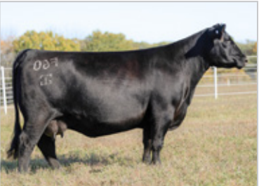
G A R IDENTIFIED F60 GRANDAM OF LOT 5