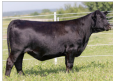
VALLEY VIEW ERIN 4124 $45,000 MATERNAL SISTER OF LOT 7 AT TWO RIVERS CATTLE, GA