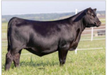
VALLEY VIEW TIANNA 12324 MATERNAL SISTER TO LOT 5