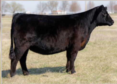
VALLEY VIEW SARAH 6423 DAM OF LOT 1