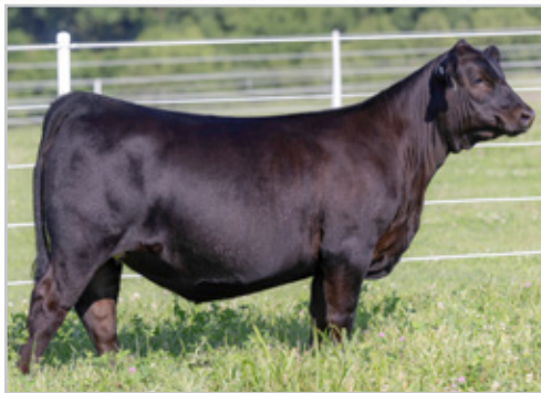
VALLEY VIEW AMANDA 11154 MATERNAL SISTER TO THE DAMS OF LOTS 8 AND 9 AT MAPLE LANE FARMS, IN