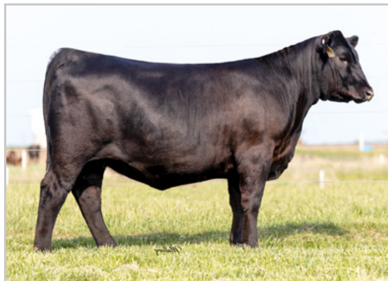
44 ERIN 2727 GRANDAM OF 4124