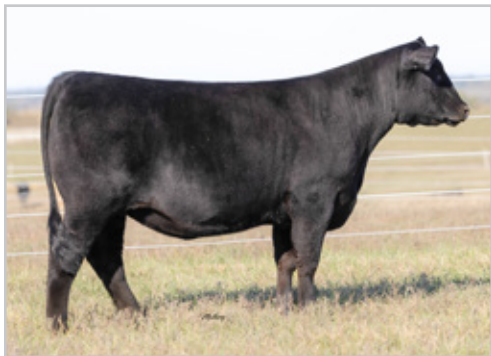
VALLEY VIEW TIANNA 1423 DAM OF LOT 5