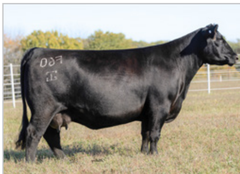
G A R IDENTIFIED F60 GRANDAM OF LOT 5