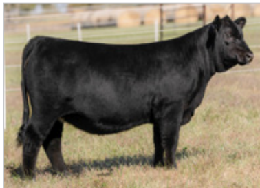
VALLEY VIEW ERIN 4824 MATERNAL SISTER OF LOT 7 AT PETERSON PRIME ANGUS, MO