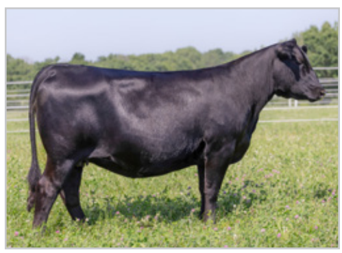
VALLEY VIEW VICTORINE 91123 FULL SISTER TO THE DAM OF LOT 3