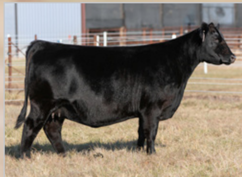
VALLEY VIEW TIANNA 2222 DAM OF LOT 4