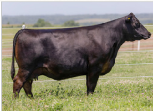
KARAMAS PEYTON 3080 GRANDAM OF LOT 2