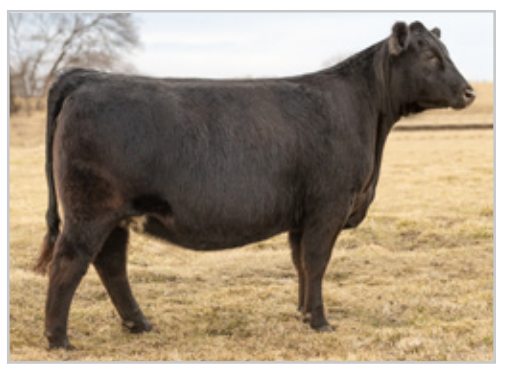
44 EARLY BIRD 1747 GRANDAM OF LOT 8 & 9