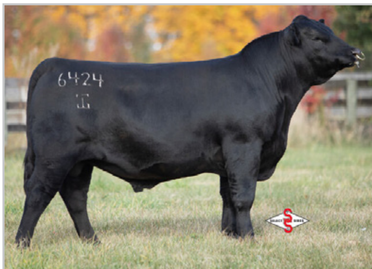
G A R GRAND SLAM REFERENCE SIRE