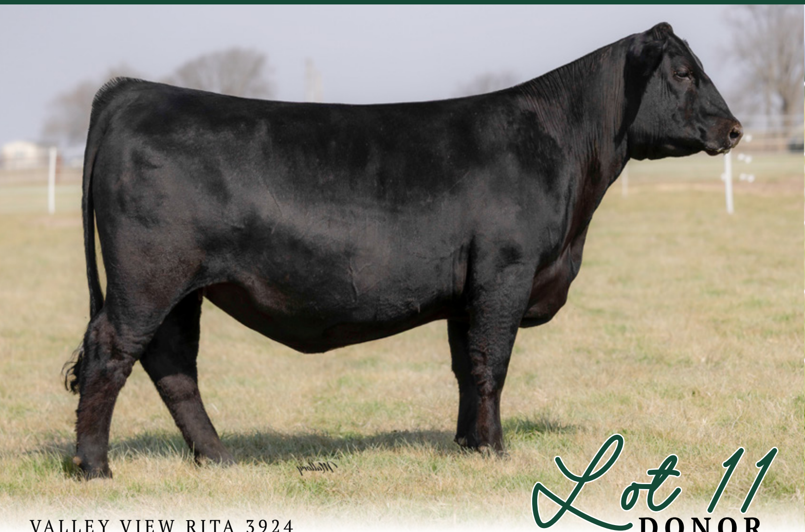
VALLEY VIEW RITA 3924