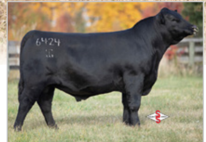
G A R GRAND SLAM REFERENCE SIRE