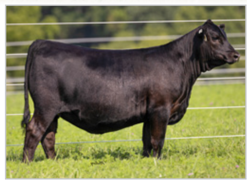
VALLEY VIEW AMANDA 9023 DAM OF LOT 8