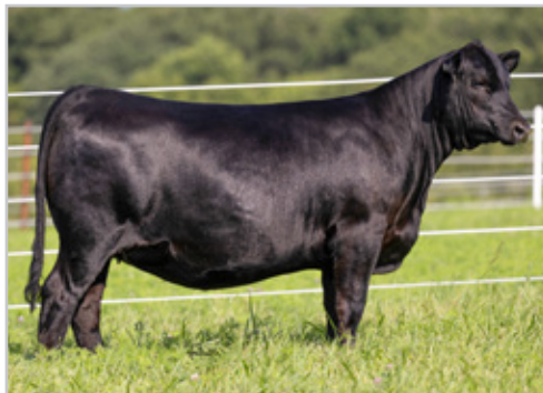
VALLEY VIEW AMANDA 8123 DAM OF LOT 9