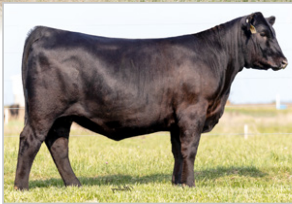
44 ERIN 2727 DAM OF LOT 7