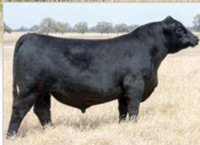
WILKS CRICK 3708 REFERENCE SIRE