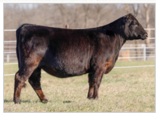
VALLEY VIEW VICTORINE 9623 DAM OF LOT 3