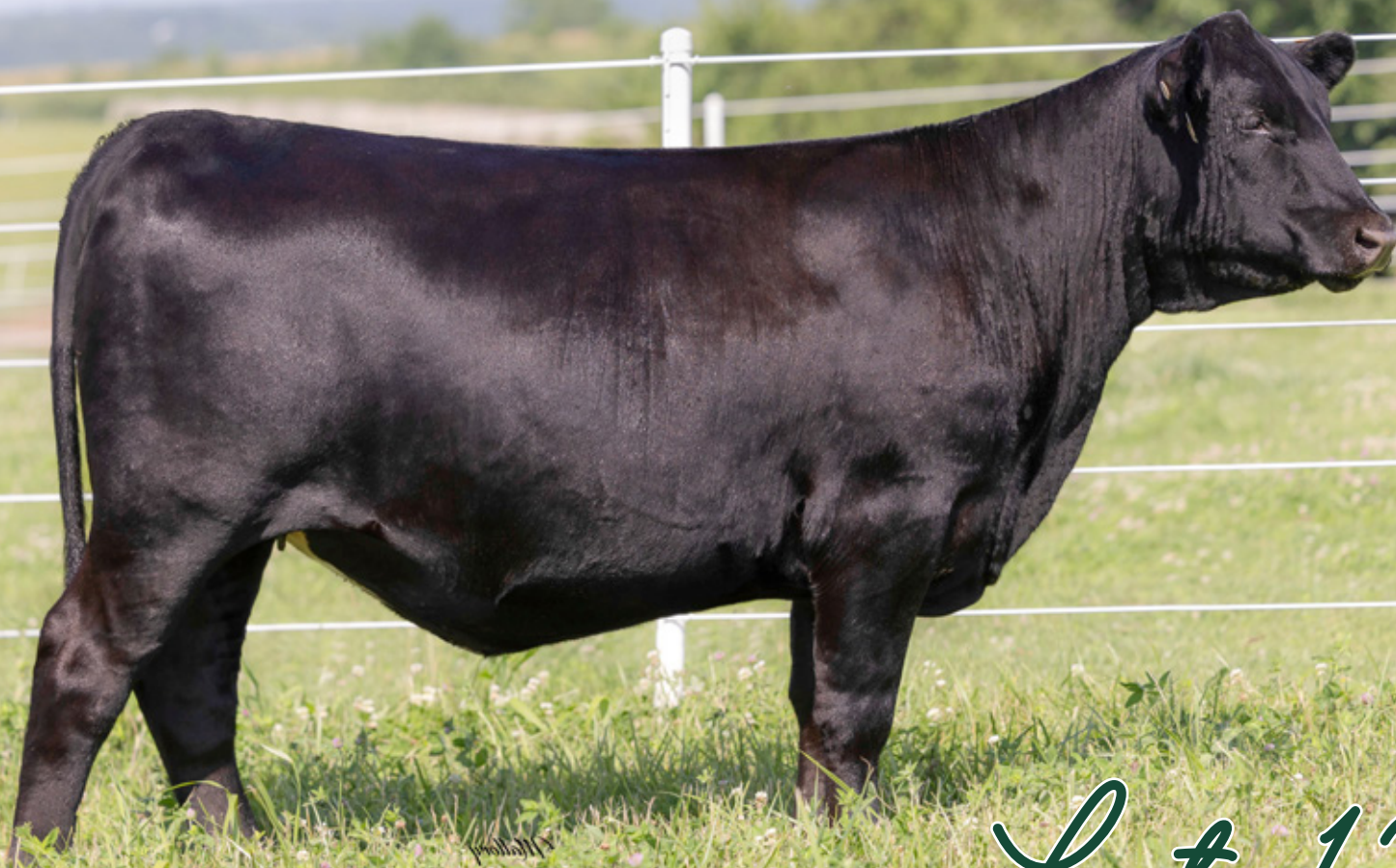
VALLEY VIEW ERIN 4124