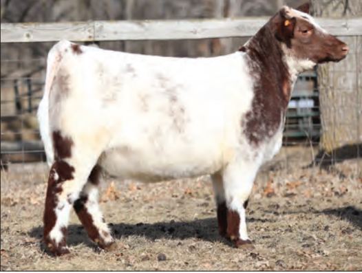
KSS MAXIM EV AV MAX ROSA ACE 2439 – Full Sister to Lot 4 Lot 1 Feature of 2025 Springtime Revival Sold to CM Cattle, Oklahoma

KSS Evolution x Max Rosa daughters are CATALYSTS of CHANGE in progressive herds!