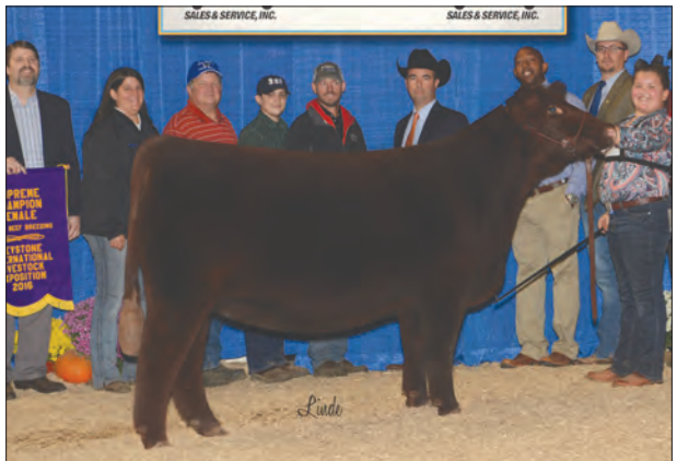
SULL ROSE MARY'S SONG ET – Donor of Lot 39 2016 Keystone International Supreme Champion