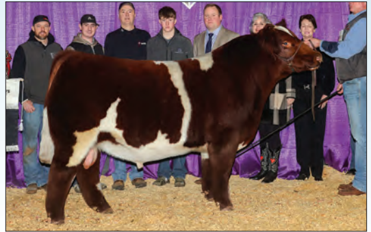
BFS LCCC AFLC DIRECT DEPOSIT 2254 ET