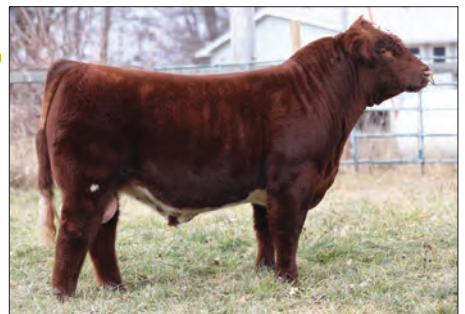
LITTLE CEDAR UNIVERSAL 2226 Sire of Lot 6A