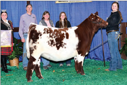
BFS MARGIE FLASH 2104 Daughter of BFS Margie LL 950 by Byland Flash 2023 NJSS Bred & Owned Reserve Grand Champion 2023 NAILE Reserve Division Champion 2024 Cattlemen's Congress E.D.G.E. Show Reserve Grand Champion

BFS Margie LL 950 was the crowd favorite at Louisville and Oklahoma City, and was named Reserve Grand Champion at the 2021 Cattlemen's Congress.