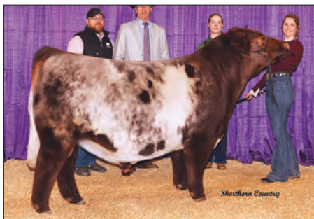
CF IN DEMAND – Sire of Lot 21A 2026 Cattleman's Congress Grand Champion

Sire BW 4.1 WW 68 YW 97 MK 28 $BMI 158.05 $CPI 184.26 Dam BW 6.1 WW 58 YW 91 MK 25 $BMI 113.94 $CPI 108.45