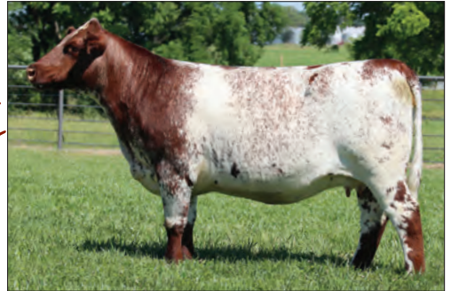
CF CSF DEMI 6100 HC ET Dam of Lots 18A and 18B