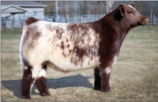
LITTLE CEDAR LOOK AHEAD 2306