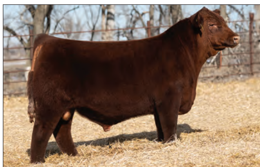
JSF SOLITAIRE 250L