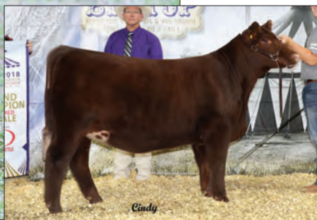
CF V8 MONA LISA REWARD 780 – 2018 NJSS GC Full Sister in blood to Dam of Lot 16

Mona Lisa Reward 3289 ranks among the most influential donors in the Shorthorn breed. She has produced national champions and herd sires that excel across every segment of the industry.