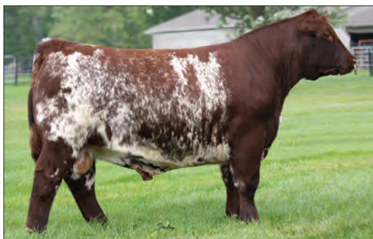
LITTLE CEDAR EQUATOR 2093 – Sire of Lot 17