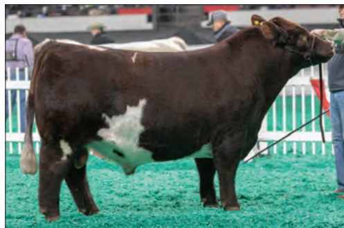
SULL CURRENT COMMODITY 7630E Maternal Brother to Lot 36, sired by Red Knight