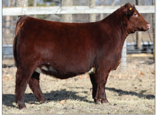
KSS MAX ROSA ACE AV EV 2424 ET – Full Sister to Lot 3 Lot 2A Feature of 2025 Springtime Revival Sold to Sweetgrass Ranches, Alberta