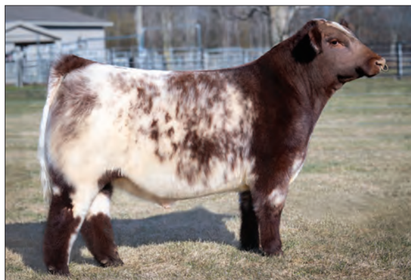
LITTLE CEDAR LOOK AHEAD – Sire of Lot 23