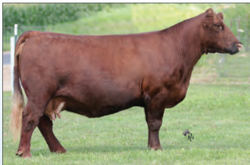
KSS BLDSTONE PRIDE 278 ET Third Dam of Lot 47 and Dam of 2122 (pictured right)

Success Story #2: Read below about the success of Augusta Pride 2122 and her son Trademark featured as a pair in the 2023 Springtime Revival Sale. We're all in this together!