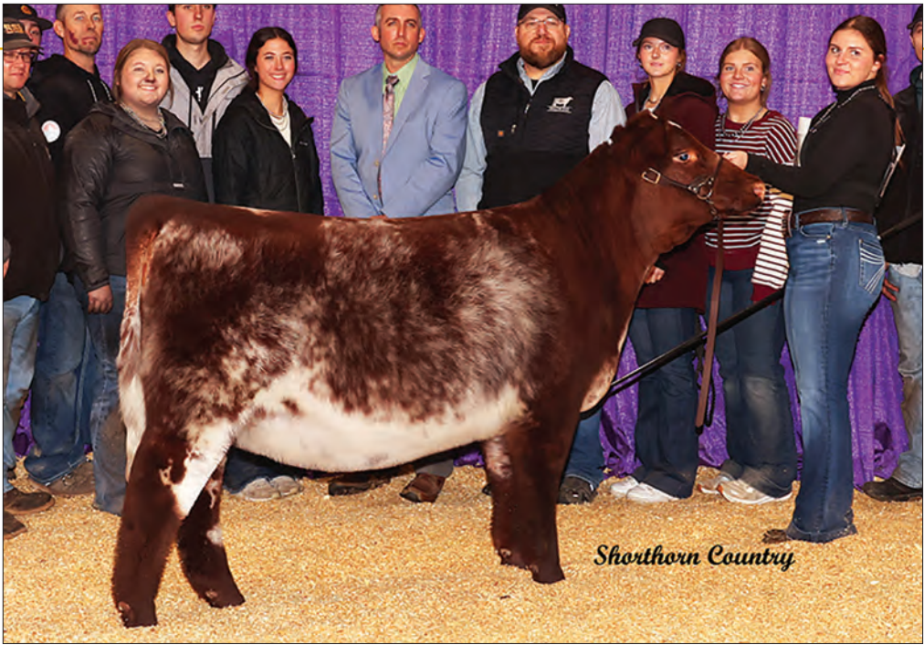
CF HANES Crystal Lucy 582 RK X ET – Full Sister in blood to Lot 19 2026 Cattleman's Congress Junior Show Reserve Grand Champion