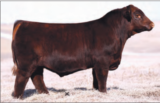
GILMAN'S CLARITY 20N ET