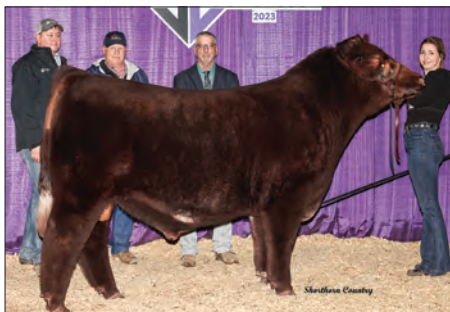
CF PAYWEIGHT X ET – Sire of Lot 32B

• Offered by Bollum Family Shorthorns & Little Cedar Cattle Co.