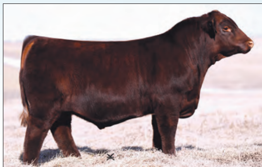
GILMAN'S CLARITY 20N ET