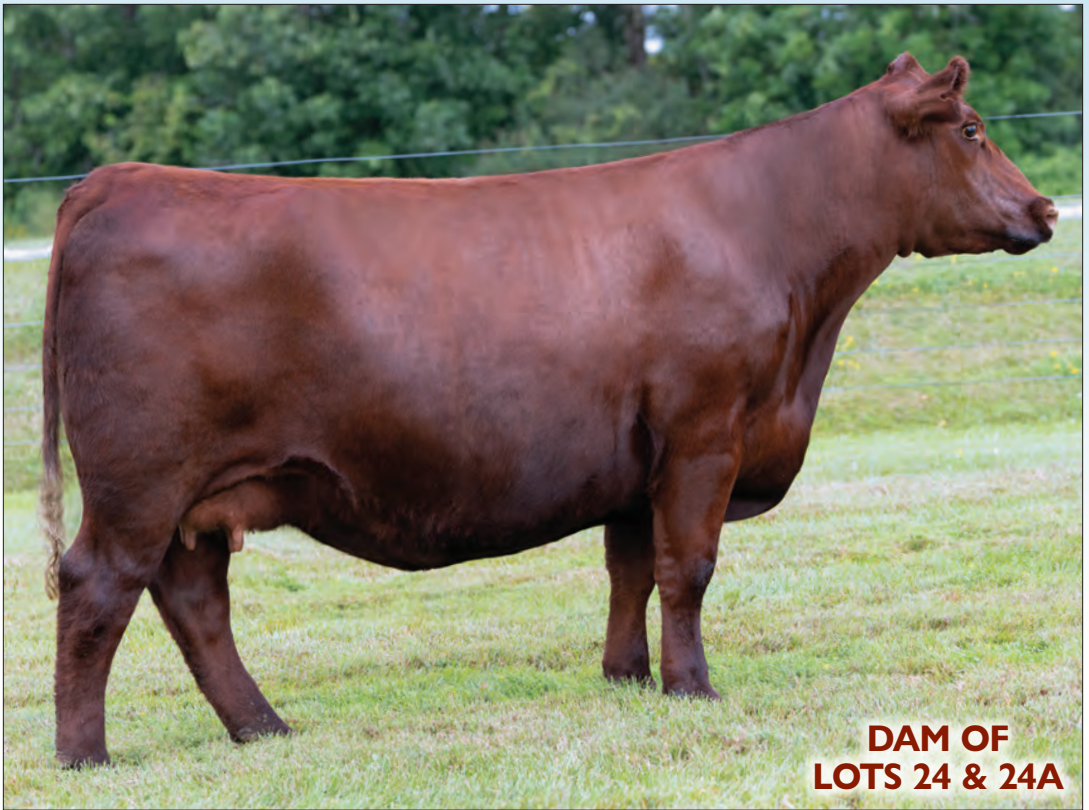
DAM OF LOTS 24 & 24A