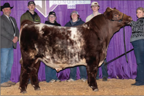
MILLER FARMS FLASH 430 ET 2026 Cattleman's Congress EDGE Show Grand Champion Bull

Design YOUR OWN OFFSPRING of the POWER COW that produced the 2026 EDGE Show Champions