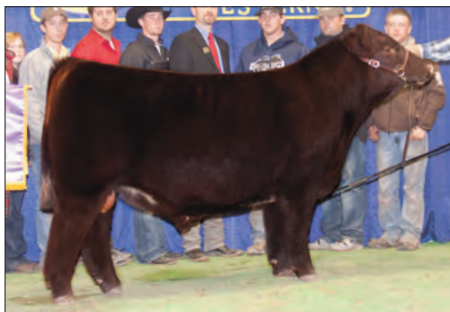
SULL RED KNIGHT 2030 ET – Sire of Lot 32A

• Offered by Bollum Family Shorthorns & Little Cedar Cattle Co.