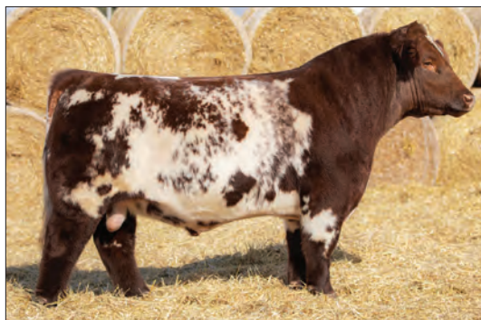
BYLAND FLASH (HEIFER SEMEN)

He is homozygous polled and an elite calving ease sire with power, lower quarter and outstanding maternal performance. He ranks in the Top 1% of the breed for $CPI – 217.71.