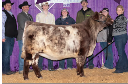
MILLER FARMS LASSIE 427 ET 2026 Cattleman's Congress EDGE Show Reserve Grand Champion Female