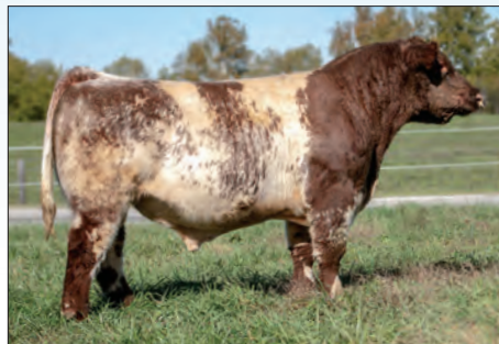
FSF PERFECTION 812 Sire of Lot 51

Some said to breed her to IGWT, but I couldn't get the VISION of Look Ahead x Perfection out of my head. Go with what you KNOW!