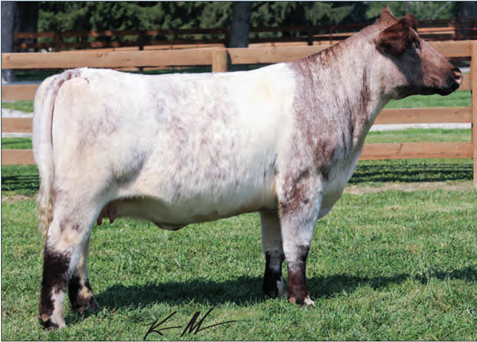
D&D MARGIE'S BEAUTY 610S – Maternal Granddam of Lot 31 Foundation of several branches of the Margie Family