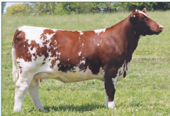
KSS FIREBALL AUGUSTA PRIDE 2122 ET Daughter of KSS Bldstone Pride 278 2023 NJSS Division X Cow/Calf Champion Dam of CSF KSS Trademark 1872

* KSS Fireball Augusta Pride 2122 was purchased by Cornerstone Farms in the 2023 Springtime Revival with her bull calf, CSF KSS Trademark, at side. You'll now find Augusta Pride 2122 in the donor pen at Cornerstone. See Trademark featured on page 48 and on Cattle Visions!