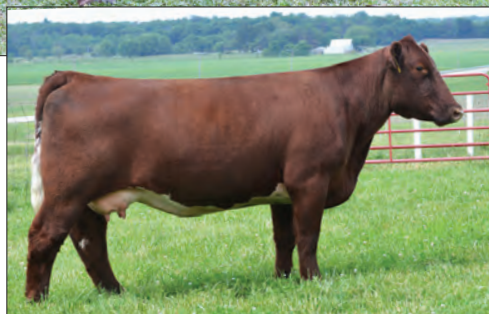
SULL MONA LISA REWARD ET Maternal Granddam of Lot 16

Mona Lisa Reward 3289 ranks among the most influential donors in the Shorthorn breed. She has produced national champions and herd sires that excel across every segment of the industry.