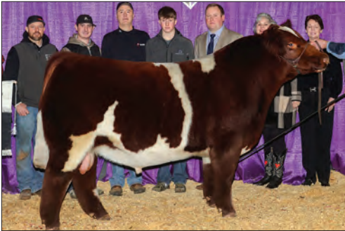
BFS LCCC AFLC DIRECT DEPOSIT 2254 ET 2023-24 ASA Show Bull of the Year Service Sire of Lot 49

Lillian 1930 was a highly ranked producer in the KSS Keystone program and their standards are high! (You'll read in a couple of KSS footnotes that they have females that are producing at age 12 and 13.) Lillian 1930 has the look and power to remain relevant thru today's fast-paced trends, especially when mated to a sire like Direct Deposit.