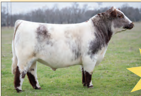
LITTLE CEDAR CURRENCY 2146

Owned by Bollum Family Shorthorns, Little Cedar Cattle Co. and Armstrong Farms