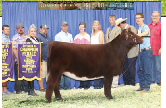
SULL CRYSTAL'S SWAN – Donor Dam of Lot 20 2015 NJSS 4th Overall Champion Heifer

CF IN DEMAND – Sire of Lot 20 2026 Cattleman's Congress Grand Champion 2025 NAILE Grand Champion