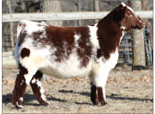
KSS MAX ROSA ACE AV EV 2448 ET – Full Sister to Lot 3 Lot 2C Feature of 2025 Springtime Revival Sold to DeLisle Farms, Michigan Exhibited by Rosalie Beechy, Michigan