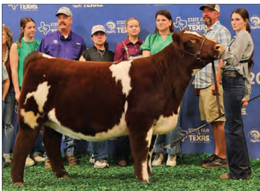
TMF CHARISMA QUEEN PERFECTION ET Full Sister to Lot 43A Embryos by Perfection