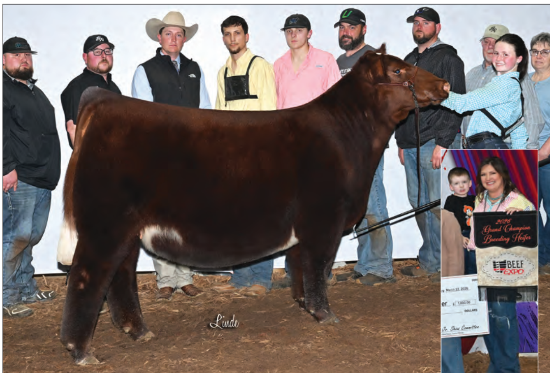
SULL GWH MAX ROSA 5733N ET – Lot 7 Maternal Sister by Dream Weaver 2026 Ohio Beef Expo Grand Champion Breeding Heifer Overall Breeds