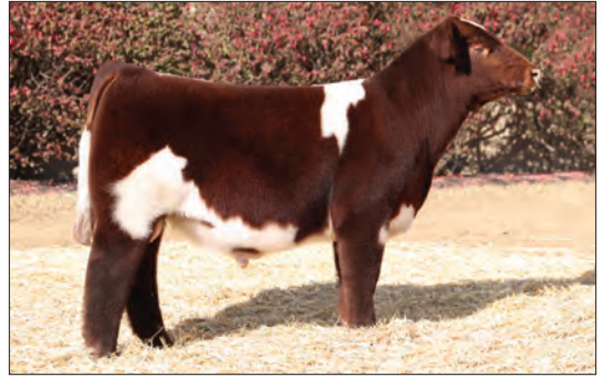
MFS DREAM WEAVER 37K

★ Little Cedar Marvelous Margie 2220 is available June 1, 2026. Little Cedar Cattle Company will create four embryos with semen from the buyer's choice of leading sires: Look Ahead, Direct Deposit, Clarity or Dream Weaver. Semen and ET services are provided by the seller.