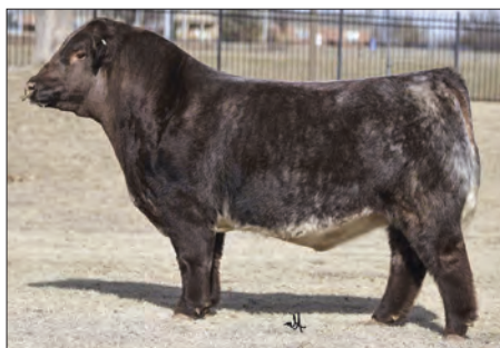
SS INFERNO Service Sire of Lot 16