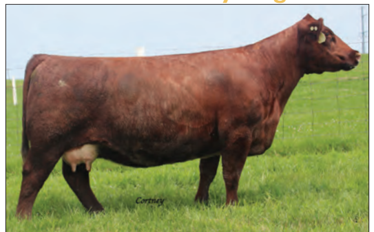
SULL CRYSTAL'S LADY 6265D Dam of Crystal's Lady 2379 and CF Payweight