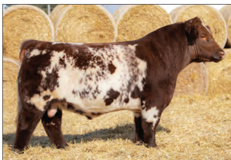
BYLAND FLASH 9U106 – Sire of Lot 32C

• Offered by Bollum Family Shorthorns & Little Cedar Cattle Co.