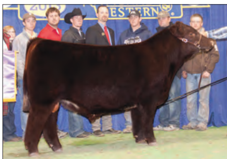
SULL RED KNIGHT Sire of Lot 21B

Sire BW 1.8 WW 62 YW 92 MK 13 $BMI 126.6 $CPI 139.3 Dam BW 6.1 WW 58 YW 91 MK 25 $BMI 113.94 $CPI 108.45