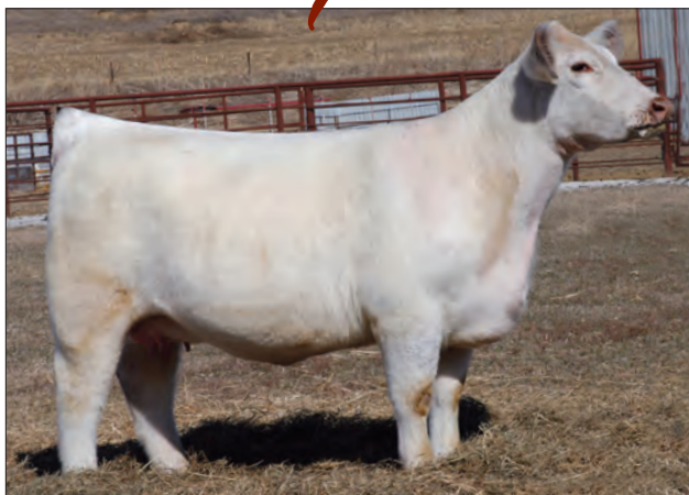
SHERWOOD LADY CRYSTAL

The original “434P” and Matriarch of the Lady Crystal cow family