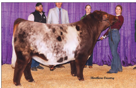
CF IN DEMAND