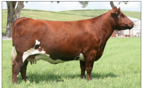
CF MYRTLE BO 46 TP X Matriarch of Sullivan Farms Myrtle Bo Line