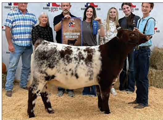
TMF DEPOSIT QUEEN ACE ET Full Sister to Lot 43B Direct Deposit Embryos Harris County British Champion Grand Champion British Heifer of Houston Stock Show Scramble Progressive Show