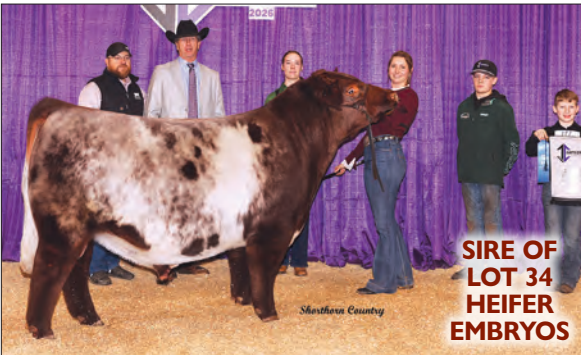
CF IN DEMAND 2025 NAILE Grand Champion 2026 Cattlemen's Congress Grand Champion 4 Heifer Embryos – In Demand x Margie RAD 423 Lot 9B feature of 2025 Revival Sale – $4,000 Purchased by Cates Farms