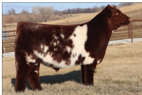
SULL RGLC THE GOAT 420M ET Sire of TWO Lot 7 Heifer Embryos