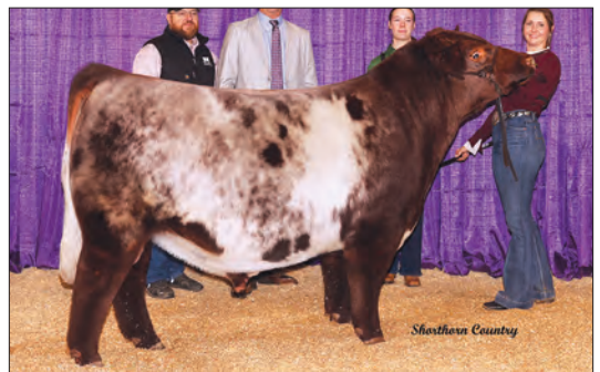
CF IN DEMAND – Sire of Lot 29 2026 Cattlemen's Congress Grand Champion

Marvelous' daughters are now in production at Little Cedar Cattle Co. and are having in tremendous success. Flip to pages 38 & 39 to see 2220 and her sons Gun Smoke and Trail Boss.