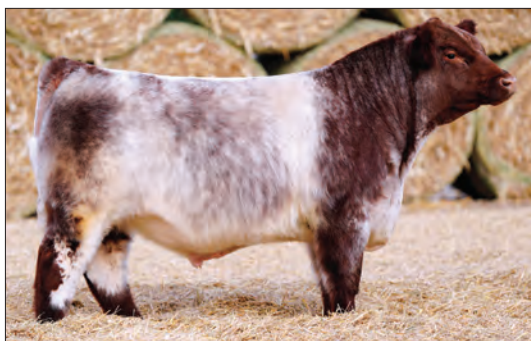
GILMAN'S MAGNUM 44N ET

Gilman's Magnum 44N (*x4392098) Owned by Miller Farms Shorthorns, Cloverleaf Farms & Gilman Shorthorns