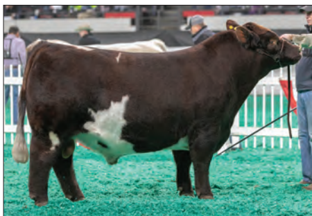
SULL CURRENT COMMODITY – Sire of Lot 32D

• Offered by Bollum Family Shorthorns & Little Cedar Cattle Co.