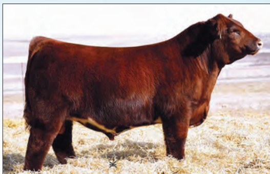
GILMAN'S ALL IN 6K