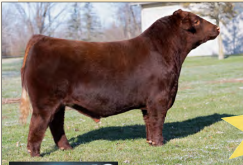
LITTLE CEDAR LASTING LOOK 2418

Owned by Little Cedar Cattle Co. and McKenzie Ranch