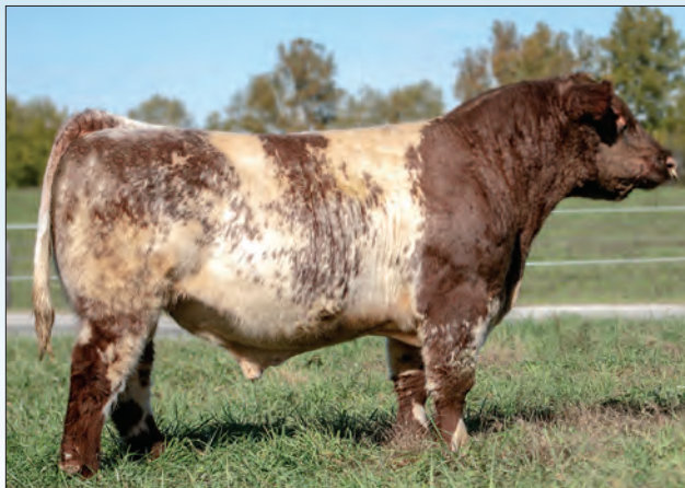
FSF PERFECTION 812 – Sire of NWCC Living Legend