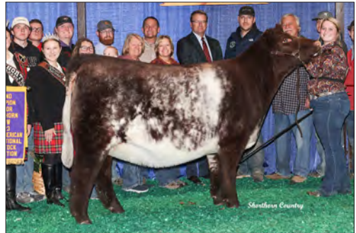
CF CRYSTAL LUCY 230 RK 2023 NAILE Grand Champion Full Sister in blood to Lot 19