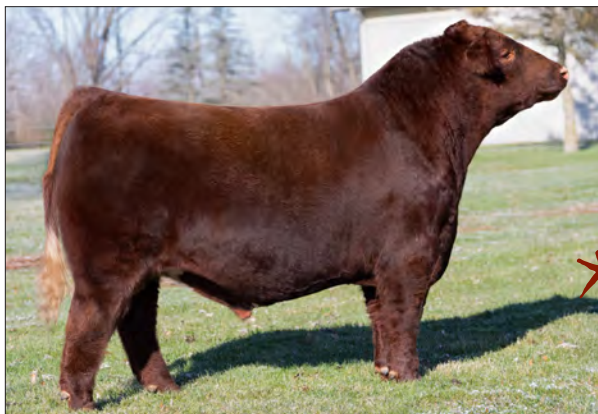
LITTLE CEDAR LASTING LOOK – Full brother to Lot 24

We are proud to offer the full brother to LASTING LOOK as this year's HEADLINER HERD SIRE PROSPECT!