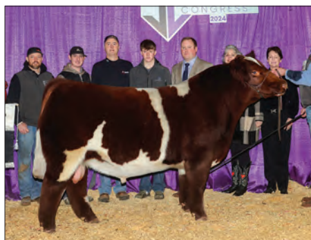
BFS LCCC AFLC DIRECT DEPOSIT 2254 ET 2023-24 ASA Show Bull of the Year Sire of Lot 48A