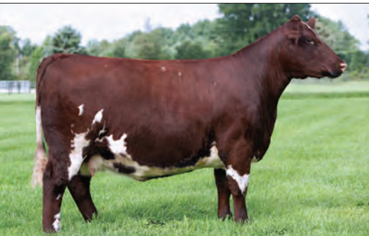
LITTLE CEDAR MARGIE 611 AV 1914 ET Maternal Sister to Lot 27 sired by Aviator

The Revival Sale is known for offering breed-changing genetics and the female resulting from Lot 27 will do exactly that. Margie 611 isn't getting any younger, so grab this heifer pregnancy and start your own line of this predominant cow family.