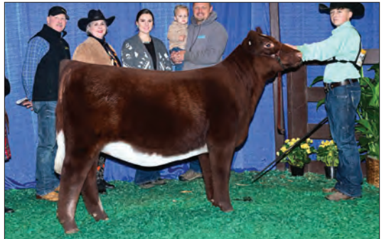
GCC KNIGHTED MARGIE 241 ET 2024 Revival Louisville Elite Top-Seller for $33,500 to LCCC