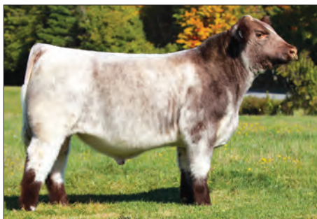
MILLBROOK TRIBUTE Sire of Lot 16

Mona Lisa 243 has always been a heifer we believed in with every expectation of keeping her as a future donor in our own program. For our first consignment to The Revival, we committed to offer only our best and this heifer is the kind that checks every box — pedigree, phenotype, and production potential. She has all the makings of a cornerstone donor with the ability to build a breeding program.