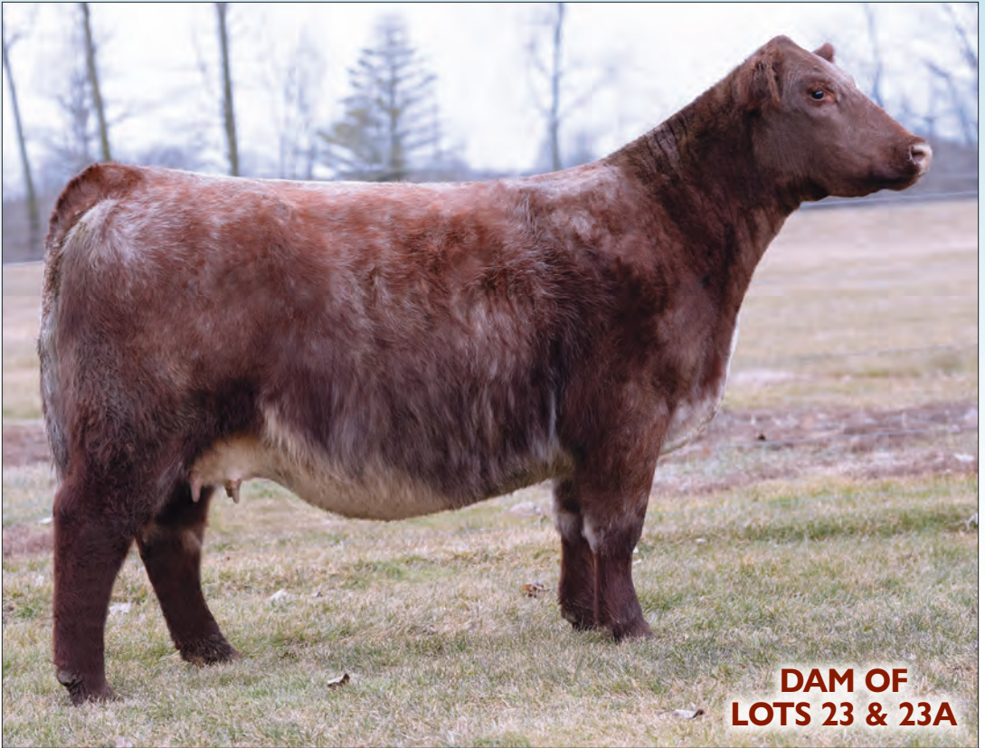
DAM OF LOTS 23 & 23A