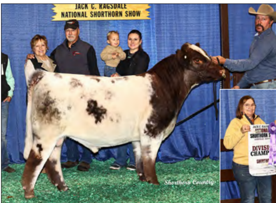
GCC FIRST WATCH 596 ET 2025 NAILE Junior Bull Calf Champion Full Brother to Donor of Lot 30, Little Cedar Marvelous Margie 2220

• Offered by WS Show Cattle and Little Cedar Cattle Company