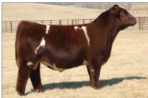
SULL DREAM MAKER 9141G ET Sire of ONE Lot 7 Heifer Embryo

SULL Max Rosa 310 is truly one of the dominant donors of the breed! A national champion herself, she has produced national champions: CYT Max Rosa 9111 and SULL Special Rosa 1151J. Plus, the recent 2026 Ohio Beef Expo GRAND CHAMPION OVERALL!