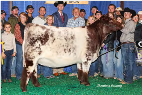
CF CRYSTAL LUCY 384 RK 2024 NAILE Grand Champion Full Sister in blood to Lot 19