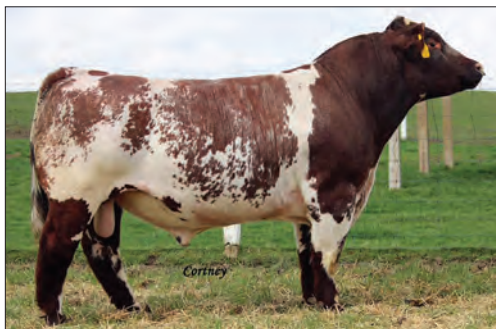
CSF EVOLUTION HC Sire of Lot 36 Heifer Pregnancy

Desert Rose is one of the most storied cow families in the Shorthorn breed. CF Solution, SULL Right Direction, SULL Rose Mary 636, HD Ruby and SULL Sara Rose are offspring of the great Desert Rose 004. Current Commodity is the son of Desert Rose 0004 CL, her genetic clone. Desert Rose's extensive list of descendants have impacted the breed in so many ways! Lot 36 is a rare opportunity to acquire a new generation Evolution x Desert Rose daughter that will give new meaning to the word IMPACT!