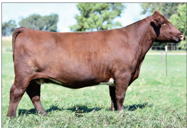
SULL MYRTLE BO 9154 – Maternal Granddam of Lot 25

She also exhibits incredible swoop and dimension in her rib cage, tying that depth into a skeleton built with all the right angles and flexibility.