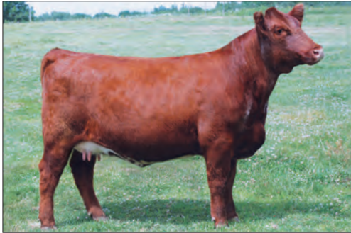
BFS LILLIAN REWARD 518 ET Dam of Lot 49 and 4th Dam of Lot 50