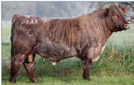
RONELLE PARK SLURPIE