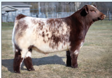
LITTLE CEDAR LOOK AHEAD Service Sire of Lot 51 (Heifer Semen)