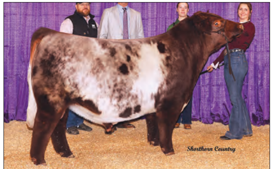
CF IN DEMAND – Sire of Lot 27 2026 Cattlemen's Congress Grand Champion