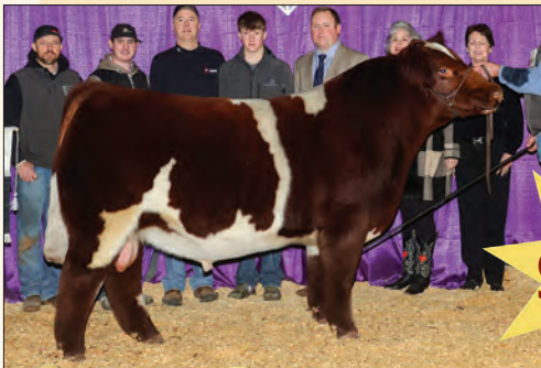
BFS LCCC AFLC DIRECT DEPOSIT 2254 ET

Owned by Little Cedar Cattle Co. and DeLisle Farms (US), Lasting Look Group (Canada)