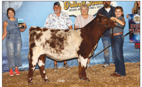
BFS MARGIE'S FLASH BF 4111 ET Daughter of BFS Margie LL 950 by Byland Flash 2025 NJSS E.D.G.E. Show Division II Reserve Champion