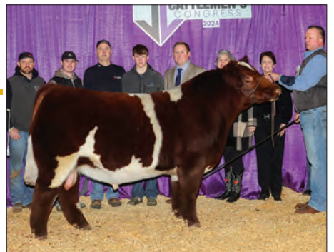
BFS LCCC AFLC DIRECT DEPOSIT 2254 ET 2023-24 ASA Show Bull of the Year Sire of Lot 35A

{ HILL HAVEN FIRE STORM 28C BFS MARGIE RAD 423 ET