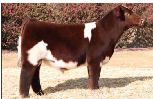
MFS DREAM WEAVER 37K – Sire of Lots 41 and 42