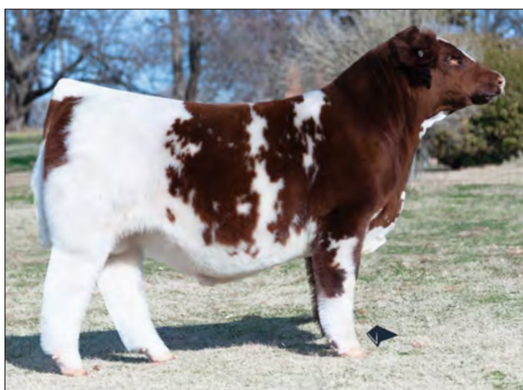
CSF KSS TRADEMARK 1872 – Sire of Lot 44

Fancy Fool 2514 is long-fronted and blends seamlessly from her smooth shoulder into her feminine neck which gives her that "look at me" presence from the profile.