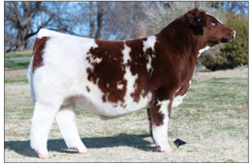
CSF KSS TRADEMARK 1872 Sire of Lot 50