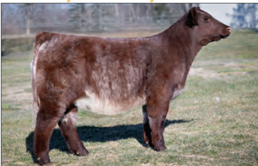
LITTLE CEDAR CRYSTAL'S LADY 2379 Featured as Lot 1 of 2024 Springtime Revival