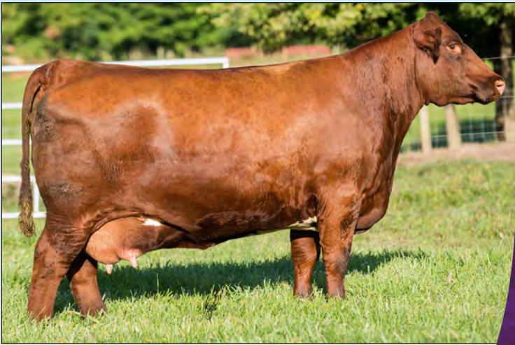
WAUKARU LASSIE 2024 – Dam of Waukaru Lassie 1075 & Granddam of Lot 15

Access the GAME CHANGING GENETICS of Waukaru Lassie 1075