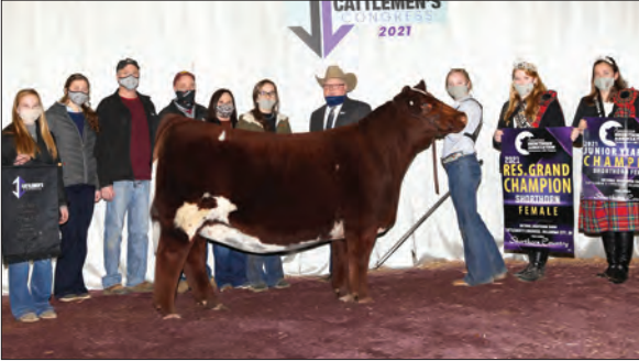
BFS MARGIE LL 950 – Full Sister to Margie 401 Daughter of Margie RAD by Long Look Lot 1 feature of 2020 Revival Sale – $20,000 half interest Purchased by Little Cedar Cattle Company

Study the lesson of the SERIOUS BREEDERS who have SEIZED the DAUGHTERS of