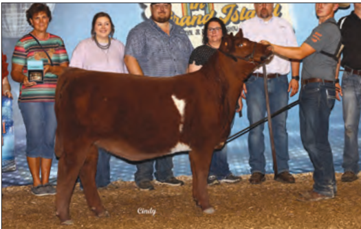
BFS MARGIE PAY PW 499 ET Daughter of BFS Margie LL 950 by CF Payweight 2025 NJSS E.D.G.E. Show Division II Champion

This former show heifer is an even more impressive cow. She is the mother of Direct Deposit, 2024 Cattlemen's Congress Grand Champion. Her first daughter, sired by Flash, was Reserve Grand Champion Bred & Owned Heifer at the 2023 NJSS, followed by Reserve Grand Champion of the 2024 EDGE Show at OKC. Her two daughters by Payweight and Flash, pictured below, impressively swept Division II of the 2025 NJSS EDGE Show!