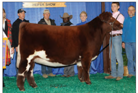
SULL BLOODED RUBY 3278 ET Dam of Lots 37A and 37B