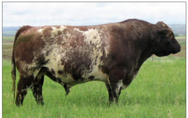
SASKVALLEY BONANZA 219M – Sire of Lot 24A