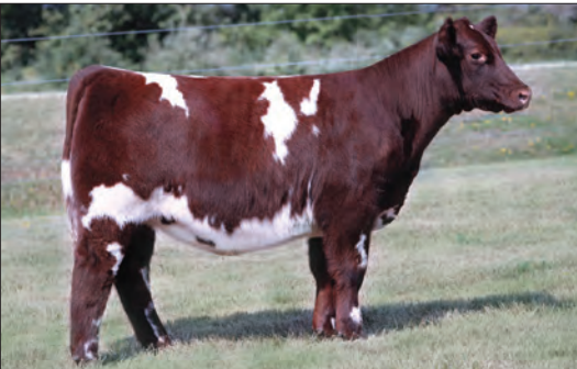
LITTLE CEDAR MARGIE 542 2533 ET 2025 Revival Sale Top-Seller for $43,000 to Haylo Farms

The Lot 28 mating of Margie 542 to CF In Demand (whose granddam SULL Dream Only 7188 shares the pasture with 542) will propel your program into the future! Note that 542 is the full sister to Marvelous Margie, featured donor of Lot 29 in yet another exciting mating to In Demand.