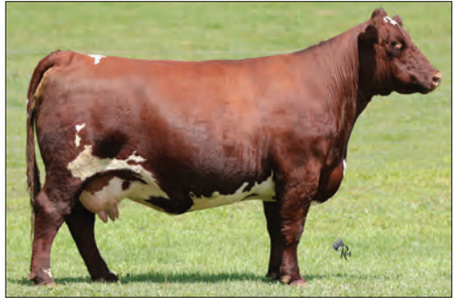
KSS GOLDEN HOT LILLIAN 1918 Maternal Granddam of Lot 50