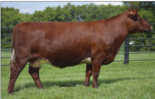
SULL BETTY BO 8203F ET Dam of Lot 26

Myrtle Bo 533 will be a GOOD HIRE for a progressive herd with BIG GOALS!