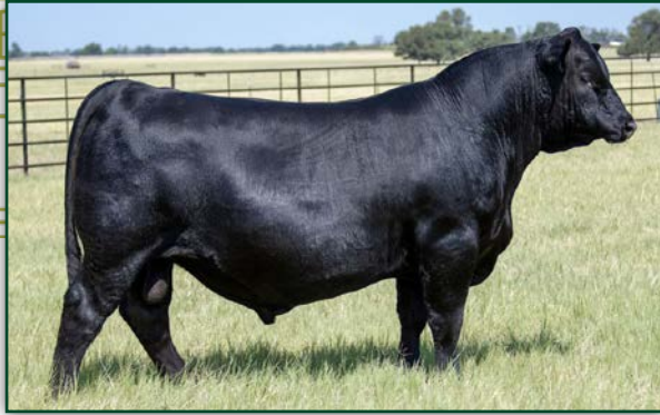
WILKS ACHIEVER 4803 +*21030520