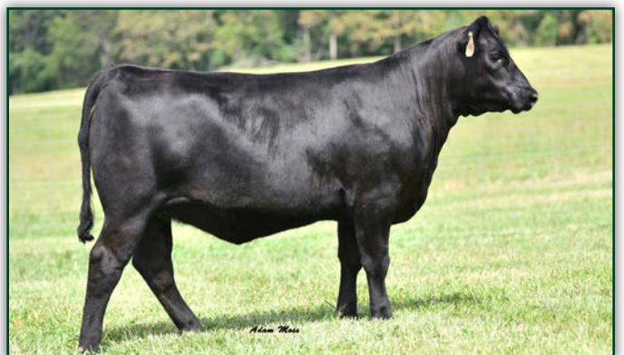
BILTMORE LUCY M418 - The $230,000 Cox Ranch Selection from our 2025 Sale and Full Sister to Lucy M406.

Sired by the $800,000 JB Seminole, who predicts to be a management trait improver, with high maternal index and exceptional carcass value.