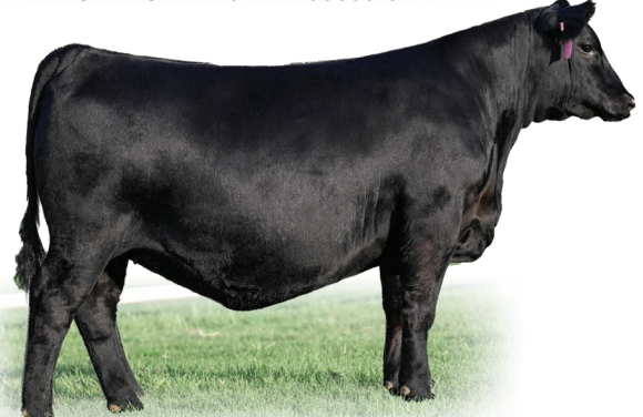
COX RITA 4585 +*21079553