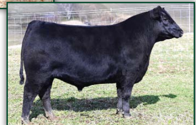
JB SEMINOLE 13