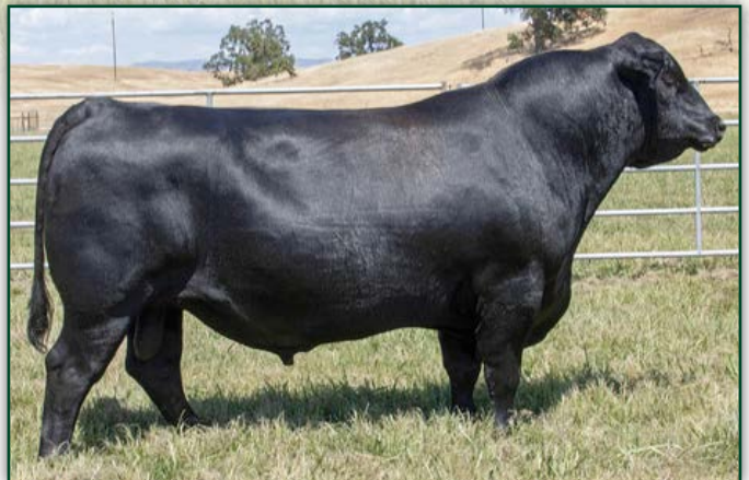
FF RITO HUSTLER