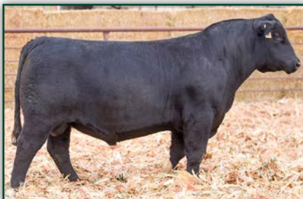
4 SONS BREAKAWAY

Breakaway embryos out of the full sister to Ruby M415! She is the #6 Ranked Marbling and #4 Ranked $C non-parent daughter of Hart Network. Breakaway complements her CED and BW and they complement each other on nearly every trait. We are excited about the future of 254M in our program and this set of embryos should produce a calf that will move the needle.