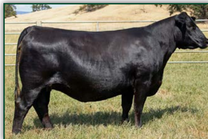
RMRK RITA 0237

Sired by Wilks Warrior, who is a full brother to Wilks Crick and Wilks Promise Keeper. Early reports suggest his calves are super stout and attractive with exceptional growth, maternal, and carcass figures.