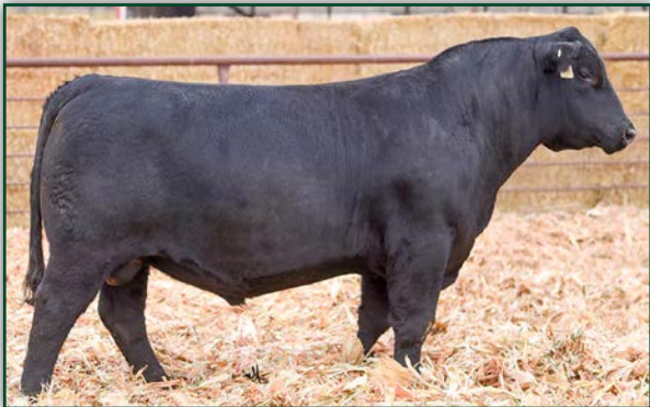
4 SONS BREAKAWAY +*20569806