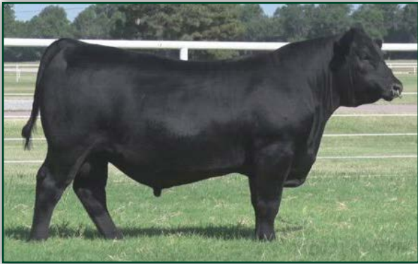
EXAR ANTICIPATION 4836B +*21053047