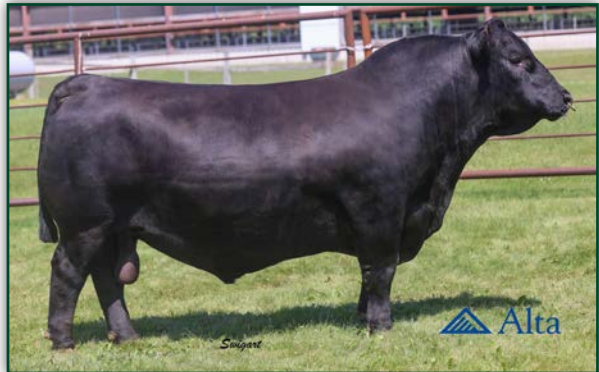
SYMMETRY 228 +* 20294177