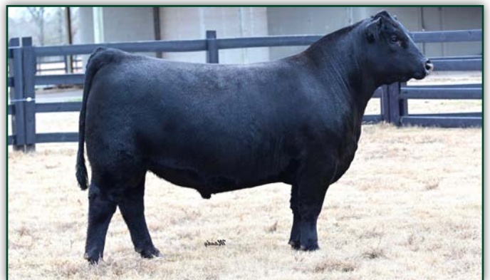
BILTMORE KINGDOM M412 - Full Brother to Lucy M418 and Lucy M406 owned by Edisto Pines.