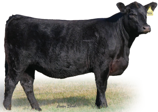
BILTMORE LUCY M406 +*21113629