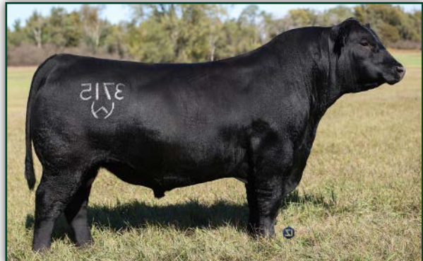
WILKS WARRIOR 3175 +*20753062