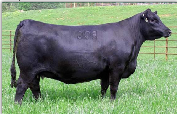
BYRD SUPERMAMA FB 6276-2548 - The $300,000 Valued Full Sister to SuperMama FB 6276-2554 owned by Katie Colin Farm.

Sired by Wilks Achiever, the $165,000 son of Hustler and DBA Rita 1034.