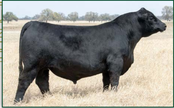
WILKS CRICK 3708 +* 20753043