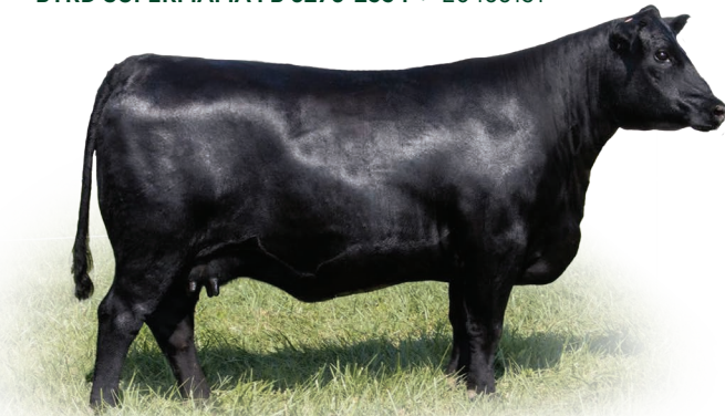
4 SONS BLACKBIRD 5L8 +*20737442