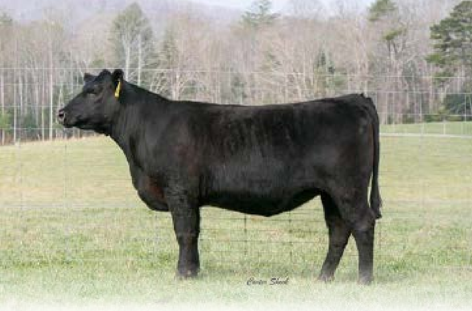
BILTMORE RUBY M415