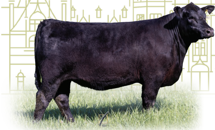
BILTMORE LUCY 148J +*20267370