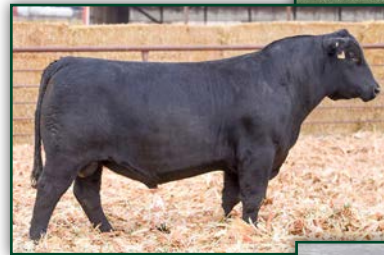
4 SONS BREAKAWAY