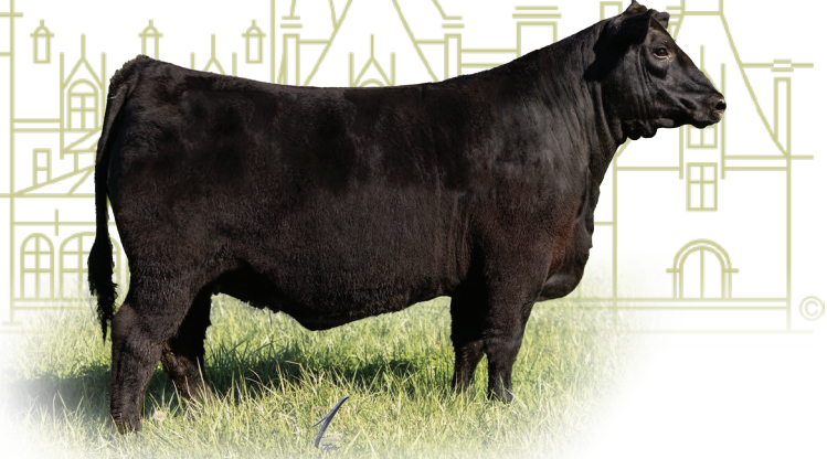
E&B LADY WILDCAT 254 *20402804