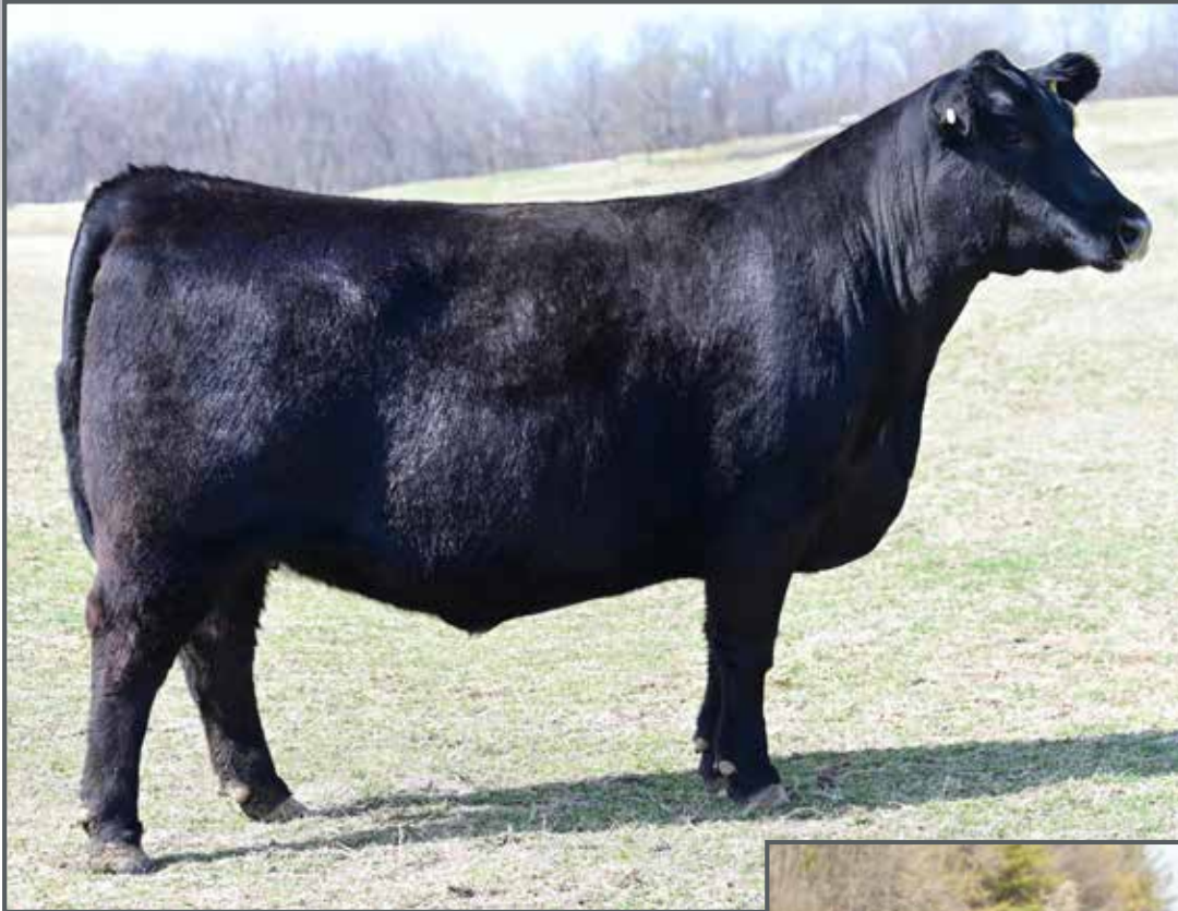
Audley Rita M059 / Lot 9

Rita M059 is a calving-ease, growth, PAP, Marb., $B and $C daughter of the $60,000 Rita G164, the featured donor in the Audley Farm program and sired by the genomic and multi-trait headliner of the ORigen roster, True Balance.