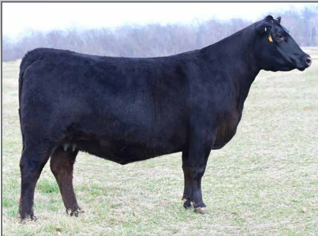
Valley View Tianna 1423 / Lot 4

Tianna 1423, the powerful growth, CW, Marb., RE, $M, $W, $B and $C combination donor featured in The 808 Ranch donor program is a direct daughter of the Valley View Angus selection as the fourth high-selling bred heifer of the 2021 Fall Gardiner Angus Ranch Sale, Identified F60 sired by the proven and now-deceased multi-trait Ankony Angus, Leachman and Maplebrook sire, Paragon.