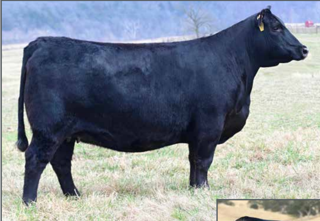
AAA Rita 2507 / Lot 6

Rita 2507 is a calving-ease, growth, PAP, HS, Marb. and $W daughter of the $240,000 valued headliner of the AAA Farms and Vintage Angus Ranch joint embryo programs, Rita 5008 sired by the proven multi-trait ST Genetics leader, Breakthrough.