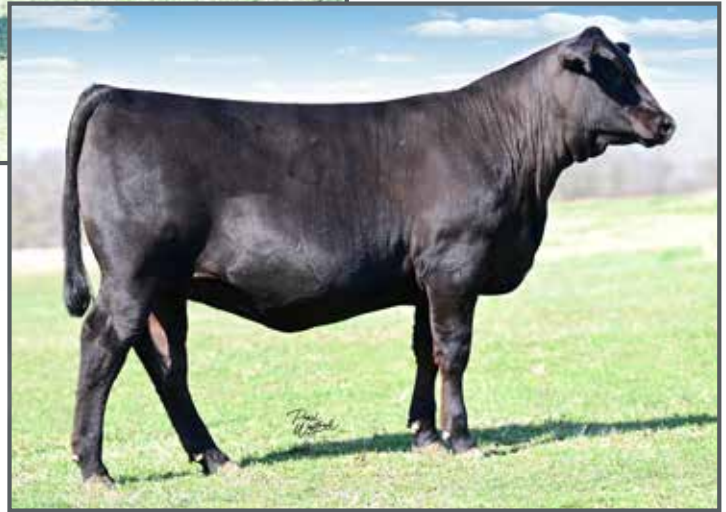
808 Lady 5286 / Lot 1B