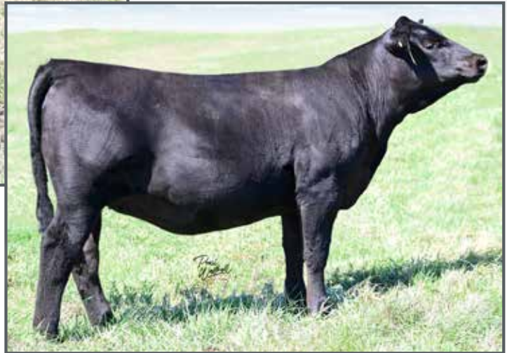
808 Rita 5292 / Lot 3B