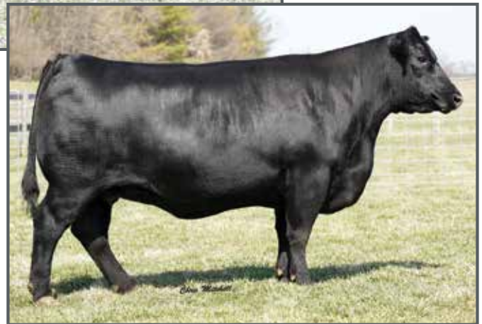
Riverbend Rita G164 / The $60,000 proven and productive dam of Lot 9.

Rita M059 is a calving-ease, growth, PAP, Marb., $B and $C daughter of the $60,000 Rita G164, the featured donor in the Audley Farm program and sired by the genomic and multi-trait headliner of the ORigen roster, True Balance.