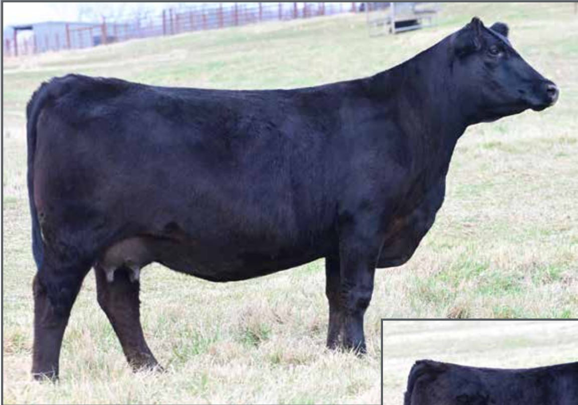
CCF Lady 3132 / Lot 2