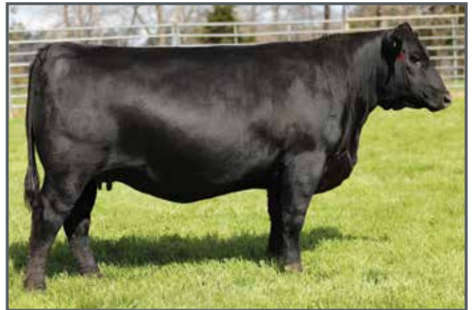
Optum's Shirley 1503 / A daughter sells as Lot 10.

Shirley W404 is a powerful growth, PAP, CW, Marb., $B and $C combination daughter of the feature of the 2024 Gobbell G3 Sale, Shirley 1503 sired by the multi-trait sire in the Select Sires roster, Fireproof.