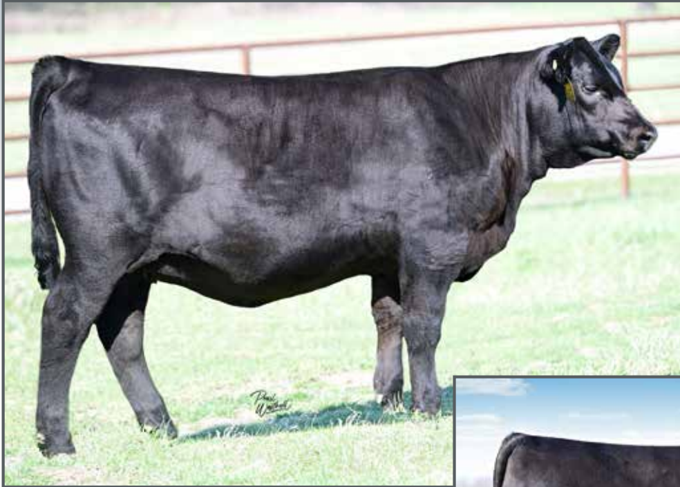
808 Lady 5234 / Lot 1A