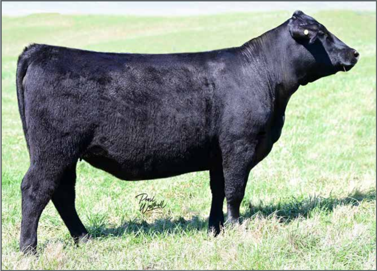
G3 Shirley W404 / Lot 10

Shirley W404 is a powerful growth, PAP, CW, Marb., $B and $C combination daughter of the feature of the 2024 Gobbell G3 Sale, Shirley 1503 sired by the multi-trait sire in the Select Sires roster, Fireproof.