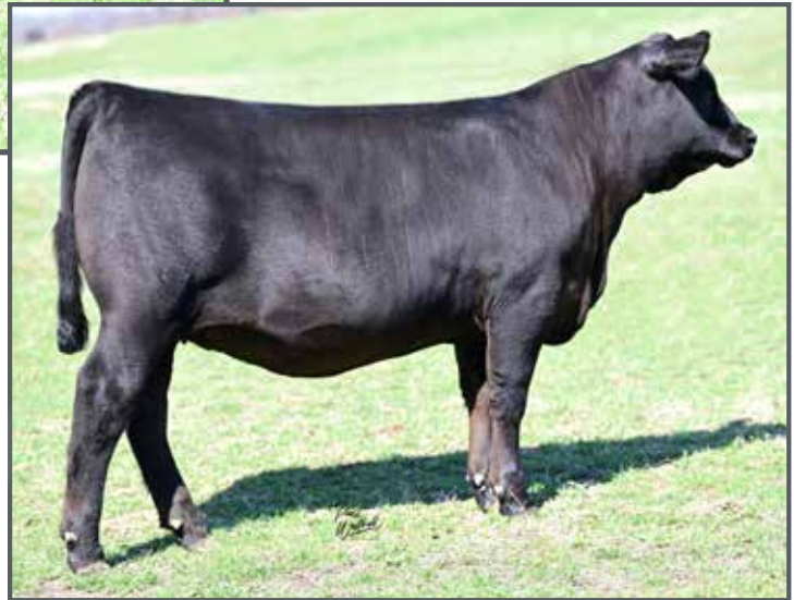
808 Ruby 5255 / Lot 8