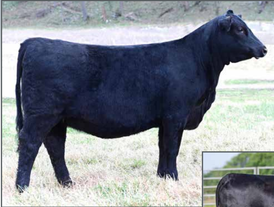
808 Rita 506 / Lot 5B