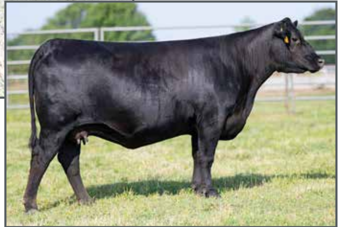
HPCA Enhance 289 / Donor dam of Lots 5A and 5B.

Featuring a heifer pregnancy and a bred heifer from the proven The 808 Ranch donor, Enhance 289 sired by the tremendous young sire, Wallace and the proven The 808 Ranch herd sire, Veracious 2175.