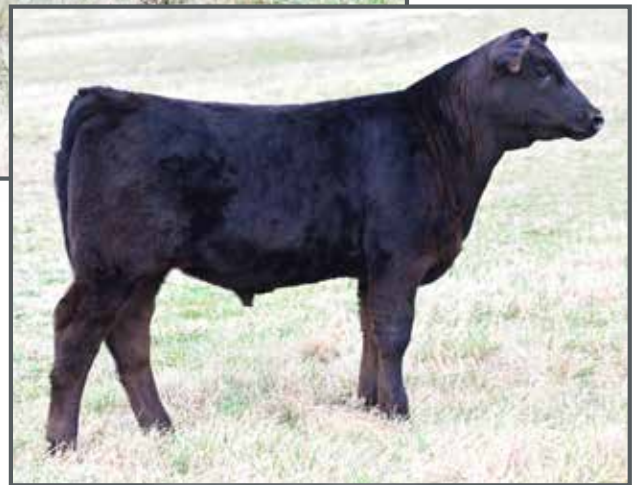
808 Captain 5999 / Lot 2A

Lady 3132 is a powerful and proven donor from the top of The 808 Ranch embryo program and is a direct daughter of the proven and productive outcross donor in the Black Creek Angus program, Lady Acclaim 4107-8809, sired by Breakthrough.