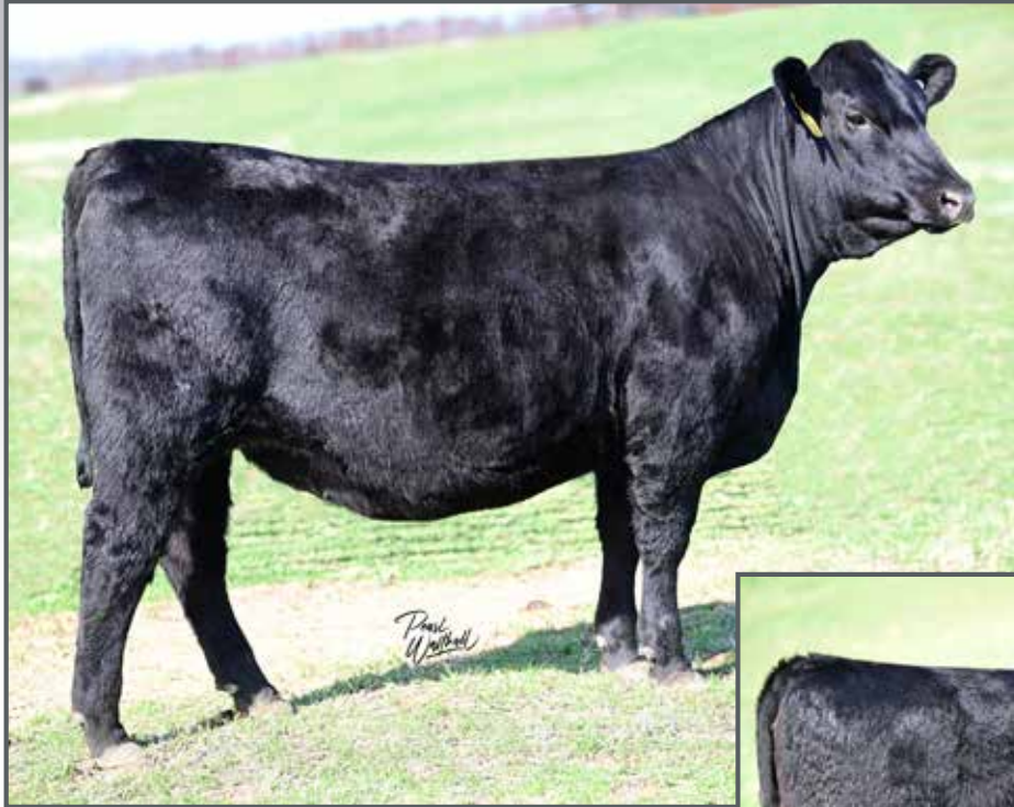
Circle F Miss Lucy 4626 / Lot 11