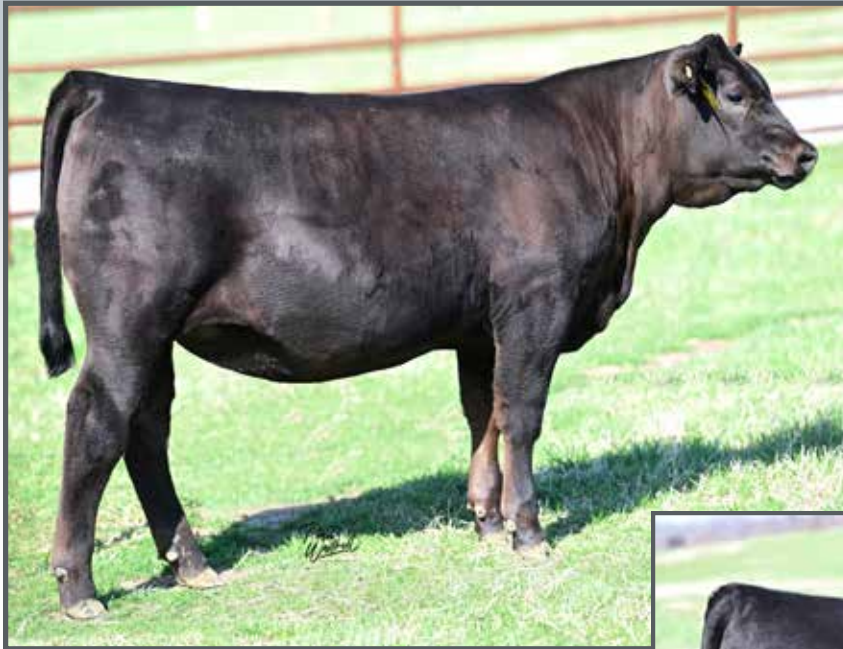
808 Erica 5229 / Lot 7