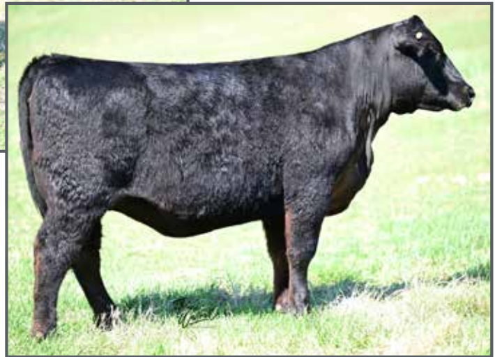
808 Ruby 4425 / Lot 12