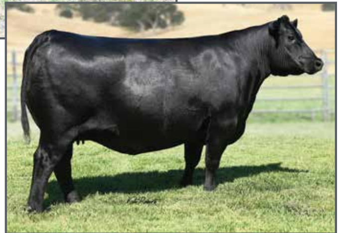
Vintage Rita 5008 / The $240,000 valued AAA Farms and Vintage Angus donor and dam of Lot 6.

Rita 2507 is a calving-ease, growth, PAP, HS, Marb. and $W daughter of the $240,000 valued headliner of the AAA Farms and Vintage Angus Ranch joint embryo programs, Rita 5008 sired by the proven multi-trait ST Genetics leader, Breakthrough.