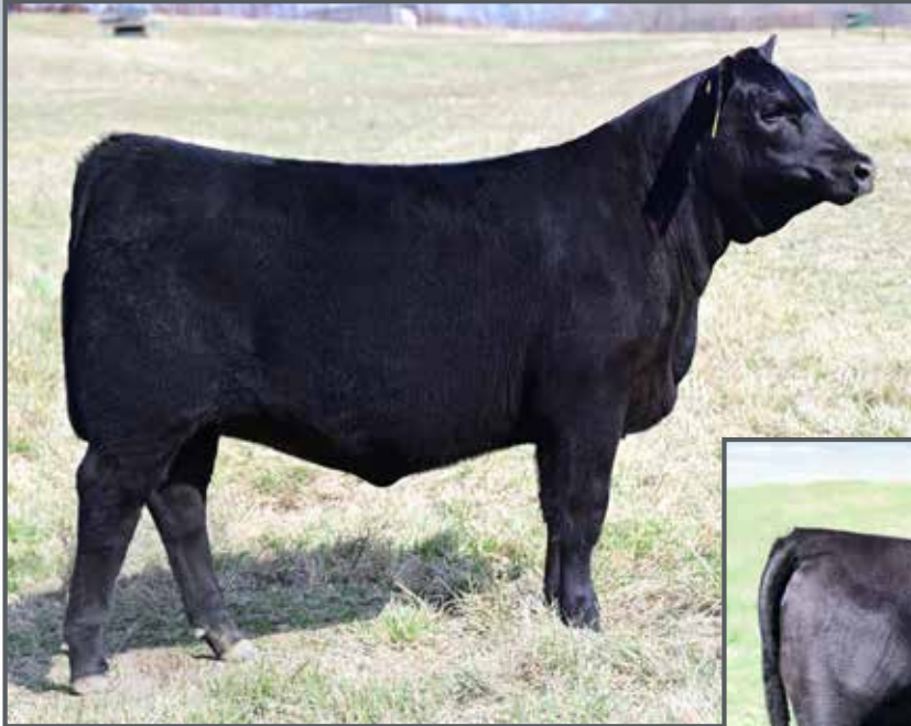
808 Rita 5259 / Lot 3A