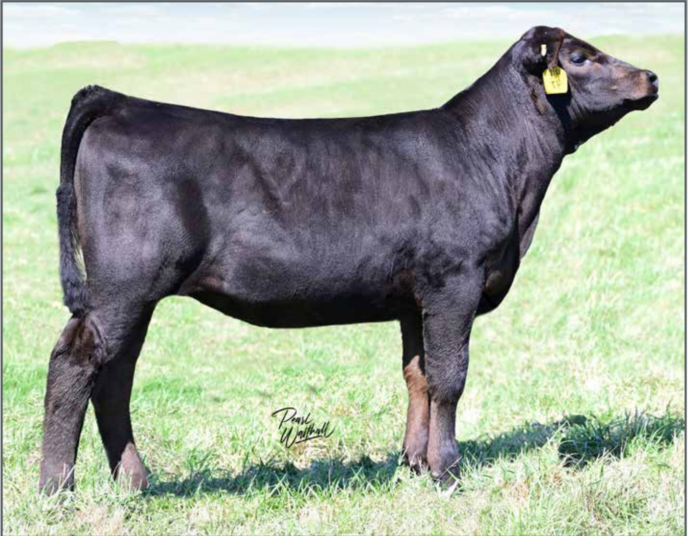
808 Lady 5537 / Lot 1