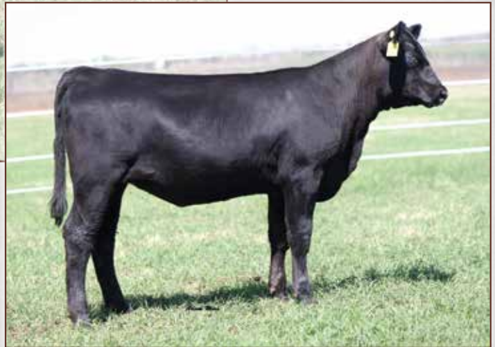
SJH Powercat of 2515 5709 / Lot 7A