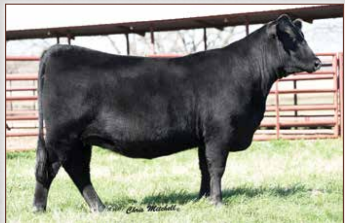
44 Ruby 6267 / A granddaughter of this foundation Blackstone Cattle Company and 44 Farms headliner sells as Lot 25.