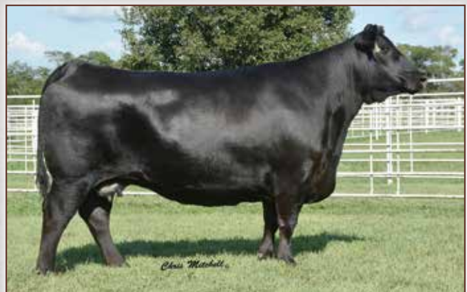
GAR Progress 830 / The record-selling multi-trait feature of the Spruce Mountain Ranch and Express Ranches programs and dam of Lot 15.

Rita 4815 is a calving-ease, PAP, Marb., $B and $C prospects produced by the $425,000 record-selling Spruce Mountain Ranch and Express Ranches headliner, Progress 830 sired by the multi-trait feature of the Riverbend Ranch and Spruce Mountain Ranch herd sire rosters, Bougie.