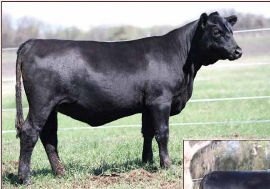
SJH Fireproof of 2247 4646 / Lot 4