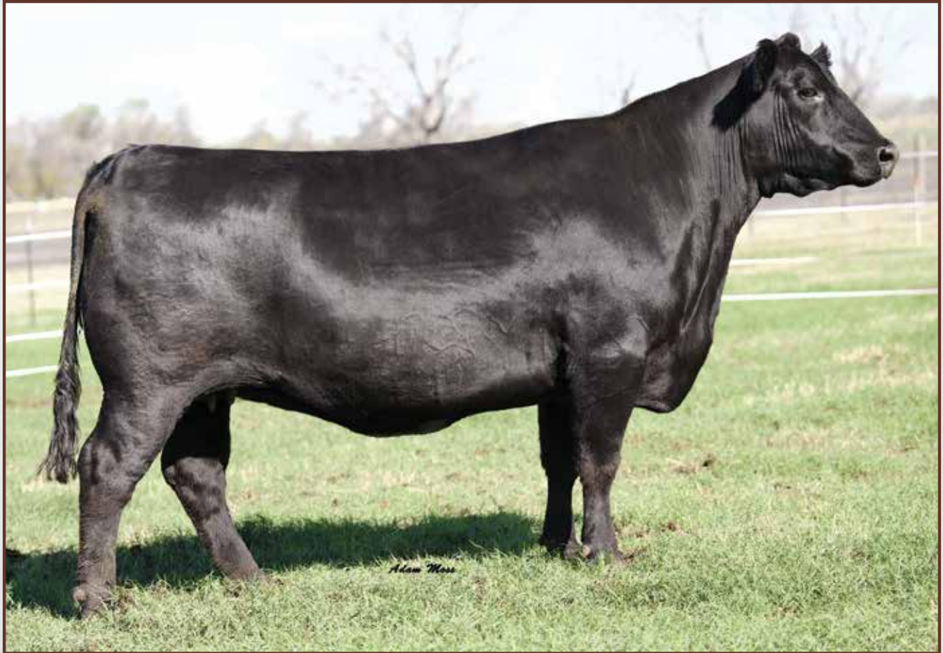
SJH Sire Fire of 4200 9605 / Lot 27