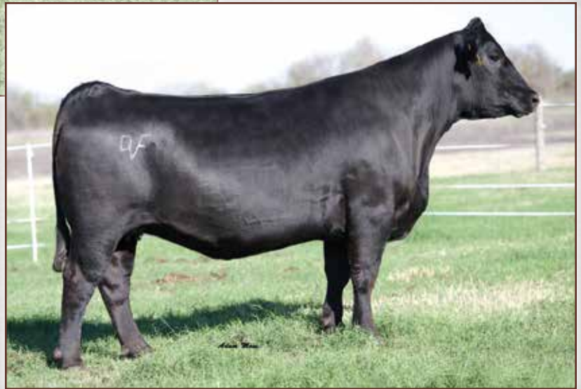
Deer Valley Chloe 2225 / Lot 24