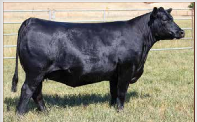
Byrd SuperMama HT 6276-1609 / The foundation donor in the Bar KJ Angus program and dam of Lot 6.

SuperMama Jam 1609-3537 is a powerful growth, PAP, Marb., $M, $W, $B and $C combination daughter of the featured SuperMama in the Bar KJ Angus program, SuperMama HT 6276-1609 sired the record-selling multi-trait leader, Jameson.