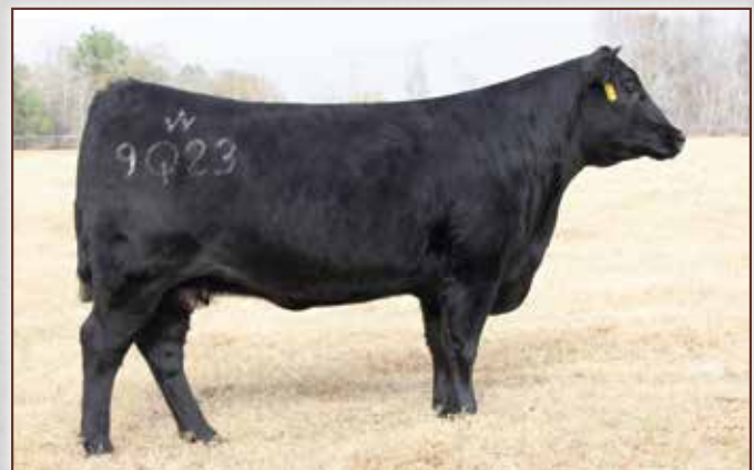
Rita 9Q23 of Rita 5F56 GHM / The cornerstone Fairway Angus and Friendship Farms donor and dam of Lot 27.