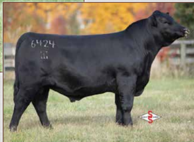
GAR Grand Slam / The $800,000 record-selling maternal brother to Lots 1A and 1B.

Featuring two sensational and exciting heifer pregnancies from the $200,000 top-selling female of the 2025 Gardiner Angus Sale and featured Hillhouse Angus and Circle F Farms donor, Sunbeam 332 sired by the proven multi-trait Genex leader, Draft Pick and the outstanding combination sire, Alpha.