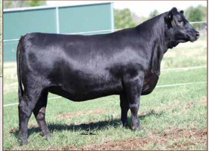
SJH Veracious of 3132 4629 / Lot 2B