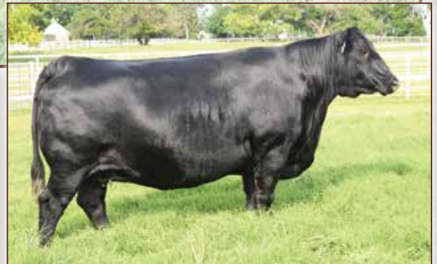
Basin Joy 9140 / The $110,000 Circle G Ranches headliner and donor dam of Lot 20.

4708 is a calving-ease, PAP, HS, Marb., RE, $M, $W, $B and $C daughter of the $110,000 addition to the Circle G Ranches program, Joy 9140 sired by the $235,000 multi-trait breed leader and record-selling sire, Ambitious.