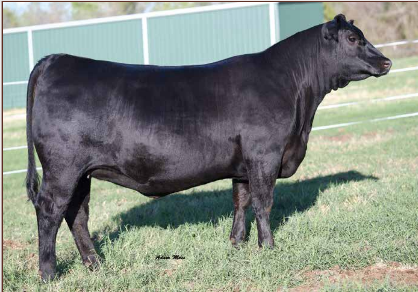
SJH True Balance of 314 4724 / Lot 14

4724 is an outstanding Marb., RE, $B and $C combination female produced by the featured donor in the Hillhouse and 2 Bar C Cattle Company joint embryo programs, Deadwood 314 and sired by the proven genomic leader of the ORlgen roster, True Balance.