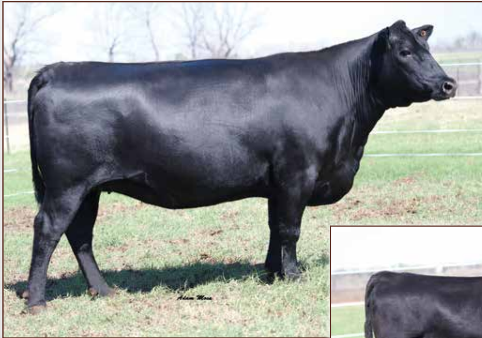
AAA Rita 2515 / Lot 7