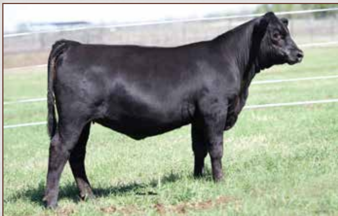
SJH Fireproof of 1780 5716 / Lot 10