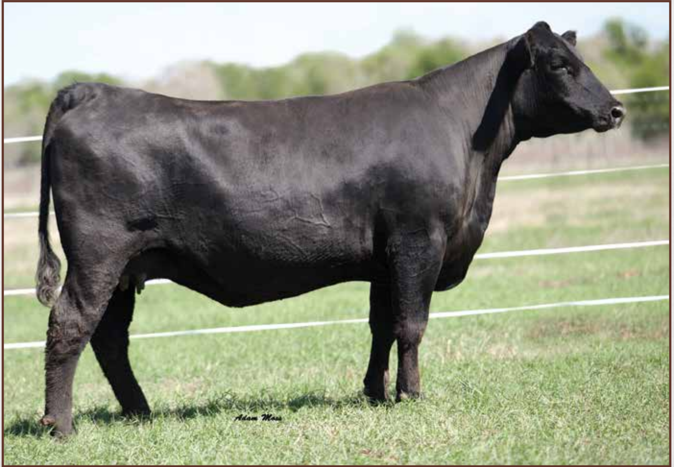
SJH Fireball of 3132 3736 / Lot 3

Featuring three multi-trait daughters of the foundation Hillhouse Angus and Maplecrest Farms donor, Ingenuity 3132 sired by the proven Select Sires roster member, Veracious and the carcass, $B and $C sire, Fireball.