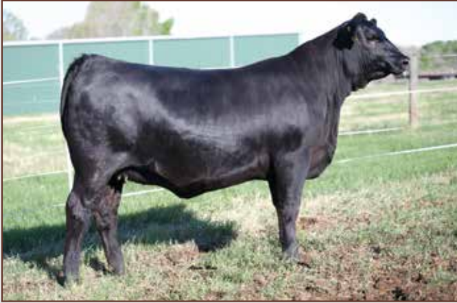
Spruce Mtn Entense 5047 / Lot 11