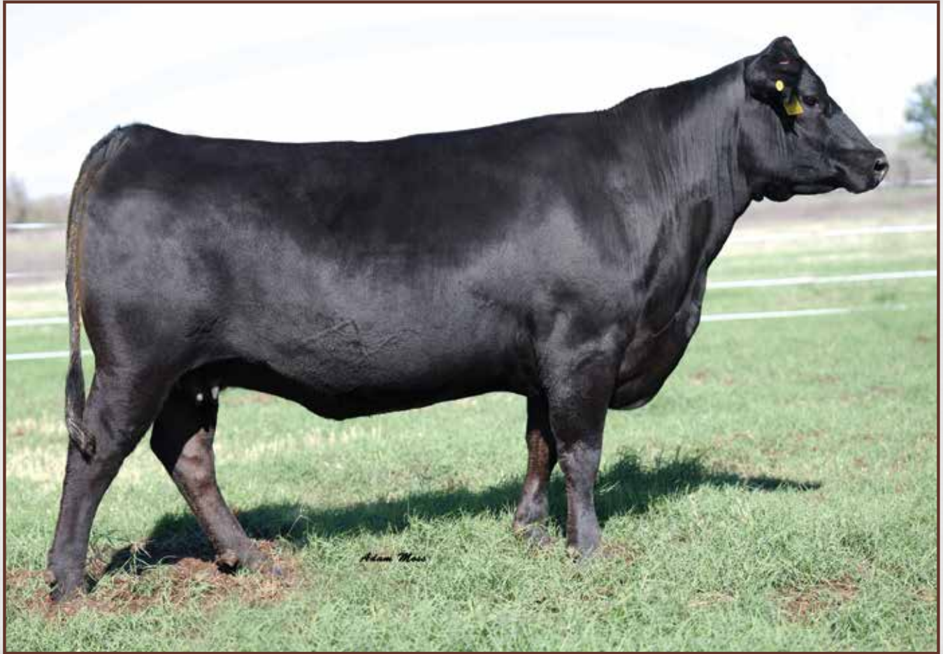
SJH Home Town of 6473 2006 / Lot 25

2006 is a low-birth, PAP, HS, Marb., RE, $M, $W, $B and $C daughter of the foundation Ruby in the Hillhouse Angus program, Enhance 9473 sired by the proven female sire, Home Town.