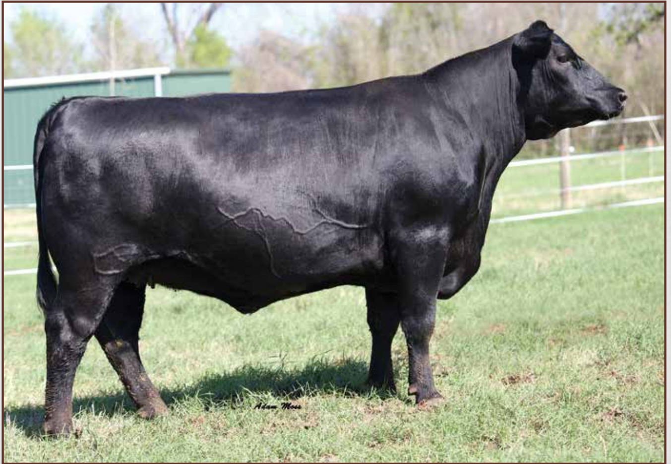
Byrd SuperMama Jam 1609-3537 / Lot 6