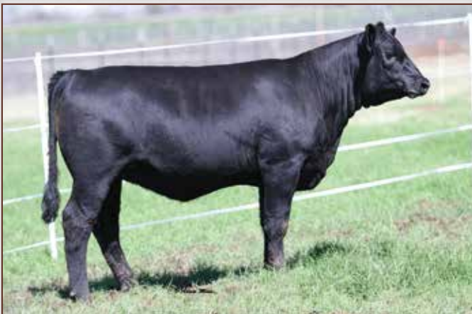
SJH Heat Seeker of 1837 5707 / Lot 13