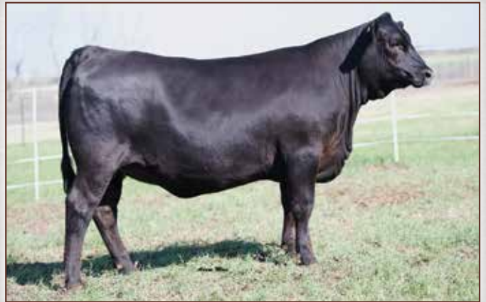
Spruce Mtn Rita 5042 / Lot 12