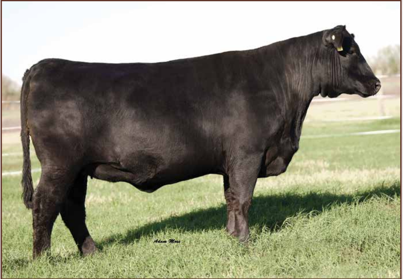
Deer Valley Henrietta 4226 / Lot 18

Henrietta 4226 is a balanced-trait daughter of the $18,000 selection of Hillhouse Angus in the first Deer Valley Farm Spring sale, Henrietta 9749 sired by the proven multi-trait leader of the Select Sires roster, Fireproof.