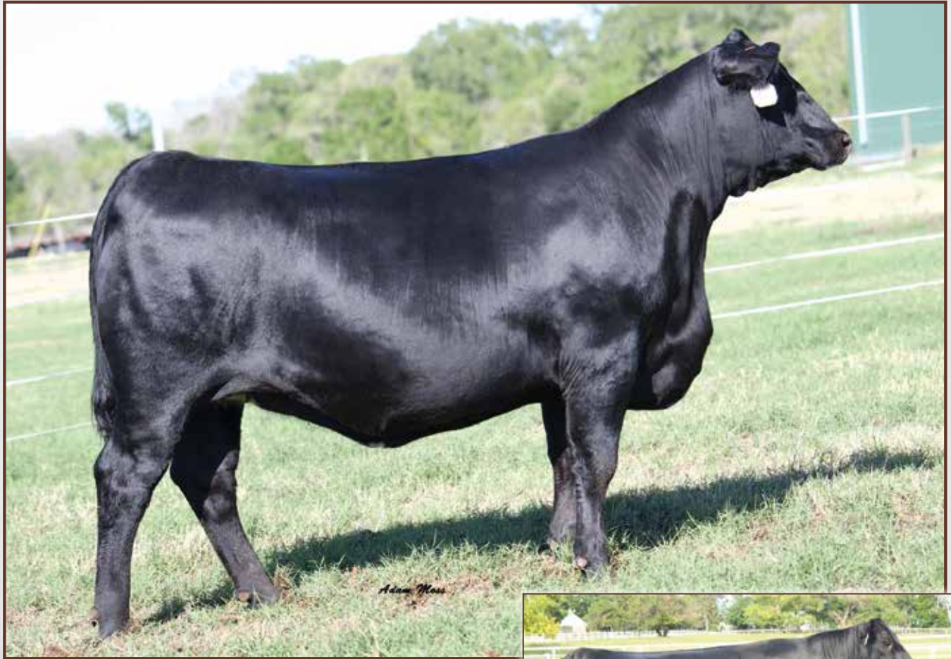
SJH Ambitious of 9140 4708 / Lot 20

4708 is a calving-ease, PAP, HS, Marb., RE, $M, $W, $B and $C daughter of the $110,000 addition to the Circle G Ranches program, Joy 9140 sired by the $235,000 multi-trait breed leader and record-selling sire, Ambitious.