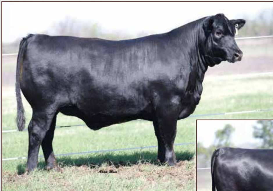
Daltons Isabel 4299 / Lot 16