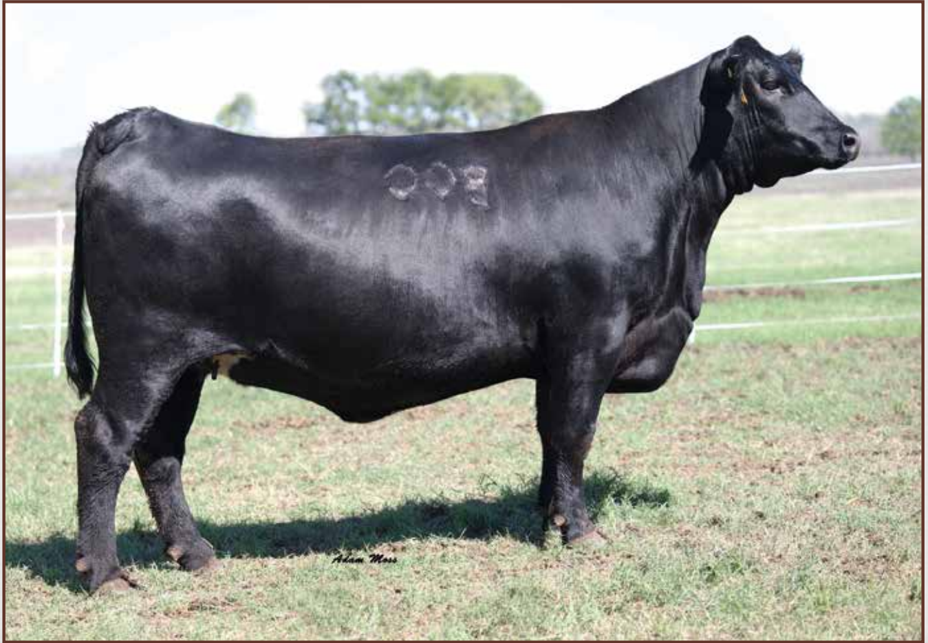
Byrd Rita Veracious 1C4-3V9 / Lot 21

Veracious 1C4-3V9 is a calving-ease, Marb., RE, $W, $B and $C daughter of the cornerstone Riverbend Ranch donor, Rita 1C4 sired by the proven Select Sires roster member, Veracious.