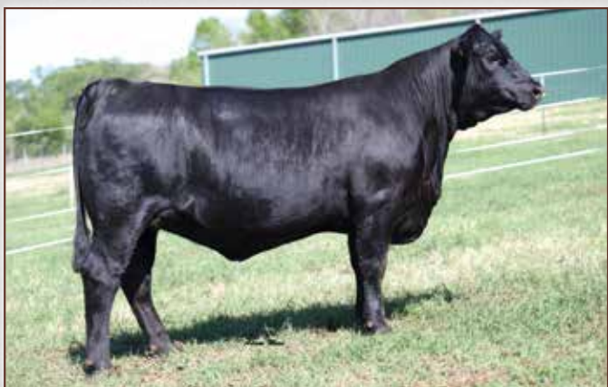
EXAR Rita 5714 / Lot 8

• 5716 is a PAP, Marb., RE, $B and $C prospect produced by the $50,000 valued half interest feature of the 2023 Deer Valley Farm Sale, Rita 1780 sired by Fireproof. • Rita 1780, the donor dam of Lot 10 is a fourth-generation Deer Valley Rita and was selected by Seldom Rest Farms to join the elite performance donors in their program. Rita 1780 blends the proven multi-trait leader of the Grimmus Cattle Company roster, Salvation with a direct daughter of the cornerstone Rita in the Dow Livestock program, Rita 5724 sired by the proven Mapleton Farm and Quaker Hill Farms sire, Rampage, Rita 7796 a Independence Ridge Farm headliner.