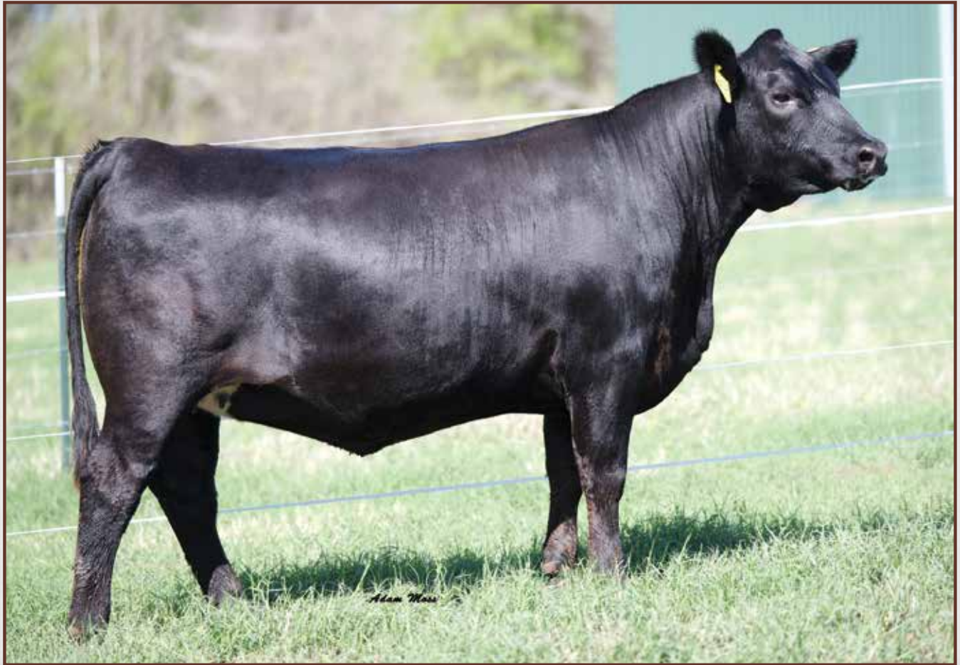
SJH Veracious of 2208 4703 / Lot 19

4703 is a PAP, Marb. and $B bred heifer produced by the foundation Erianna in the B&B Cattle Company program, Erianna 2208 and is sired by the proven multi-trait Select Sires roster member, Veracious.