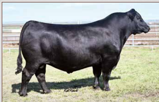
RSA True Balance 1311 / A daughter sells as Lot 14.