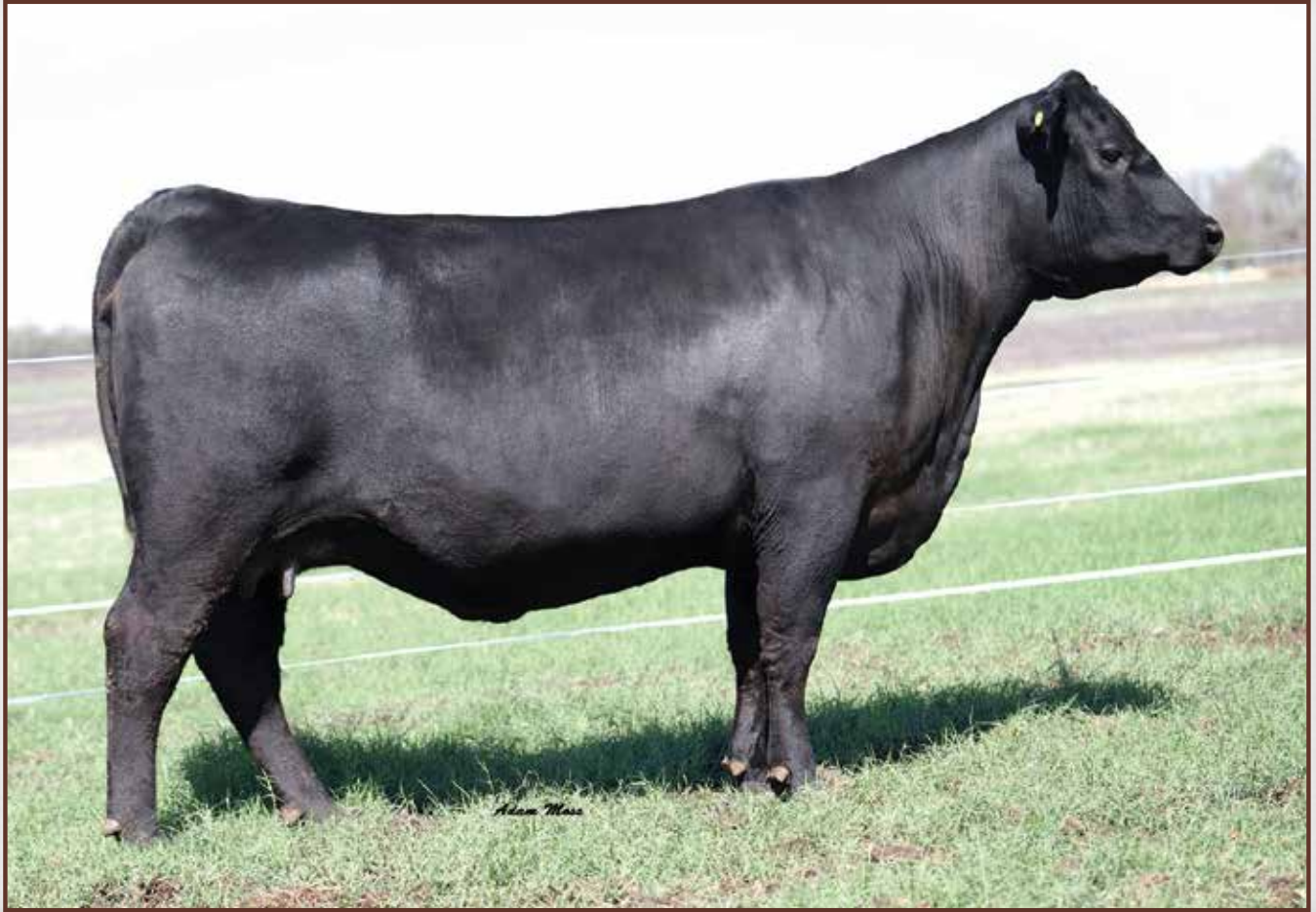
Vintage Lucy 3167 / Lot 22

Lucy 3167 is a powerful growth, $M, $W, $B and $C direct daughter of the $33,000 Maplebrook Farms donor, Lucy 8861 sired by the outcross female sire, Exponential.