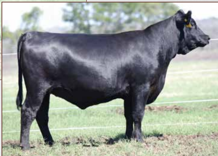
Pine Tree Fireproof 403 / Lot 17