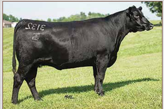
GAR Ingenuity 3132 / The powerful and proven donor dam of Lots 2A through 3.