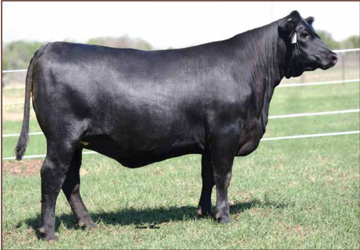
SJH Rita 4815 / Lot 15