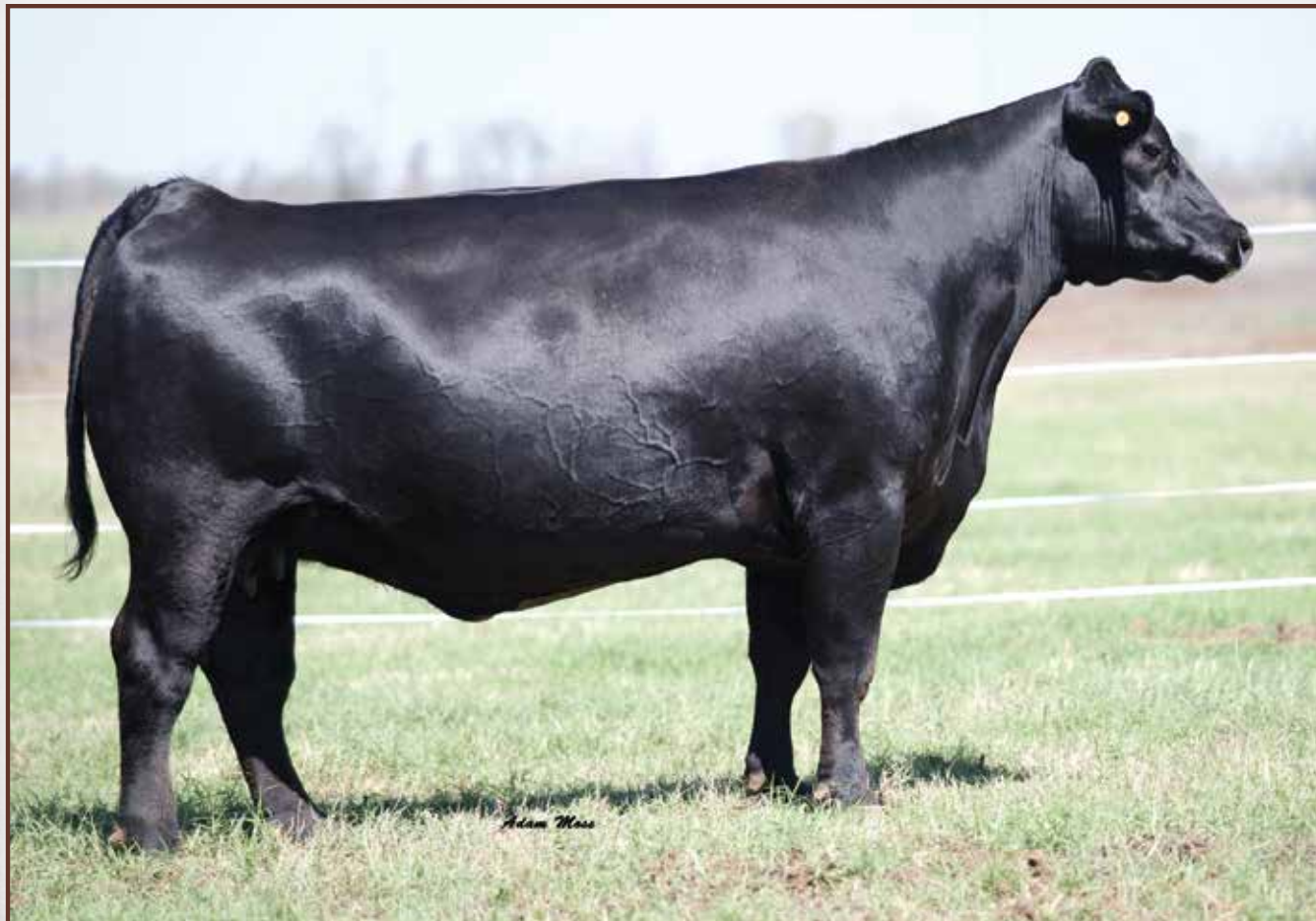
Pollard Barbara 1570 / Lot 26

Barbara 1570 is a calving-ease, PAP, Marb., RE, $B and $C daughter of the third-generation Barbara in the Pollard Farms program, Barbara 9523 sired by the proven multi-trait female sire in the Select Sires roster, Home Town.