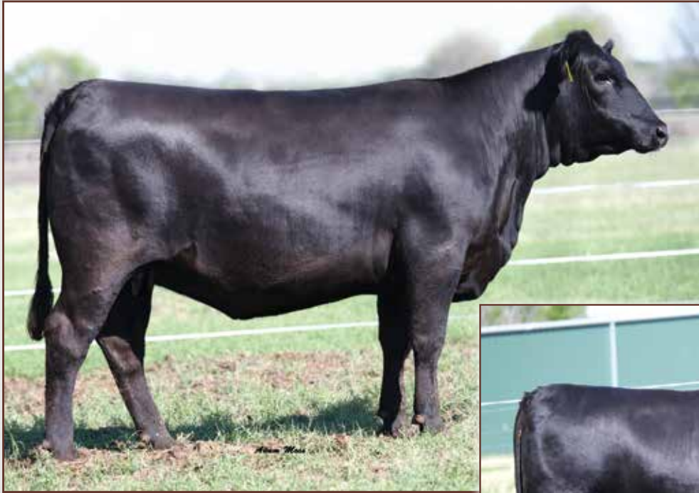
SJH Veracious of 3132 4623 / Lot 2A