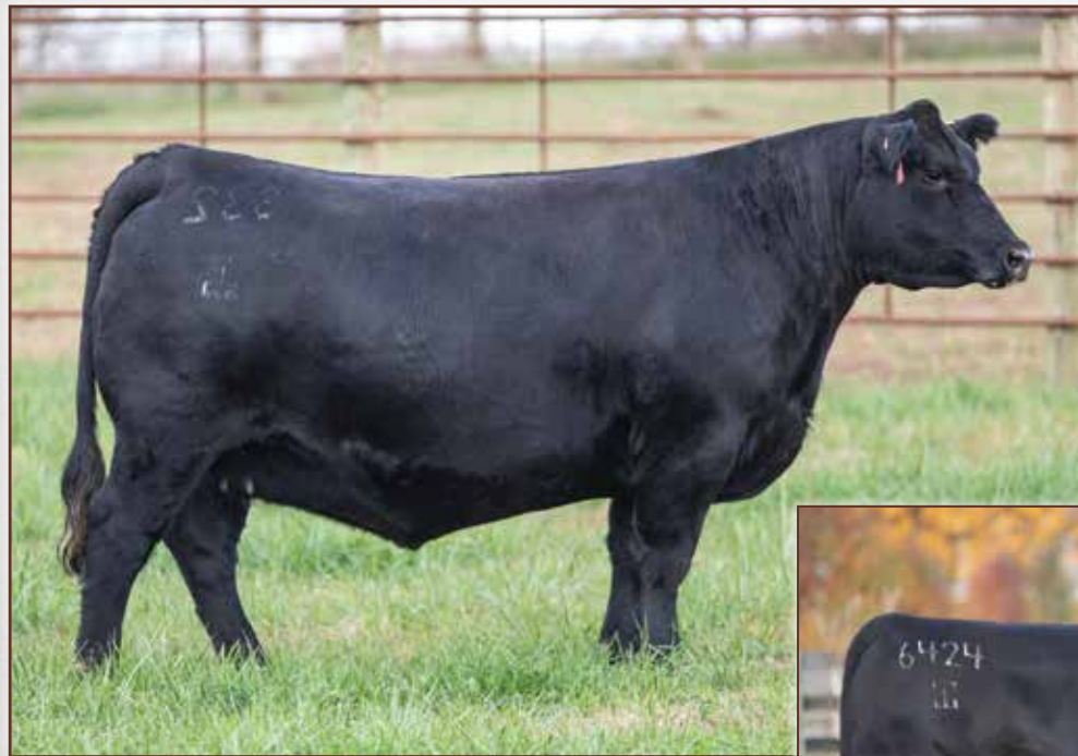
GAR Sunbeam 332 / The $200,000 multi-trait leading donor dam of Lots 1A and 1B.