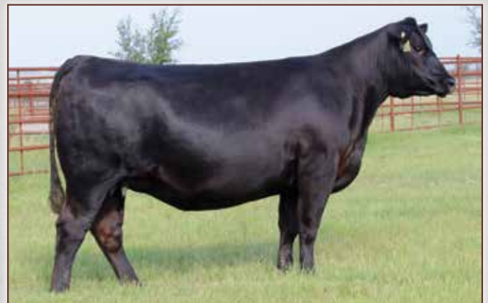
DCF Lucy 8861 / A daughter sells as Lot 22.