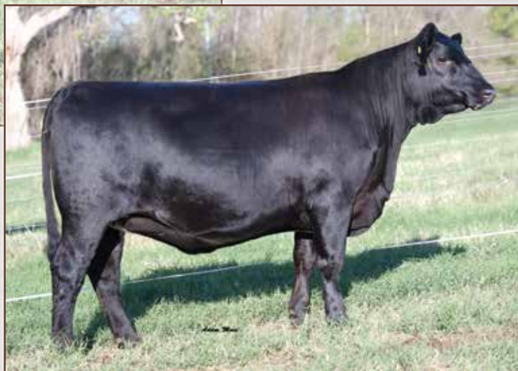
SJH Preeminent of 540K 4716 / Lot 5