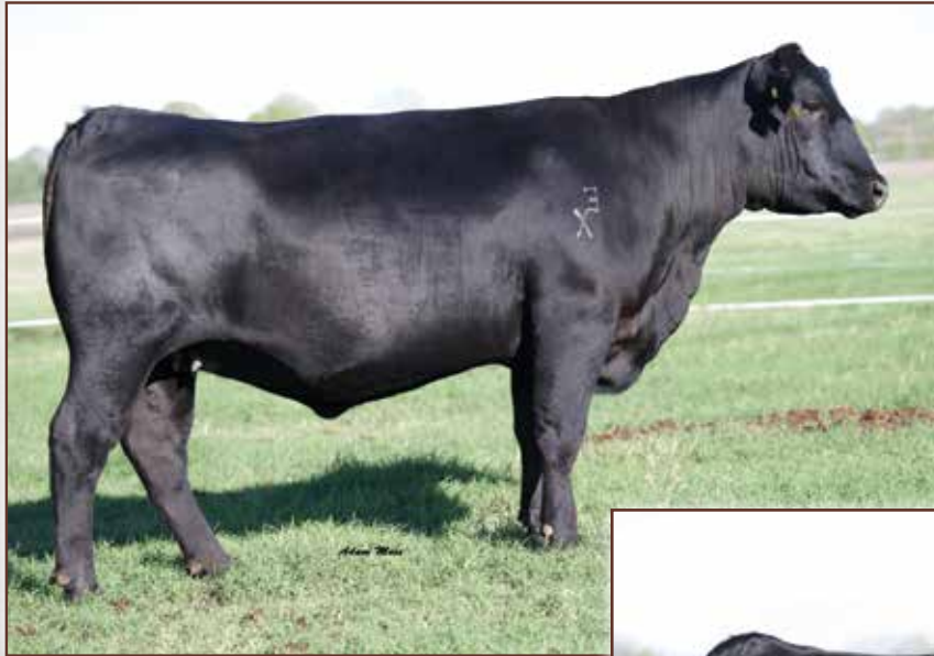
EXAR Chloe 3902 / Lot 23