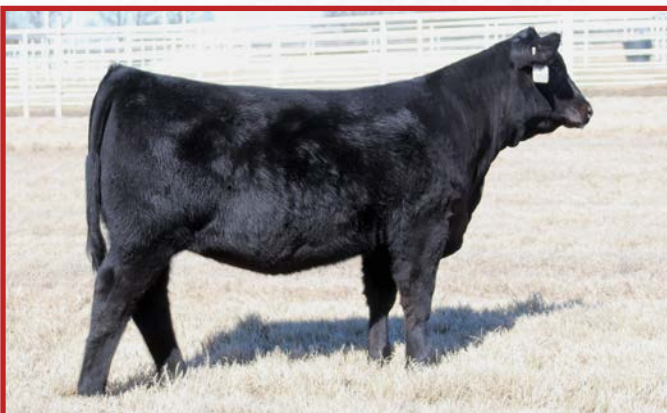
Gabriel Rita 5565 - $45,000 Satisfaction Daughter selling to Fecht Ranch

Satisfaction is quickly becoming a must use sire in the Industry! He adds length of spine, angular front ends, smooth joint structure without sacrificing any muscle. The first calf crop is proving to be DNA leaders for many traits. The first daughters include the $70,000 selection of Grimmus Cattle in the 2025 National Finals Sale. The $50,000 1/2 interest purchase of Spruce Mountain Ranch in the 2025 Stonewall Ridge Production Sale, the $160,000 selection of Byrd Cattle Company in the recent Gabriel Ranch Sale, and the $45,000 selection of Fecht Ranch in the March Gabriel Ranch Sale.