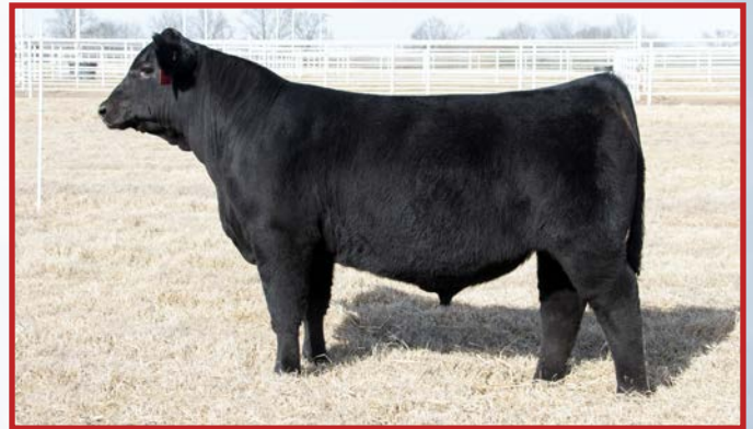
Gabriel Turning Point 5506 - $320,000 Valued maternal brother to Lots 1A-D

A female that has already left her mark on the industry, Rita 3523 is quickly becoming a household name and, as a two-year-old, has already amassed over $1 million in progeny sales that include the $320,000 valued selection of ST Genetics, the $140,000 selection of JB Farms and 4C Cattle, the $150,000 valued Stonewall Ridge and Spruce Mountain donor, and the $50,000 Stonewall Ridge selection in the recent March sale here at the ranch. If you are looking for genetics that just flat out get it done, look no further. This one is just a flat out producer.