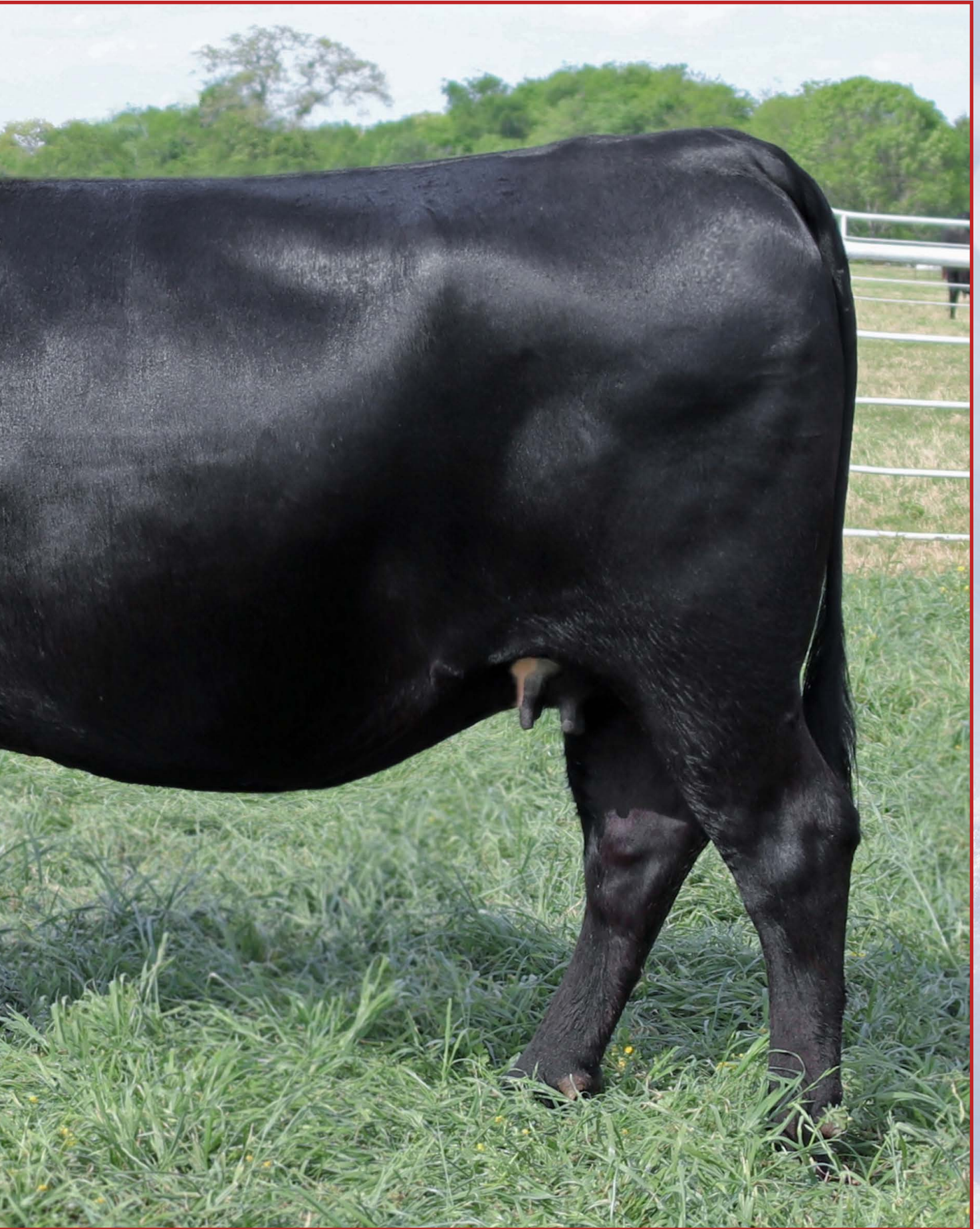
Gabriel Eclipse 2507 - Dam of Lots 5A & 5B Embryos