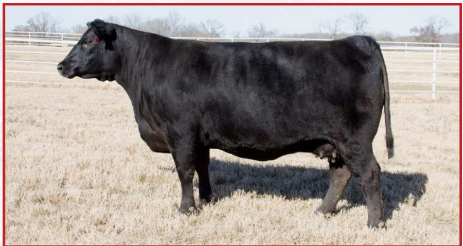
SR Black Miss 2406 - Dam of Lot 8 Embryos

2406 has already built a following, producing 2 sons by Statesman that are number 1 and number 2 $C in the breed. Her first son sold to Wilks Ranch in the 2025 bull sale for $24,000 and her weaned bull calf recently sold as a split pair in the 2026 sale for a $75,000 value to Smith Livestock. Talk about a female that can get it done on paper and on the hoof.