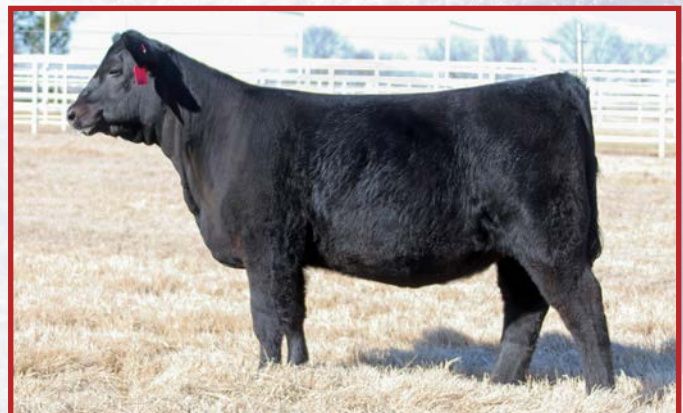
Gabriel Lady 5558 - $160,000 Satisfaction Daughter selling to Byrd Cattle Co.