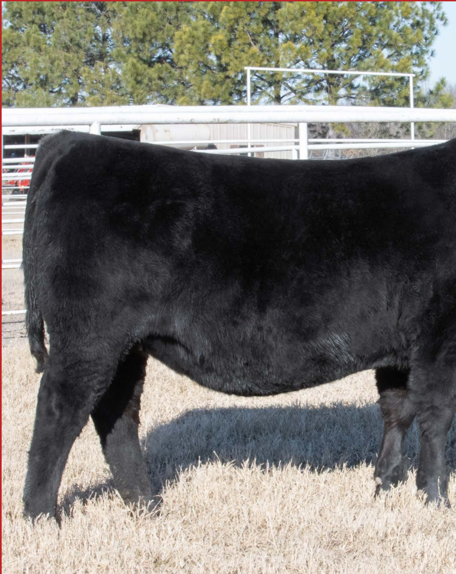
J3 Fleetwood of 9682 J088 - Dam of Lots 6A-6C Embryos