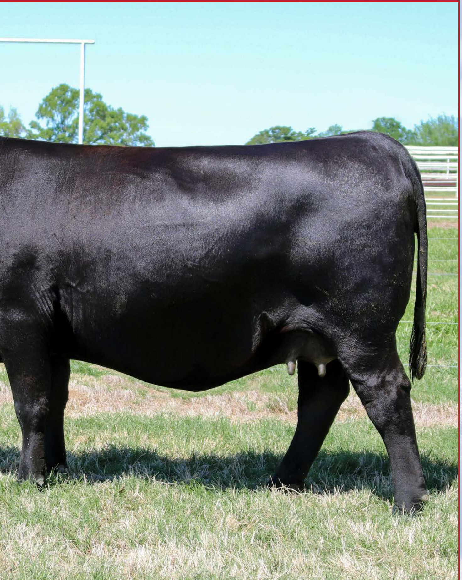
Ogeechee FB Grid Maker 17155 - Dam of Lots 2A-2C