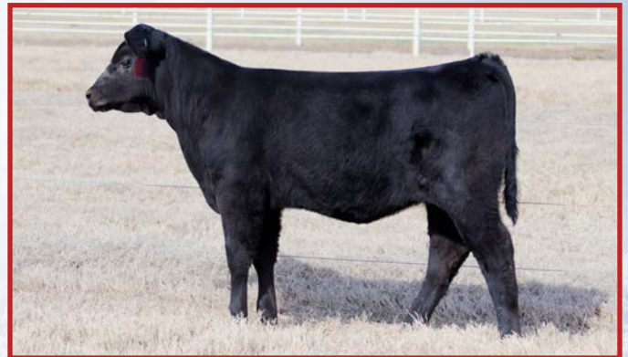
Gabriel Rita 5642 - $140,000 Maternal sister to Lots 1A-1D