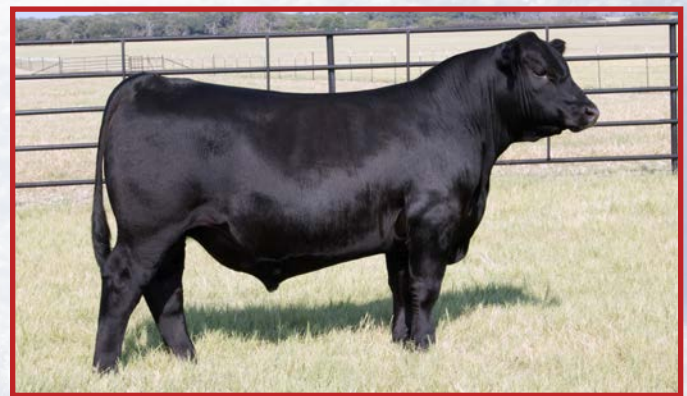
Wilks Avid 4864 - The $1.2 Million Valued Sire of Lot 4A Embryos

A guarantee of 1 pregnancy if work is performed by a licensed professional.