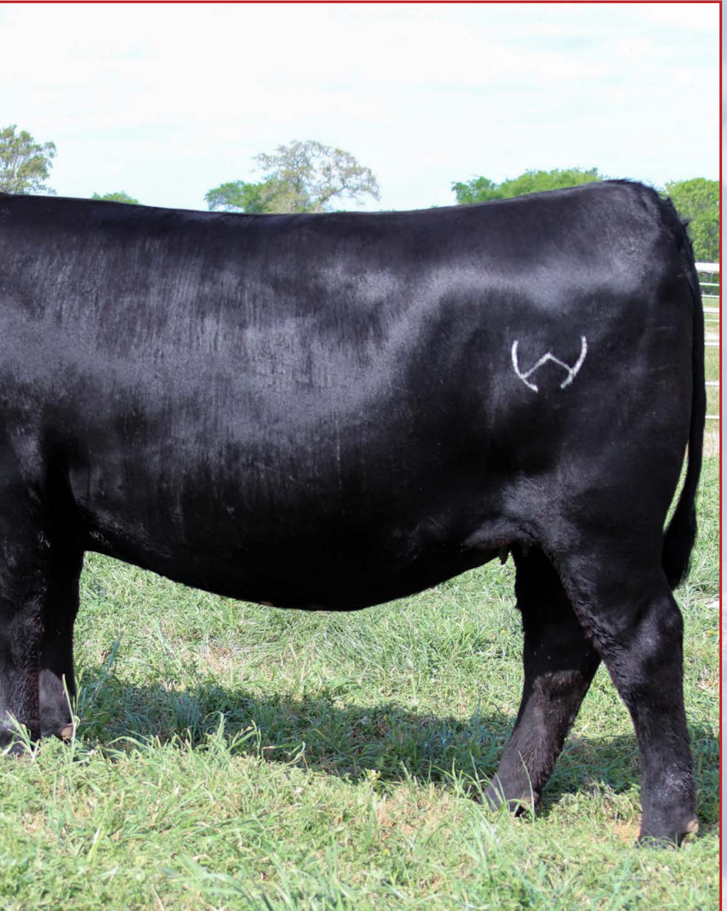
Wilks Rita 4807 - Dam of Lots 3A & 3B Embryos