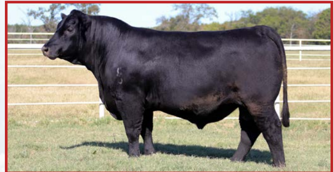
Gabriel Statesman 4094 - Maternal Brother to Lot 8 Embryos

A guarantee of 1 pregnancy if work is performed by a licensed professional.