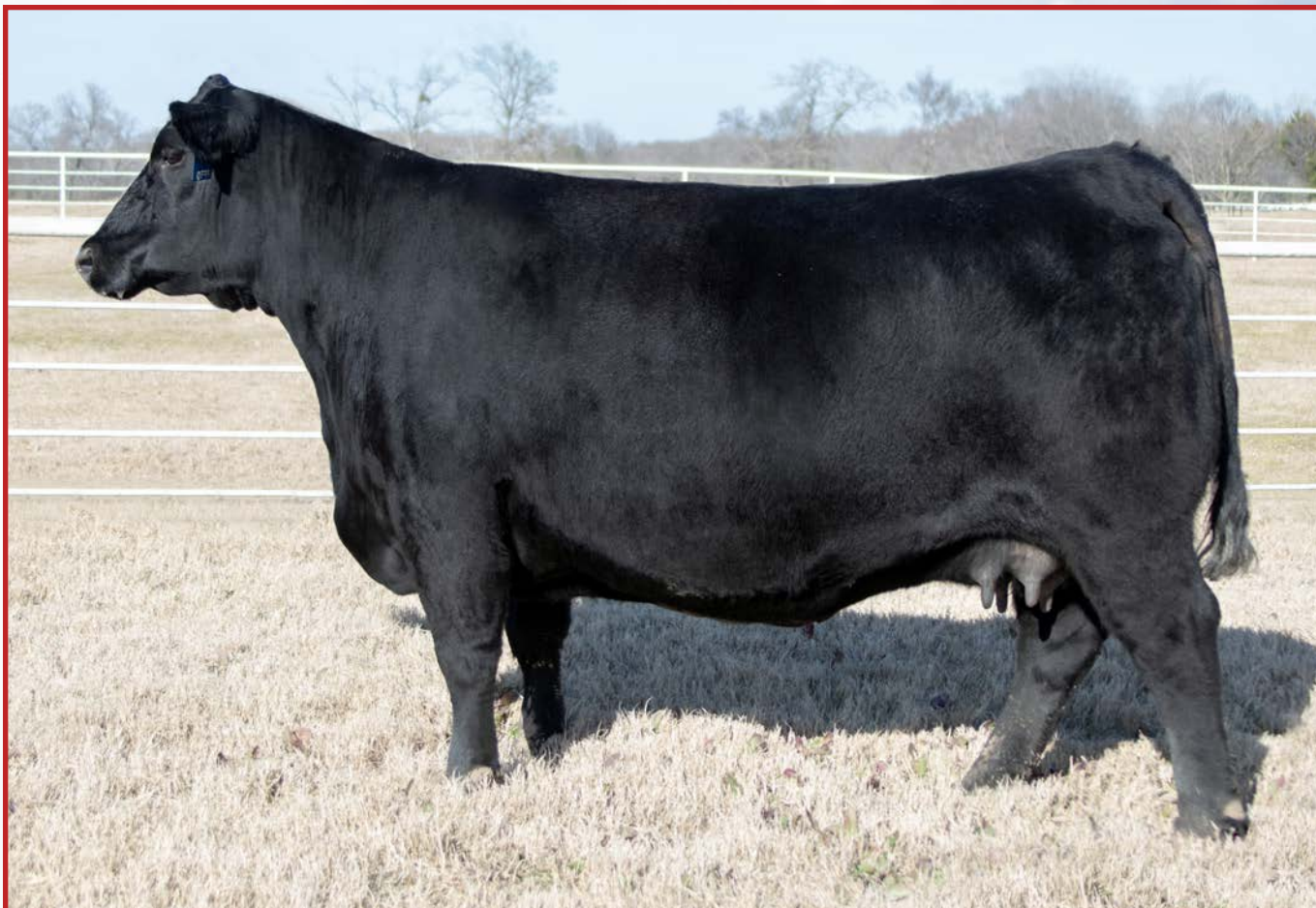
FF Rita OF99 of 5092 Fireball - Dam of Lots 9A & 9B Embryos

Rita OF99 is a powerfully-made Fireball daughter that is seriously captivating when you analyze the sheer power and elegance she possesses all in one super complete package. She was the 1/2 interest selection of Triple C Farms in the 2025 Gabriel Ranch Production Sale and her daughter was the $25,000 selection of G3 in the recent 2026 production sale. We feel this is the kind, both on hoof and on paper, that it takes to achieve elite performance cattle.