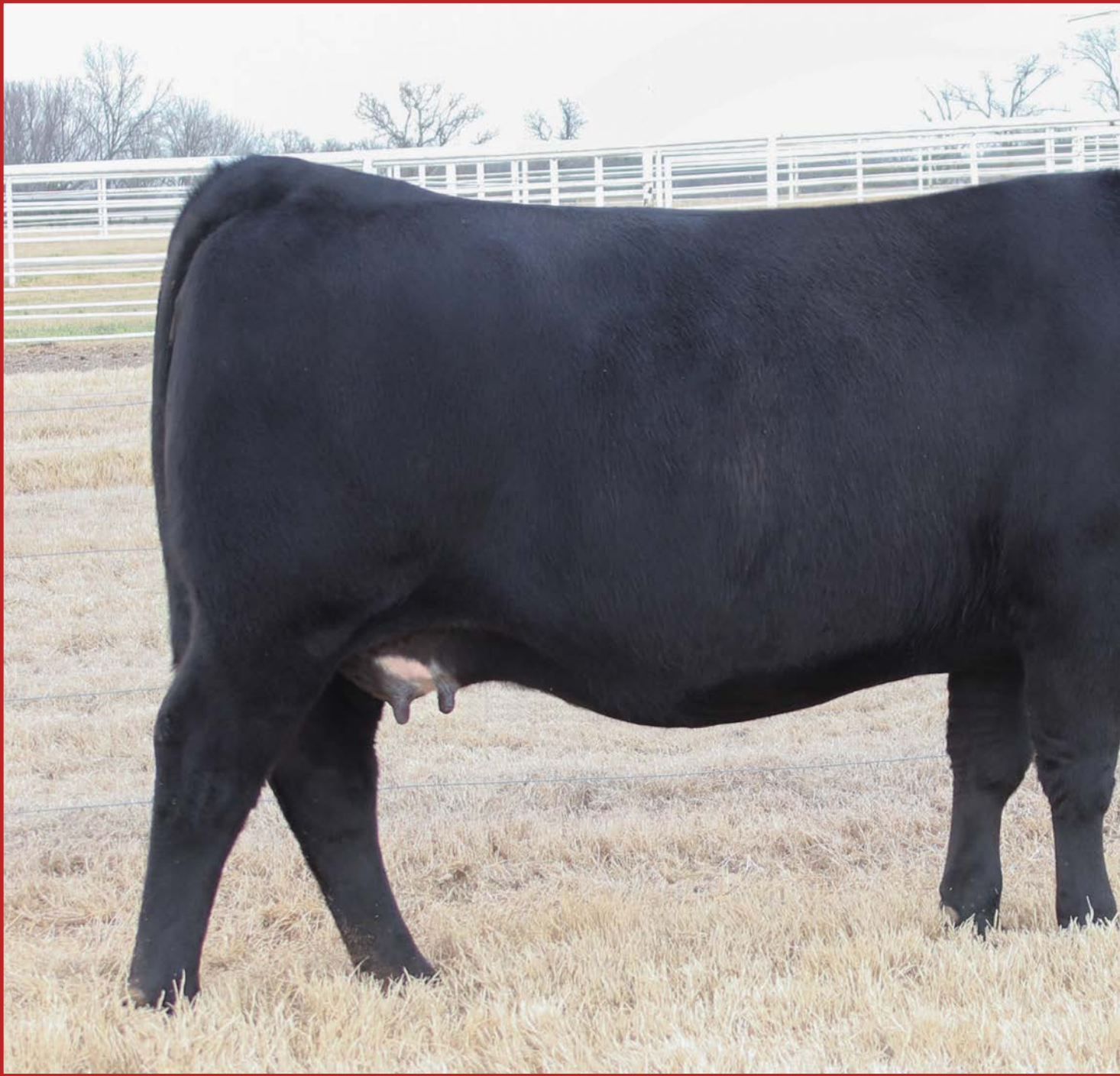
Gabriel Rita 3523 - Dam of Lots 1A-1D