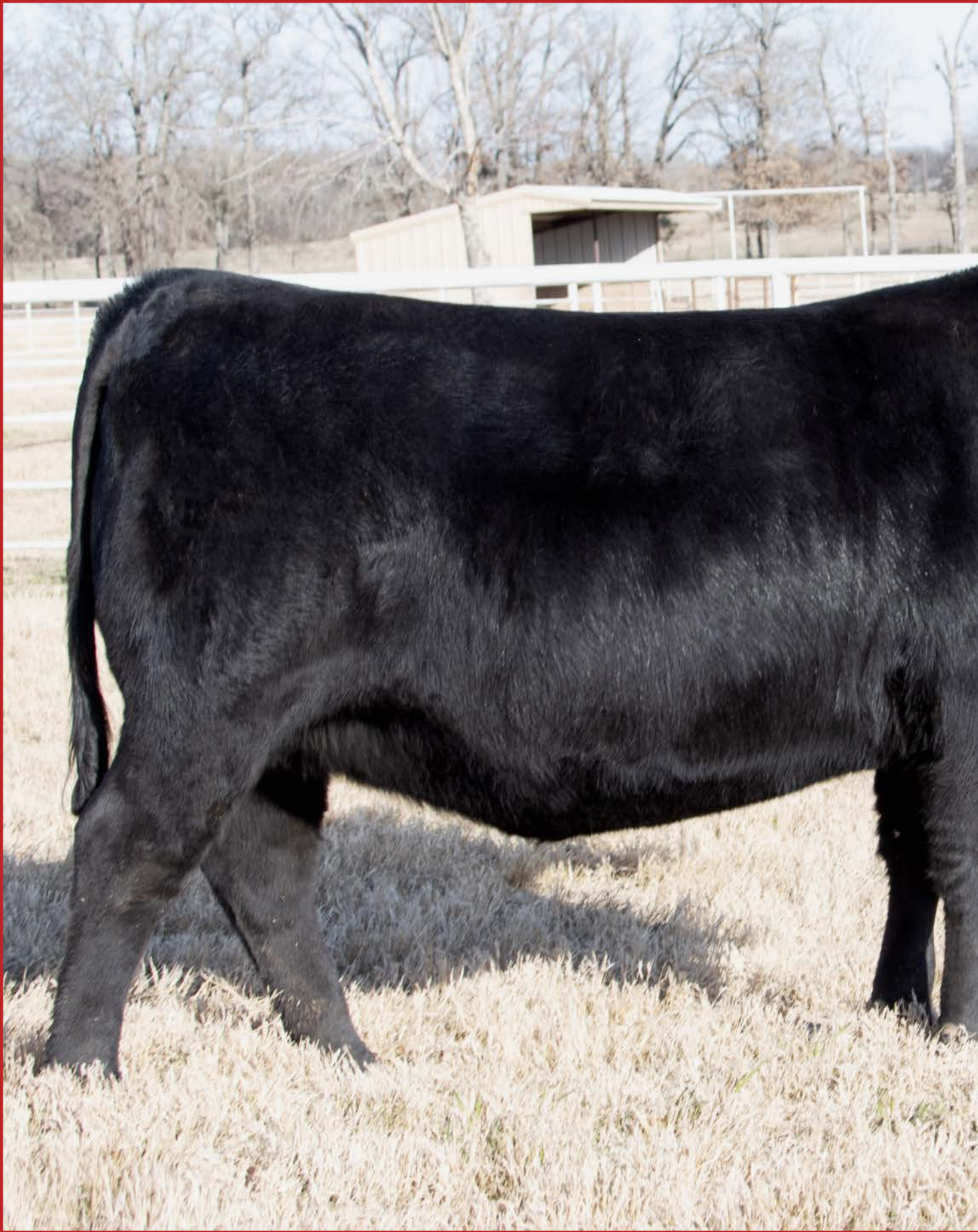
Gabriel Erica 4503 - Dam of Lots 4A-4C Embryos