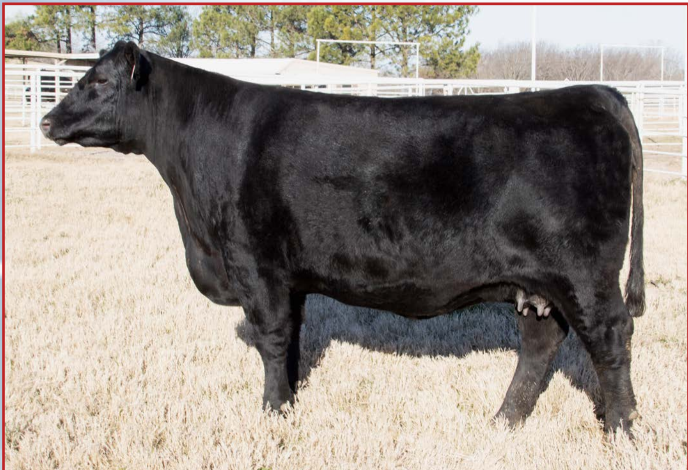
PEAK Rita K231 - Dam of Lots 10A-10C Embryos

Rita K231 is a massive-made, sweet-uddered, long-spined, deep-sided Clarity daughter that was one of the top-selling spring pairs at $32,000 to Fecht Ranch in the sale. This is the kind of female that possesses unlimited potential; she is the ideal frame, ideal conformation and, to top it off, she is loaded with elite performance on paper. These matings should do nothing but be money-making progeny.