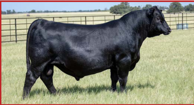
Wilks Achiever 4803 - $320,000 Valued Flush Mate to Lot 3 Donor