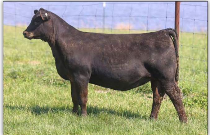
WSC Emblynette N227 - Sells as Lot 260