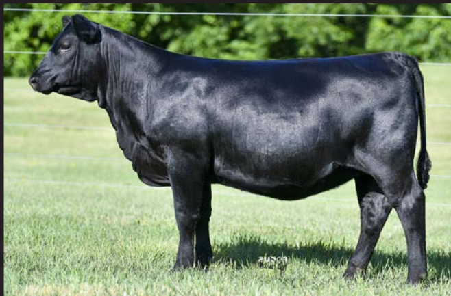
Brumfield Lady Stallion 9820