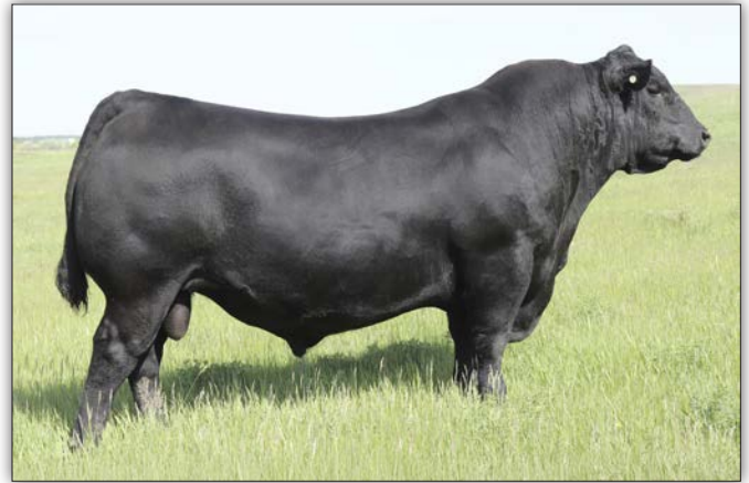
SAV Courage 3003 - Sire of Lot 275

We start off this fall calf division with an outstanding WSC Independence female that goes back to the great Belle cow family. Lot 274 has nice growth figures, nice fertility scores, balanced carcass traits, and five dollar figures in the top 10% of the breed.