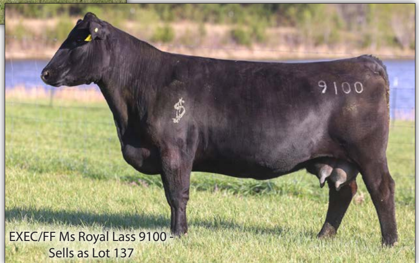
EXEC/FF Ms Royal Lass 9100 - Sells as Lot 137