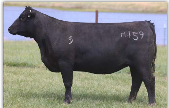
WSC Jilt M159 - Sells as Lot 42

Another outstanding low birth weight prospect by Reclaim, one of the newest herd sires for the Wall Street Cattle Company. M228 has double-digit CED and a negative BW, excellent YW, top 5% HP, top 1% Functional Longevity, excellent docility, perfect foot scores, top 15% CW, with big-time $Values. Due on 11/14/26 to WSC Phantom.