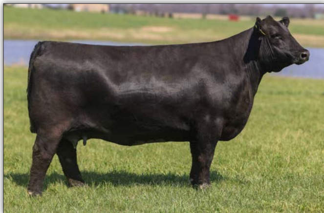
G-C Blackbird of 5D76 8D92 - Sells as Lot 97

Here's another one of the top donors in the program with a very good production record of BW 2@81 and YW 1@116 ratios. This young female will enter the donor pen for her new owner. 8D92 has top 10% YW, top 5% CEM, excellent milk, controlled mature height, nice foot scores, top 4% CW, top 1% RE with outstanding SValues. Sells with a bull calf at side Lot 97A, Tag P072 born on 3/25/26. PE to Voss Maximus on 4/10/26 until sale day.