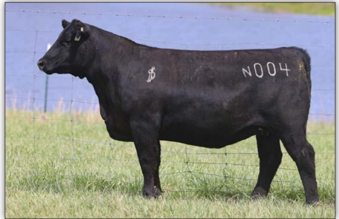
WSC Lucy N004 - Sells as Lot 14

Here's another member of the great Lucy tribe, cattle well known for covering all the bases. This young Guru daughter excels for convenience traits and mothering ability. N004 has excellent BW, top 5% for HP, excellent CEM, controlled mature height, top 10% PAP, top 20% MARB, with elite $Values.