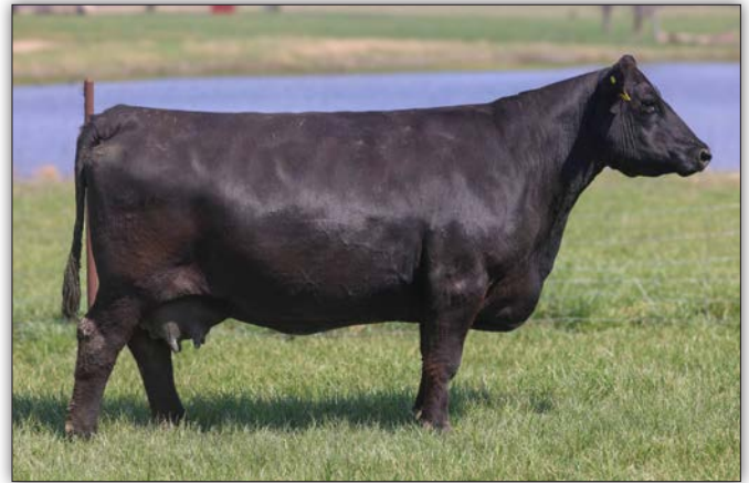
Ruth S S Z63 - Sells as Lot 55

What an exciting chance here to buy the great Ruth Z63 herself. These kind of opportunities only come along in an event like this. Z63's production record is at 6@108 WW, 3@108 YW, 20@112 IMF, 21@102 RE, and 21@100 Fat. Z63 has a double-digit CED with outstanding BW, very good HP, controlled mature height, top 3% MARB, with outstanding $Values. Sells with a bull calf at side Lot 55A, Tag P099 born on 4/14/26 by Blairs External Law. PE to Voss Jesse James from 4/13/26 until sale time.