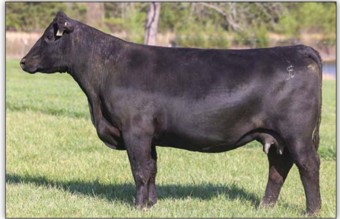
WSC Rita K179 - Sells as Lot 163

Another elite daughter of Iron Horse that traces back to GAR Prophet, so you can expect outstanding carcass from this young female. K179 has a double-digit CED with top 2% YW, top 1% CEM, very good functional longevity, 2% Docility, 2% CW, top 2% RE, with big-time $Values. Due on 11/9/26 to Gilbert Ice man 110.