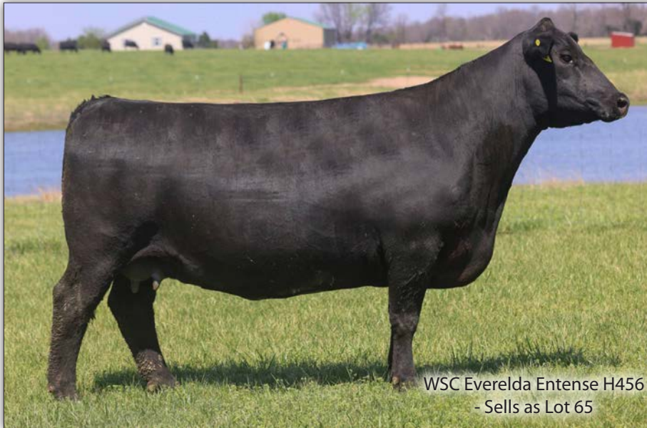
WSC Everelda Entense H456 - Sells as Lot 65