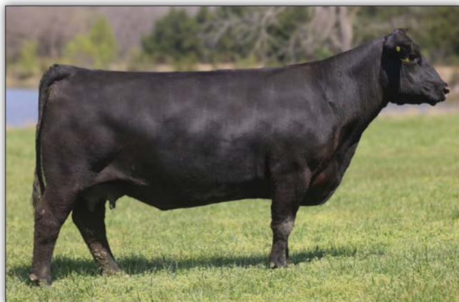
WSC Lady Sig 167-G346 - Sells as Lot 68

Sells with a bull calf at side Lot 68A, Tag P018 born on 2/8/26 PE to Voss Maximus on 4/10/26 until sale time.