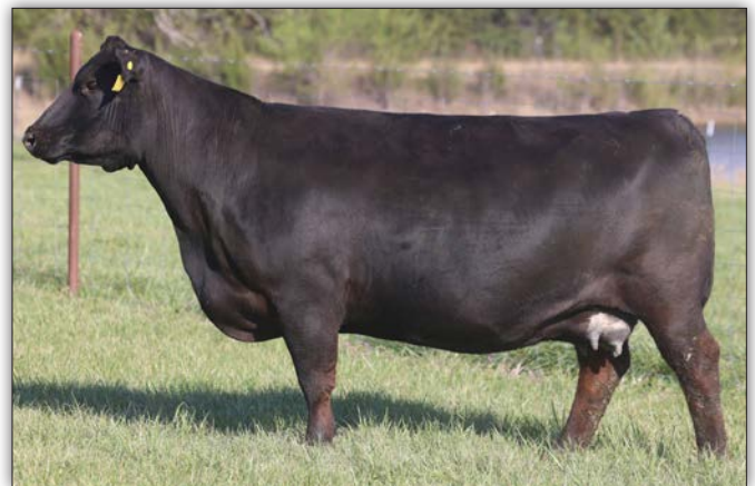
GMAR Stellar G010 - Sells as Lot 141

This special sale attraction was the pick out of 400 heifers from the great GMAR herd in Montana. Stellar has been one of the top bulls for maternal traits in the industry for over five years. G010 has a negative BW, excellent CEM, outstanding teat and udder scores, controlled mature height, excellent foot scores, negative PAP, excellent MARB, with balanced $Values. Due on 10/30/26 to Ellingson Prosper.