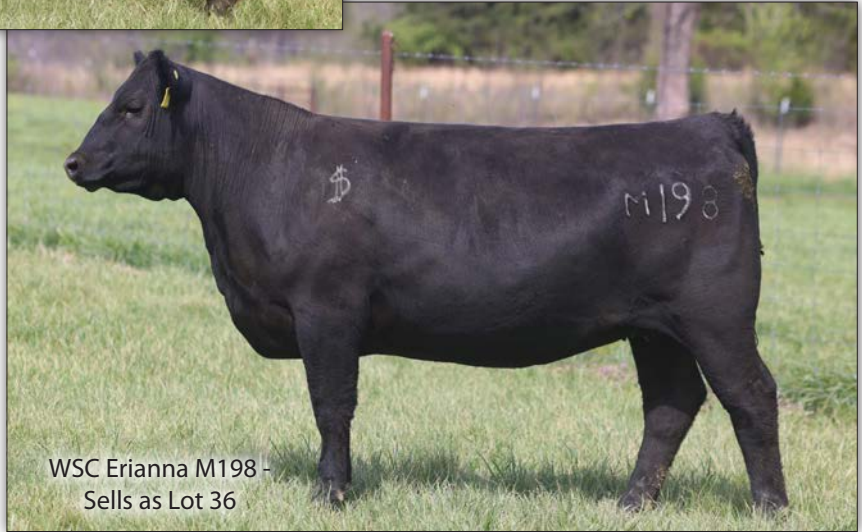
WSC Erianna M198 - Sells as Lot 36

Here's a chance to buy one of the top-performance females in the offering—she has a BW@89, WW@104, YW@100, IMF@112, and a RE@107. This great Signal daughter traces back to the Erianna cow family, one of the top end-product families in the breed. M198 has a double-digit CED with outstanding YW, top 5% CEM, controlled mature height, excellent docility, top 2% RE, with great $Values. Due on 9/20/26 to Wilks Promise Keeper 3709.