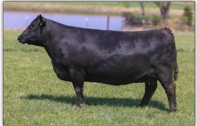
WSC Jilt J140 - Sells as Lot 225

This is another sale attraction that is packed with a growth pedigree. Here is a female that has big-time figures, tons of growth, great teat and udder scores, fantastic foot scores, huge carcass traits, and six $Values in the top 1% of the breed. PE to Voss Maximus from 4-10-26 to sale day.