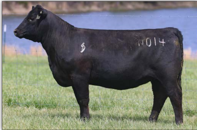
WSC Lady Shire N014 - Sells as Lot 18

This young high-performance female had a WW@103, and traces back to an outstanding Iron Horse daughter in the prime of her life. N014 has a double-digit CED, top 2% YW, excellent scrotal and HP combination, very good CEM, excellent docility, with big-time $Values.