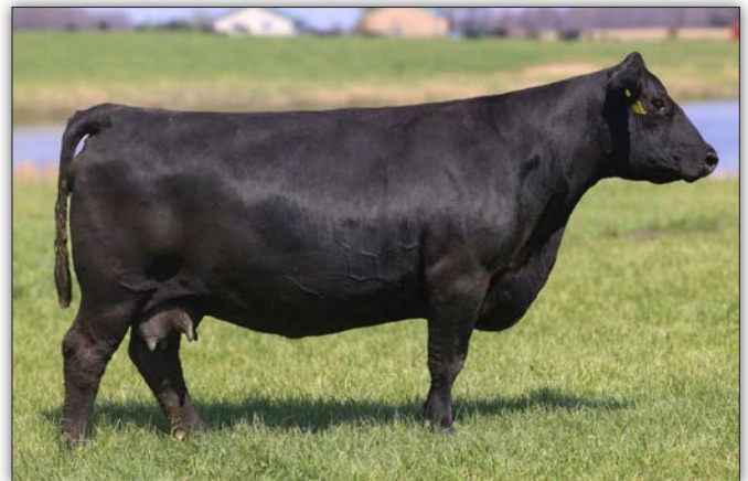
RB Lady Identity 02-3113 - Sells as Lot 52

Sells with a bull calf at side Lot 51A, Tag P093 born on 4/9/26 by WSC Leroy. PE on 4/13/26 to WSC Leroy until sale day.