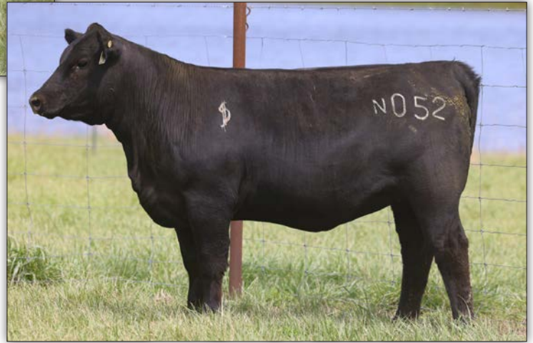
WSC Rita N052 - Sells as Lot 1