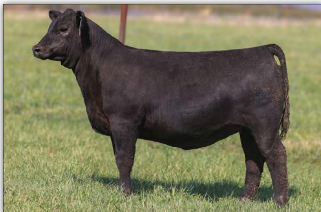
WSC Sandy N219 - Sells as Lot 257