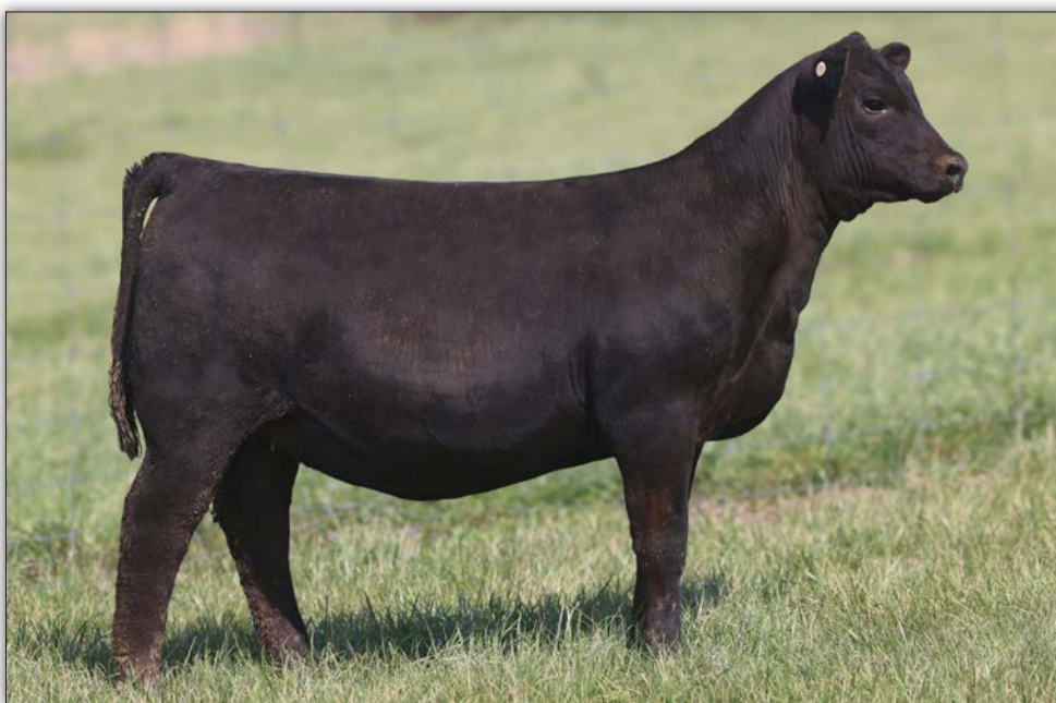
WSC Donna N237 - Sells as Lot 268