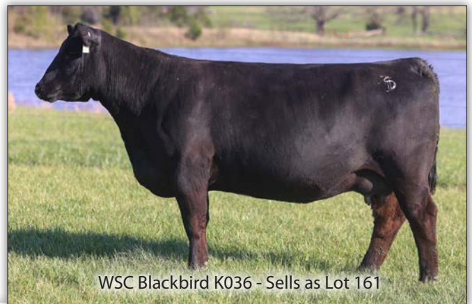
WSC Blackbird K036 - Sells as Lot 161

Another daughter of the $1.5 million SAV America that traces back to the great Basin Lucy family developed in Montana. J866 has top 2% YW, excellent scrotal and HP combination, top 20% Milk, top 1% Docility, 2% CW, with great $Values. Due 11/29/26 to Voss Maximus 2052.