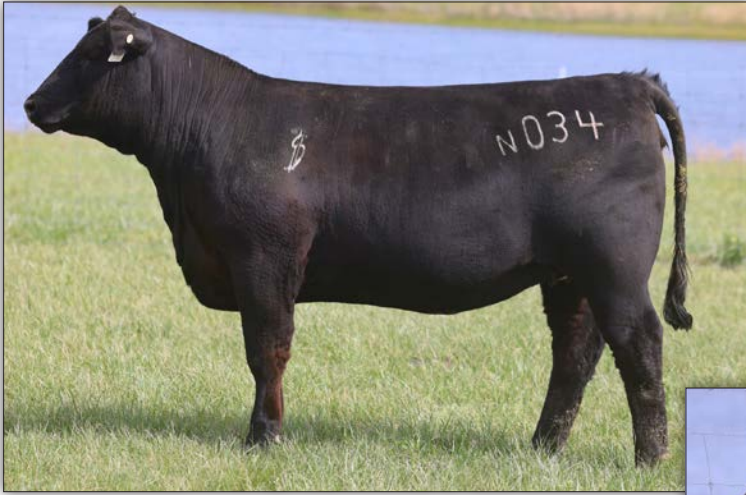
WSC Blackbird N034 - Sells as Lot 4