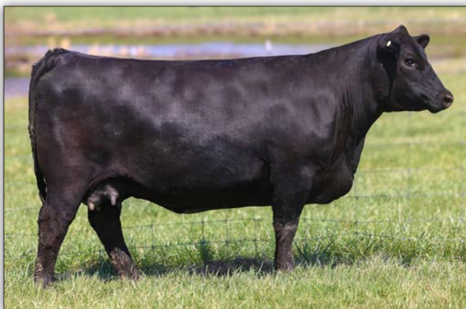
WSC Jilt 490L8 - Sells as Lot 105

Another very special young female that again is adding up a very good production record of BW Ratio 1@94 and WW Ratio 1@112. This young Madame Pride female will surely have outstanding fertility and udder quality. L9963 has outstanding growth, excellent teat and udder scores, controlled mature height, top 20% CW, with balanced $Values. Sells with a bull calf at side Lot 104A, Tag P086 born on 4/4/26. PE to Voss Jesse James on 4/13/26 until sale day.