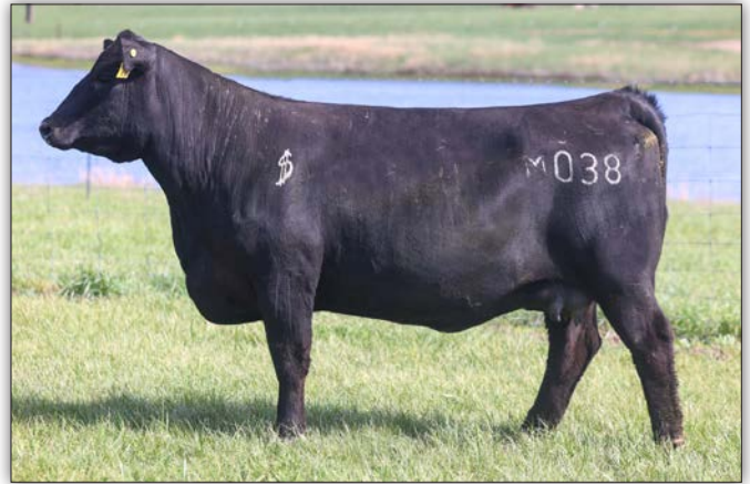
WSC Everelda Entense M038 - Sells as Lot 72

Now here's something that will be very popular sale day. WSC Badger will be one of the highlights on sale day as his calves have been the most sought after since his first year. M038 has a double-digit CED with outstanding YW, excellent HP, top 5% CEM, very good foot scores, top 10% RE, with very good $Values. Sells with a bull calf at side Lot 72A, Tag P023 born on 2/10/26 (Reg-21564937) PE to WSC Leroy 4/13/26 until sale time.