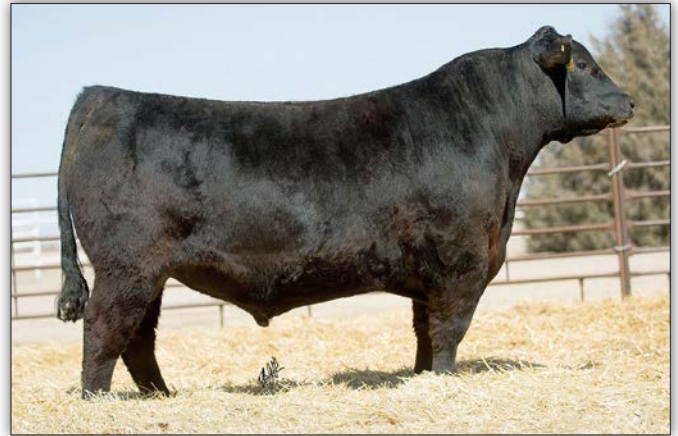
Poss Deadwood - Grandsire of Lot 277

Here is an outstanding Independence daughter with both great physical look and a EPD set that all cattlemen will love.