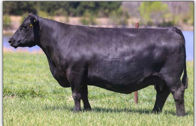
WSC Lady Sig 167-6353 - Sells as Lot 74

Now here's a proven matron that has had quite a production record with BW Ratio 6@101, WW Ratio 5@99, YW Ratio 1@100. 6322 has a double-digit CED, very good scrotal and HP combination, excellent milk, controlled mature height, top 10% Docility, top 10% CW, with great $Values. Sells with a bull calf at side Lot 73A, Tag P024 born on 2/10/26 (Reg-21564914) PE to Voss Maximus on 4/10/26 until sale day.