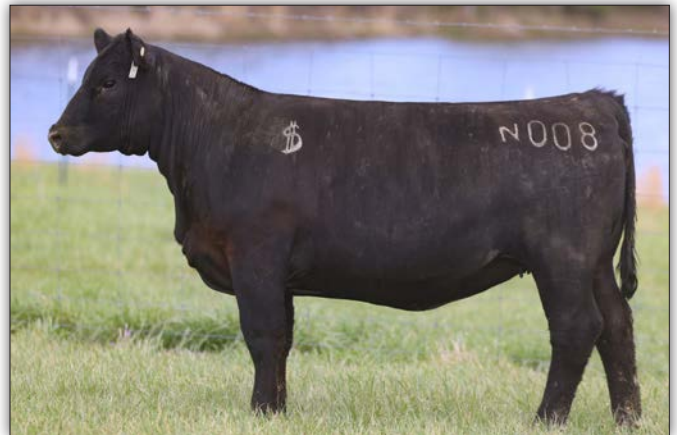
WSC Lady Shire N008 - Sells as Lot 17

Big-time performance heifer out of the new young sire WSC Shire, tracing back to one of the great Exemplify daughters on the ranch. Exemplify has done great things for the industry, and he has proven to be a sire that can make females as well as his bulls. N071 has top 1% YW, excellent scrotal, top 2% Foot scores, top 1% RE & CW, with big-time breed leading $Values.