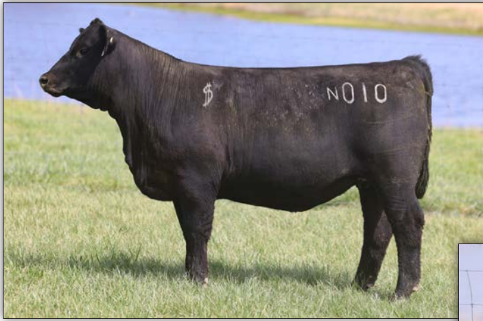
WSC Joy N010 - Sells as Lot 7