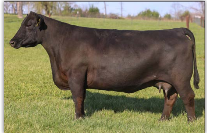
Galaxy Blackbird 7255 - Sells as Lot 202

very good Southside daughter that traces back to Galaxy Blackbird, a cow family well known for outstanding females. 7255 has top 1% YW and WW, outstanding scrotal and HP combination, top 20% CEM, nice functional longevity, top 10% Docility, 4% CW, with big-time $Values. PE to Gilbert Icmann from 4/10/26 until sale day