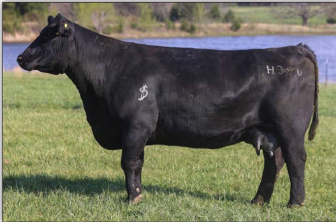
WSC Jilt H396 - Sells as Lot 205

The Mohnen Jilt cows are as good of mama cows you'll find anywhere in the country. PE to Gilbert Ice man from 4-10-26 until sale day.