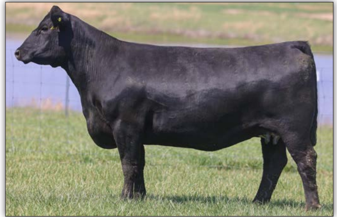
WSC Lady L9021 - Sells as Lot 229

Another high-growth Iron Horse daughter that will put the pounds on a calf crop. She has a top 1% for WW and YW, top 4% for SC, negative PAP, with very-balanced carcass and $Values. PE to WSC Jessie James from 4-13-26 to sale day.