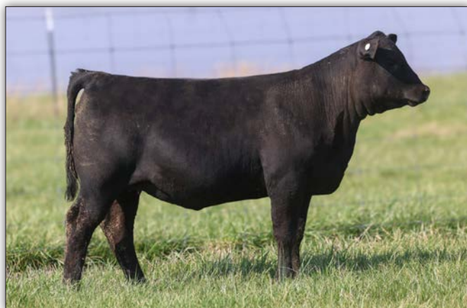
WSC Jilt N251 - Sells as Lot 267