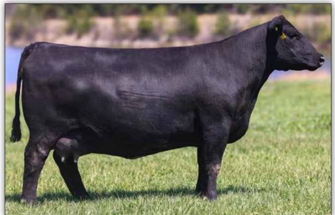
Byergo Elia 7641 - Sells as Lot 83

A young Portside heifer in the prime of her life that traces back to one of the top donors in the program, 8233, that has topped numerous sales in the past. J825 has top 10% YW, excellent scrotal and HP combination, controlled mature height, top 1% Docility, excellent foot scores, with big-time $Values. Sells with a heifer calf at side Lot 80A, Tag P036 Born on 2/15/26 (Reg-21564926) PE to Voss Maximus 4/10/26 until sale day.