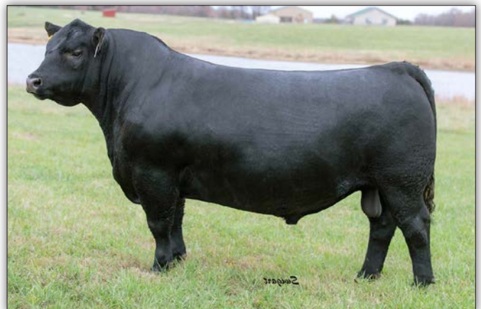
Bigk/WSC Iron Horse 025F - Maternal Grand sire of Lot 13

This special sale highlight is a Crystal Clear daughter traces back to the great WSC Harley, who was purchased by Hart Angus of South Dakota. Harley had a very successful career siring cattle that flesh extremely well with a ton of Angus power. This female has big production figures with great birth-to-growth, with balanced carcass and $Values.