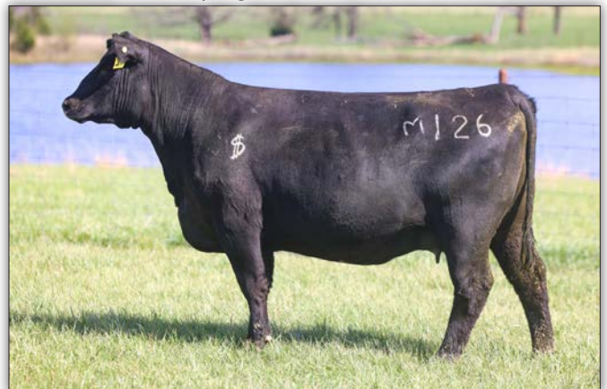
WSC Lady M126 - Sells as Lot 76

And here is a big-time sale highlight that is a direct daughter of the $300,000 Lady Party 167-305, by the $150,000 VAR Signal 7244. This young female is also a maternal sister to the $10 million producing RB Lady Denver 453. G353 has top 1% WW and YW, very nice scrotal and HP combination, excellent docility, top 1% CW, with balanced $Values. Sells with a heifer calf at side Lot 74A, Tag P025 born on 2/10/26 (Reg-21564917) PE to Voss Maximus on 4/10/26 until sale day.