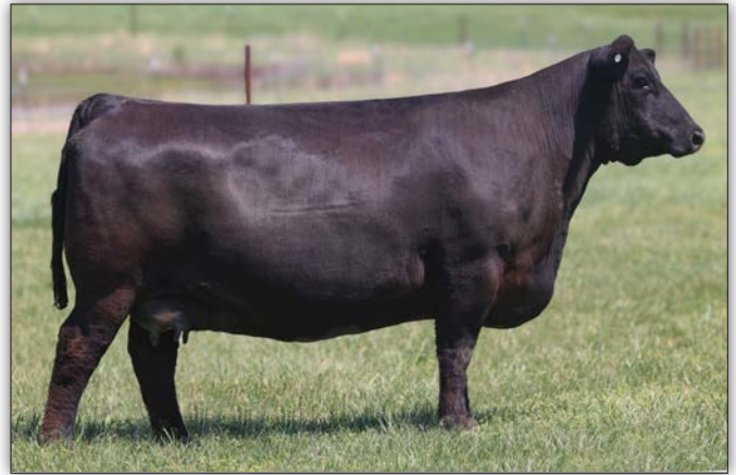
Wilks Blackcap 2044 - Sells as Lot 84

Ultra good looking Exclusive daughter in the prime of her life. This one traces back to the same cow family that brought us Quaker Hill Rampage. 2044 has a double-digit CED and negative BW, very good scrotal and HP combination, top 5% CEM, very controlled mature height, top 15% MARB, with nice $Values. Sells with a heifer calf at side Lot 84, Tag P058 born on 3/10/26 (Reg-21564912) PE to Voss Maximus on 4/10/26 until sale day.