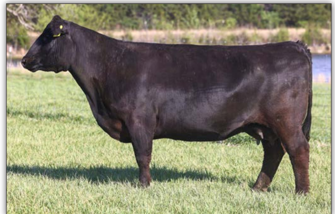
EF Blackcap 7614 - Sells as Lot 187

Very nice old-school pedigree bringing Cowboy Up and Discovery to the front. 7614 has tremendous YW, excellent scrotal and HP combination, nice functional longevity, excellent claw, top 5% CW, top 10% MARB, with very good $Values. Due on 11/19/26 to Voss Jesse James or WSC Boardwalk.