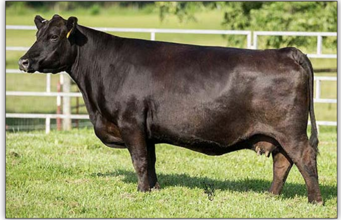
Ruth SS Z63 - Granddam of Lot 283

Here is an absolutely gorgeous Shire daughter back to the great and powerful donor, Ingram Elba 9103.