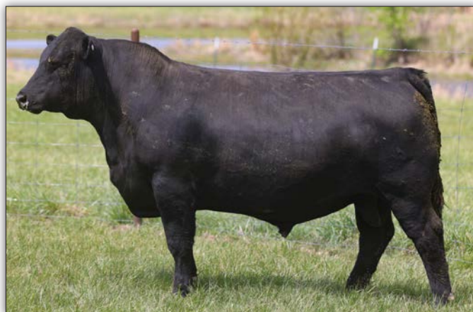
WSC Outfitter M225 - Sells as Lot 243

This age-advantaged yearling son of Bentley truly brings all the bells and whistles to the table, he has outstanding growth with big-time end-product merit. M197 has a double-digit CED with top 5% YW, top 3% CEM, excellent teat and udder scores, top 20% Functional Longevity, outstanding foot scores, top 1% RE, with great $Values.