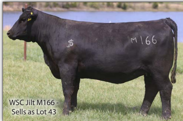
WSC Jilt M166 - Sells as Lot 43

Here's a chance to buy a young Isabell female in the prime of her life that traces back to the great Sampson. R2948 has top 10% YW, excellent scrotal and HP combination, outstanding teat and udder scores, top 20% Docility, top 15% MARB, with balanced $Values. Due on 9/20/26 to Basin Macallan 4179.