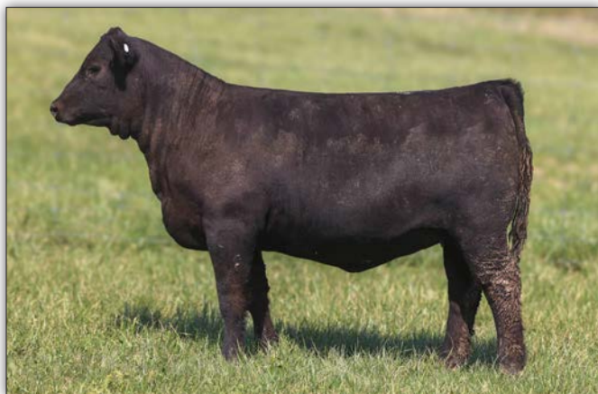
WSC Sandy N228 - Sells as Lot 256