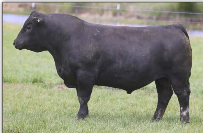
WSC Iceman M355 - Sells as Lot 252

Another excellent Gilbert Iceman son that traces back to the same Lady Rumpage 5497—a cow that was well known for power in this herd. M353 has very-good YW, excellent scrotal, very-good milk, controlled mature height, top 15% CW, with balanced $Values.