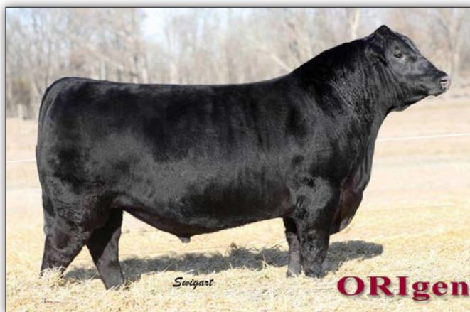
Linz Exemplify 71124 - Sire of Lot 237

Here is another very good sire that's been walking the pastures at Wall Street. He is, of course, a son of the great VAR Signal—one of the most dominant bulls to ever breed here. J153 has a top 2% CED, excellent YW, top 1% CEM, excellent mature height, very good foot scores, nice CW, with great $Values.