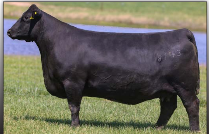
SAV Emblynette 8143