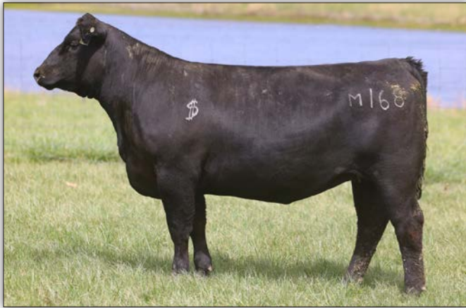
WSC Ms Nobility M168 - Sells as Lot 32