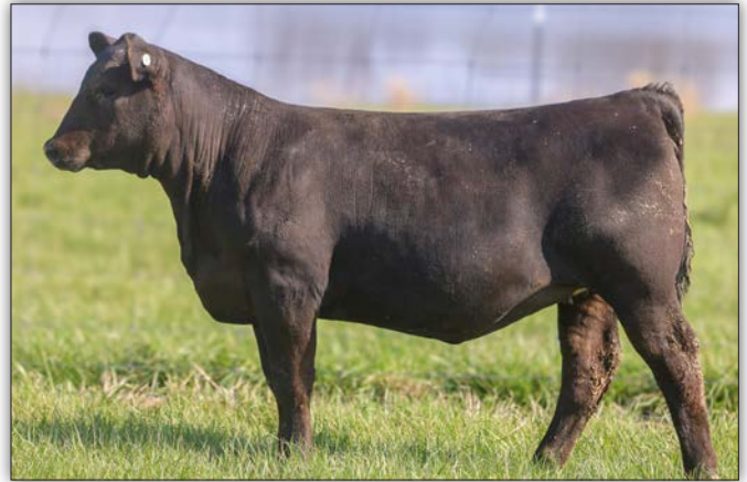
WSC Sandy N214 - Sells as Lot 258