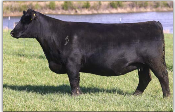
WSC Jilt J032 - Sells as Lot 145

Another special sale highlight by LinZ Exemplify, a bull that has gone on and re-written the history books when it comes to phenotype and genotype combination. Exemplify has won the national PGS show four different times. H453 has outstanding YW, top 5% Milk, controlled mature height, top 3% CW, top 10% MARB, with outstanding $Values. Due on 9/20/26 to GA Alter 4113.