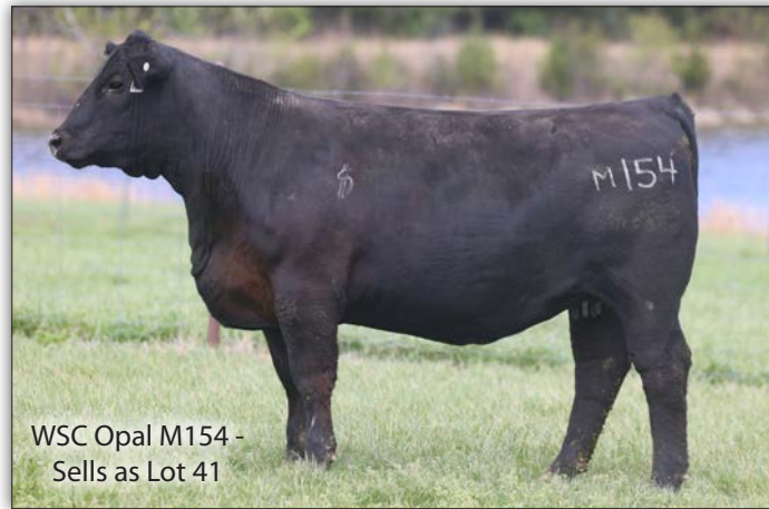
WSC Opal M154 - Sells as Lot 41

Here is our first female by Voss Maximus 2052, the high-selling bull from the 2023 Voss bull sale. Maximus is appreciated by all who see him for his incredible herd sire look with ultimate power. M154 has top 2% YW, excellent scrotal, top 10% Milk, top 1% CW, top 5% RE, with very nice $Values. Due on 9/20/26 to Basin Macallan 4179.