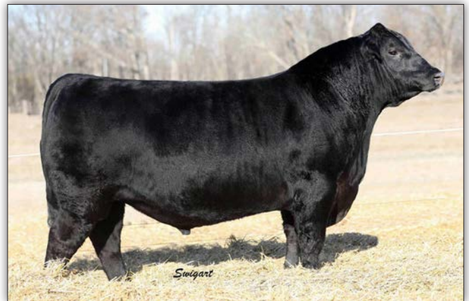
Linz Exemplify 71124 - Grandsire of Lot 284

Another great Bentley daughter that traces back to the top donor dam in the Wall Street program, Ogeechee Discovery 569.