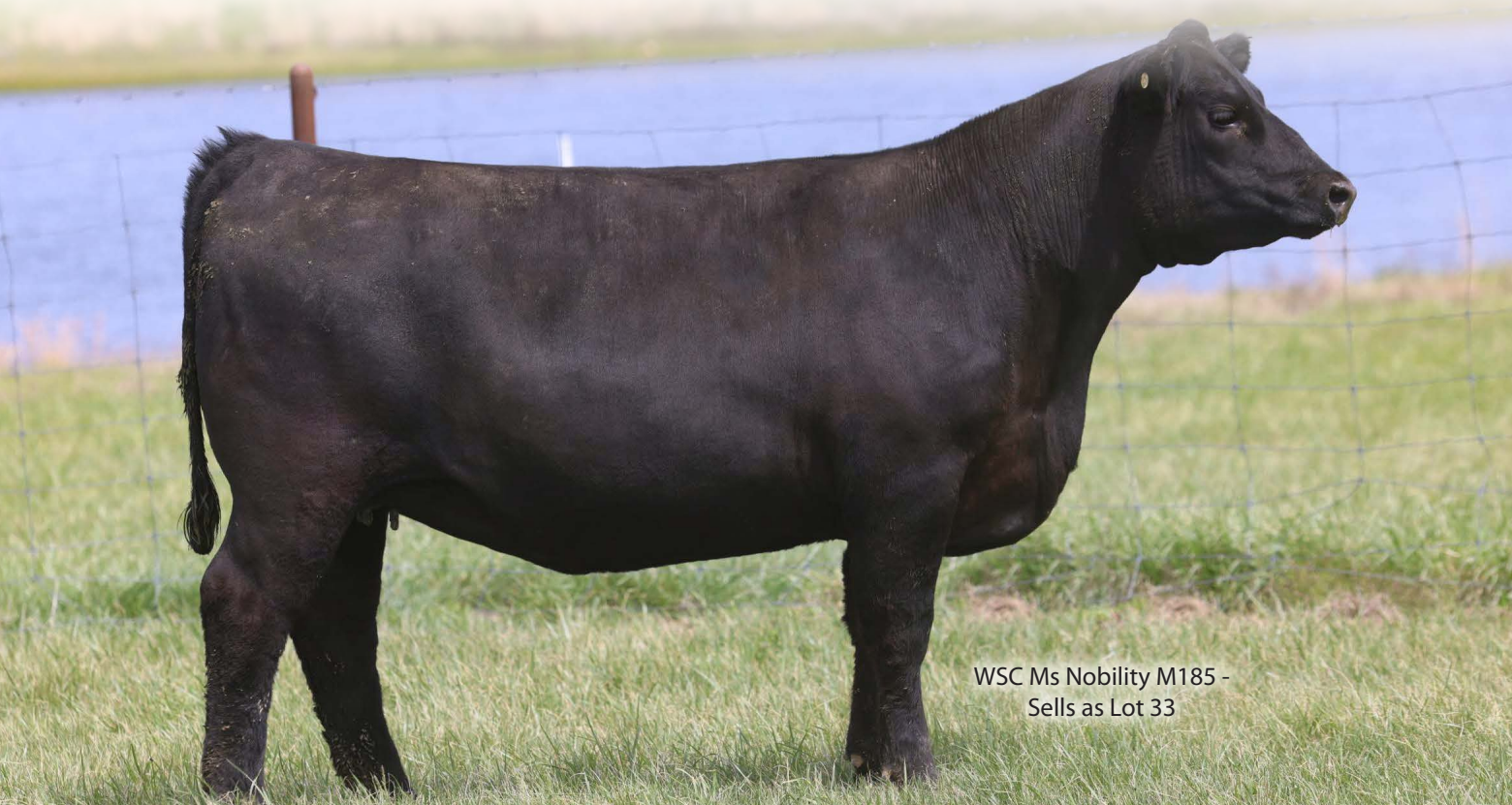
WSC Ms Nobility M185 - Sells as Lot 33

Another high-performing daughter of Nobility that had a YW@107, IMF@99, RE@112, from a dam that has 6@108 WW, 3@108 YW, 20@112 IMF, 21@102 RE, with 21@100 Fat. This young female will continue on the high performance that the Ruth family is known for. M185 has very good CED, controlled mature height and mature weight, very good foot scores, with balanced $Values. Due 9/20/26 to Wilks Promise Keeper.