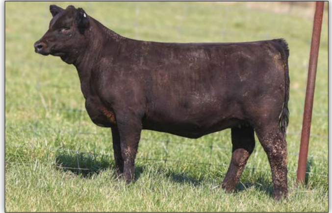
WSC Sandy N200 - Sells as Lot 259