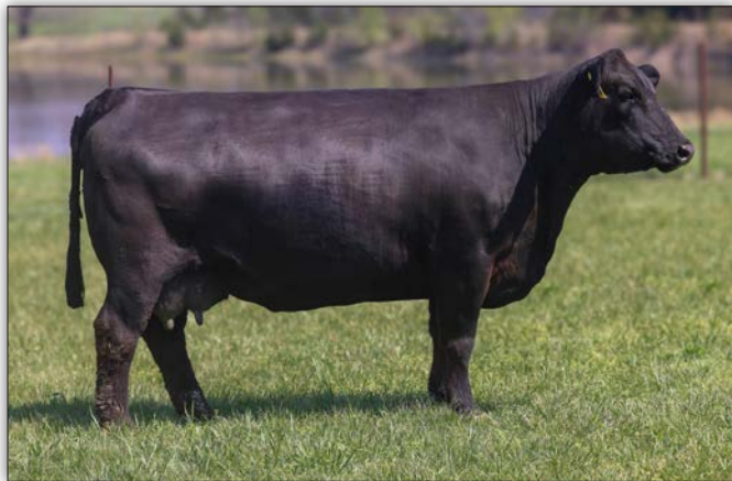
WSC Erianna J156 - Sells as Lot 101