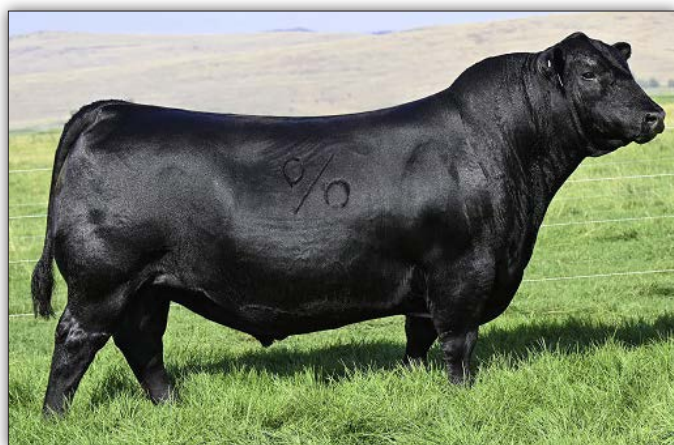
Coleman Glacier 041 - Sire of Lot 268