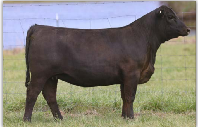
WSC Lady External Law N001 - Sells as Lot 15

Now here's a young female with very blended genetics—the great Duff program combined with the mighty Lady family largely known for outstanding growth females. N001 has big-time scrotal, very controlled mature height, excellent PAP, with balanced $Values.