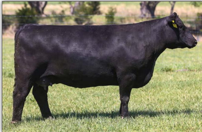
WSC Blackcap 93K - Sells as Lot 85