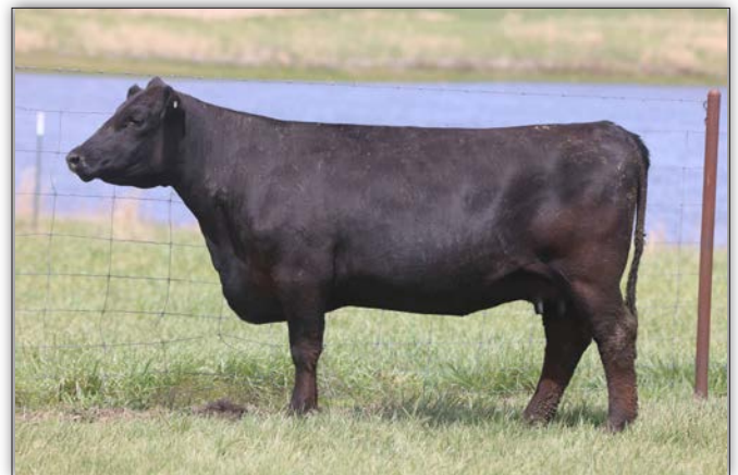
WSC Ruth K400 - Sells as Lot 223

PE to Voss Maximus from 4-10-26 to sale day.