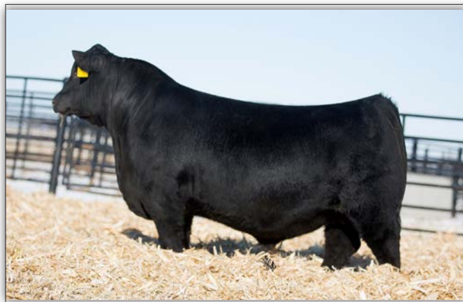
Voss Maximus 2052 - Sells as Lot 233

Another really-attractive herd sire that traces back to the great SAV Black Cap May 2397. Gilbert Iceman has been a sire here for the past three seasons, and his cattle are tremendous phenotypically and genomically. 110 has very good YW, top 4% Scrotal, excellent milk, outstanding teat and udder scores, very good foot scores, top 15% CW, with balanced $Values.