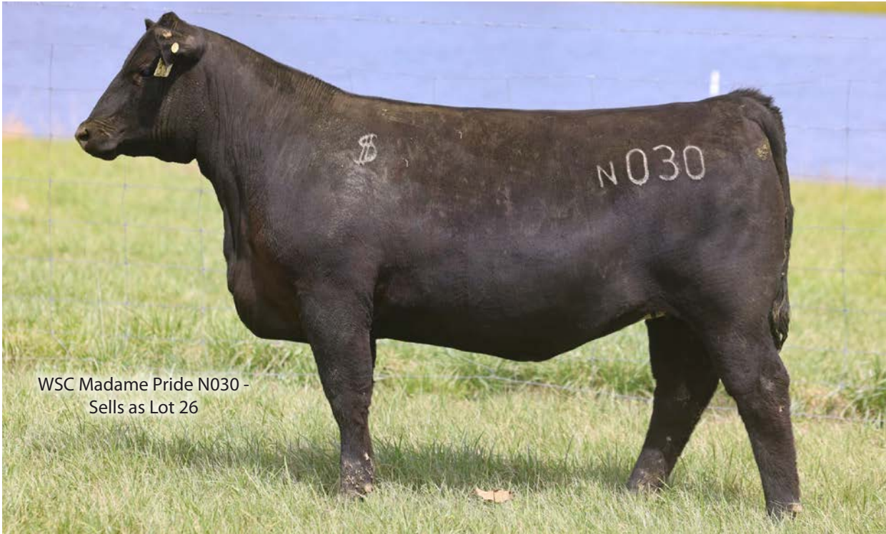
WSC Madame Pride N030 - Sells as Lot 26