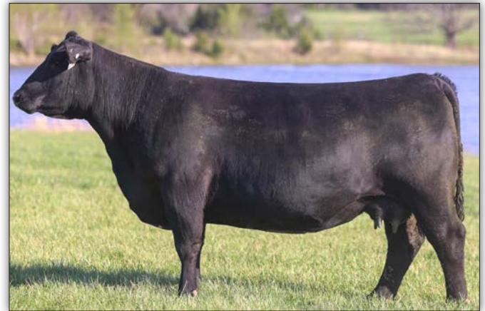
Brumfield Lady Rainfall 1118 - Sells as Lot 182

Due on 12/9/26 to Gilbert Iceman 110 or WSC Shire.