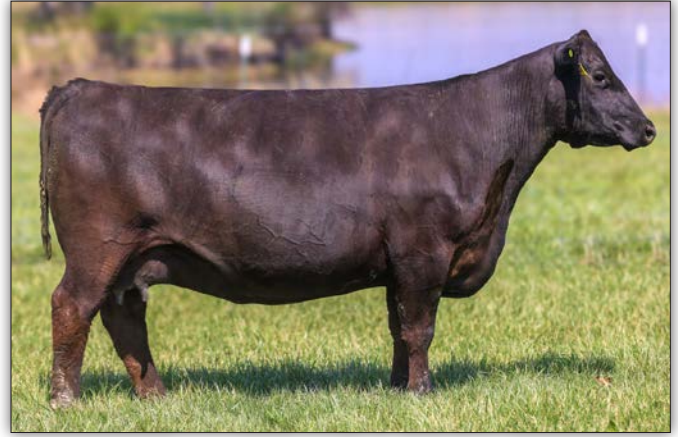
WSC Lucy J831 - Sells as Lot 53

Sells with a heifer calf at side Lot 49A, Tag P091 born on 4/9/26 by WSC Leroy. PE to WSC Leroy from 4/13/26 until sale.