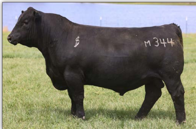
WSC Maximus M344 - Sells as Lot 254