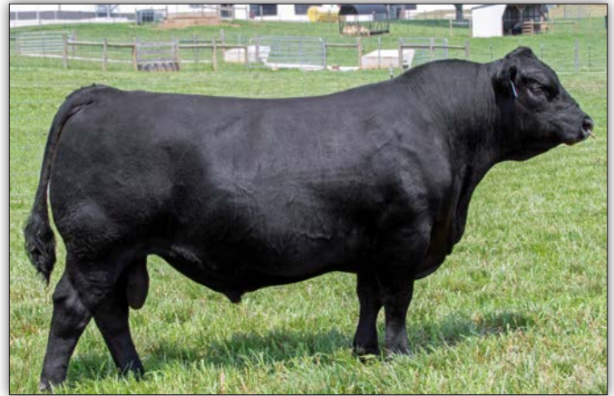
BNWZ Nobility 1202 - Sire of Lots 32 and 33