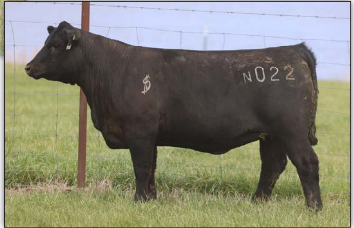
WSC Joy N022 - Sells as Lot 8