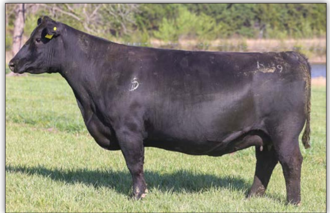
WSC Emblynette H490 - Sells as Lot 192