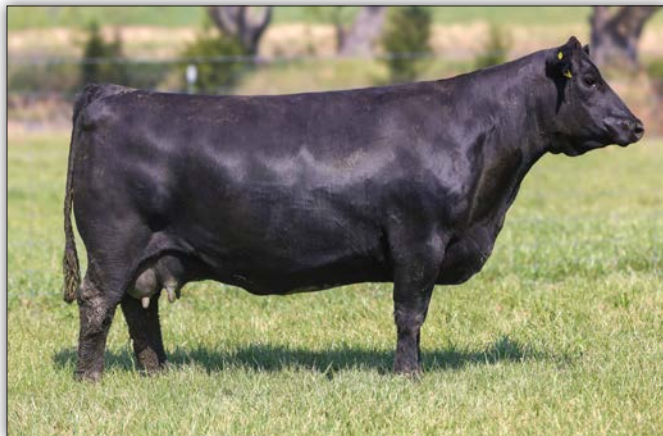
WSC Ruth J308 - Sells as Lot 96

Very interesting pedigree with a combination of SAV America to the great Ruth Z63—the top the donor in the entire program. J308 has very good growth, excellent scrotal, controlled mature height, top 20% MARB, with nice SValues. Sells with a heifer calf at side Lot 96A, P071 born on 3/25/26. PE to Voss Jesse James on 4/13/26 until sale day.