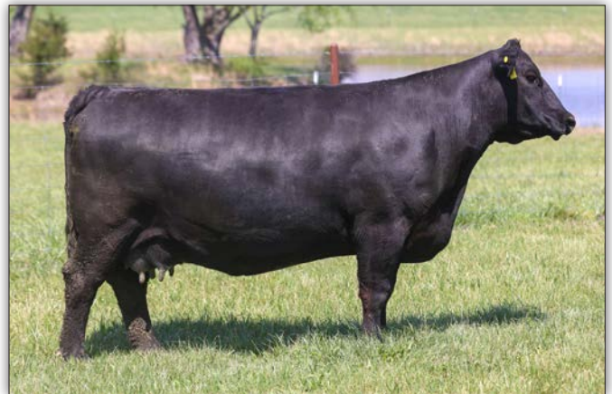
WSC Blackbird H802 - Sells as Lot 98

Very exciting young female here by Signal tracing back to the great Galaxy Blackbird 2102, one of the top cows in their program. H802 has top 1% YW and WW, top 2% Scrotal, top 10% HP, top 1% CW, with outstanding SValues. Sells with a bull calf at side Lot 98A, Tag P074 born on 3/30/26. PE to Voss Jesse James on 4/13/26 until sale day.