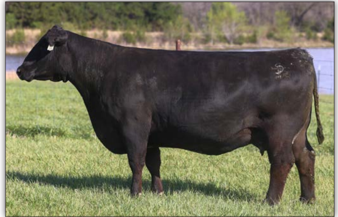
WSC Donna J302 - Sells as Lot 148

Something very interesting here. We have the moderate Donna family back to the stretch and size of Black Magic, and then bring on the power of the great breed-leading Iconic and you get one heck of a female. J302 has top 1% YW, excellent scrotal and HP combination, nice docility, top 2% CW, with great $Values. Due on 9/30/26 to Basin Macallan 4179.