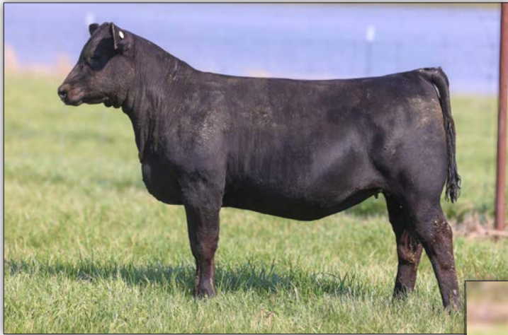
WSC Emblynette N240 - Sells as Lot 261