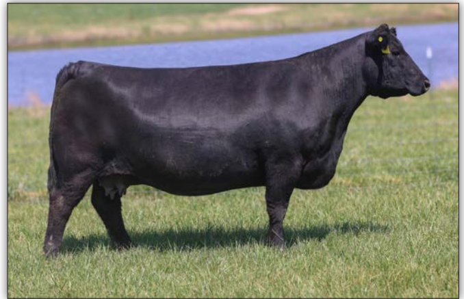
WSC Jilt J038 - Sells as Lot 56

This special Iron Horse female was a direct daughter of the great 3829, one of the best Jilts in the program, and this one has always been a fan favorite. J038 has a double-digit CED with an outstanding BW, top 10% YW, top 5% Scrotal, top 15% CEM, top 10% Functional Longevity, top 1% Docility, top 15% CW, top 1% RE, with outstanding $Values. Sells with a bull calf at side Lot 56A, Tag P100 born on 4/14/26 to Blairs External Law. PE to Voss Jesse James from 4/13/26 until sale day.