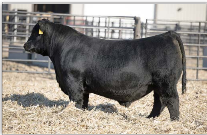
Voss Jesse James 3157 - Sells as Lot 234