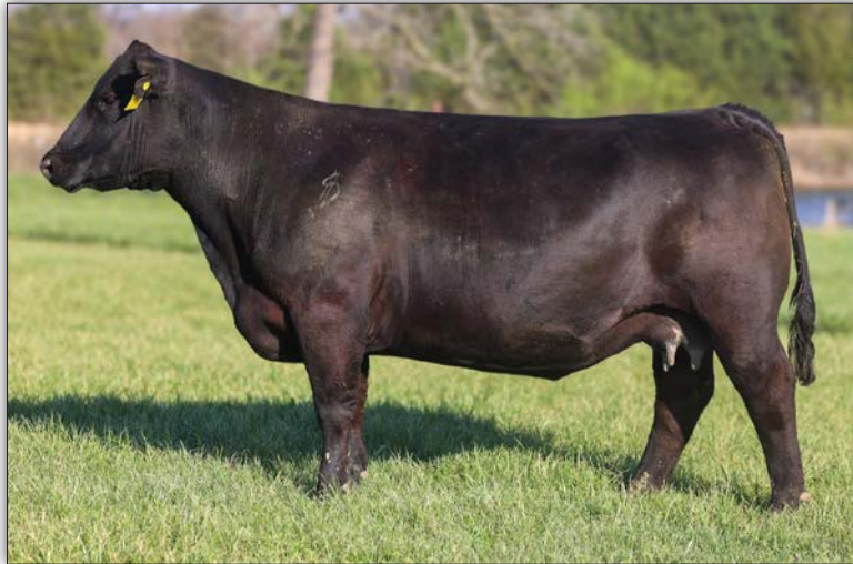
WSC Empress J855 - Sells as Lot 159