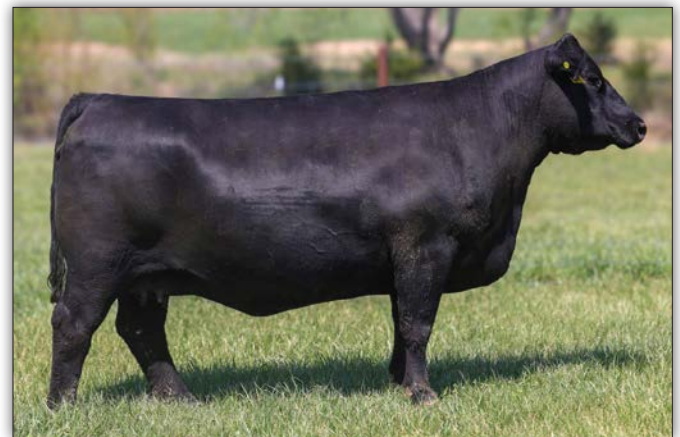
Legend's Donna 080 - Sells as Lot 181