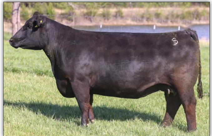
WSC Lady Versatile G001K1 - Sells as Lot 140

Here we are again with a granddaughter of the mighty 3113, believed to be by all the top donor in the program at Wall Street. 3113 had power beyond belief—she was deeply powerful with a ton of bone. G001K1 has top 10% YW, nice HP, controlled mature height, top 1% Docility, negative PAP, top 10% CW, top 10% MARB, with outstanding $Values. Due on 10/20/26 to Ellingson Prosper.