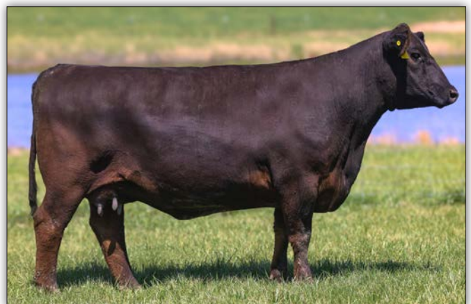
Smith Valley Eline 1508 - Sells as Lot 62

PE to Voss Maximus on 4/10/26 until sale time.