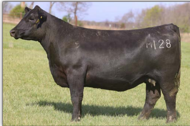
WSC Lady Innovation M128 - Sells as Lot 93

Another outstanding daughter of GMAR Innovation in the prime of her life, ready to go to work for the new owner. This one traces back to Vintage First Lady a family that is well known for end-product merit. M128 has top 1% YW, very good HP nice functional longevity, top 1% CW, with outstanding $Values. Sells with a heifer calf at side Lot 93A, Tag P067 born on 3/20/26. (Reg - 21573192) PE to WSC Leroy 4/13/26 until sale day.