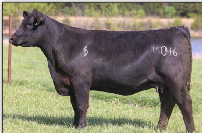
WSC Ruth K394 - Sells as Lot 69

Sells with a bull calf at side Lot 69A, Tag P019 born on 2/8/26 (Reg-21564931) PE to Voss Maximus on 4/10/26 until sale time.