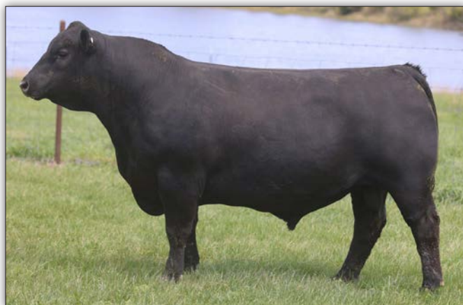
WSC Nobility M158 - Sells as Lot 253

Now here is a unique pedigree with the great Gilbert Iceman tracing back to the EXAR Lucy family that has been a high-income producer for years. M355 has very good growth, excellent scrotal and HP combination, controlled mature height, nice angle, top 25% CW with great $Values.