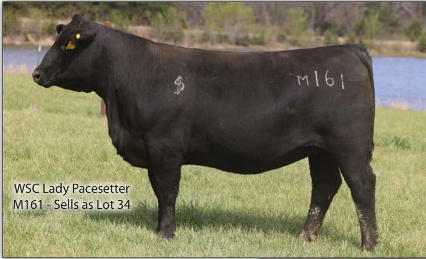
WSC Lady Pacesetter M161 - Sells as Lot 34

This very special sale attraction need no introduction to the Angus world. She is a granddaughter of the $10 million producing Lady Denver 453—a cow that has re-written the record books when it comes to income. M161 has big-time YW, very good scrotal and HP combination, nice foot scores, top 2% CWD with awesome $Values. Due on 11/14/26 to WSC Phantom.