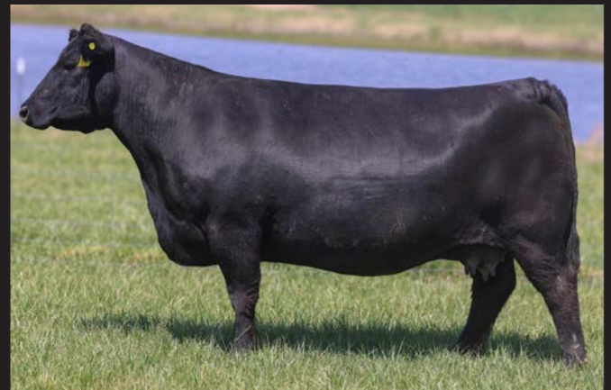
WSC Jilt J038