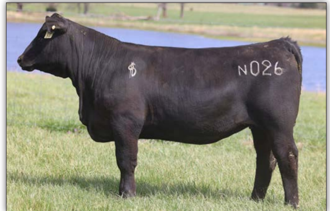
WSC Lucy N026 - Sells as Lot 29

Here's another high-performance daughter of Badger that has a ratio of 106@WW. These Badger daughters are really getting it done when it comes to genotype and phenotype. N026 has top 5% YW, excellent scrotal and HP combination, very good CEM, controlled mature height, excellent foot scores, top 10% CW, with big-time $Values.