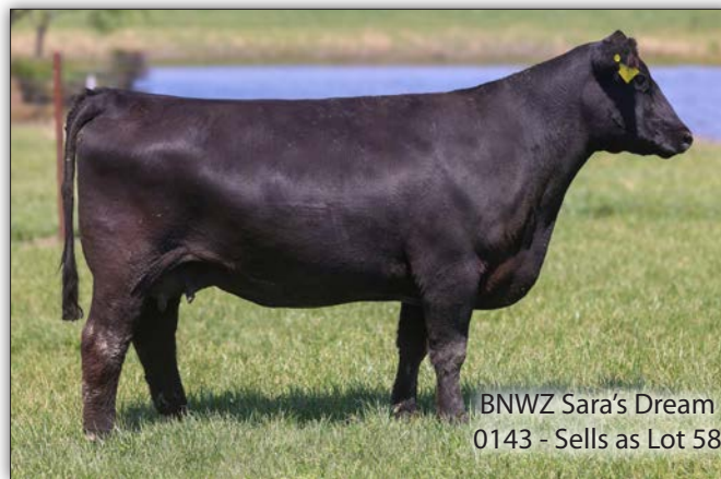
BNWZ Sara's Dream 0143 - Sells as Lot 58

PE to Voss Maximus 4/10/26 until sale time.