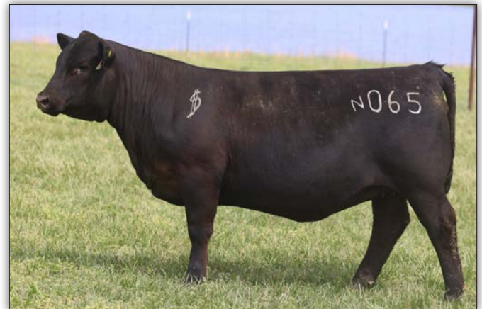
WSC Lady Shire N065 - Sells as Lot 19

A Shire daughter that is passing on the tradition for fertility scores from the great Rita Family. N066 has top 3% YW, excellent scrotal and HP combination, very good teat and udder scores, very good foot scores, excellent docility, with big time carcass and $Values.