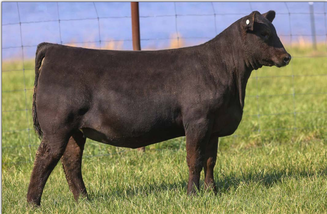
WSC Madame Pride N217 - Sells as Lot 265