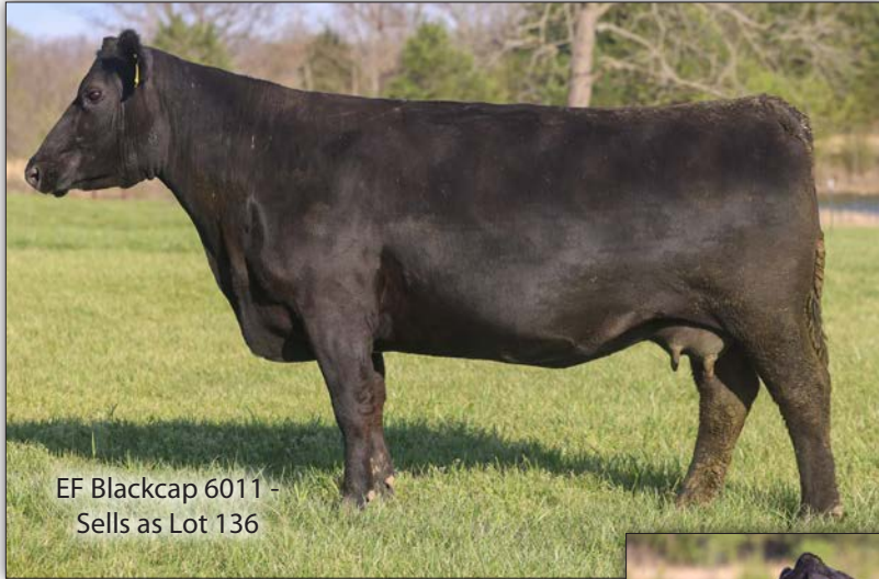
EF Blackcap 6011 - Sells as Lot 136

One of the top donors in the entire program. She has accumulated quite a production record starting with 4@94 BW, 2@101 WW, 10@108 IMF, 10@98 RE, and 10@96 Fat. 6011 is another Discovery daughter that has stood the test of time, and many daughters have been retained in the herd. 6011 has a double-digit CED with a top 10% BW, top 3% CEM, controlled mature height, very nice claw, top 15% CW, top 10% MARB, with breed-leading $Values. Due on 10/330/26 to Ellingson Prosper.