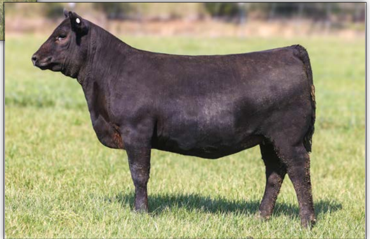
WSC Blackbird N223 - Sells as Lot 263