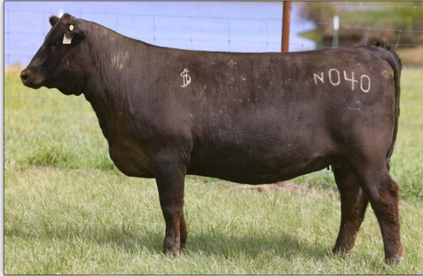
WSC Everelda Entense N040 - Sells as Lot 13