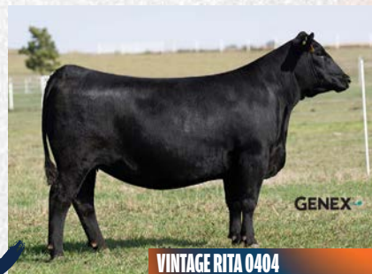
VINTAGE RITA 0404