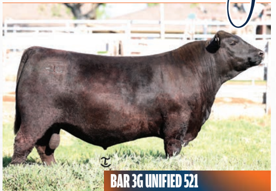
BAR 3G UNIFIED 521

GARONE GENERATION E45 BAR 3G BLACKCAP A42