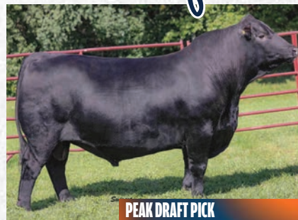
PEAK DRAFT PICK