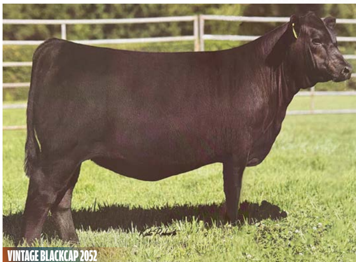
VINTAGE BLACKCAP 2052

OWNED BY VINTAGE ANGUS RANCH Sells due 9/11/26 to Poss Longbow.