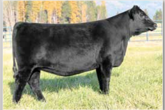
MONTANA LUCY 7003 / A daughter sells as Lot 34.

34 Ankony Miss Lucy C188 [AMF-CAF-D2F-DDF-M1F-NHF-OHF-OSF-RDF] Birth Date: 10-11-2023 Cow #*20767947 Tattoo: C188 #*G A R Sure Fire 6404 #*G A R Sure Fire #*GB Fireball 672 *G A R Complete N281 18690054 *GB Anticipation 432 *G A R Anticipation *GB Ambush 269 #*Quaker Hill Ramage 0A36 #MCC Daybreak #*Montana Lucy 7003 *OHF Blackcap 6E2 of4V16 4355 18800192 *Basin Lucy 1037 #Gardens Wave *Basin Lucy 262S