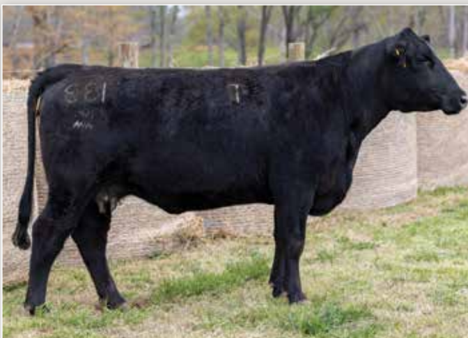
TWO RIVERS FIREBALL T133 / Lot 38