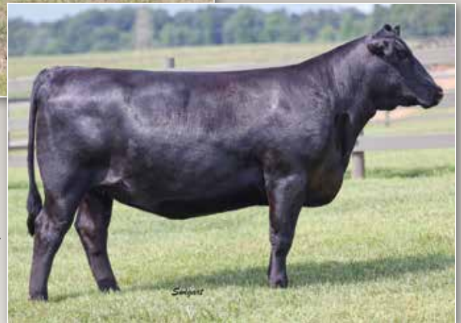
ANKONY MISS LUCY A011 / A daughter of this Circle F Farms donor sells as Lot 40.