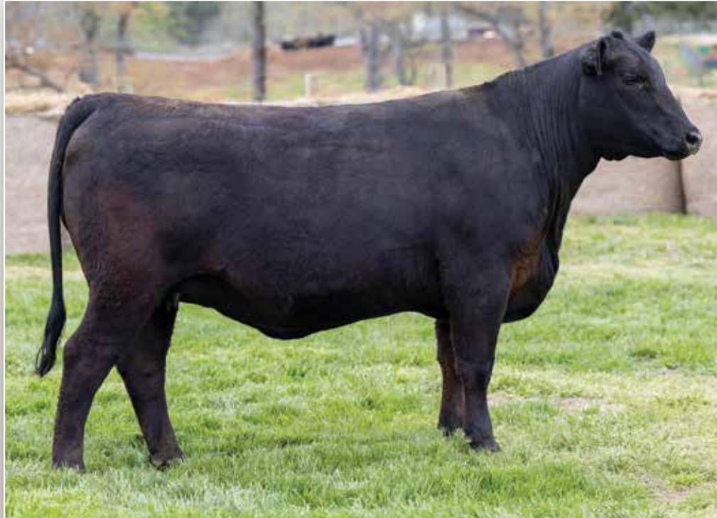
TWO RIVERS VVA PARAGON 11324 / Lot 30