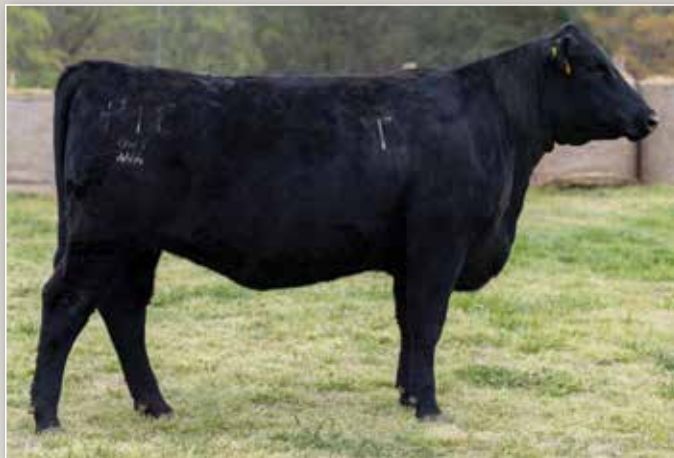
TWO RIVERS FIREBALL T314 / Lot 26