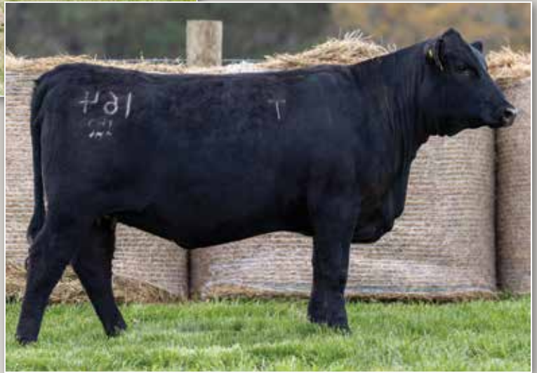
TWO RIVERS FIREBALL T164 / Lot 24