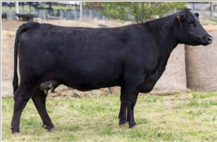
PRIME CAPTAIN 6100 / Lot 8

SELLING HALF INTEREST IN LOT 7 WITH THE OPTION TO DOUBLE