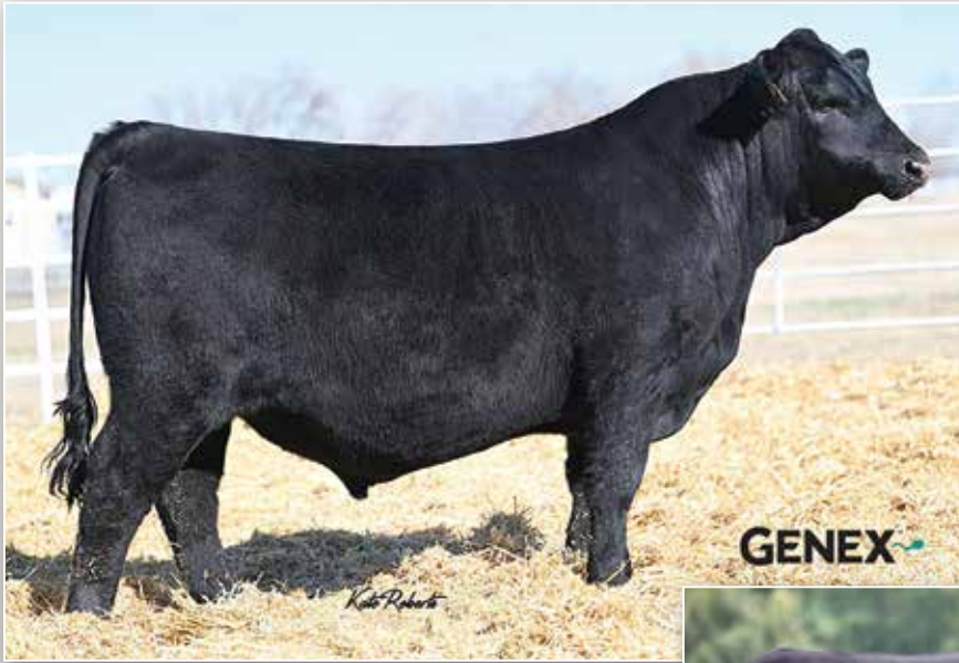
PEAK DRAFT PICK / The multi-trait sire of Lot 31A.