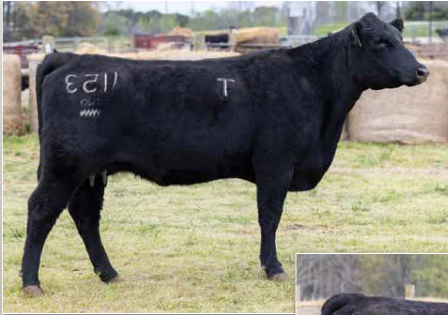
TWO RIVERS HOMETOWN T1153 / Lot 32