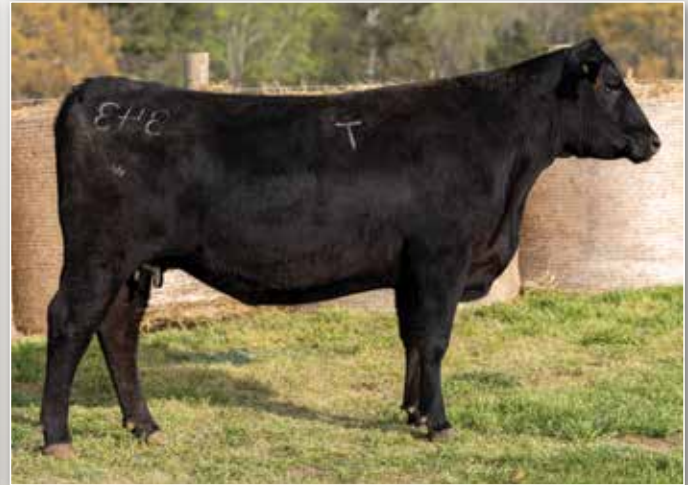
TWO RIVERS HOME TOWN T343 / Lot 37

37 Two Rivers Home Town T343 Birth Date: 08-30-2023 Cow *20737842 Tattoo: T343 #*G A R Ashland #*G A R Early Bird #*Chair Rock Ambush 1018 #*G A R Sure Fire #*Chair Rock Progress 3005 #*G A R Phoenix #*G A R Sure Fire #*G A R Prophet N744 #*G A R Progress #*RWA New Day W043 #*RWA Phoenix W1279 #*RWA Progress W222