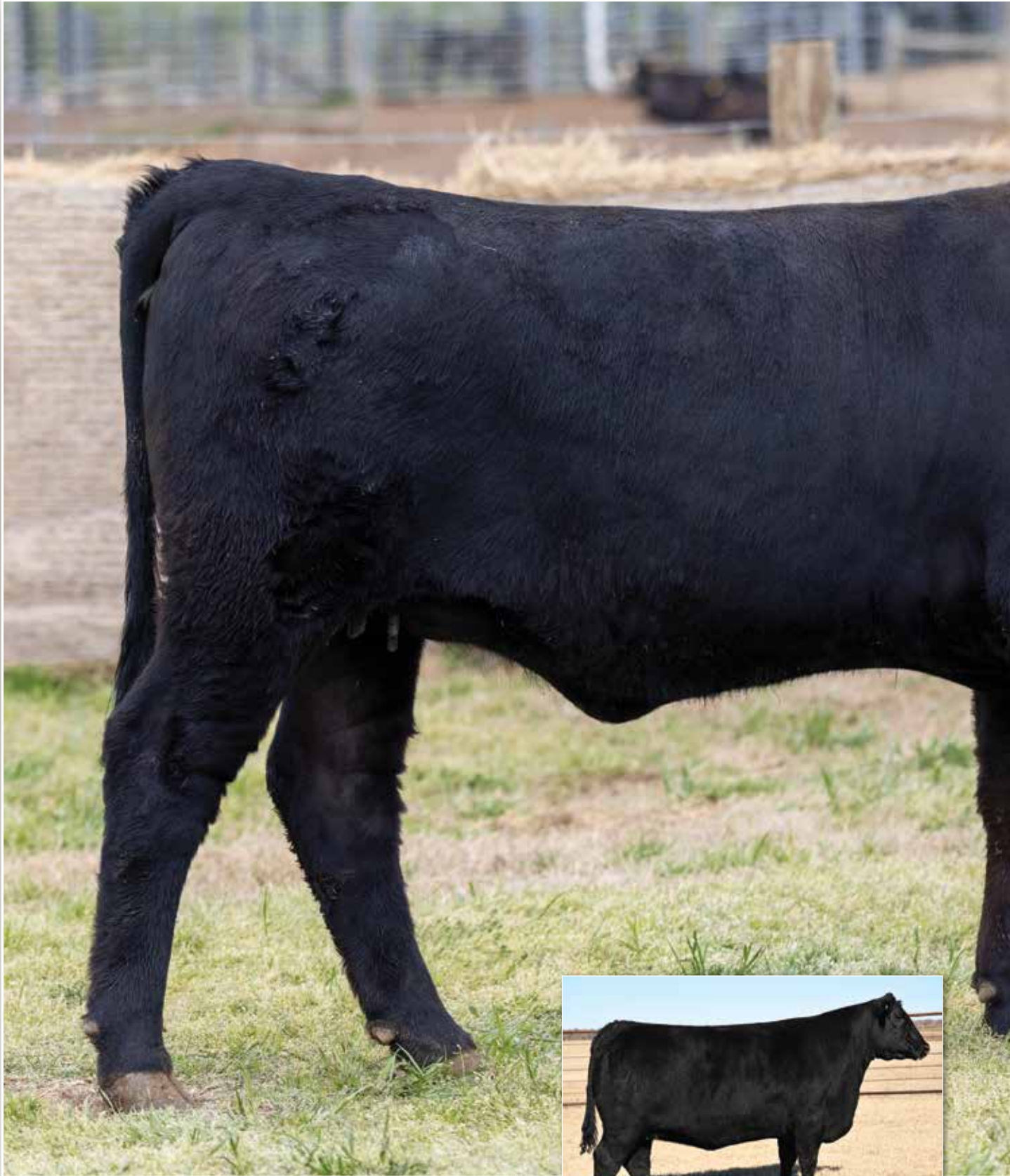
GAR IDENTIFIED 781S / The $430,000 valued grandam of Lot 5 and headliner of the Circle F Farms, Hopson Angus and Hirschy Angus programs.