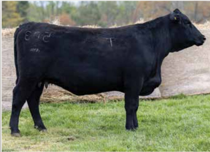
TWO RIVERS FIREBALL T503 / Lot 36

36 Two Rivers Fireball T503 Birth Date: 09-17-2023 Cow *20741575 Tattoo: T503 #*G A R Sure Fire 6404 #*G A R Sure Fire #*G A R Complete N281 #*G A R Anticipation GB Ambush 269 #*G A R Phoenix #*G A R Sure Fire #*G A R Prophet N744 #*G A R Progress #*RWA New Day W043 #*RWA Phoenix W1279 #*RWA Progress W222