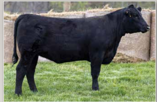
TWO RIVERS FIREBALL T1015 / Lot 18