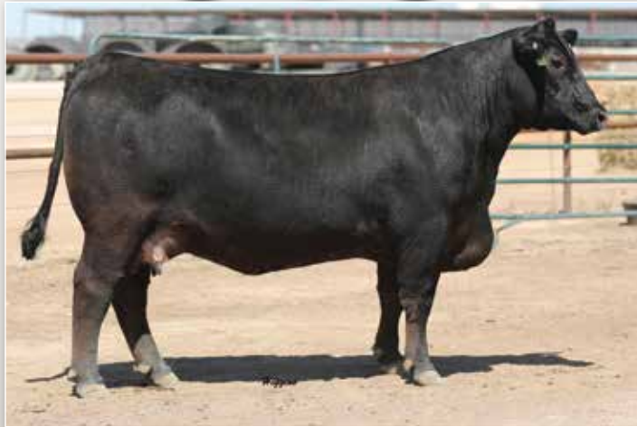
K BAR ACCLAIM 8108 / The powerful and proven third dam of Lot 31D.