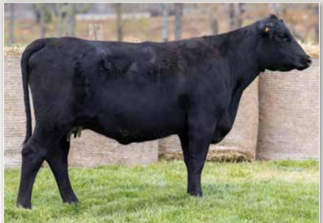
ANKONY MISS BLACKCAP C069 / Lot 35