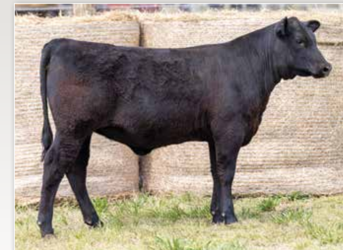
TWO RIVERS PARAGON T1295 / Lot 12

• Paragon T1295 is a growth, Marb., $B and $C female produced by the second-generation Two Rivers female, Peyton T552 and sired by the now-deceased genomic leader of the Ankony Angus, Leachman and Maplebrook Farms programs, Paragon. • Peyton T552, the powerful and prolific Two Rivers donor and dam of Lot 12 blends the longtime Edgewood Angus and Select Sires feature, Peyton with a daughter of the calving-ease specialist, 100X. The dam of Lot 12 records a WR 1@106.