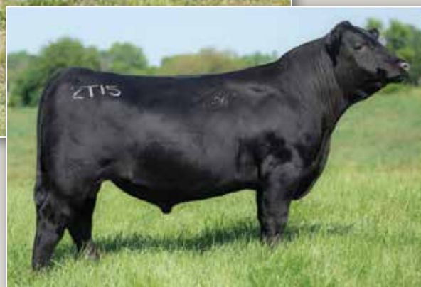
TWO RIVERS VERACIOUS T1213 / Lot 39