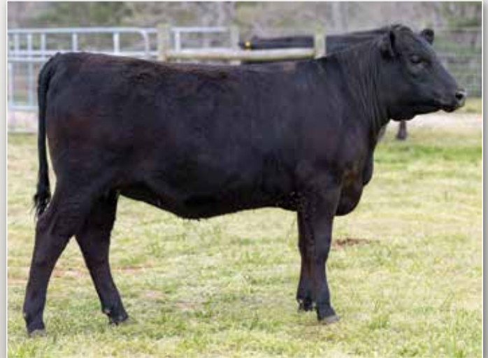
TWO RIVERS PREEMINENT T1215 / Lot 7

SELLING HALF INTEREST IN LOT 7 WITH THE OPTION TO DOUBLE