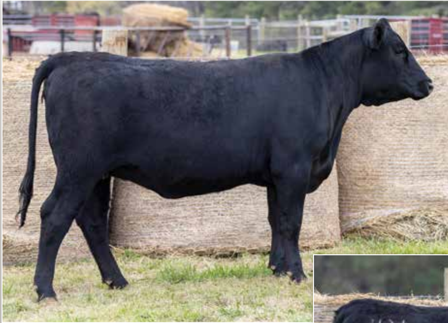
TWO RIVERS FIREBALL T274 / Lot 23