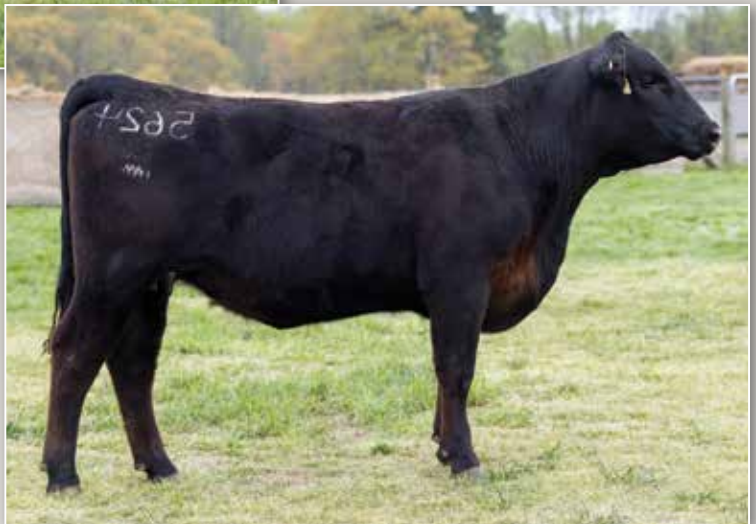
TWO RIVERS NEW PARADIGM 5624 / Lot 28B