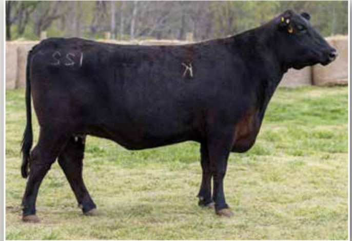
PEAK RITA K122 / Lot 41

*G A R Early Bird +*Chair Rock Ambush 1018 #*G A R Momentum +*G A R Prophet N744