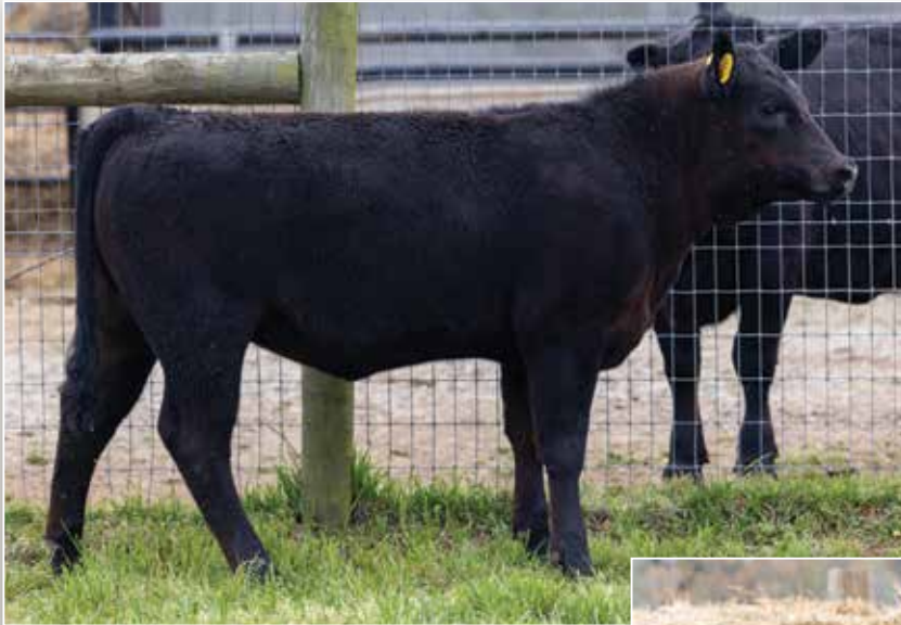
TWO RIVERS VERACIOUS T2195 / Lot 15B