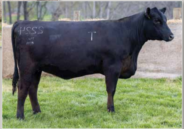
TWO RIVERS HOME TOWNT2224 / Lot 3

Home Town T293 is a calving-ease, HS, Marb., $M, $B and $C female from the top of the Two Rivers fall calving program and is a direct daughter of the prolific Two Rivers donor, Phoenix W1529 sired by the one-time record-selling multi-trait female sire, Home Town.