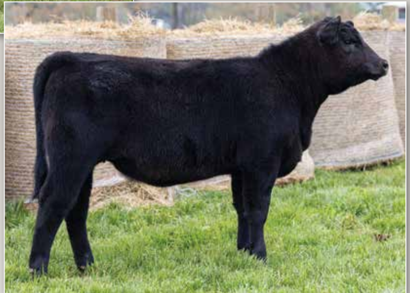
TWO RIVERS VERACIOUS T2145 / Lot 15C