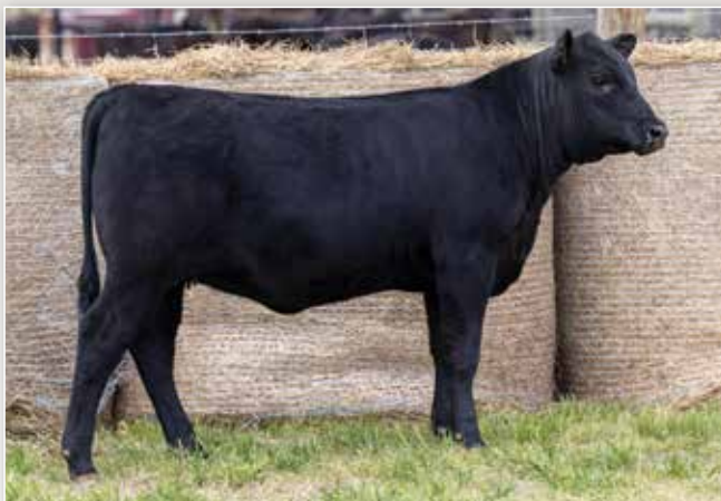
TWO RIVERS BREAKTHROUGH T135 / Lot 16

• Breakthrough T135 is a calving-ease, PAR, Marb., RE, $W, $B and SC combination female produced by a second-generation Two Rivers female and first calf heifer, Peyton T1043 and sired by the longtime multi-trait leader of the ST Genetics roster, Breakthrough. • Peyton T1043, the first calf heifer dam of Lot 16 is a direct daughter of the proven and prolific Two Rivers headliner, Momentum W1806 sired by the proven Edgewood Angus and Select Sires roster member, Peyton. Paragon T1245 who sells as Lot 13 is a maternal sister to the dam of Lot 16.