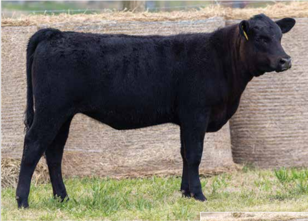
TWO RIVERS FIREBALL T2225 / Lot 14

Fireball T2225 is an outstanding Marb., RE, $M $W, $B and $C daughter of the proven Two Rivers donor, Enhance W819 sired by the proven multi-trait sire, Fireball.