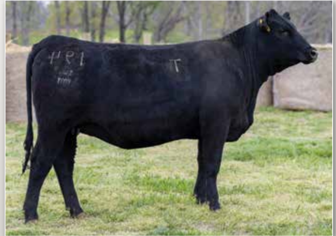
TWO RIVERS FIREBALL T194 / Lot 25