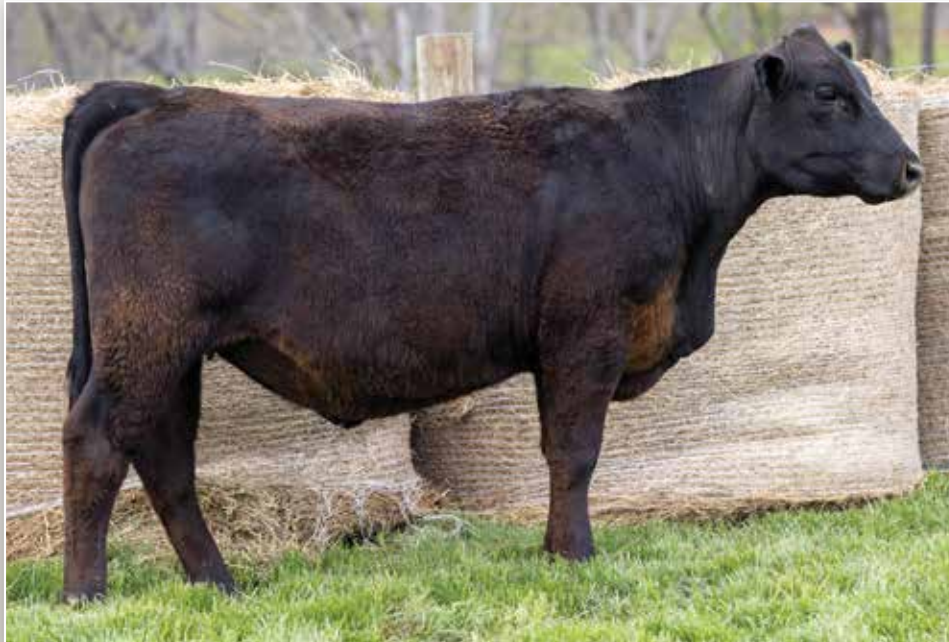
TWO RIVERS NEW PARADIGM 5924 / Lot 29

New Paradigm 5924 is a growth, PAP, HS, CW, Marb., RE, $B and $C combination prospect produced by the $110,000 record-selling Valley View Angus female selected by Jocko Valley Angus in the 2024 Valley View Angus Spring LiveOnline Sale, Home Town J06 sired by the proven multi-trait sire, New Paradigm.