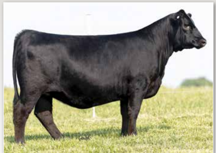
VALLEY VIEW RITA 4122 / Daughters of this Ramos Ranch donor sell as Lots 6A through 6D.