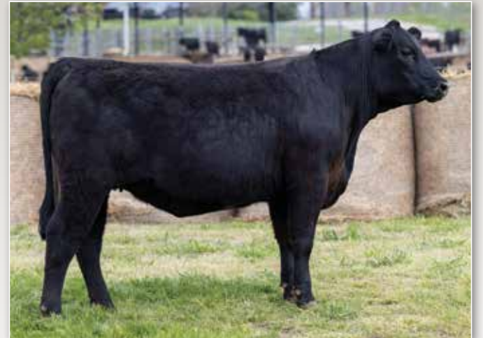
VALLEY VIEW NOURIA 31124 / Lot 22C