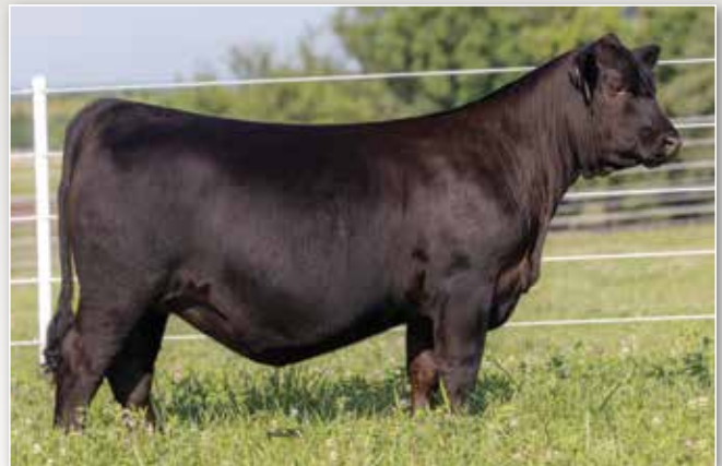
VALLEYVIEW SARAH 91324 / The $85,000 maternal sister to Lot 29 selected by Grimmus Cattle Company.