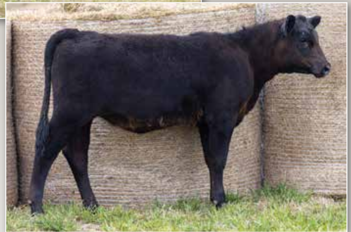
TWO RIVERS VERACIOUS T2175 / Lot 15A

Fireball T2225 is an outstanding Marb., RE, $M $W, $B and $C daughter of the proven Two Rivers donor, Enhance W819 sired by the proven multi-trait sire, Fireball.