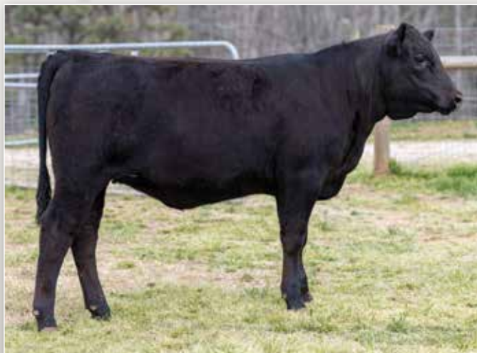
TWO RIVERS PREEMINENT T2095 / Lot 11

• Preeminent T2095 is an exciting Marb., RE, $m, $B and $C combination prospect produced by the featured second-generation Rita in the FB Genetics program, Veracious 9559 sired by the proven multi-trait headliner, Preeminent. • Veracious 9559, the dam of Lot 11 blends the proven multi-trait Select Sires roster member, Veracious with the longtime carcass leader of the Edgewood Angus and Select Sires rosters, West Point.