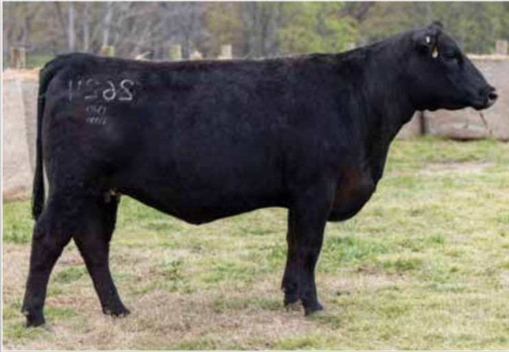
TWO RIVERS NEW PARADIGM 2624 / Lot 6B