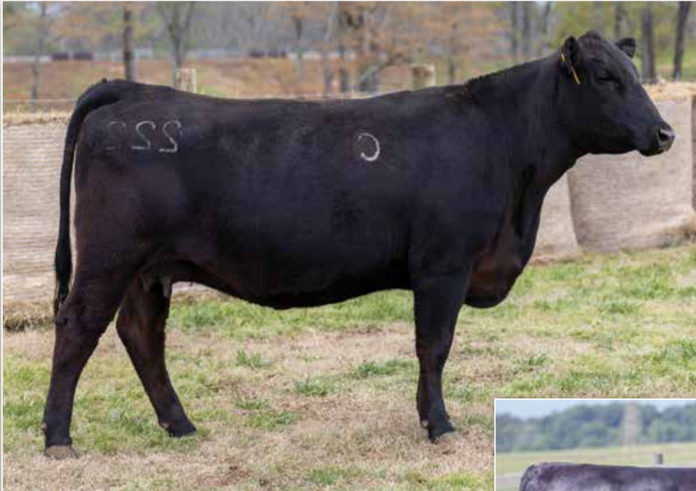
ANKONY MISS LUCY C222 / Lot 40