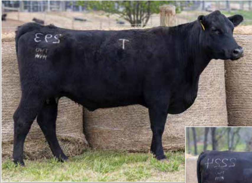
TWO RIVERS HOME TOWNT293 / Lot 2