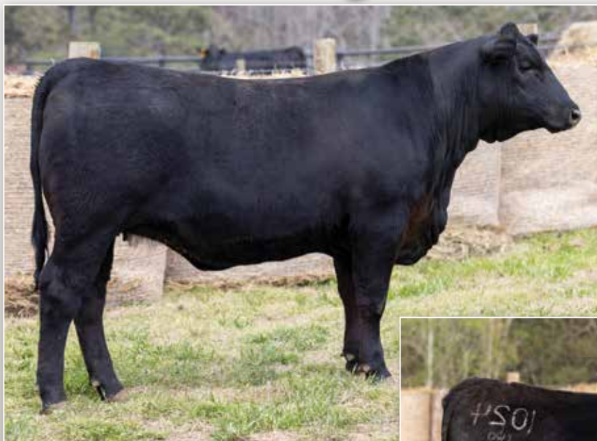
TWO RIVERS FIREBALL T1025 / Lot 19A