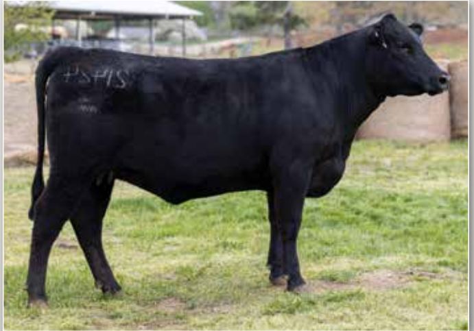
TWO RIVERS FIRESIDE 21424 / Lot 22A