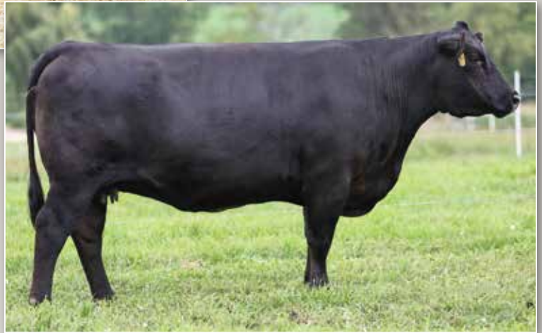
OGEECHEE SUNRISE 6023 / Descendants of this foundation Prime of Iowa Angus donor sell as Lots 31B and 31C.