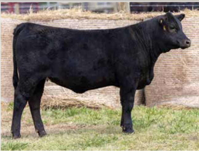
TWO RIVERS PARAGON T1295 / Lot 12