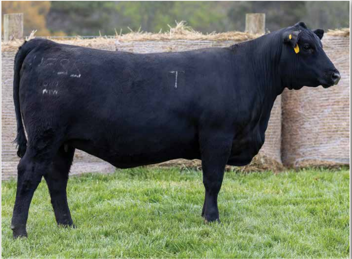
TWO RIVERS FIREBALL T2254 / Lot 4