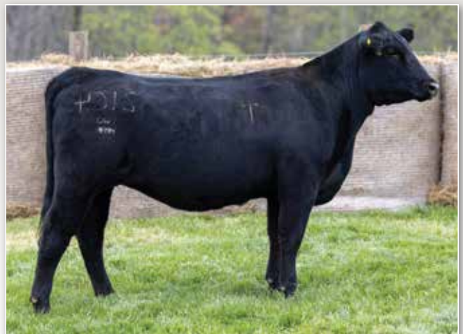
TWO RIVERS FIREBALL T2164 / Lot 27