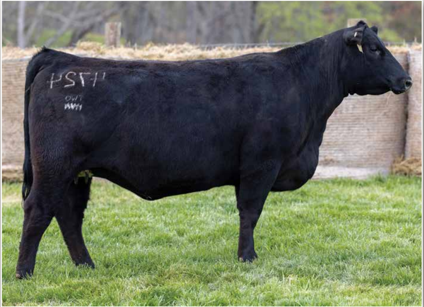
TWO RIVERS NEW PARADIGM 4724 / Lot 6A

Featuring four daughters of the multi-trait leading donor in the Ramos Ranch program, Rita 4122 sired by the multi-trait headliner of the Soaring Eagle and Valley View programs, New Paradigm.