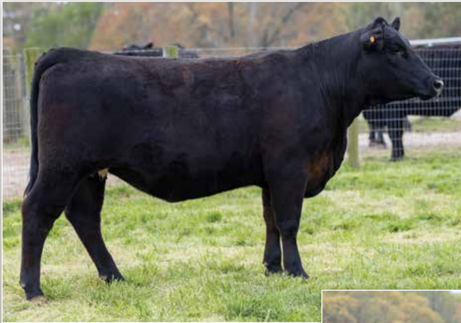
TWO RIVERS NEW PARADIGM 5724 / Lot 28A