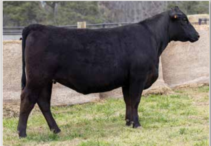
TWO RIVERS NEW PARADIGM 41924 / Lot 6D

• Heifer calf, due 10/10/26 by GAR Home Run.