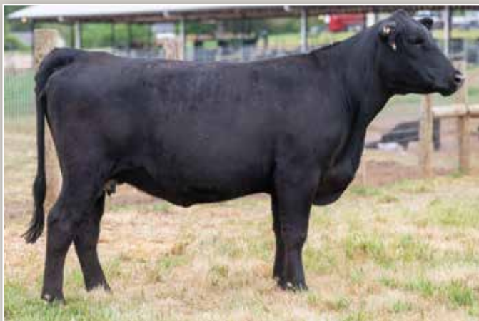
ANKONY MISS LUCY C221 / Lot 42