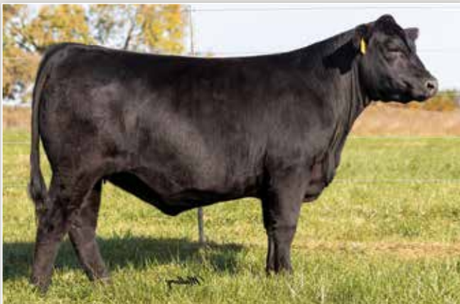
6 MILE HOMETOWN J06 / The $110,000 multi-trait Jocko Valley Angus donor and dam of Lot 29.

• Bull calf, due 10/8/26 by GAR Home Run.