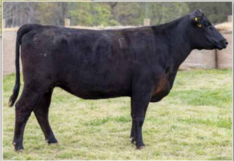
TWO RIVERS TRANSCENDENT T153 / lot 33