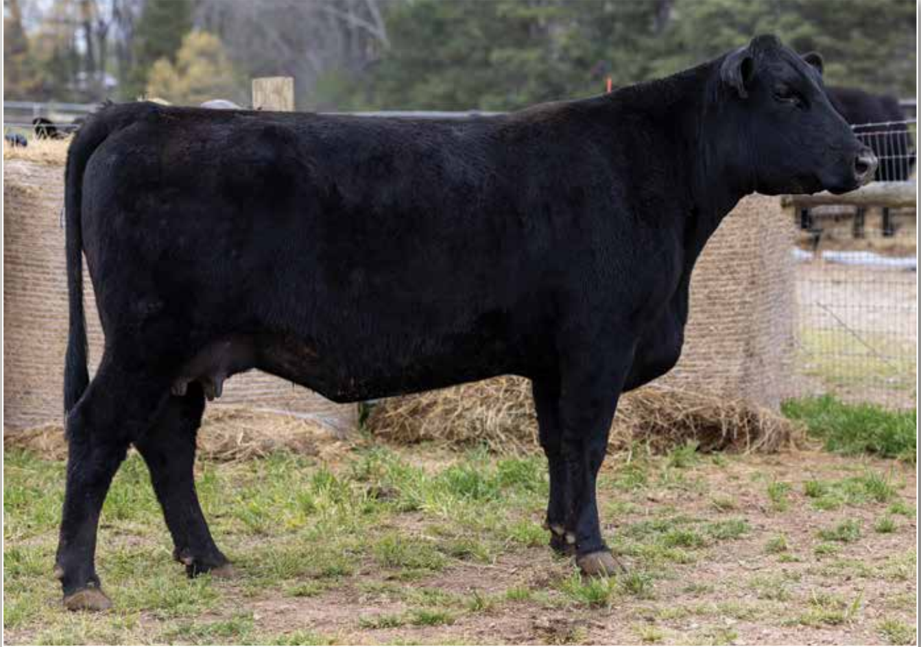
TWO RIVERS HOMETOWN T051 / Lot 10

Home Town T051 is a calving-ease, PAP, Marb., RE, $B and $C combination female from the Two Rivers donor program and blends the foundation Two Rivers female, Phoenix W1279 and is sired by the legendary female sire, Home Town.