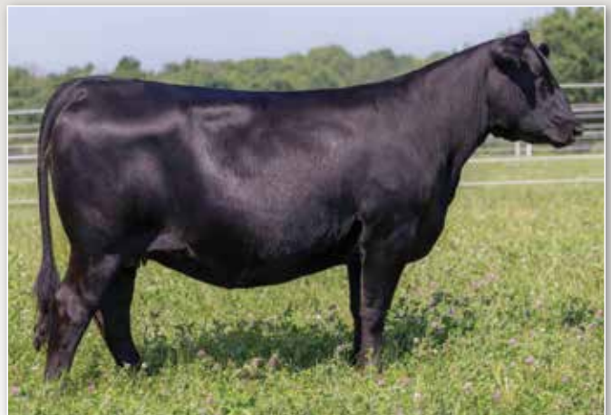
VALLEY VIEW VICTORINE 91123 / A maternal sister sells as Lot 30.