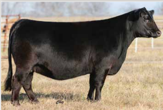
BAR 7 CLARITY A748 1604 / A daughter sells as Lot 30.