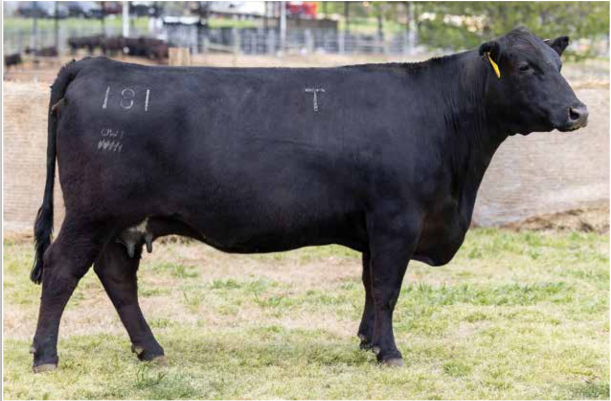
TWO RIVERS HOMETOWN T181 / Lot 9

Home Town T181 is a low-birth, PAP, Marb., $m, $B and $C daughter of the former Two Rivers highlight, West Point W1389 sired by the longtime leader of the Select Sires roster and featured female sire, Home Town.