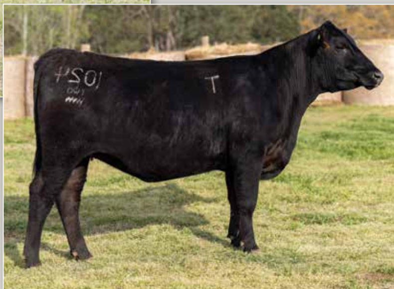
TWO RIVERS FIREBALL T1024 / Lot 19B

A special highlight, two multi-trait Marb. and RE daughters of the second-generation Two Rivers donor, Home Town T121 sired by the carcass, $B and $C sire, Fireball.