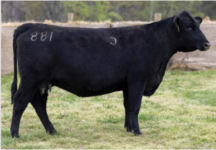
ANKONY MISS LUCY C188 / Lot 34