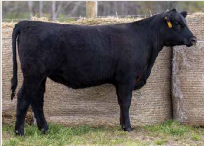
TWO RIVERS FIREPROOF T025 / Lot 17