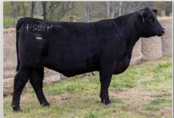
TWO RIVERS NEW PARADIGM 41824 / Lot 6C