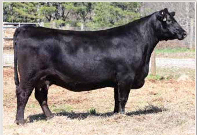
RWA WEST POINT W1389 / A daughter sells as Lot 9.

• Bull calf, due 8/5/26 by PEAK Draft Pick.