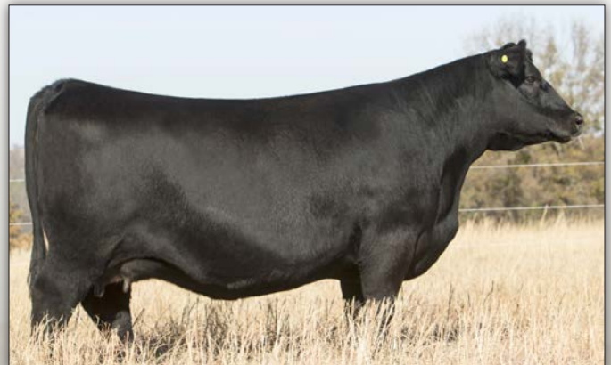
Long Lucy 909 // Dam of Stellpflug Bighorn

Aside from his genetic strengths, BIGHORN is a true standout due to impressive individual qualities and pedigree. He weaned off at over 800 lbs. and had an adjusted yearling weight of 1,510 lbs. With all that power and performance, BIGHORN maintains an impressive skeleton with extra base width and accurate alignment that results in a massive, easy moving, level designed individual with a herd bull look.