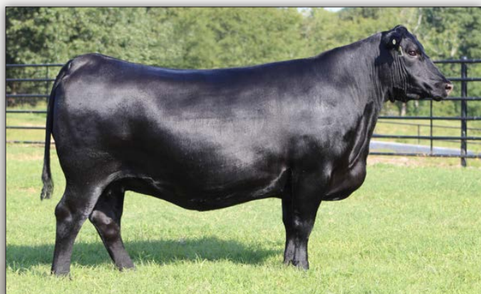
Ankony Miss Belle A064 // Dam of BAR Dominion 464M

We feel this young sire has as much potential on the seedstock side as any bull in our lineup.