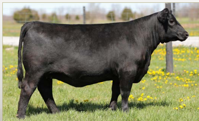
Optum's Rita 0762 // Dam of VAR Wesson

In the flesh, this sire excels in phenotypic balance with distinct advantages in length, structural integrity, and internal dimension. He has an attractive pattern yet still maintains the masculine look of a herd bull.