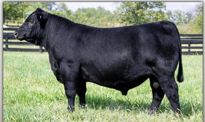
4 Sons/Leegan Lottery Pick

When elite genomics, proven cow families, structural integrity, maternal excellence, and end-product merit come together, the result is unlimited potential. This is a true next-generation genetic package designed to move a program forward for years to come.