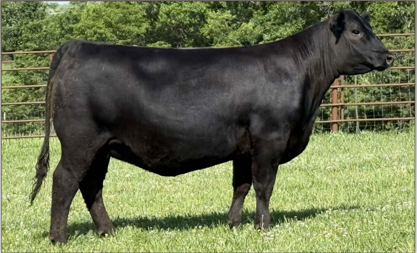
GCC Donna 4582